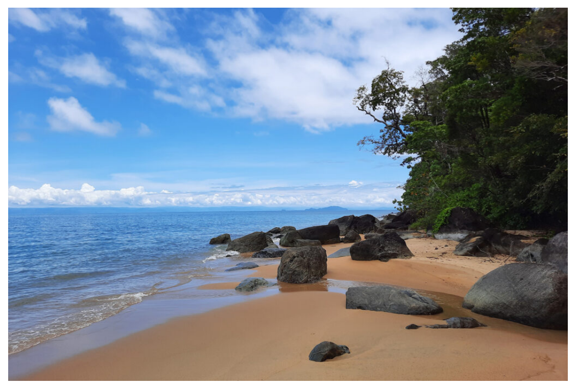
The Masoala Peninsula is one of the very few places in Madagascar where primary forest comes down to the coast