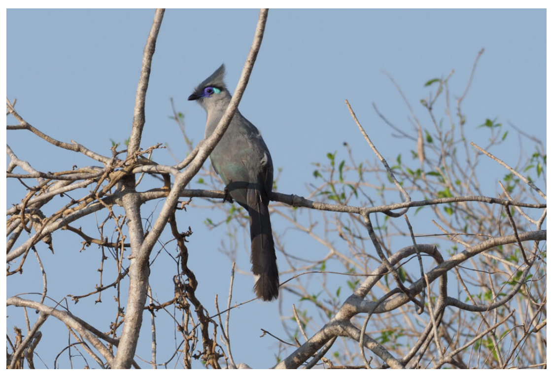
The attractive Crested Coua is a widespread endemic all over the forested areas of Madagascar