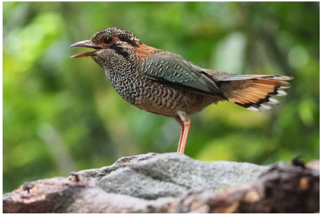
The beautifully patterned Scaly Ground Roller showed very well in the forests of the Masoala Peninsula