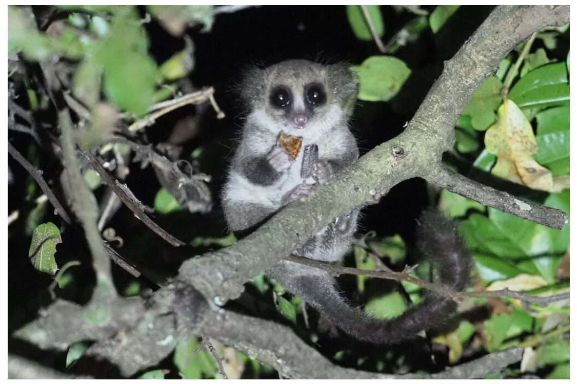
This cute Hairy-eared Dwarf Lemur performed beautifully at night at Bemanevika