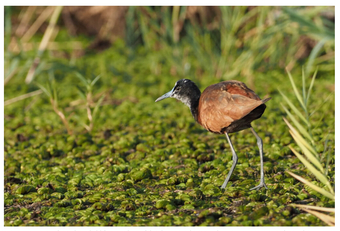
Lake Kinkony held fair numbers of the elegant, endemic Madagascar Jacana