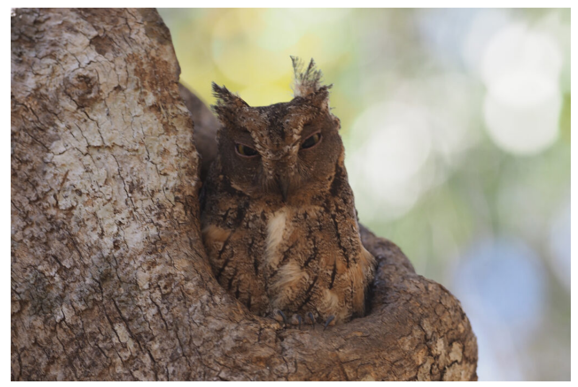
The endemic Torotoroka Scops Owl was keeping an eye on us from its roost in the Ankarafantsika National Park

Collared Spine-tailed Lizard Oplurus cuvieri Madagascar Day Gecko Phelsuma madagascariensis Mossy Leaf-tailed (or Southern Flat-tailed) Gecko Uroplatus sikorae Giant Leaf-tailed (or Common Flat-tailed) Gecko Uroplatus fimbriatus Lined Leaf-tailed (or Flat-tailed) Gecko Uroplatus lineatus Madagascar Flap-necked Chameleon Chamaeleo dilepis Blue-legged (or Cryptic) Chameleon Calumma crypticum Short-horned Chameleon Calumma brevicornis Madagascar Pimple-nosed Chameleon Calumma nasutum Oustalet's (or Malagasy Giant) Chameleon Furcifer oustaleti Madagascar Cat-eyed Snake Madagascarophis colubrinus Tomato Frog Dyscophus antongilii