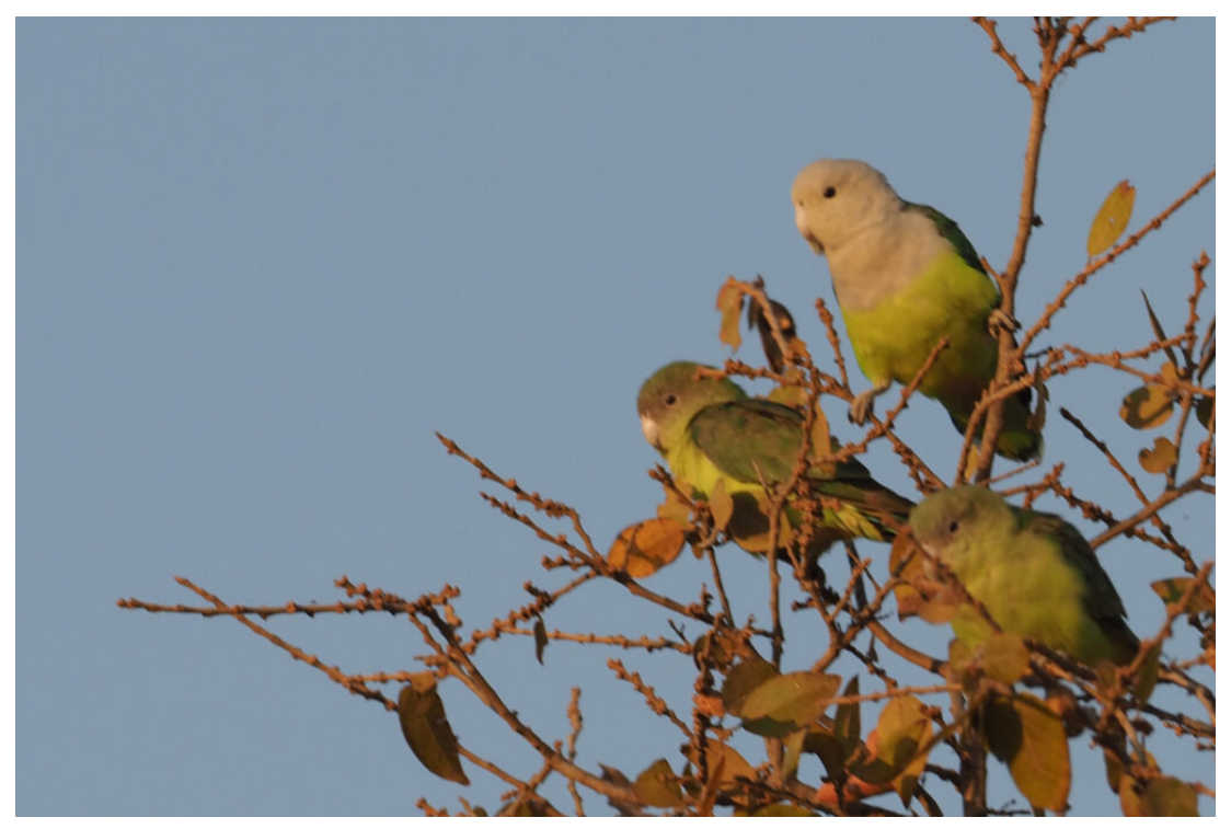
We obtained our best looks at Grey-headed Lovebirds in the forest surrounding Lake Kinkony