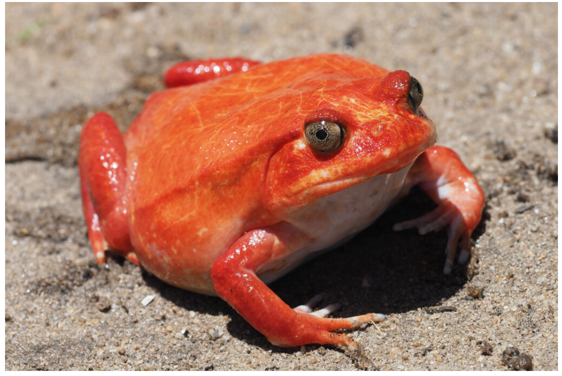
The amazing Tomato Frog only lives in a small area centered around the town of Maroantsetra. One of these unbelievable amphibians showed exceedingly well in the garden of our hotel