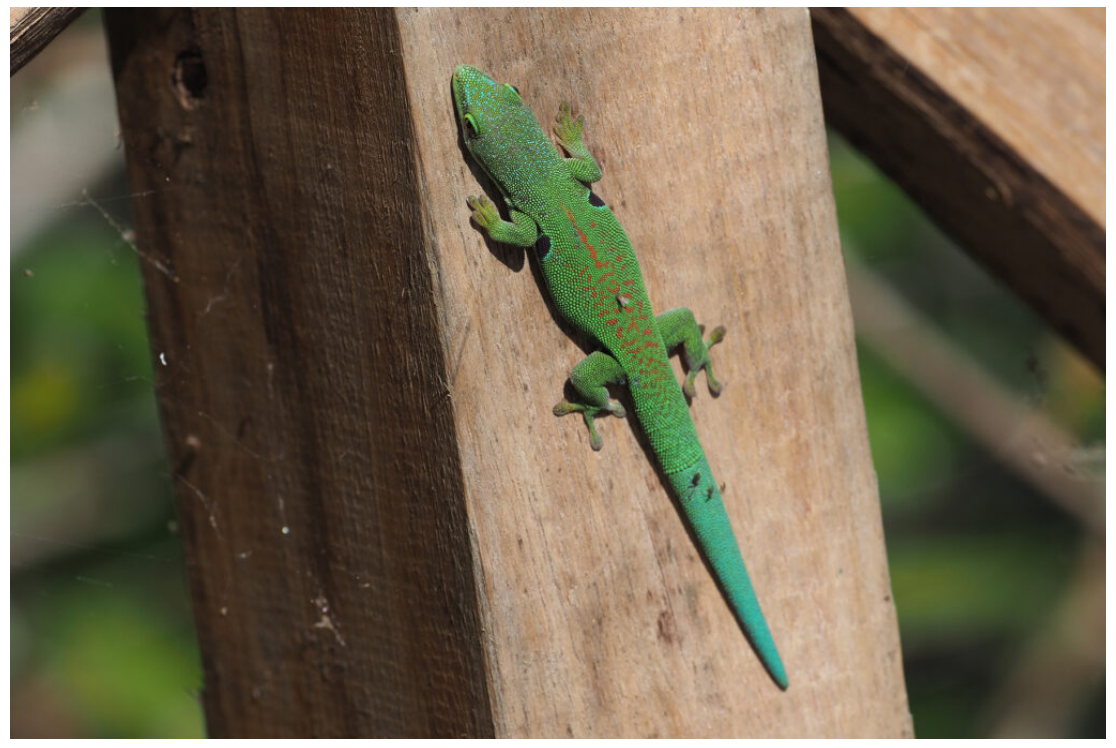
The very colourful Madagascar Day Gecko is a very adaptable species which often occurs where people live