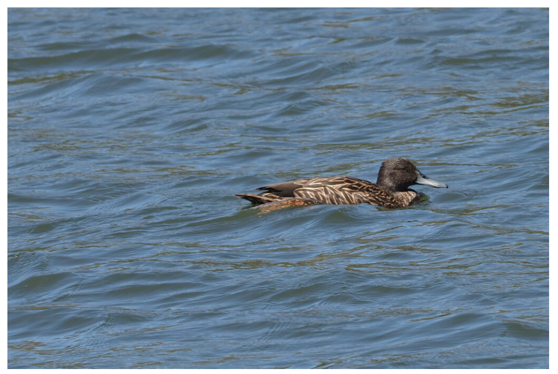
The endemic Meller's Duck was regularly encountered in the Bemanevika area