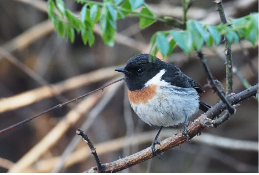
The lovely Madagascar Stonechat is a widespread and common endemic