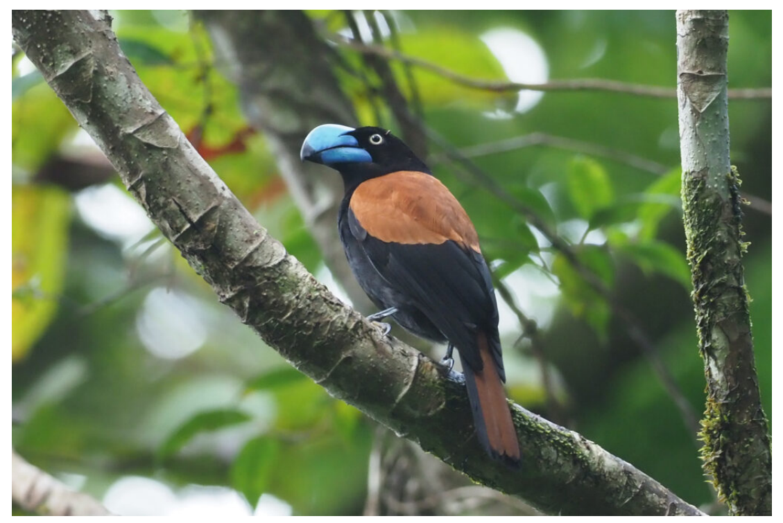
The incredible Helmet Vanga surely is one of the best birds in the world