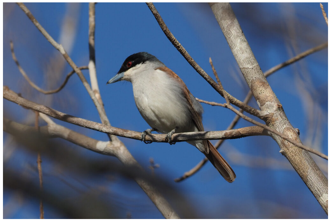
The endemic Rufous Vanga is a not very active inhabitant of primary forest; this is a female