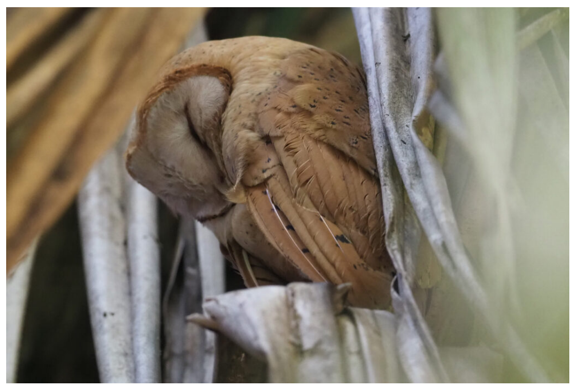
The endemic Red Owl favours dense pandanus palms to roost in