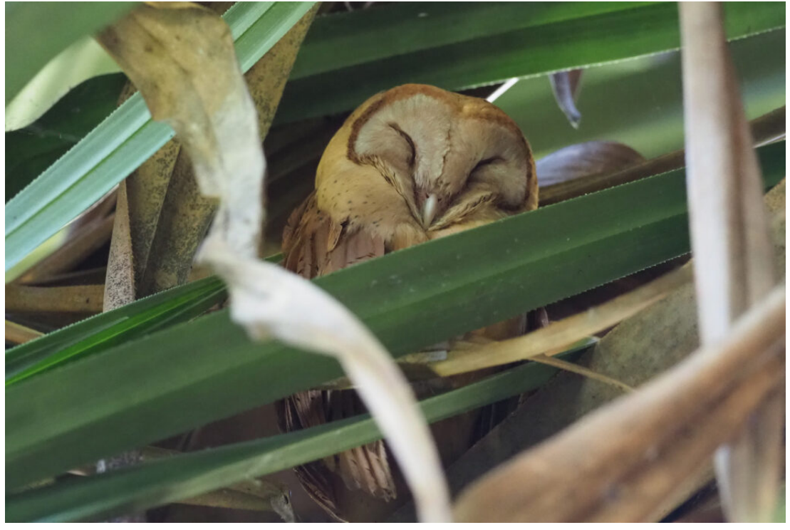
The endemic Red Owl showed beautifully at its day roost in the forest at Bemanevika