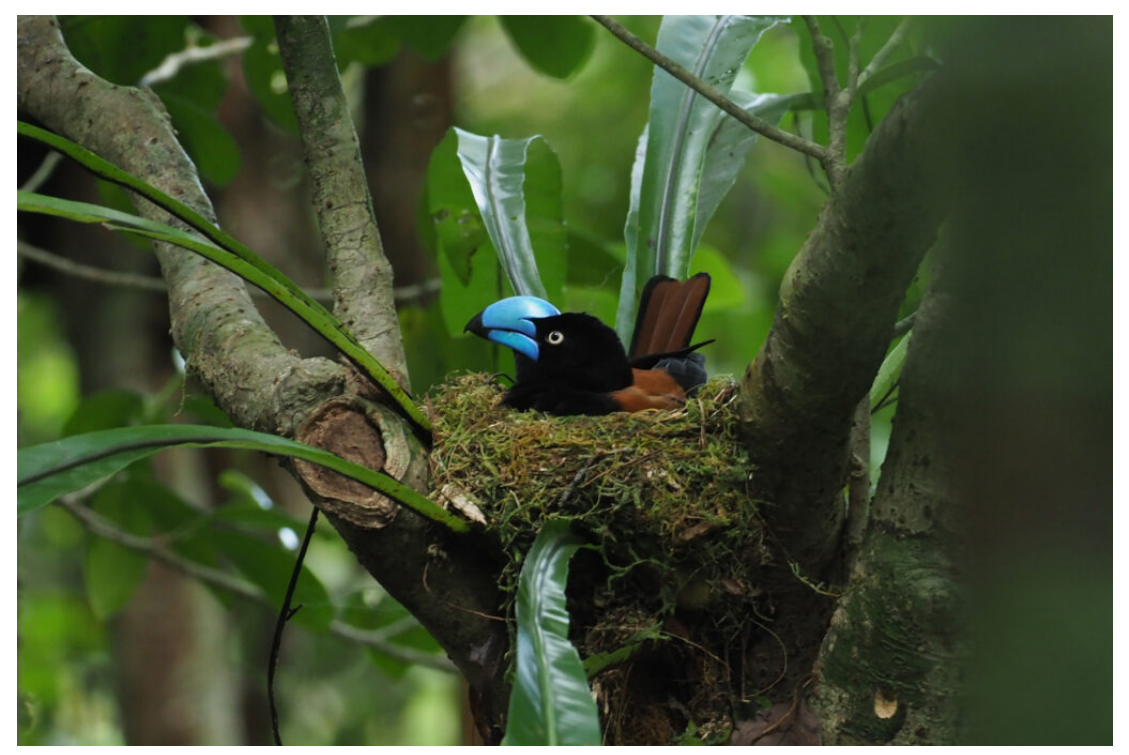
Two active nests of the very attractive Helmet Vanga were found on our walks in the primary forests of the Masoala Peninsula