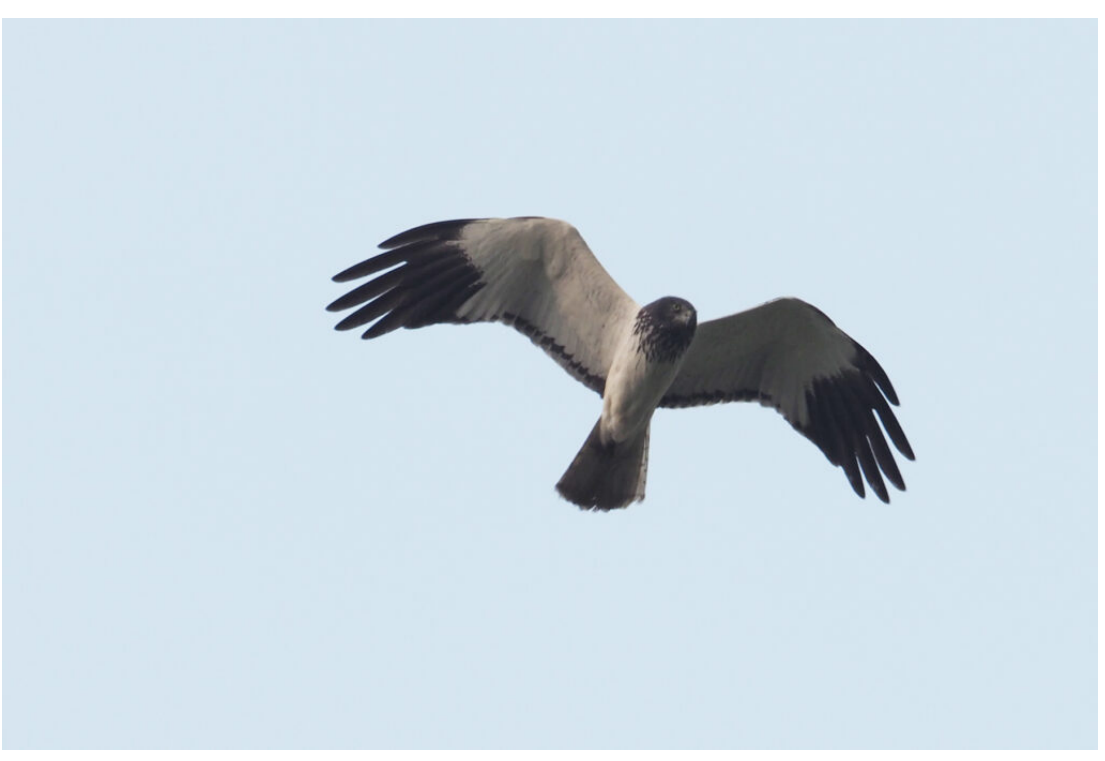
The very attractively patterned Malagasy Harrier performed very well at Bemanevika