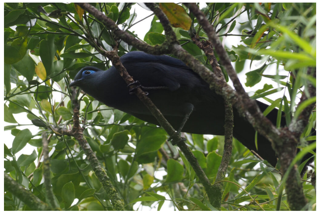
The Blue Coua is one of several totally blue coloured birds that inhabit the eighth continent (image by Mark Van Beirs)