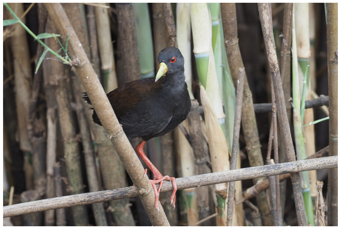
The cute Sakalava Rail is restricted to a few marshy lakes in western Madagascar. We obtained cracking views of this rarely seen endemic on Lake Kinkony