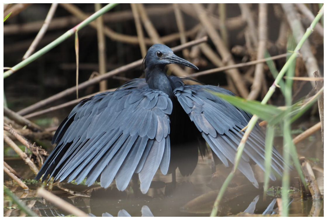
The endearing Black Heron regularly showed off its unique foraging behaviour