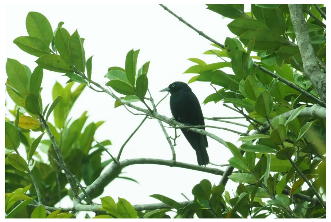
The rare and unobtrusive Bernier's Vanga showed well on the Masoala Peninsula; this is a male