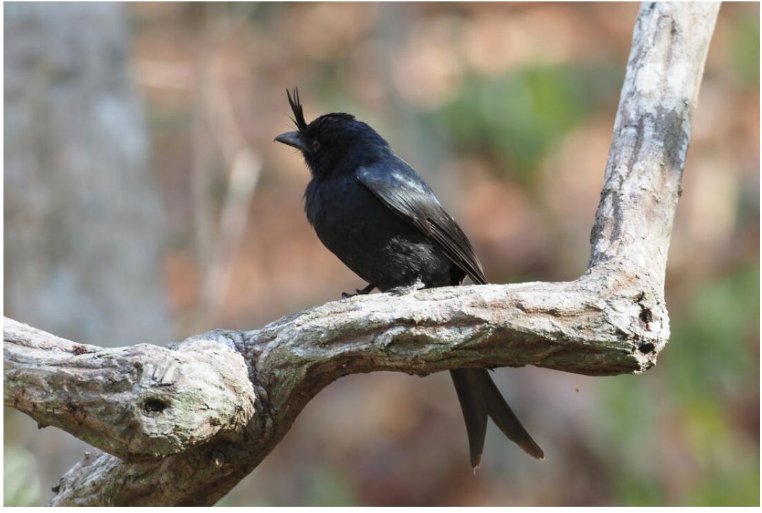
The feisty, endemic Madagascar Drongo often acts as the flock leader in the Madagascan forests