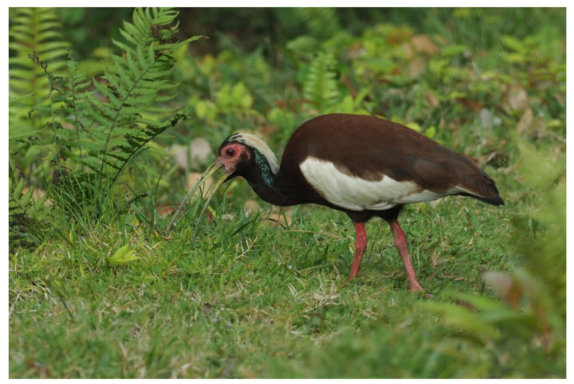
A pair of very smart Madagascar Ibises regularly foraged amongst the chalets of our accommodation on the Masoala Peninsula