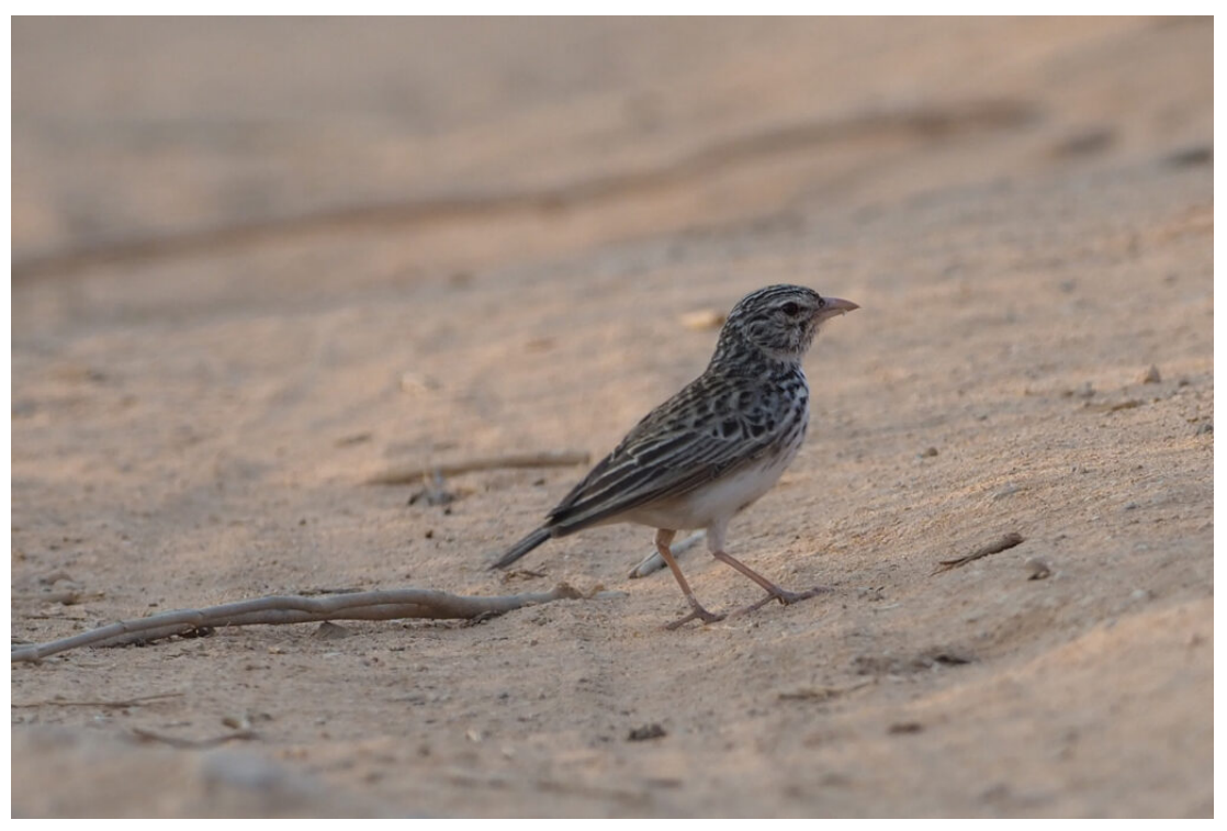
The Madagascar Lark is one of the few endemics that inhabits the grassy expanses of Madagascar's central plateau