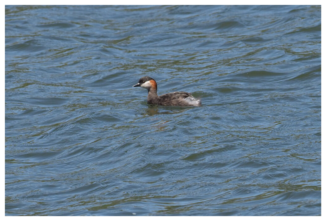
Good numbers of endemic Madagascar Grebes showed at the Madagascar Pochard lake