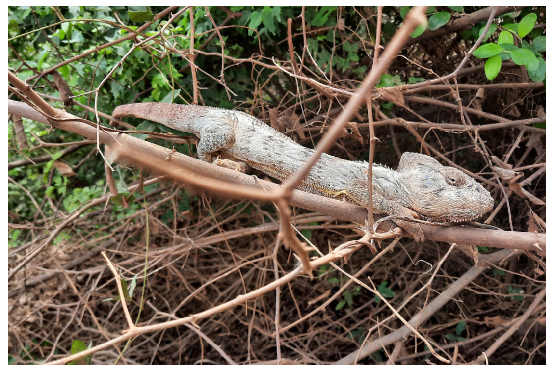
Madagascar holds half of the world's chameleons and the Oustalet's (or Madagascar Giant) Chameleon is one of the more widespread ones