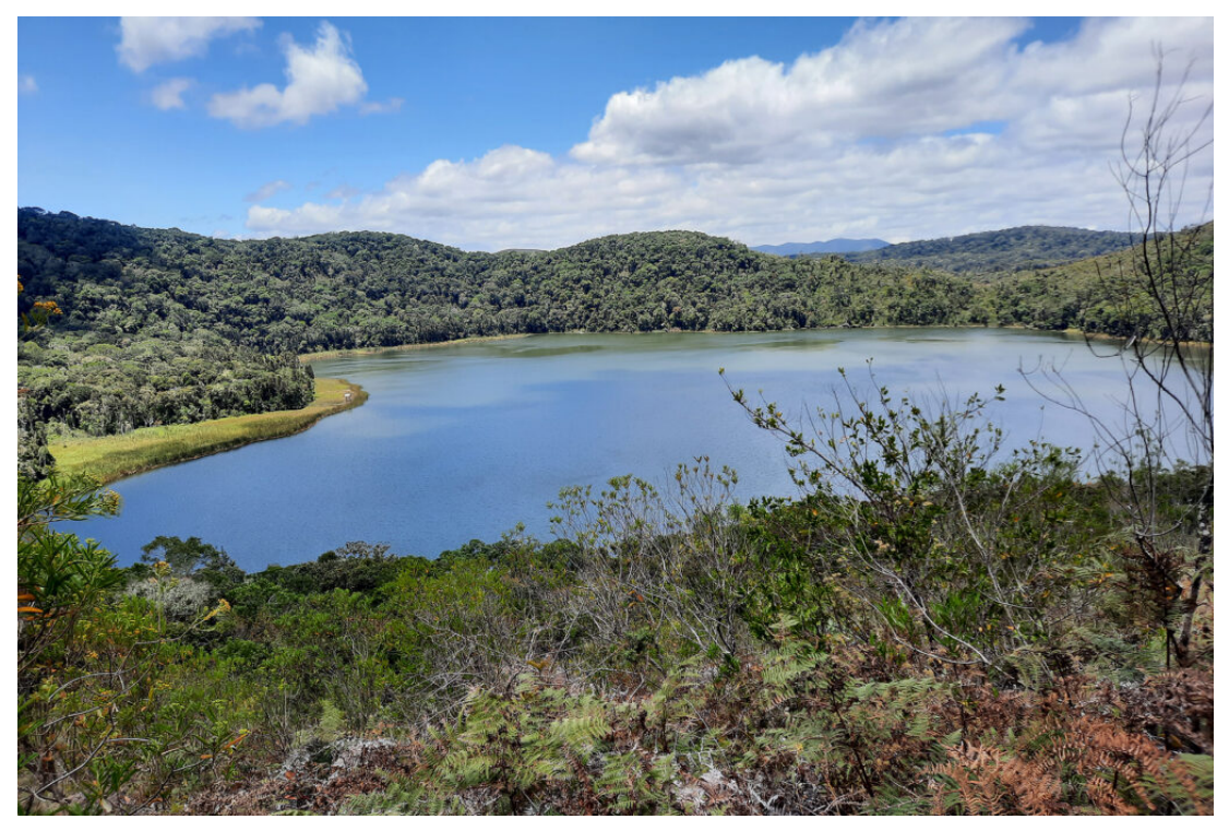
This lake in northern Madagascar holds most of the tiny population of the Critically Endangered Madagascar Pochard