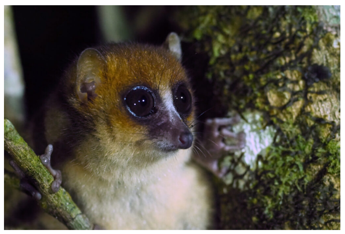
We regularly encountered cute Brown Mouse Lemurs on our nocturnal wanderings