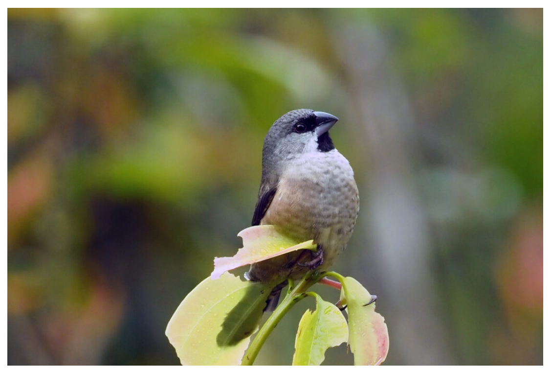
The endemic Madagascar Mannikin is widespread all over the island