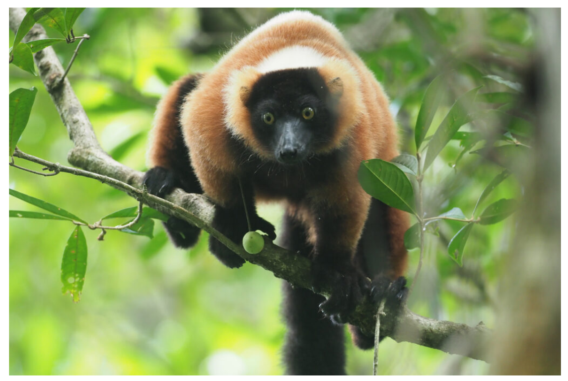
The charming Red Ruffed Lemur is virtually restricted to the Masoala Peninsula, where we saw and heard it regularly on our walks