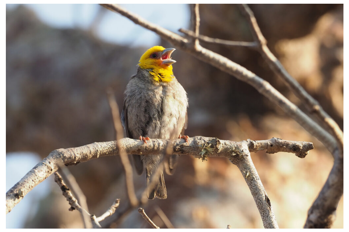
The endemic Sakalava Weaver is a widespread endemic of western Madagascar