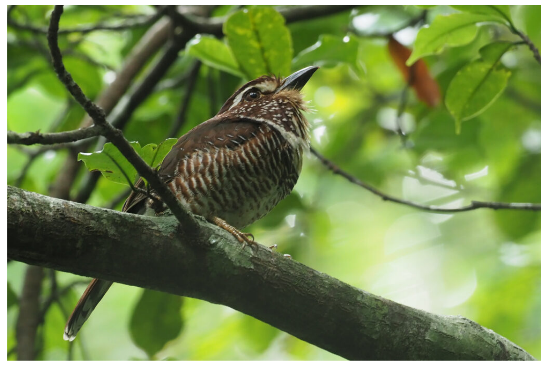
It took a bit of effort to find our first Short-legged Ground Roller in the primary forest of the Masoala Peninsula. The second observation involved a bird that could be scoped next to the trail...