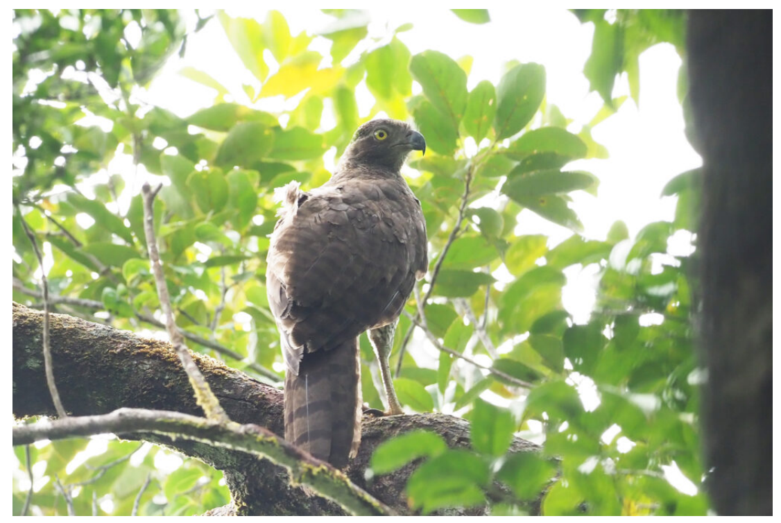
The very rare Madagascar Serpent Eagle is the only member of its genus (Eutriorchis) and feeds mainly on chameleons