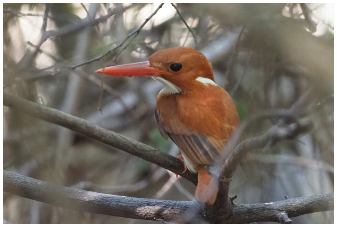
The endemic Madagascar Pygmy Kingfisher showed very well in the forest at Bemanevika