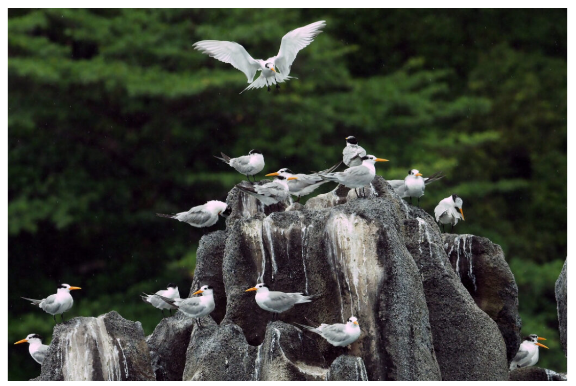
Good numbers of Lesser Crested Terns were roosting on offshore rocks near our base on the Masoala Peninsula