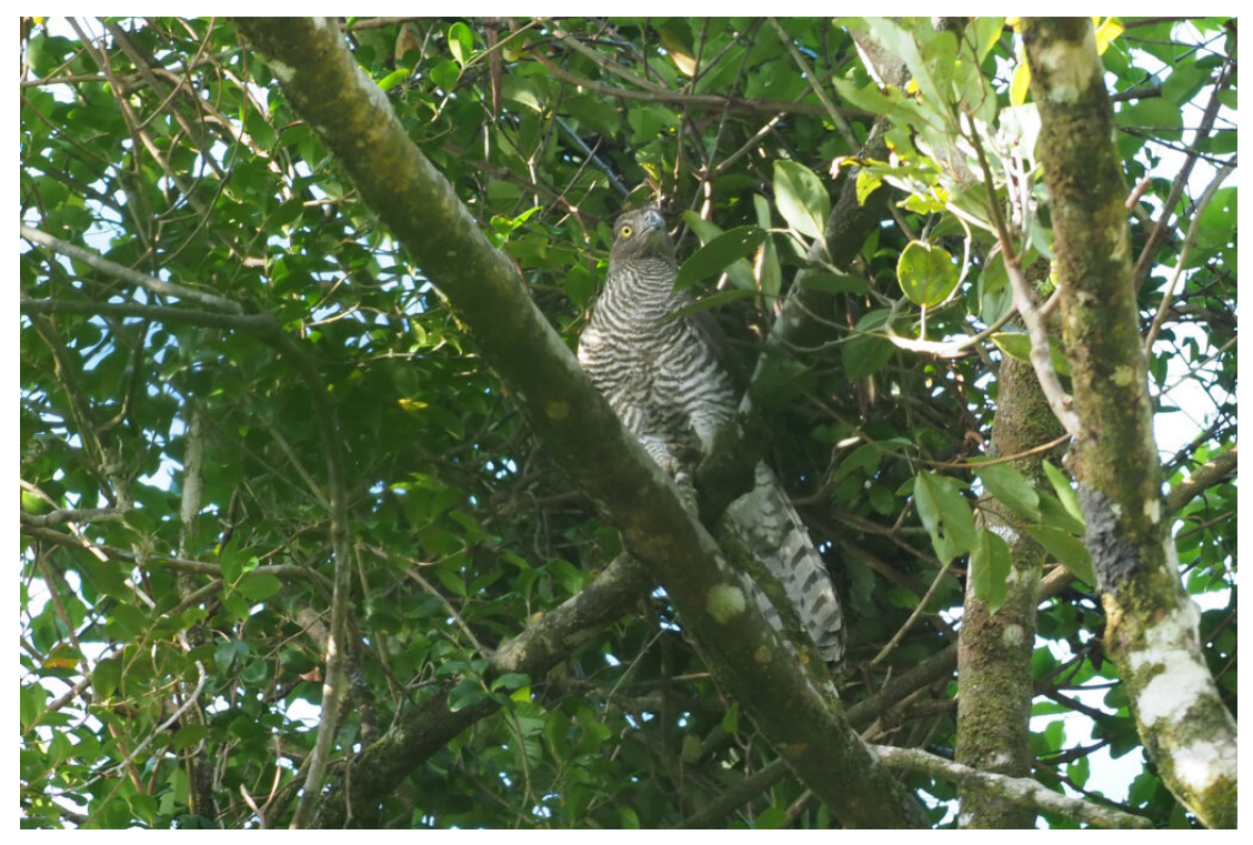
The Madagascar Serpent Eagle is a very rare and seldomly encountered inhabitant of Madagascar's eastern rainforests. We were exceedingly lucky to be able to obtain perfect scope views near our accommodation on the Masoala Peninsula