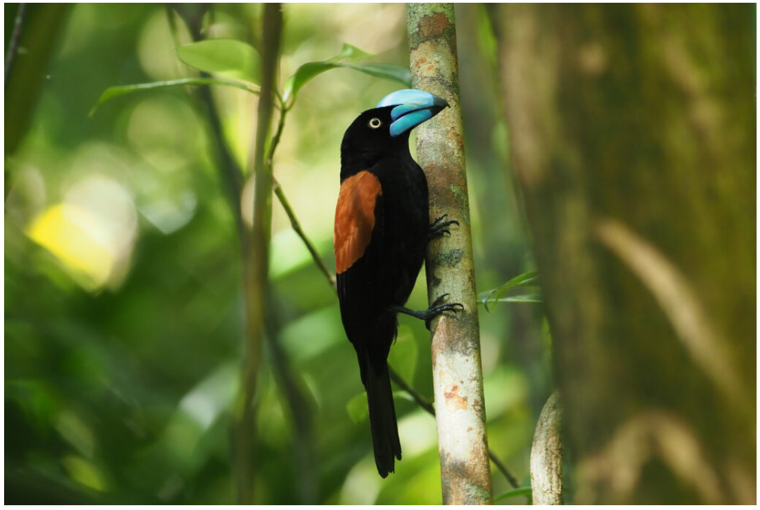
The much-wanted Helmet Vanga is restricted to primary forest in the northeast of Madagascar