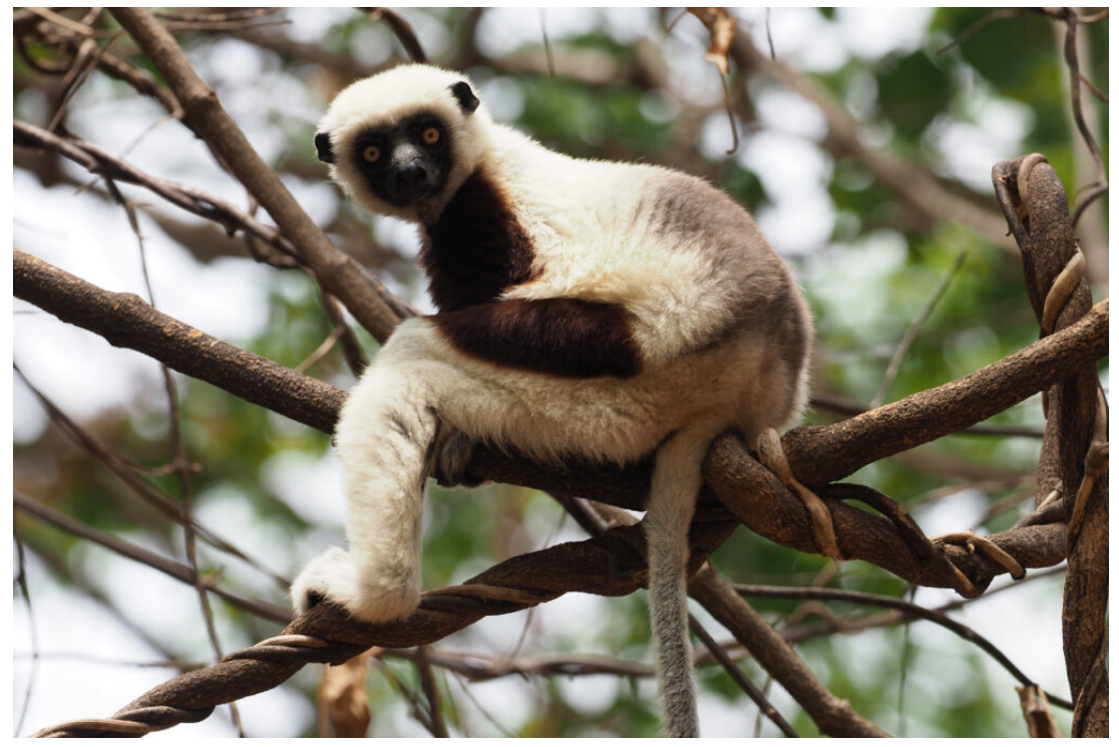
Acrobatic Coquerel's Sifakas showed very well at the Ankarafantsika National Park