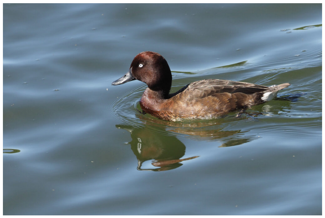
The Madagascar Pochard was thought to be extinct till a small population was found in 2006 at Bemanevika, this endemic is now considered to be Critically Endangered