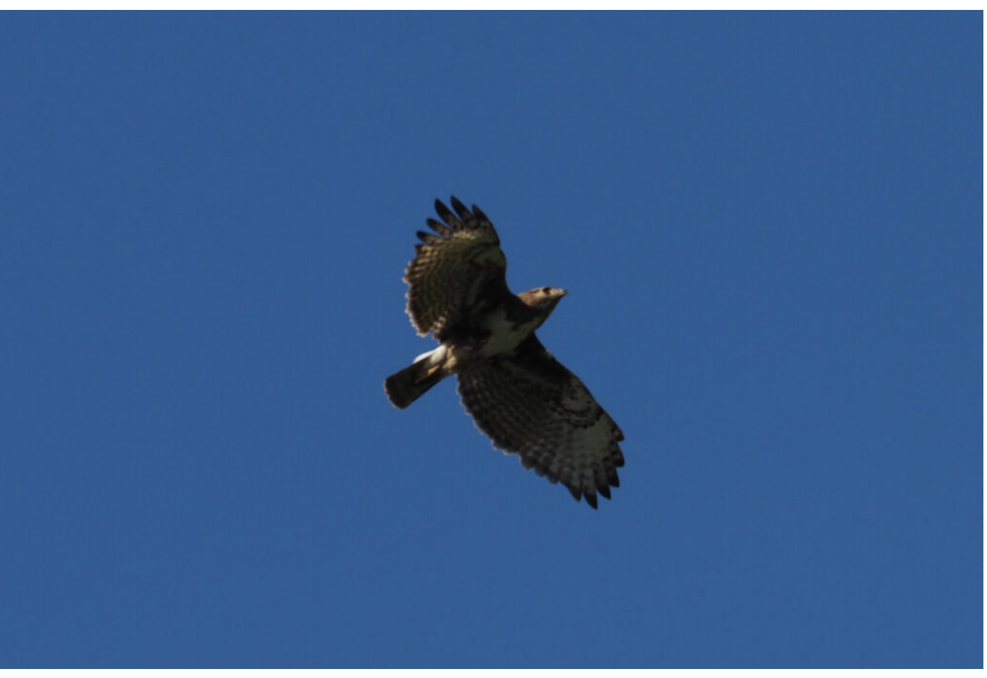
The endemic Madagascar Buzzard showed regularly in forested areas