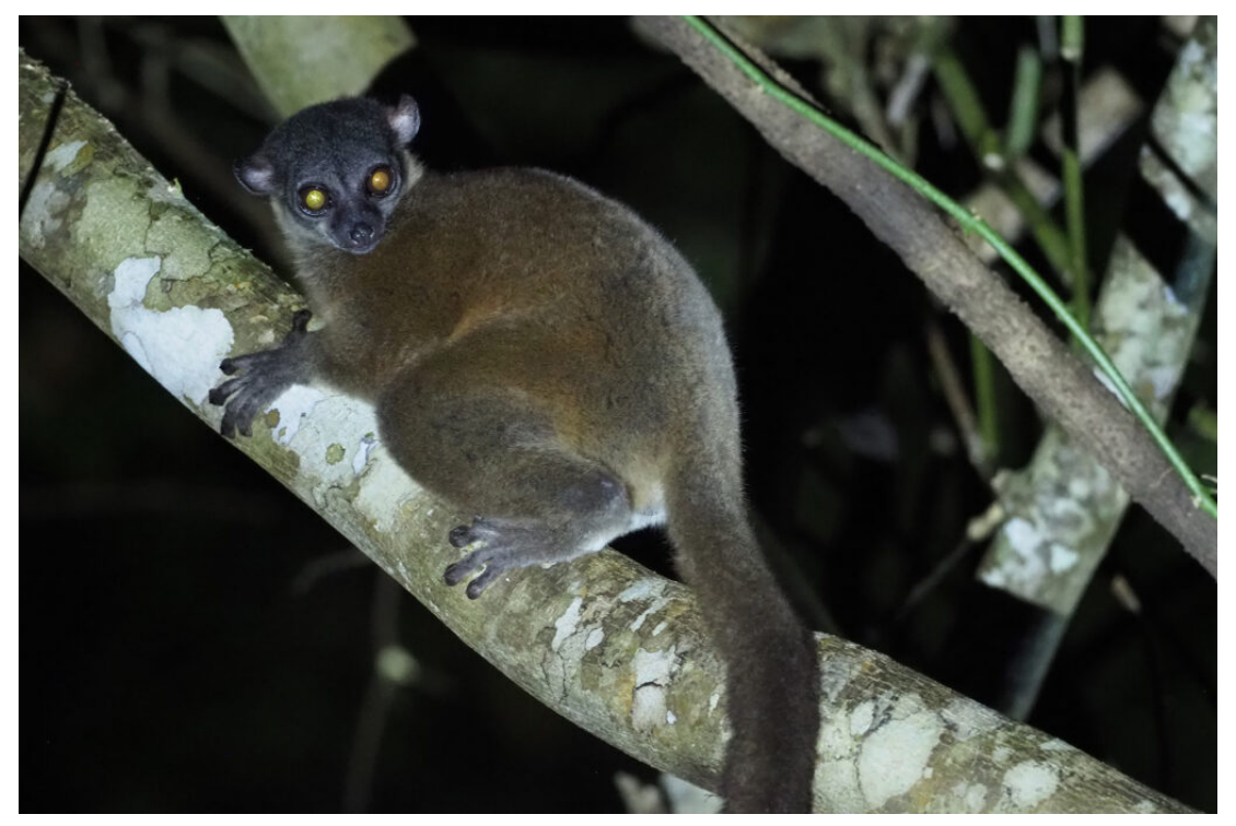
The nocturnal Scott's (or Masoala) Sportive Lemur showed regularly on our night walks on the Masoala Peninsula