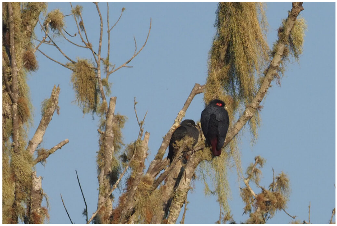
The highly attractive Madagascar Blue Pigeon was only seen a few times on our tour