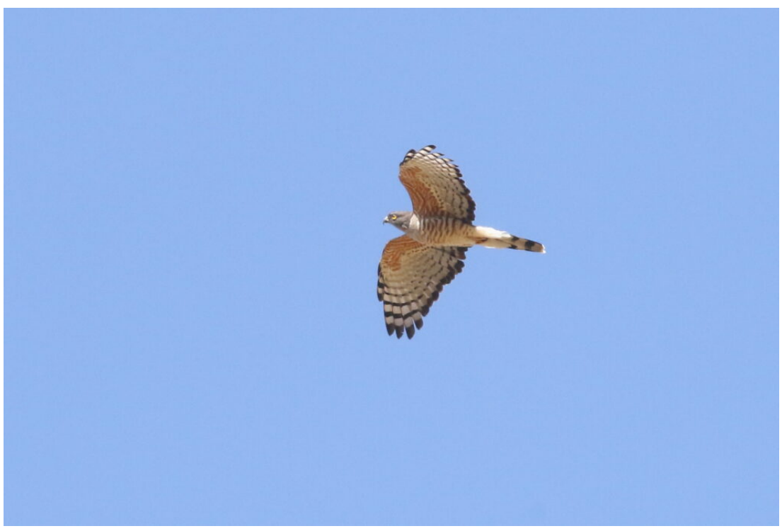
African Cuckoo-Hawk