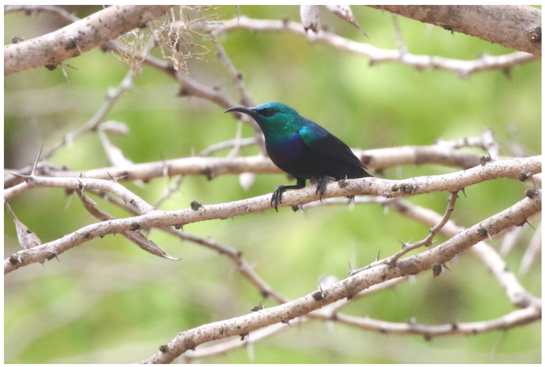
Purple-banded Sunbird