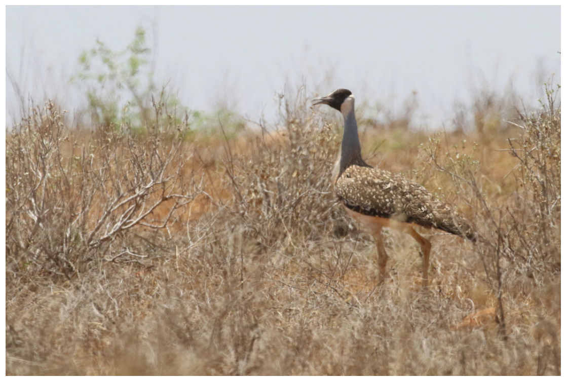
Heuglin's Bustard