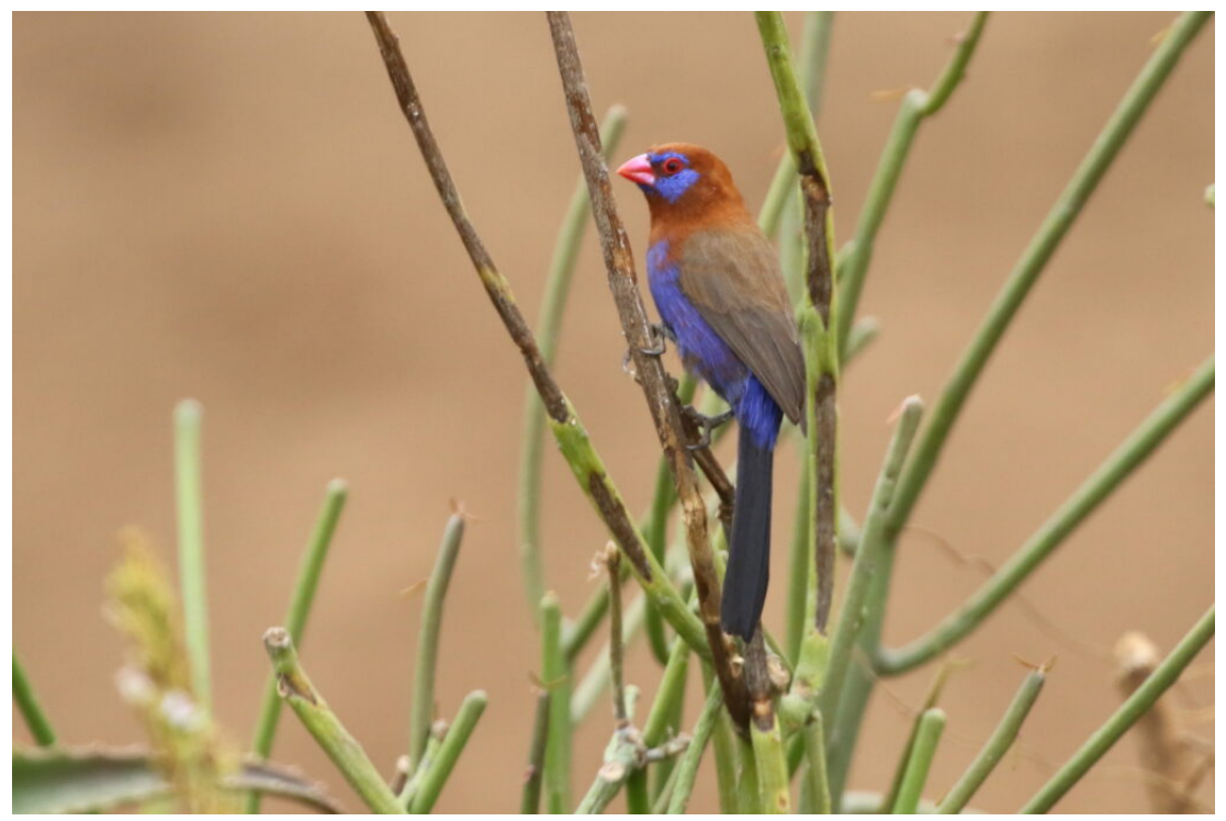
Purple Grenadier