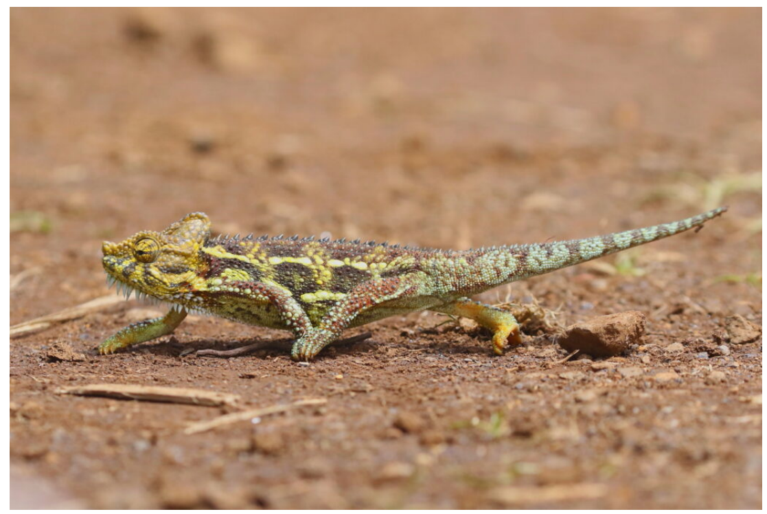
Von Hohnes Chameleon