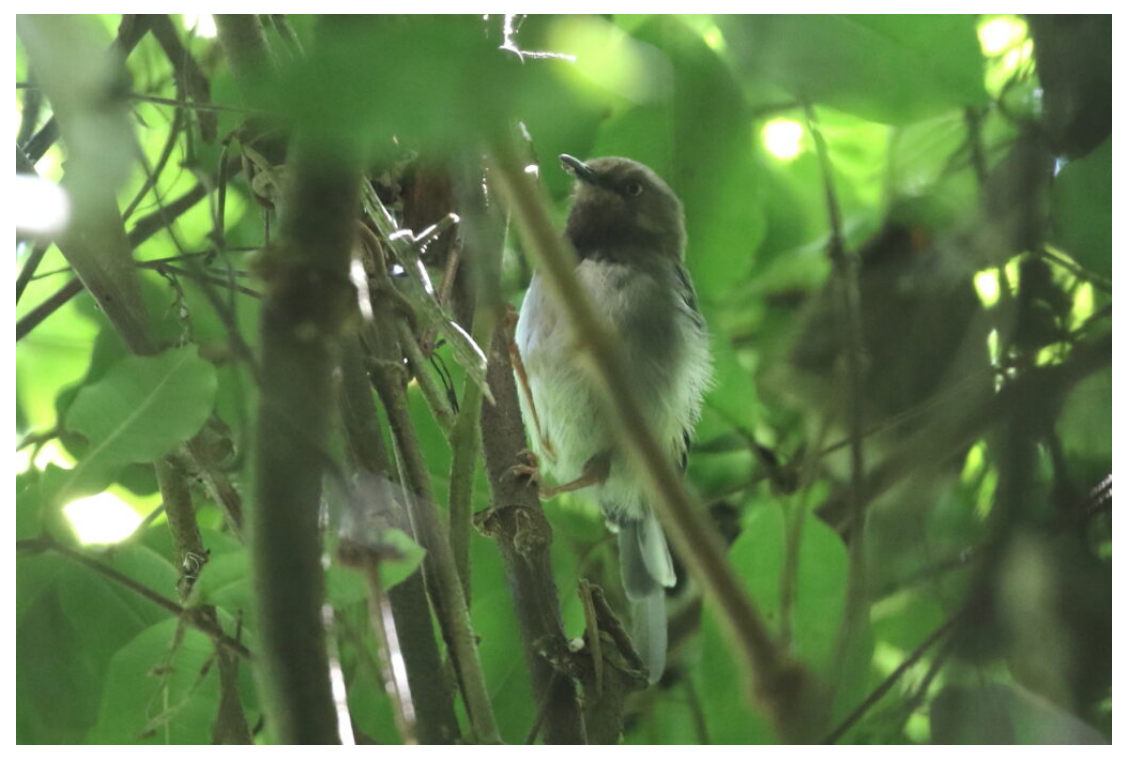
Taita Apalis