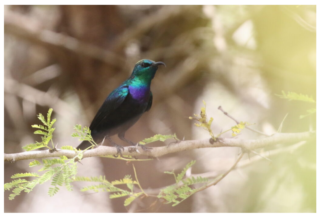
Purple-banded Sunbird