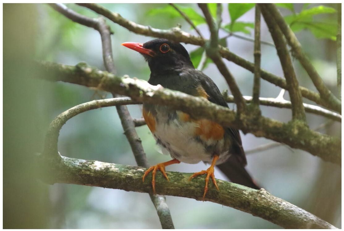
Taita Thrush