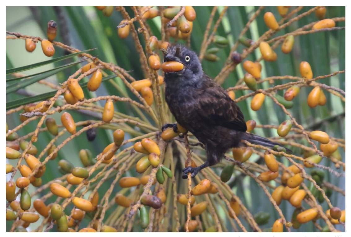
Grey-throated Barbet