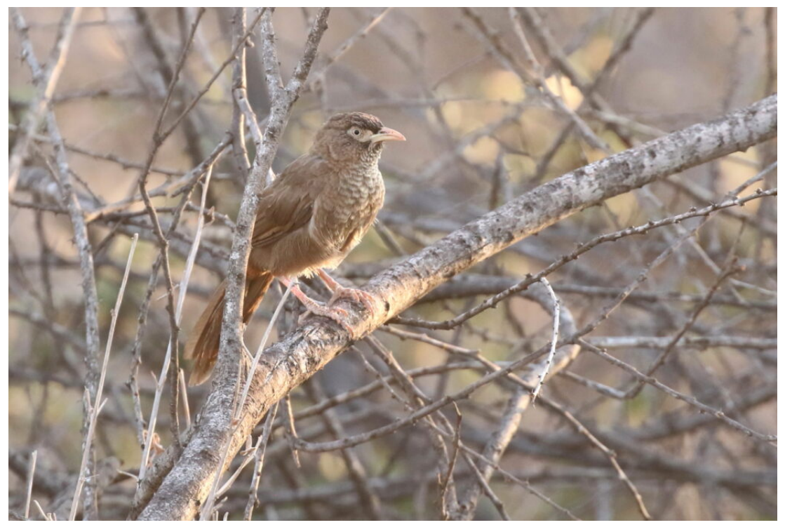
Scaly Chatterer