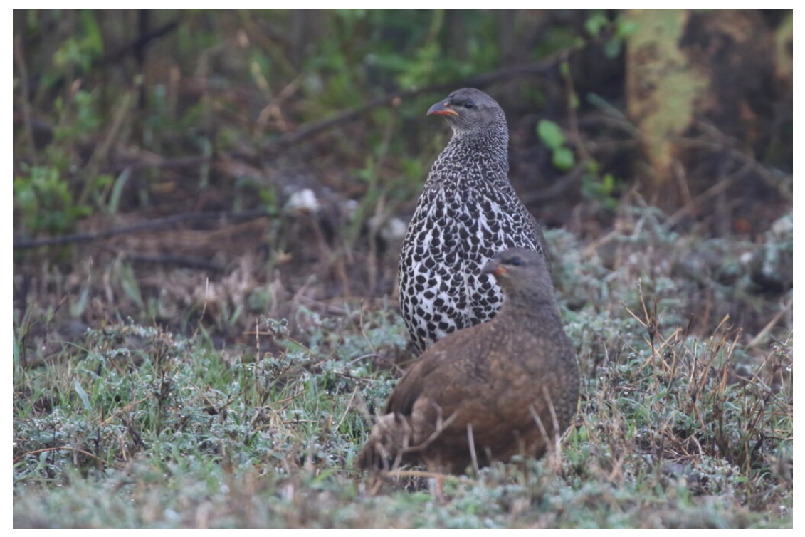
Hilbebrandt's Spurfowl