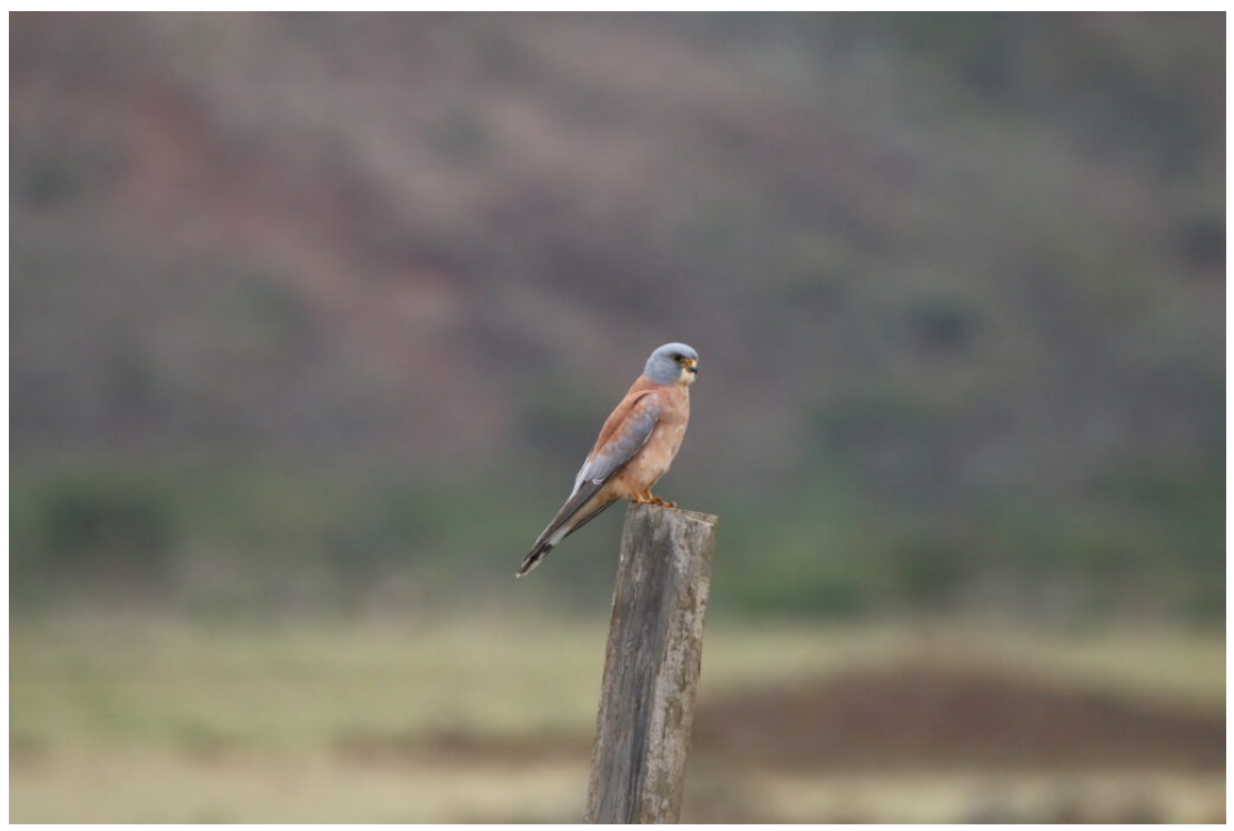
Lesser Kestrel