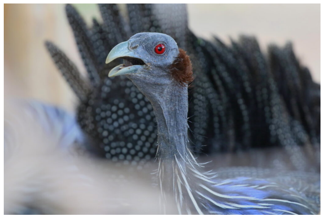
Vulturine Guineafowl