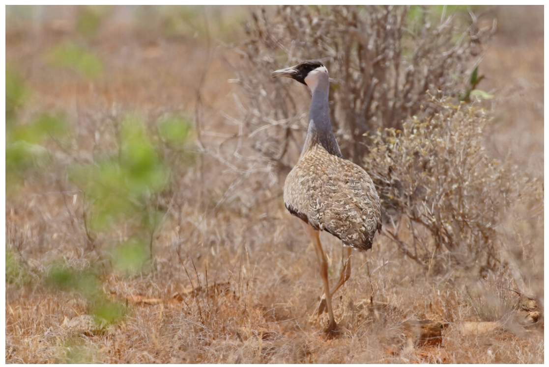
Heuglin's Bustard