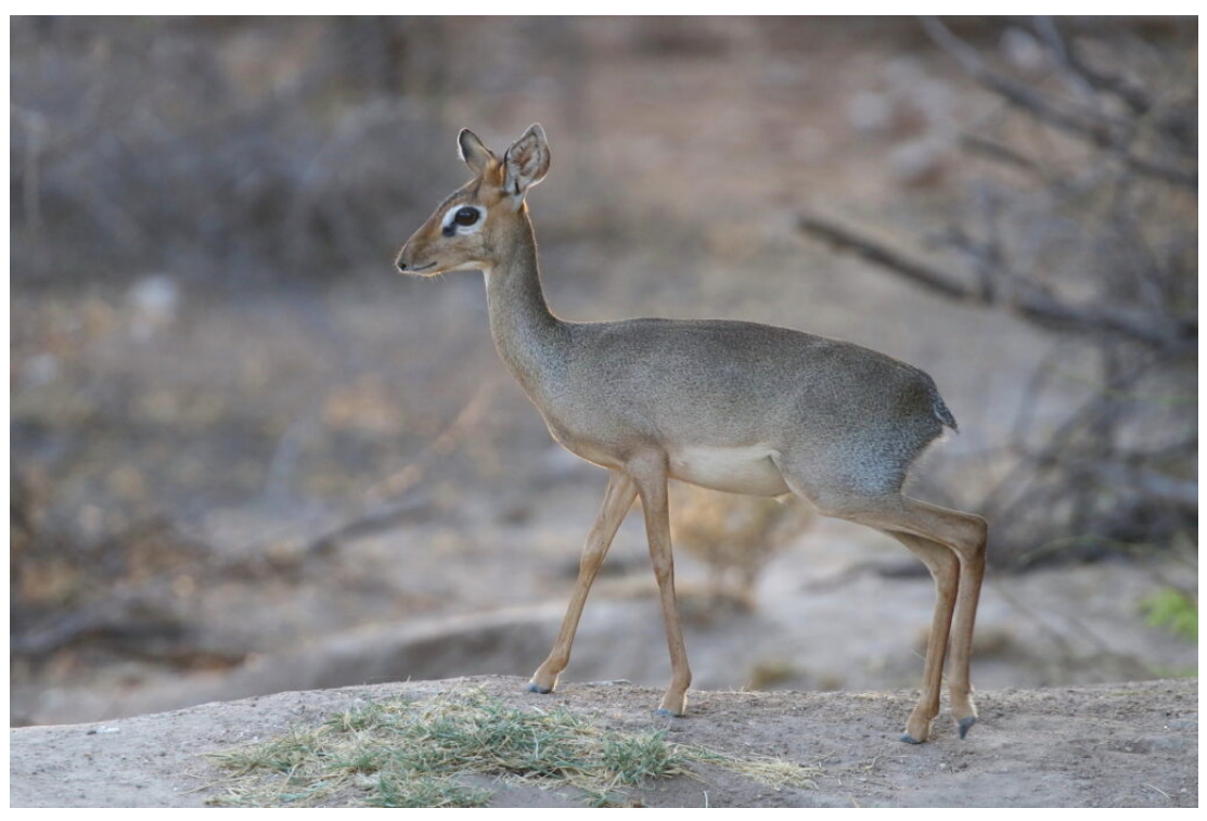
Kirk's Dikdik