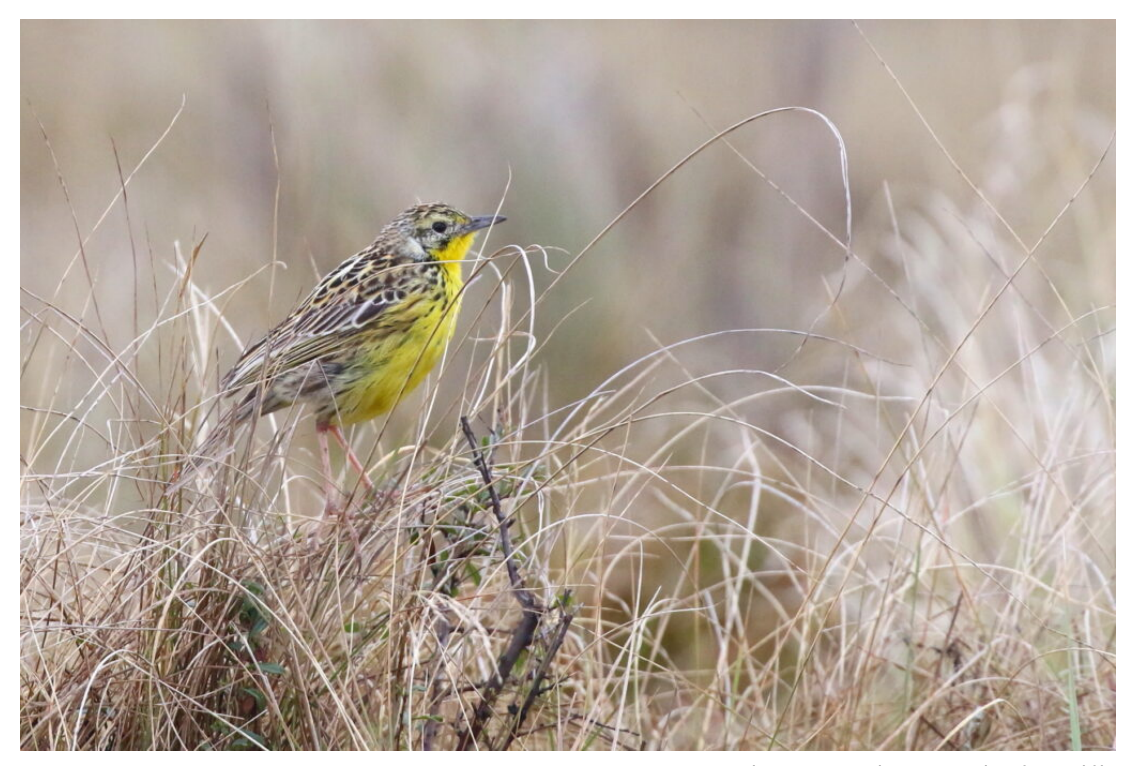
Sharpe's Longclaw