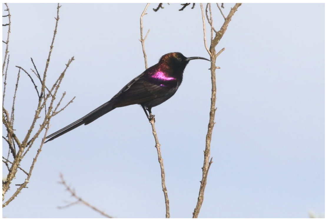
Tacazze Sunbird