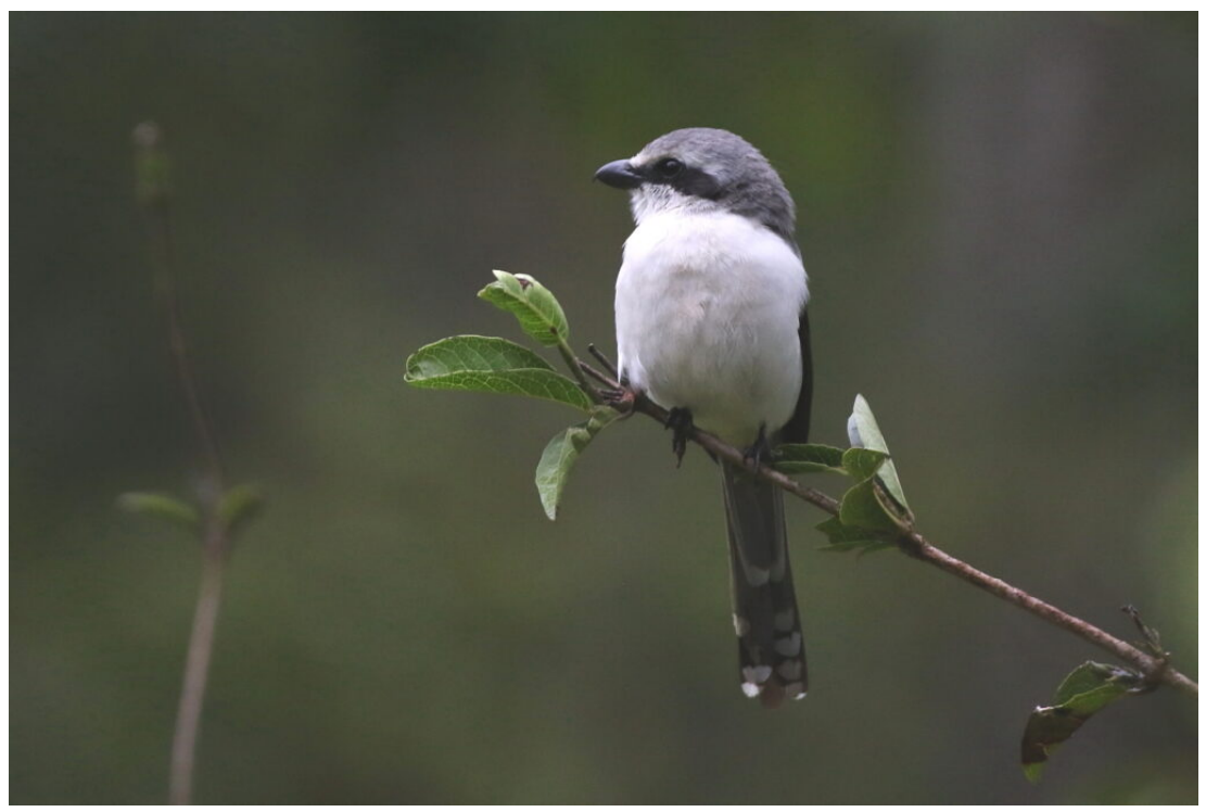
Mackinnon's Shrike