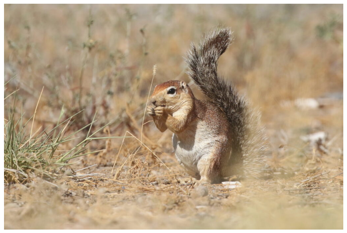
Unstriped Ground Squirrel