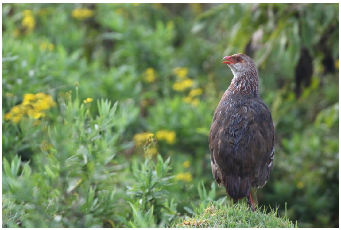
Jackson's Spurfowl