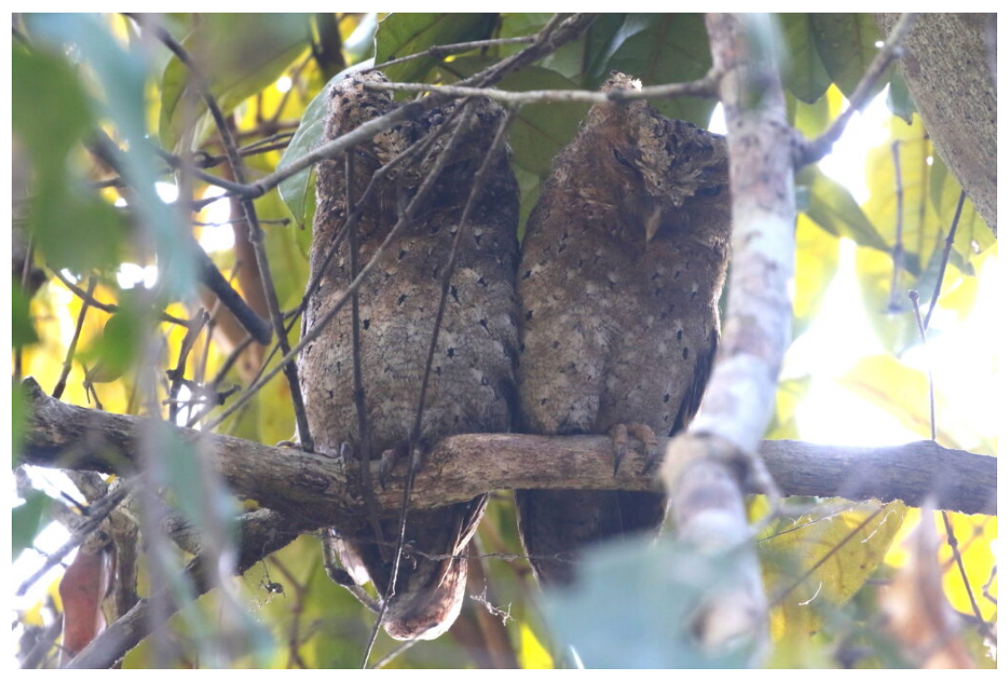
Sokoke Scops Owls