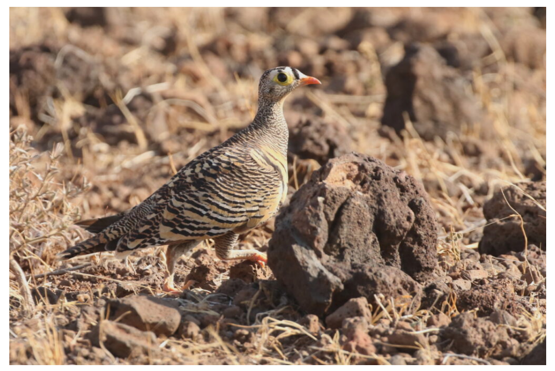
Lichtenstein's Sandgrouse