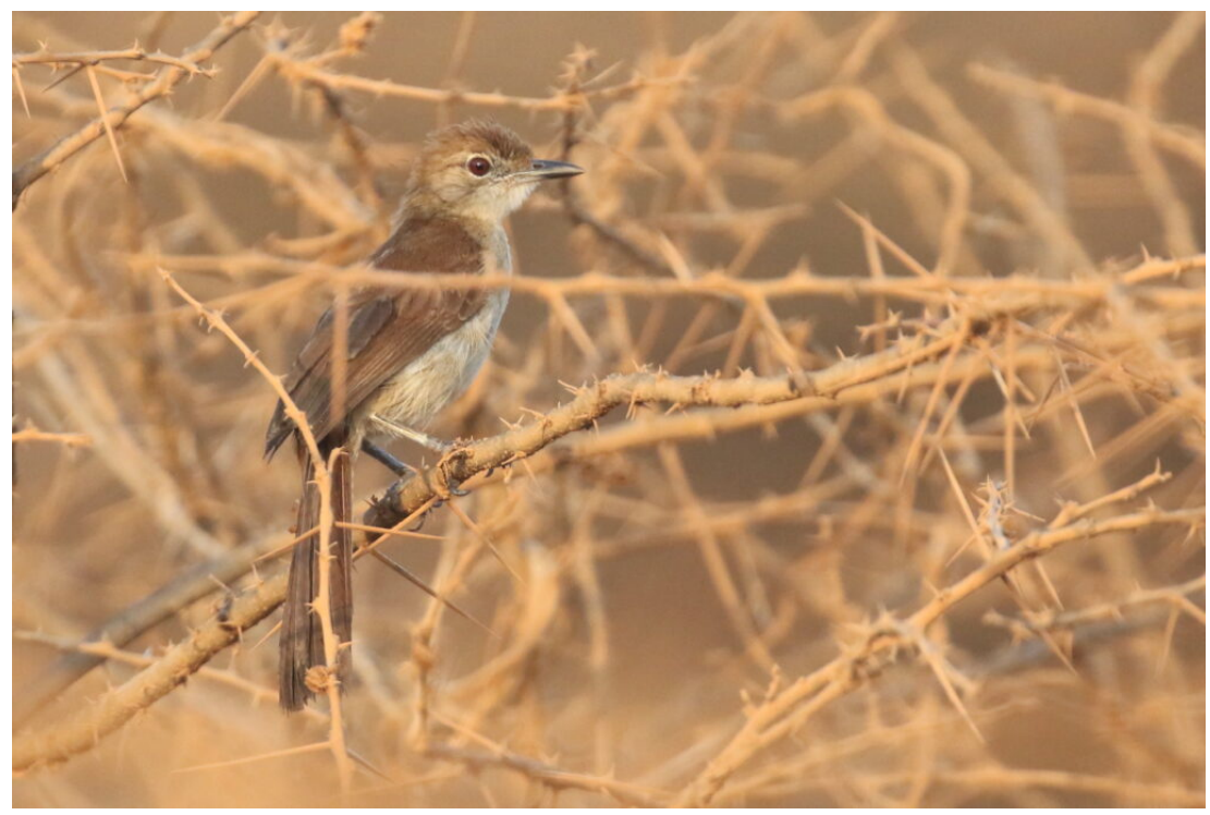
Northern Brownbul