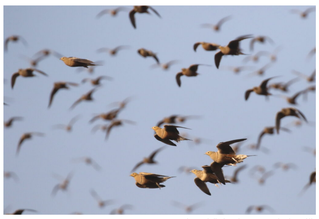
Chestnut-bellied Sandgrouse