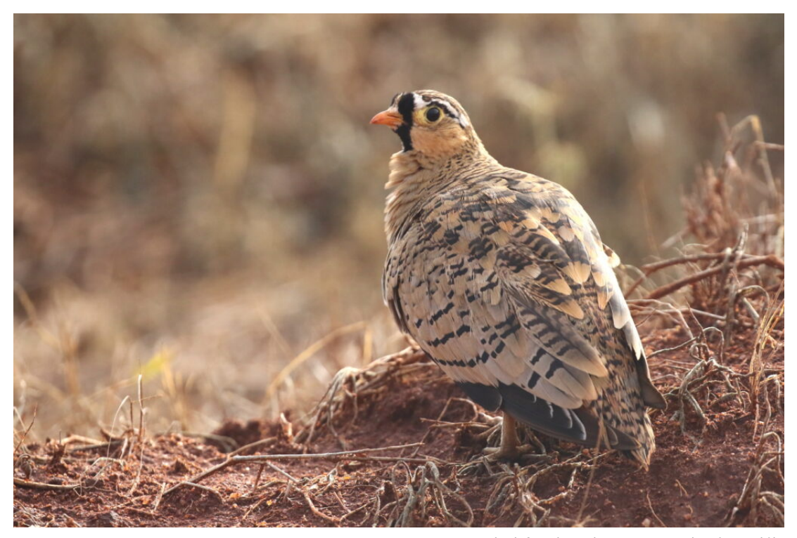
Black-faced Sandgrouse