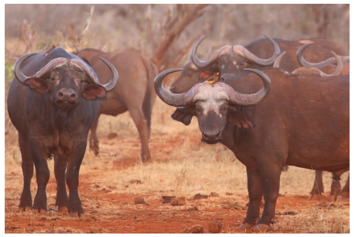
Yellow-billed Oxpecker with African Buffalo's