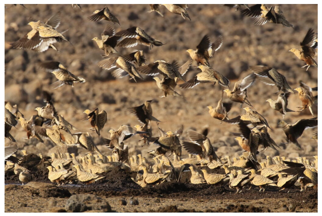
Chestnut-bellied Sandgrouse