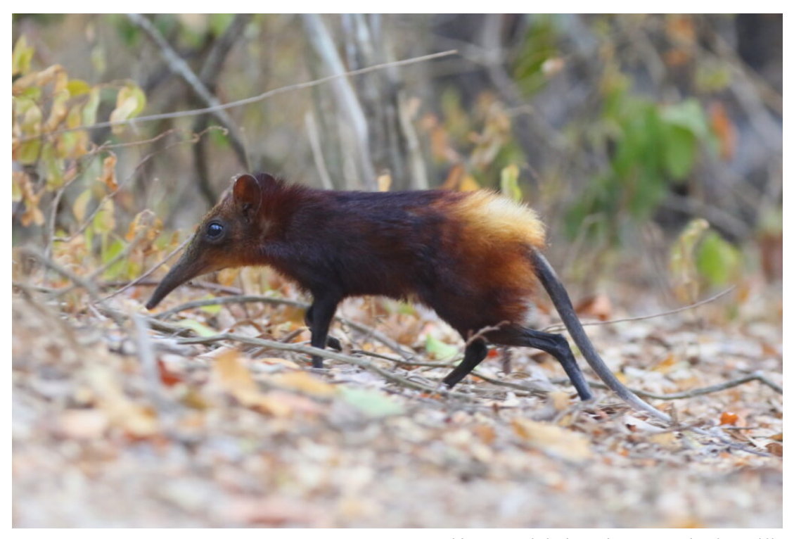
Golden-rumped Elephant Shrew