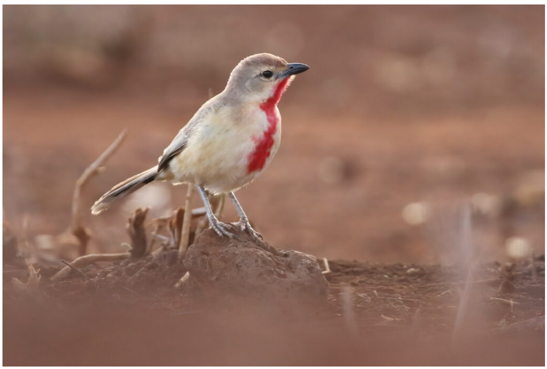
Rosy-patched Bushshrike