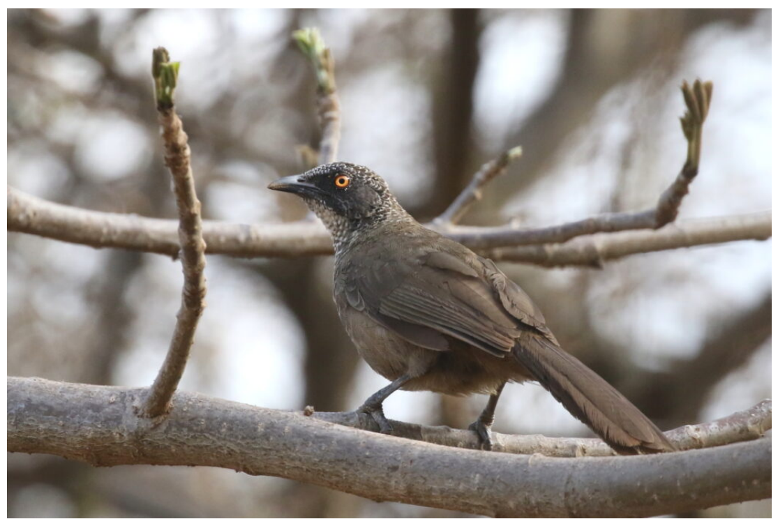
Scaly Babbler