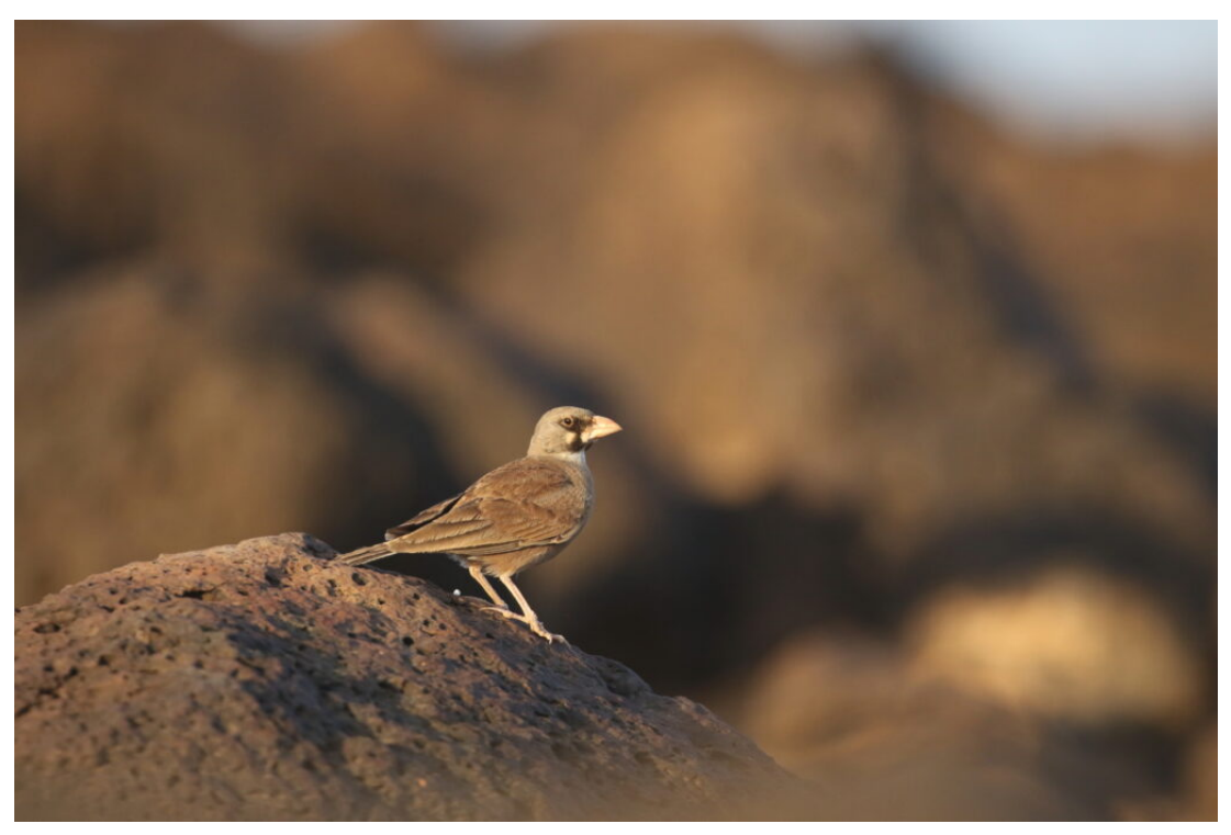
Masked Lark