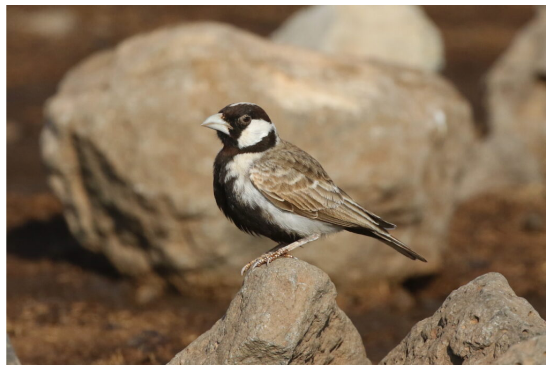
Chestnut-headed Sparrow-Lark