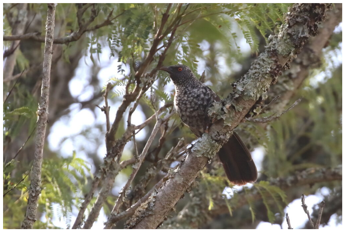
Hinde's Pied Babbler