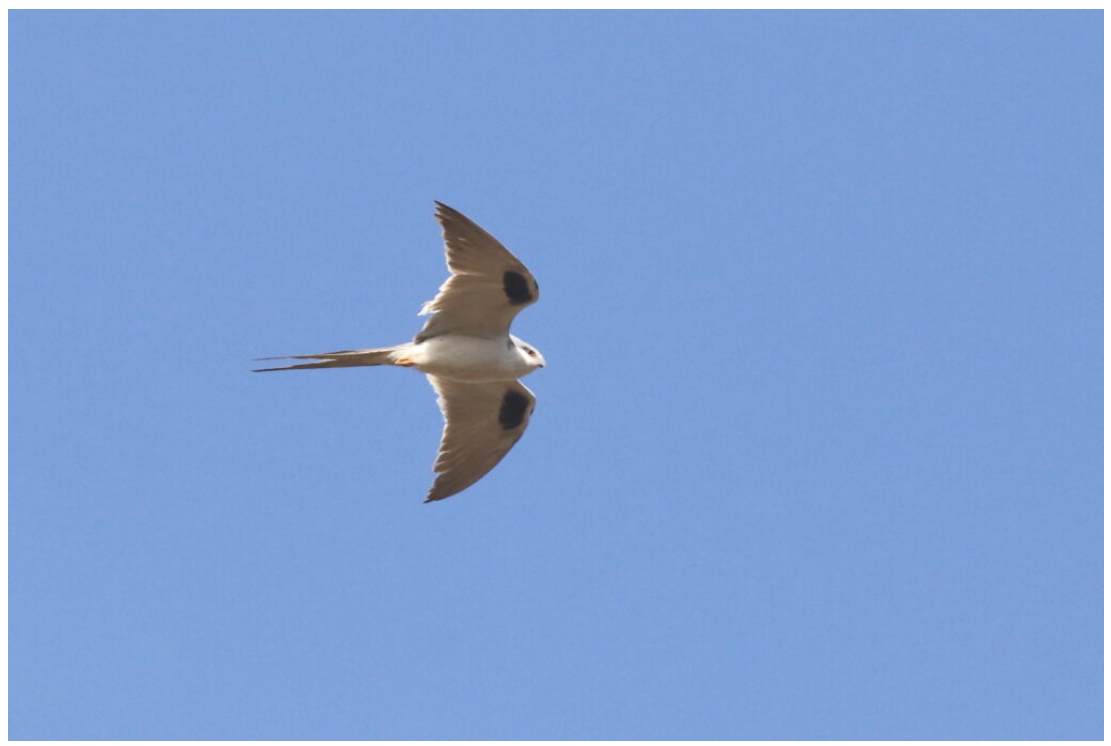
African Scissor-tailed Kite