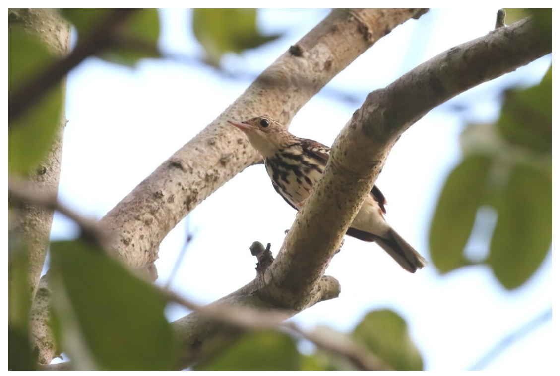
Sokoke Pipit