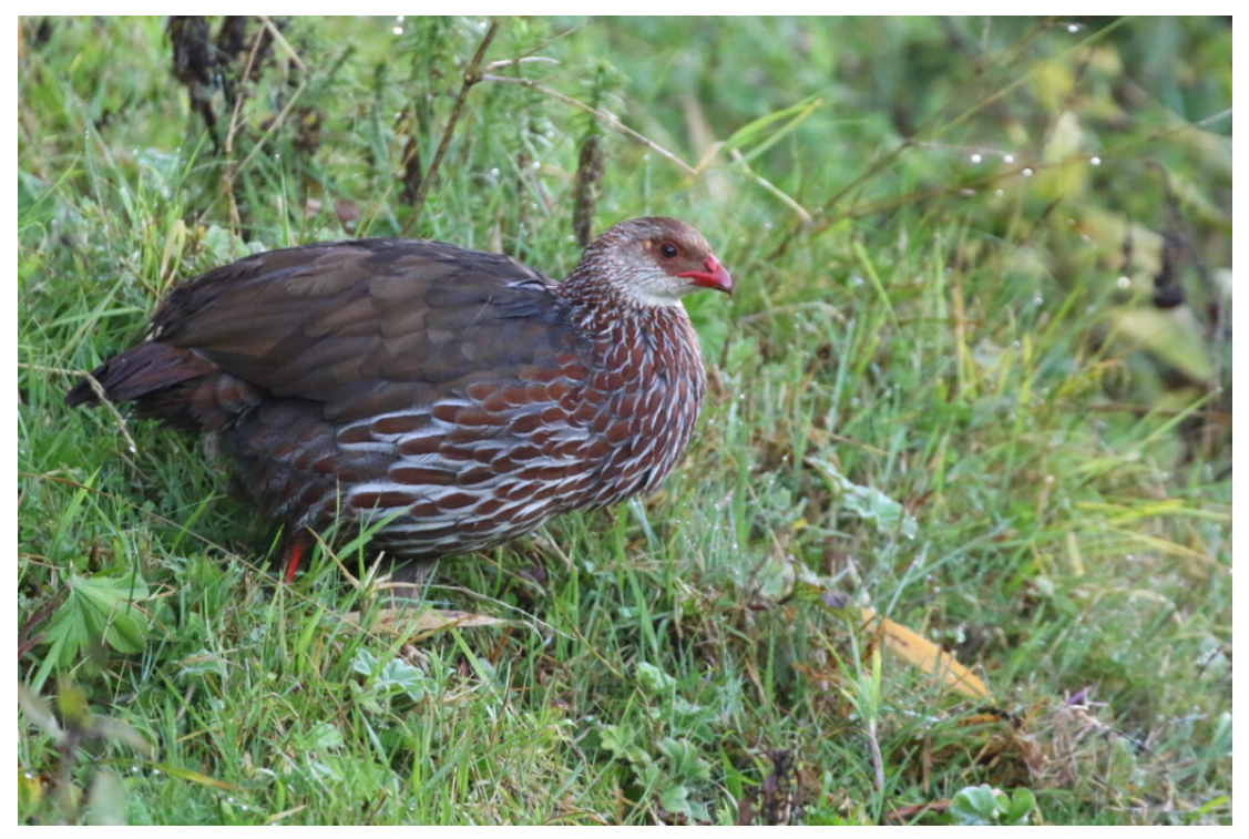
Jackson's Spurfowl