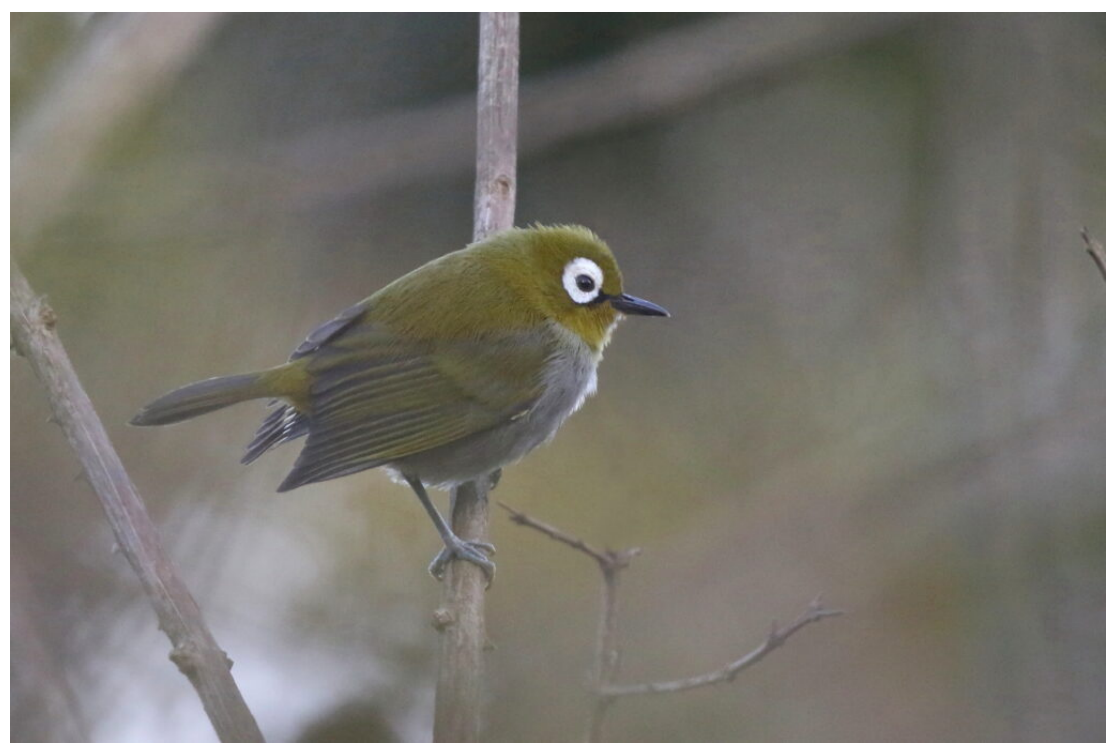
Taita White-eye