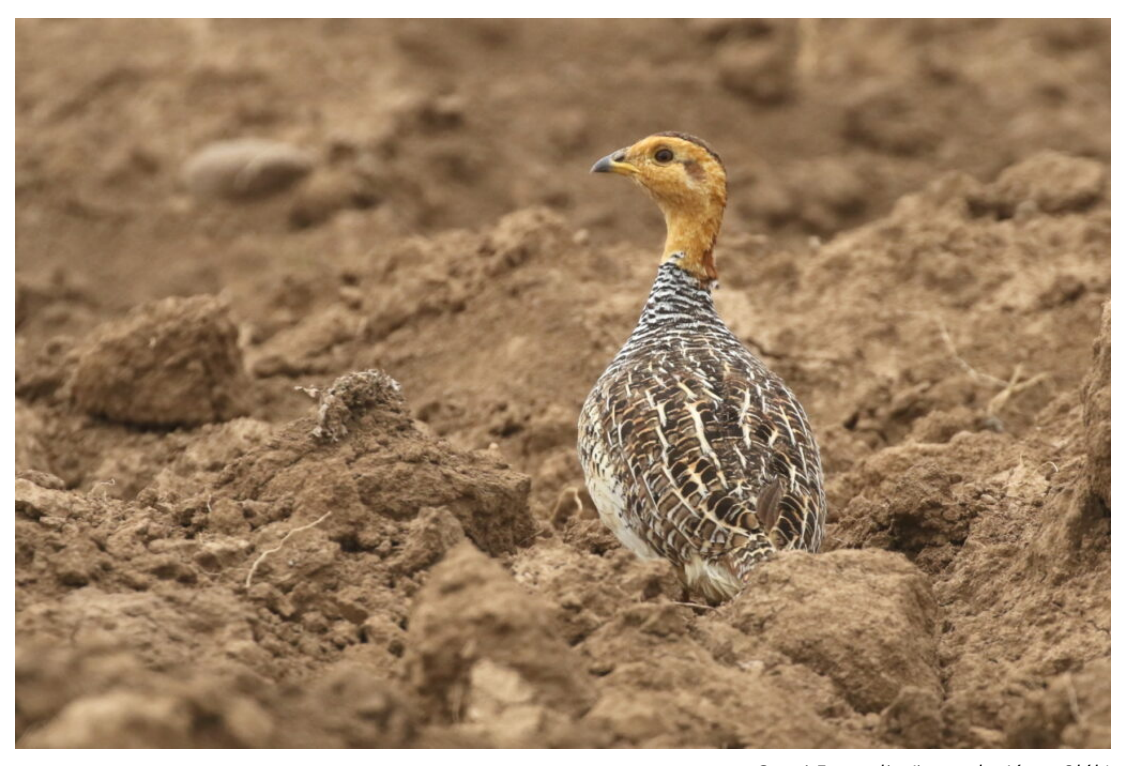
Coqui Francolin