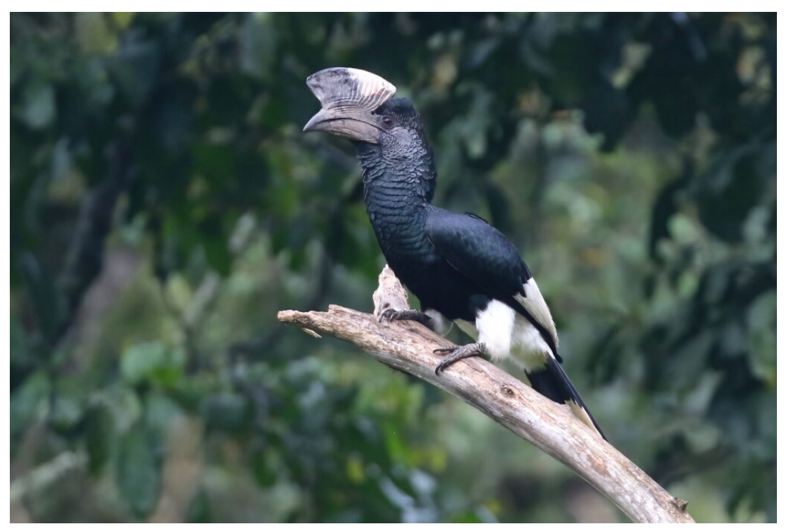
Black-and-white-casqued Hornbill