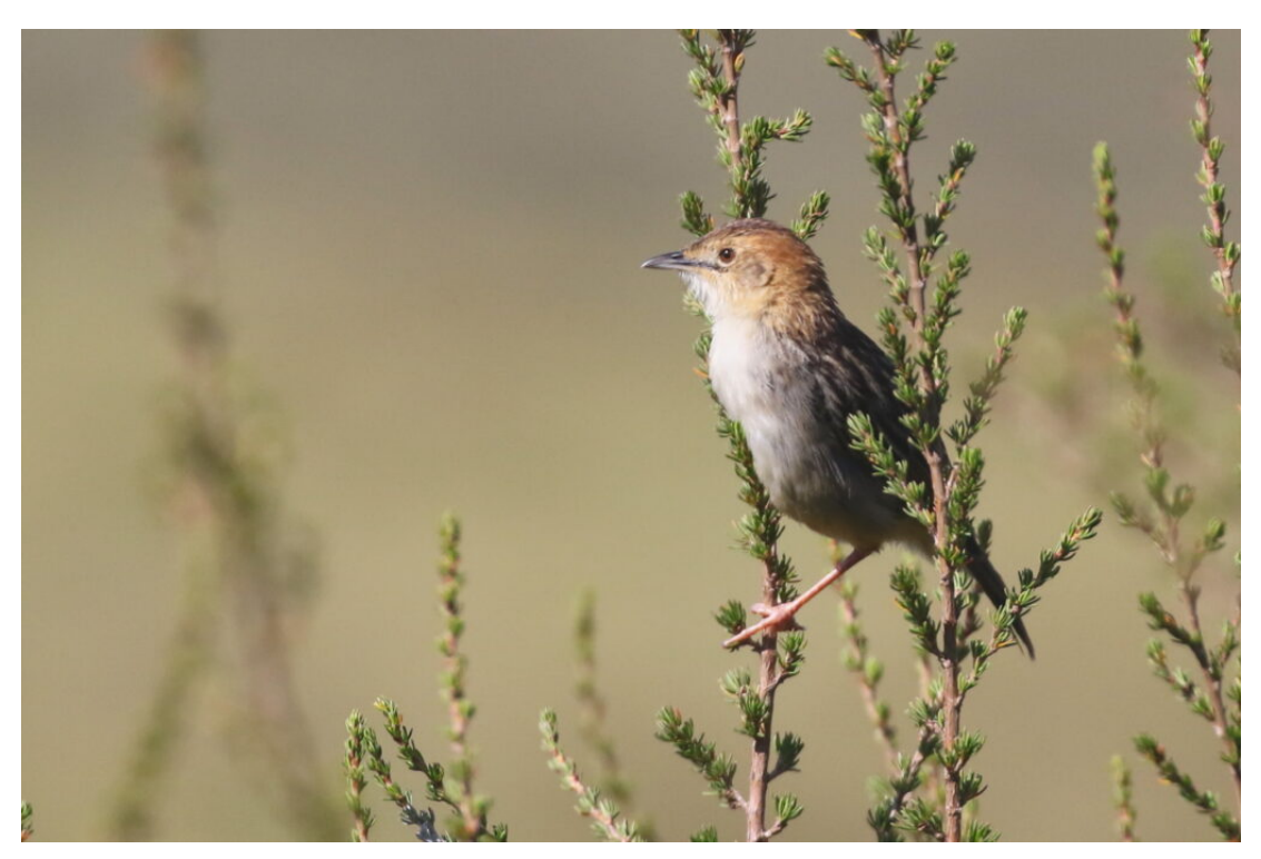
Aberdare Cisticola