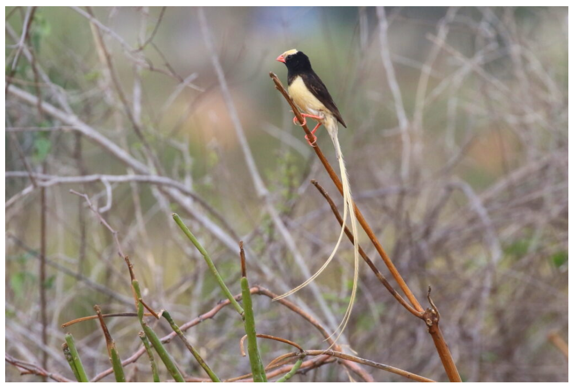
Straw-tailed Whydah