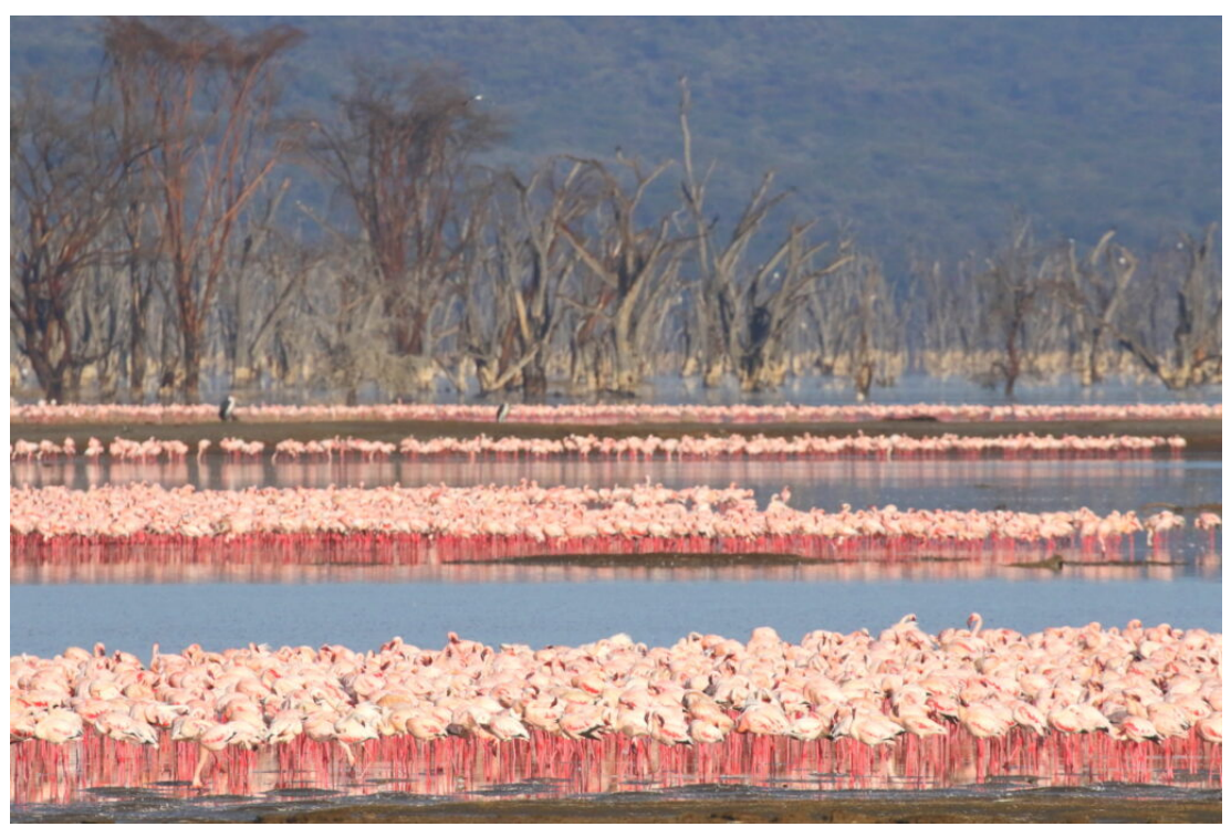
Lesser Flamingos