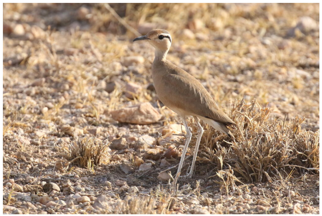
Somali Courser