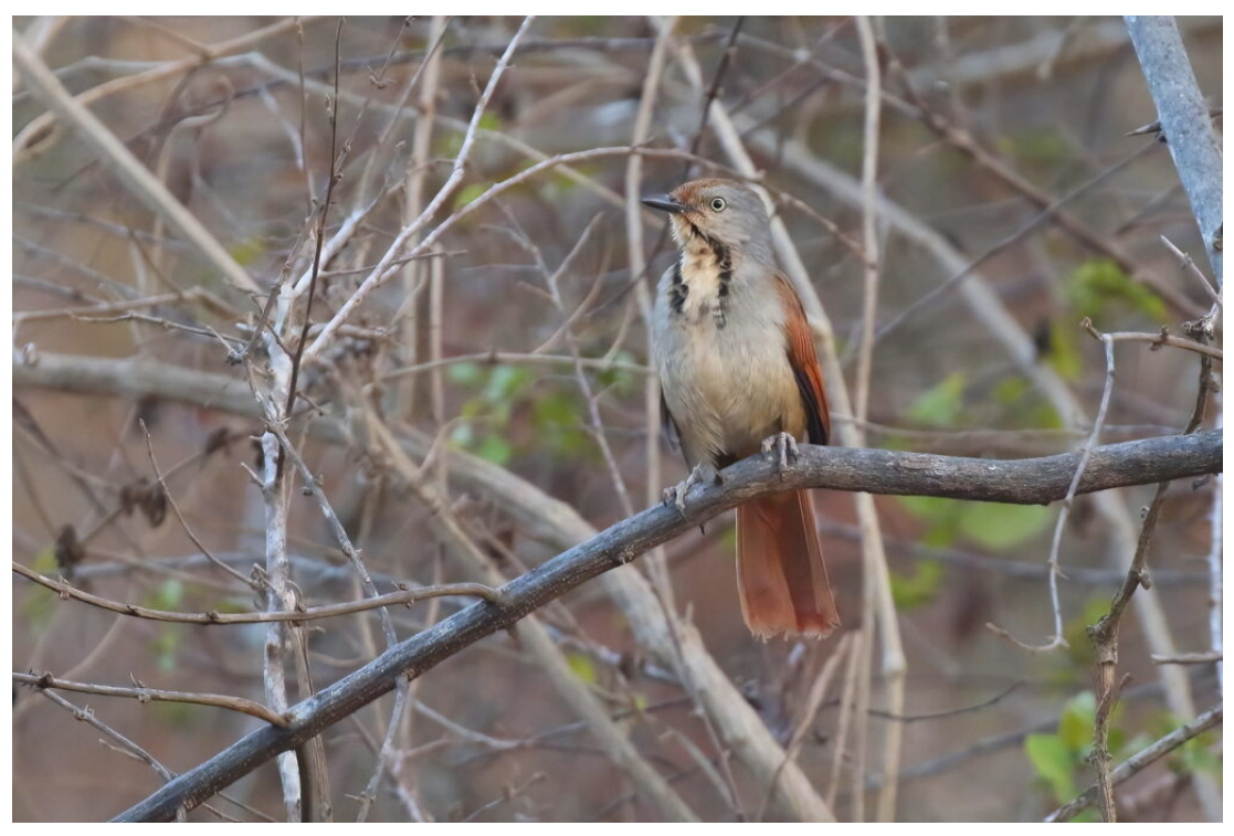
Collared Palm Thrush