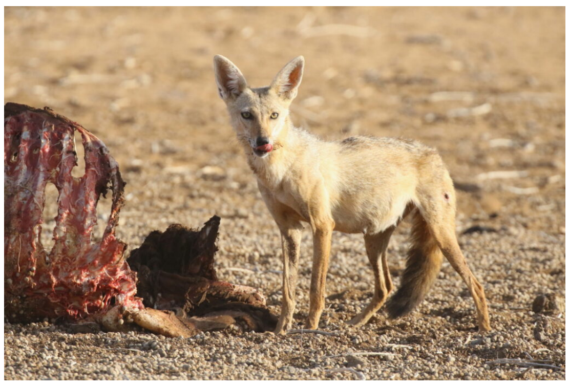
African Golden Wolf