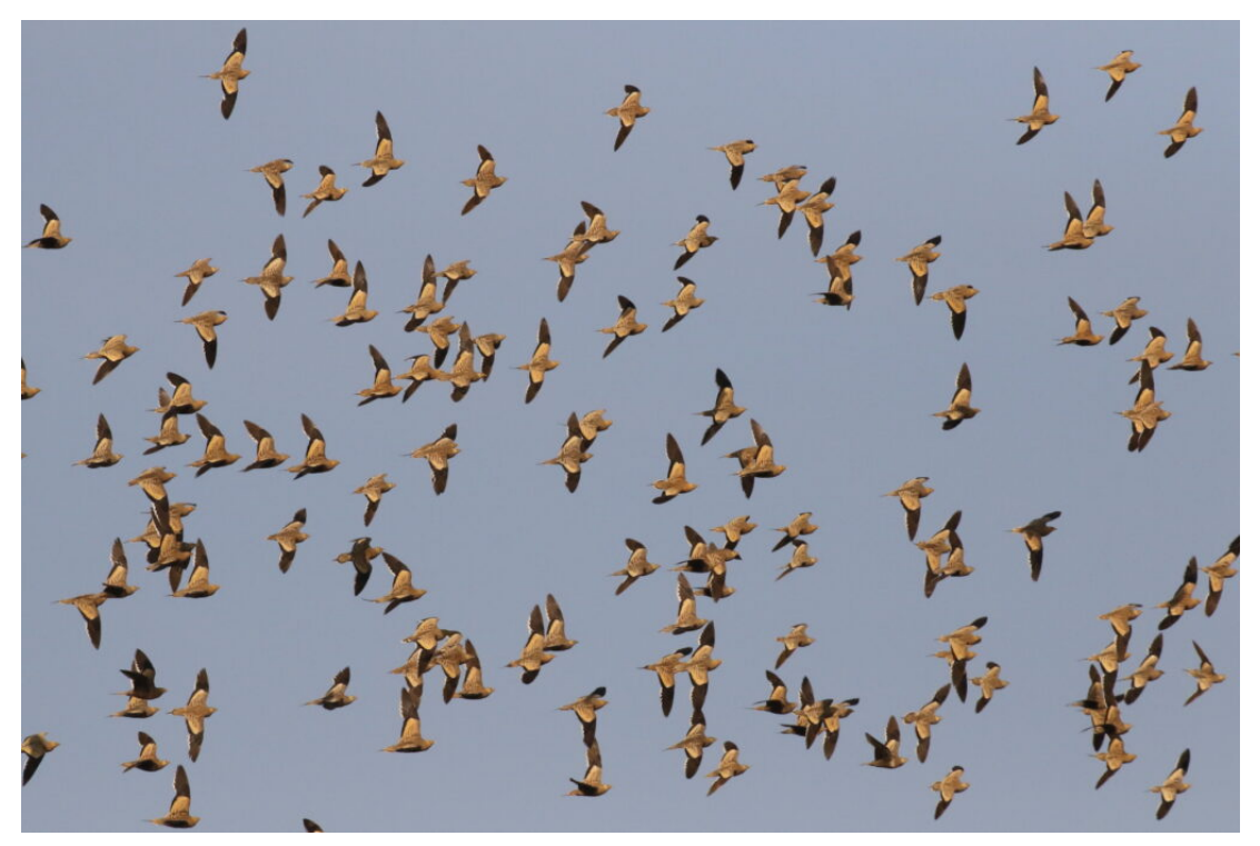
Chestnut-bellied Sandgrouse