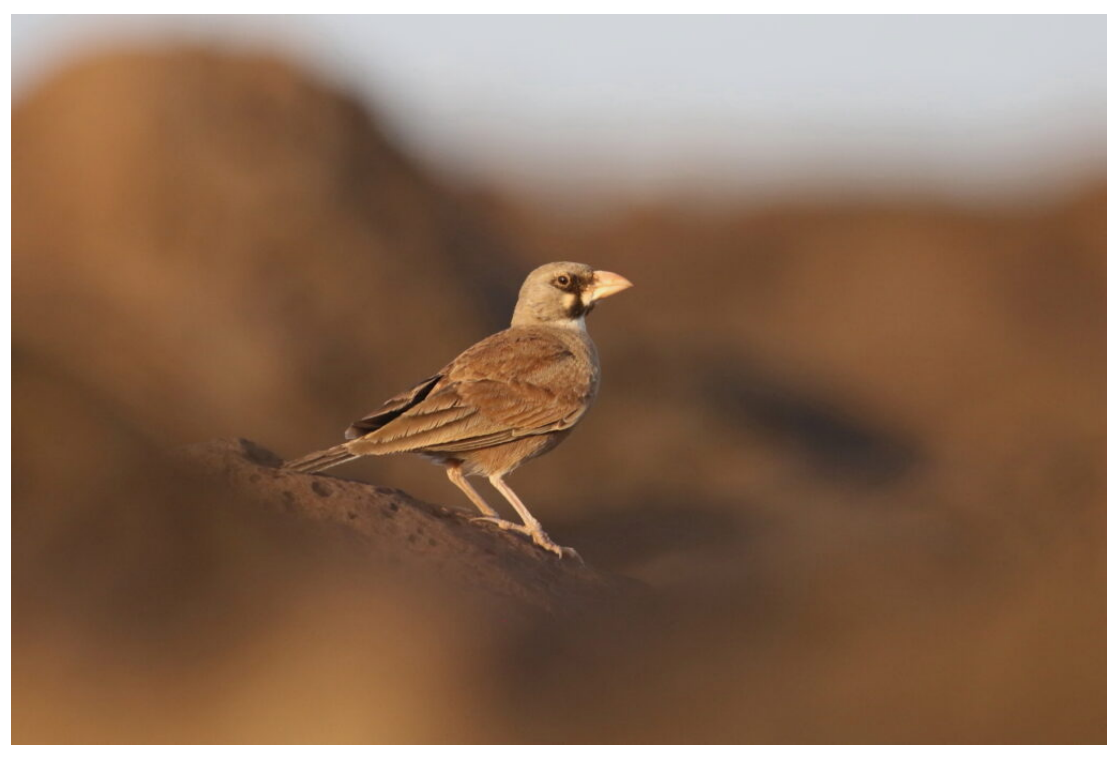
Masked Lark