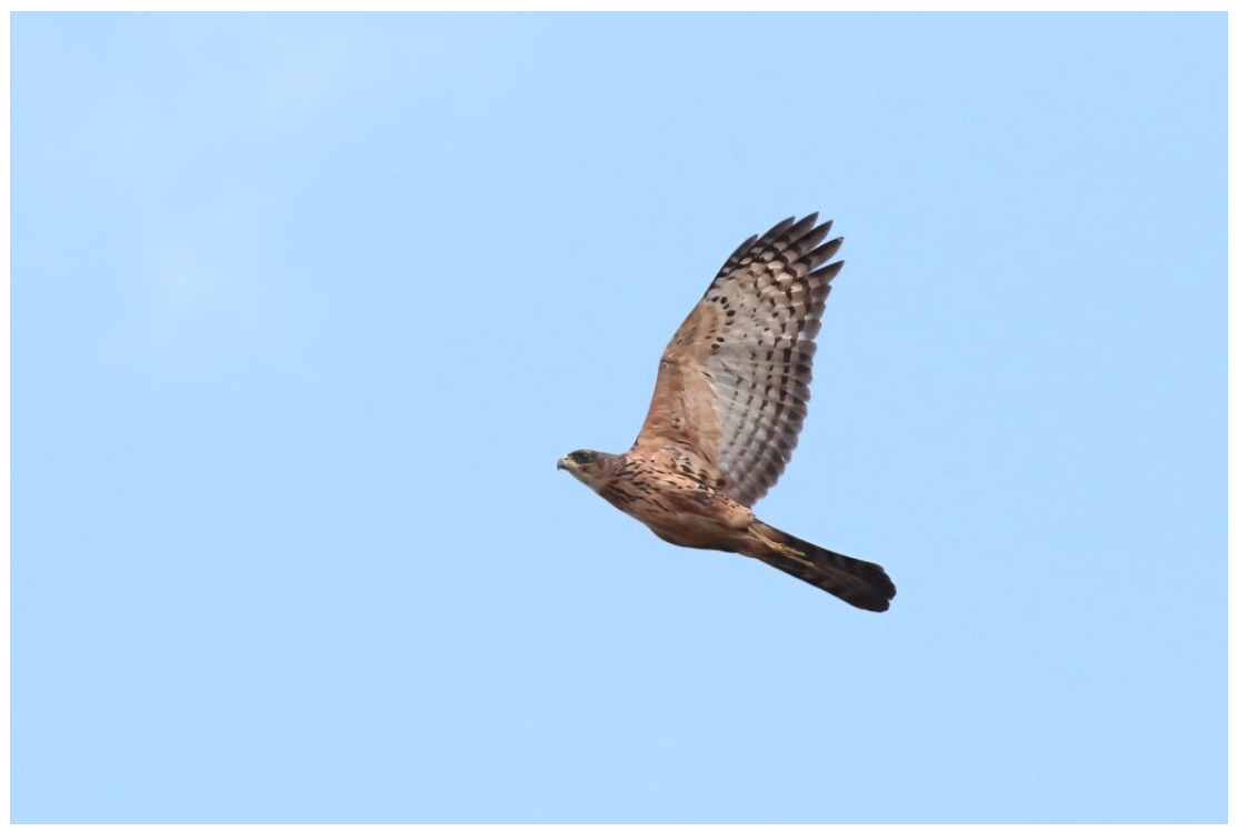
Black Sparrowhawk