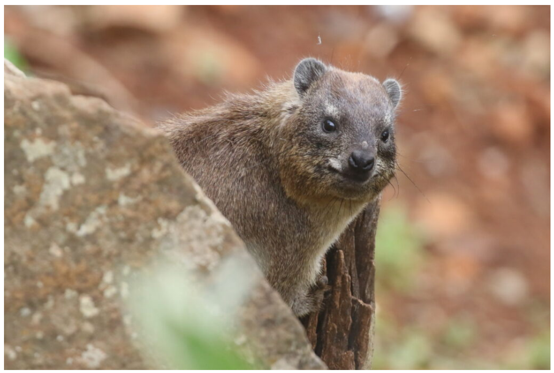
Yellow-spotted Hyrax