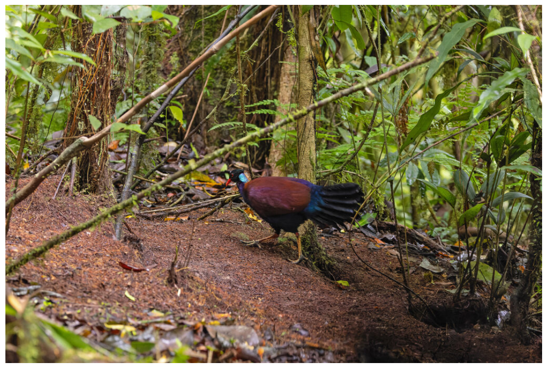
Pheasant Pigeon