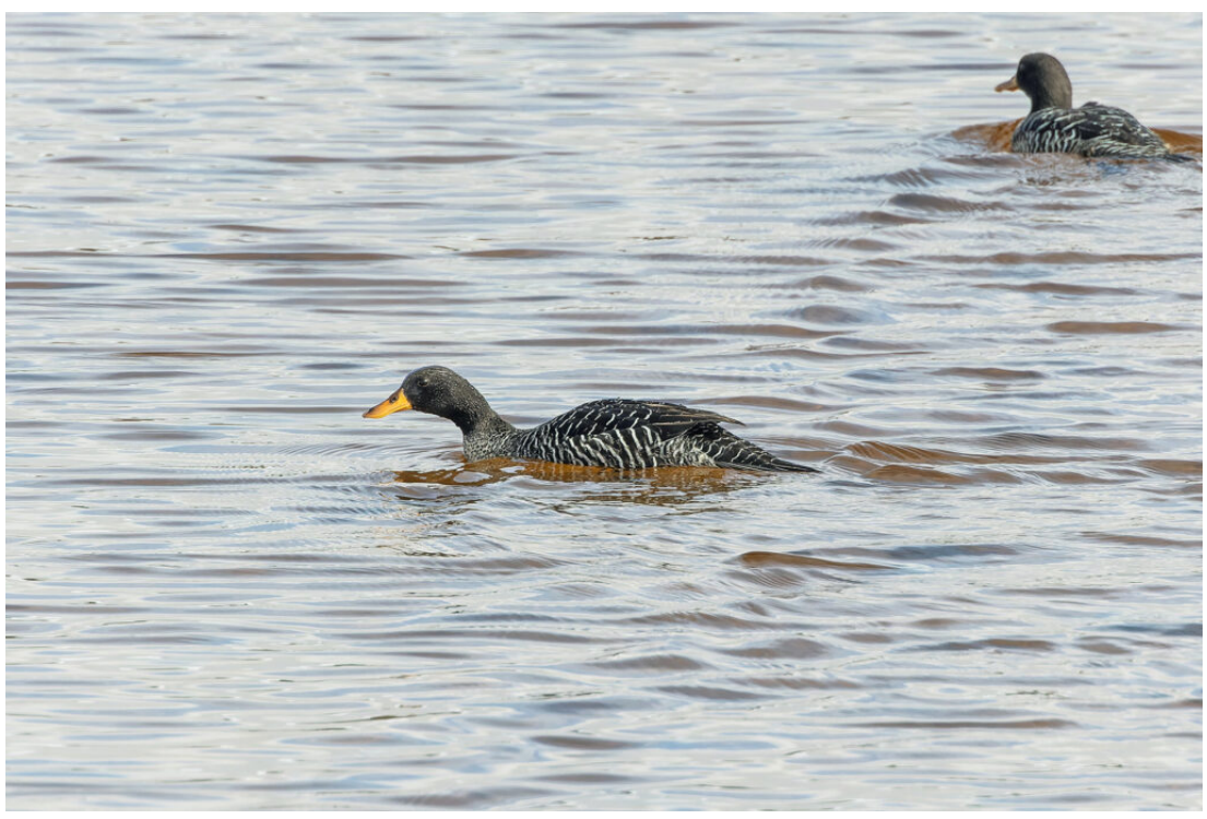
Salvadori's Teal