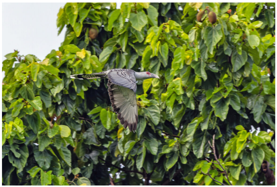
Channel-billed Cuckoo