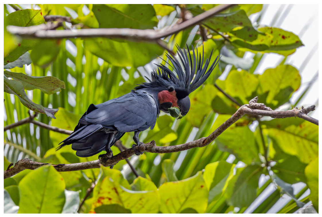
Palm Cockatoo