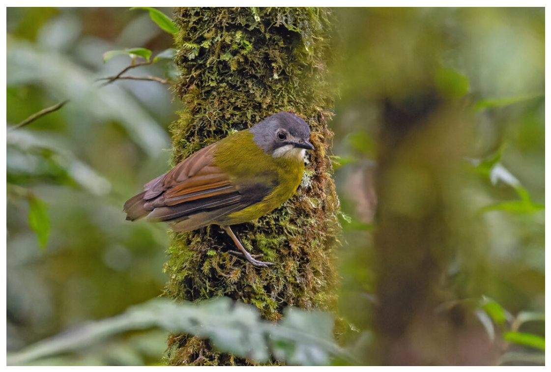
Green-backed Robin