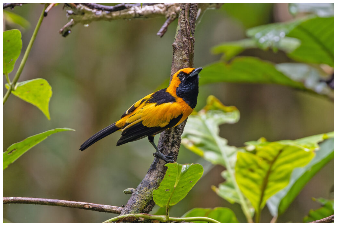
Golden Monarch