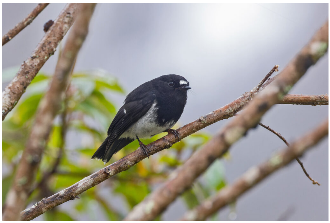
Mountain Robin