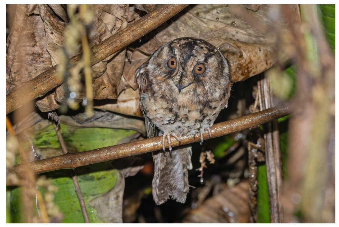
Mountain Owlet-nightjar