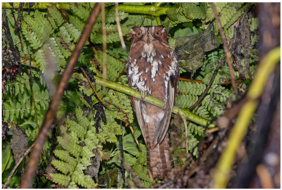
Feline Owlet-nightjar