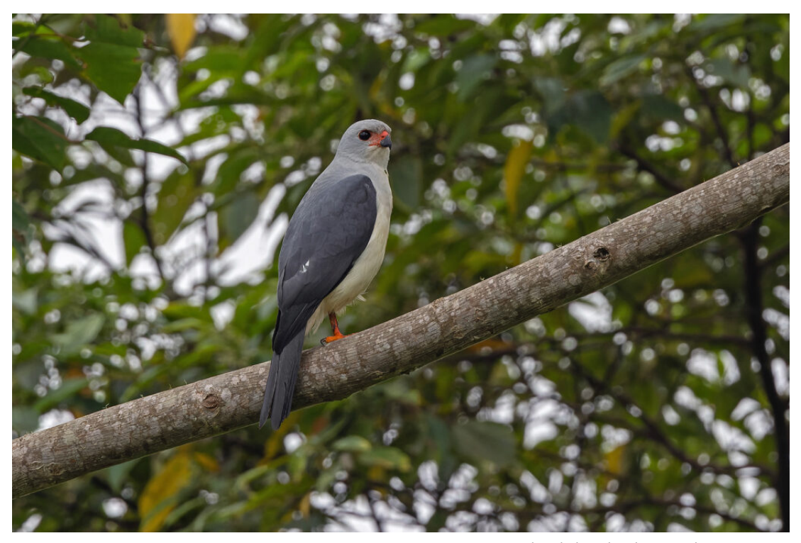
Grey-headed Goshawk