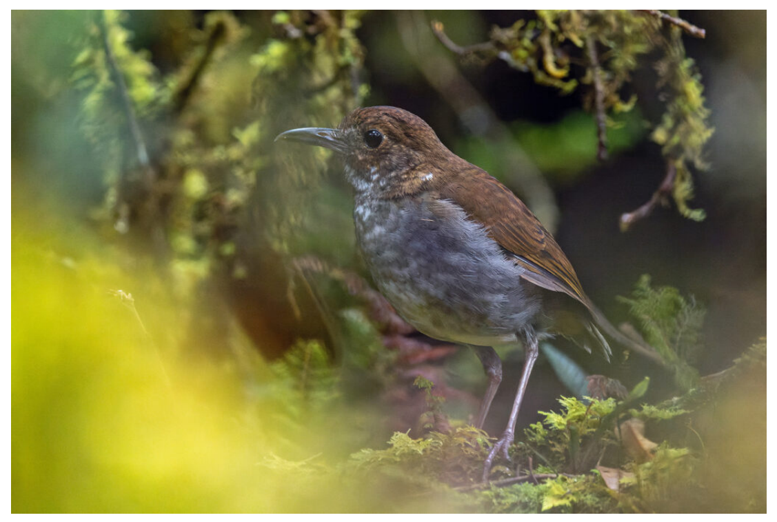
Greater Ground Robin