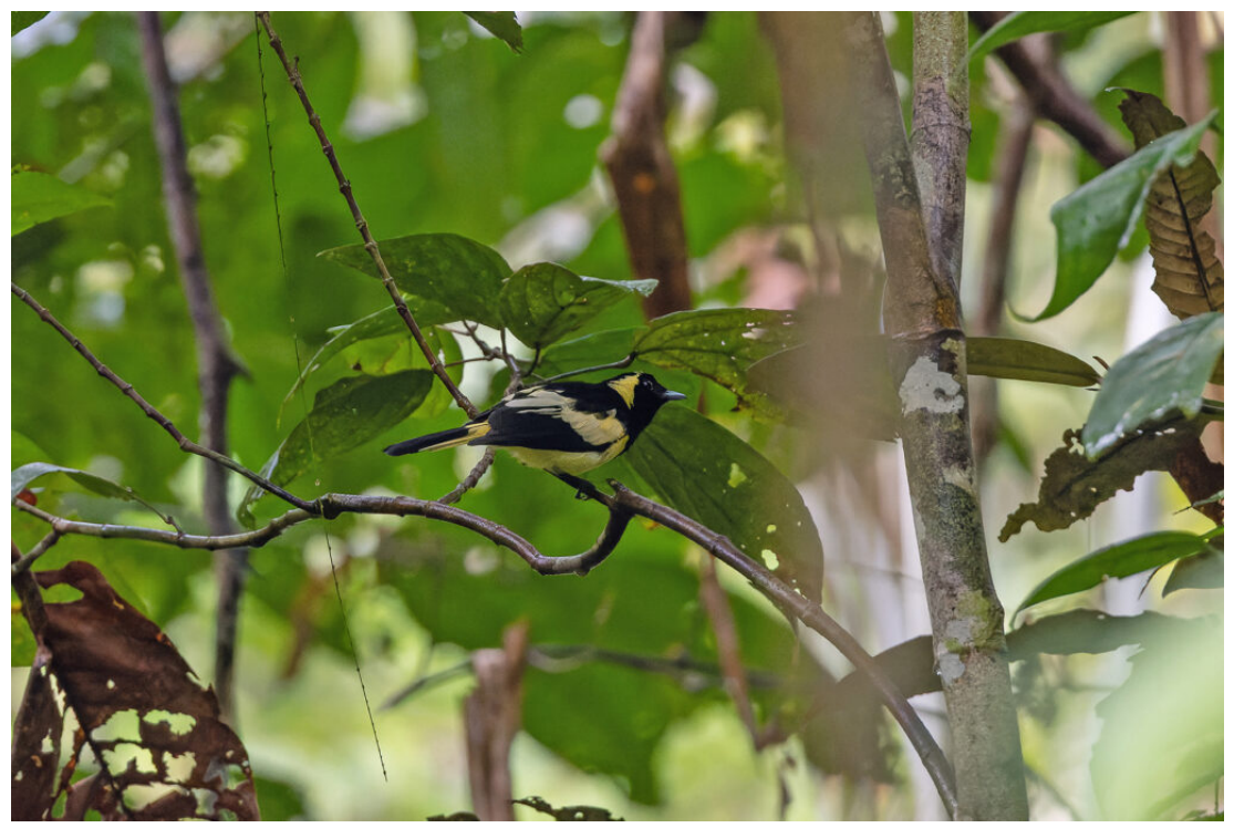
Biak Monarch