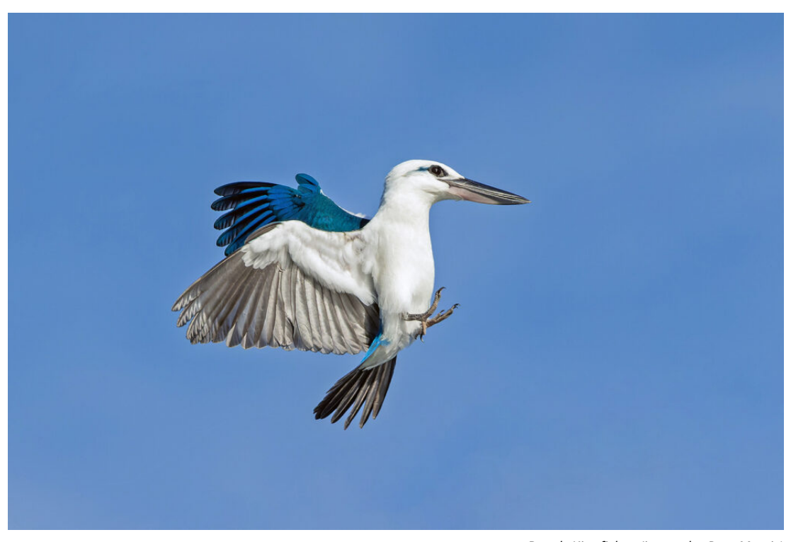
Beach Kingfisher