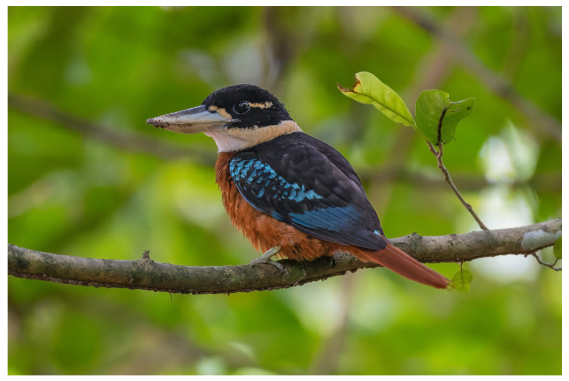
Rufous-bellied Kookaburra