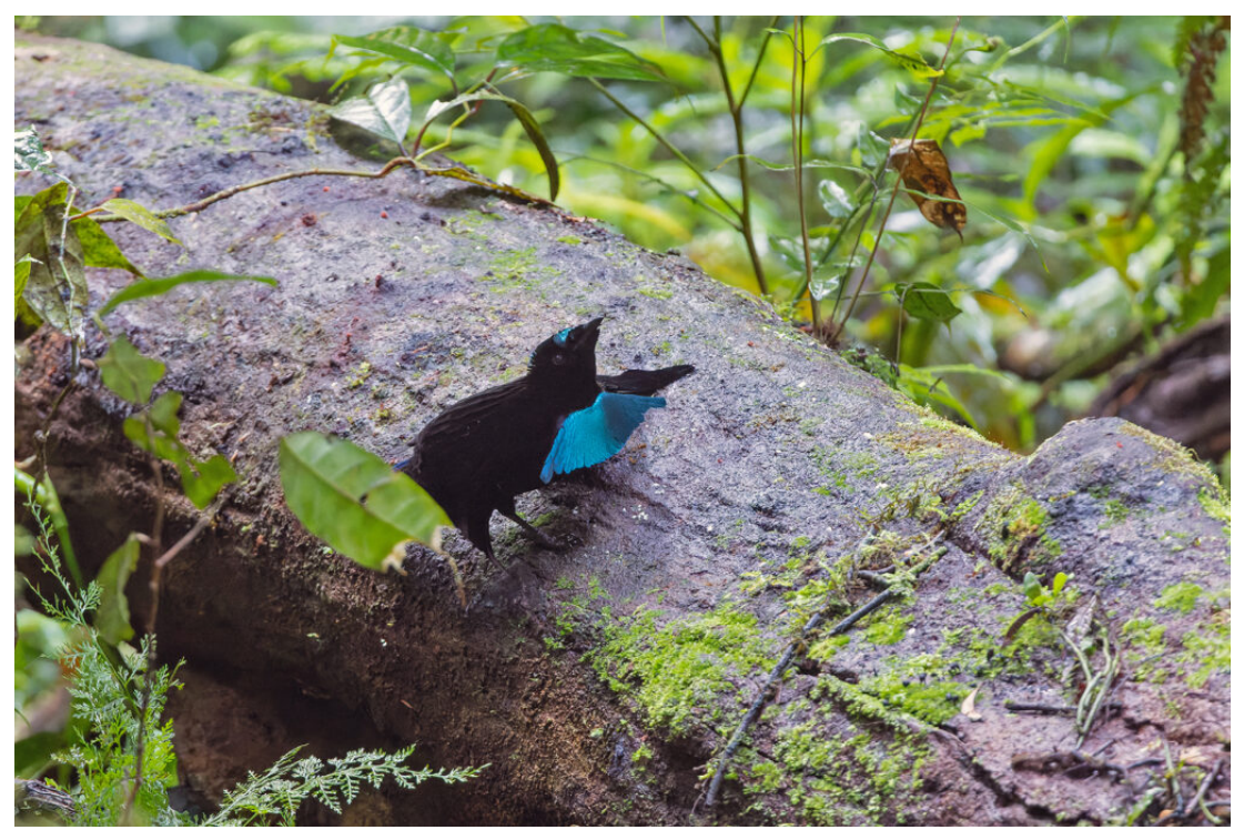
Crescent-caped Lophorina