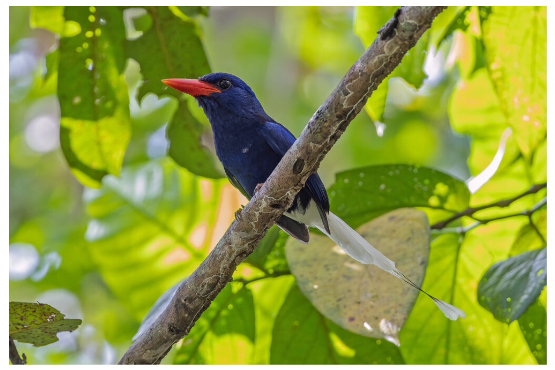
Numfor Paradise Kingfisher