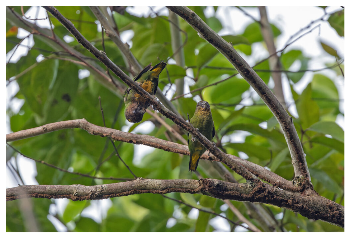
Geelvink Pygmy Parrot