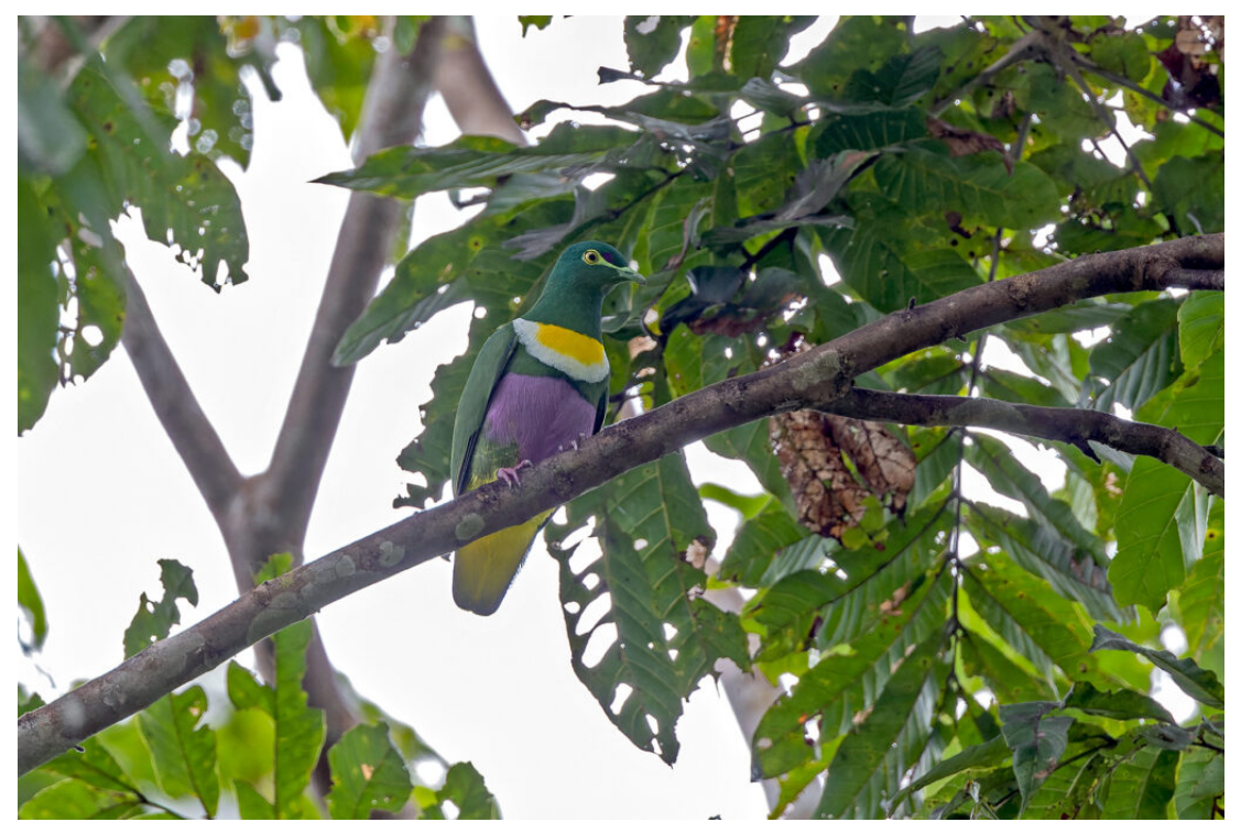
Geelvink Fruit Dove