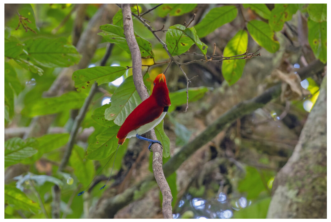
King Bird-of-paradise