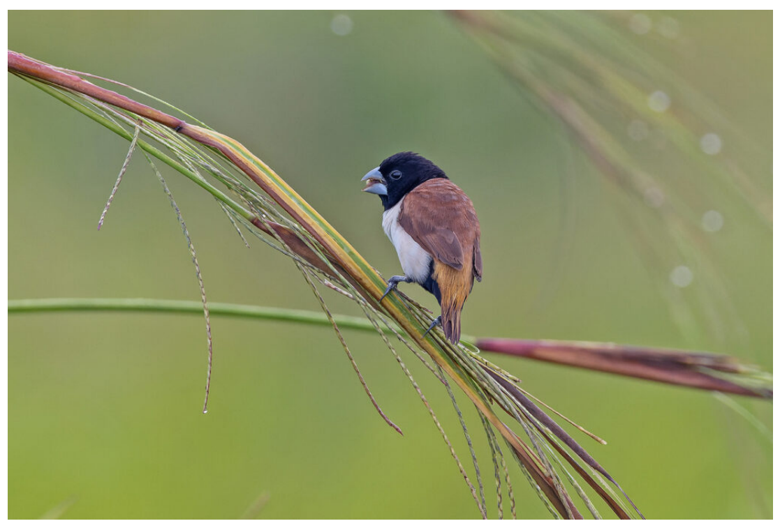
Hooded Mannikin