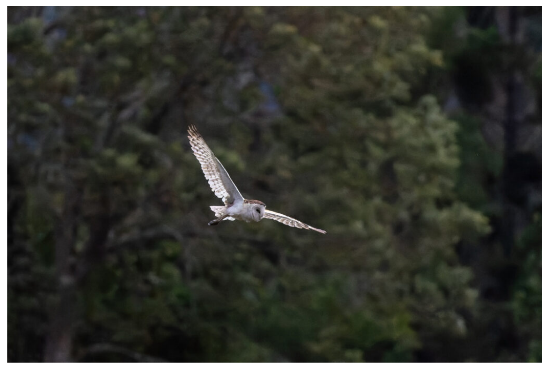
Eastern Grass Owl