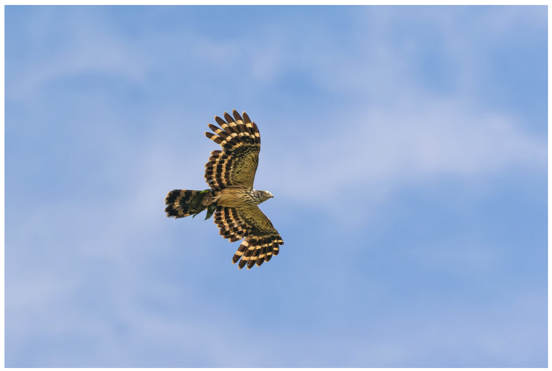
Long-tailed Honey Buzzard