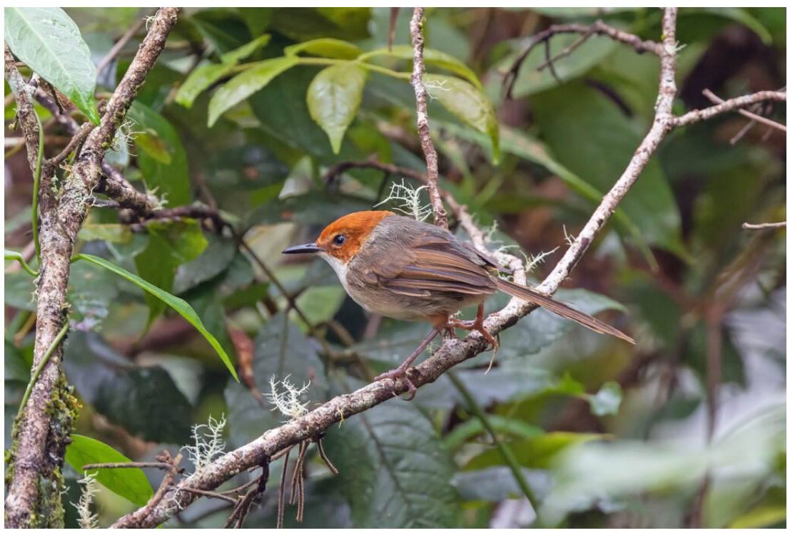
Orange-crowned Fairywren