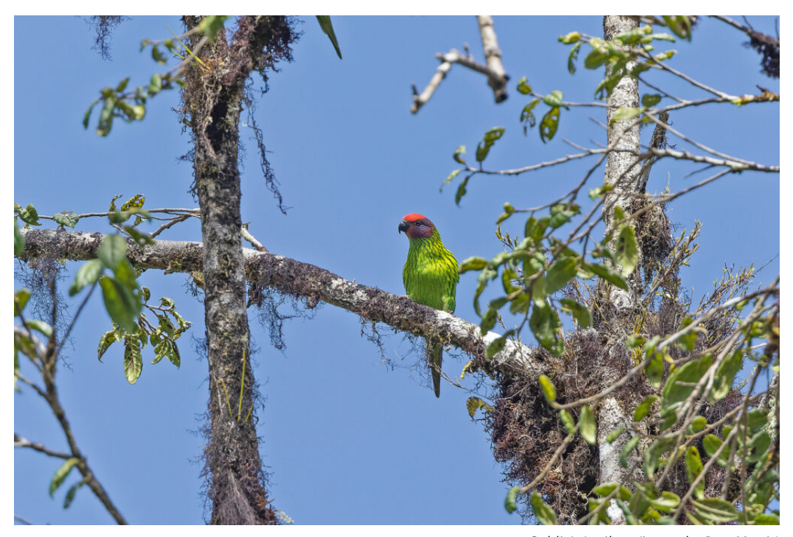
Goldie's Lorikeet