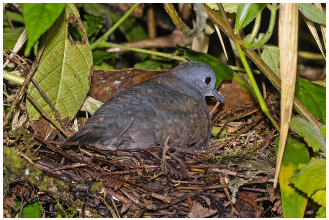
Bronze Ground Dove