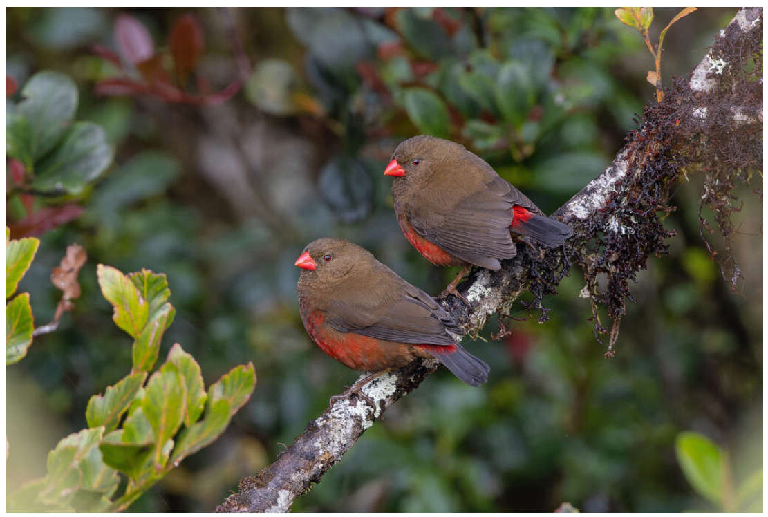
Mountain Firetail