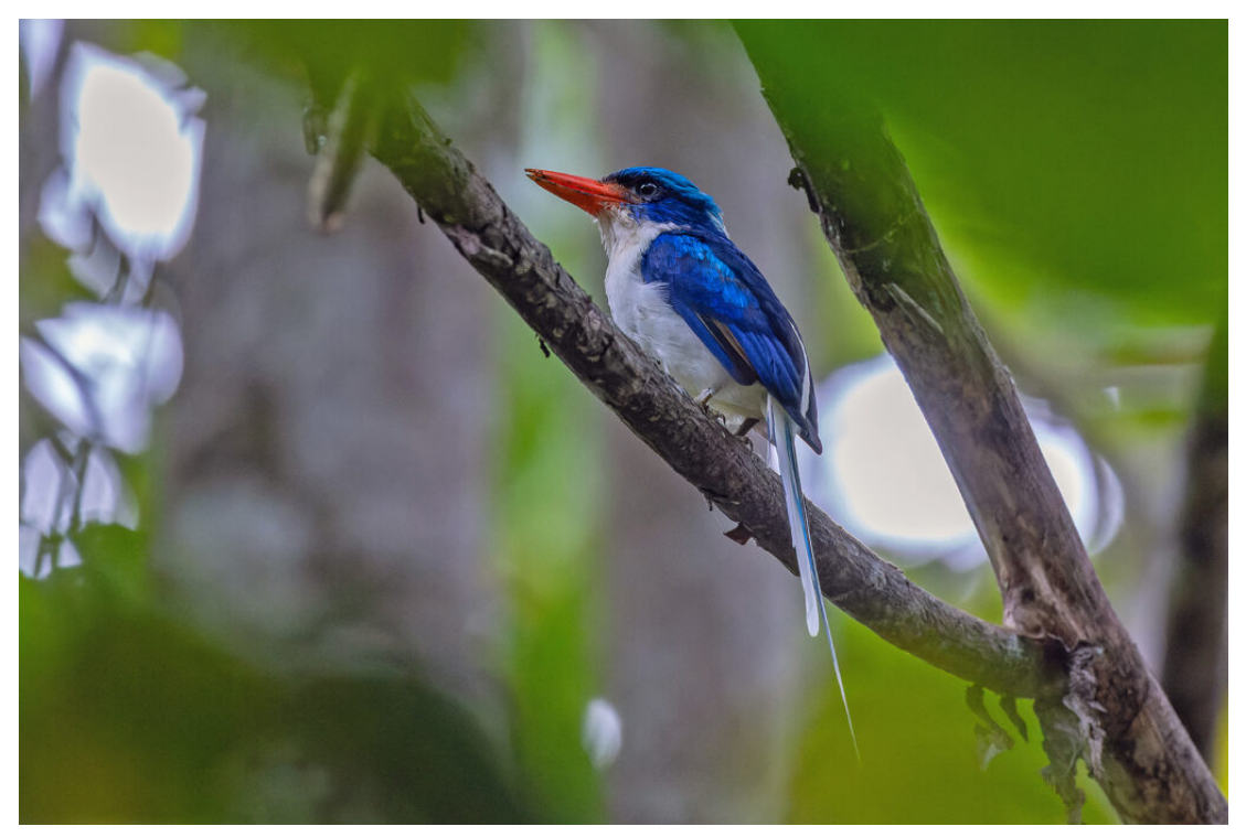
Common Paradise Kingfisher