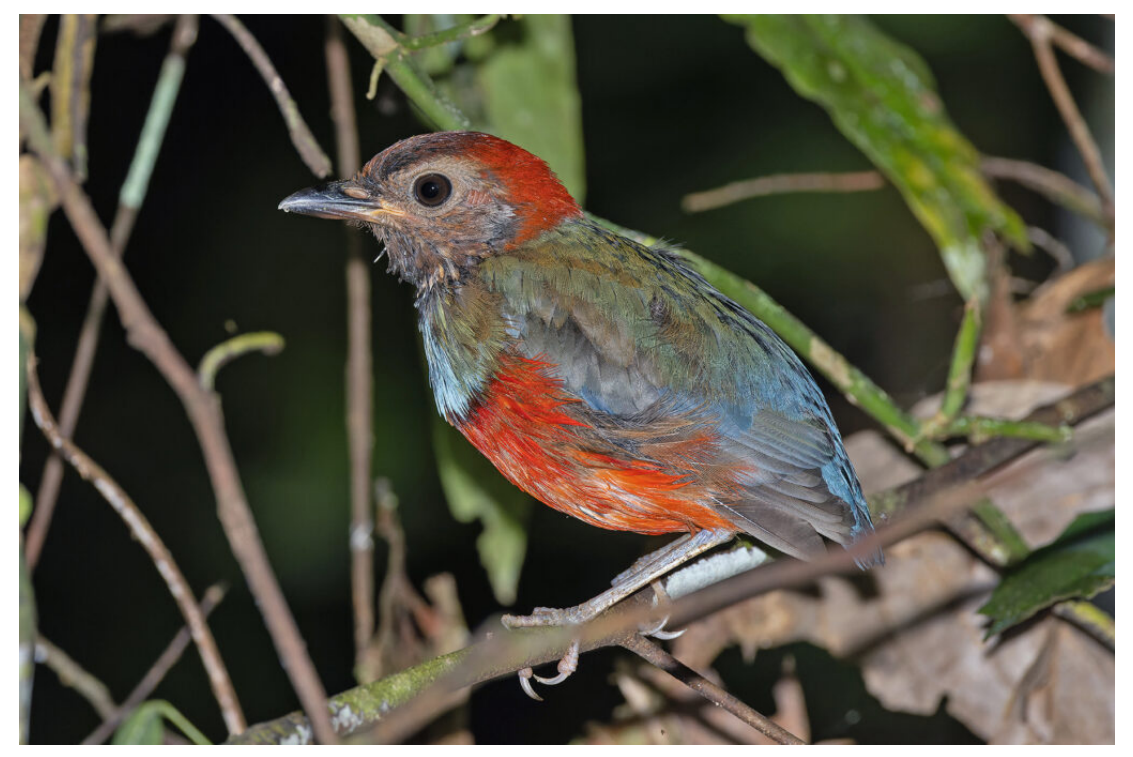
Papuan Pitta