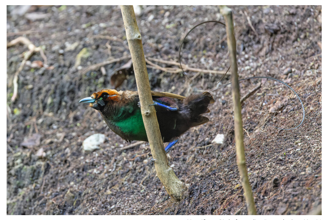
Magnificent Bird-of-paradise