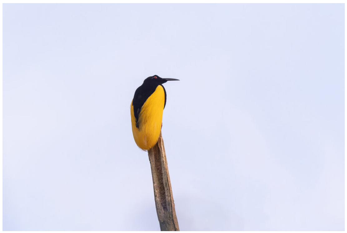
Twelve-wired Bird-of-paradise