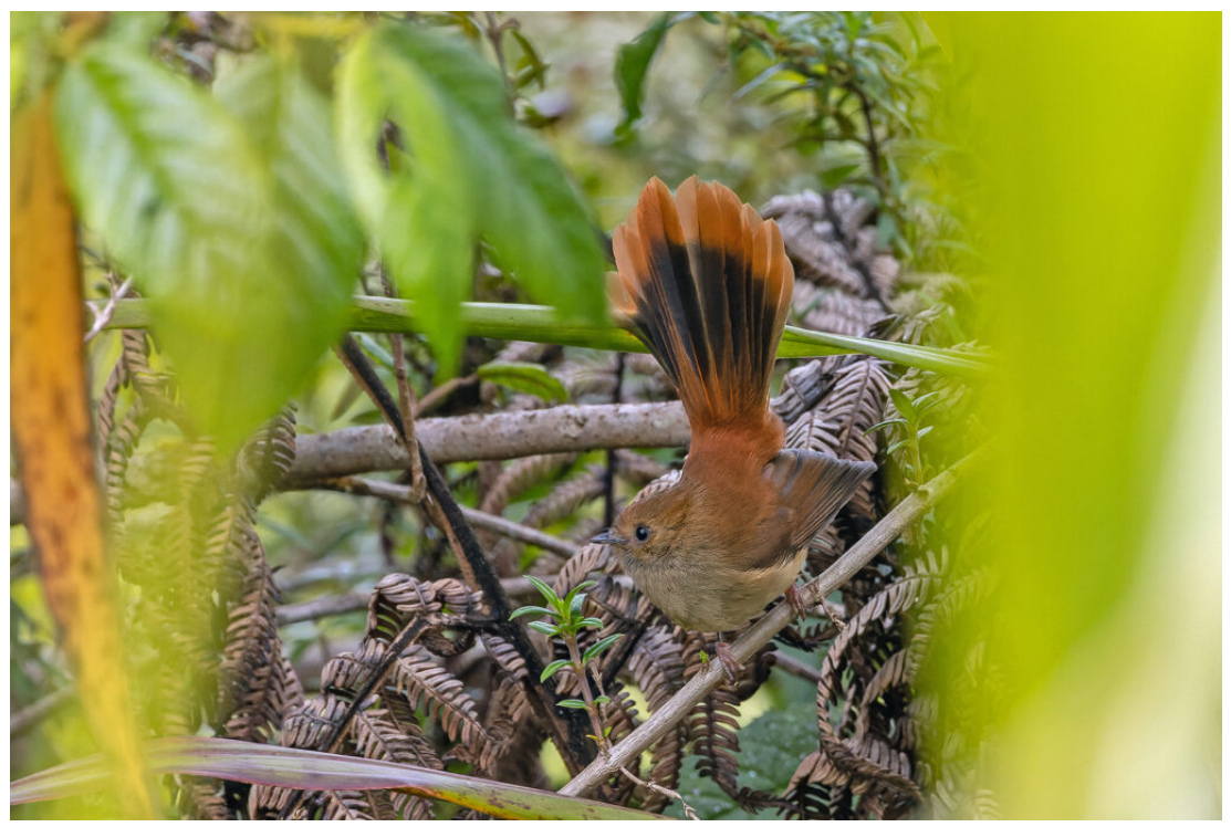
Dimorphic Fantail