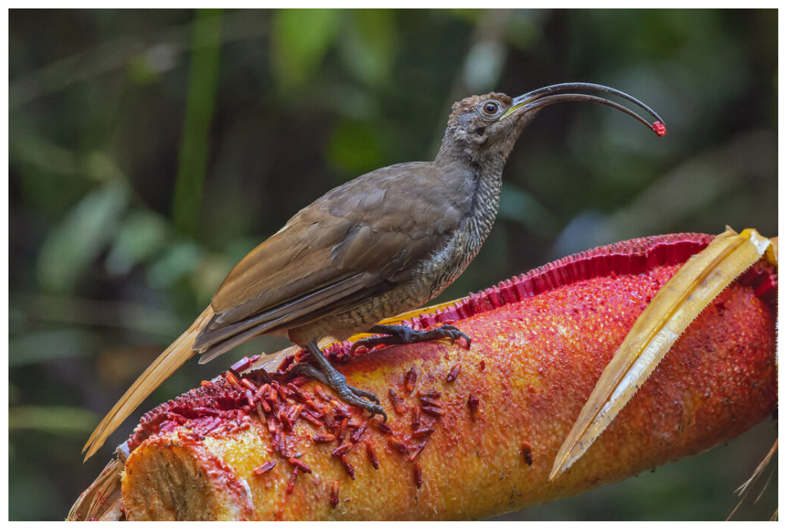
Black-billed Sicklebill