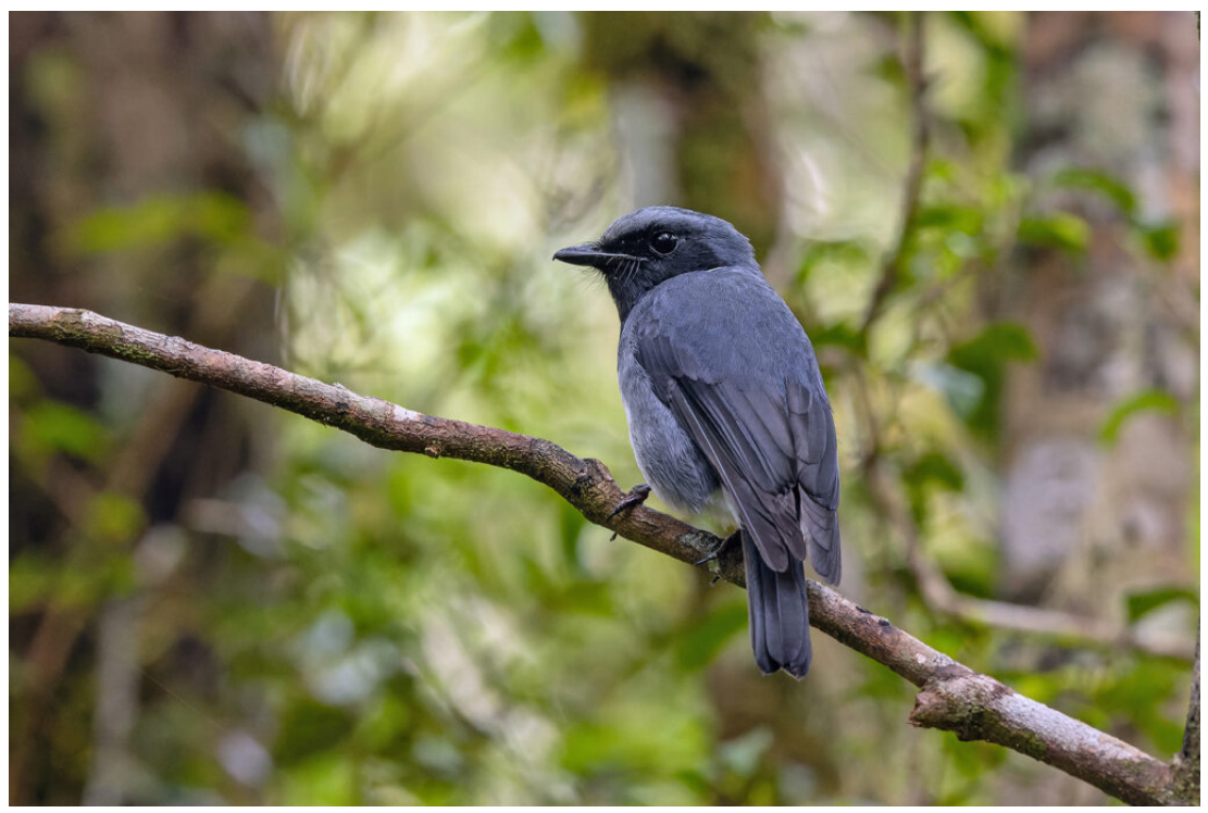
Black-throated Robin