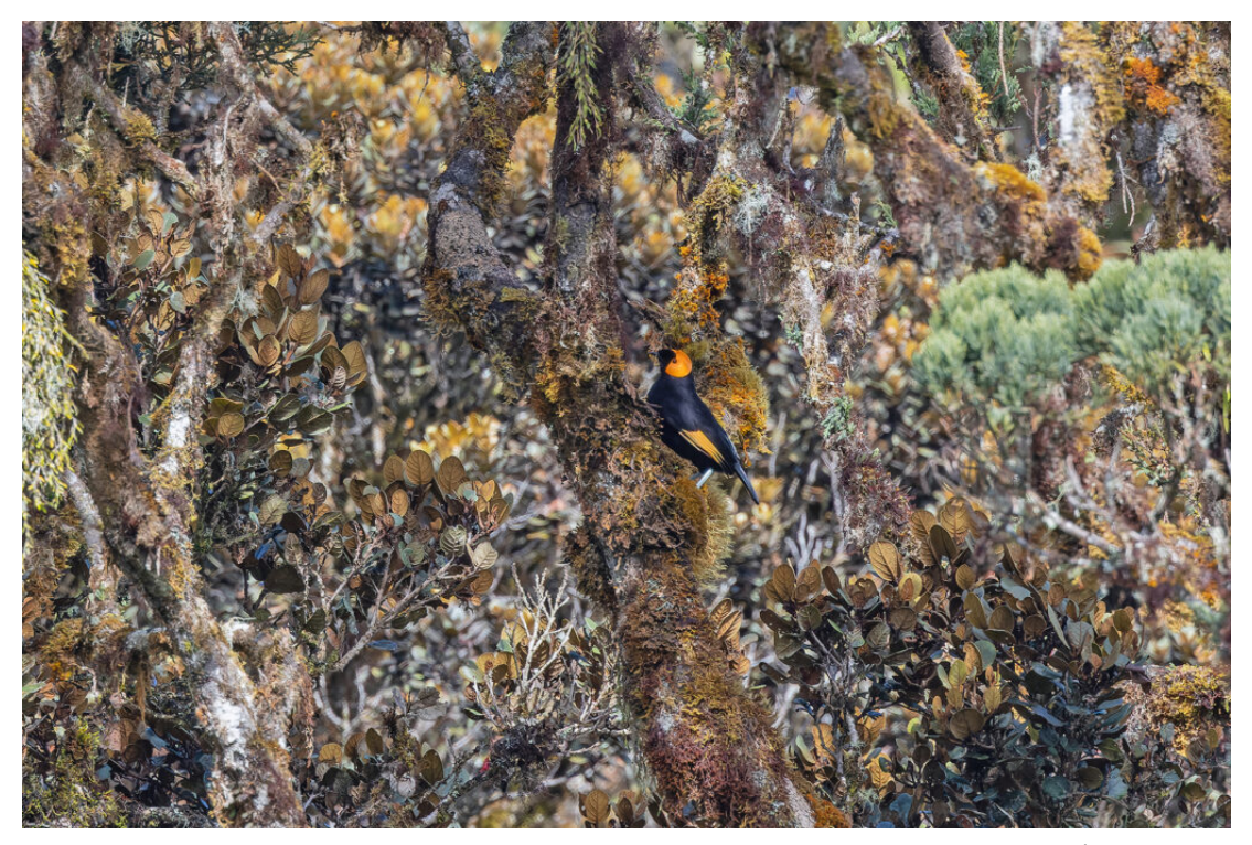
MacGregor's Honeyeater