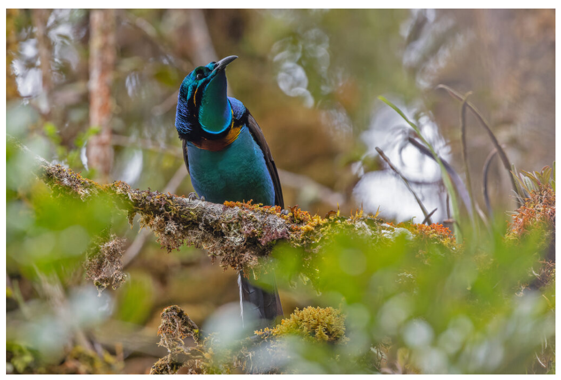
Splendid Astrapia