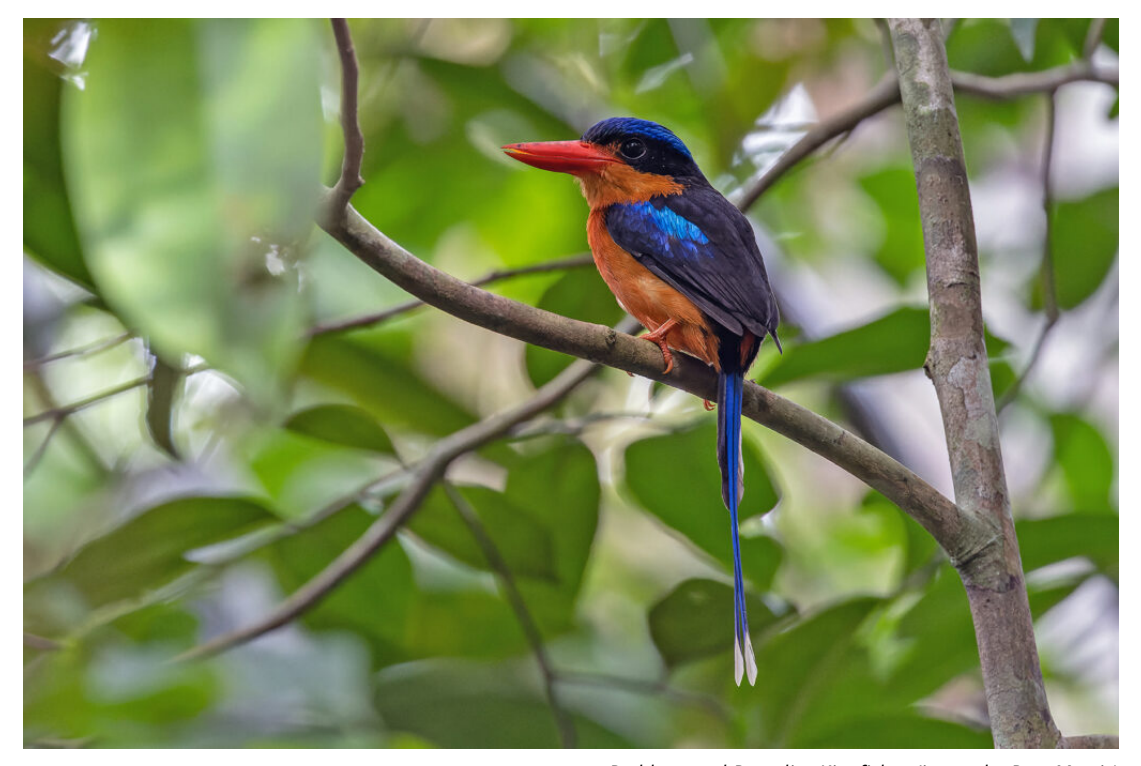
Red-breasted Paradise Kingfisher