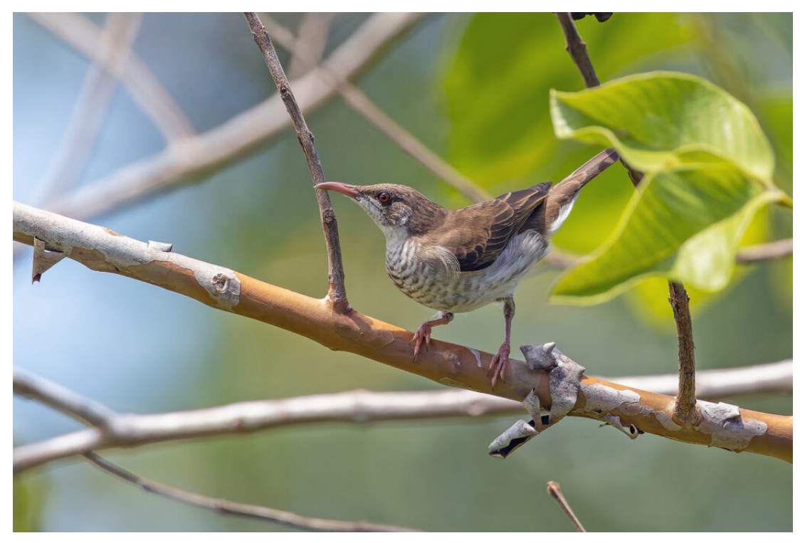
Brown-backed Honeyeater