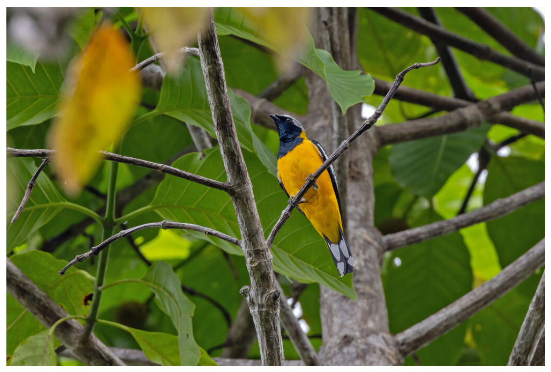
Golden Cuckooshrike