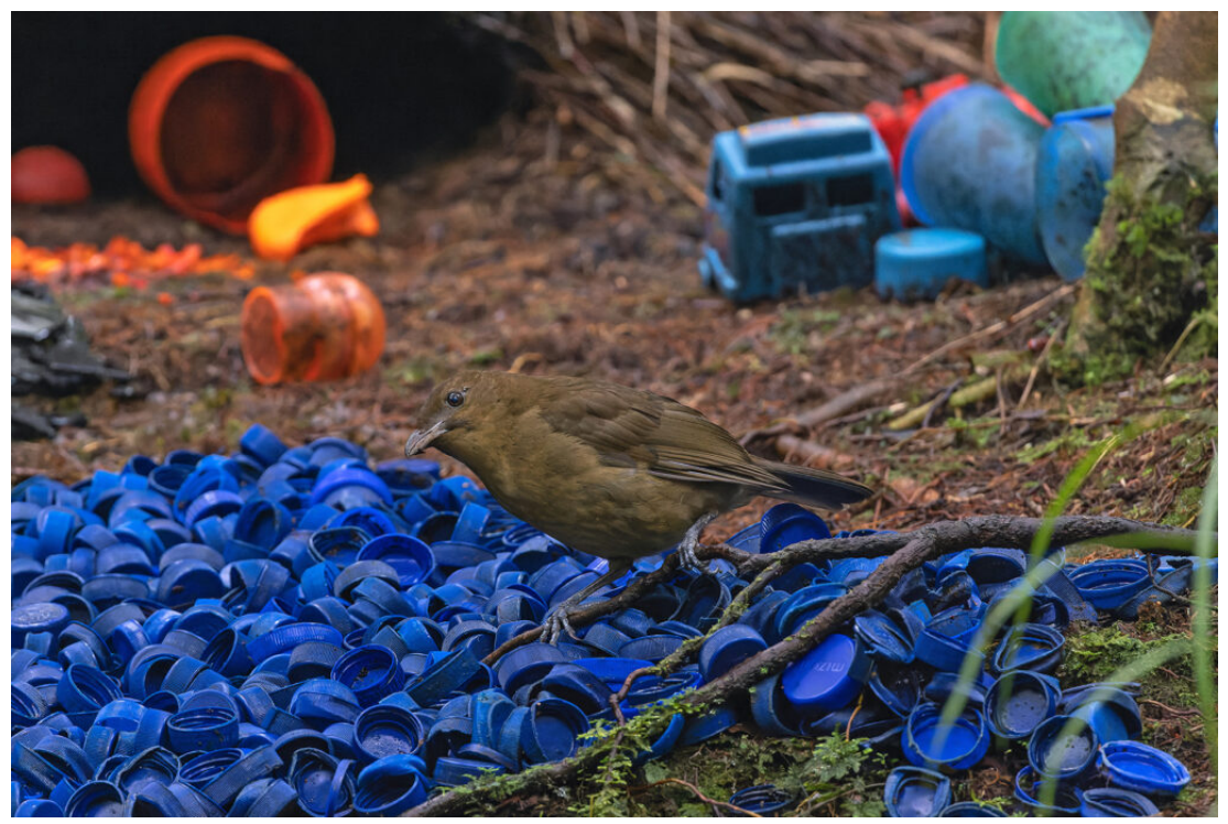
Vogelkop Bowerbird