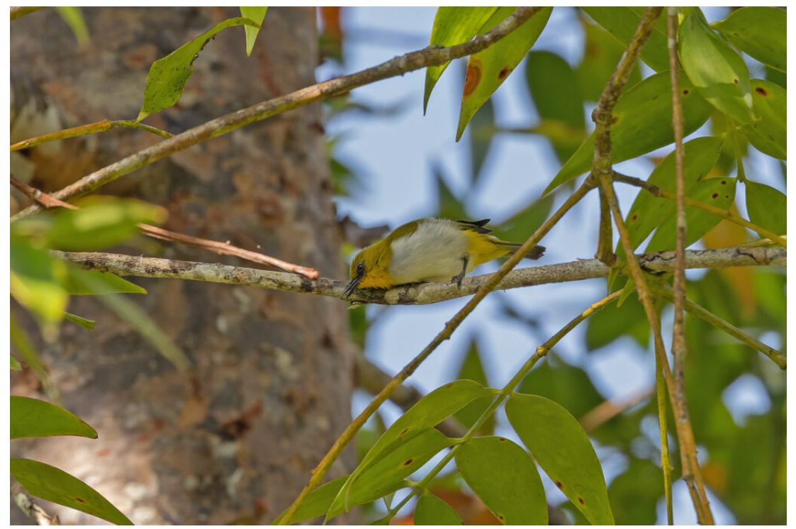
Green-fronted White-eye