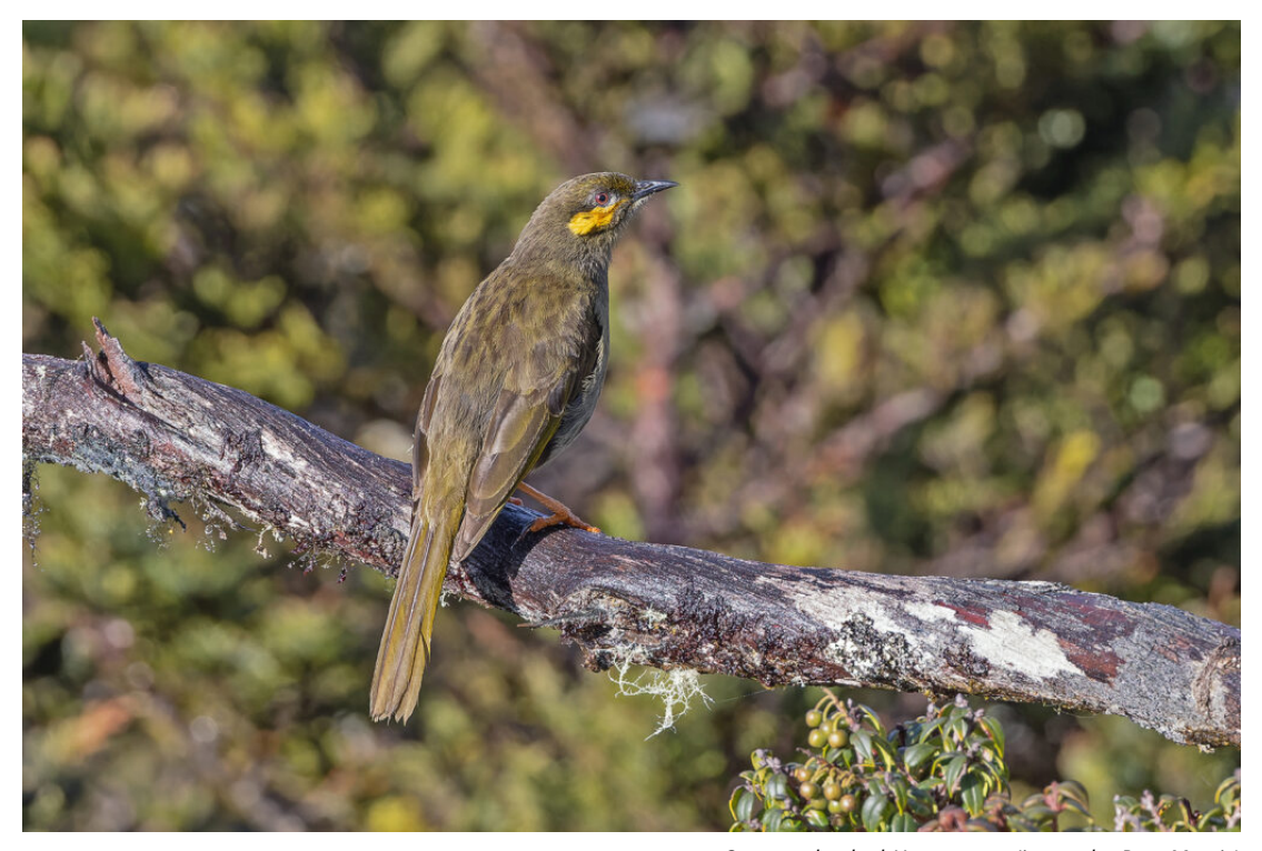
Orange-cheeked Honeyeater