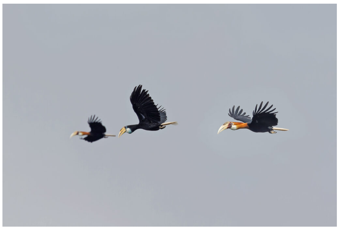
Blyth's Hornbill