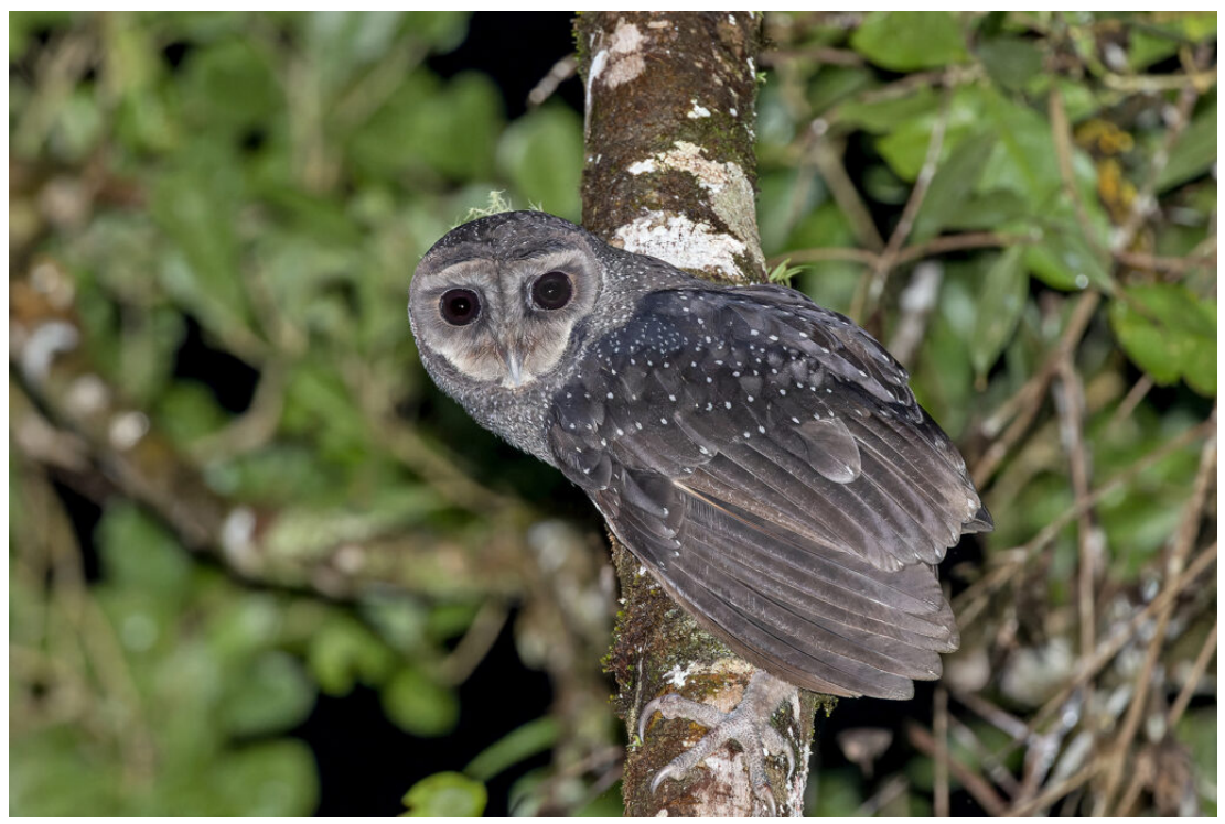
Greater Sooty Owl