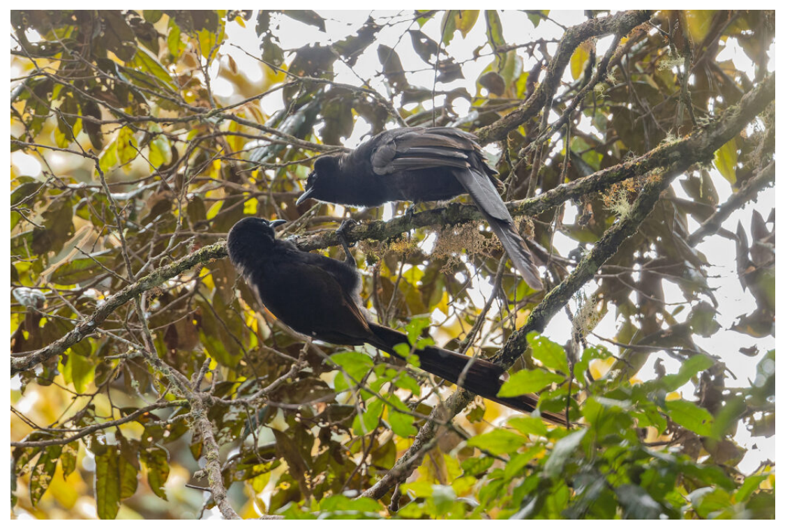
Arfak Astrapia