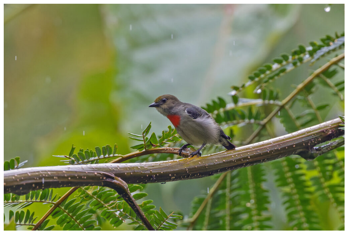
Olive-crowned Flowerpecker