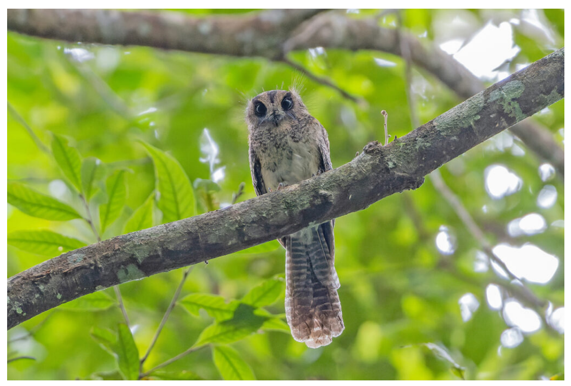
Vogelkop Owlet-nightjar