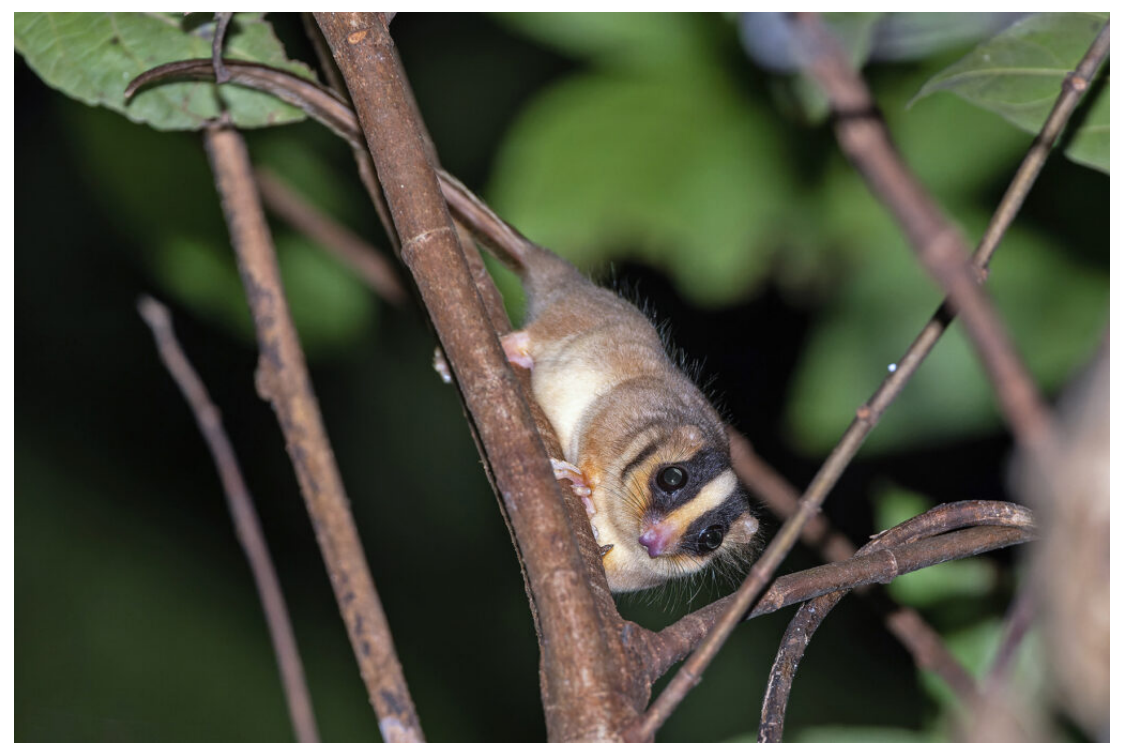
Feather-tailed Possum