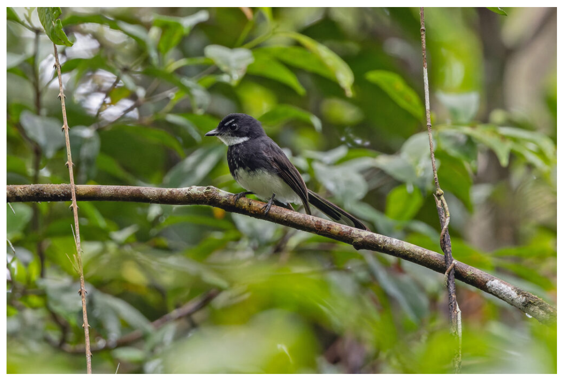
Biak Fantail