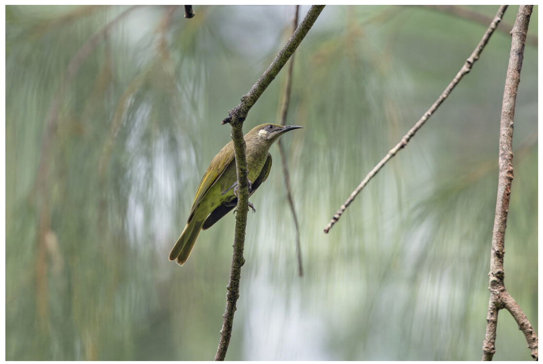
Olive Honeyeater