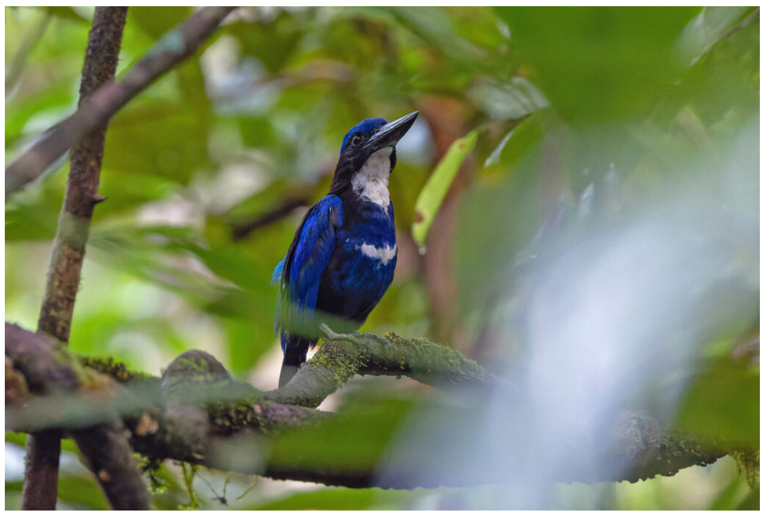
Blue-black Kingfisher