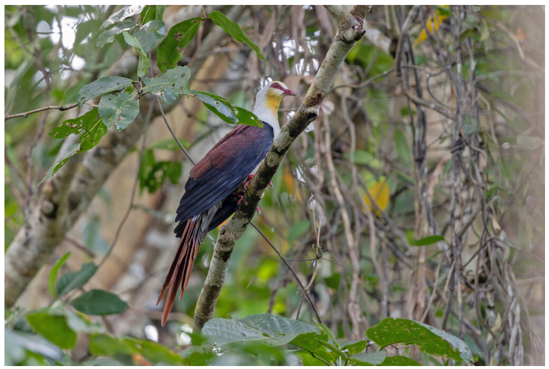
Great Cuckoo-Dove (image by Pete Morris)