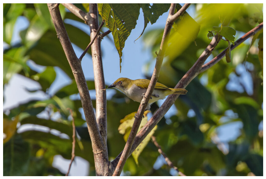
Biak White-eye