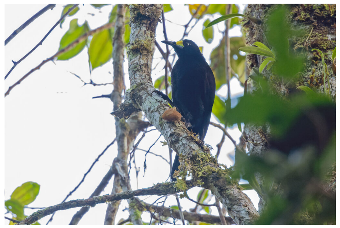
Long-tailed Paradigalla