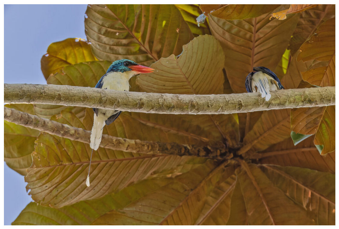
Biak Paradise Kingfisher