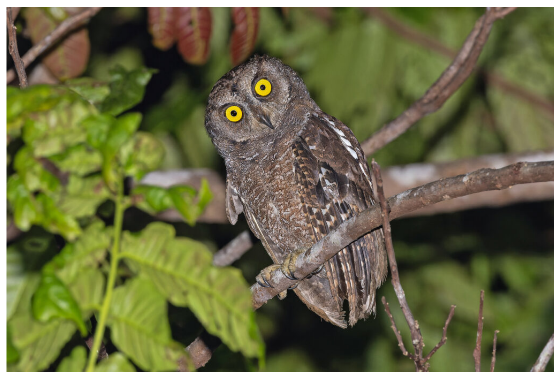
Biak Scops Owl (image by Pete Morris)