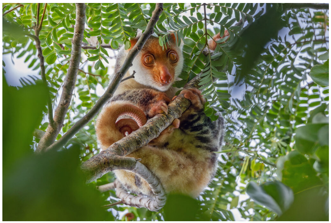
Waigeo Cuscus