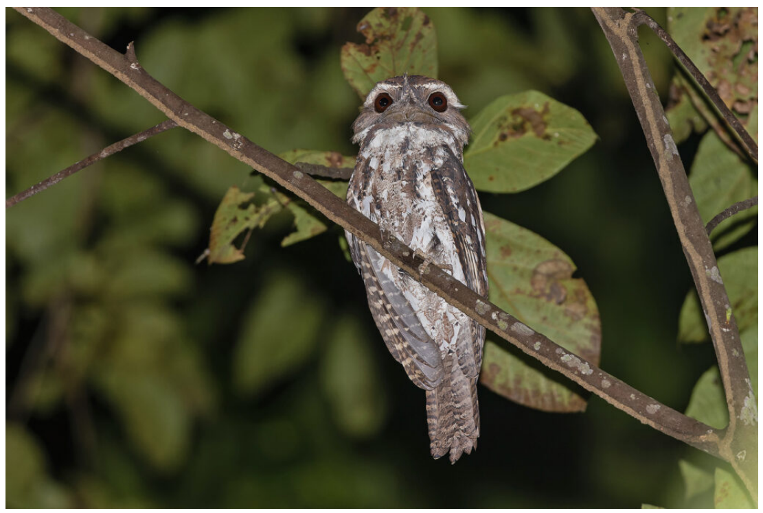
Marbled Frogmouth