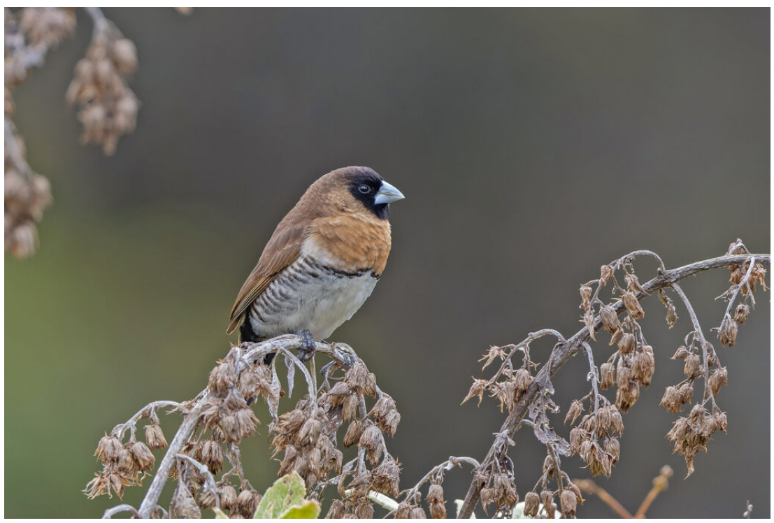
Western Alpine Mannikin