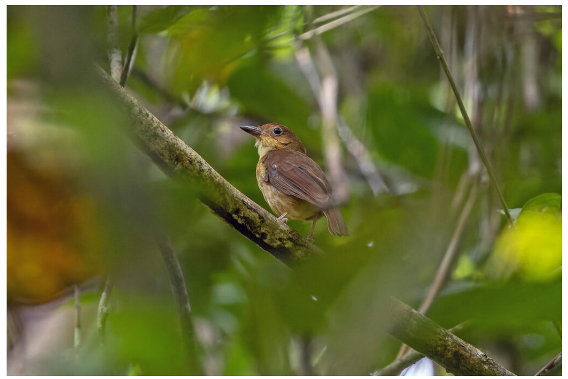
Biak Whistler