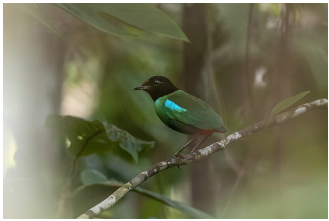
Hooded Pitta (Numfor)