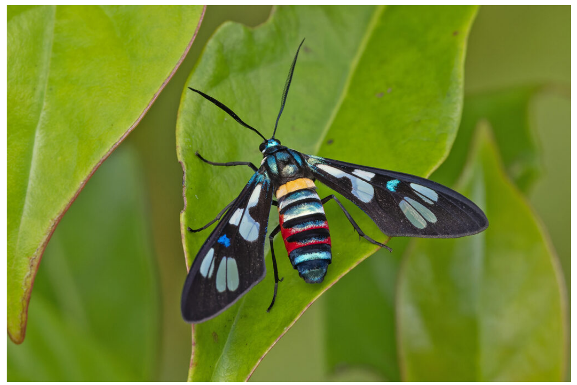
Biak Clearwing