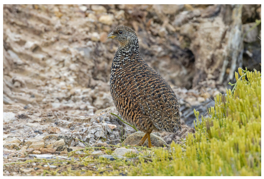
Snow Mountain Quail