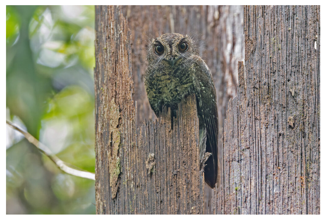
Wallace's Owlet-nightjar