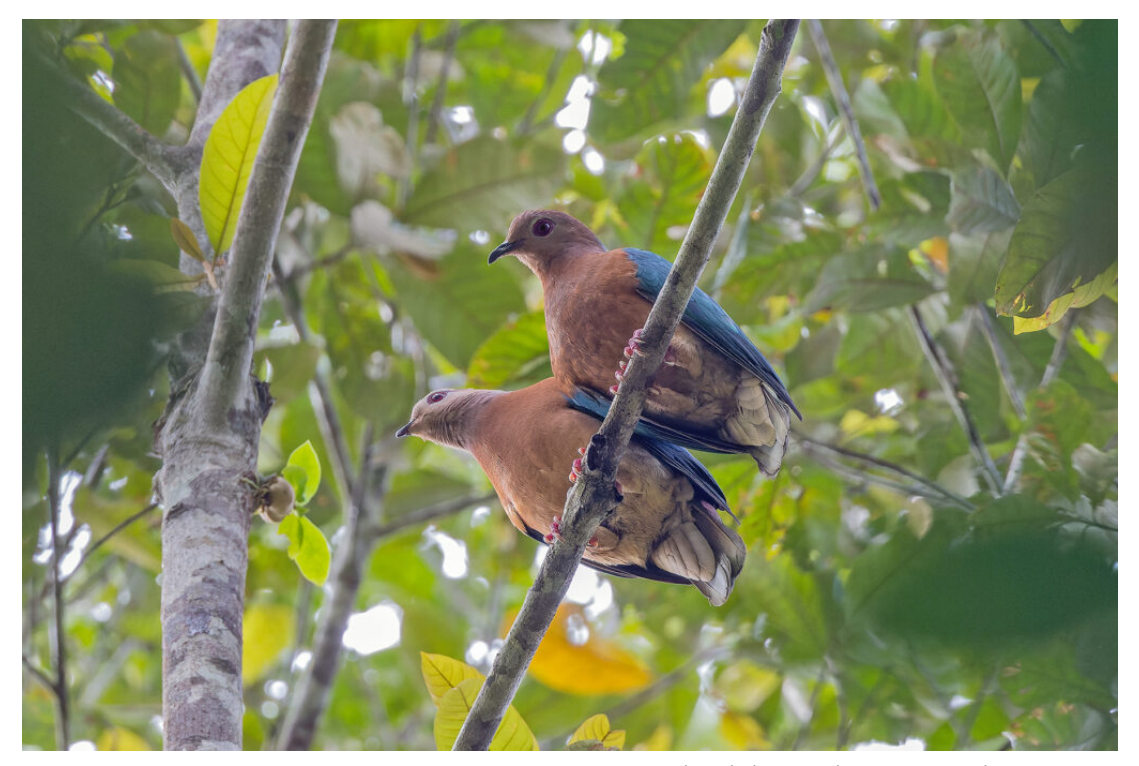
Purple-tailed Imperial Pigeon