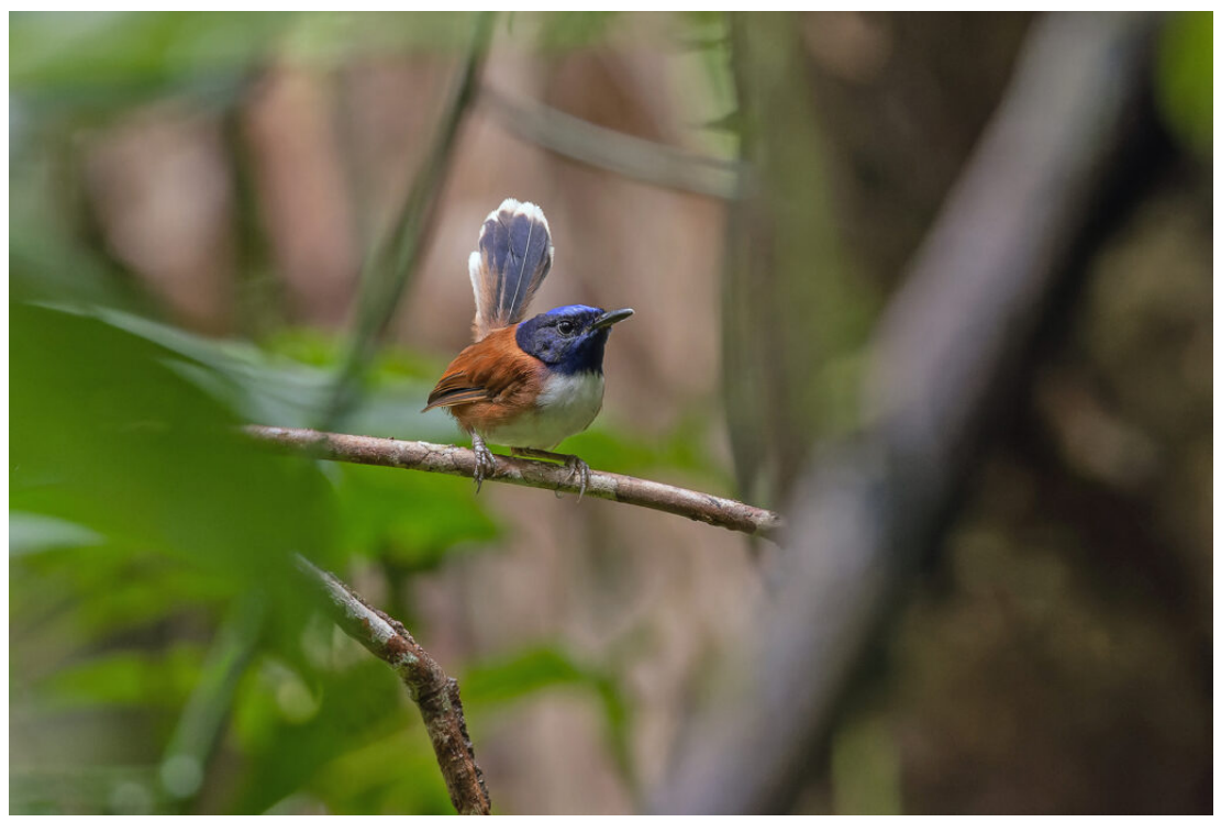
Emperor Fairywren