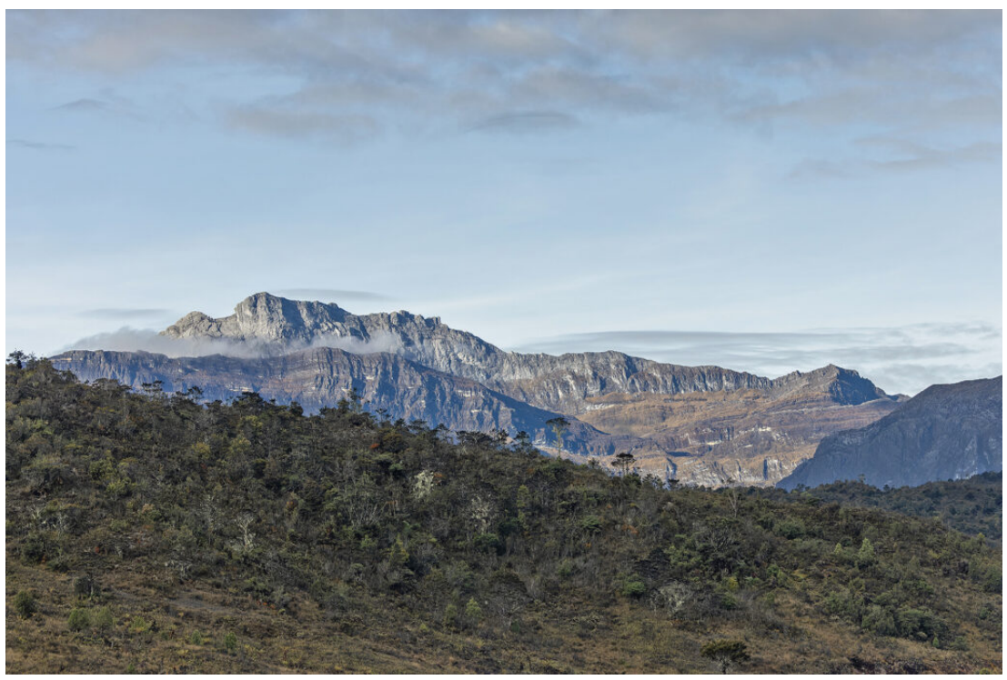
Snow Mountains