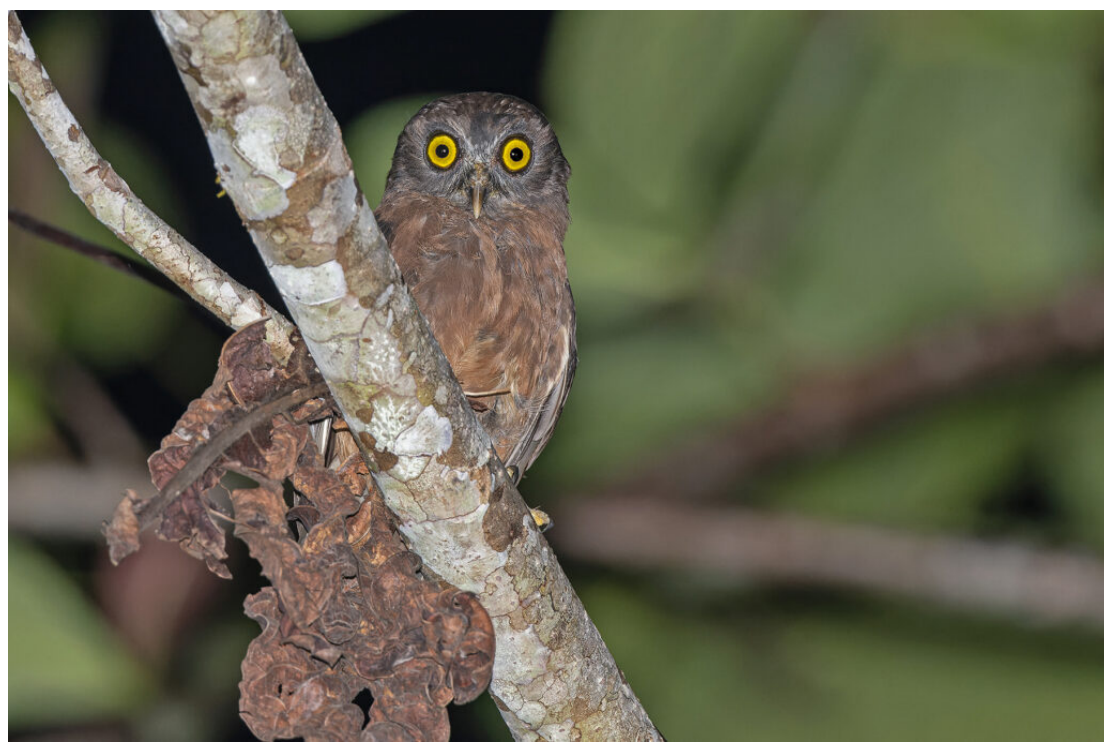
Papuan Boobook