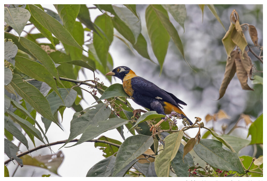
Golden Myna