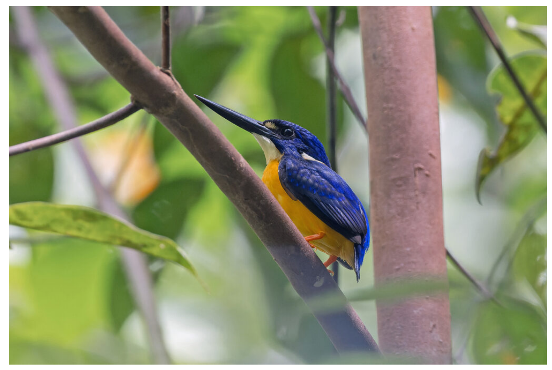
Papuan Dwarf Kingfisher