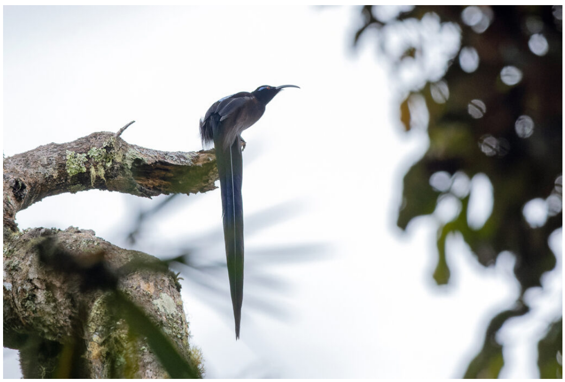
Black Sicklebill