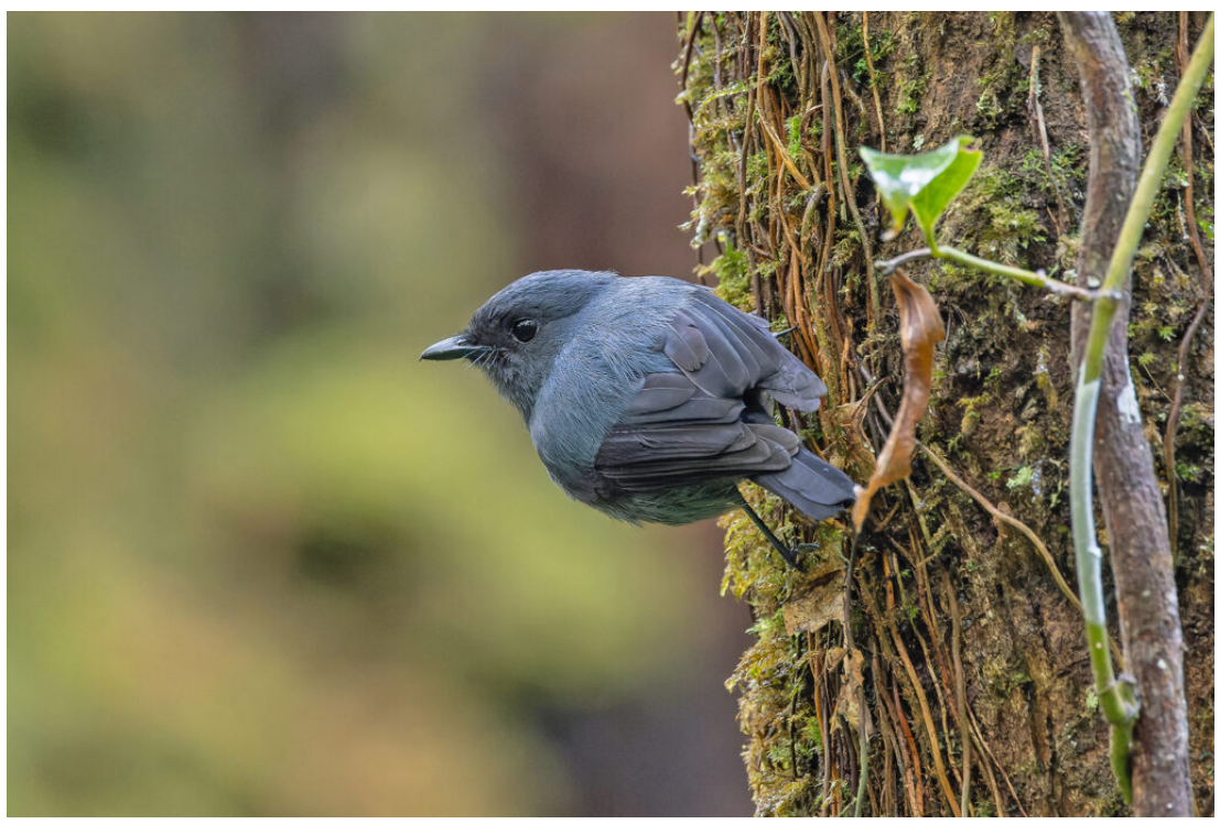
Ashy Robin