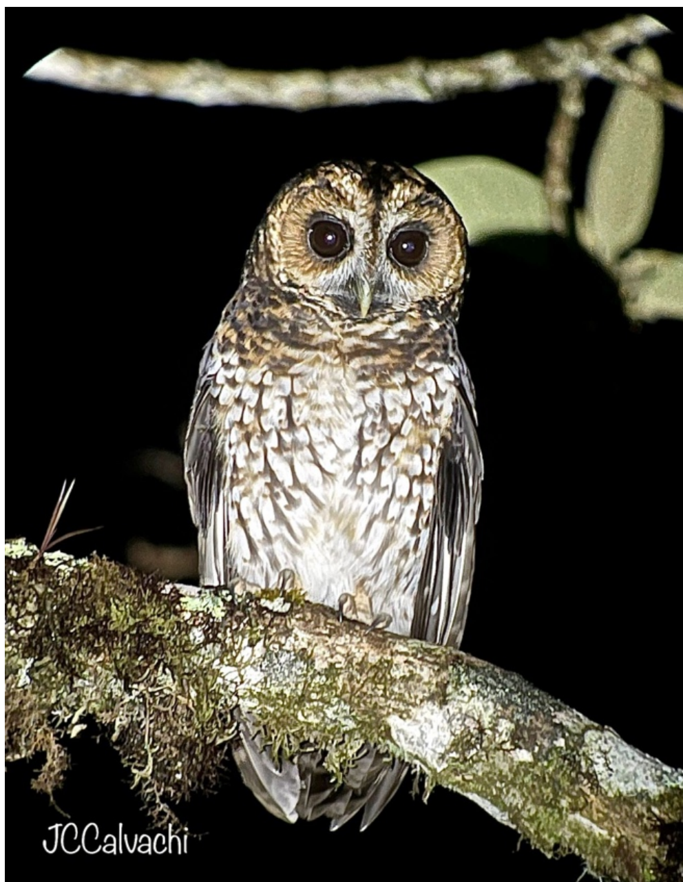
Rufous-banded Owl. (Juan Carlos Calvachi) |

Early next morning was spent around the very birdy lodge garden, where we saw Montane and Olive-backed Woodcreepers, Pale-edged Flycatcher, Glossy-black Thrush, Mountain Wren, Black-billed Peppershrike, Inca Jay, Subtropical Cacique, Black-crested Warbler, Ashy-headed Tyrannulet and Marble-faced Bristle-Tyrant. This was followed by a short visit to the antpitta feeding station where 2 White-bellied Antpittas came out very nicely in the open which was the Antpitta specie number 10. Our breakfast was eaten while watching the hummingbird feeders where Collared and Bronzy Incas, Chestnut-breasted Coronets, Fawn-breasted Brilliants and Long-tailed Sylph were zipping around. We birded in the surroundings, Streak-headed Antbird, Rufous-crowned Tody-Flycatcher and Black-eared Hemispingus in the thick bamboo undergrowth and a pair of White-throated Toucanet.