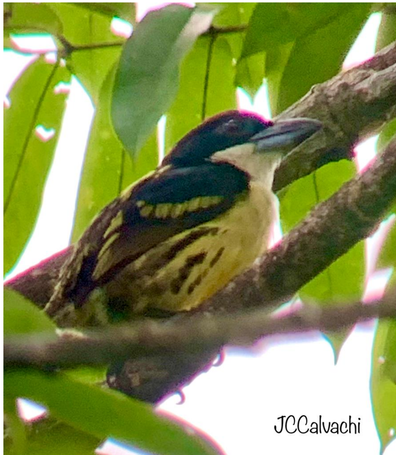
Five-coloured Barbet. (Juan Carlos Calvachi)