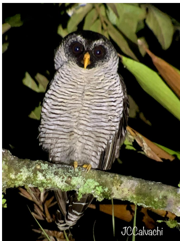
Plate-billed Mountain Toucan (left) and Black-and-white Owl (Juan Carlos Calvachi)