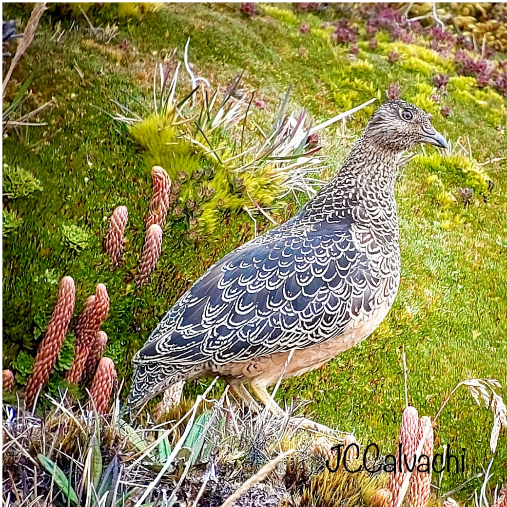
Rufous-bellied Seedsnipe.

contained several of the specialties for this site like the striking Masked-Mountain Tanager, few Black-backed Bush-Tanagers, Pearled treerunners, Andean Tit-Spinetail, Tawny Antpitta which was the specie number 11, Brown-backed Chat-Tyrant amongst others previously seen. In the upper part we saw a pair of gorgeous Rufous-bellied Seedsnipe, Carunculated Caracaras, Variable Hawks, the handsome Red-rumped Bush-Tyrant and White-chinned Thistletail.