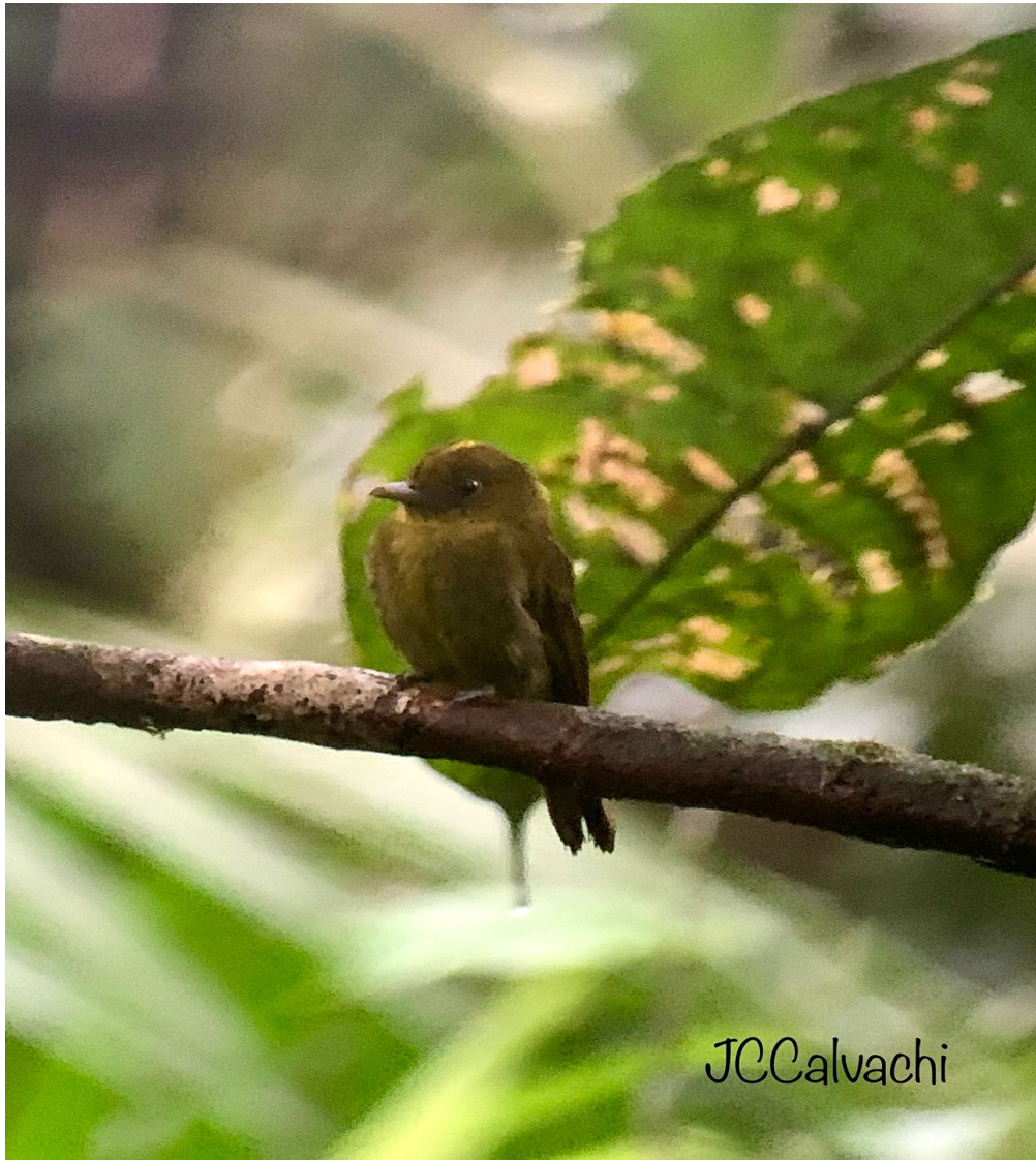
Sapayoa.

After breakfast on our third day, we had to leave very early and take the canoe back to Selva Alegre. The boat journey was uneventful but we had Fasciated Tiger Heron. Our next stop was at the rather degraded Humedal de Yalaré forest where we quickly found Black-breasted and Pied Puffbirds, a pair of Slaty-tailed Trogons, a female Scarlet-thighed Tanager, a pair of Red-lored Amazons and an incredible sighting was a singing Rufous Mourner right at the edge of the main highway which was my highlight after many years since I saw it the last time. This was followed for the rest of the morning and afternoon was spent near Lita along the trail of the La Union road- Alto Tambo area. This track is going through foothill forest and holds a few very rare and localised birds. Weather was good and we had a few hours of birding with a great selection of amazing Choco birds like a male Cinammon Woodpecker and the scarce Golden-chested Tanager, Long-tailed Tyrant, White-rumped Hawk, a pair of Chestnut-fronted Macaws Tawny-crested, Emerald and Golden-hooded Tanagers increased our Tanagers list and a Golden-winged Manakin female, Choco Tyrannulets, Slate-colored Grosbeaks Cinnamon Becard were also seen very well. Then Yellow-collared Chlorophonias, Purple Quail-Dove and Choco Tapaculo were only heard, then we continue towards our luxury hotel the Hacienda Primavera that everyone loved it after 3 nights at the basic Playa de Oro lodge.