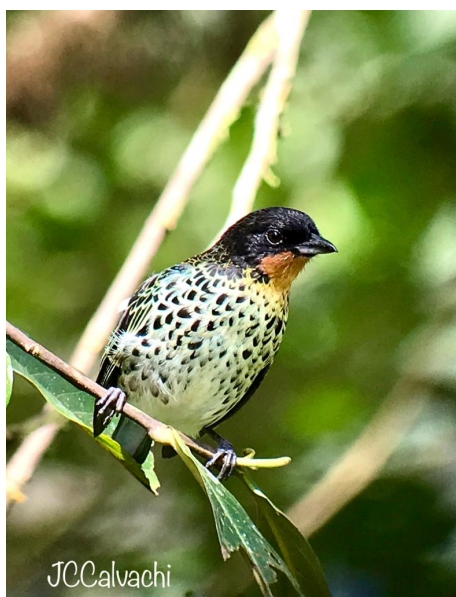
Purplish-mantled Tanager (left) and Rufous-throated Tanager. (Juan Carlos Calvachi)

It was time to visit the eastern slope of the Andes but this morning first we had to climb over the Papallacta Pass. We dressed as warmly as we could to face the cold of this high altitude Andean habitat, unfortunately the weather was very misty, cold and rainy so we still tried to bird under these bad conditions and being able to get good views of Glossy Flowerpiercer and Viridian Metaltail, then we continued towards our destination stopping along the road between Papallacta and Baeza finally away from the rain where we found Pale-edge and Cinammon Flycatchers, Montane Woodcreeper, Long-tailed Sylph, Rufous-breasted Chat-Tyrant and White-capped Dippers, then we continued our journey towards Baeza where we stopped for lunch, then we continued our drive towards Sumaco lodge but with 1 stop along the Loreto road finding several new birds with great looks of the regular resident Cliff Flycatcher, the uncommon Rufous-tailed Tyrant, the very local Yellow-throated Tanager, Green-back Hillstar and Olivaceous Siskin then we arrived in the late afternoon to the fantastic Sumaco lodge our home for the next 4 nights.