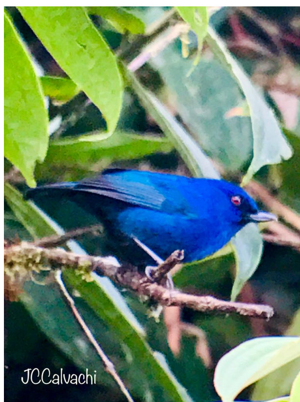
Orange-breasted Fruiteater (left) & Indigo Flowerpiercer (right).