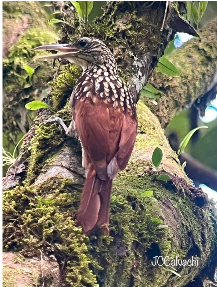
Black-striped Woodcreeper. (Juan Carlos Calvachi)