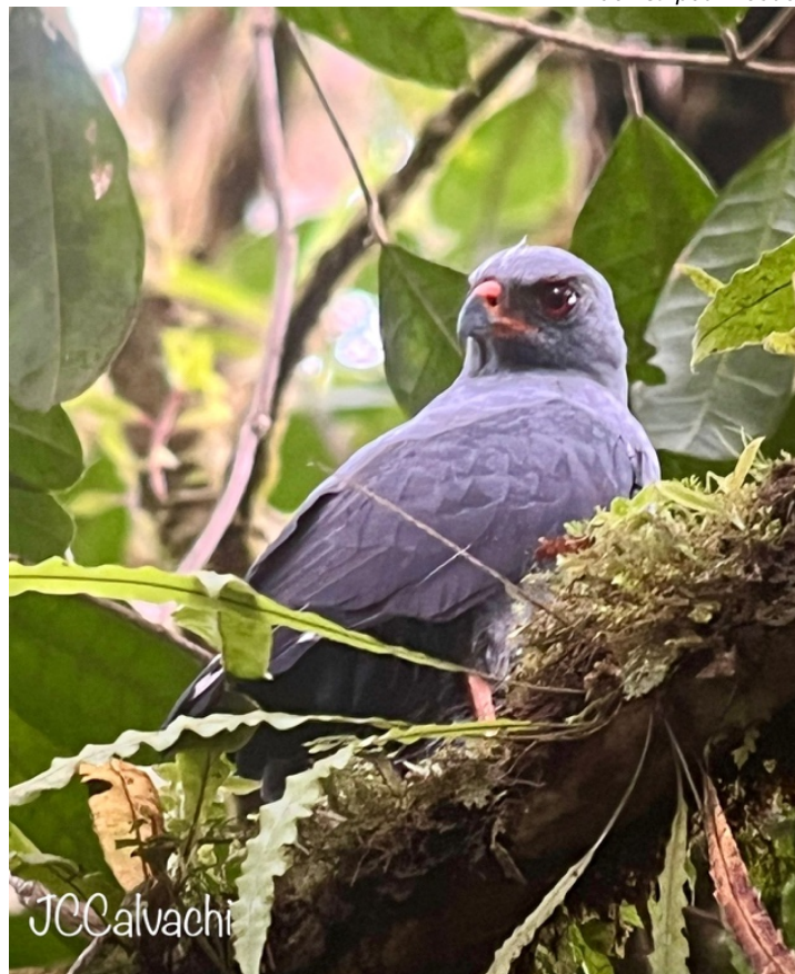
Plumbeous Hawk.)