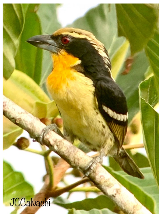
Wire-crested Thorntail (left) and Golden Barbet (right).