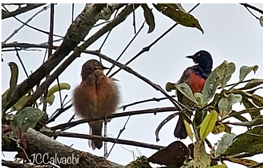
Scarlet-breasted Dagnis (Juan Carlos Calvachi)

It was time to leave Mindo area behind and next day we drove to the Suamox private reserve where we could only hear the very shy Brown Wood-Rail which some times visit a compost site. Other new birds included White-tailed Trogon, Rufous-tailed Jacama, the tiny Black-capped Pygmy Tyrant, Dusky-faced Tanagers, Green Kingfisher, Black-crowned Antshrike, Brown-capped Tyrannulet and Choco Toucan, amongst others. Back in the main house before we embarked on the long drive to Selva Alegre we had at the feeders a couple of males of Orange-crowned Euphonias. We had a quick lunch stop on the coast near Esmeraldas adding a few new birds such as Magnificent Frigatebird, Black several Yellow-crowned Night-Herons, and few Brown Pelicans. We arrived to Selva Alegre just an hour before dark so we immediately got into the boat and started cruising towards Playa de Oro. We had a few Neotropic Cormorants, a single Coccoi Heron and Fasciated Tiger Herons. It was already late afternoon by the time we arrived to the basic lodge. So, we made it to the prime lowland Choco site in Ecuador.