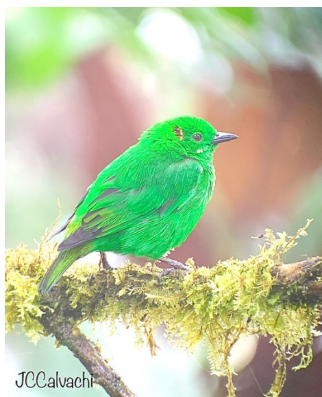
Moss-backed Tanager (left) & Glistening-green Tanager.