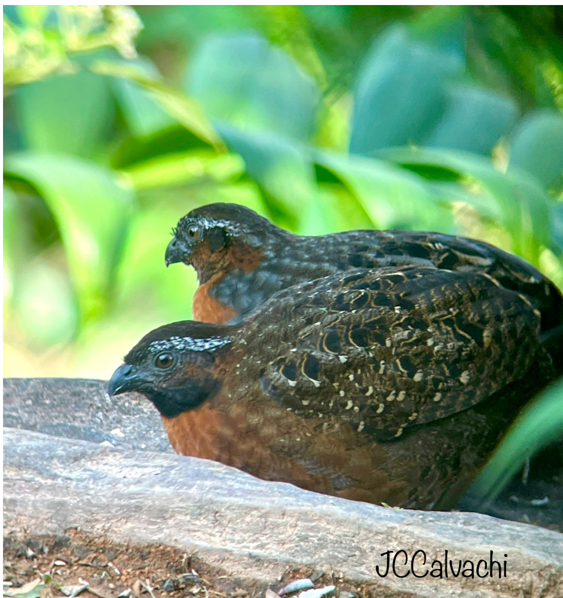
Rufous-breasted Wood Quail.

Early the next morning we drove and went hiking the famous Guacamayos ridge trail with several birds restricted to this area and elevation we spent 6 hours on this trail that produced Slate-crowned and Peruvian Antpittas, Dusky Piha, Grass-green Tanager, Yellow-vented Woodpecker, a single noisy White-capped Tanager responded immediately to my play back, a young Sickle-winged Guan, Black-capped Hemispingus, a very cooperative Chesnut-bellied Thrush showed up few times along the trail, Handsome Flycatcher, a pair of impressive Powerful Woodpeckers and a noisy flock of Northern Mountain Caciques. After lunch we birded the surrounding areas where we found Sulphur-bellied Tyrannulet, Bluish Flowerpiercer were new for the list and stayed until dusk where several calling Rufous-banded Owl were around, then one of them finally came in the open near a light to collect the moths certainly a great end for the day.