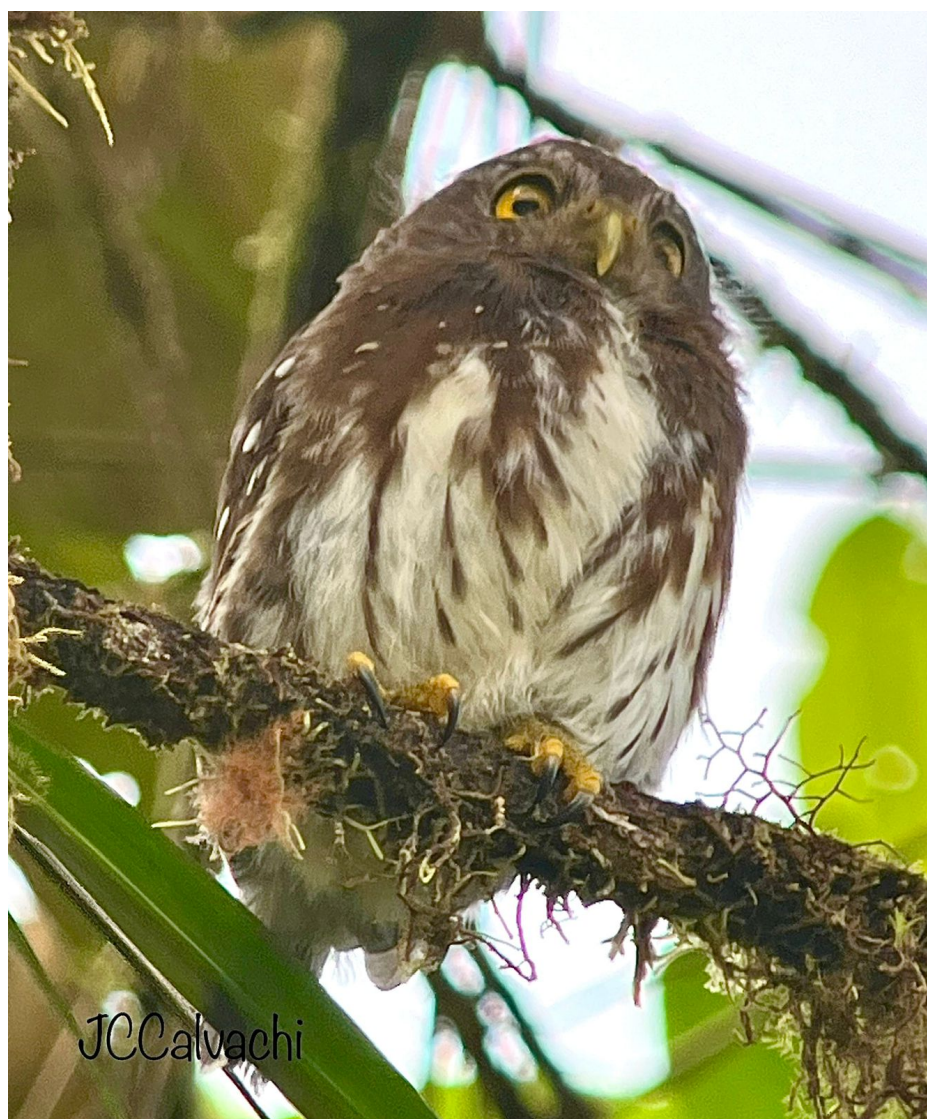
Cloud Forest Pygmy Owl (Juan Carlos Calvachi)

Following this success, we spent the rest of the morning birding some nearby areas. Highlights included, Plushcap, Capped Conebill, Streaked Tuftedcheek, Spillman's Tapaculo seen well, Green-and-black Fruiteater, a cracking Ocellated Tapaculo came out in the open, Dusky Bush-Tanager, Grass-green Tanager and Three-striped Warblers. We spent a long time looking for the very uncommon Beautiful Jay at various locations but we didn't have a sniff. After lunch at Septimo Paraiso lodge we walked one of its trails where we had great views of Cloud-forest Pygmy-Owl being mobbed by Brown-capped Vireo, Beryl-spangled, Flame-faced and Golden-naped Tanagers and several hummingbirds that helped us to locate this very efficient predator. Later we continued our journey to bird the surrounding areas of Mindo that produced other birds like White-throated Crake, Pacific Antwren, a pair of Olivaceous Piculets, Ecuadorian Thrush, a pair of nesting Pacific Parrotlets, Red-headed Barbet, then we drove and waited until dusk to see a fantastic flying Lyre tailed Nightjar male with an extremely long tale and in our way back to the lodge, we found a Black and White Owl just before the entrance lodge.