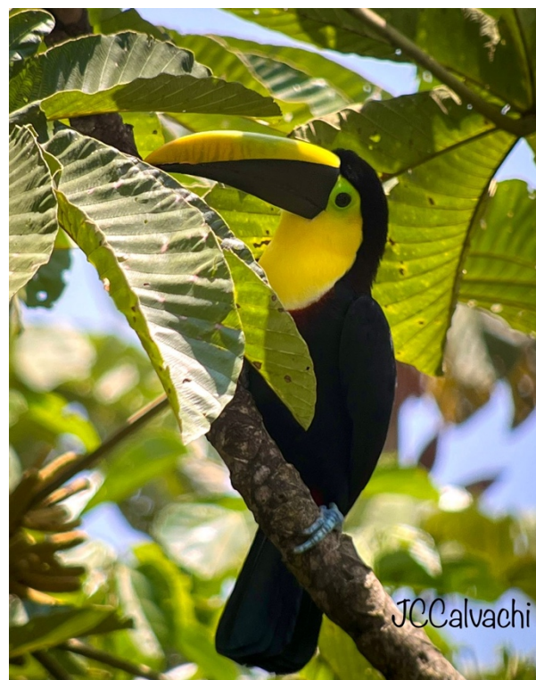
Black-streaked Puffbird (left) & Yellow-throated Toucan (right).