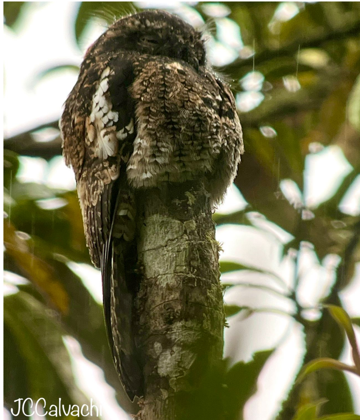
Our cover star is the Andean Potoo!