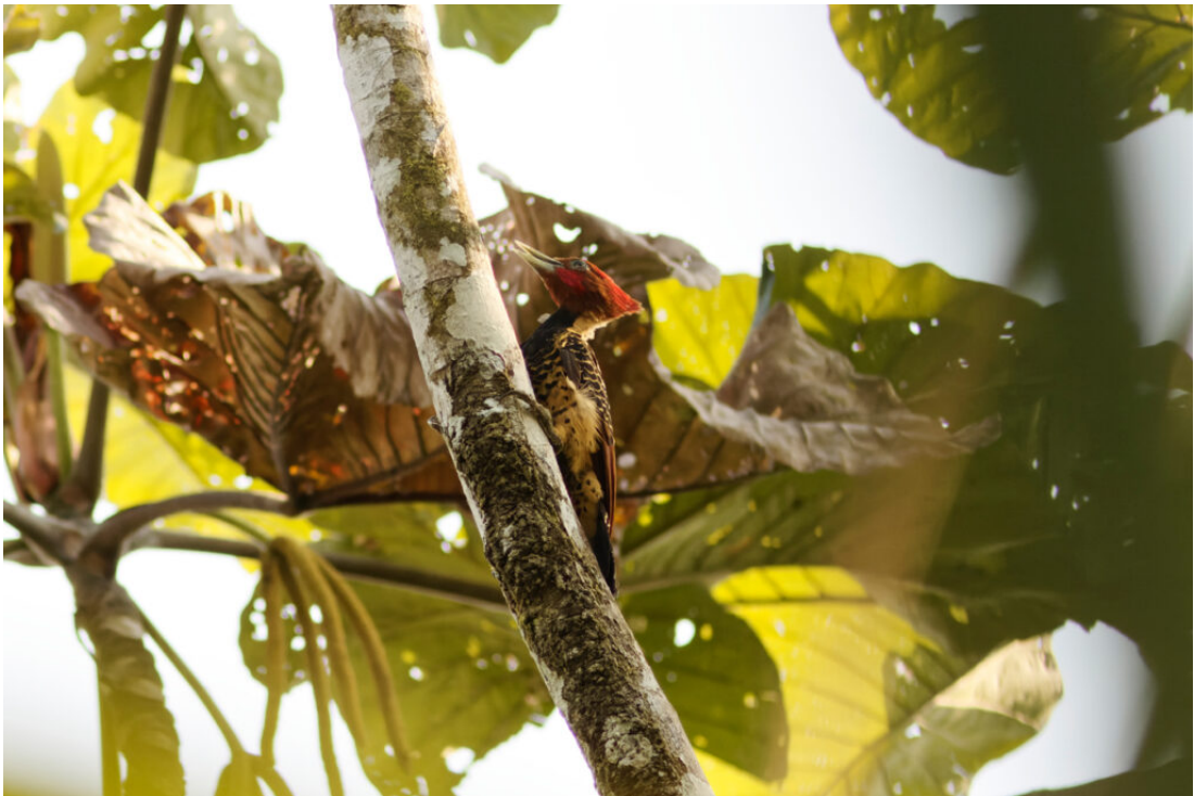
Rufous-headed Woodpecker