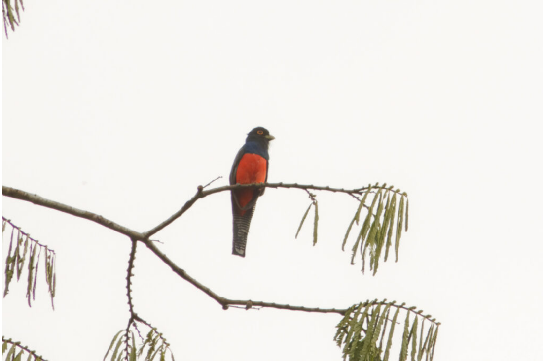
Blue-crowned Trogon