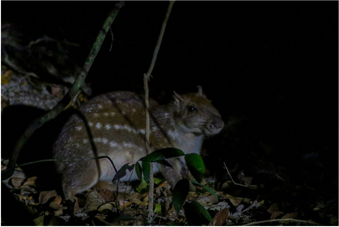
Paca