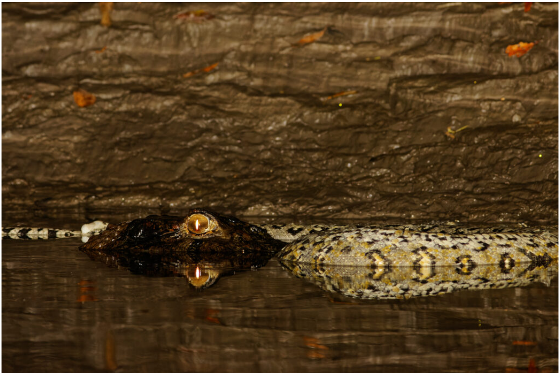
Black Caiman eating Green Anaconda