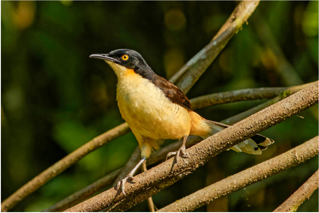
Black-capped Donacobius