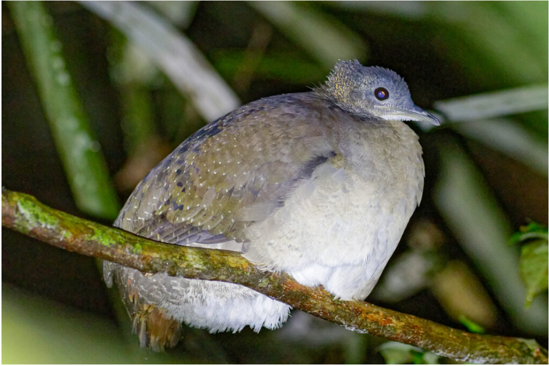
White-throated Tinamou