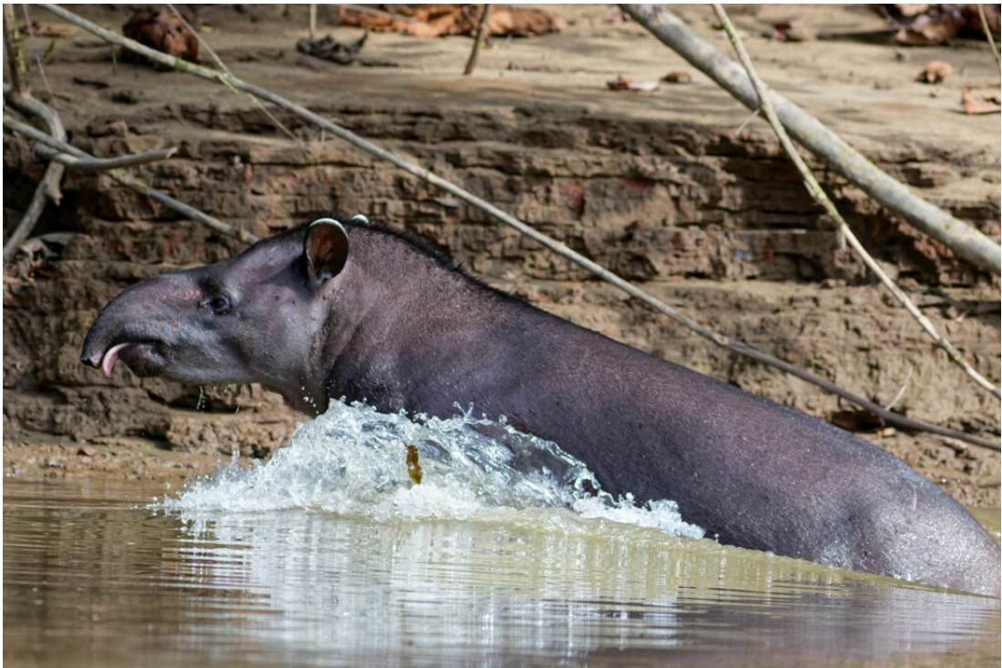
Lowland Tapir