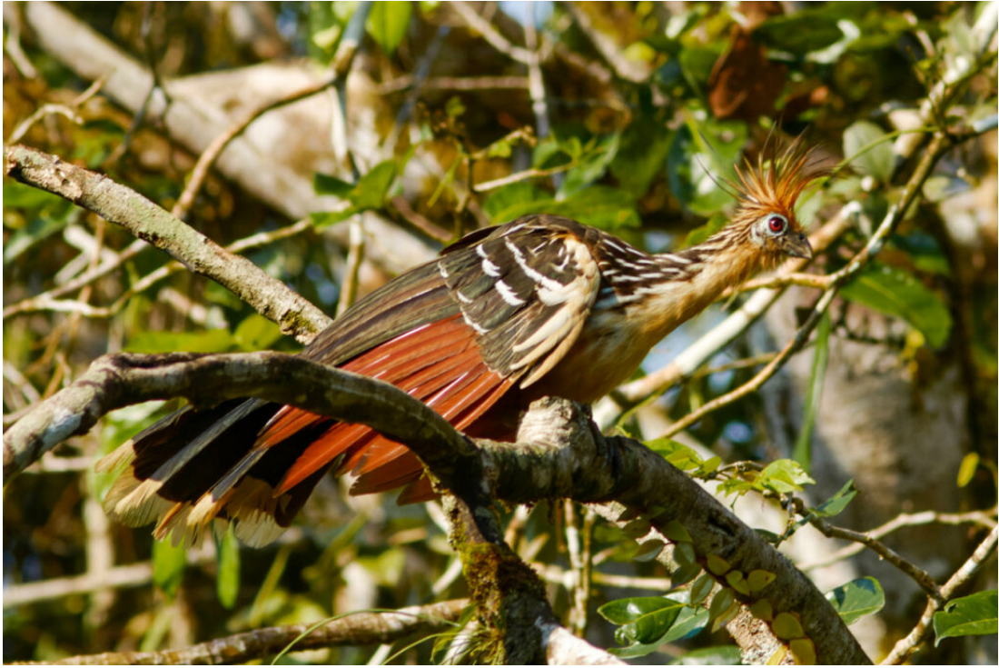
Hoatzin