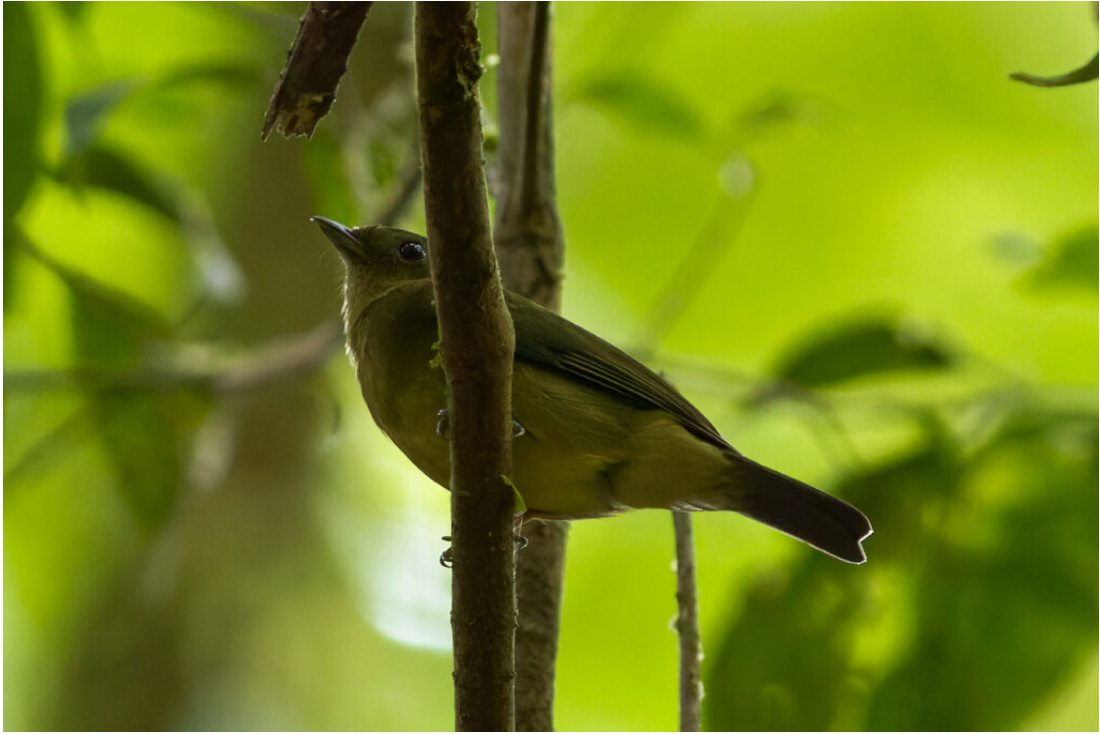
Green Manakin