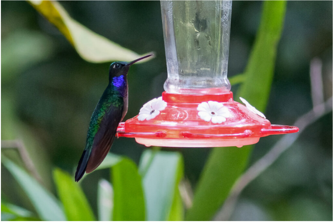
Napo Sabrewing