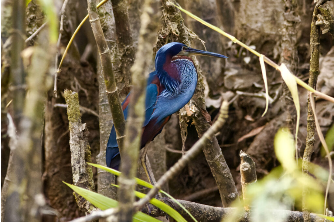
Agami Heron