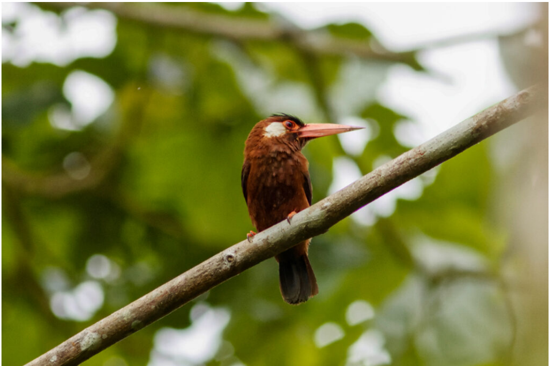
White-eared Jacamar