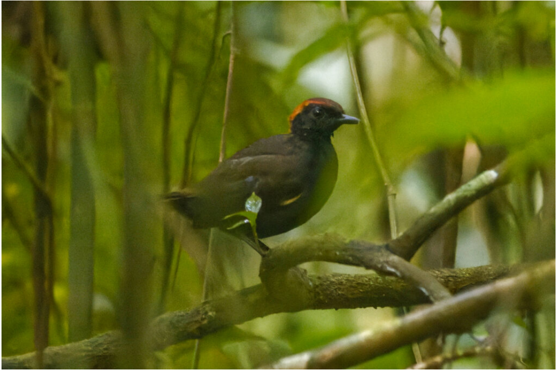
Rufous-capped Anthrush