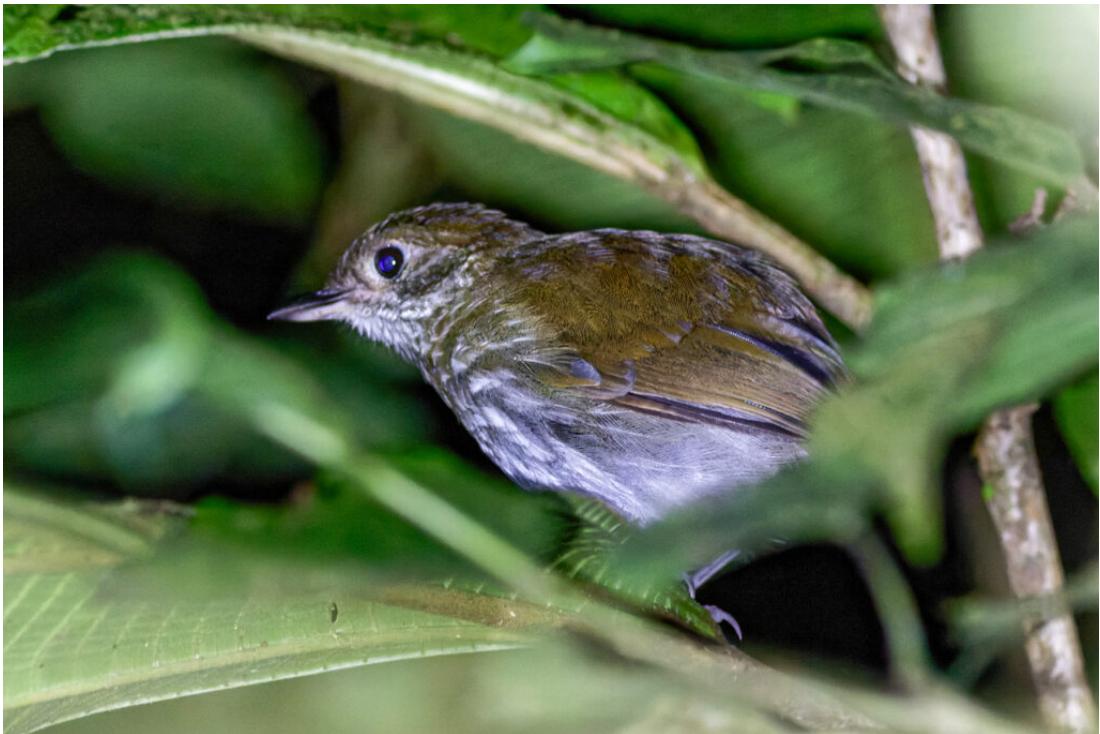
Thrush-like Antpitta