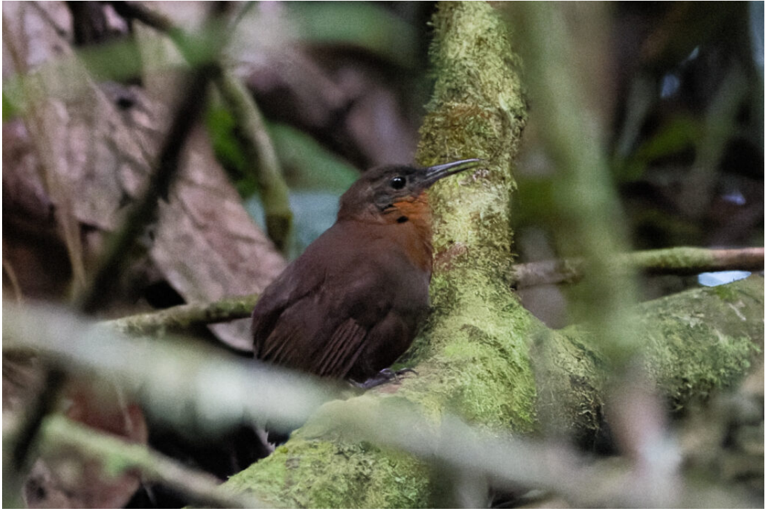
Dusky Leaf-tosser