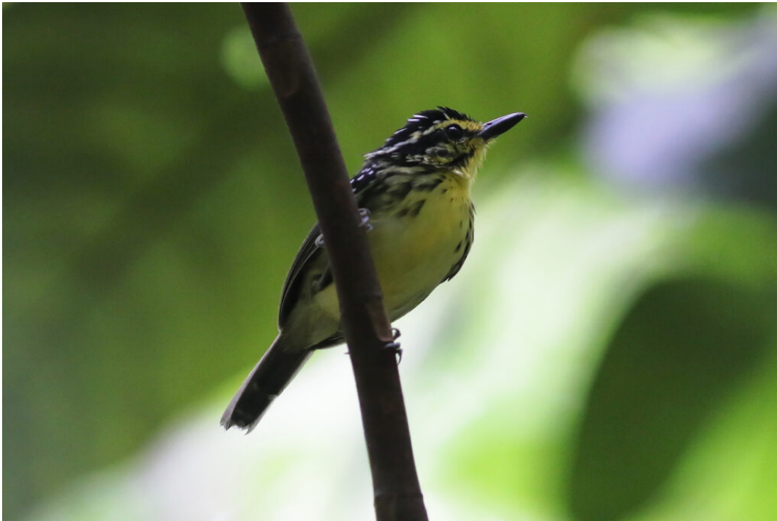
Yellow-browed Antbird

Arapaima Arapaima gigas Very impressive fish, seen at Sani Lagoon.