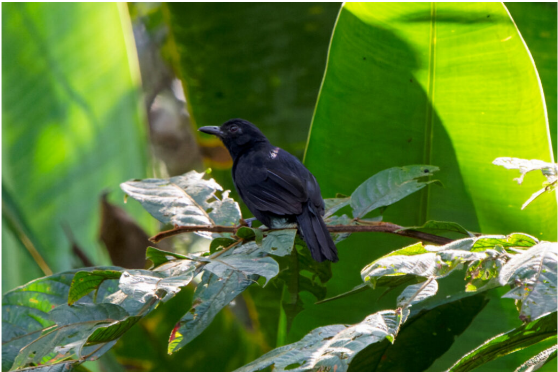
Cocha Antshrike