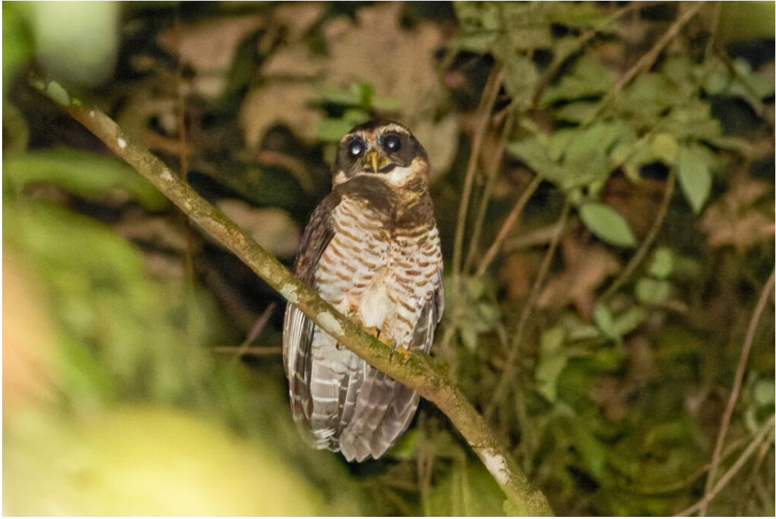
Band-bellied Owl