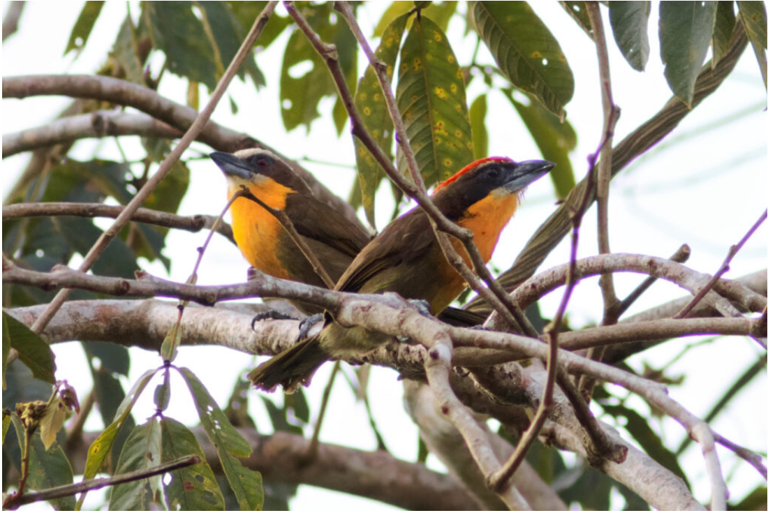
Scarlet-crowned Barbet