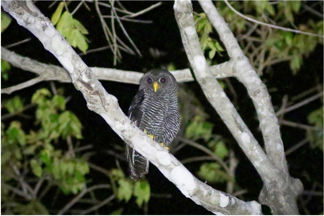
Black-banded Owl