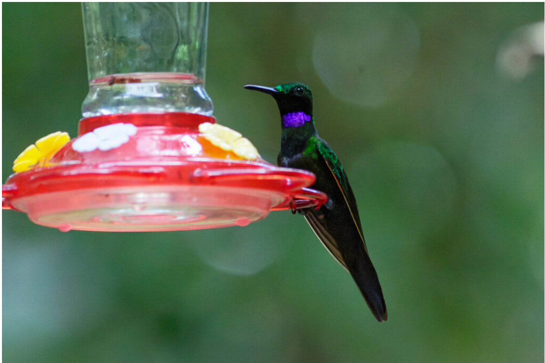
Black-throated Brilliant