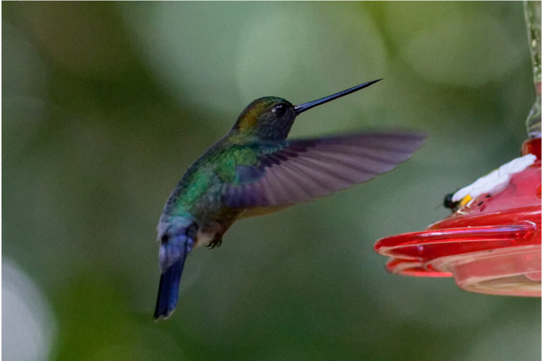
Blue-fronted Lancebill