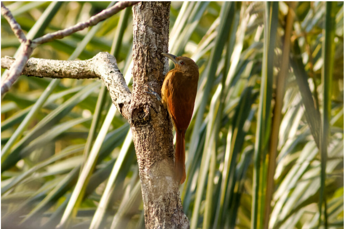
Cinnamon-throated Woodcreeper