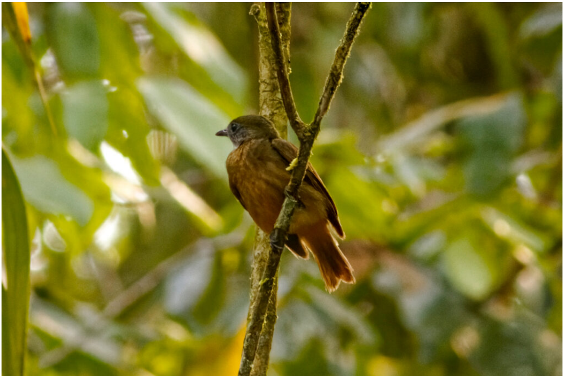
Orange-crested Manakin