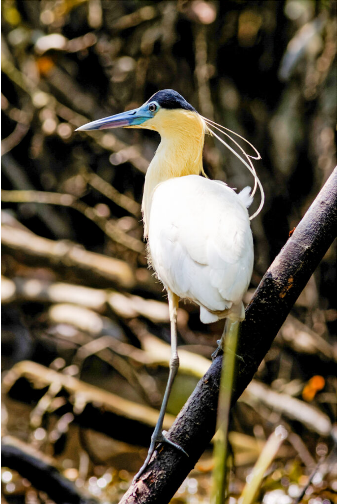
Capped Heron