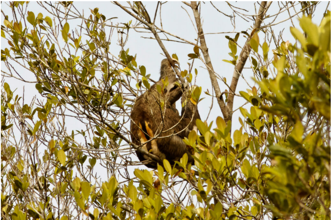
Brown-throated Sloth