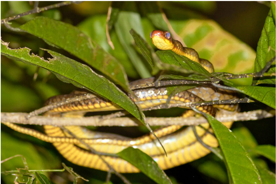
Brown Sipo