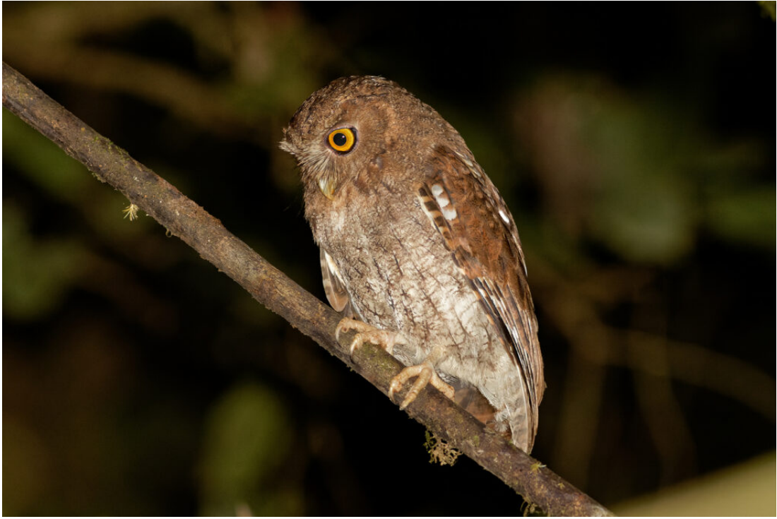
Foothill Screech Owl