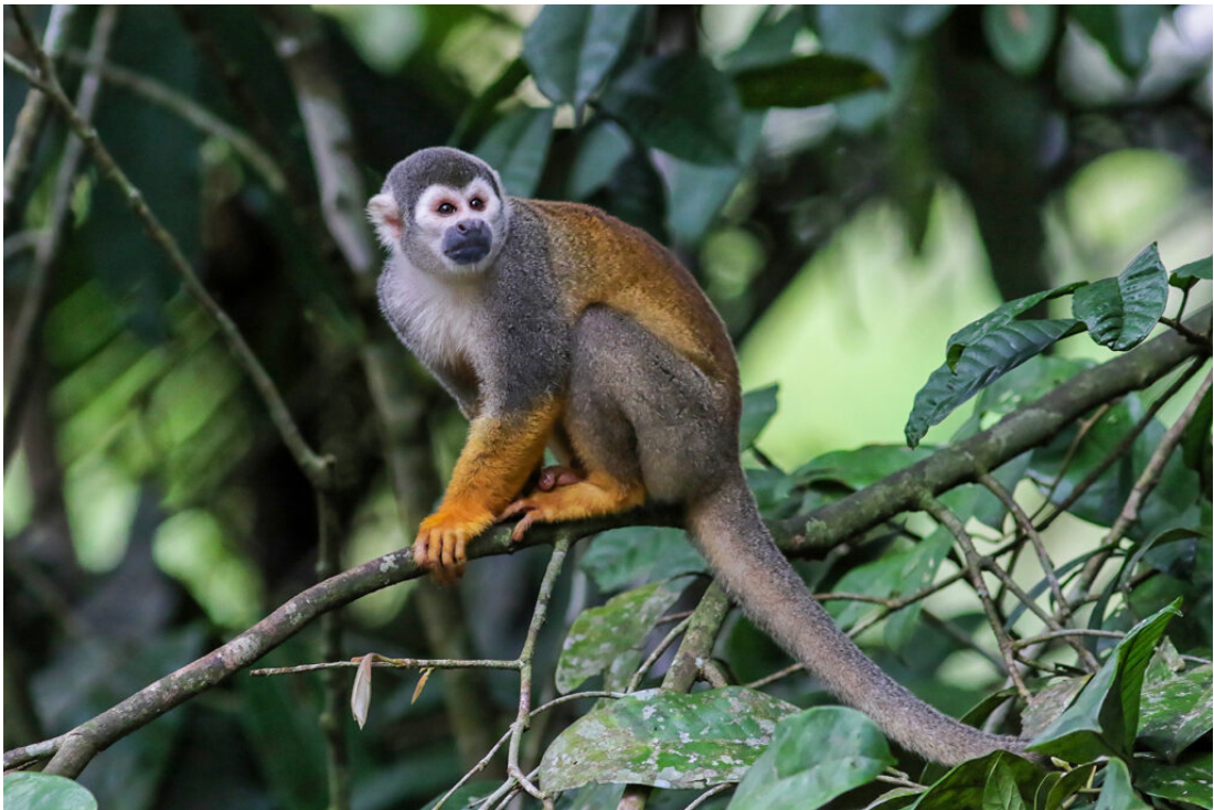
Humboldt's Squirrel Monkey