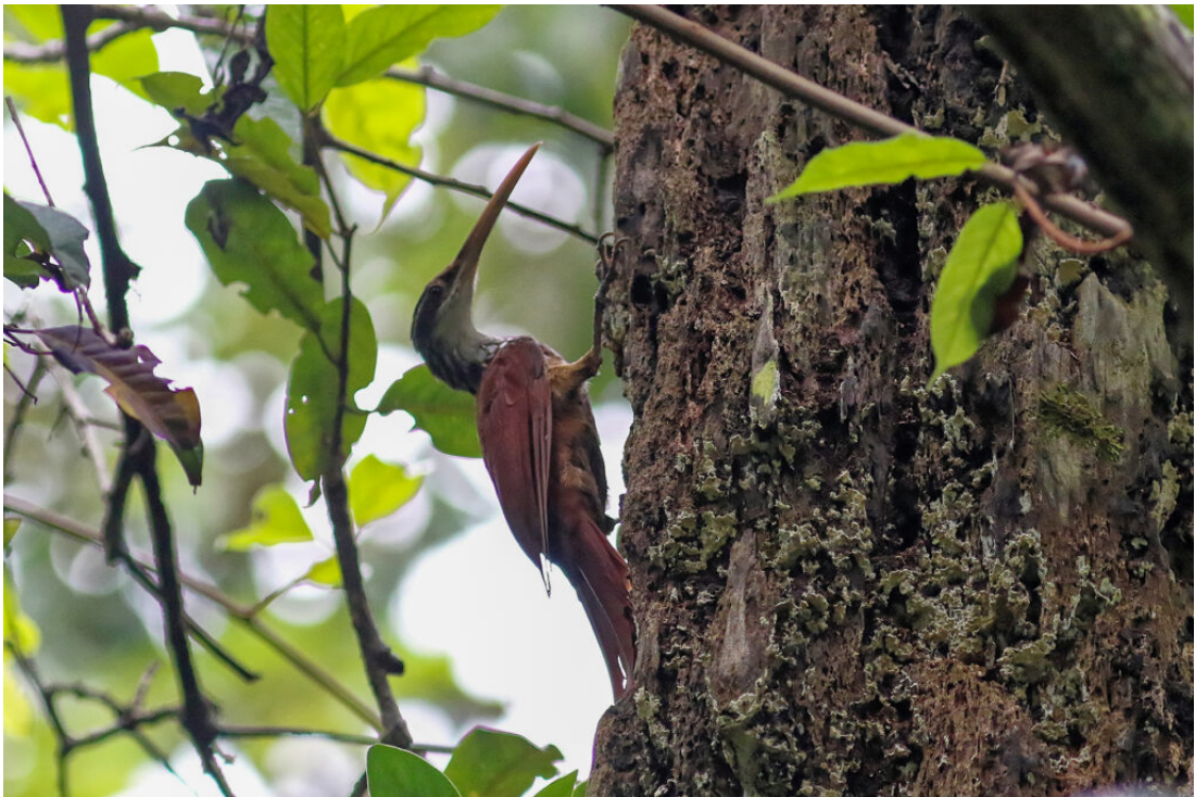
Long-billed Woodcreeper