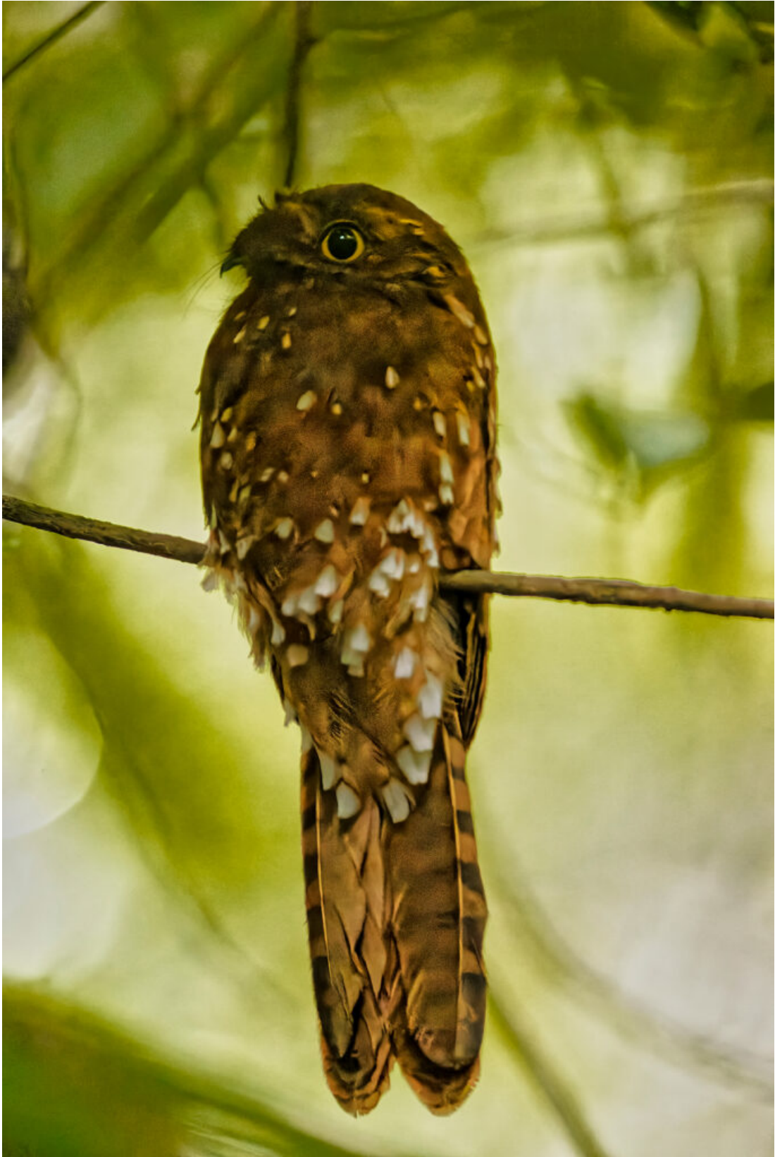
Rufous Potoo