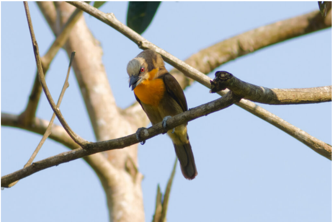
Scarlet-crowned Barbet