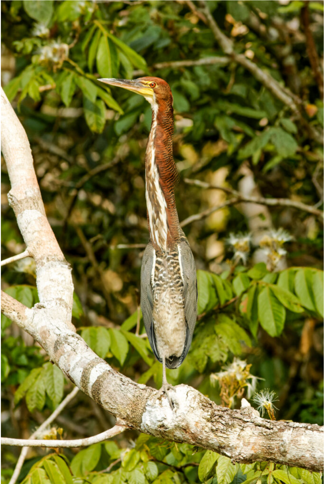
Rufescent Tiger Heron