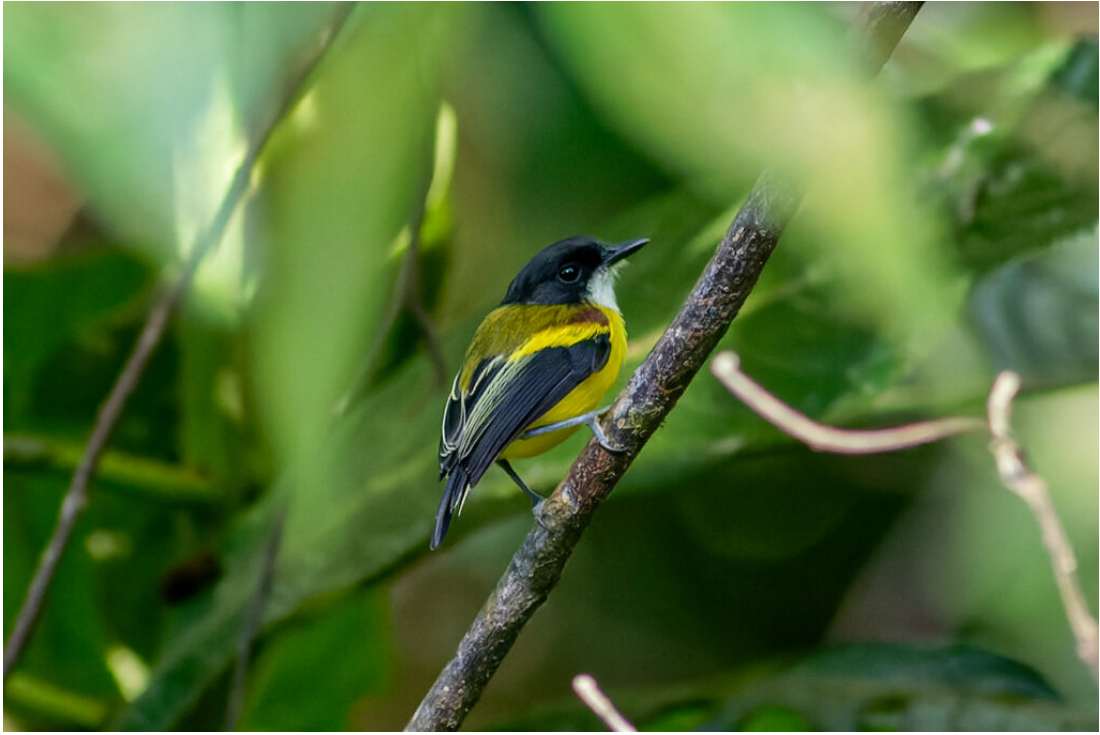
Golden-winged Tody-Flycatcher