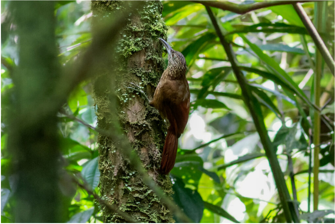
Strong-billed Woodcreeper