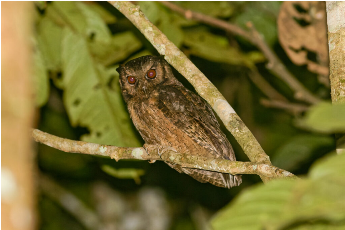
Tawny-bellied Screech Owl