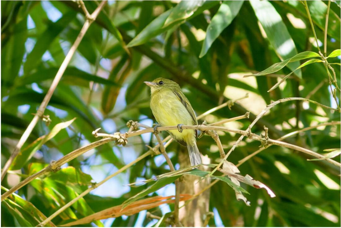
Olive-faced Flatbill