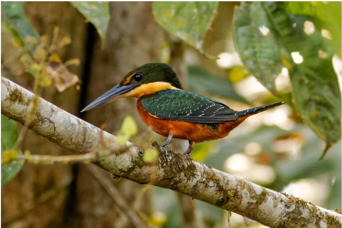
Green-and-rufous Kingfisher