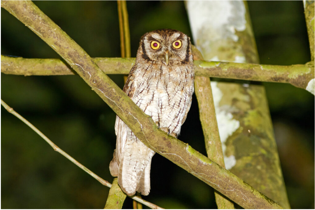
Tropical Screech Owl