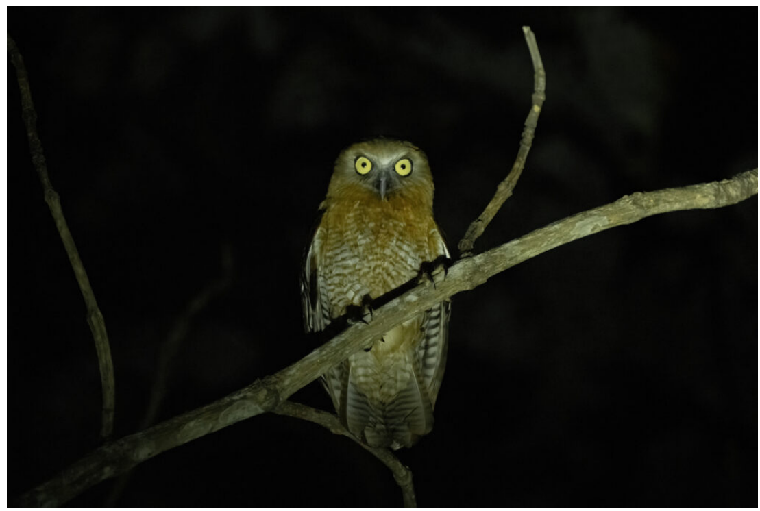
The endemic Tanimbar Boobook