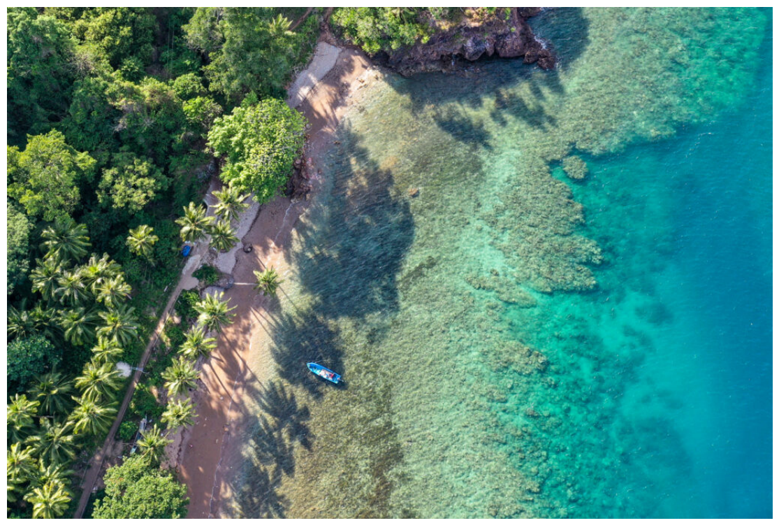
Beautiful coral reefs come right to the shoreline in the Banda Sea, like this one on Damar