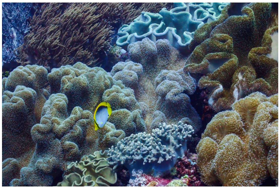
A Spot-tailed Butterflyfish amidst the corals