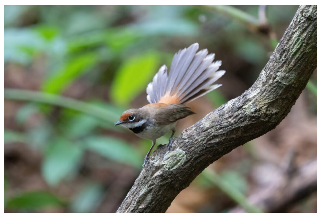
Arafura (or Supertramp) Fantail of the form semicollaris on Wetar