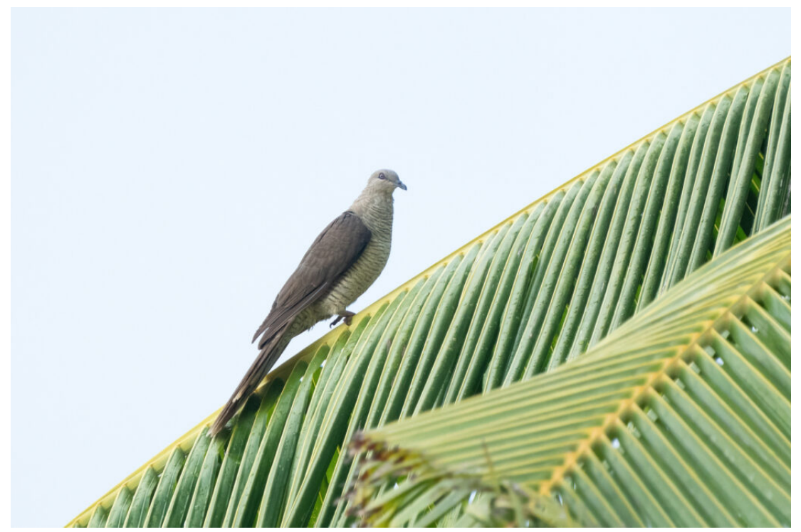
The endemic Flores Sea Cuckoo-Dove