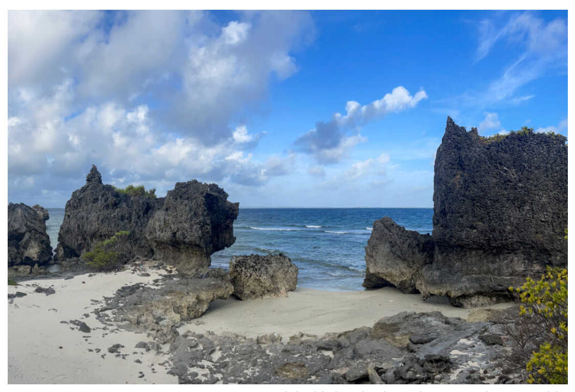
Eroded uplifted coral in the Banda Sea