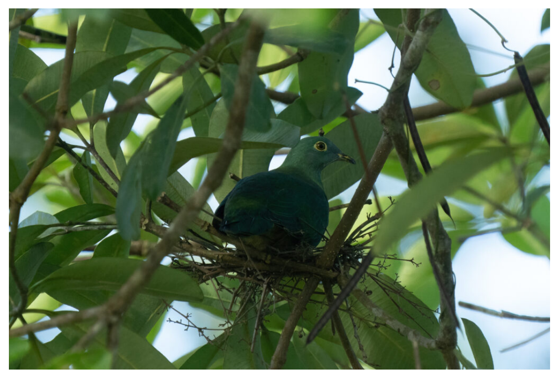
A female Black-naped Fruit Dove on its flimsy nest