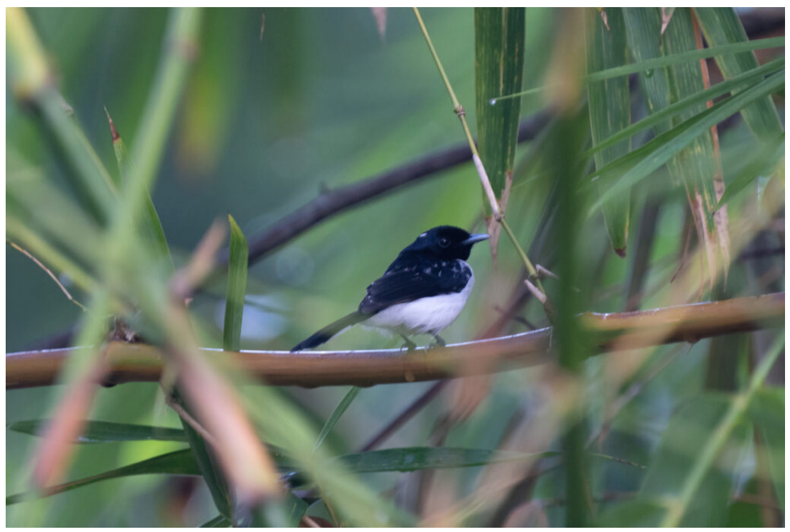
The endemic Tanahjampea Monarch