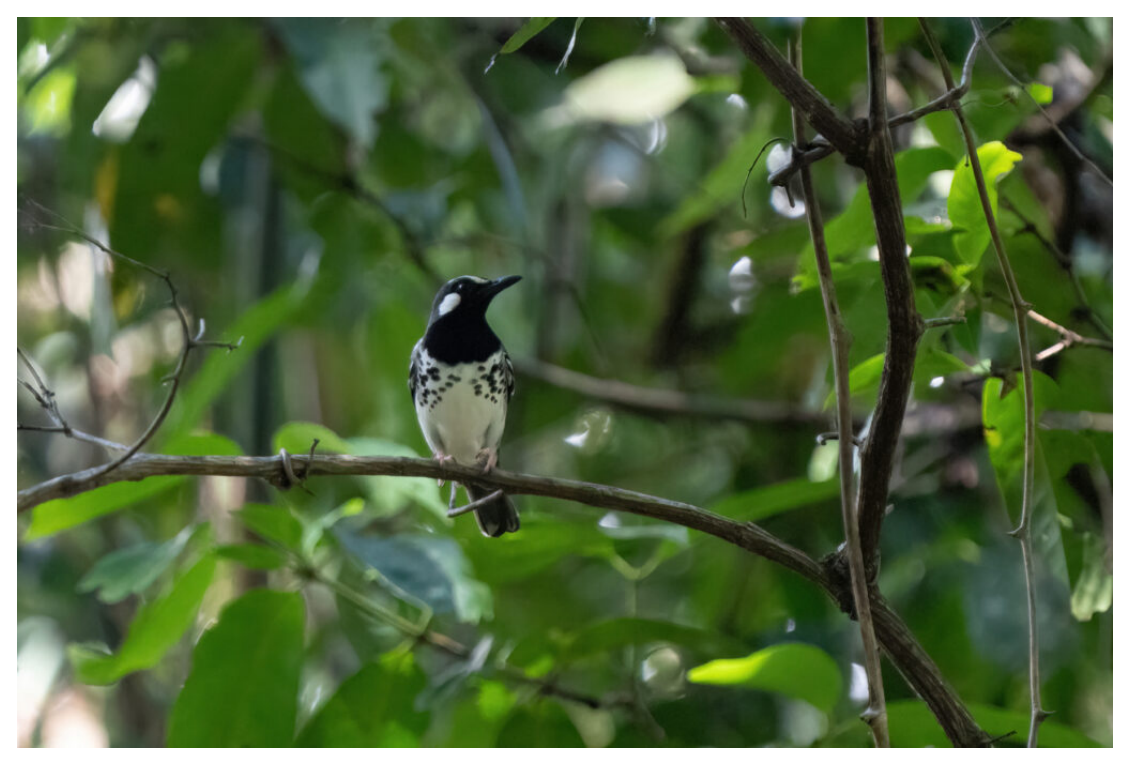
The endemic Slaty-backed Thrush in Tanimbar (image by Inger Vandyke)