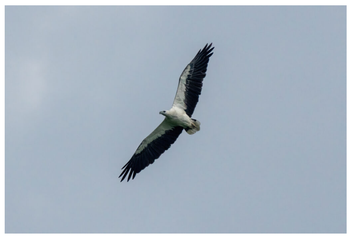
White-bellied Sea Eagle