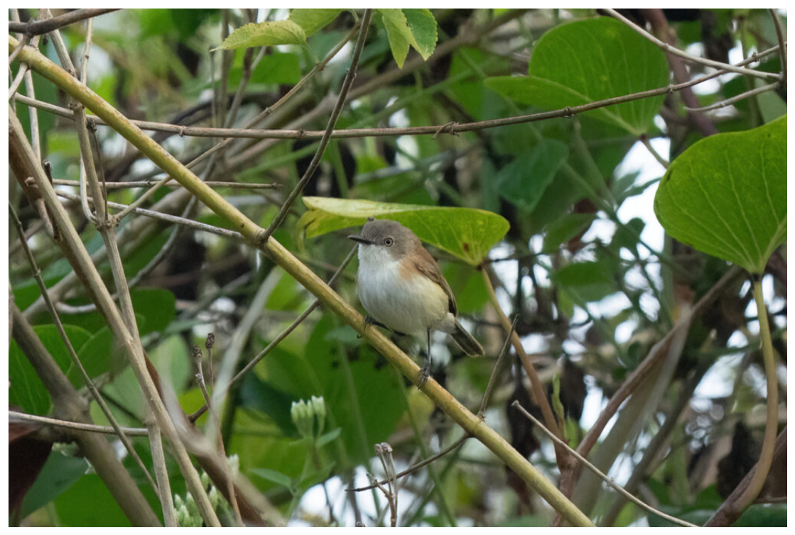
The senex form of the Rufous-sided (or Banda Sea) Gerygone on remote Kalaotoa