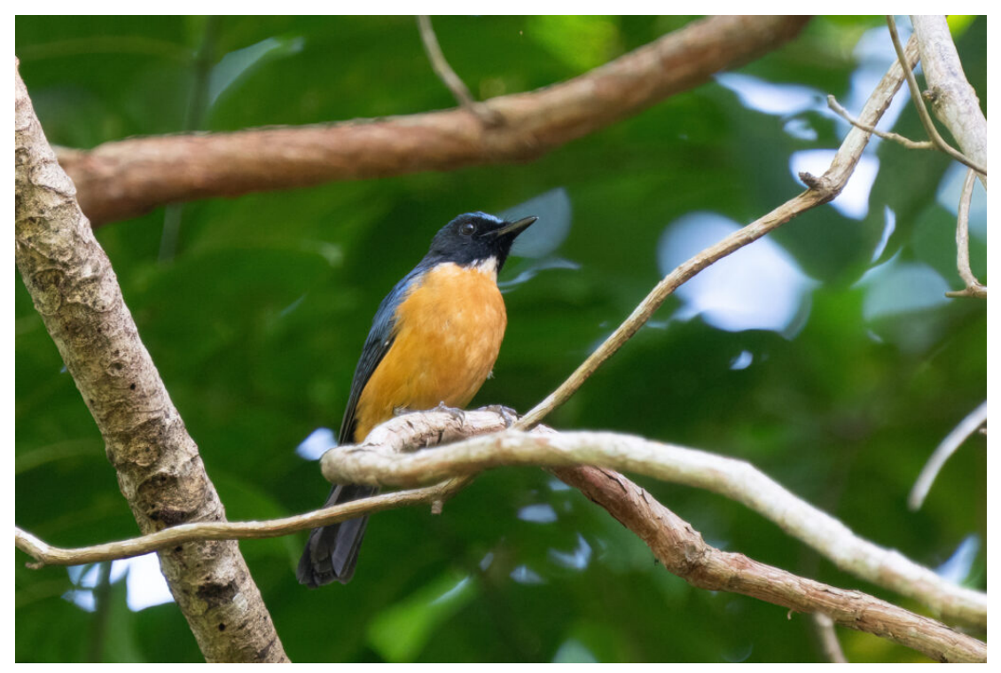
The endemic Tanahjampea Blue Flycatcher (or Tanahjampea Jungle Flycatcher)