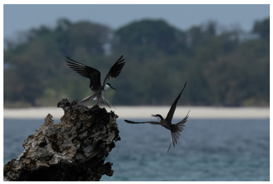
Bridled Terns