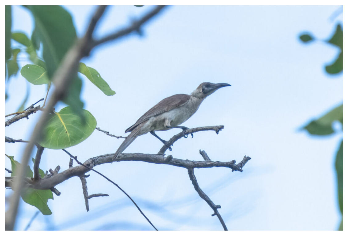
The endemic Grey (or Kisar) Friarbird