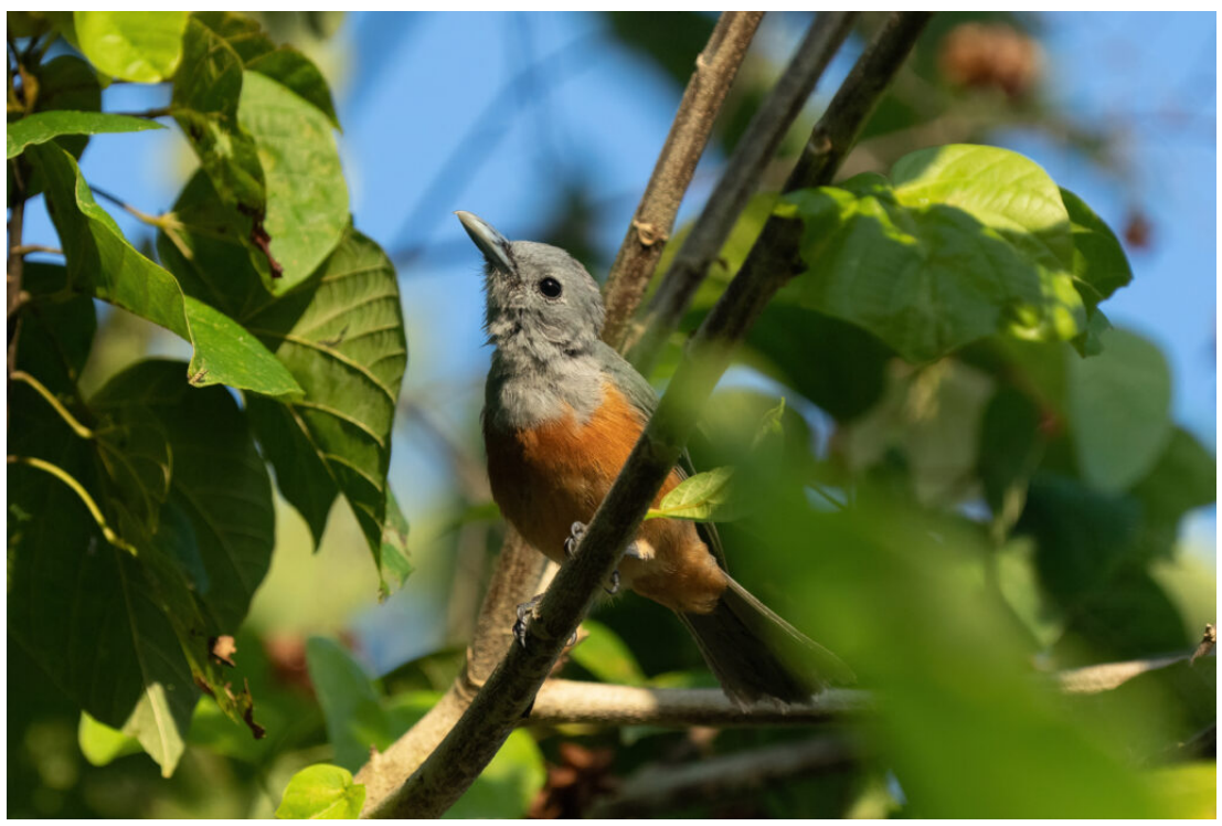
Island Monarch