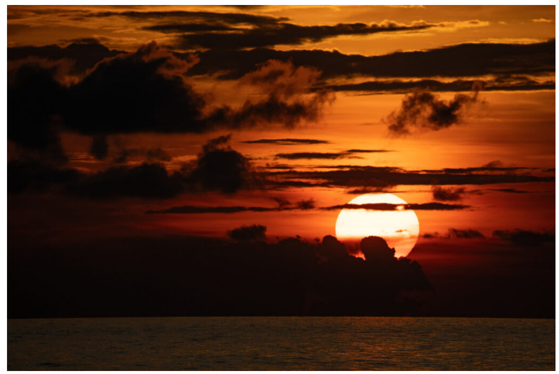
Yet another Banda Sea sunset