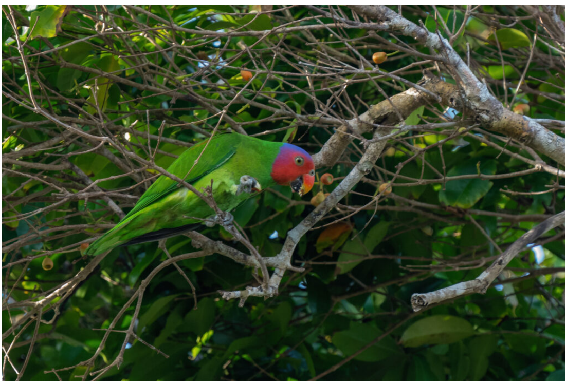
Red-cheeked Parrot of the form timorlaoensis in Tanimbar