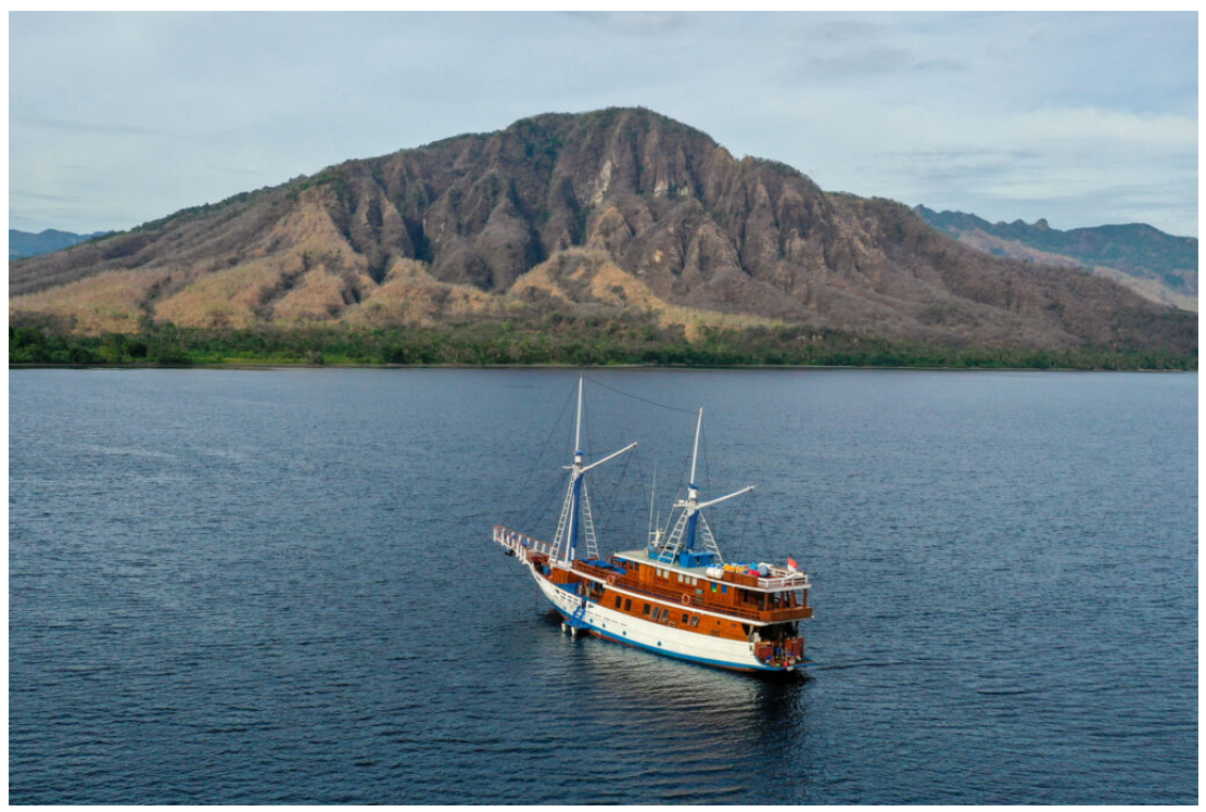
Lady Denok off Wetar in the Banda Sea