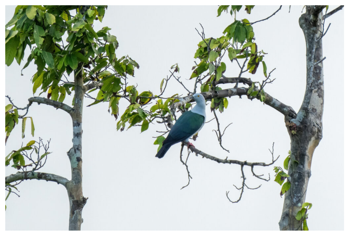
Elegant Imperial Pigeon