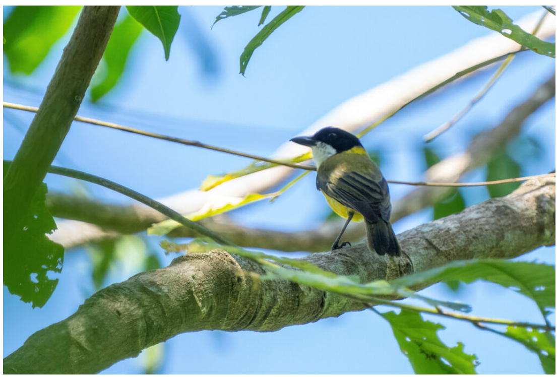
The endemic Babar Whistler