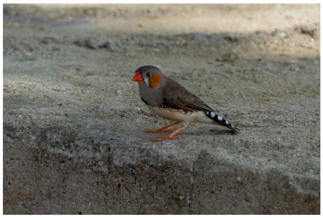
Sunda Zebra Finch