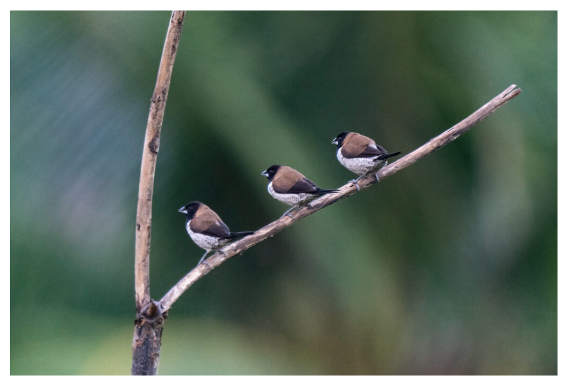
Black-faced Munias