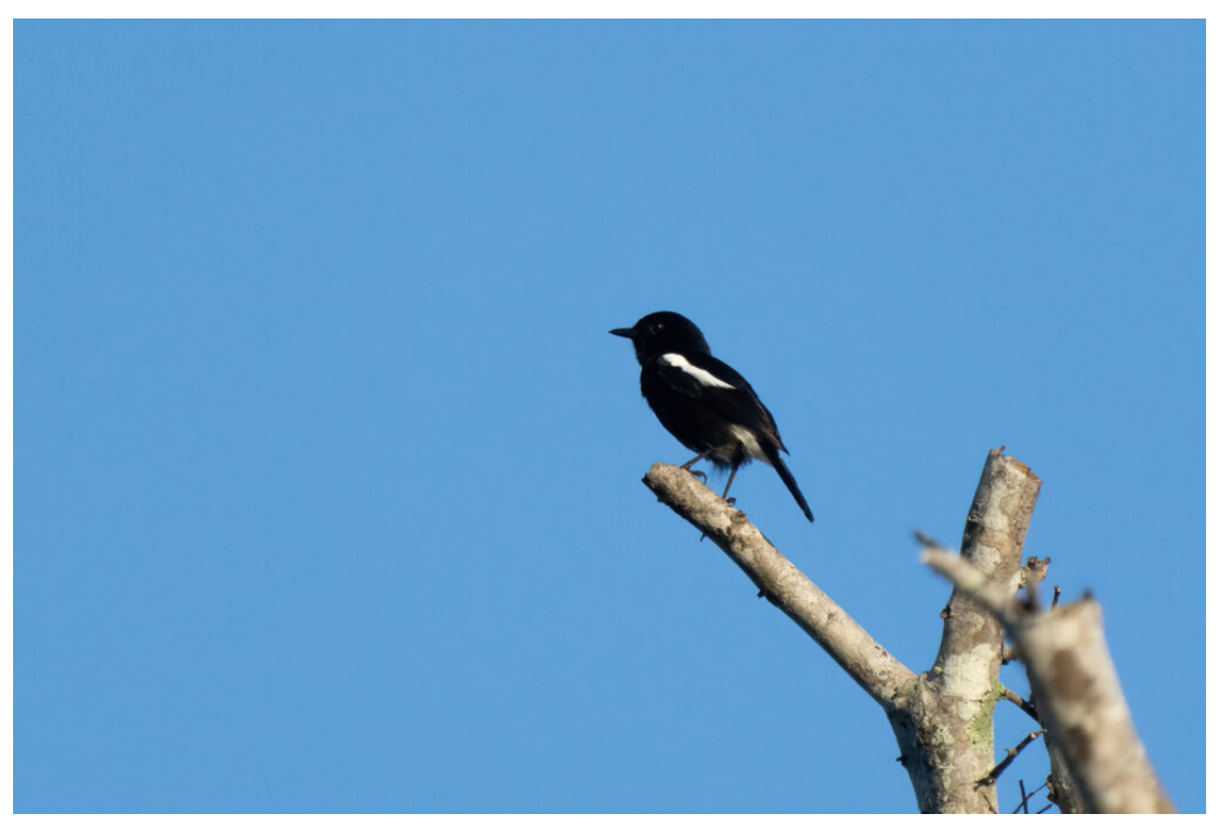
Pied Bush Chat of the form cognatus on Babar