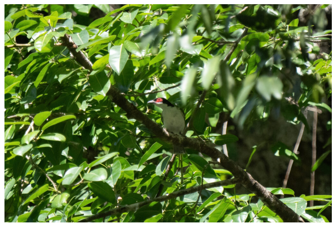
The endemic Wetar Figbird