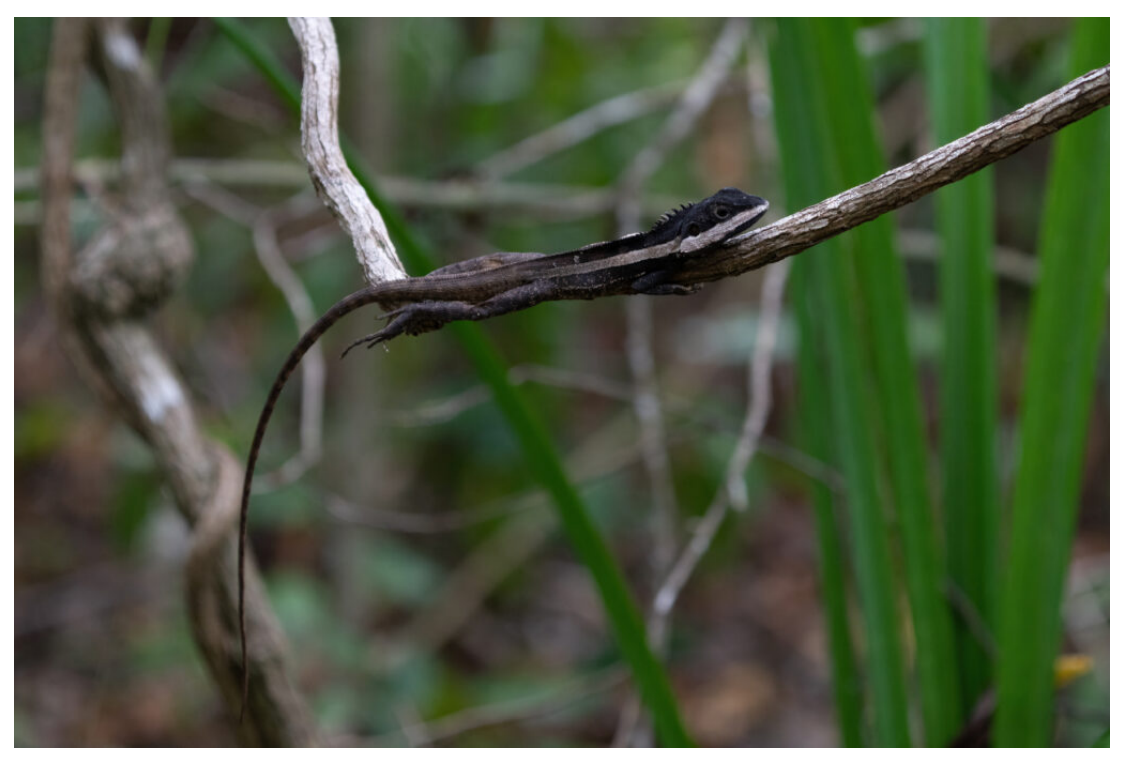
Northern Water Dragon