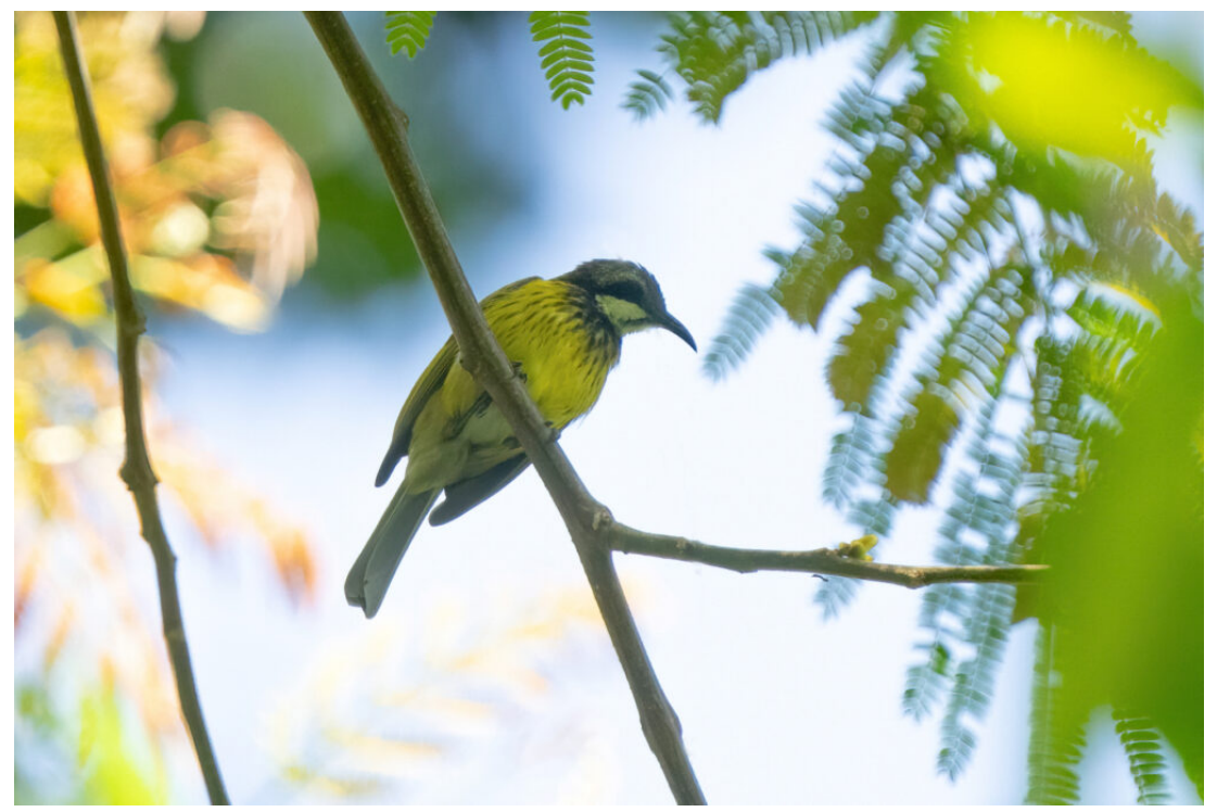
The endemic Black-necklaced Honeyeater