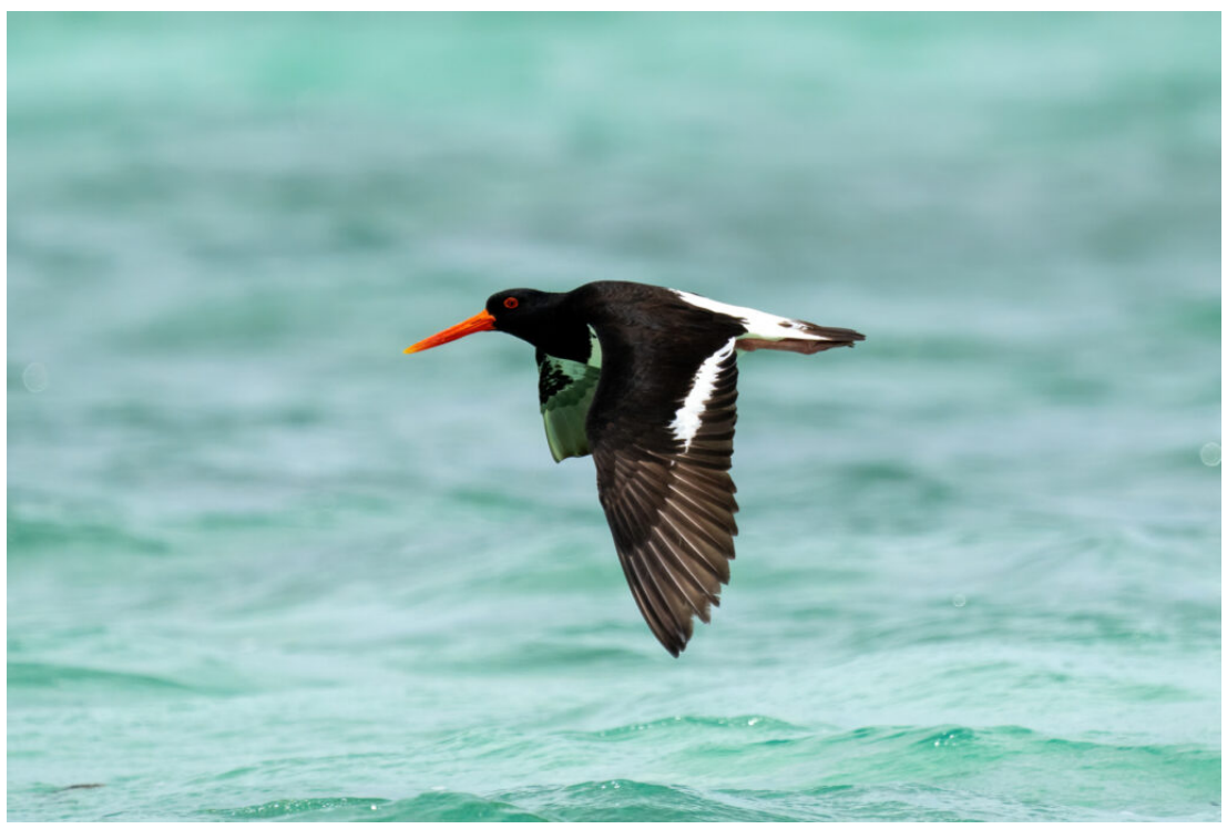
Pied Oystercatcher in Tanimbar is a surprise addition to most people's Asian list!