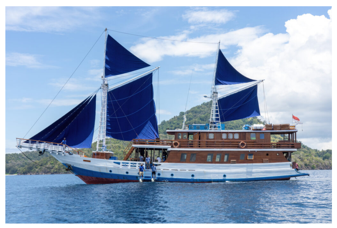
The crew awaiting us with help at the gangway, cool towels and welcome drinks as we return from birding! This is the life!