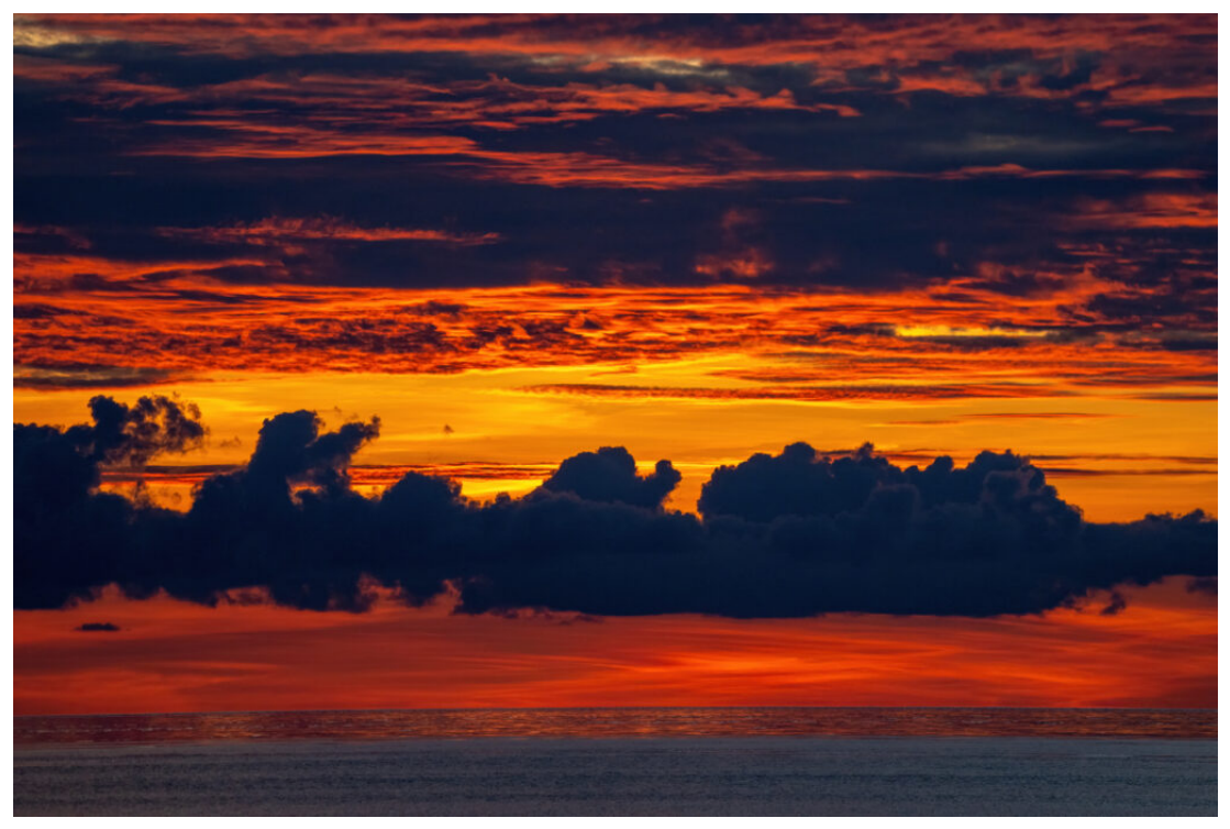
Sunset over the Banda Sea