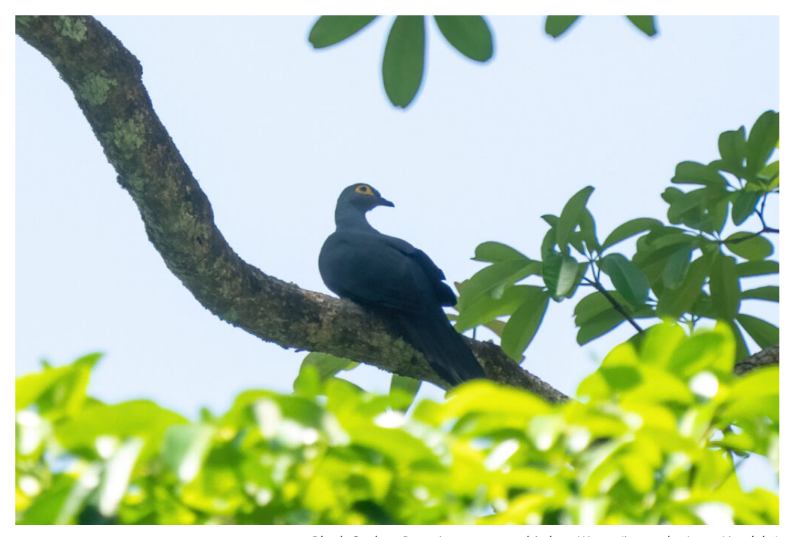
Black Cuckoo-Dove is a common bird on Wetar