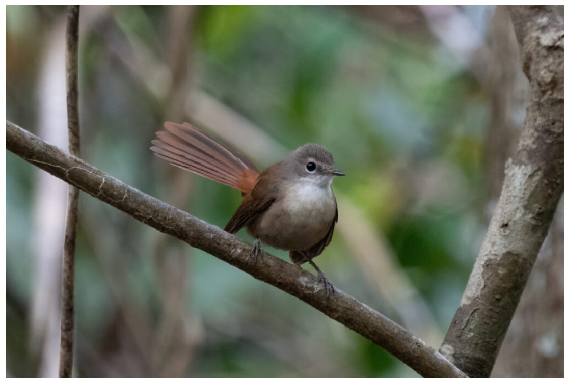
The endemic Long-tailed (or Charming) Fantail in Tanimbar