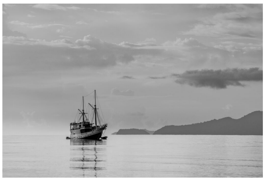
Lady Denok, our wonderful home from home