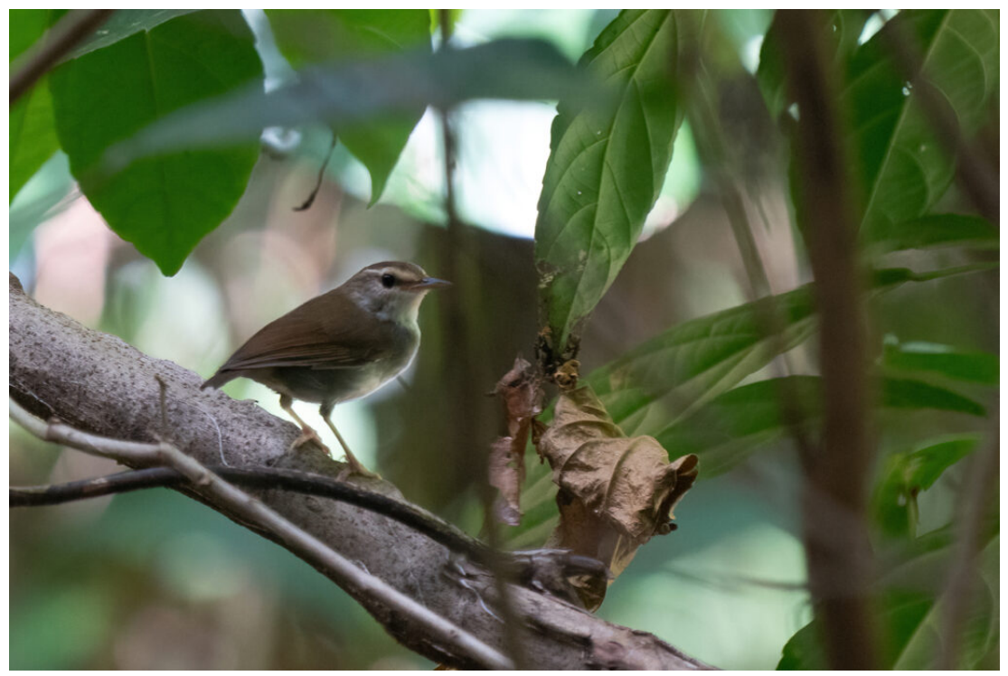
The shy Timor Stubtail