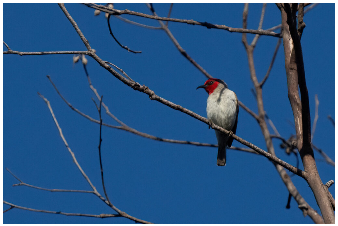
The recently-discovered endemic Alor Myzomela