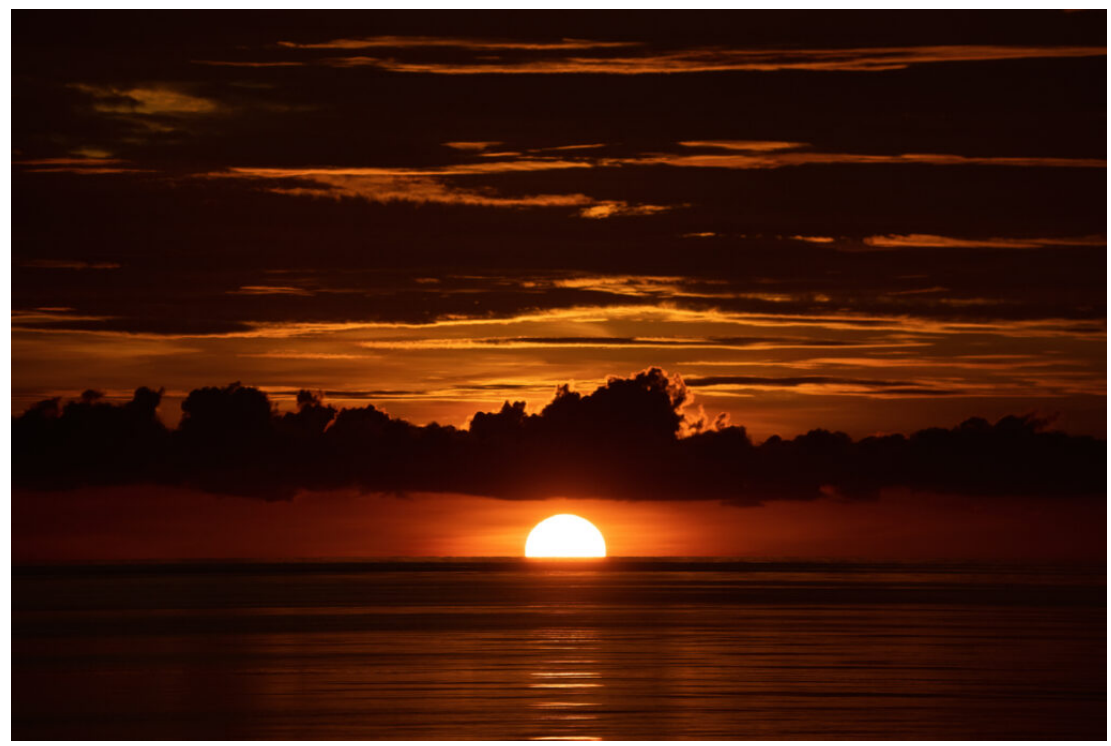
Banda Sea sunset