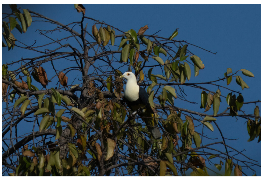
The beautiful Banded (or Black-banded) Fruit Dove of the rarely-seen form lettiensis on Leti