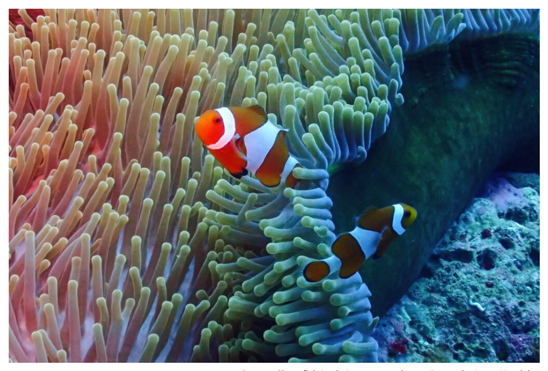
Orange Clownfish in their anemone home