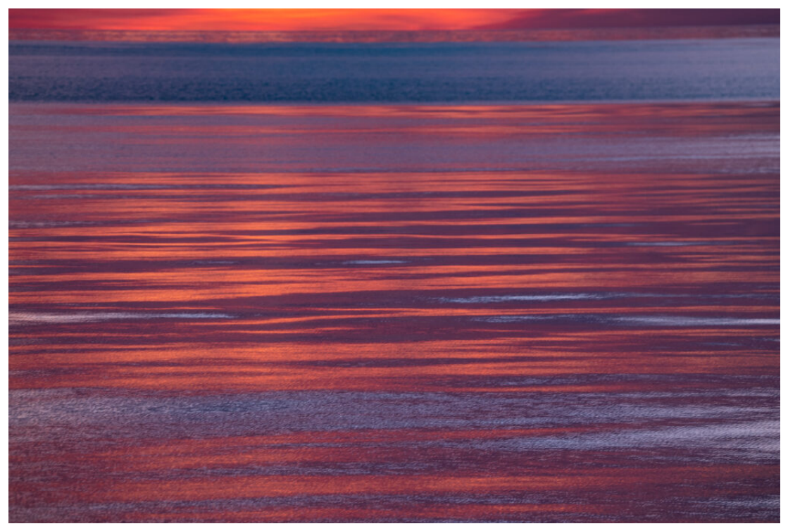
The glassy waters of the Banda Sea reflect the post-sunset colours