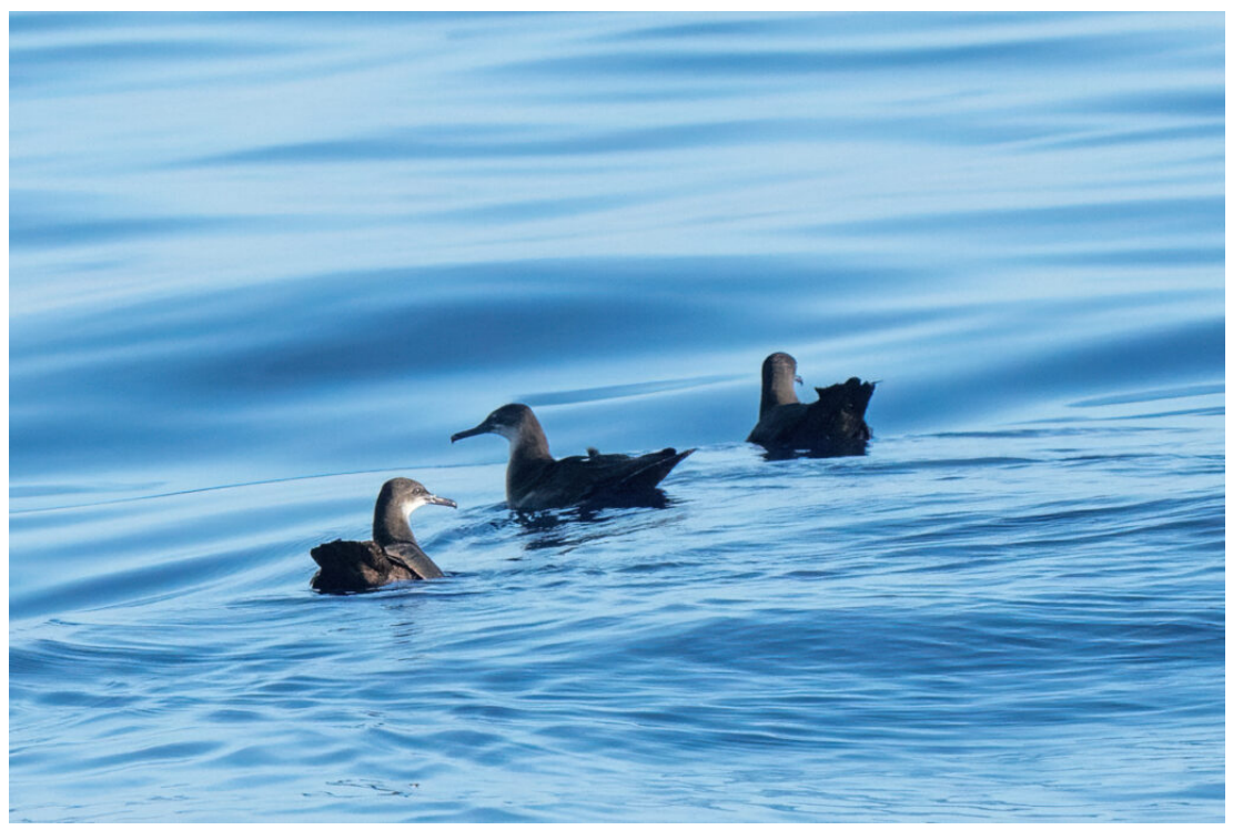
The rare and little-known Heinroth's Shearwater