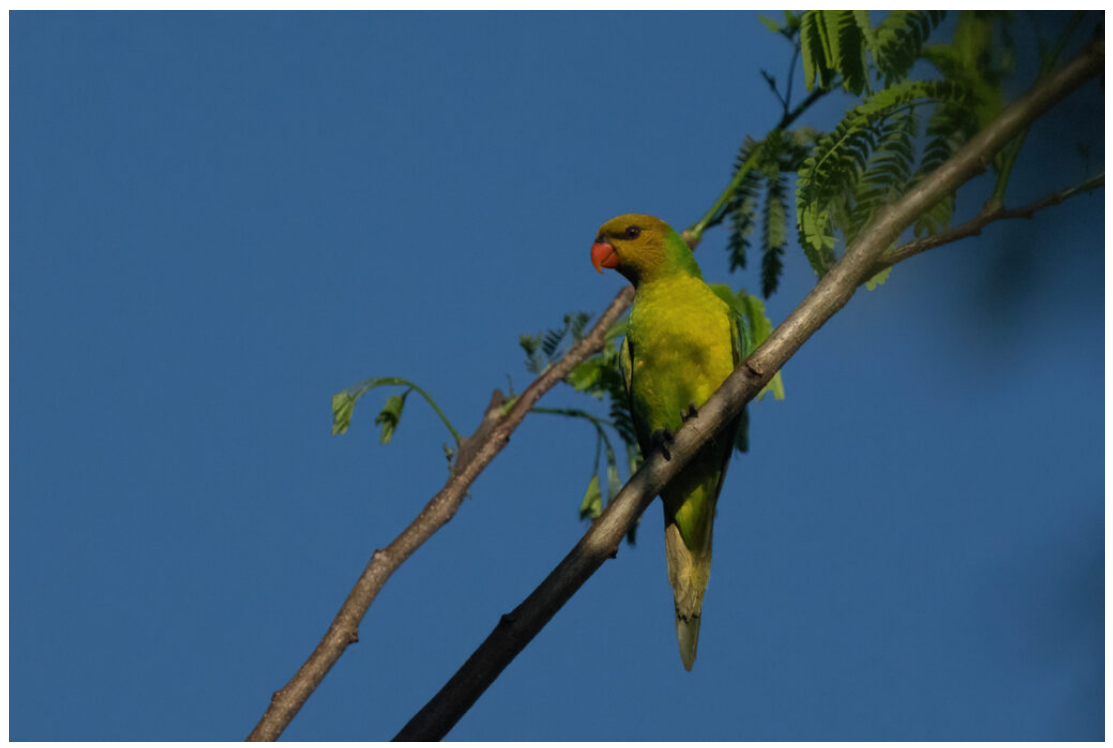
Olive-headed Lorikeet