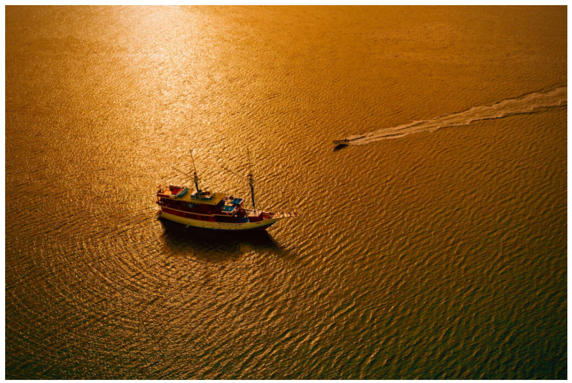
Lady Denok at sunset