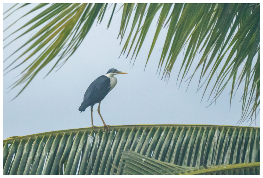
Pied Heron