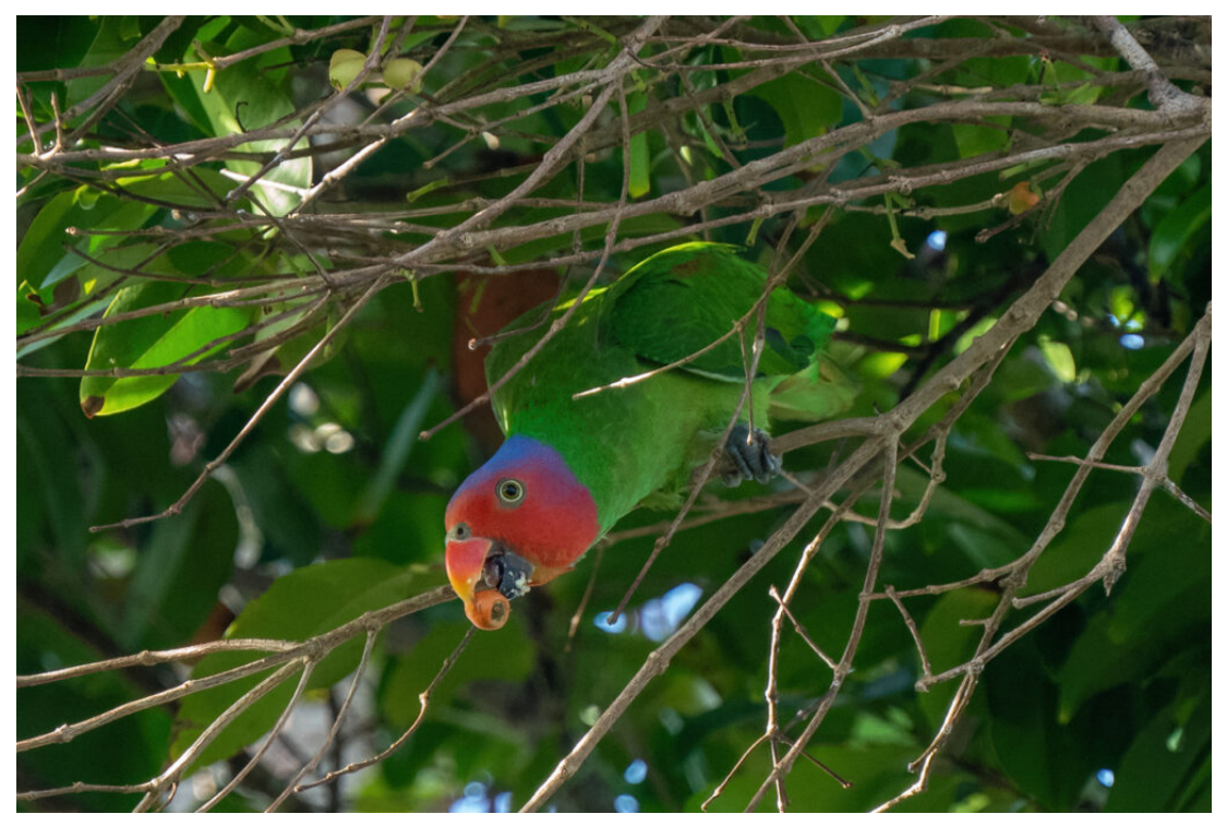
Red-cheeked Parrot of the form timorlaoensis in Tanimbar