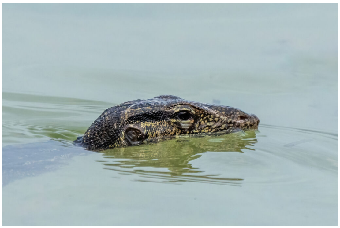
Asian Water Monitor