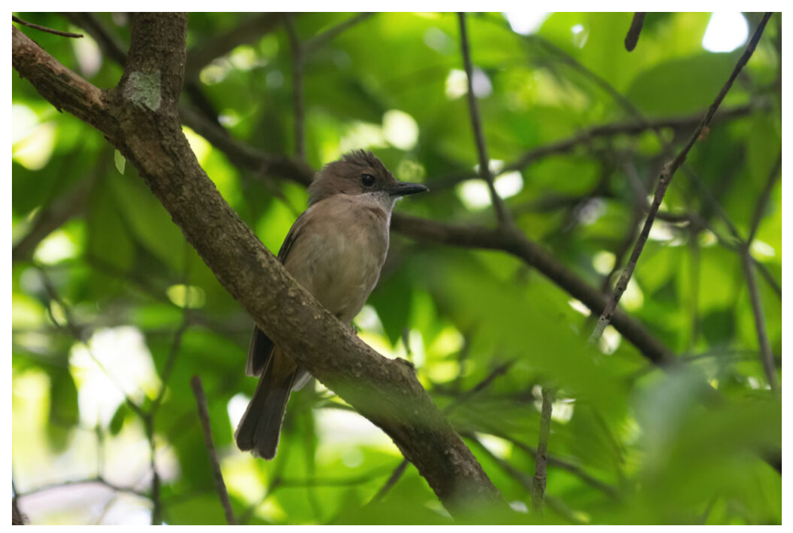
A female 'Damar Whistler'