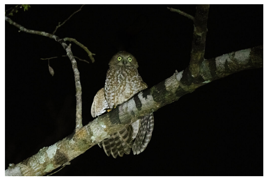
The endemic Alor Boobook