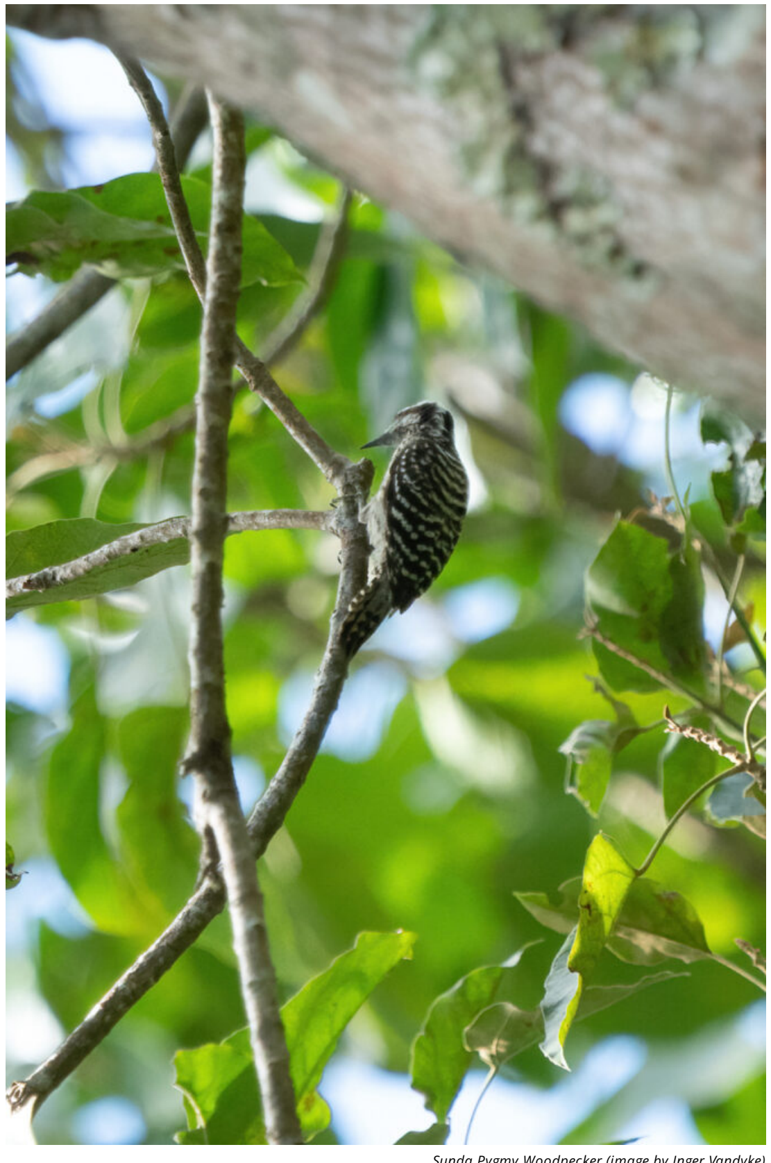
Sunda Pygmy Woodpecker