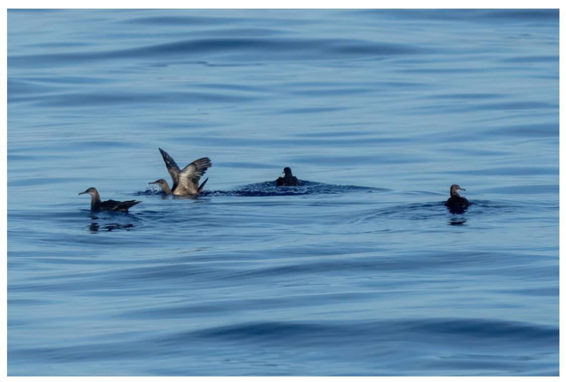
Four Heinroth's Shearwaters together in the Banda Sea