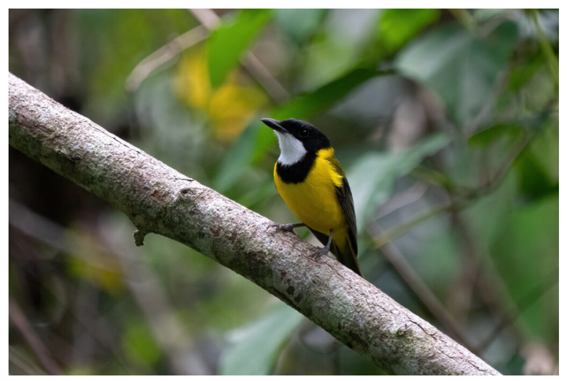
The endemic 'Damar Whistler' a likely split from Golden Whistler