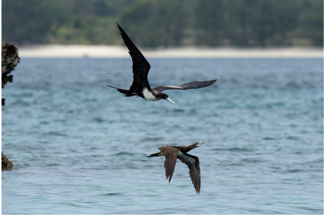
A Great Frigatebird pursues a hapless Brown Booby