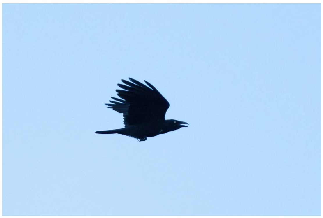
Torresian Crow is a suprisingly scarce bird in Tanimbar