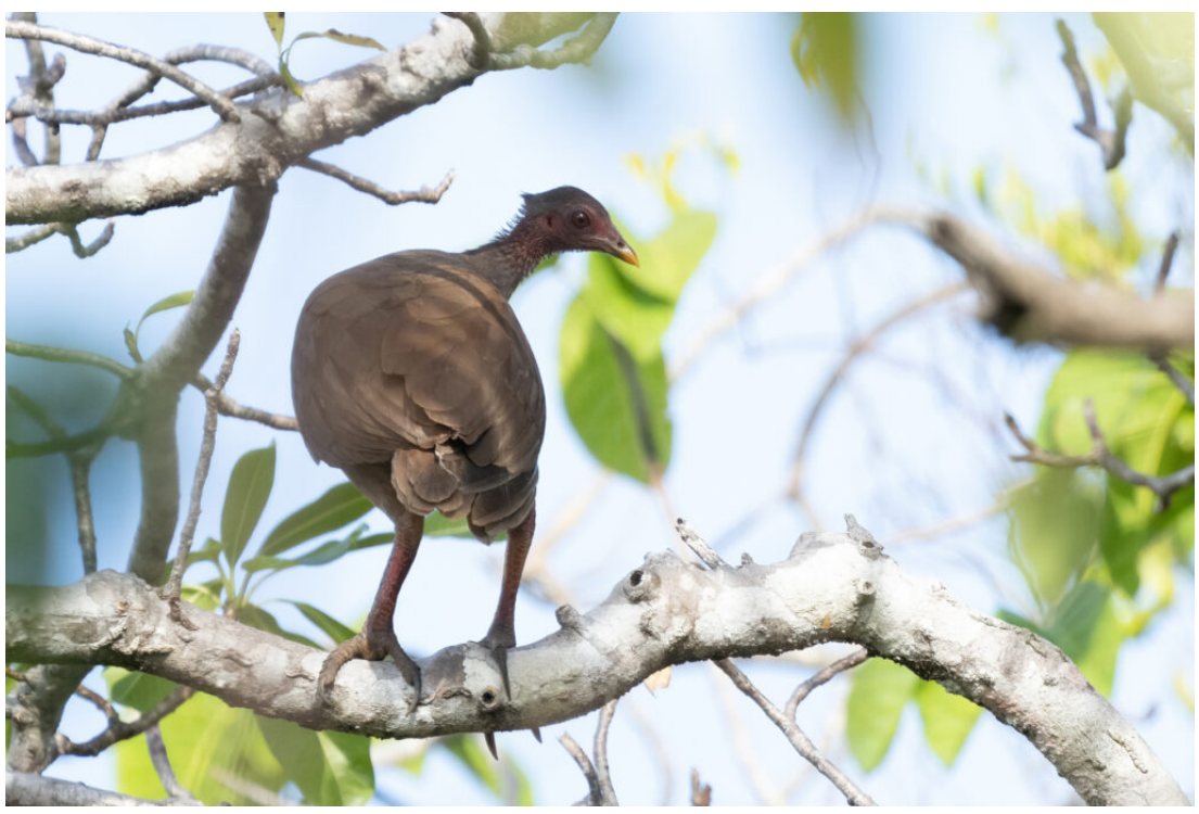
Tanimbar Megapode (or Tanimbar Scrubfowl) is the most difficult of Tanimbar's endemics