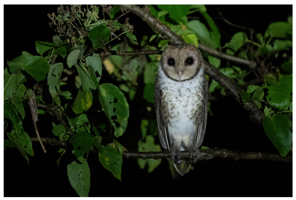
Moluccan Masked Owl is a difficult and sought-after species in Tanimbar