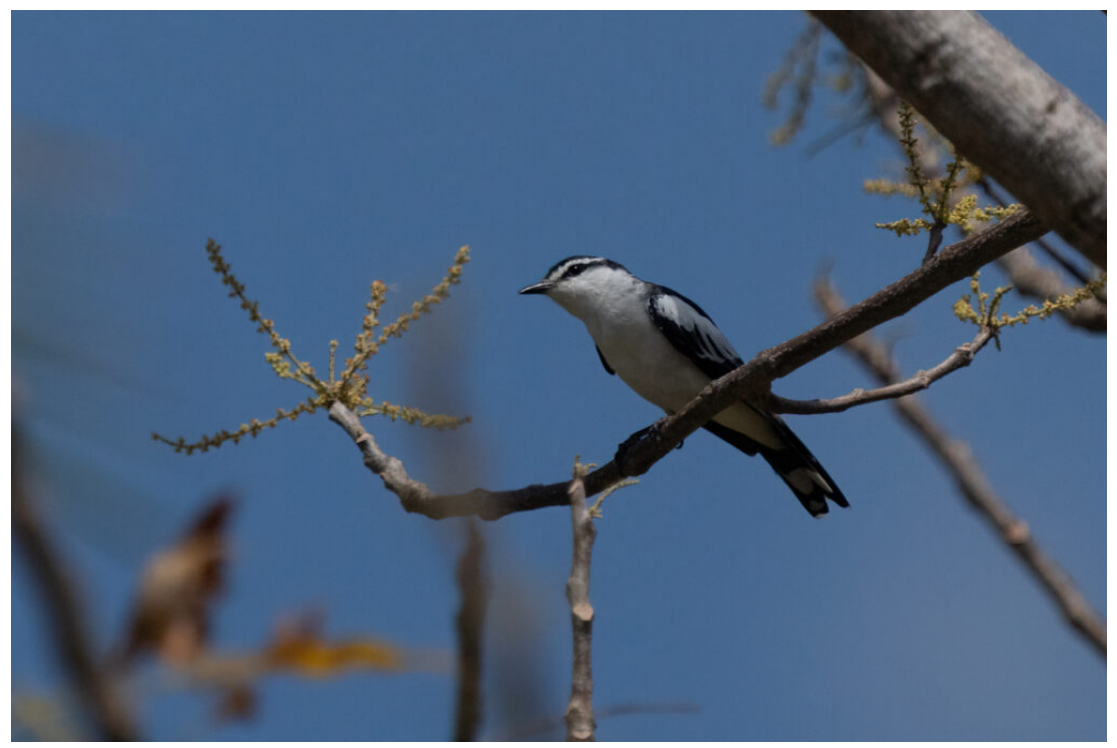
White-shouldered (or Lesueur's) Triller