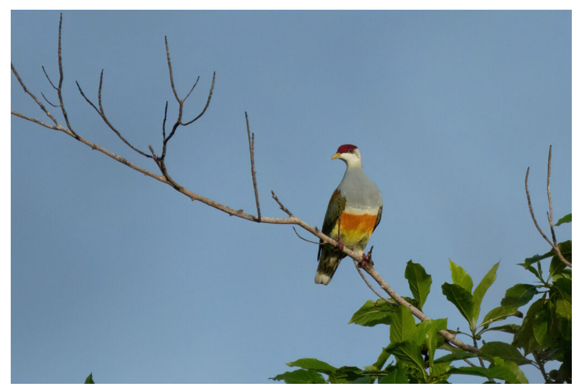
The beautiful Wallace's Fruit Dove in Tanimbar