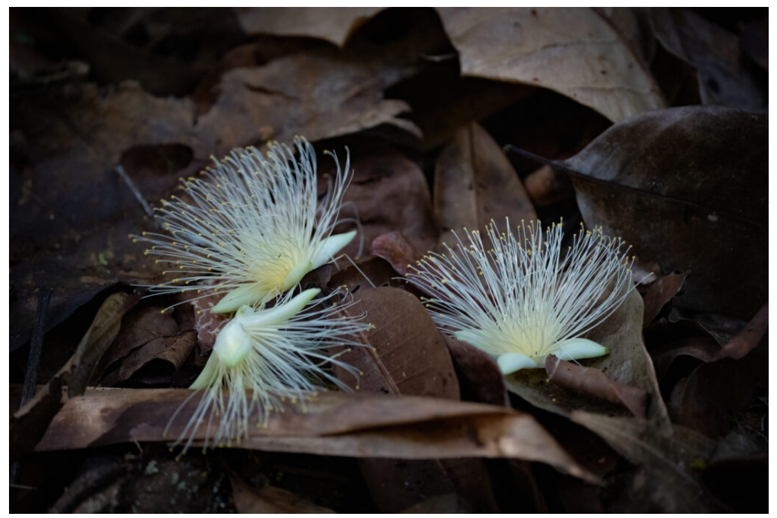
Malabar Plum flowers, beloved of myzomelas and honeyeaters