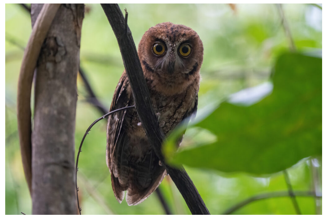
The endemic Wetar Scops Owl comes out to play long before dusk