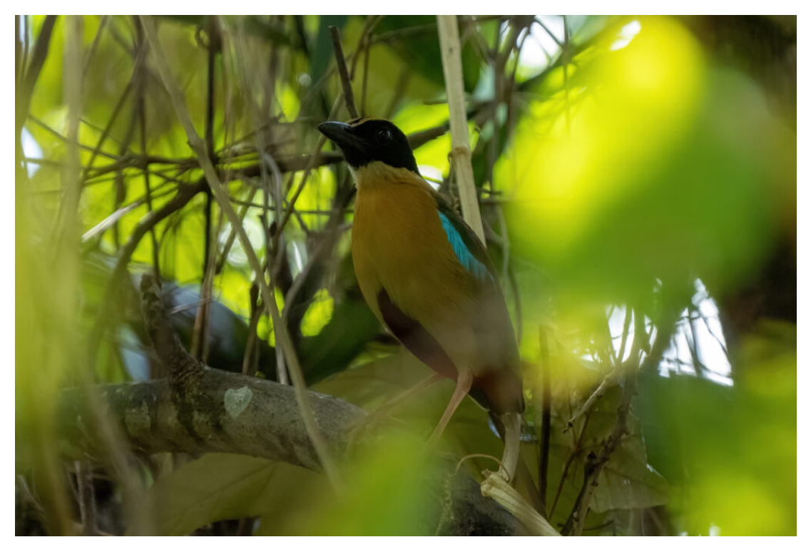
The endemic virginalis form of the (Wallace's) Elegant Pitta