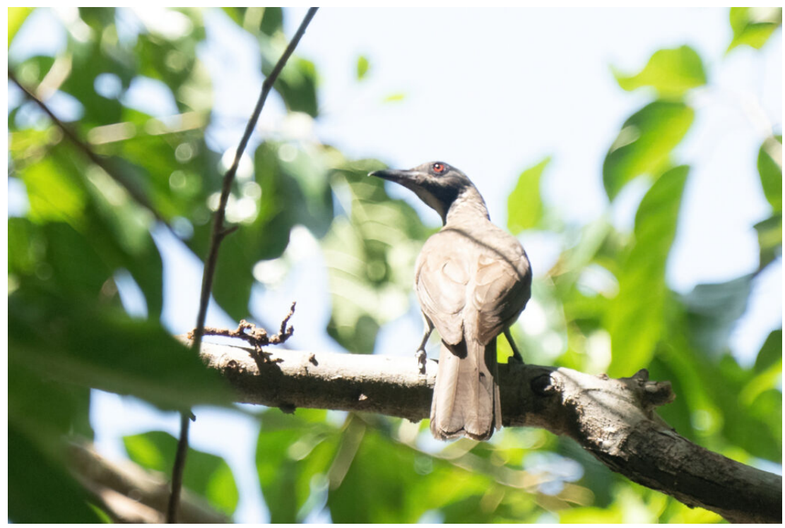
The endemic Wetar Oriole