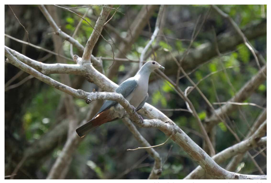
Pink-headed Imperial Pigeon