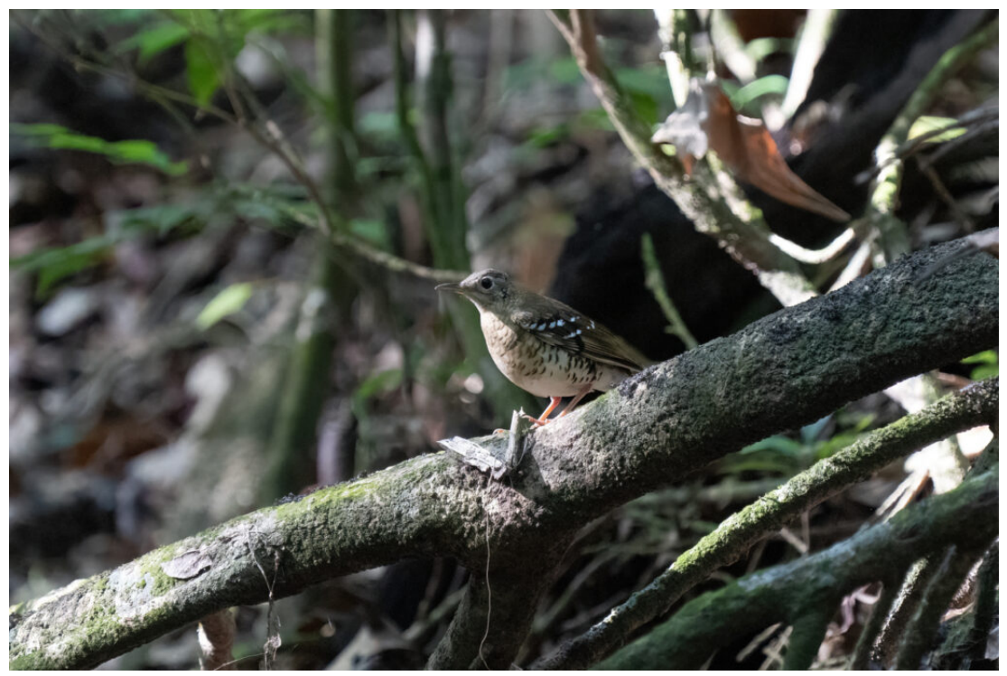
The shy endemic Fawn-breasted Thrush in Tanimbar