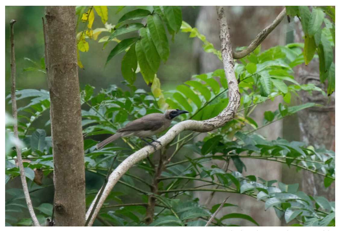
Tenggara Friarbird on Alor