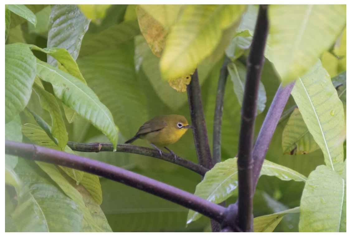
Lemon-bellied White-eye