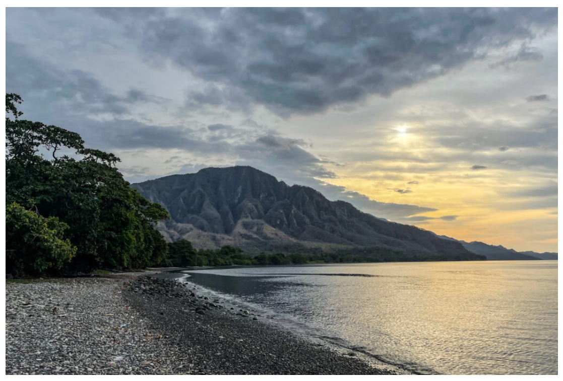
Wetar coastline