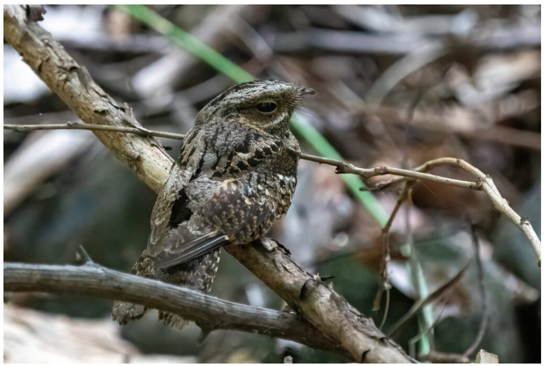
Timor Nightjar on Wetar