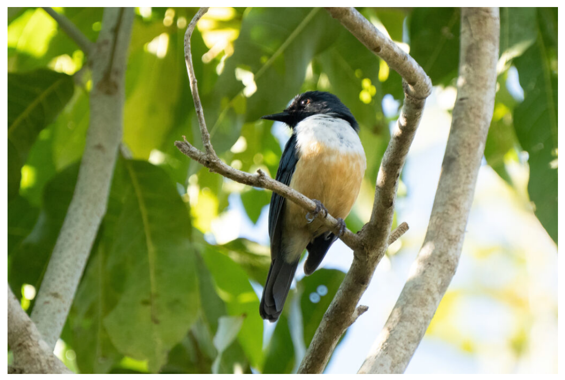
The endemic Kalao Blue Flycatcher (or Kalao Jungle Flycatcher)