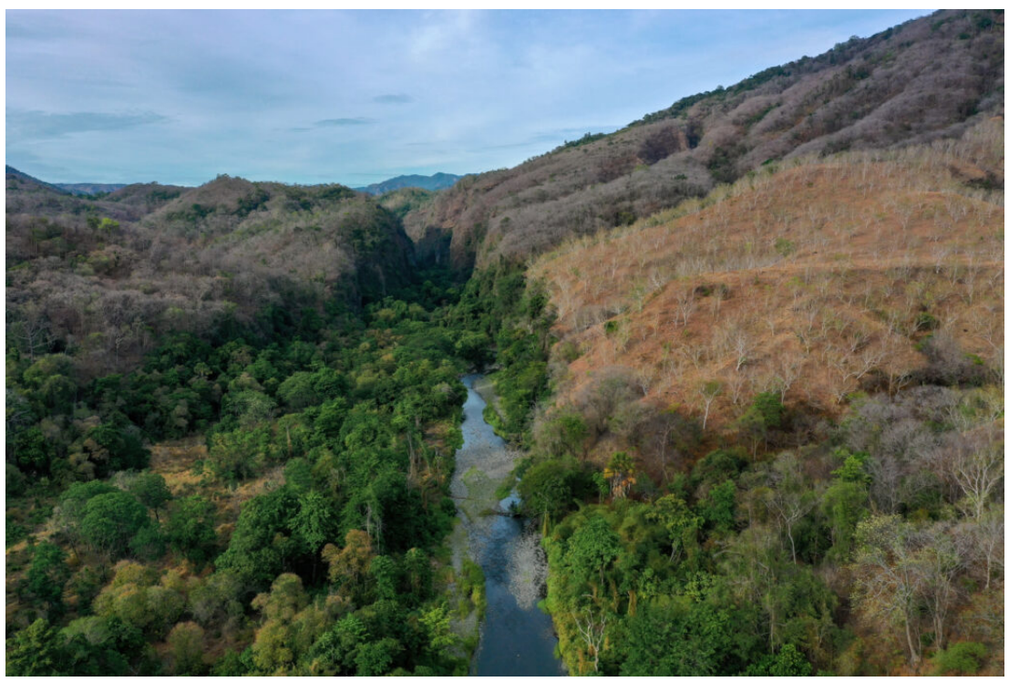
A remote canyon on the island of Wetar