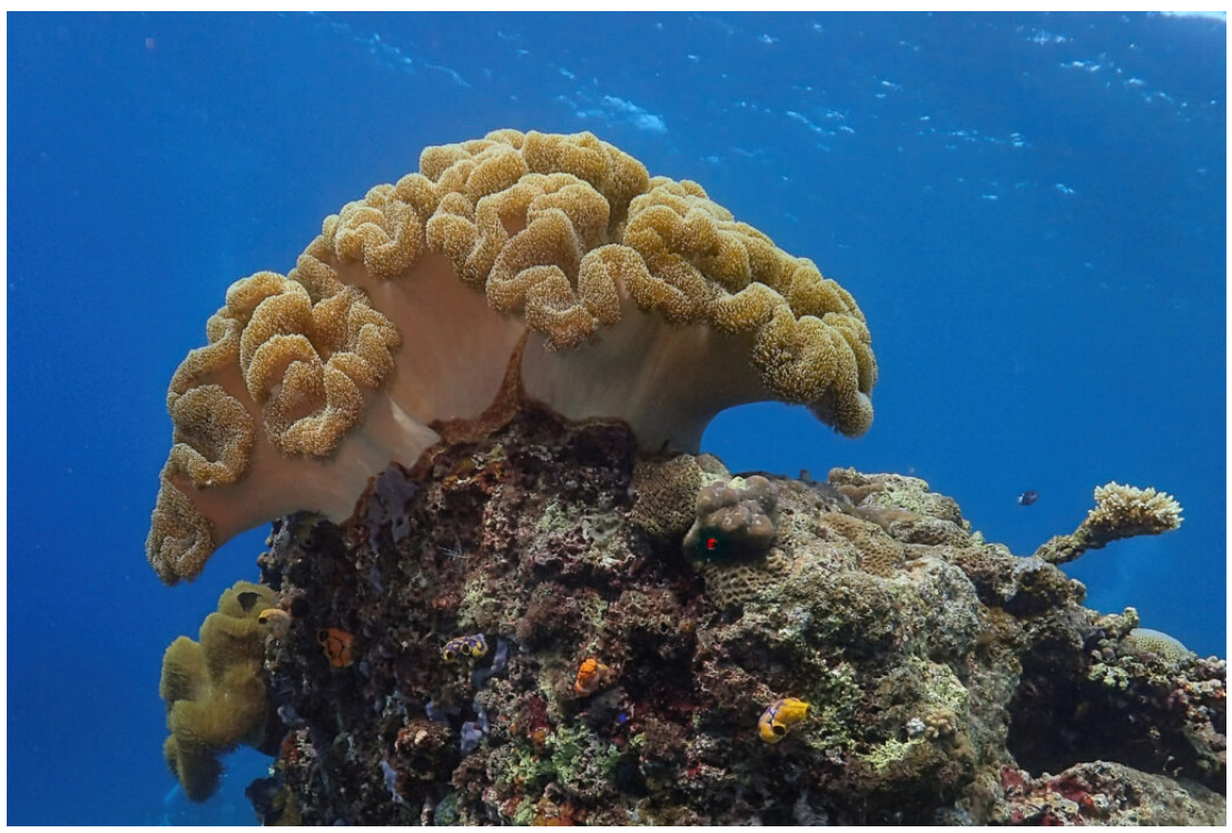
Soft corals are a glory of the Banda Sea