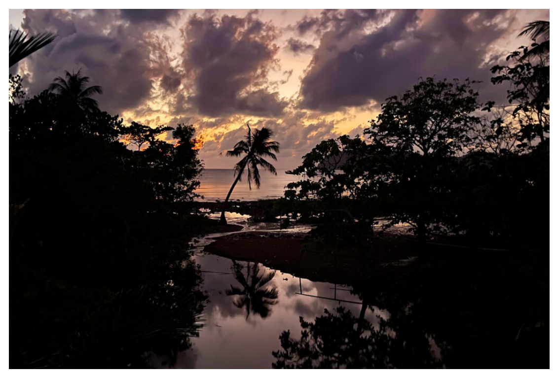
Damar at sunrise