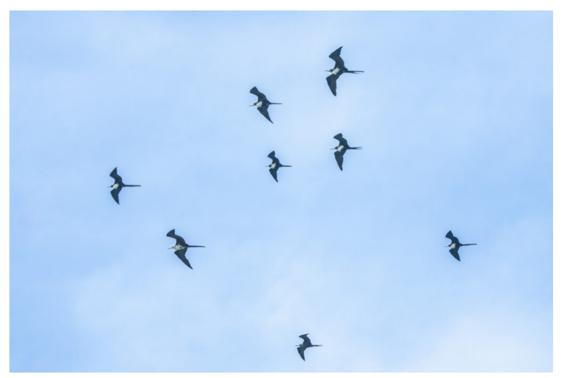
Great Frigatebirds lie in wait