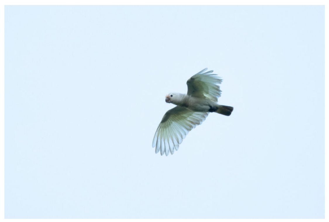
The endemic Tanimbar Corella (or Tanimbar Cockatoo)