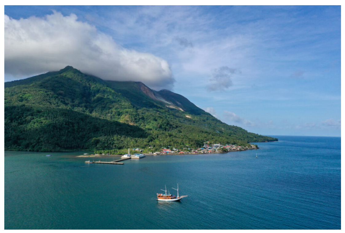
Lady Denok below the volcano on Damar