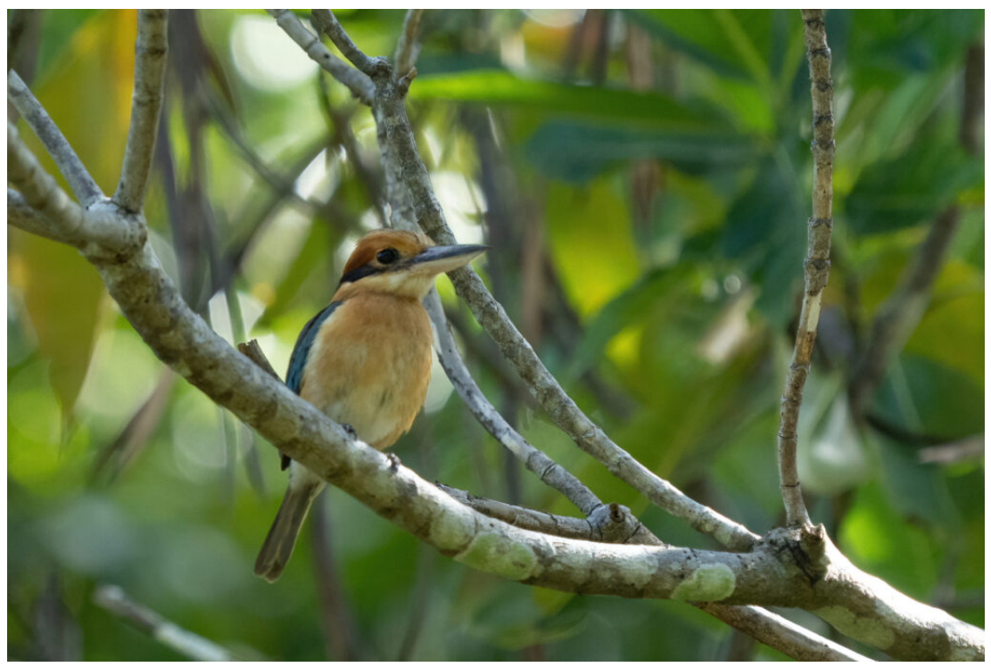
Cinnamon-banded Kingfisher of the form dammerianus