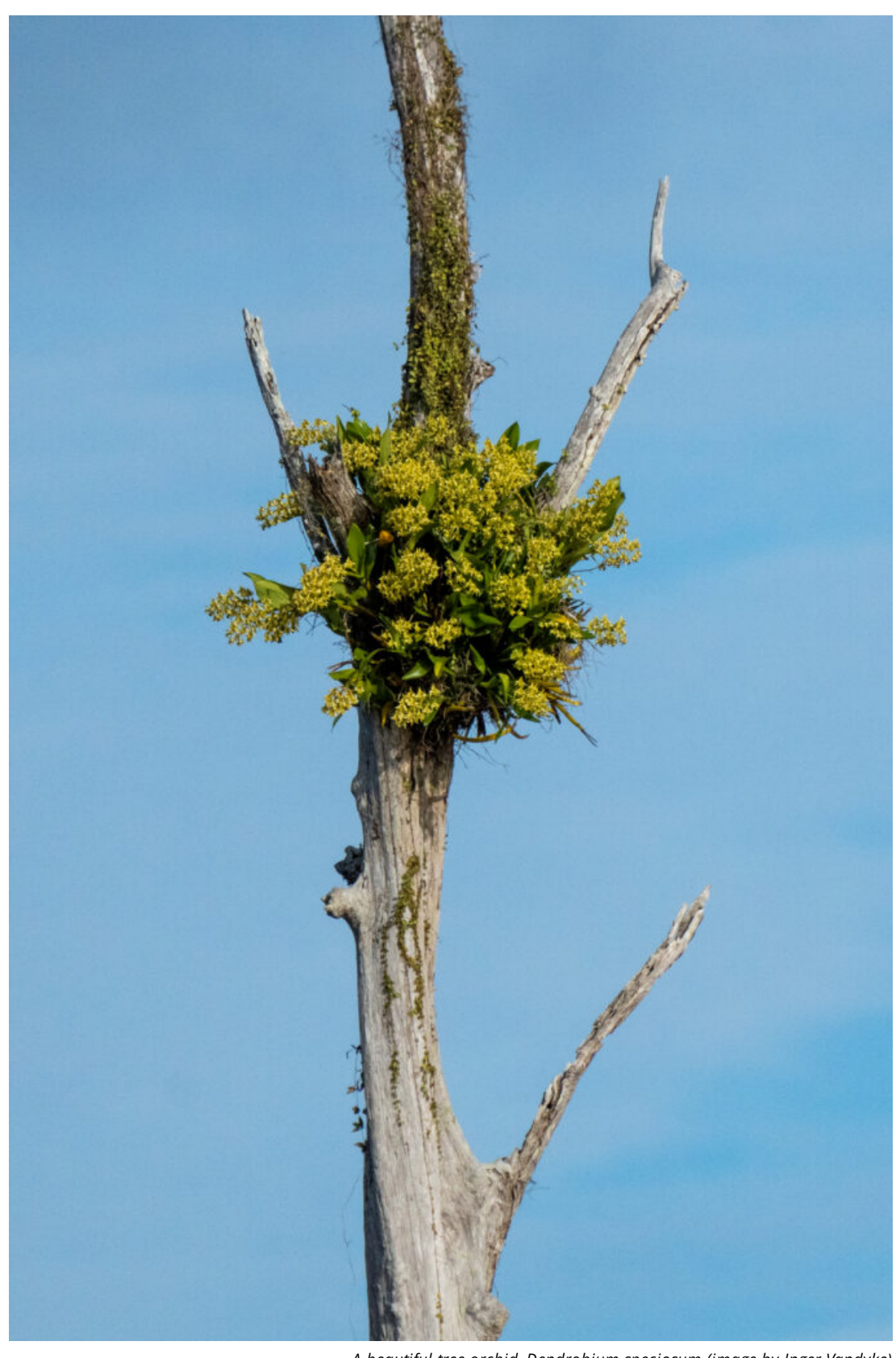
A beautiful tree orchid, Dendrobium speciosum