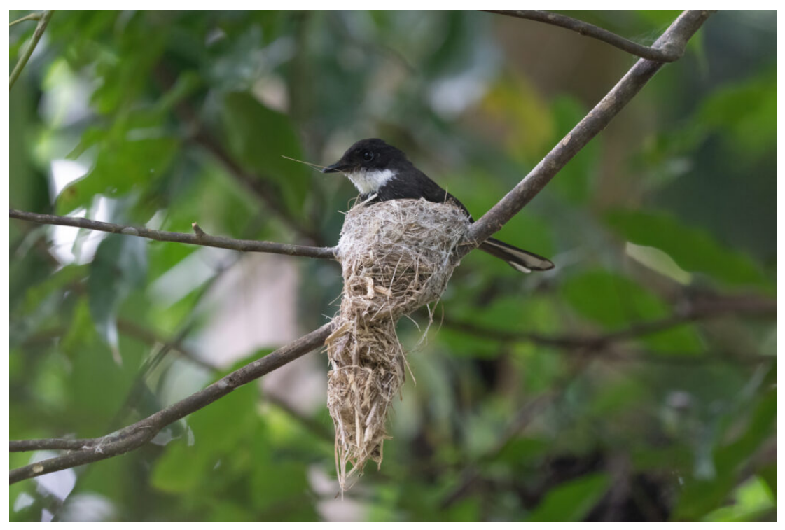
The endemic Banda Sea Fantail