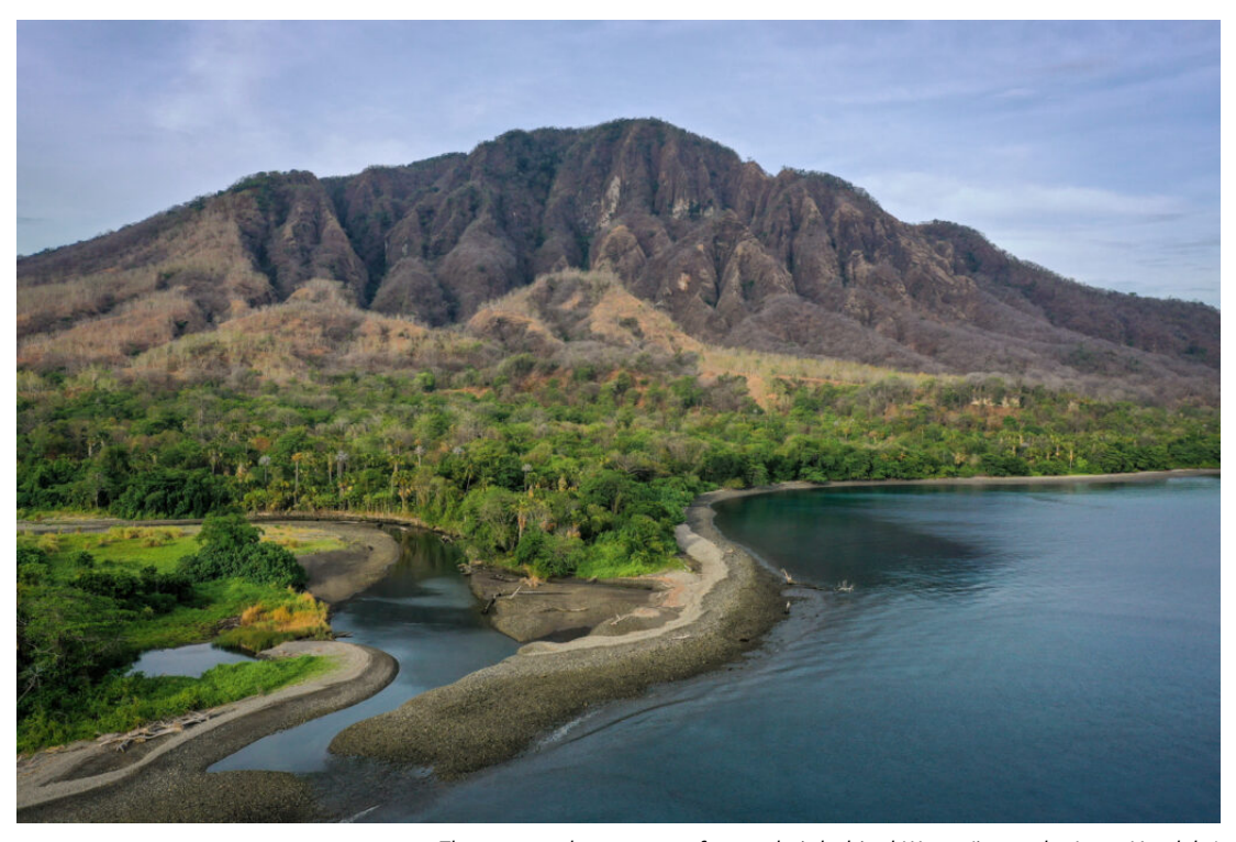
The spectacular scenery of sparsely-inhabited Wetar