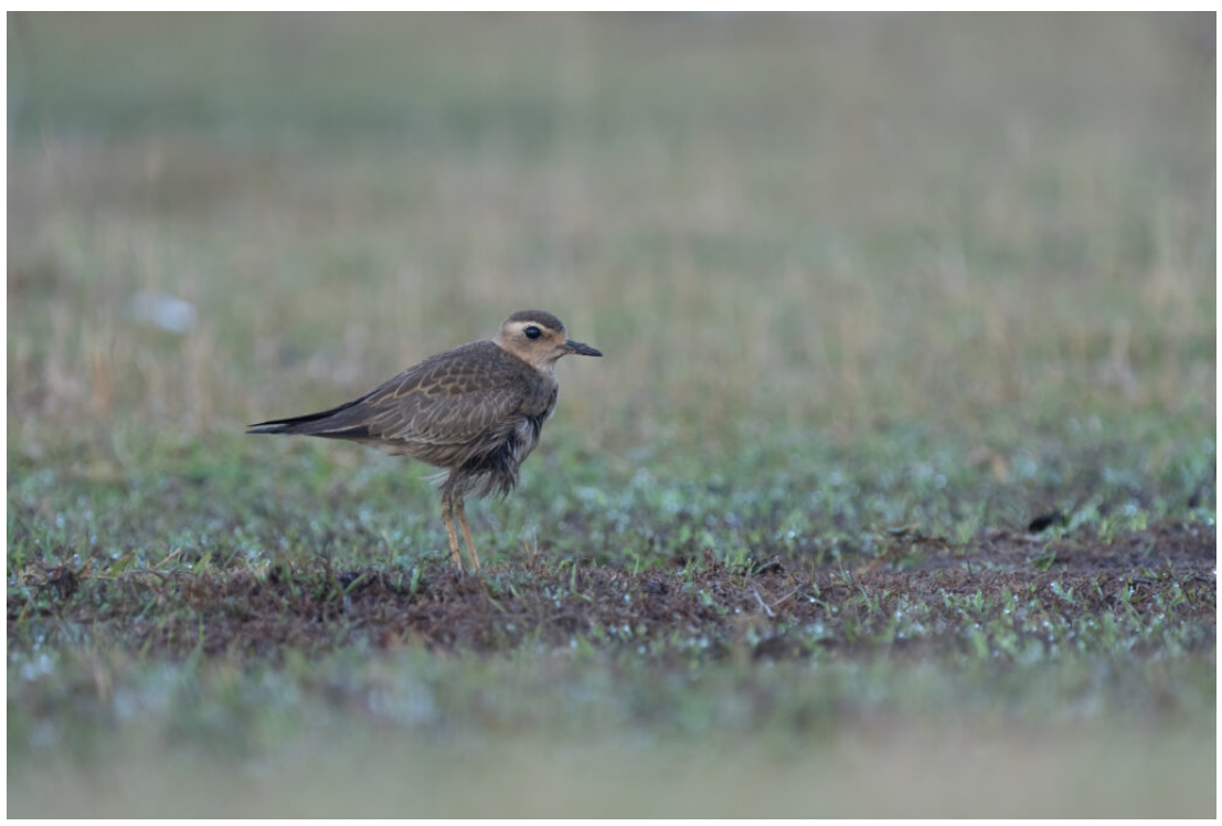
An Oriental Plover pauses on migration to Australia