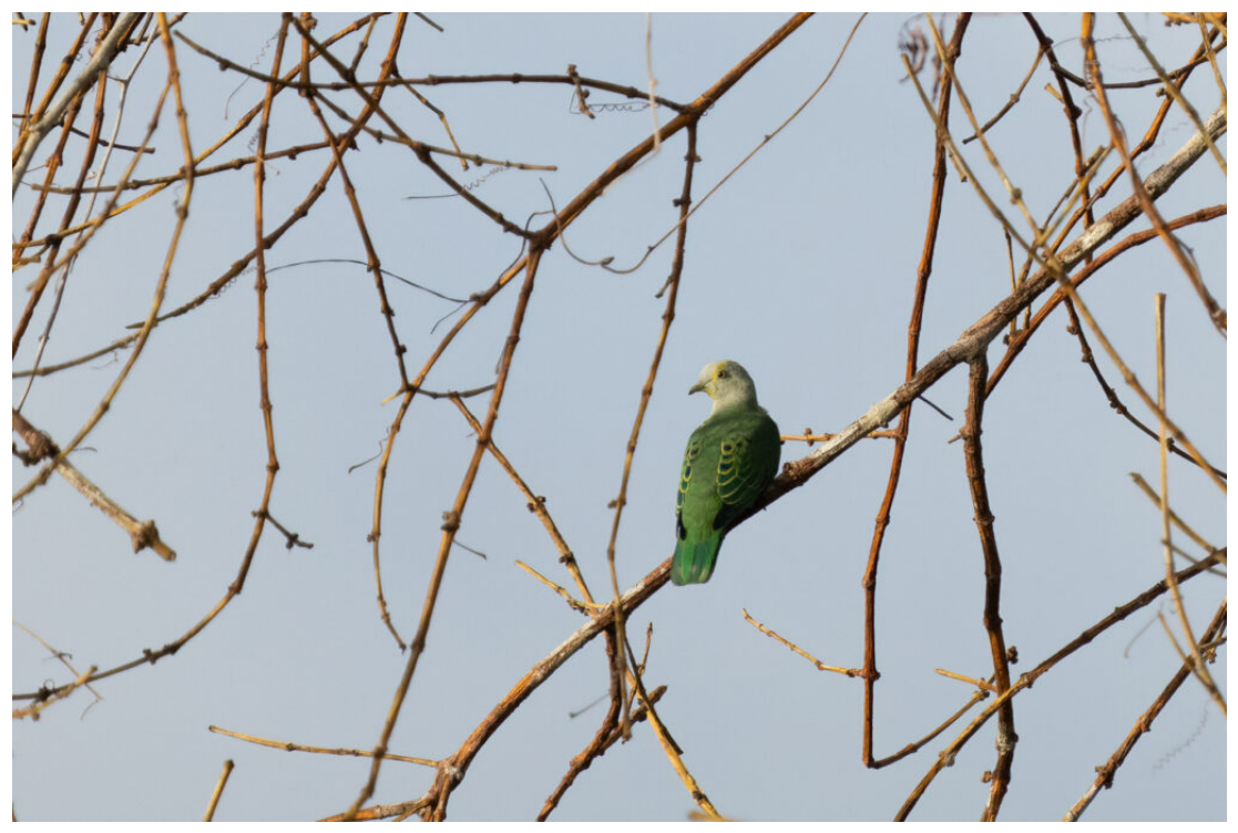
Some of the Banda Sea forms of Rose-crowned Fruit Dove, like xanthogaster, lack a rosy crown!