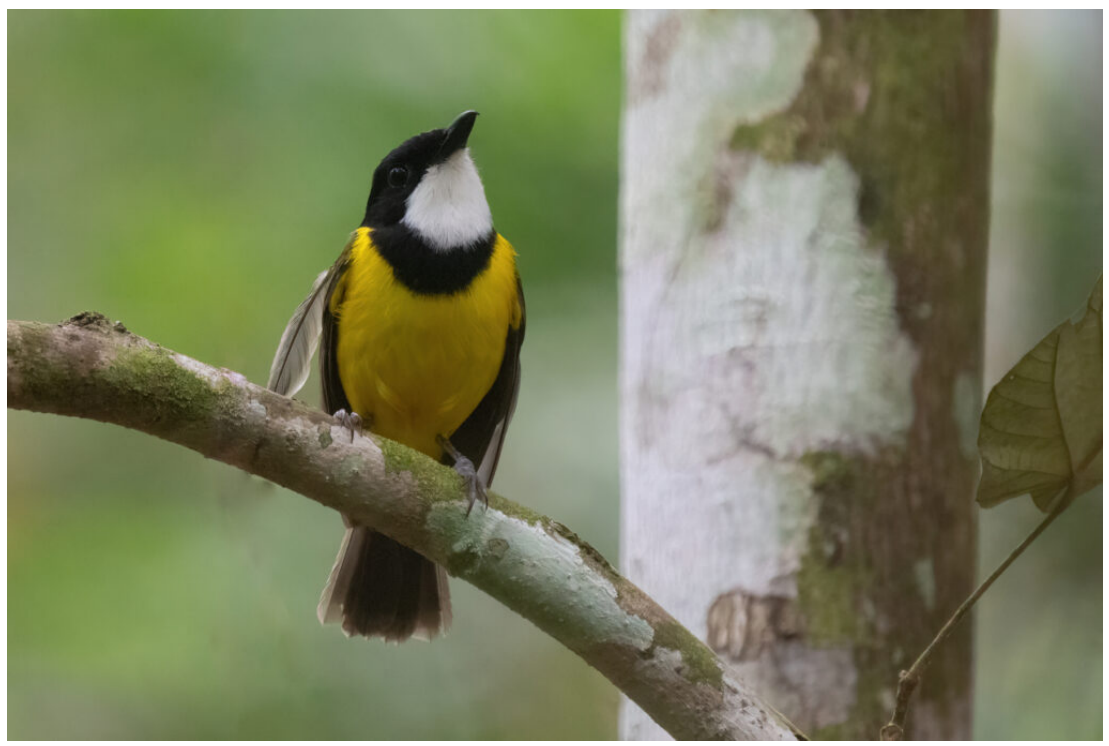
A male 'Damar Whistler'