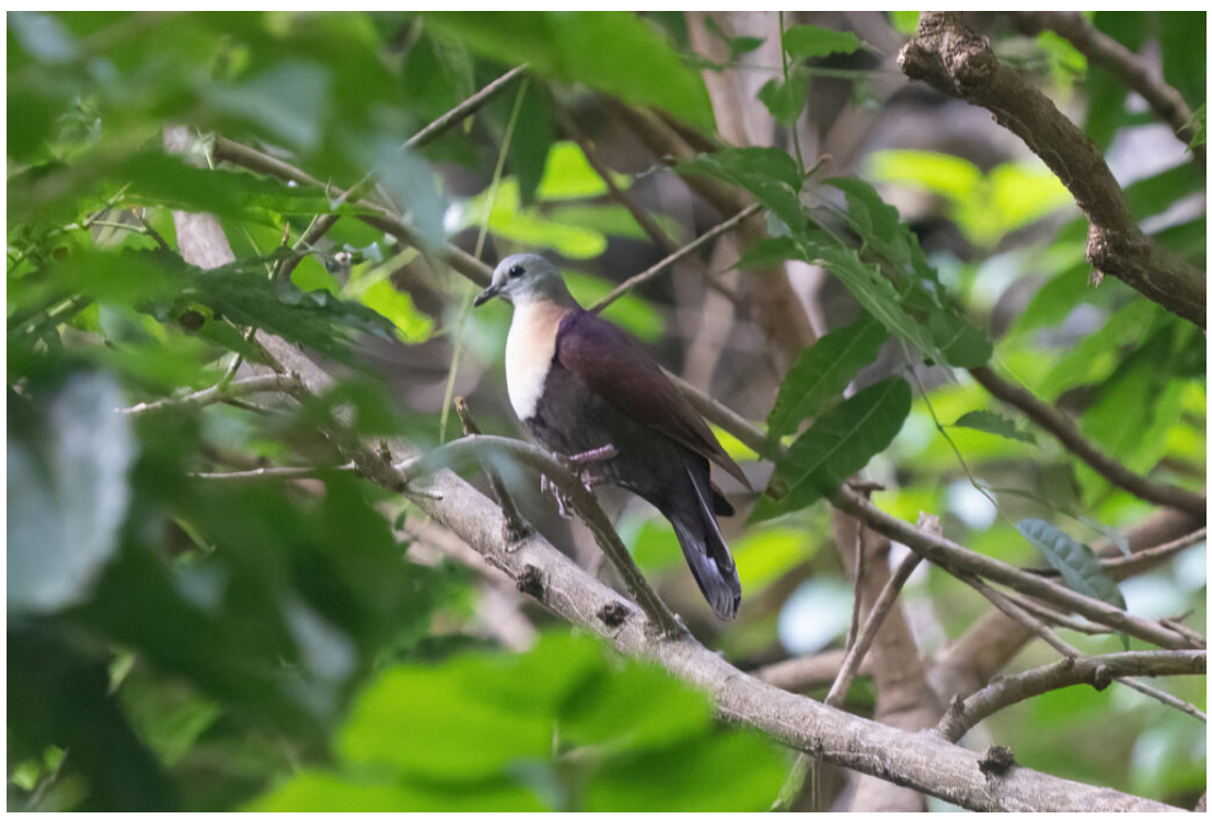
The retiring, near-endemic Wetar Ground Dove, one of the most sought-after specialities