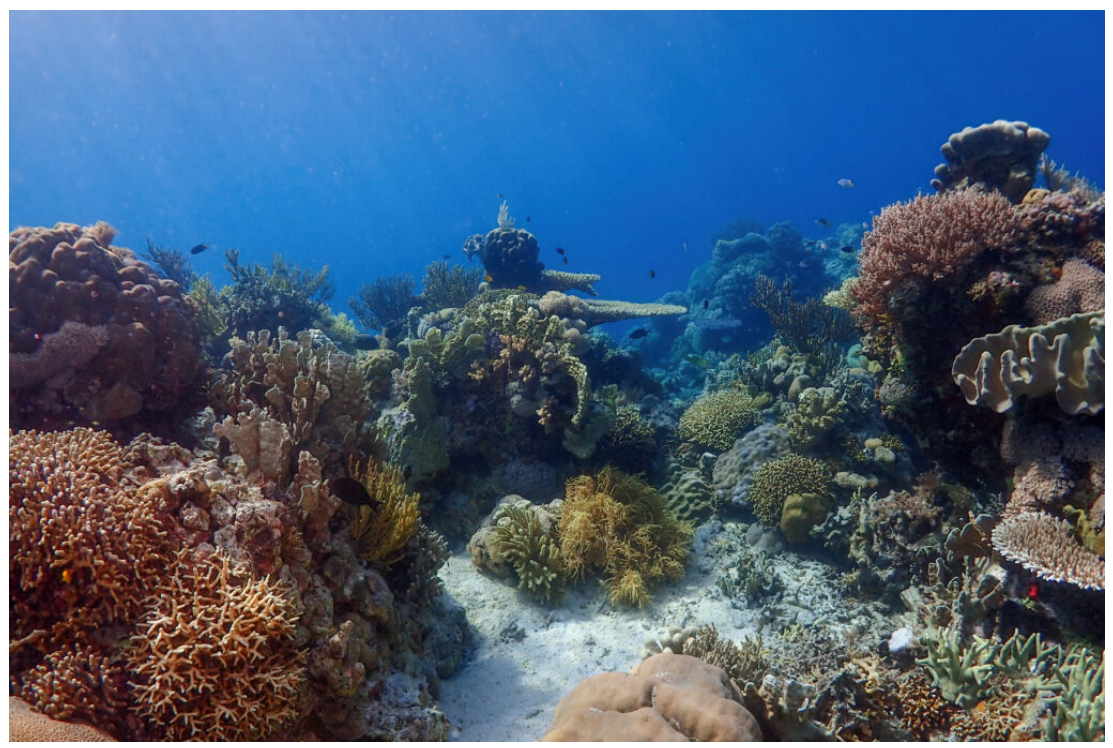
The coral reefs of the Banda Sea are legendary!