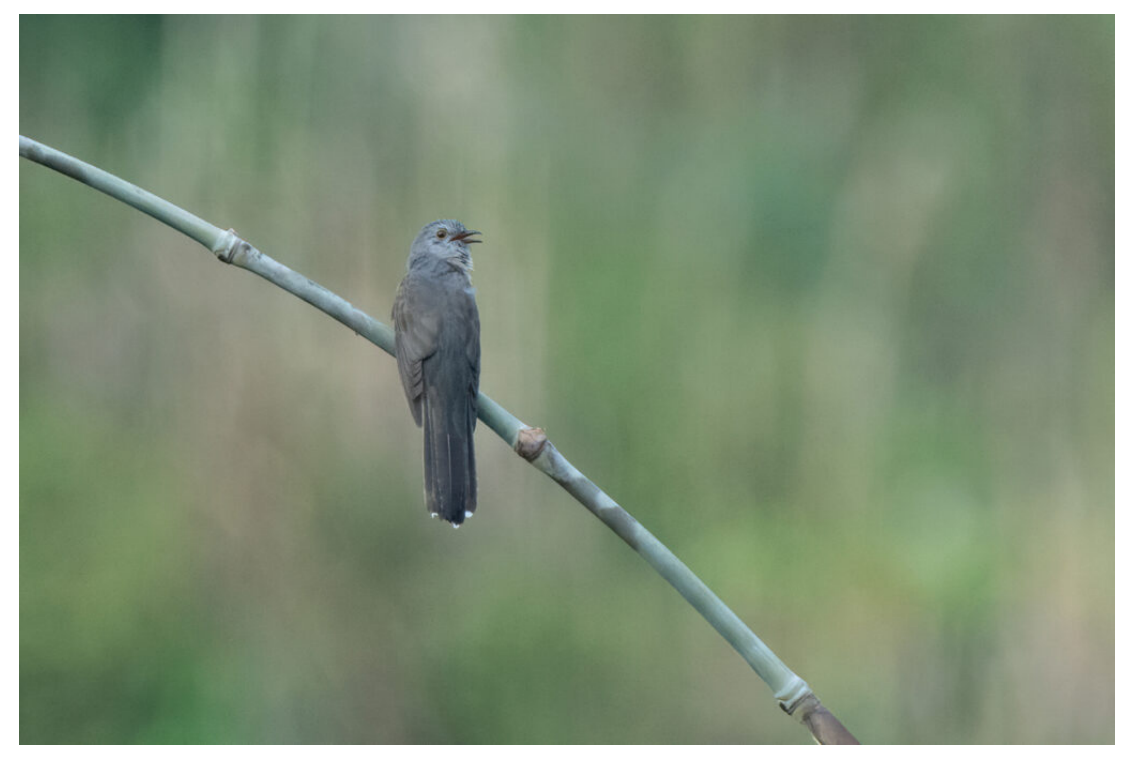
Rusty-breasted Cuckoo