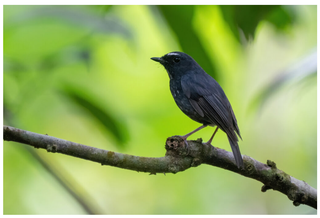
The delightful little endemic Damar Flycatcher, lost to science for a century