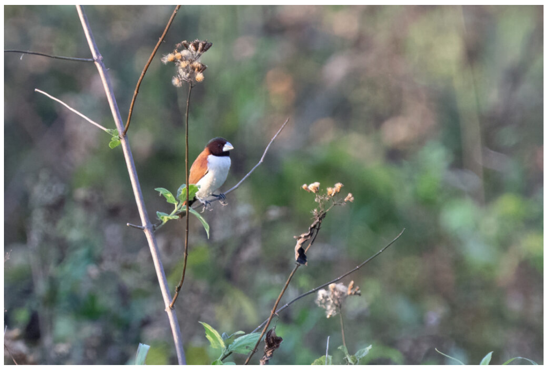
Five-coloured Munia (image by Inger Vandyke)