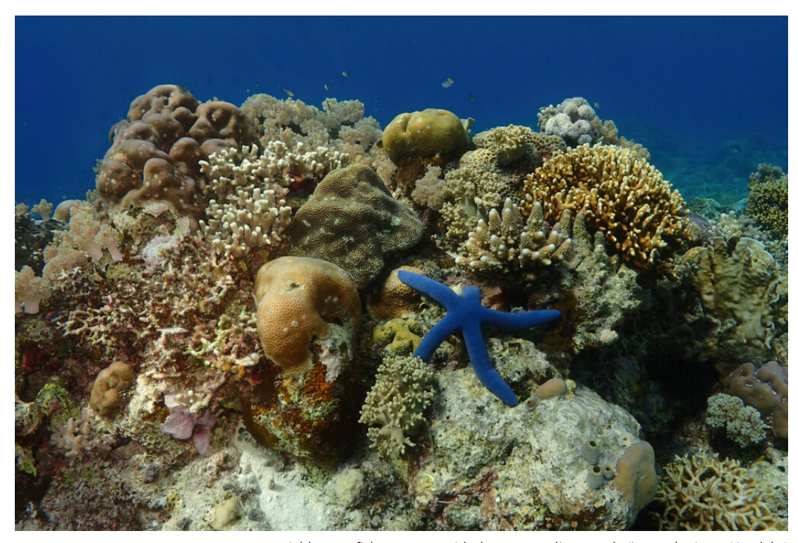
A blue starfish contrasts with the surrounding corals