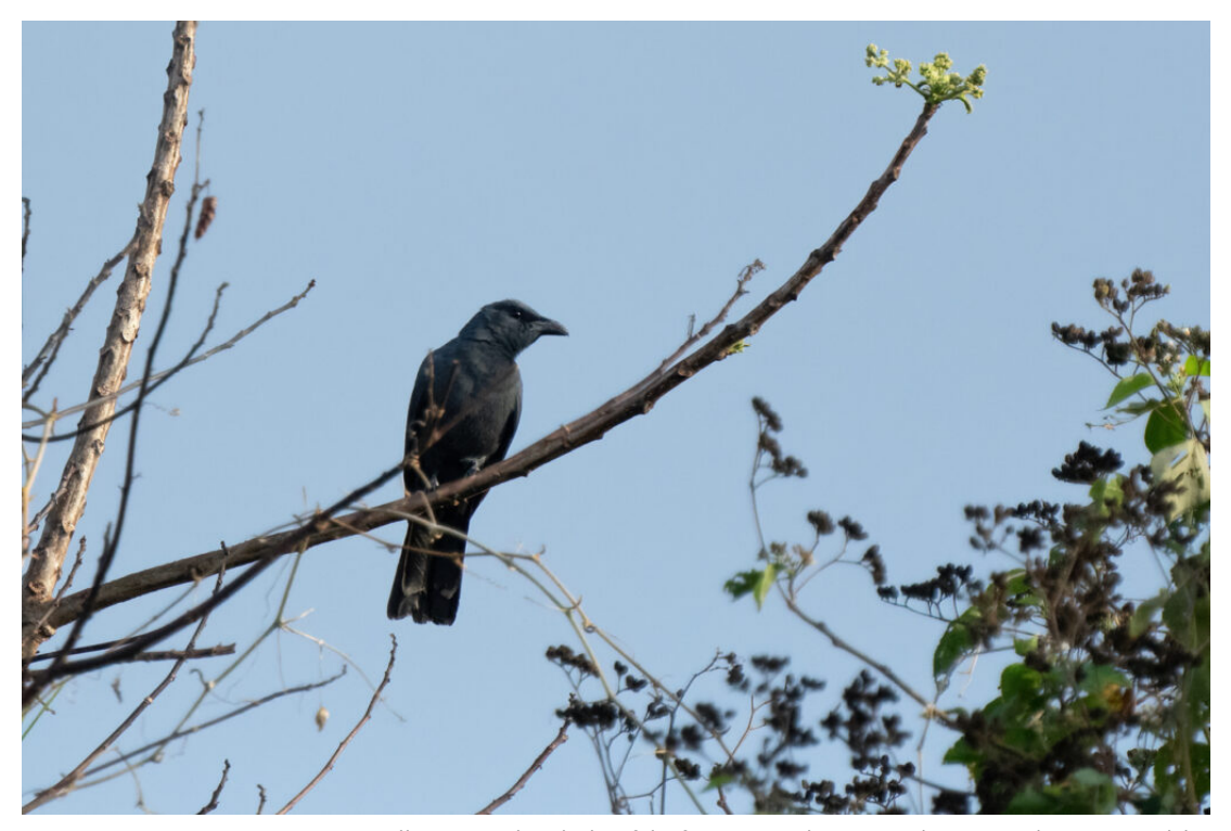
Wallacean Cuckooshrike of the form unimoda in Tanimbar