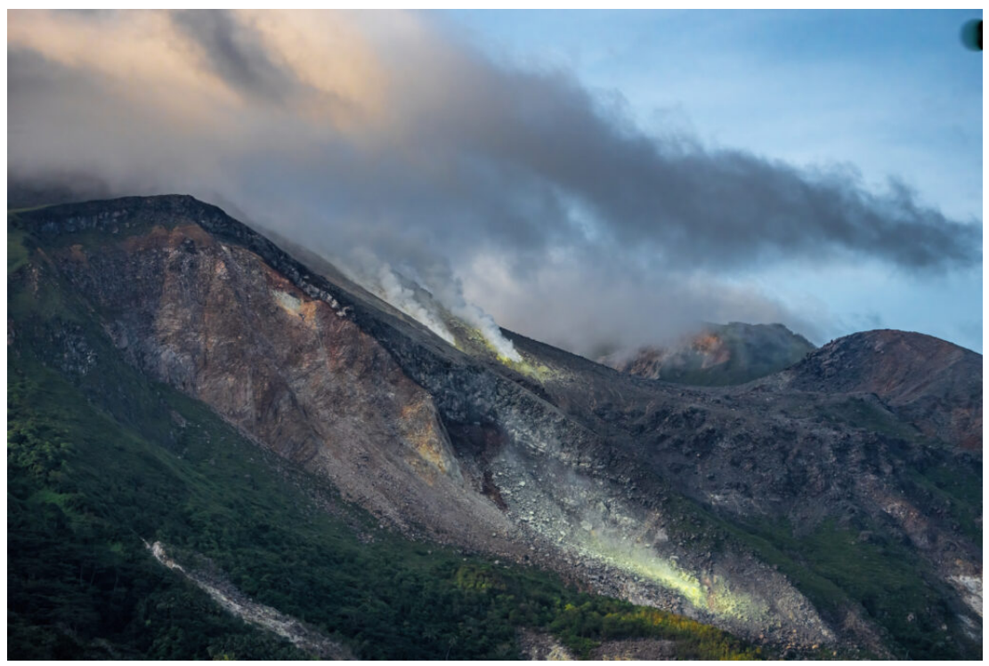
The active volcano on remote Damar in the Banda Sea