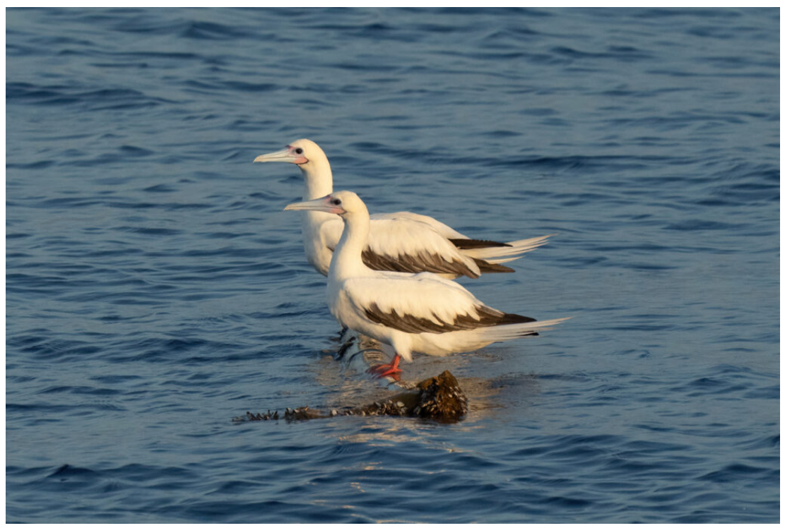
Red-footed Boobies taking a rest on some flotsam