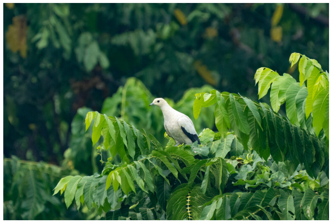
Pied Imperial Pigeon