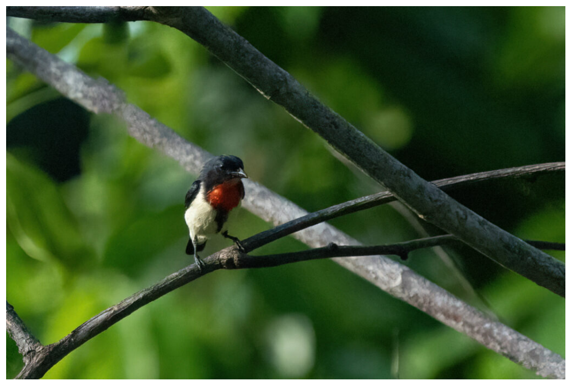
Blue-cheeked (or Red-chested) Flowerpecker of the nominate form