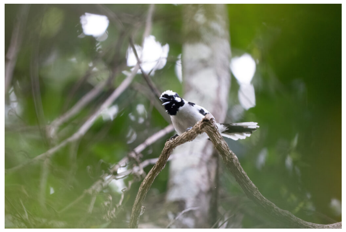
The perky endemic Tanimbar Monarch