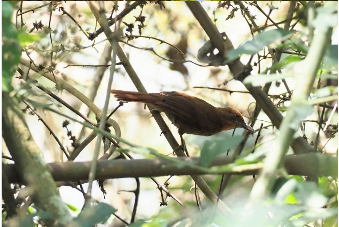
Top: Orange-fronted Pushcrown