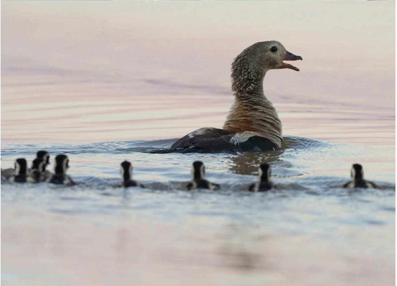
Top: Parker's Spinetail