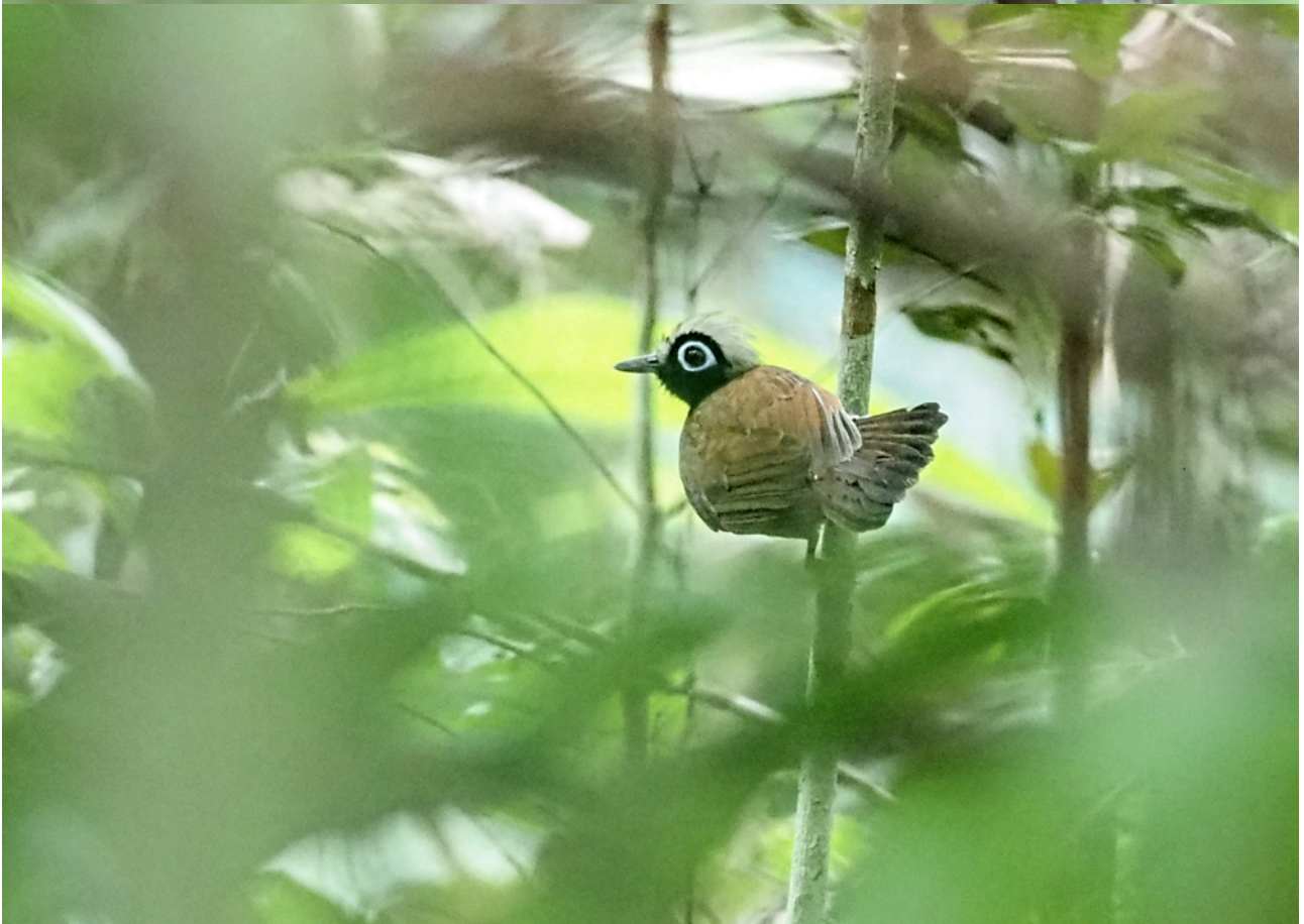
Top: White-throated Antbird – male