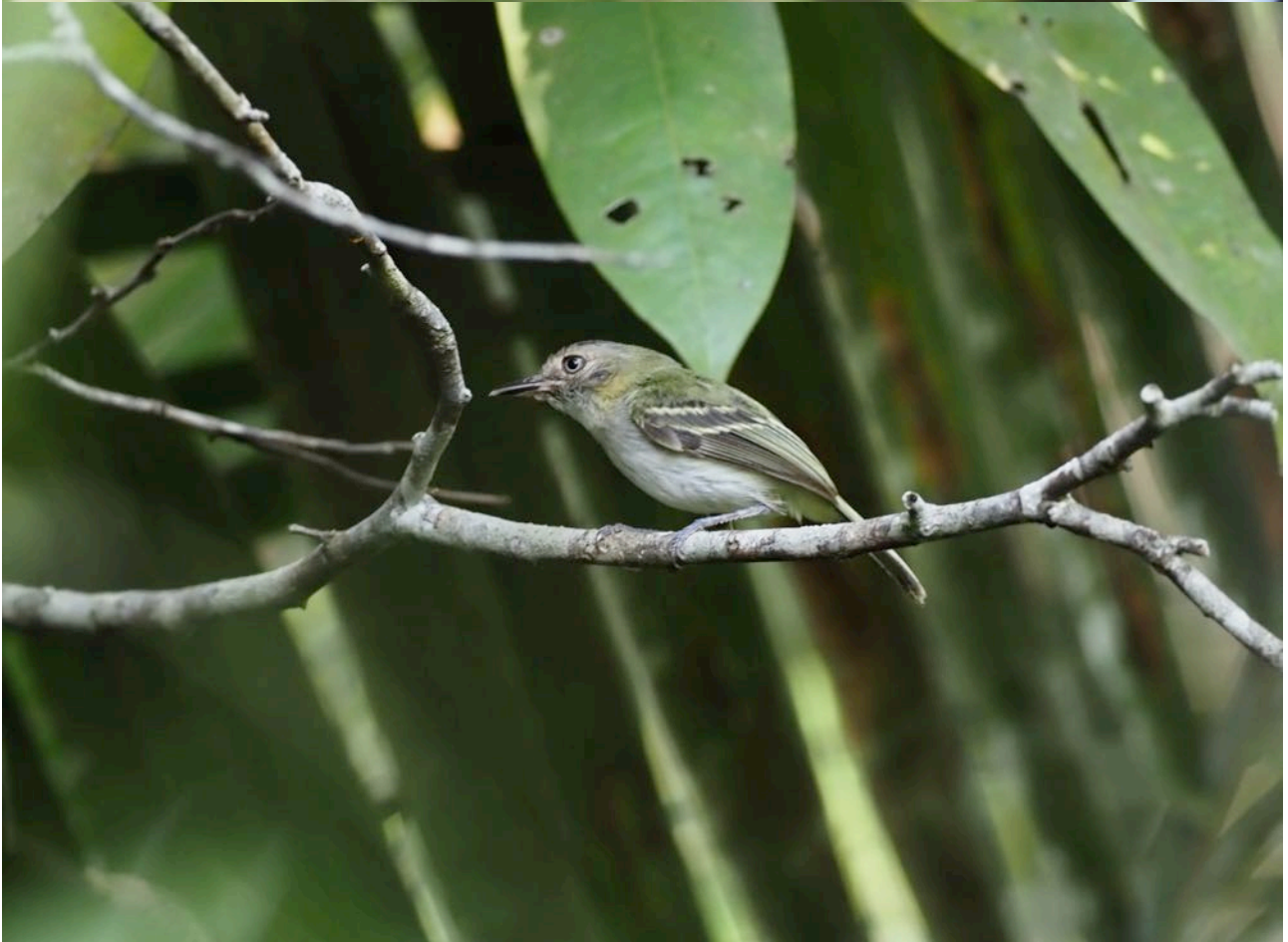
Top: Flame-crested Manakin – male