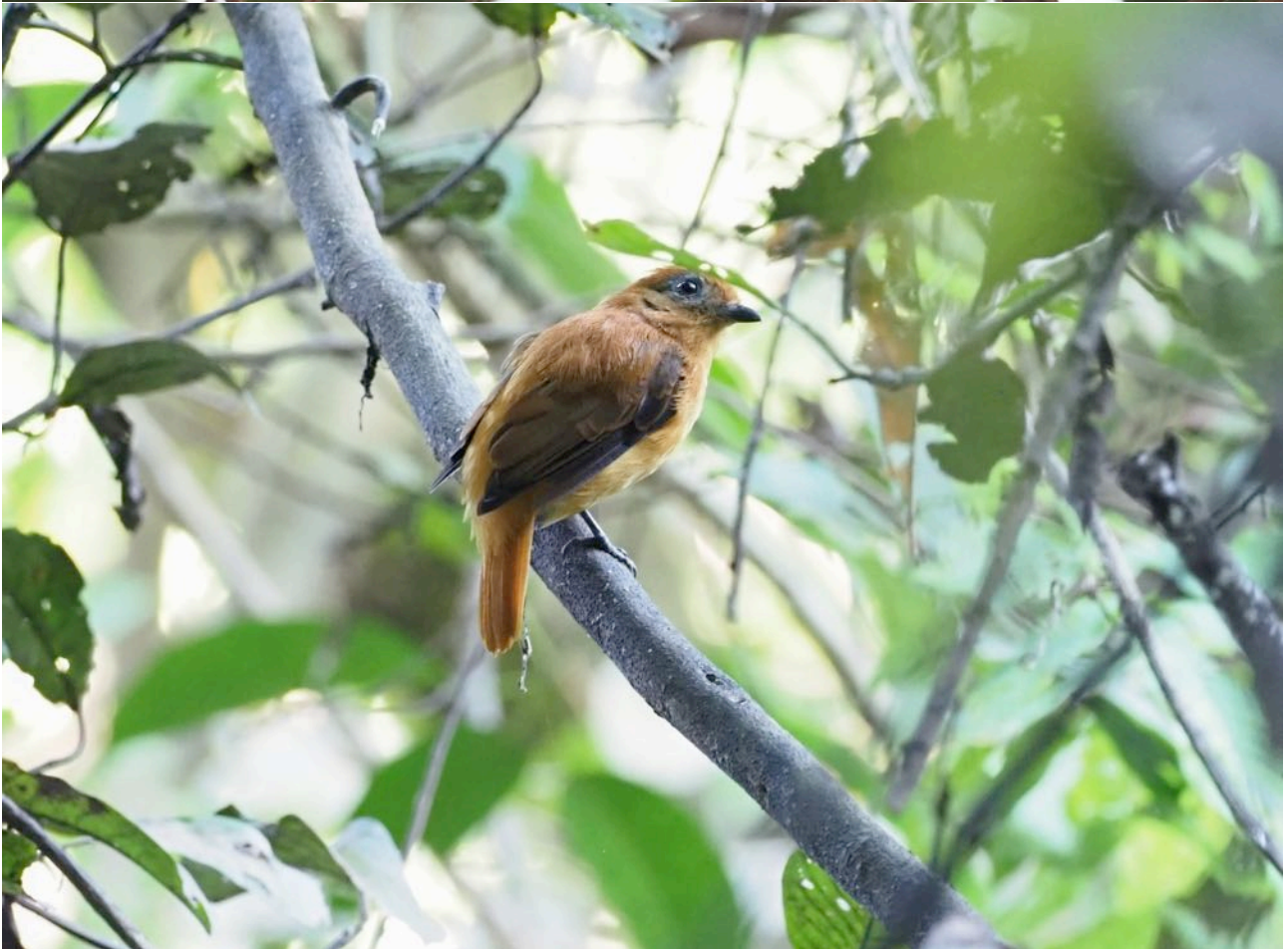
Top: Plain Softtail