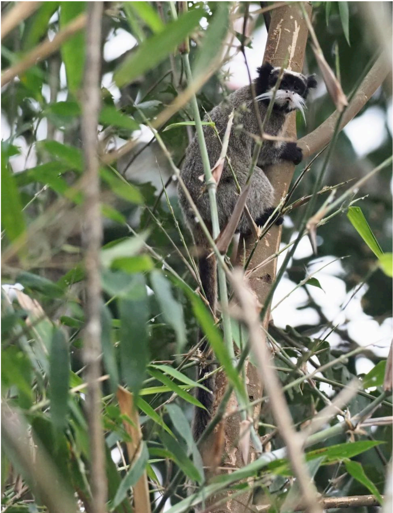
Emperor Tamarin