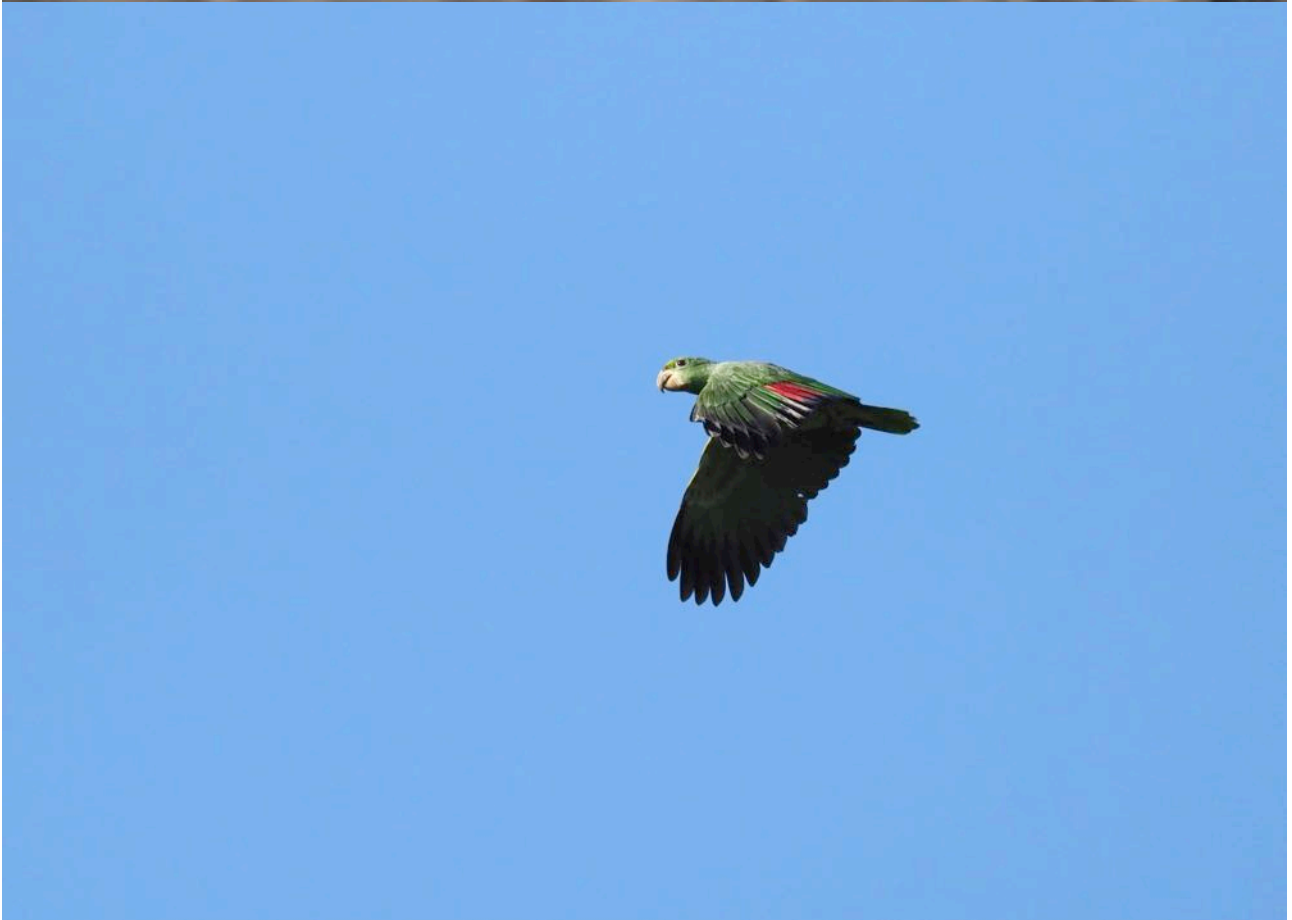
Top: Sand-colored Nighthawk