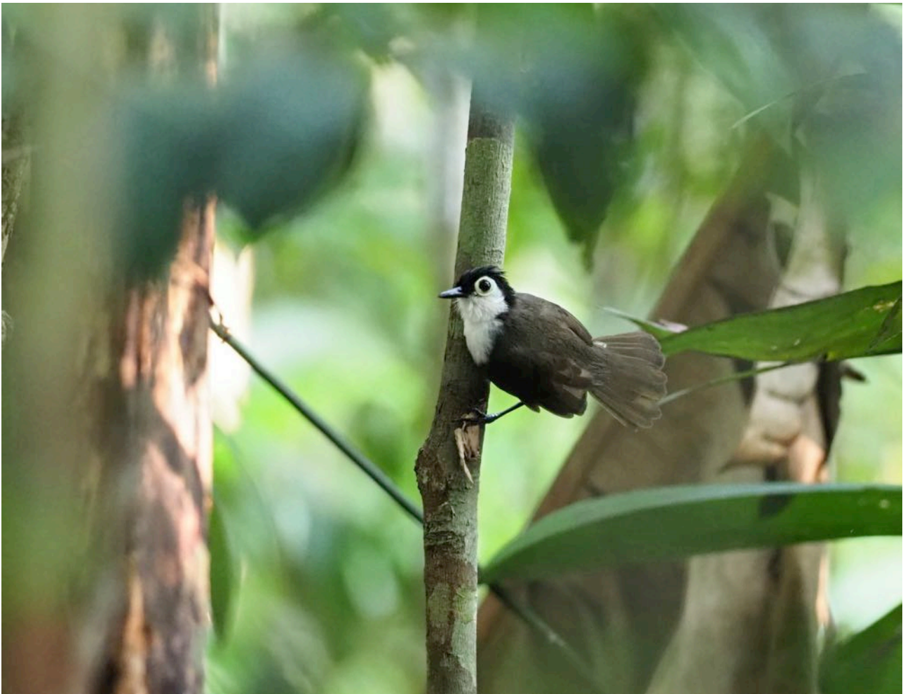
White-breasted Antbird - male

Jul 9 th . For this day of birding near Porto Velho, we crossed the Rio Madeira to its left bank (Inambari) to explore the road Linha C30, a site with good terra firme and campinarana forests. There we started with a nice stop in terra firme which gave us species like Peruvian Warbling Antbird, Curl-crested and Brown-madibled Aracaris, Humaita and Sooty Antbirds, Snethlage's Tody-Tyrant ( pallens ), Gilded Barbet, Long-tailed Woodcreeper, Chestnut-winged Foliage-gleaner and a brief flight view of White-bellied Parrot. Later in Campinarana we saw Bronzy Jacamar, Predicted Antwren and Green-tailed Goldenthrout. By late morning, we covered more terra firme along a side trail where we saw Blue-crowned Manakin, Black Antbird, Grey Antwren and Mouse-colored Antshrike. In the afternoon, we were back to C30, in campinarana to enjoy incredible sightings of Azure-naped (Campina) Jay, a group of about six birds feeding and behaving calmly on the roadside. At the same place, we had a brief look at a Pale-bellied Mourner as well. To finish the day we got nice views of two Brown-banded Puffbird and Blackish and Spot-tailed Nightjars.