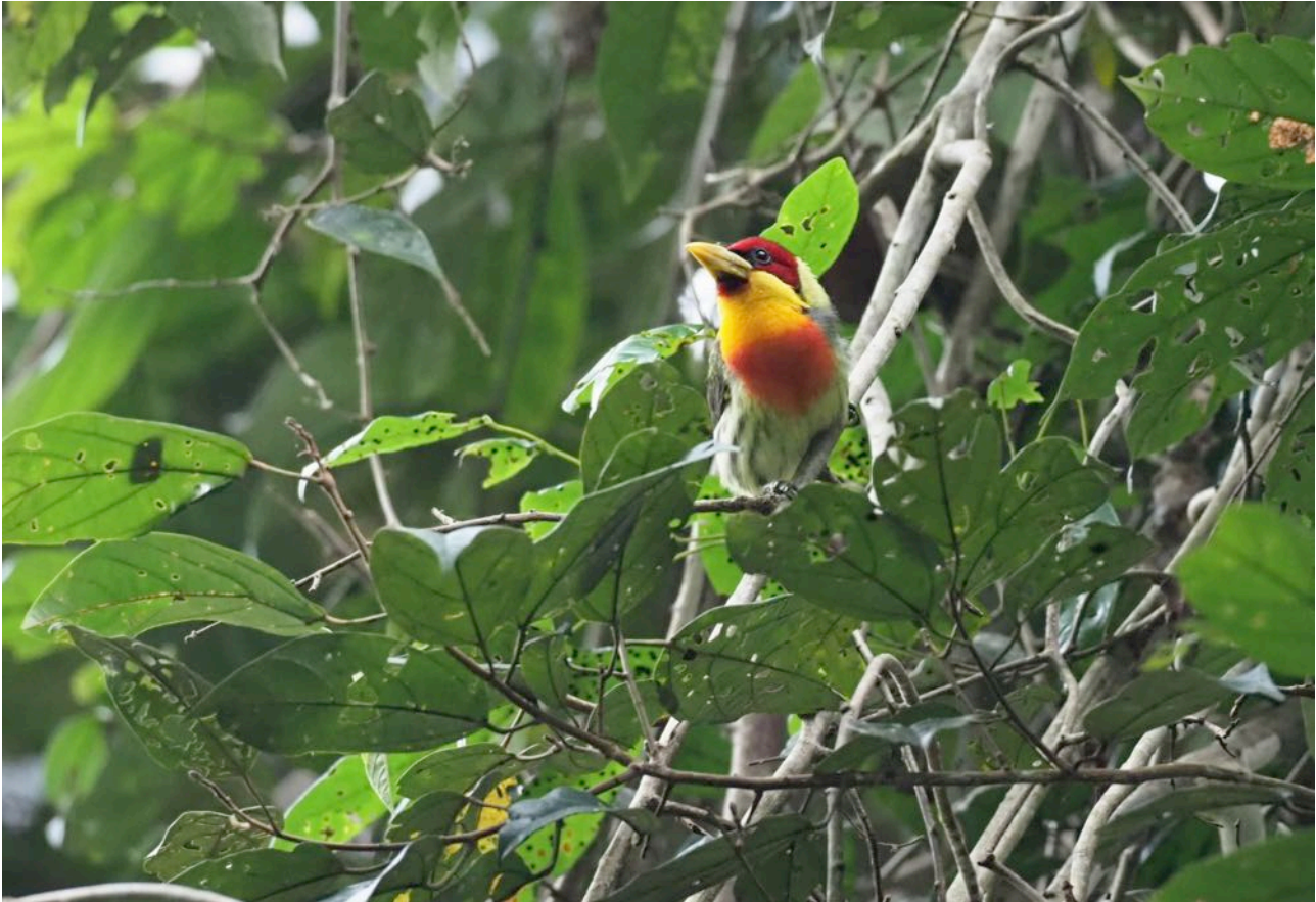
Lemon-throated Barbet - male