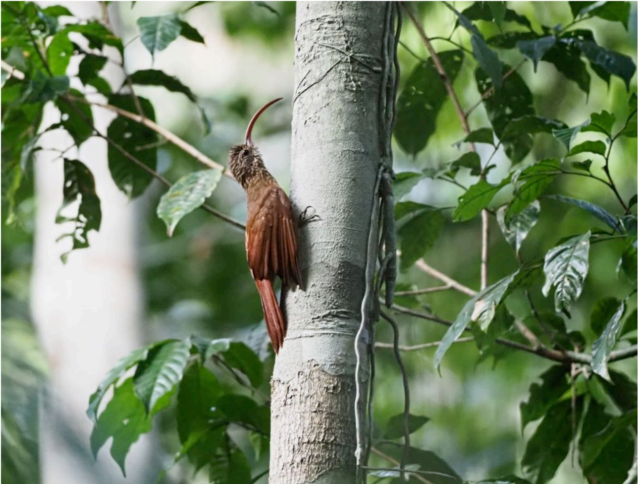
Curve-billed Scythebill – probatus (Eduardo Patrial)