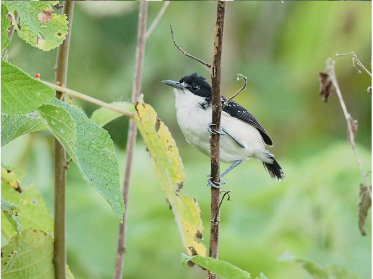
Top: Rondonia Bushbird – male