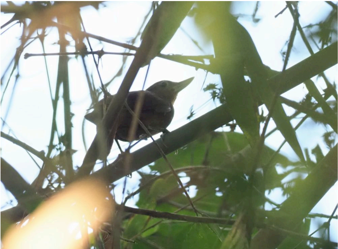
Peruvian Recurvebill