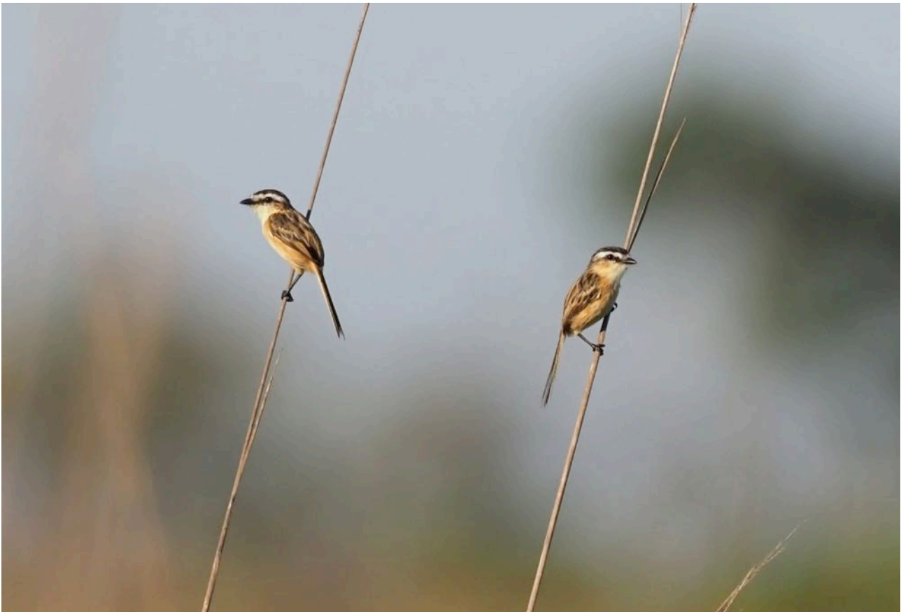
Sharp-tailed Grass Tyrant