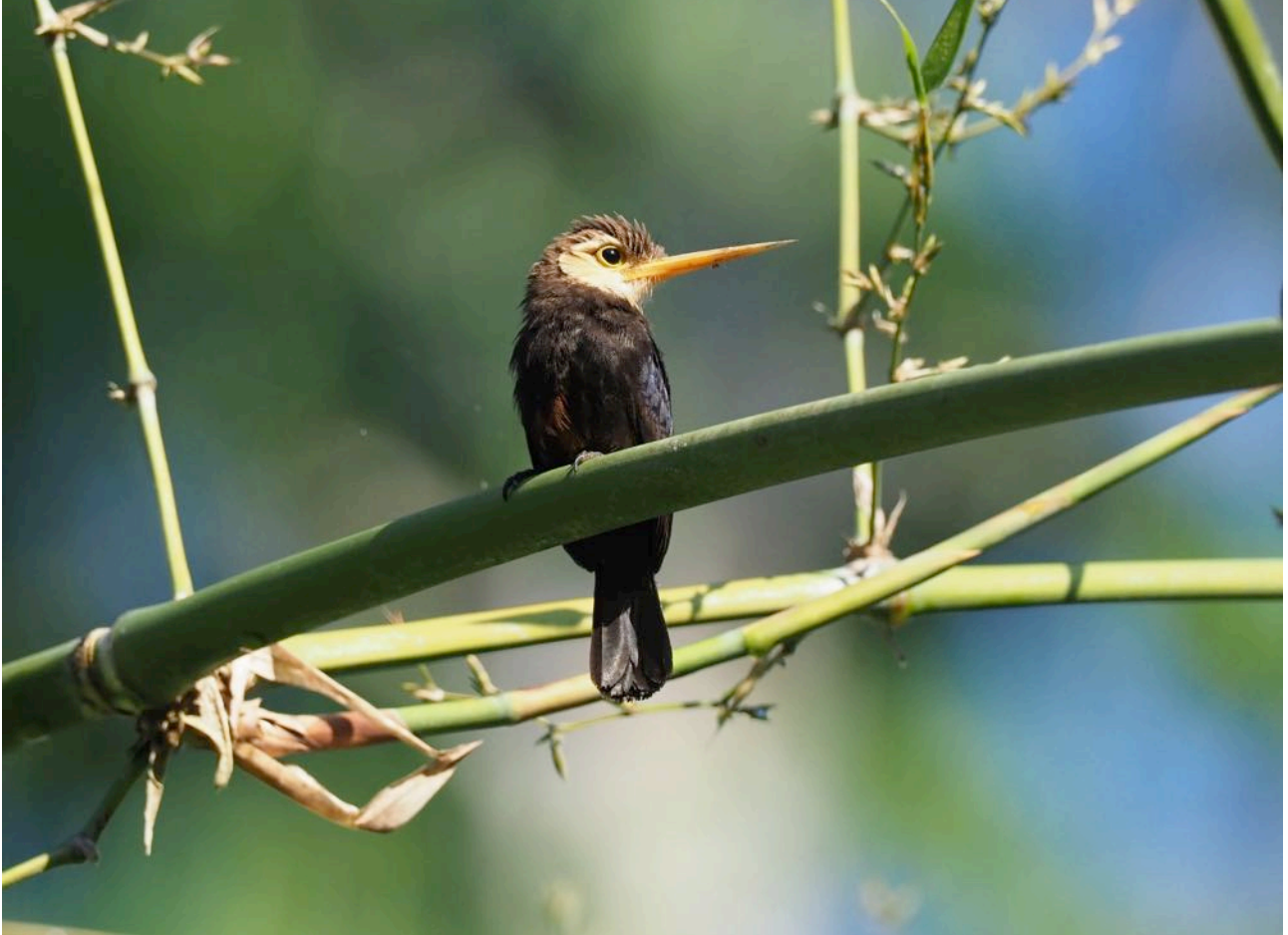
Top: Black-faced Cotinga