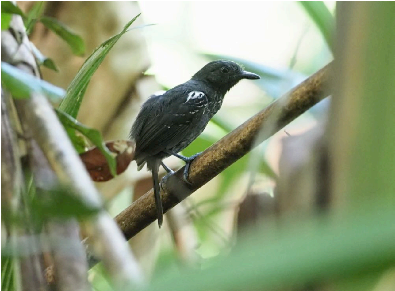
Black Antbird – male (Eduardo Patrial)