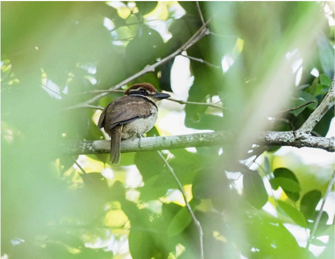
Chestnut-capped Puffbird