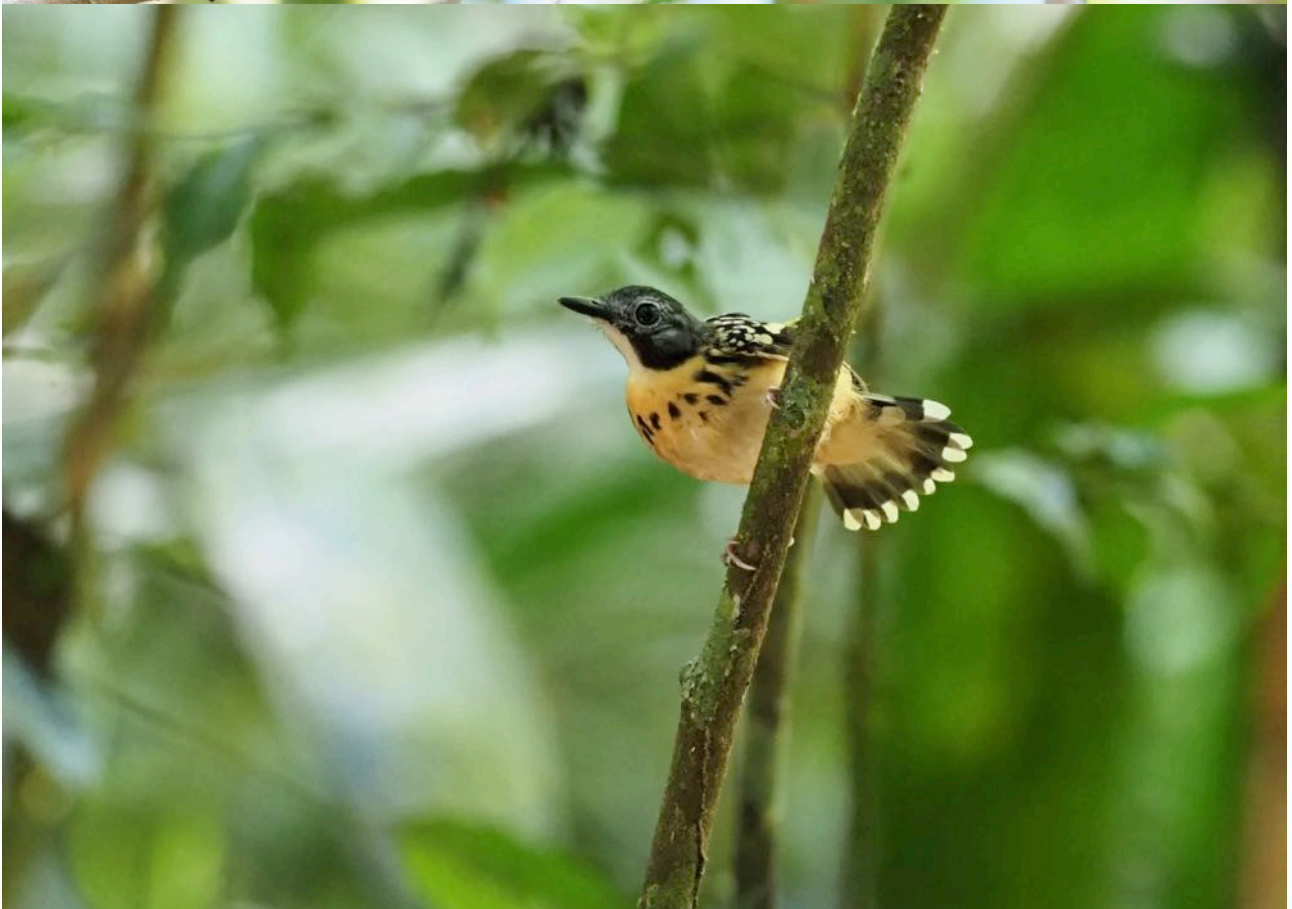
Top: Glossy Antshrike – male