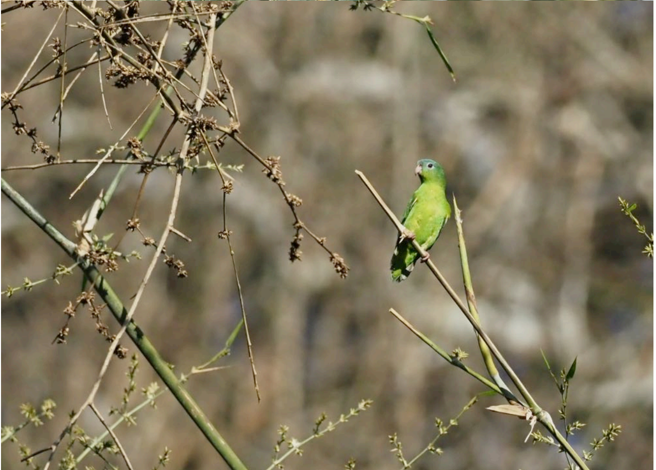
Top: Rufous-headed Woodpecker