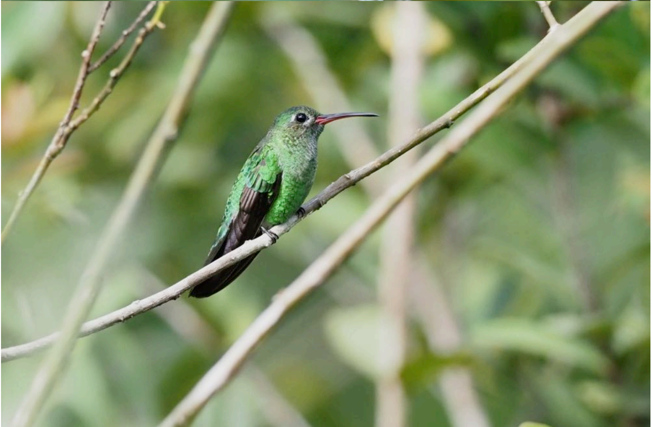
Top: Azure-naped (Campina) Jay