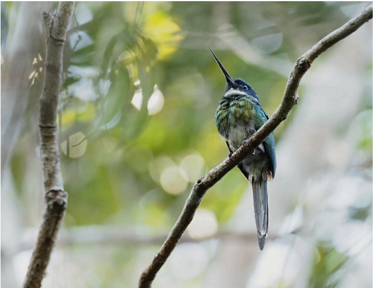
Bronzy Jacamar