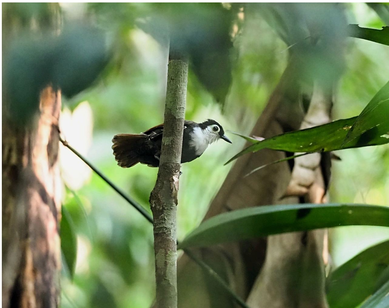
Antbirds! No other trip provides the number and the quality from this incredible family from the Neotropics. Here the Brazilian endemic White-breasted Antbird