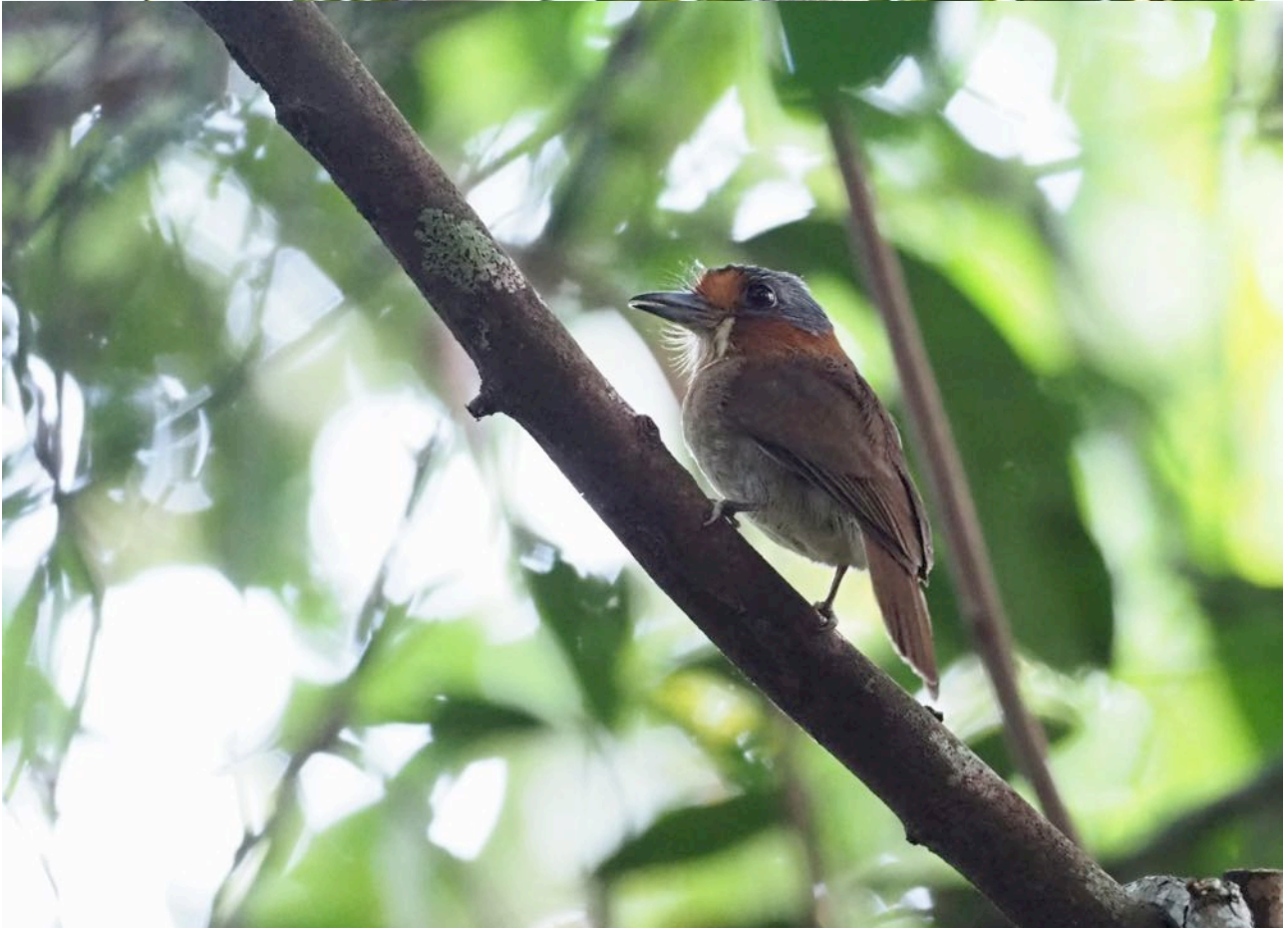
Top: Hoffmann's Woodcreeper