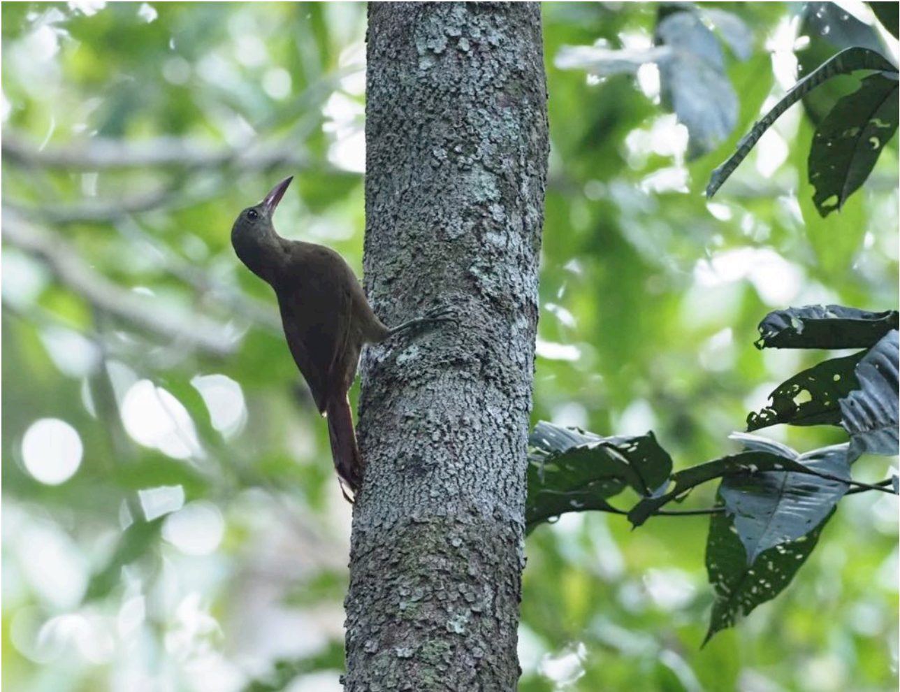
Uniform Woodcreeper (Eduardo Patrial)

Yellow-billed Nunbird ♦ Monasa flavirostris Good sightings at Ramal do Noca. Swallow-winged Puffbird Chelidoptera tenebrosa Common and frequent along the tour. Black-girdled Barbet ♦ Capito dayi A lovely pair seen well in Tabajara. Gilded Barbet Capito auratus Great views of a pair at Ramal C30, heard at more places.