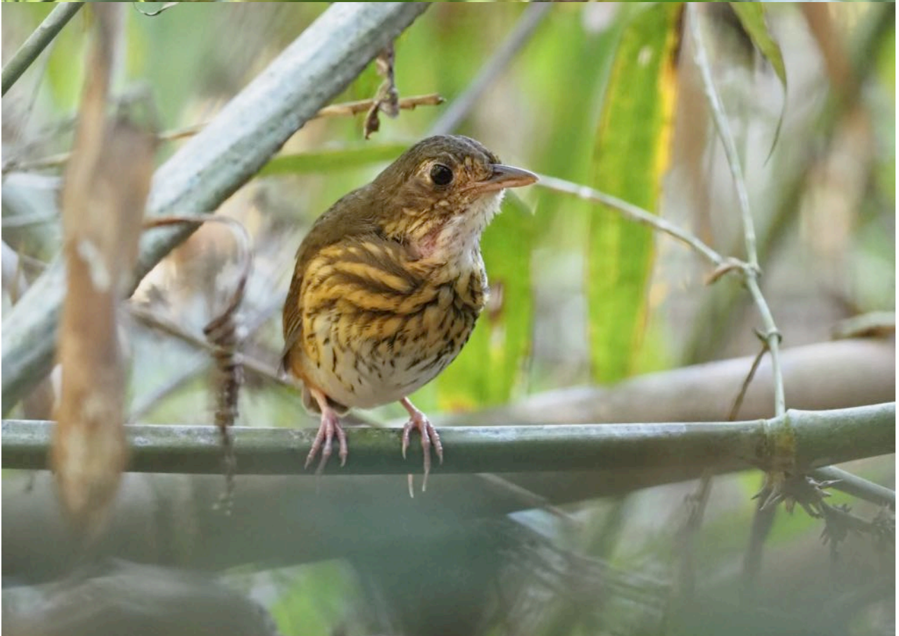
Top: Goeldi's Antbird – male