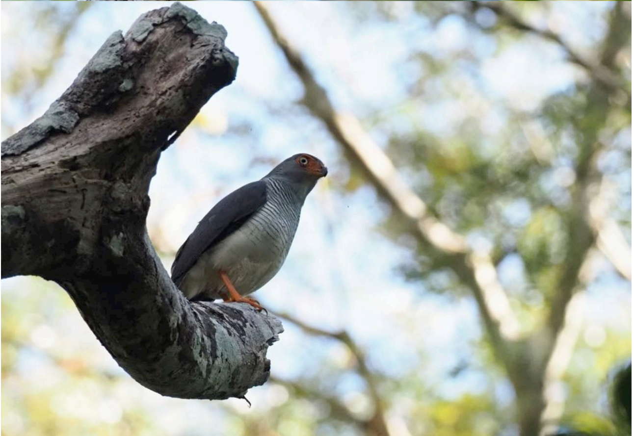
Top: Slate-colored Hawk