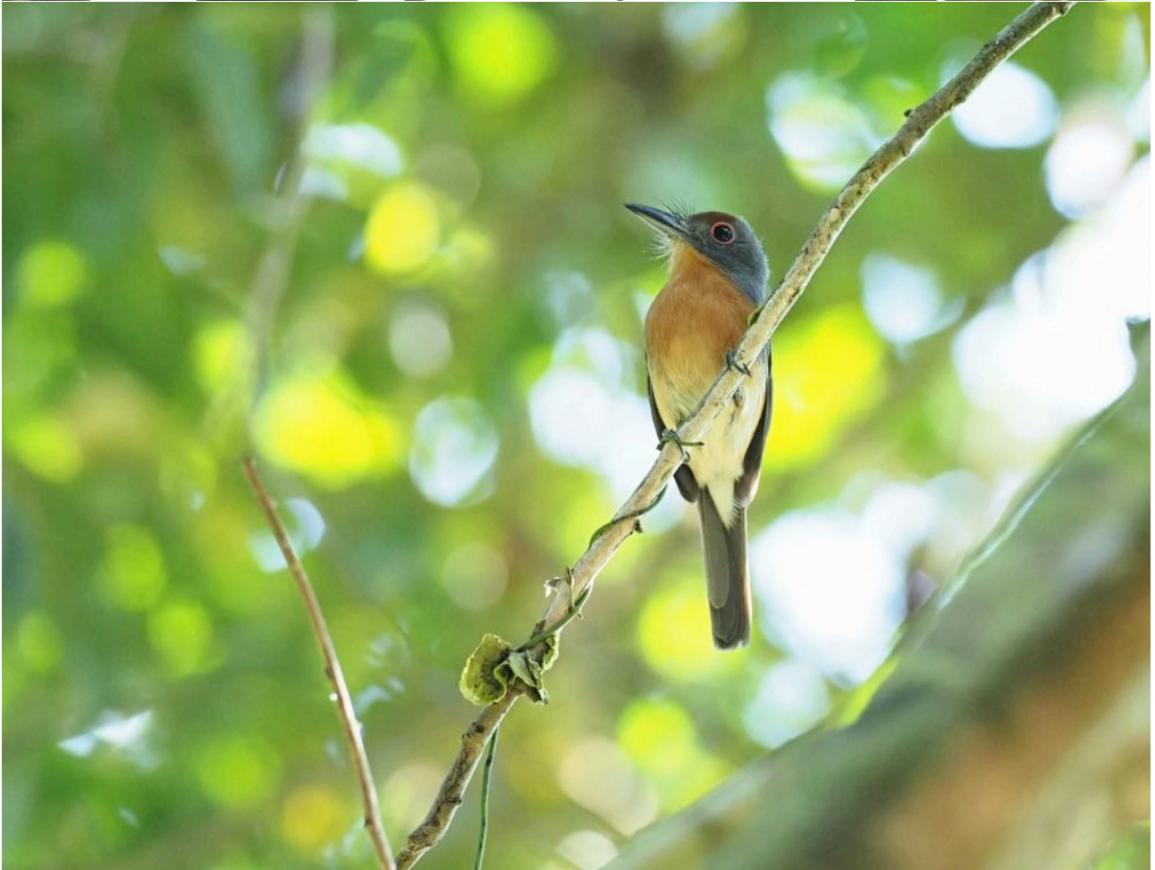
Top: Black-throated Toucanet