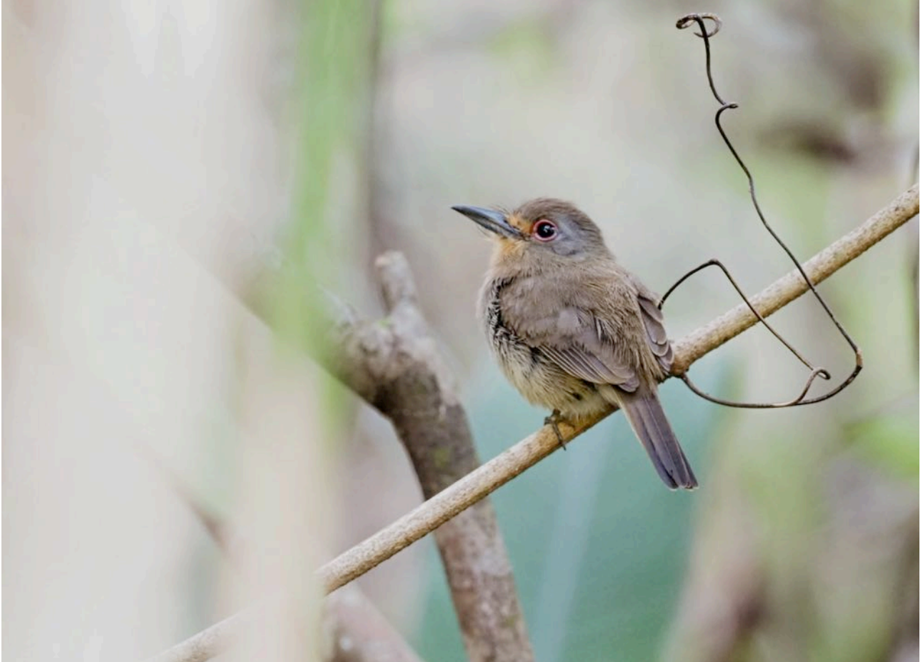
Top: Bar-bellied Woodcreeper