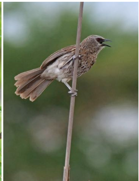
Arrow-marked Babbler (left) at Machile River and Hartlaub's Babbler (right) at Nkanga. (Nik Borrow)

Southern Yellow White-eye (African Y W) Zosterops anderssoni A pair seen near Lusaka airport. Southern Hyliota Hyliota australis Small numbers seen well at Nkanga. Common Myna (Introduced) Acridotheres tristis Seen in Livingstone. Wattled Starling Creatophora cinerea 6+ at Nkanga. Miombo Blue-eared Starling (Southern B-e S) Lamprotornis elisabeth Numerous at Nkanga. Meves's Starling Lamprotornis mevesii Common in the Machile area and seen again in the Kafue River area. Burchell's Starling Lamprotornis australis Small numbers in the Machile area. Violet-backed Starling Cinnyricinclus leucogaster Widespread sightings throughout. Red-winged Starling Onychognathus morio Common at Victoria Falls. Red-billed Oxpecker Buphagus erythrorhynchus Small numbers seen in the Machile area. Kurrichane Thrush Turdus libonyana Small numbers at Nkanga. Bearded Scrub Robin Cercotrichas quadrivirgata Good views at Camp Nkwazi and Kafue River. White-browed Scrub Robin Cercotrichas leucophrys Widespread sightings throughout.