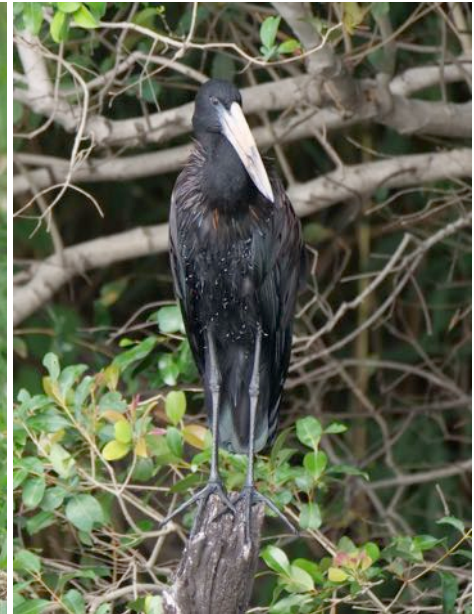
African Wattled Lapwing at Nkanga (left) and African Openbill at Nkwazi (right).