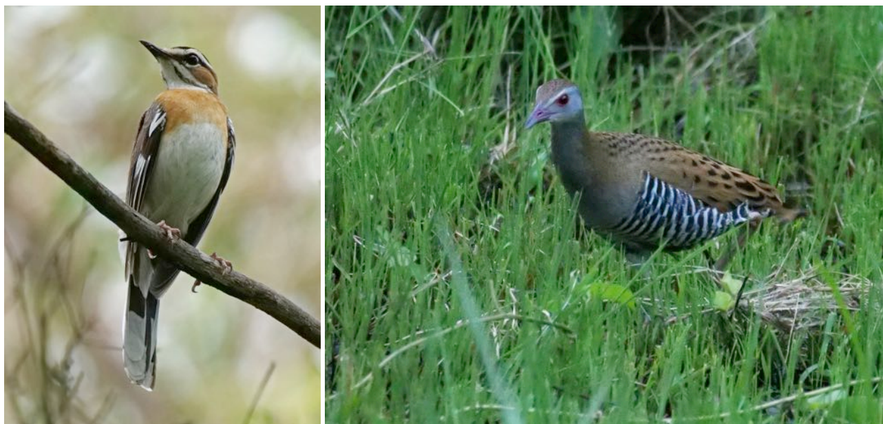
We enjoyed great views of an obliging Bearded Scrub Robin (left) in the garden of our comfortable lodge on the banks of the Zambezi River and an African Crake (right) was much more unexpected!

and the sight of millions of tons of water dropping into chasms over 100 metres deep was awe-inspiring. Rainbows arched through the fine spray before vanishing into the gorges far below us. Not only that but there were also a few birds to be seen and it was good to start the tour with some brief views of a pair of Verreaux's Eagles as well as more widespread species that included Reed Cormorant, Yellow-billed Kite, Trumpeter Hornbill, Broad-billed Roller, Chinspot Batis, Black-backed Puffback, African Paradise Flycatcher, Pied Crow, Dark-capped Bulbul, Yellow-bellied Greenbul, Terrestrial Brownbul, Rock Martin, Violet-backed and Red-winged Starlings, Collared Sunbird and Blue Waxbill before making the short journey to our pleasantly situated lodge some way upriver on the banks of the Zambezi itself.