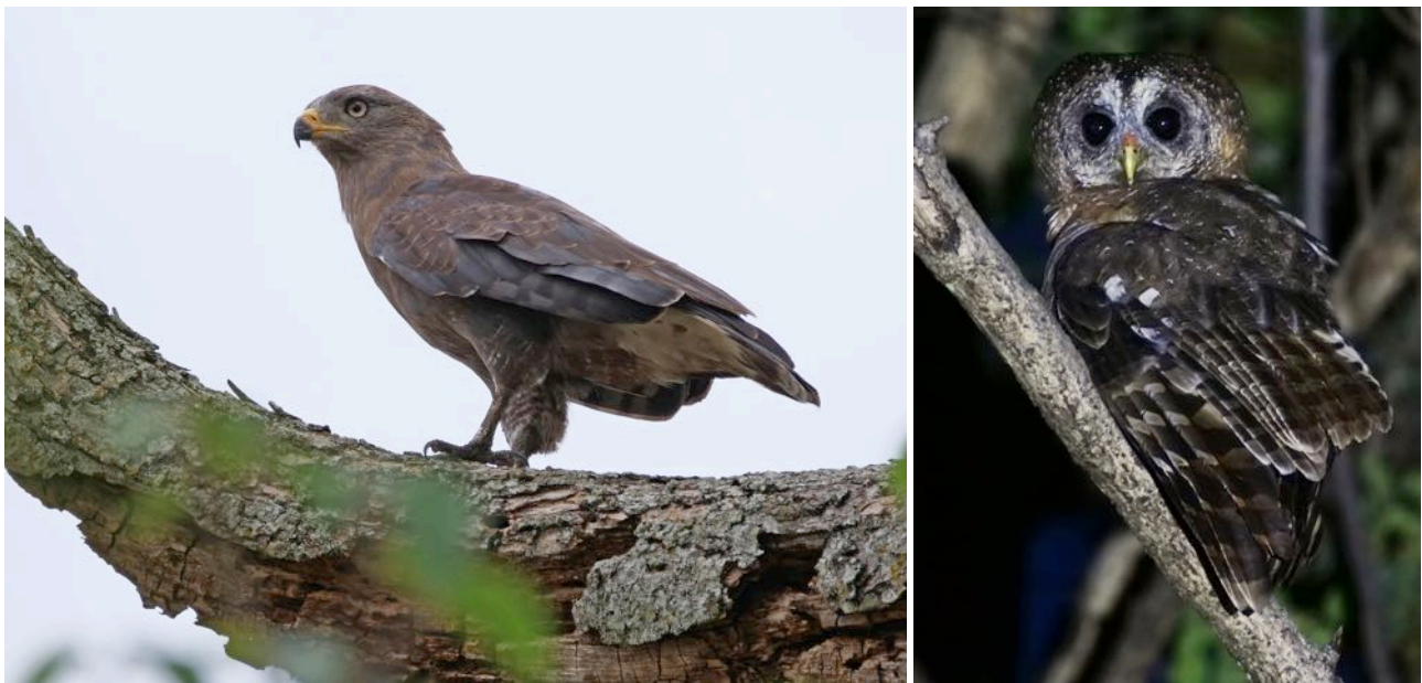
Western Banded Snake Eagle (left) at the Machile River and an African Wood Owl at our camp (right). (Nik Borrow)

Due to the rain cuckoos were noisy and some Arrow-marked Babblers were very distressed by the presence of a pair of Levillant's Cuckoos. Diederik and Black Cuckoos were also seen and a Western Banded Snake Eagle posed nicely but perhaps the best bird was a male Shelley's Sunbird that put in a brief appearance. After our success there was little to do but make the long journey back to base and we got back fortuitously not only to enjoy sundowners during the evening river watch but also to view a Half-collared Kingfisher and two Slaty Egrets that passed by and the day was brought to a successful conclusion by the appearance of the camp's resident African Wood Owls.