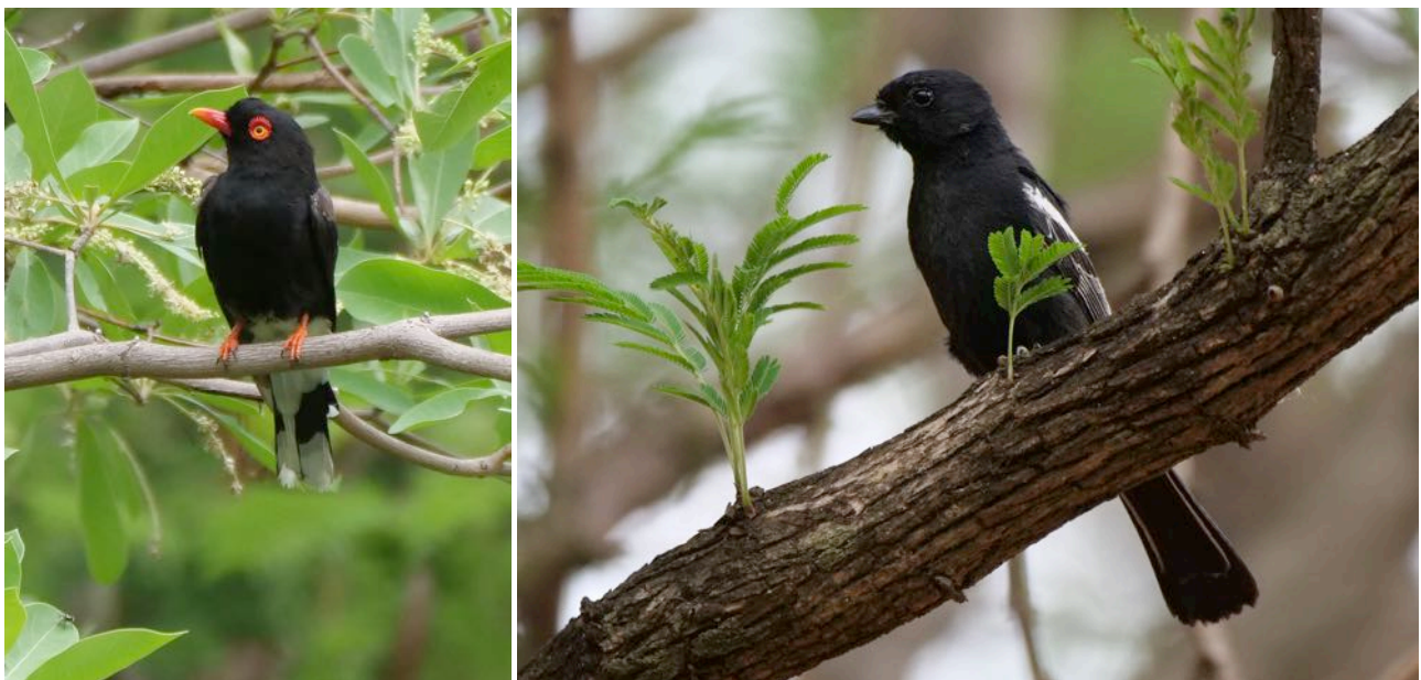
Retz's Helmetshrike (left) was seen well on our journey back to Lusaka. Southern Black Tit (right) was nesting at Masuku.

Miombo Tit (M Grey T) Melaniparus griseiventris Just 1 at the last minute at Nkanga. Grey Penduline Tit (African P T) Anthoscopus caroli 4 seen at Nkanga. Eastern Nicator Nicator gularis Seen well at Kafue River. Rufous-naped Lark Mirafra africana (H) Heard at Nkanga, Zambia. Flappet Lark Mirafra rufocinnamomea Seen at Nkanga, Zambia. Dark-capped Bulbul (Common B) Pycnonotus tricolor A very common bird seen every day Sombre Greenbul Andropadus importunus Easily seen at Kafue River. Yellow-bellied Greenbul Chlorocichla flaviventris Widespread sightings throughout the tour. Terrestrial Brownbul Phyllastrephus terrestris Widespread sightings throughout the tour.