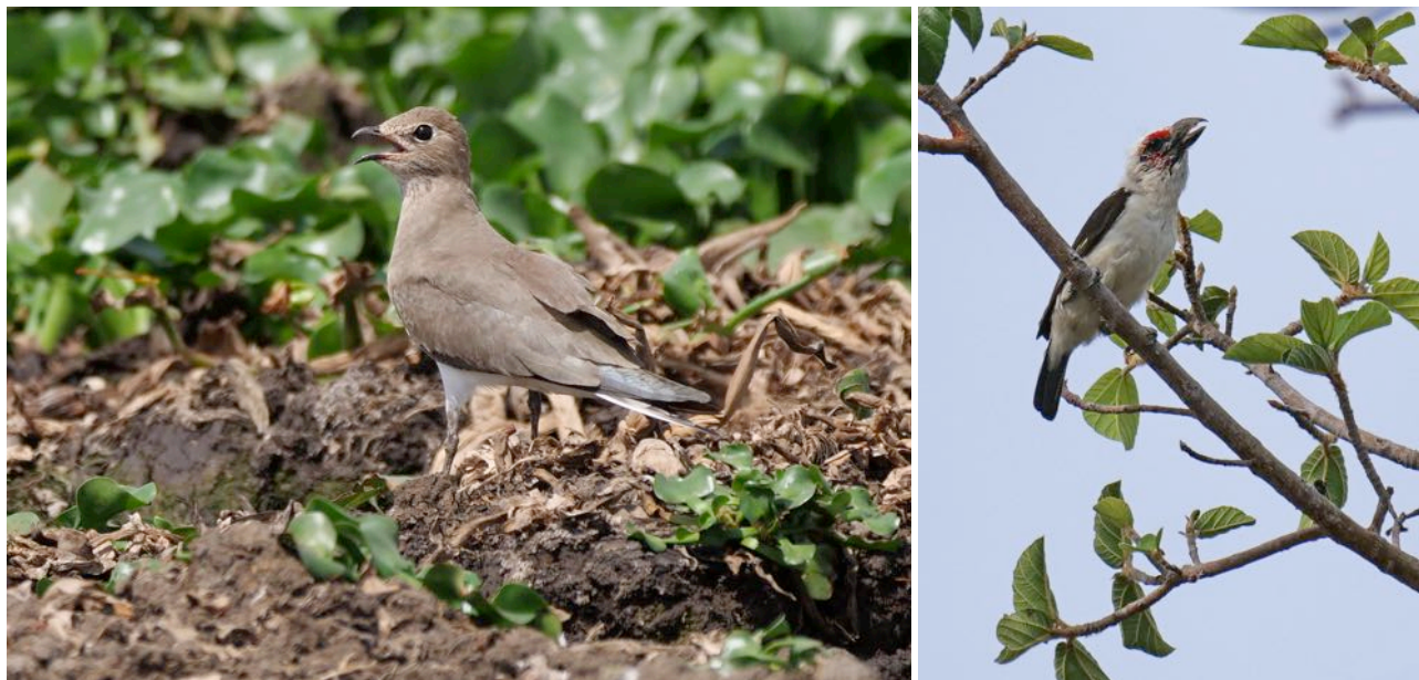
The day began with Black-winged Pratincole (left) at Livingstone sewage farm and ended with a family of endemic Chaplin's Barbets (right) in the Nkanga Conservation Area. (Nik Borrow)

eared Starlings, Sooty Chat, Northern Grey-headed Sparrow, Yellow Bishop, Yellow-mantled Widowbird, Bronze Mannikin, Village Indigobird, Pin-tailed Whydah and Plain-backed Pipit. A Little Sparrowhawk dashed through and as the afternoon wore on numbers of Amur Falcons were watched drifting over.