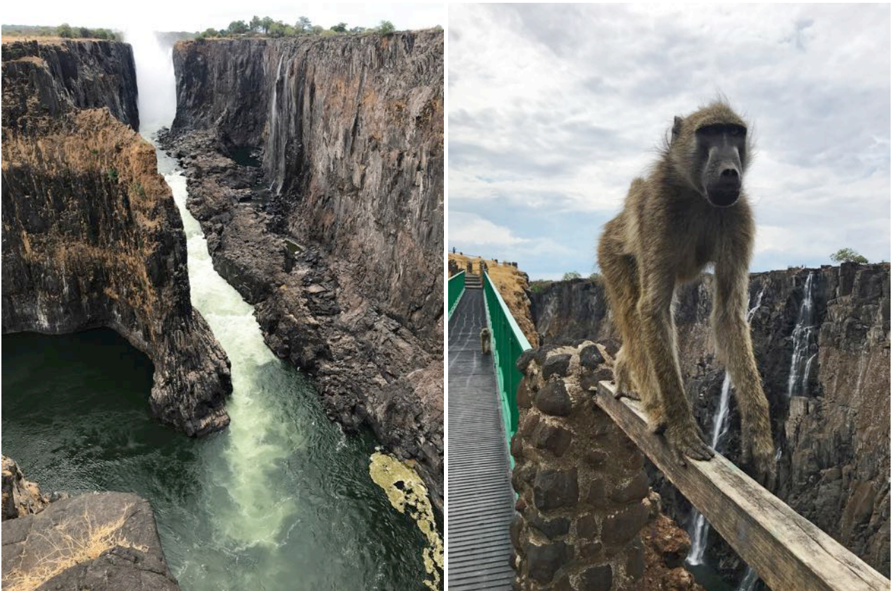
The Victoria Falls were relatively dry at the time of our visit but even the scale of the gorge is impressive and Chacma Baboons have the right of way!

The tour began in Livingstone and we immediately transferred to our 4WD vehicle which took us past some introduced Common Mynas in the town to the simply amazing Victoria Falls where we were quite happy to do the 'tourist thing' and gaze alongside the angels of David Livingstone on the spectacle in front of us. Here the mighty Zambezi widens to nearly two kilometres broad in the wet season before plunging vertically downwards. Even though it was the dry season and the flow of water was at its lowest, as we approached the falls we could see the dense clouds of water vapour that hung over the area on the Zimbabwean side