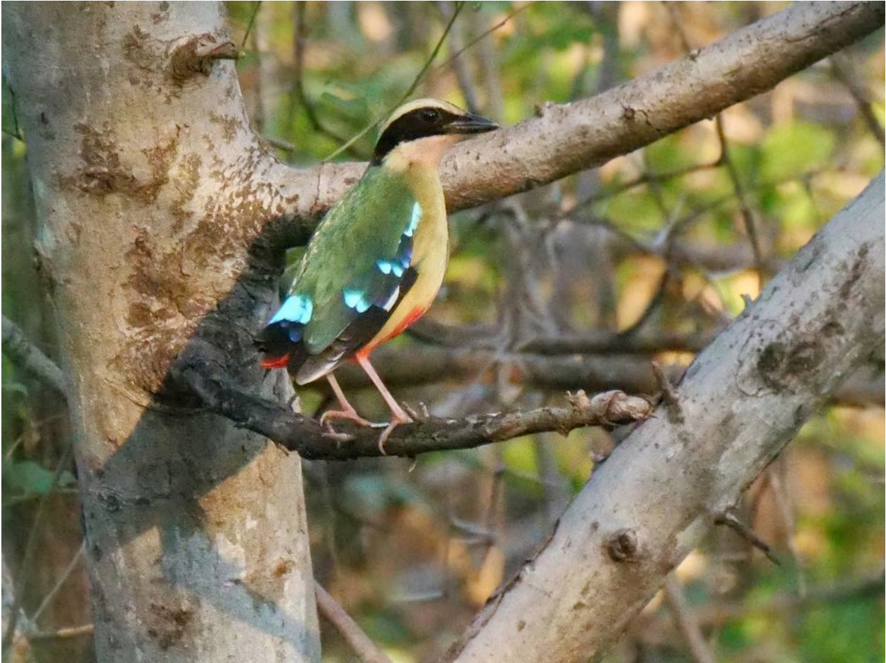
The trip highlight was certainly our wonderful encounter with the marvellous African Pitta in the Zambezi Valley.