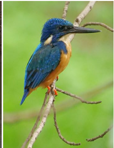
A Shikra (left) was watched bathing in a roadside puddle near Kazungula. Half-collared Kingfisher (right) was seen at Camp Nkwazi.

Giant Kingfisher Megaceryle maxima Singletons at Nkwazi and Kafue River. Pied Kingfisher Ceryle rudis Widespread sightings in appropriate habitat. Swallow-tailed Bee-eater Merops hirundineus 2 seen in the Machile area. Little Bee-eater Merops pusillus Widespread sightings throughout the tour. White-fronted Bee-eater Merops bullockoides Seen well during both of the Zambezi boat trips. Blue-cheeked Bee-eater Merops persicus Seen well during both of the Zambezi boat trips. European Bee-eater Merops apiaster 12+ of these Palearctic migrants at Nkanga. Southern Carmine Bee-eater Merops nubicoides In the Machile area and a colony at Kafue/Zambezi Rivers. Yellow-fronted Tinkerbird Pogoniulus chrysoconus Widespread encounters in Zambia. Miombo Pied Barbet Tricholaema frontata After a struggle 1 was seen well at Nkanga. Chaplin's Barbet Lybius chaplini Wonderful views of Zambia's endemic barbet. At least 4 seen well at Nkanga. Black-collared Barbet Lybius torquatus Widespread sightings throughout the tour.