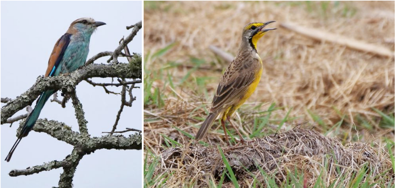
Racket-tailed Roller (left) is one of the major target species in the miombo woodlands of the Nkanga Conservation Area. Fülleborn's Longclaws (right) may be found around the dams.

departure and left it as long as we could in the hope that the storm would pass us by but bad weather was clearly approaching quite rapidly and so finally we beat a hasty retreat which sadly wasn't fast enough and we ended up getting wet driving back in our open topped vehicle!