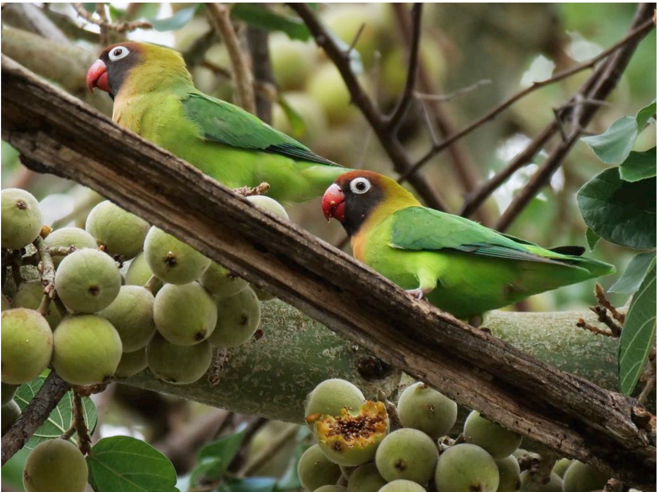
The gorgeous Black-cheeked Lovebird is virtually a Zambian endemic as records from outside of the country probably relate to wanderers or escapees. (Nik Borrow)

Continuing on our way the journey was not completely straightforward as the maze of tracks interweave often confusingly. Occasional Swainson's Spurfowl were seen and Swallow-tailed, Little, Blue-cheeked and Southern Carmine Bee-eaters provided suitable splashes of colour. Raptors were sparse but we noted Brown Snake Eagle, Wahlberg's Eagle and Shikra whilst other species seen during the journey included White-faced Whistling Duck, Spur-winged Goose, Little and White-rumped Swifts, African Green Pigeon, Red-faced Mousebird, African Hoopoe, Common Scimitarbill, Southern Red-billed Hornbill, Lilac-breasted Roller, Woodland Kingfisher, Meyer's Parrot, Brown-crowned Tchagra, Brubru, White-crested Helmetshrike, African Golden Oriole, Willow Warbler, Rattling Cisticola, Tawny-flanked Prinia, Red-billed Oxpecker, Spotted Flycatcher, Scarlet-chested and White-bellied Sunbirds, Southern Grey-headed Sparrow, Southern Masked Weaver, Cut-throat Finch, Red-billed Firefinch and Black-throated Canary.