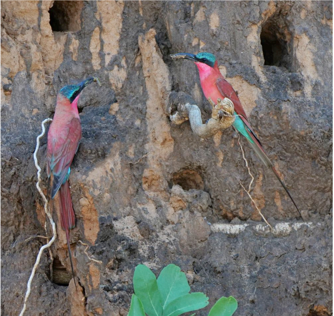
A breeding colony of Southern Carmine Bee-eaters seen during our boat trip along the Kafue and Zambezi Rivers was a colourful experience! (Nik Borrow)

Retz's Helmetshrike, Olive Tree Warbler, Southern Yellow White-eye and Cinnamon-breasted Bunting.