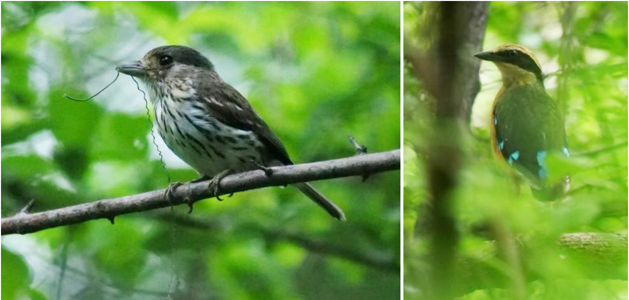
Dull days with rain didn't make our quest to see African Broadbill (left) here carrying nesting material and the African Pitta (right) any easier but these first views of the bird were certainly good enough to tick!

afternoon in the hope that they might be more obliging. Sure enough this time round we were lucky with the male bird returning to the same rather obscured perch that he had used the previous day but this time we were better placed to watch him and we were treated to a lengthy performance as he stood on suitable low lianas and branches from where he would leap into the air almost in slow motion, spreading his wings and making the mechanical frog-like 'blip' sound whilst doing so. This time everyone had good views and the only things that could be complained about were the lack of sunlight and the restricted viewing. However, the bird was well and truly in the bag!