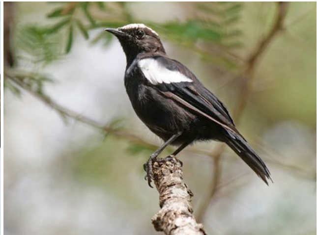
Ashy Flycatcher (left) at Nkwazi and Arnot's Chat (right) at Masuku Lodge.