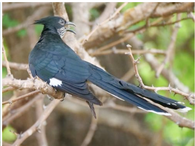
Coppery-tailed Coucal (left) was seen well in the Nkanga Conservation Area and a Levaillant's Cuckoo (right) was apparently trying to lay eggs in an Arrow-marked Babbler nest. (Nik Borrow)