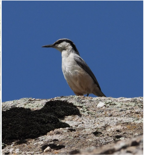
Eastern Orphee Warbler; Eastern Rock Nuthatch (Mark Van Beirs)

Common Starling Sturnus vulgaris Regular.