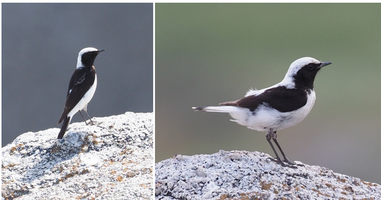
Pied and Finsch's Wheatears occur in the same habitat and look superficially alike (Mark Van Beirs)

The morning chorus in the surroundings of the hotel consisted primarily of the marvellous song of Common Nightingales and the more subdued strophes of Hume's Whitethroats. We were lucky enough to bump into a pair of Hawfinches and obtained good scope views of this usually rather shy species. We observed good numbers of lovely Yellow-breasted (Azure) and Great (Turkestan) Tits, but the Rufous-naped Tit was the tit we really wanted to see here. Eventually we heard their distinctive notes in the distance and after a bit of scanning we got this restricted range species in front of our binoculars as it was acrobatically foraging in a flowering tree. A couple of Oriental Turtle Doves allowed close approach, but a pair of Indian Golden Orioles remained high up in the canopy of the tall poplars. A dainty White-crowned Penduline Tit was feeding its young in the fluffy, hanging nest. Other interesting species included Eurasian Sparrowhawk, Red-rumped Swallow, Hume's Leaf Warbler, some very obliging Mistle Thrushes and Common Rosefinch. After a delicious breakfast we drove to Tashkent airport, where we said goodbye to our friendly Uzbek hosts. The flight to Nur Sultan (the new name for Astana), the capital of Kazakhstan went smoothly and after effortless immigration (for most), we drove into this fast-developing city, admiring its amazing and sometimes mind-boggling architecture.