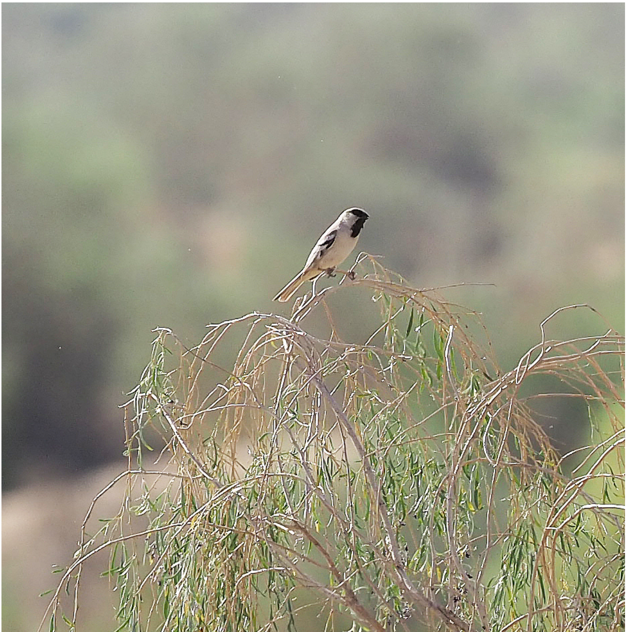
A record shot of the increasingly rare Zarudny's Sparrow

Our Central Asia tour started with a big bang as on the Turkmenistan pre-trip we managed to observe the rare and truly enigmatic Zarudny's (or Asian Desert) Sparrow, one of the hardest to see birds in the Palearctic! This rarity hadn't been seen in its remote haunts by western birdwatchers for over ten years. We obtained cracking views of a male and two recently fledged young in the barchan dunes of the famous Repetek reserve. The favourite highlights of our visit to the varied habitats of Uzbekistan and Kazakhstan included the unique Ibisbill (foraging in a mountain stream), the unusual White-headed Duck (displaying at close range), the magnificent Himalayan Snowcock (terrific scope studies of a foraging bird) and the endearing Pander's Ground Jay (singing from the tops of bushes and running about like a Roadrunner). Other much appreciated specialities were Marbled Duck, Red-crested Pochard, Ferruginous Duck, Dalmatian Pelican, Bearded Vulture, Pallid Harrier, White-tailed Eagle, Macqueen's Bustard, Demoiselle Crane, Sociable and White-tailed Lapwings, Caspian Plover, Black-winged Pratincole, Pallas's Gull, Black-bellied Sandgrouse, Yellow-eyed Pigeon, White-winged Woodpecker, Red-footed Falcon, fluffy Azure and enchanting Yellow-breasted Tits, White-winged and Black Larks, Streaked Scrub Warbler (in its own family!), an overwhelming variety of Phylloscopus, Acrocephalus and Sylvia warblers, Wallcreeper, Rosy Starling, White-throated Robin,