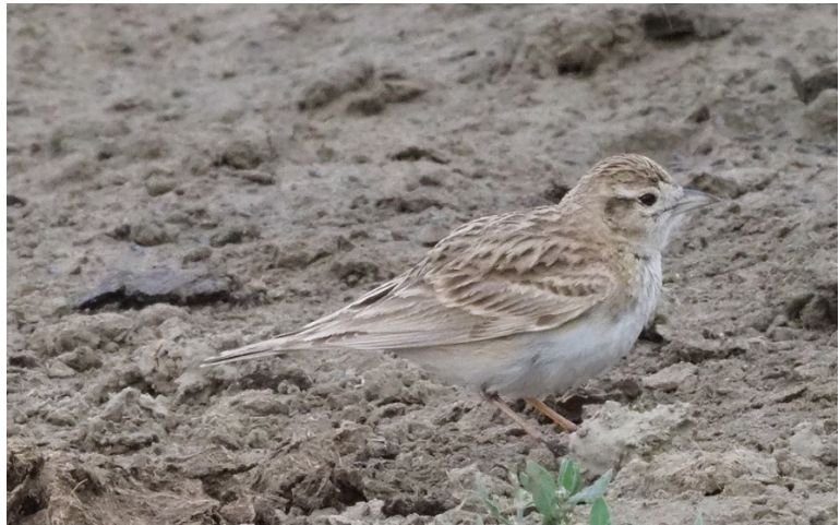
Oriental Skylark; Greater Short-toed Lark

Oriental Skylark Alauda gulgula A single sighting near Bukhara. Eurasian Skylark Alauda arvensis Common in the northern Kazakhstan steppes. Crested Lark Galerida cristata Regular along roads and tracks in all three countries. Hume's Short-toed Lark ♦ Calandrella acutirostris A single showed all too briefly above Samarkand. Greater Short-toed Lark Calandrella brachydactyla Many in the Taukum desert (Kazakhstan). Bimaculated Lark Melanocorypha bimaculata Several excellent encounters in the Taukum desert. Calandra Lark Melanocorypha calandra Delightfully common in the Taukum desert (Kazakhstan). Black Lark ♦ Melanocorypha yeltoniensis Many in the Sultan Nur steppes. An unusual-looking lark! See Note. Lesser Short-toed Lark Aldadala rufescens A few in the Taukum desert (Kazakhstan). See Note.