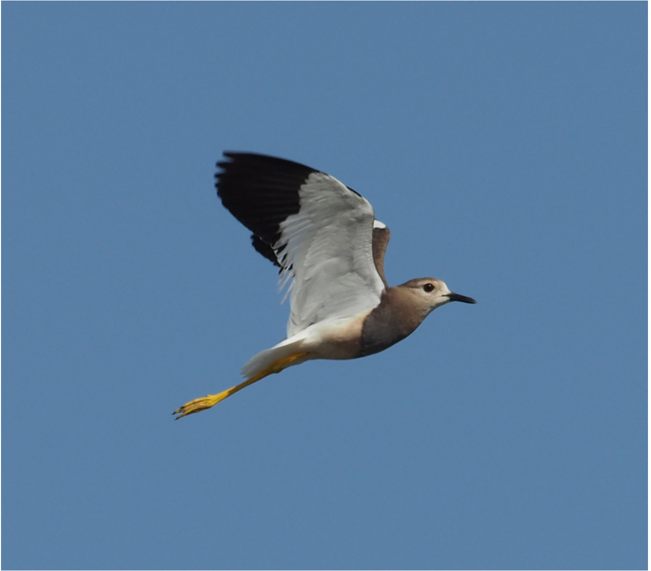
White-tailed Lapwing (Mark Van Beirs)