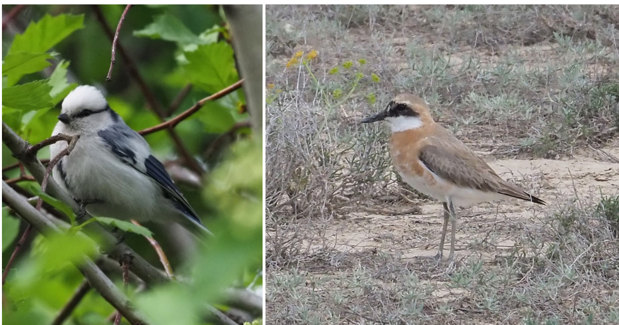
The charming Azure Tit is always a delight to observe; Bright Greater Sand Plovers were easily found in the Taukum desert

The following morning we travelled to the open Turanga (poplar) woodlands and reedy dune slacks near the Ili river, situated to the north of our camp site. We were rather unlucky with the weather as high winds were disrupting our efforts to try to get to grips with several reed-inhabiting passerines. Wandering through the park-like habitat gave us a few rather shy Yellow-eyed Pigeons, which posed all too briefly on the top of the gnarled trees. Through the scope we could discern the distinctive yellow iris of this Central Asian breeding endemic. Nearby we found several ever so attractive Saxaul Sparrows, living in a human made construction. This very smart-looking member of the genus Passer only lives in areas where the hardy, little Saxaul trees and bushes occur. An eyrie of a Long-legged Buzzard holding chicks was also inhabited by Spanish Sparrows and by House Sparrows ( bactrianus ). Overhead we noted a squadron of Great White Pelicans and in the semi desert we located a grey-looking Red-tailed Shrike (of the so called karelini form) and Desert Whitethroat. At a river crossing Azure Tit and the striking Black-headed Wagtail (race feldegg of Western Yellow Wagtail) were seen and our local guide was lucky enough to spot a Golden Jackal. In the afternoon we explored the steppe and semi-desert near our camp. Using the minibus as a hide we had several nice