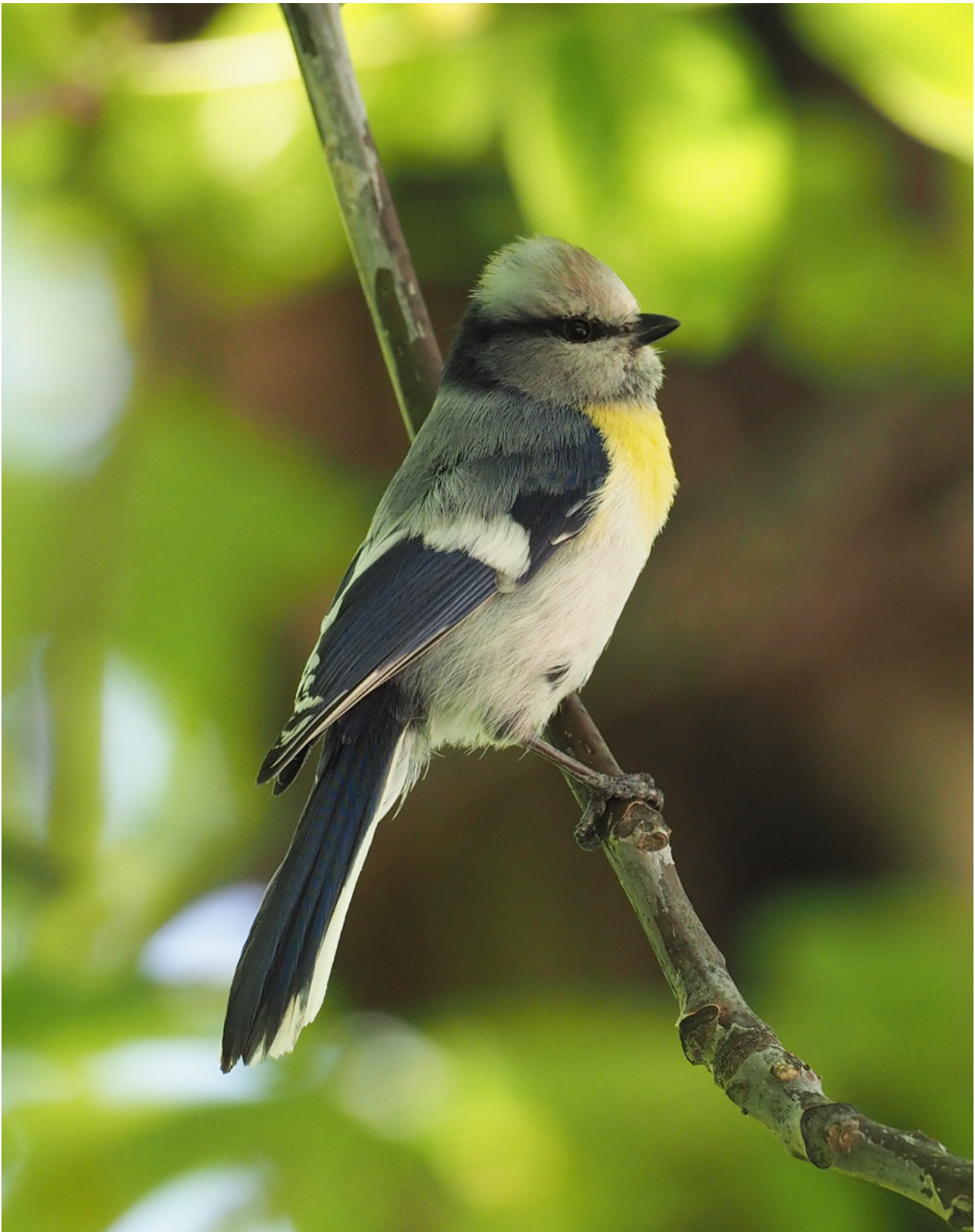
The adorable Yellow-breasted Tit is usually considered as a race of Azure Tit, but their ranges are widely separated and they sure look different (Mark Van Beirs)