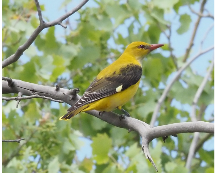
Red-footed Falcon (female); Indian Golden Oriole

Common Kestrel Falco tinnunculus Common.