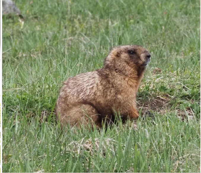
The humble Black-throated Accentor and the cuddly Altai Marmot occupy the forest edge zone of the Tien Shan mountains (Mark Van Beirs)