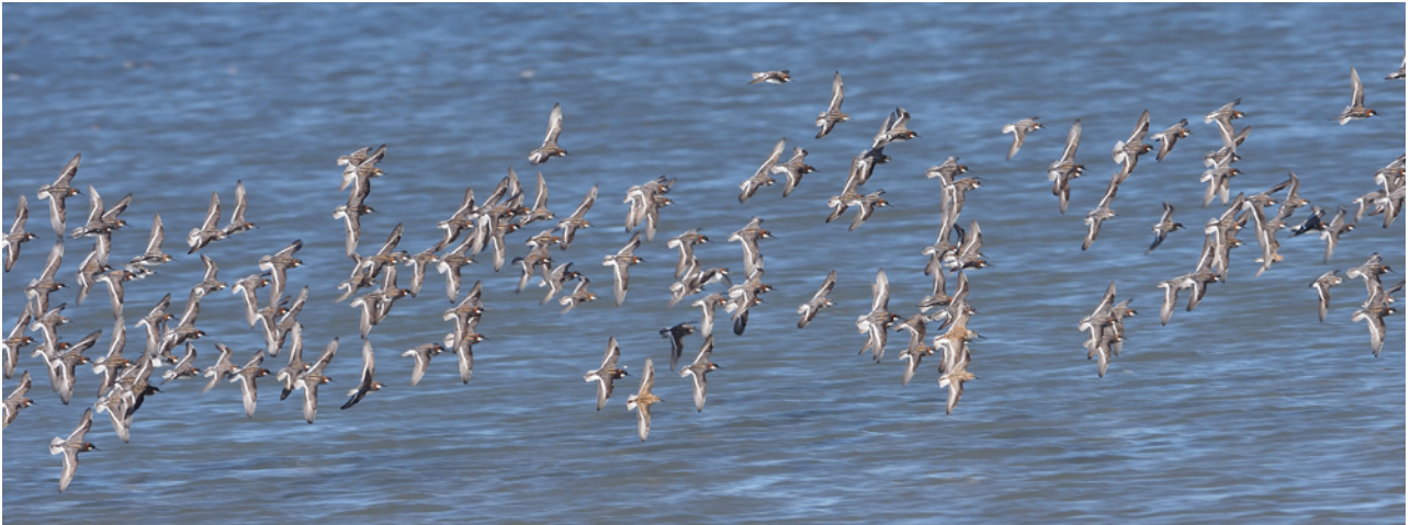
Red-necked Phalaropes (Mark Van Beirs)

Black-tailed Godwit Limosa limosa Regular observations of this marvelous wader. Ruff Calidris pugnax We loved the magnificent spectacle of dozens of displaying males near Nur Sultan. Curlew Sandpiper Calidris ferruginea A few in breeding plumage at steppe lakes. Temminck's Stint Calidris temminckii Regular at steppe lakes and ponds. Dunlin Calidris alpina Small numbers in breeding plumage at the Nur Sultan lakes. Little Stint Calidris minuta A regular migrant of the steppe lakes in Uzbekistan and Kazakhstan. Terek Sandpiper Xenus cinereus Three nice sightings of this splendid wader in Kazakhstan.