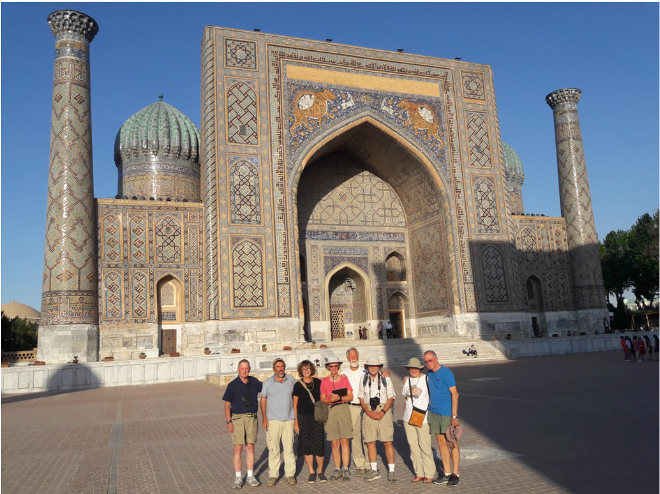
The group in Samarkand