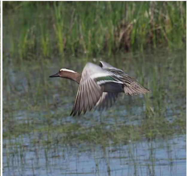
Ruddy Shelduck; a drake Garganey

Ruddy Shelduck Tadorna ferruginea Small numbers in drier areas of Uzbekistan and Kazakhstan.