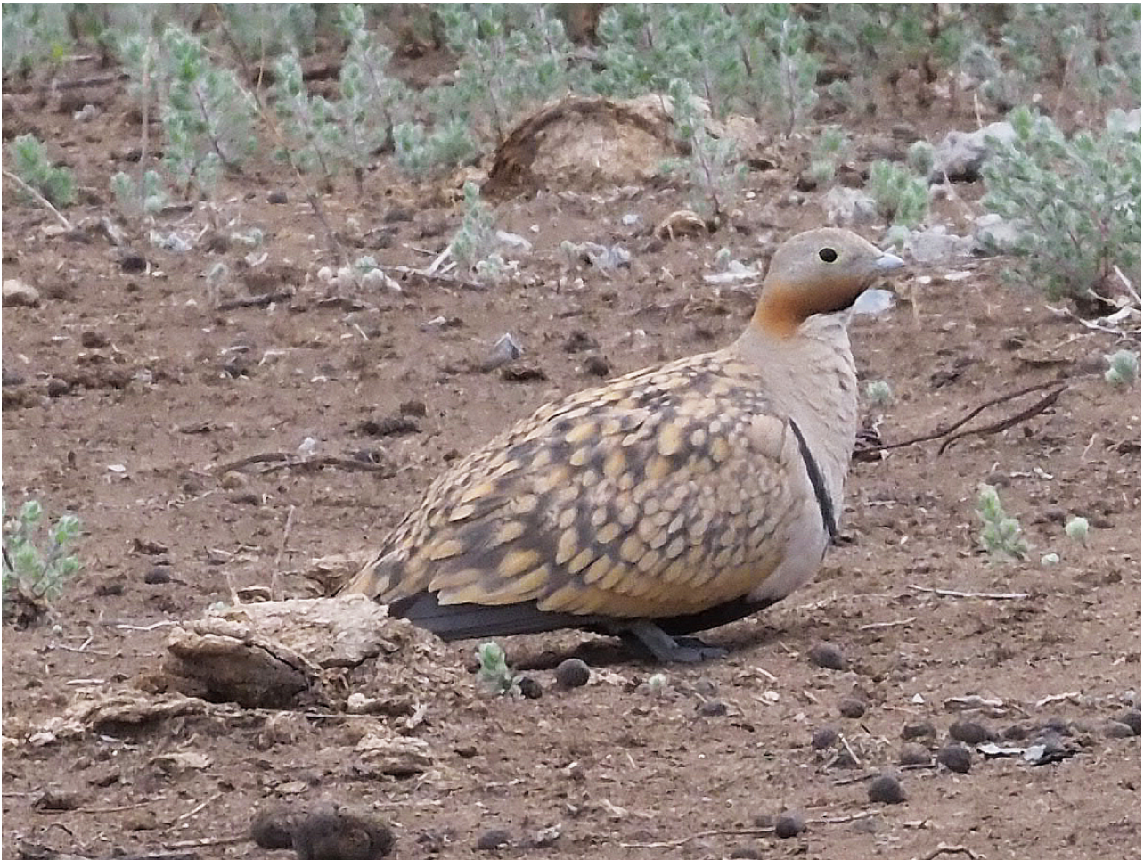
Black-bellied Sandgrouse were commonly encountered while exploring the Taukum desert

encounters with Greater Sand Plovers in their beautiful, rather variable breeding dress. We had good looks at a Black-bellied Sandgrouse on the deck and also observed Brown-necked Raven, lots of Calandra and Greater Short-toed Larks and a shy Goitered Gazelle. After a delicious dinner, as the sun was setting in a riot of colours, we sat at the snug camp fire, enjoying a fiery Kazakh brandy, while listening to our local guide's stories and songs.