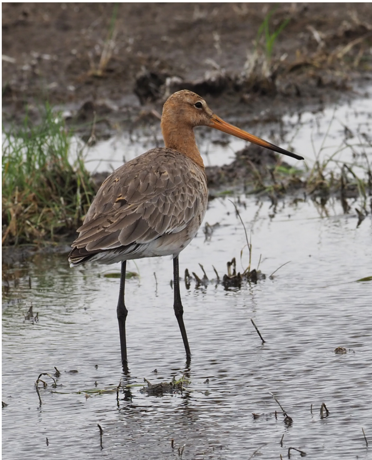
Black-tailed Godwit (Mark Van Beirs)

White-tailed Lapwing ♦ (W-t Plover) Vanellus leucurus Close up looks in the Bukhara marshes. Grey Plover (Black-bellied P) Pluvialis squatarola A few in breeding plumage at the Nur Sultan lakes. Common Ringed Plover Charadrius hiaticula A few sightings of the migratory race tundrius . Little Ringed Plover Charadrius dubius Regular observations. Yellow orbital ring! Kentish Plover Charadrius alexandrinus Small numbers at saline lakes in Uzbekistan and Kazakhstan. Greater Sand Plover Charadrius leschenaultii A few in Uzbekistan and regular in the Taukum desert. Caspian Plover ♦ Charadrius asiaticus We found a female on her nest in the Taukum desert.