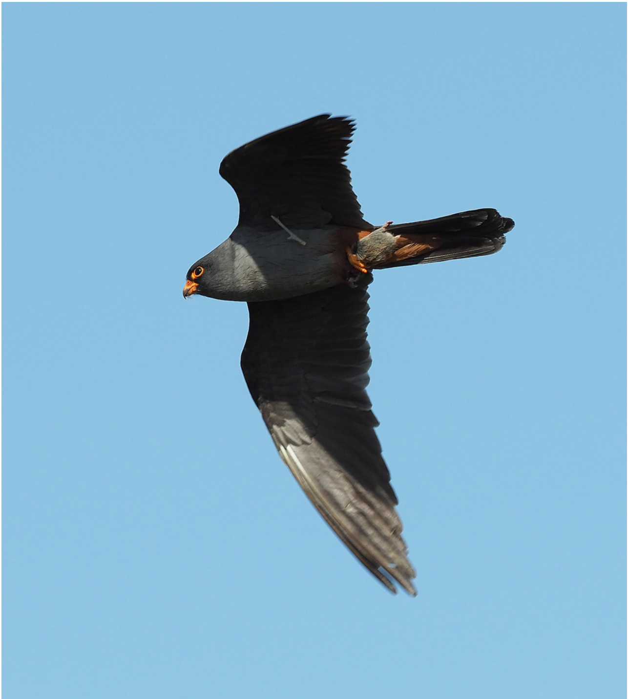
This cracking male Red-footed Falcon was bringing a vole to his brooding lady

and their moonwalk dance were very much appreciated. We had terrific views of small numbers of well-performing, dashing Red-footed Falcons. A couple of enormous Dalmatian Pelicans flew low over our heads as we were admiring a colony of nimble Black-winged Pratincoles. Just a few sophisticated Demoiselle Cranes were noted and graceful male Pallid Harriers regularly showed at close range. New waders for the tally included Northern Lapwing, Grey Plover (in immaculate breeding dress), Common and Little Ringed Plovers, Black-tailed Godwit, Curlew Sandpiper, Temminck's Stint, smart Dunlin, Common Redshank and Marsh Sandpiper. We saw a good selection of ducks, including Greylag Goose, Mute Swan (real ones!), Whooper Swan, Common Shelduck, lovely Garganey, Northern Shoveler, Mallard, Northern Pintail, Common Pochard and Tufted Duck. Red-necked, Great Crested and Black-necked Grebes showed off in their breeding plumages and Greater Flamingoes were more common and allowed much better views than usual. We also scoped a nice colony of impressive Pallas's Gulls. Great Egret, Long-legged and Common