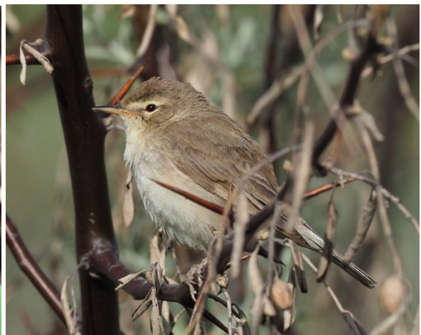
Barn Swallow; Blyth's Reed Warbler

Sand Martin (Bank Swallow) Riparia riparia Regular in small numbers.