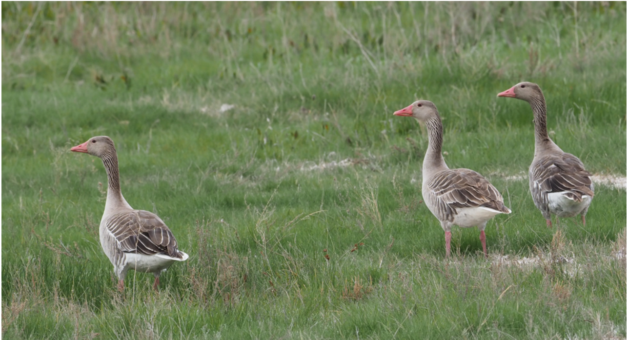
Greylag Geese (Mark Van Beirs)

Species marked with the diamond symbol (◊) are either endemic to the country or local region or considered 'special' birds for some other reason (e.g. it is only seen on one or two Birdquest tours; it is difficult to see across all or most of its range; the local form is endemic or restricted-range and may in future be treated as a full species).