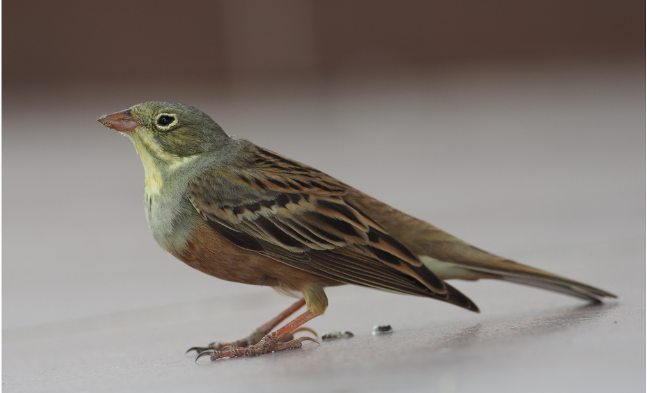
This exhausted male Ortolan Bunting had just crossed the eastern Kara Kum desert (Mark Van Beirs)

at the little oasis surrounding the park's headquarters where Eurasian Hoopoes were active around their nesthole and three colourful male Eurasian Golden Orioles were playing hide and seek in the canopy of the poplars. The surrounding bushes produced Greenish, Blyth's Reed and Eastern Olivaceous Warblers, Common Whitethroat, a posing and displaying Rufous-tailed Scrub Robin, lots of Spotted Flycatchers, a female Bluethroat and a beautiful, exhausted male Ortolan Bunting. In late afternoon we did a bit more exploring of the Saxaul woodland, where Tolai Hare and Common Cuckoo were the only prizes.