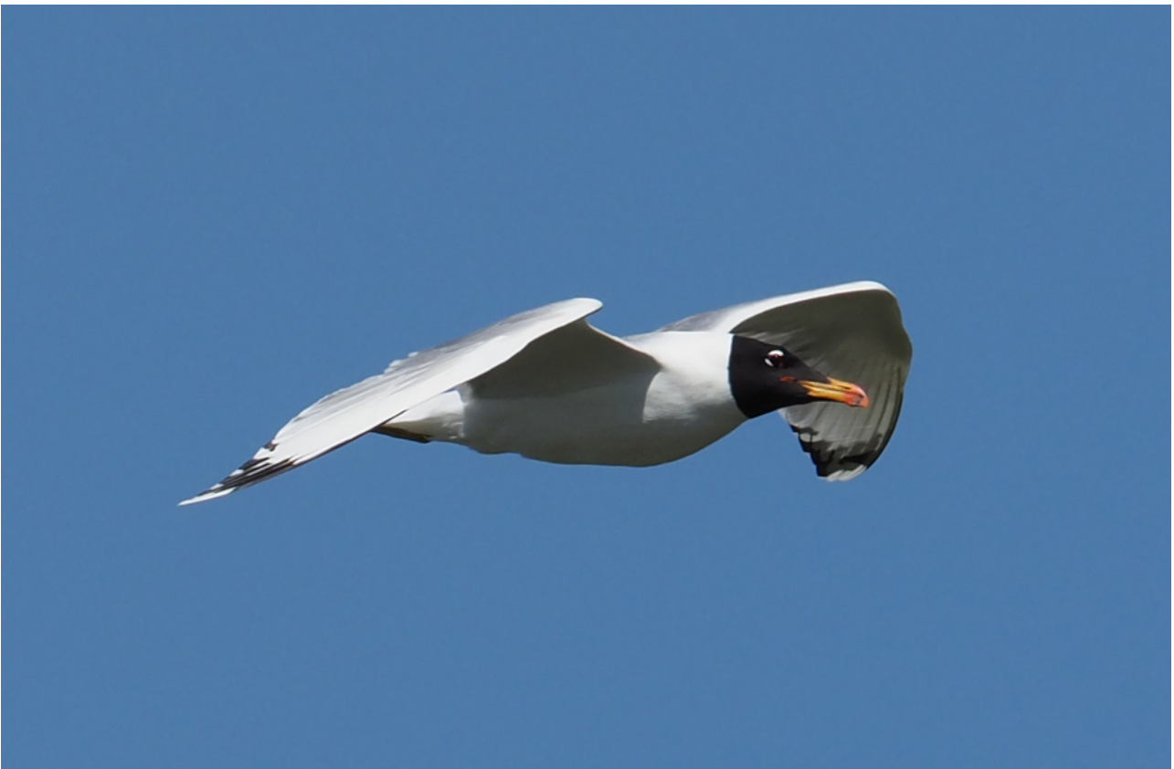
Pallas's Gull (Mark Van Beirs)

Red-necked Phalarope Phalaropus lobatus Thousands in breeding attire on the Nur Sultan lakes. Common Sandpiper Actitis hypoleucos A handful of observations in Uzbekistan and Kazakhstan. Green Sandpiper Tringa ochropus A single sighting near Bukhara (Uzbekistan).