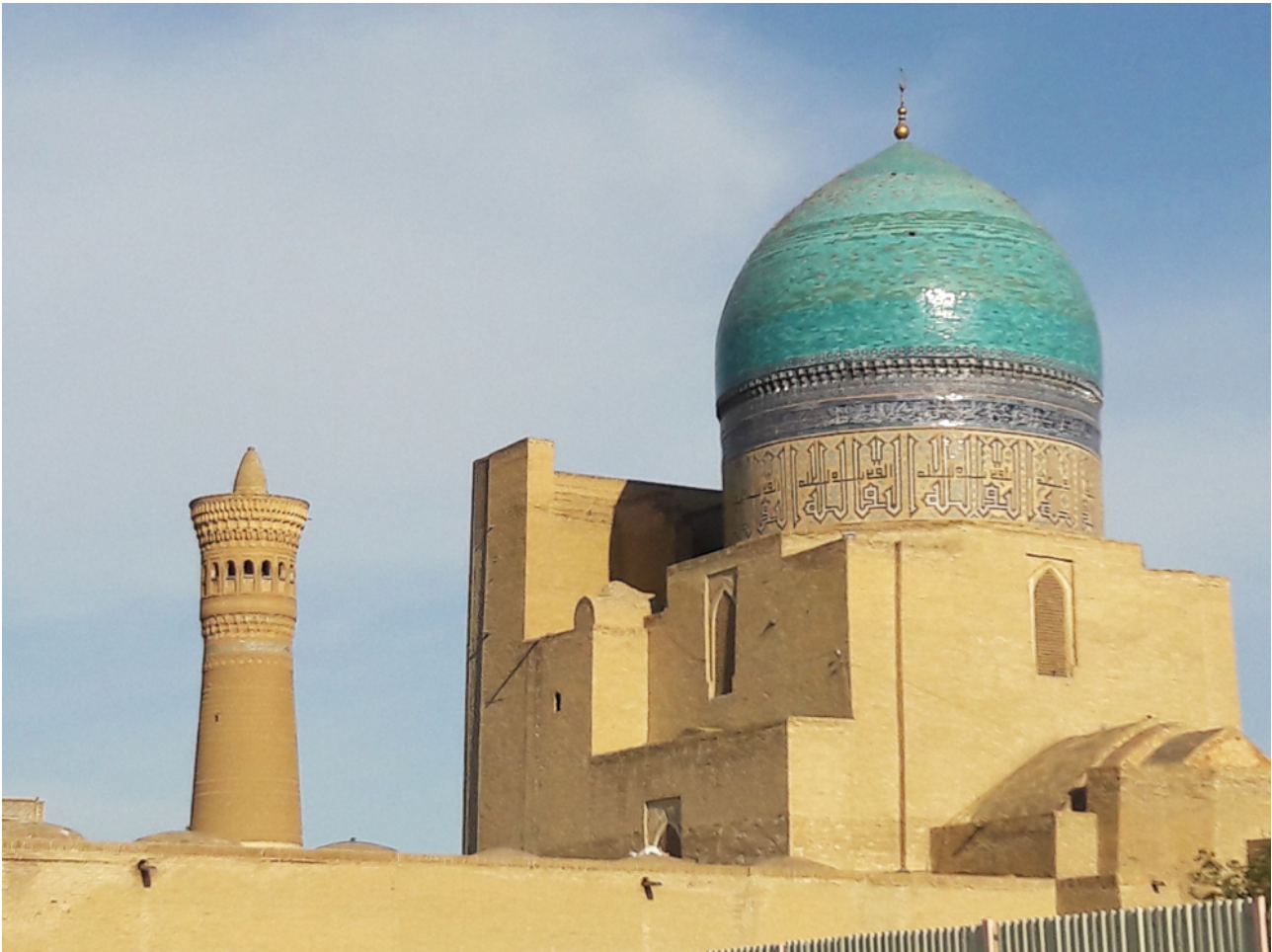
The historic centre of Bukhara is an UNESCO World Heritage Site

Himalayan Rubythroat, Eversmann's, Blue-capped and Güldenstädt's Redstarts, Finsch's Wheatear, Black-throated Accentor, White-winged Grosbeak, Red-mantled Rosefinch, Red-fronted Serin and White-capped, Grey-necked and Red-headed Buntings. We also enjoyed the impressive avian spectacles of dozens of lekking male Ruff, of thousands of pirouetting Red-necked Phalaropes in breeding attire and of scores of superbly elegant White-winged Terns dancing over reedy lakes. Altai and Bobak Marmots, Siberian Roe Deer and Goitered Gazelle represented the mammal department and an interesting selection of reptiles included Common Sand Boa, Sheltopusik, Desert Monitor Lizard, several agamas and lumbering Horsfield's Tortoises. Next to the natural history side, we also greatly valued the visits to the amazing Silk Road cultural heritage towns of Bukhara and Samarkand, where we wandered amongst the atmospheric, spectacular madrasas, mosques and bazaars.