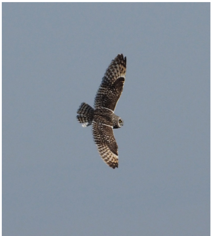
Tawny Owl; Short-eared Owl

Alpine Swift Tachymarptis melba Splendid at the Samarkand mosques.