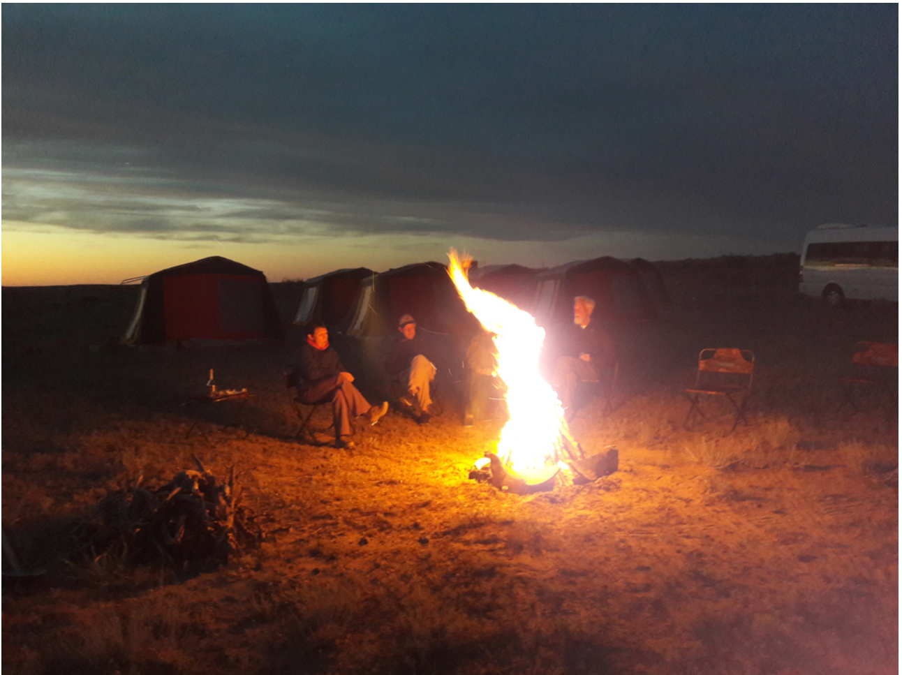
Camp fire in the Taukum desert (Mark Van Beirs)