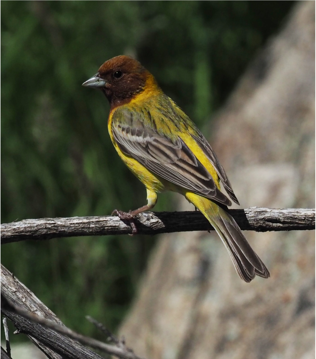
Every birdwatcher loves buntings and the fabulous Red-headed Bunting is one of the fancier ones (Mark Van Beirs)

rather large Sheltopusik (Pallas's Glass Lizard). Around noon we descended the mountain and explored a wooded valley where we soon encountered a pair of Indian Paradise Flycatchers. We enjoyed a tasty sit-down lunch in a shady bit of Walnut and Black Locust (False Acacia) woodland. It was great to be interrupted by splendours like White-winged Woodpecker, Eurasian Hobby and fabulous Yellow-breasted (Azure) Tits. A leisurely walk produced a nice Cetti's Warbler, several showy Common Nightingales and a two cracking male White-capped Buntings. On the return drive to Samarkand we walked about in a boulder-strewn hill range where the delightful Finsch's Wheatear gave an excellent performance. We also scoped both rufous and grey morphs of Common Cuckoo here.