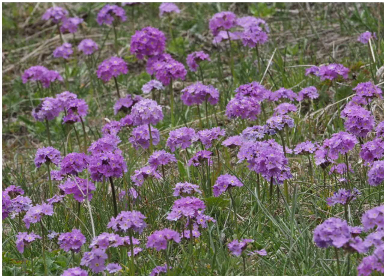
Primulas in the Tien Shan (Mark Van Beirs)

This species is treated as CRITICALLY ENDANGERED by BirdLife International. The total population stands at 16,000-17,000 birds and most of the birds breed in Kazakhstan, with just a handful in nearby Russia. Sudan is the main wintering ground, but several hundred birds migrate to northwest India!