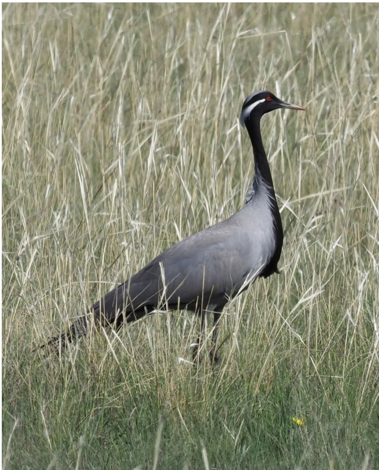
Demoiselle Cranes are superbly elegant inhabitants of the steppes and semi deserts (Mark Van Beirs)

After a scrumptious breakfast we drove out of town and slowly made our way up into the Tien Shan mountains. A couple of stops in the (Schrenk's) Spruce zone gave us a posing Blue Whistling Thrush and two very well-behaved Brown Dippers. We found the first of many Hume's Leaf Warblers and heard a Eurasian Wren. In late morning we walked to the famous Great Almaty reservoir and had a great time birding the different habitats surrounding it. Patches of tall spruce were surrounded by grassy slopes partly covered in dwarf juniper and dotted with large boulders and rocky outcrops. We scanned the streams crossing the bare pebble flats and eventually found our much-wanted target: the magnificent, well-camouflaged Ibisbill.