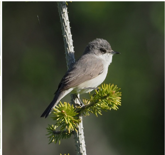
Lesser Whitethroat; Hume's Whitethroat

Lesser Whitethroat Sylvia curruca A few sightings. Desert Whitethroat ◇ Sylvia minula Nice looks in the Taukum desert. Hume's Whitethroat ◇ Sylvia althaea Common in the Chatkal Range (Uzbekistan). Eastern Orphean Warbler ◇ Sylvia crassirostris Splendid in the Chatkal Range (Uzbekistan). Asian Desert Warbler ◇ Sylvia nana Nice looks in the Kyzyl Kum desert near Bukhara. Common Whitethroat Sylvia communis A couple of records of this migrant. Menetries's Warbler ◇ Sylvia mystacea All too brief looks near Bukhara (Uzbekistan). Eurasian Wren Troglodytes troglodytes (H) We heard one in the Tien Shan. Eastern Rock Nuthatch (Great R N) Sitta tephronota Regular and noisy near Samarkand. Wallcreeper Tichodroma muraria A single in flight high up in the Tien Shan. Common Myna Acridotheres tristis Common in the southern part of our itinerary. Rosy Starling ◇ (Rose-coloured S) Pastor roseus Amazing flocks in southern Kazakhstan!