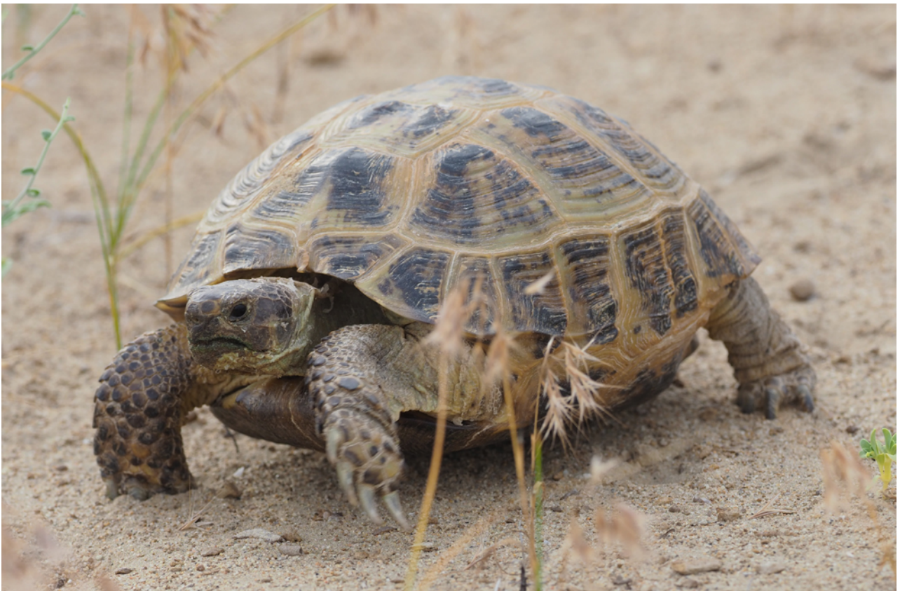
Horsfield's Tortoise