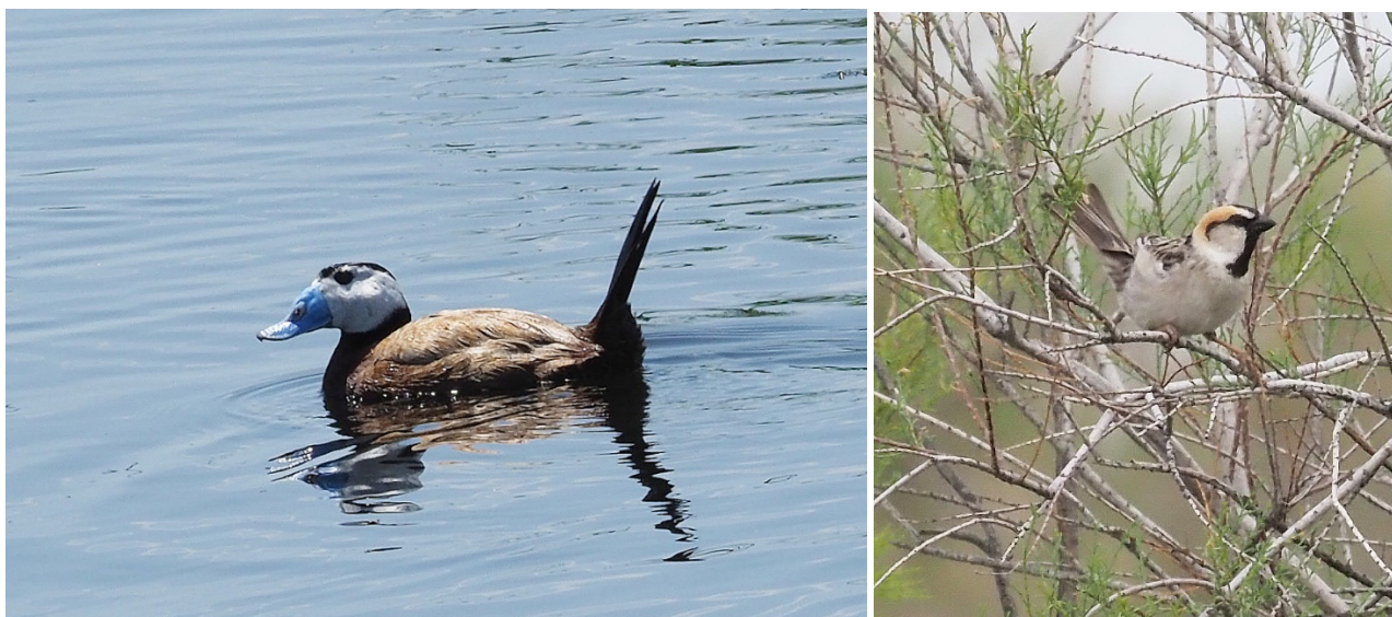
White-headed Duck and Saxaul Sparrow were some of the highlights of our visit to the Taukum desert

The following morning we travelled to the open Turanga (poplar) woodlands and reedy dune slacks near the Ili river, situated to the north of our camp site. We were rather unlucky with the weather as high winds were disrupting our efforts to try to get to grips with several reed-inhabiting passerines. Wandering through the park-like habitat gave us a few rather shy Yellow-eyed Pigeons, which posed all too briefly on the top of the gnarled trees. Through the scope we could discern the distinctive yellow iris of this Central Asian breeding endemic. Nearby we found several ever so attractive Saxaul Sparrows, living in a human made construction. This very smart-looking member of the genus Passer only lives in areas where the hardy, little Saxaul trees and bushes occur. An eyrie of a Long-legged Buzzard holding chicks was also inhabited by Spanish Sparrows and by House Sparrows ( bactrianus ). Overhead we noted a squadron of Great White Pelicans and in the semi desert we located a grey-looking Red-tailed Shrike (of the so called karelini form) and Desert Whitethroat. At a river crossing Azure Tit and the striking Black-headed Wagtail (race feldegg of Western Yellow Wagtail) were seen and our local guide was lucky enough to spot a Golden Jackal. In the afternoon we explored the steppe and semi-desert near our camp. Using the minibus as a hide we had several nice