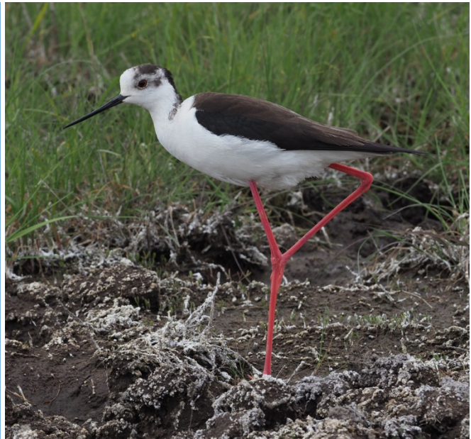
Black Kite; Black-winged Stilt (Mark Van Beirs)

Black Kite (Black-eared K) Milvus [migrans] lineatus One in Uzbekistan and common in Kazakhstan. White-tailed Eagle Haliaeetus albicilla Two young on an eyrie together with a nearby adult near Almaty. Long-legged Buzzard Buteo rufinus Regular encounters along the whole itinerary. Common Buzzard Buteo buteo A few observations of the race vulpinus . Macqueen's Bustard ♦ Chlamydotis macqueenii A single bird in the distance in the Taukum desert. See Note. Common Moorhen Gallinula chloropus Just a few in southern Kazakhstan. Eurasian Coot (Common C) Fulica atra Common. Demoiselle Crane ♦ Grus virgo Small numbers in the Kazakhstan steppes. Eurasian Oystercatcher Haematopus ostralegus A single bird near Nur Sultan. Ibisbill ♦ Ibidorhyncha struthersii THE BIRD OF THE TRIP. Excellent views in the Tien Shan. Black-winged Stilt Himantopus himantopus Common and vociferous. Pied Avocet Recurvirostra avosetta Regular encounters. Northern Lapwing Vanellus vanellus Fairly common. Sociable Lapwing ♦ (S Plover) Vanellus gregarius Splendid looks at 20 birds in the Nur Sultan steppe. See Note.