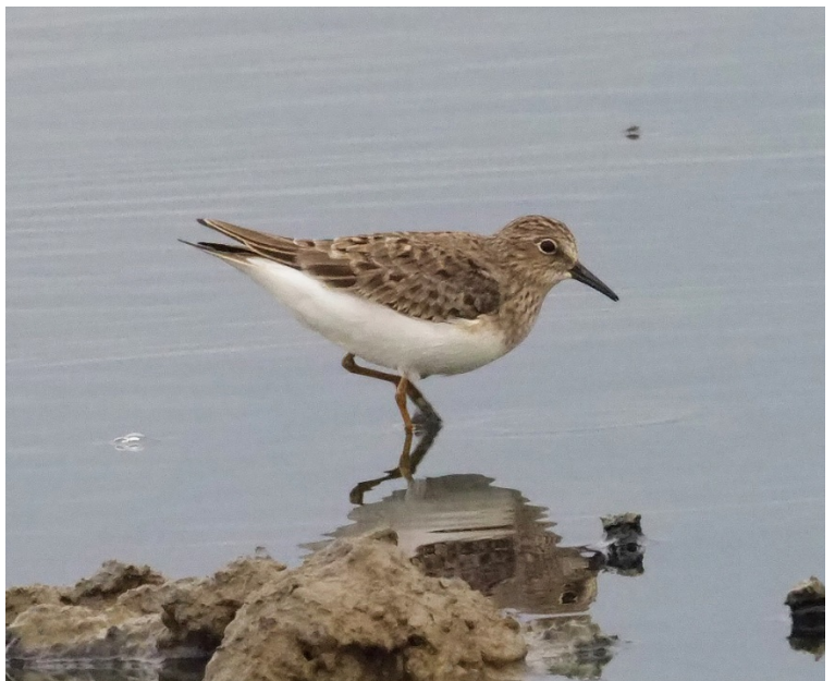
Kentish Plover; Temminck's Stint