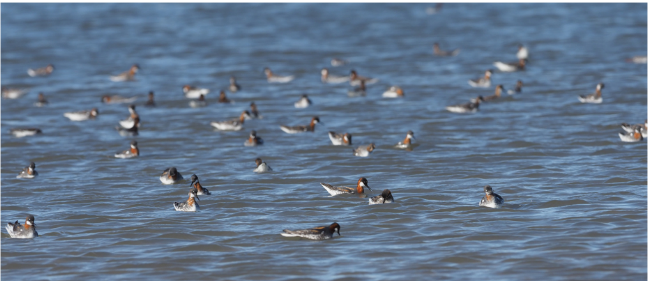
Thousands of breeding-plumaged Red-necked Phalaropes decorated one of the steppe lakes

We experienced a fantastic day in the endless steppes, lakes and marshes to the southwest of the capital Nur Sultan. Our very capable local guide took us from one hotspot to the next and we soon amassed a terrific selection of specialities. The severely endangered Sociable Lapwing was one of the targets, as this much-wanted and rarely seen species is doing so very badly, even here in one of its core breeding areas. We were lucky enough to be able to witness some display and obtained cracking scope views of this elegant wader in its steppe habitat. Waders were definitely a feature of the day as we also had excellent looks at large groups of displaying male Ruff. The sheer variety of their splendid finery has to be seen to be believed and their amazing sparring behaviour was quite a sight! Another wader that took our breath away was the graceful Red-necked Phalarope. One of the lakes we visited was covered in pirouetting birds in exquisite breeding attire and we estimated c11,000 birds to be present! Smart, localized White-winged Larks were regularly flushed in the steppe and unusual-looking Black Larks were everywhere. Their rowing display flight