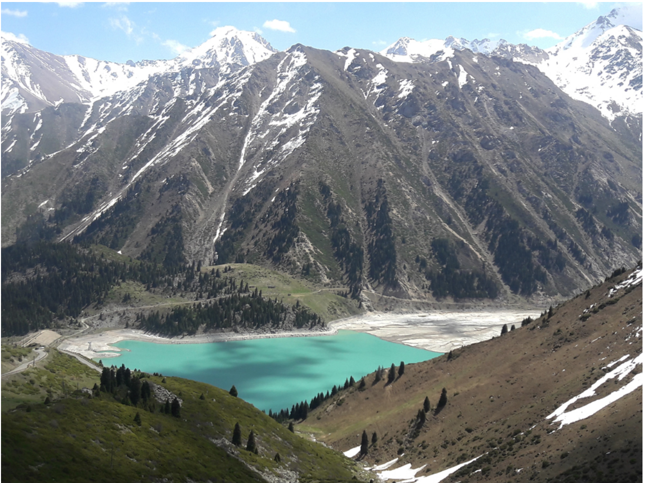
The Tien Shan offers some breath-taking scenery