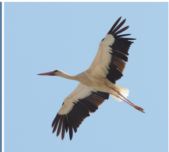
Greater Flamingo; White Stork

Himalayan Snowcock ♦ Tetraogallus himalayensis Perfect scope studies of one in the Tien Shan. See Note.