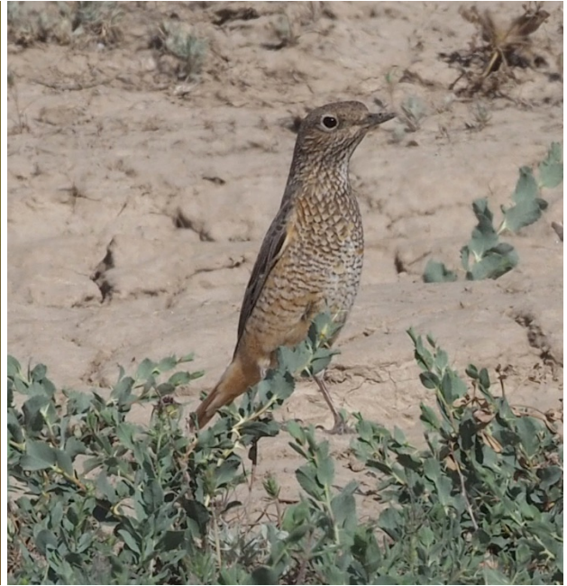
Male and female Common Rock Thrush

Isabelline Wheatear Oenanthe isabellina Regular in the Kyzyl Kum and Taukum deserts.