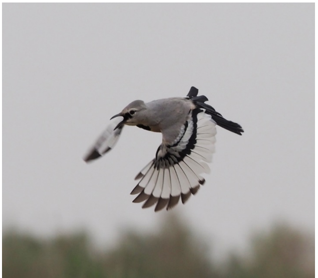
The eastern forms of Rufous-tailed Scrub Robin are much greyer than the western race; The Pander's Ground Jay is a delightful species full of character

observed smart-looking Saxaul Sparrows and a Grey-headed ('thunbergi') Wagtail. On the return drive through the reserve we picked up goodies like Shikra, a cracking European Roller, a male Red-backed Shrike, several gorgeous Pander's Ground Jays and a lovely Rosy Starling. During the hot hours we relaxed