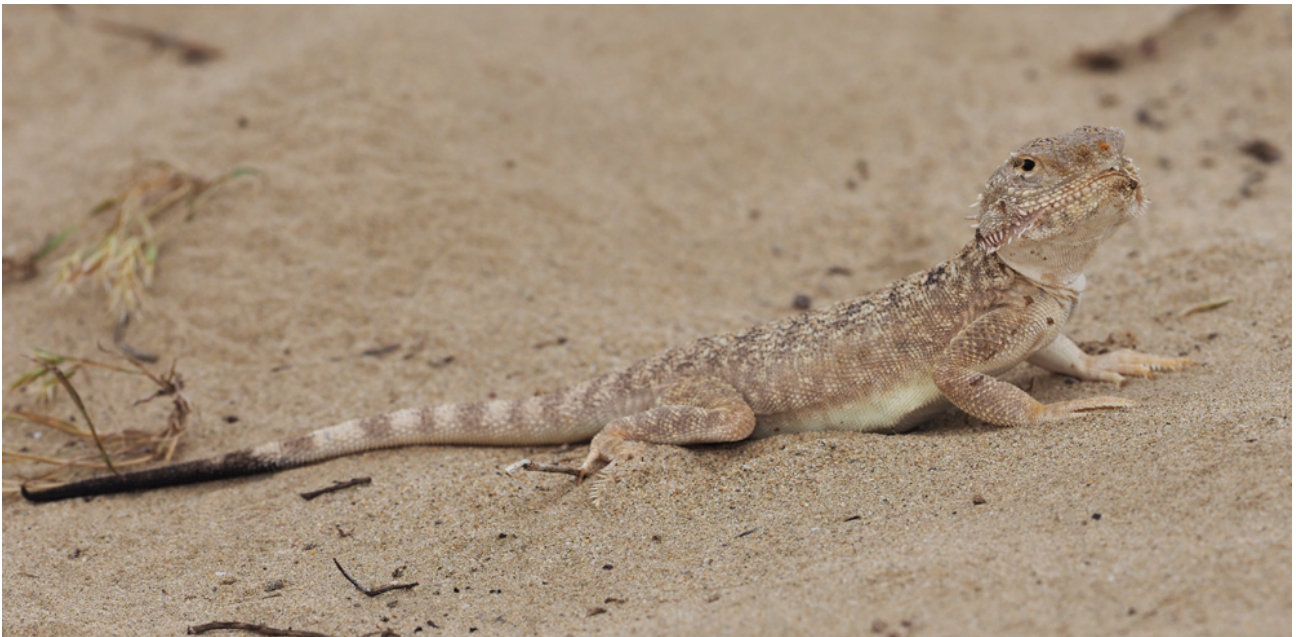
Secret Toad-headed Agama