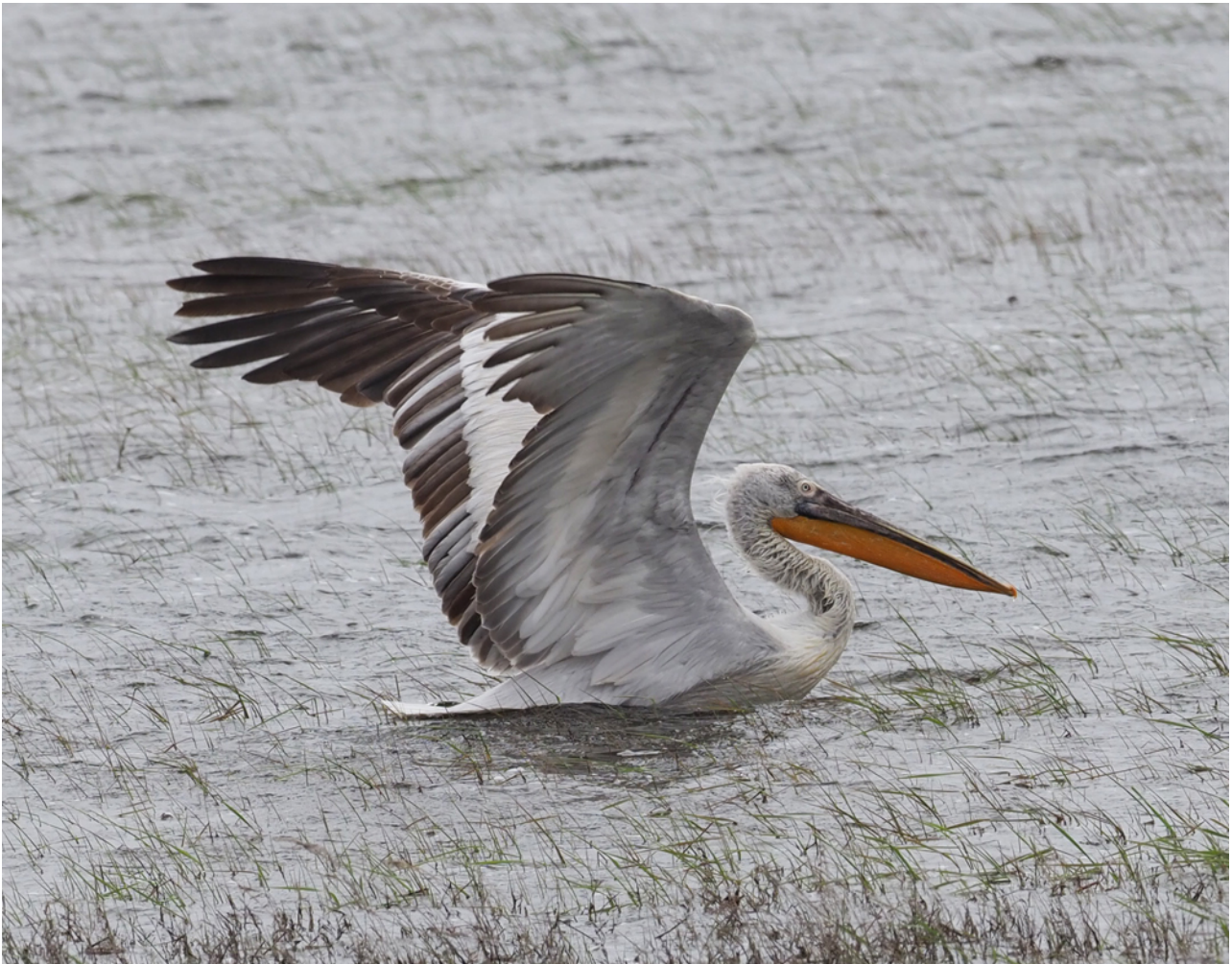
Dalmatian Pelican (Mark Van Beirs)

Common Quail Coturnix coturnix (H) We heard the distinctive song near Bukhara (Uzbekistan). Common Pheasant Phasianus colchicus A single sighting for some and regularly heard. Red-necked Grebe Podiceps grisegena A single bird on a steppe lake near Nur Sultan. Great Crested Grebe Podiceps cristatus Common. Great looks at parents with chicks on their backs. Black-necked Grebe (Eared G) Podiceps nigricollis Regular. Birds with chicks near Almaty. Greater Flamingo Phoenicopterus roseus 500+ on steppe lakes near Nur Sultan. Terrific looks. Black Stork Ciconia nigra A circling bird on the final day of the tour. White Stork Ciconia ciconia Many occupied nests near the Syr Darya in Uzbekistan (race asiatica ). See Note. Glossy Ibis Plegadis falcinellus Small numbers were noted in Uzbekistan. Black-crowned Night Heron Nycticorax nycticorax A few sightings in Uzbekistan and Kazakhstan. Grey Heron Ardea cinerea Regular. Purple Heron Ardea purpurea Just two at a pond near Bukhara. Great Egret (G White E) Ardea alba Small numbers in Kazakhstan. Great White Pelican Pelecanus onocrotalus A circling party of 12 birds in southern Kazakhstan.