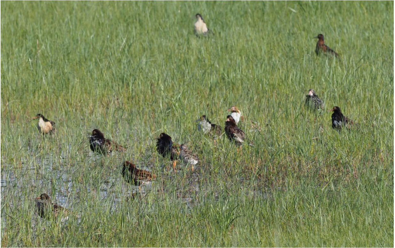
Displaying male Ruff offered quite a spectacle (Mark Van Beirs)

We experienced a fantastic day in the endless steppes, lakes and marshes to the southwest of the capital Nur Sultan. Our very capable local guide took us from one hotspot to the next and we soon amassed a terrific selection of specialities. The severely endangered Sociable Lapwing was one of the targets, as this much-wanted and rarely seen species is doing so very badly, even here in one of its core breeding areas. We were lucky enough to be able to witness some display and obtained cracking scope views of this elegant wader in its steppe habitat. Waders were definitely a feature of the day as we also had excellent looks at large groups of displaying male Ruff. The sheer variety of their splendid finery has to be seen to be believed and their amazing sparring behaviour was quite a sight! Another wader that took our breath away was the graceful Red-necked Phalarope. One of the lakes we visited was covered in pirouetting birds in exquisite breeding attire and we estimated c11,000 birds to be present! Smart, localized White-winged Larks were regularly flushed in the steppe and unusual-looking Black Larks were everywhere. Their rowing display flight