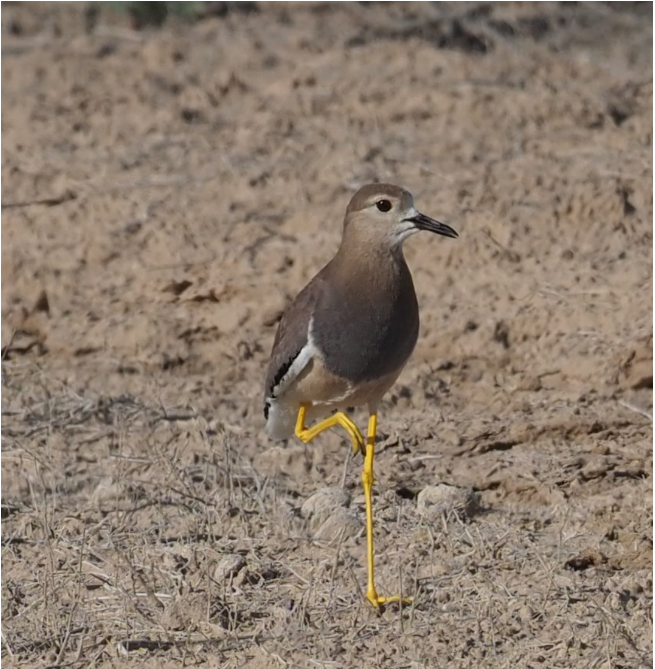
The White-tailed Lapwing has a fairly small range in southwestern Asia (Mark Van Beirs)

visited the famous landmarks of Samarkand: the well-known Registan Square and the mausoleum of Timur. Flocks of screaming Alpine Swifts added to our enjoyment of the unique ambiance of this jewel of the Silk Road.