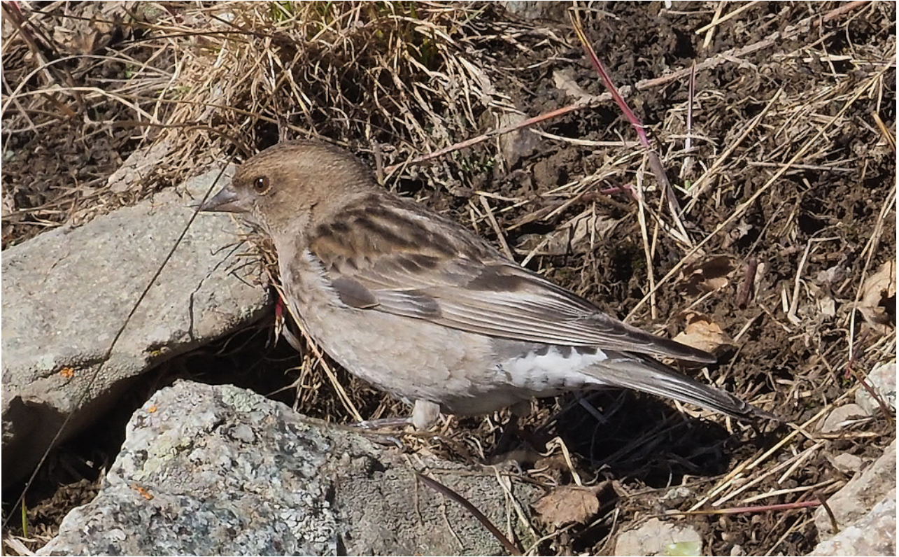
Plain Mountain Finch