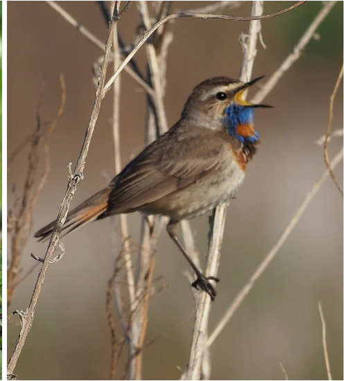
Mistle Thrush; Bluethroat

Rufous-tailed Scrub Robin (R Bushchat) Cercotrichas galactotes Several showed well in the south.