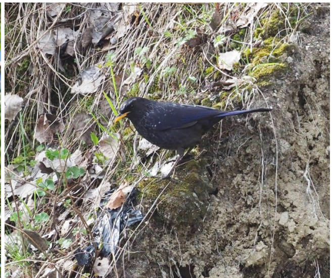
Female White-throated Robin; Blue Whistling Thrush

White-throated Robin ♦ (Iranian) Irania gutturalis Scope views in the Chatkal Range (Uzbekistan).