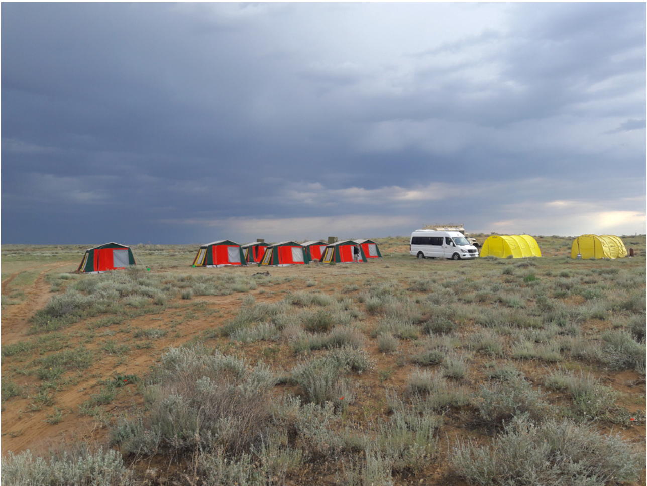
Our camp in the Taukum desert (Mark Van Beirs)