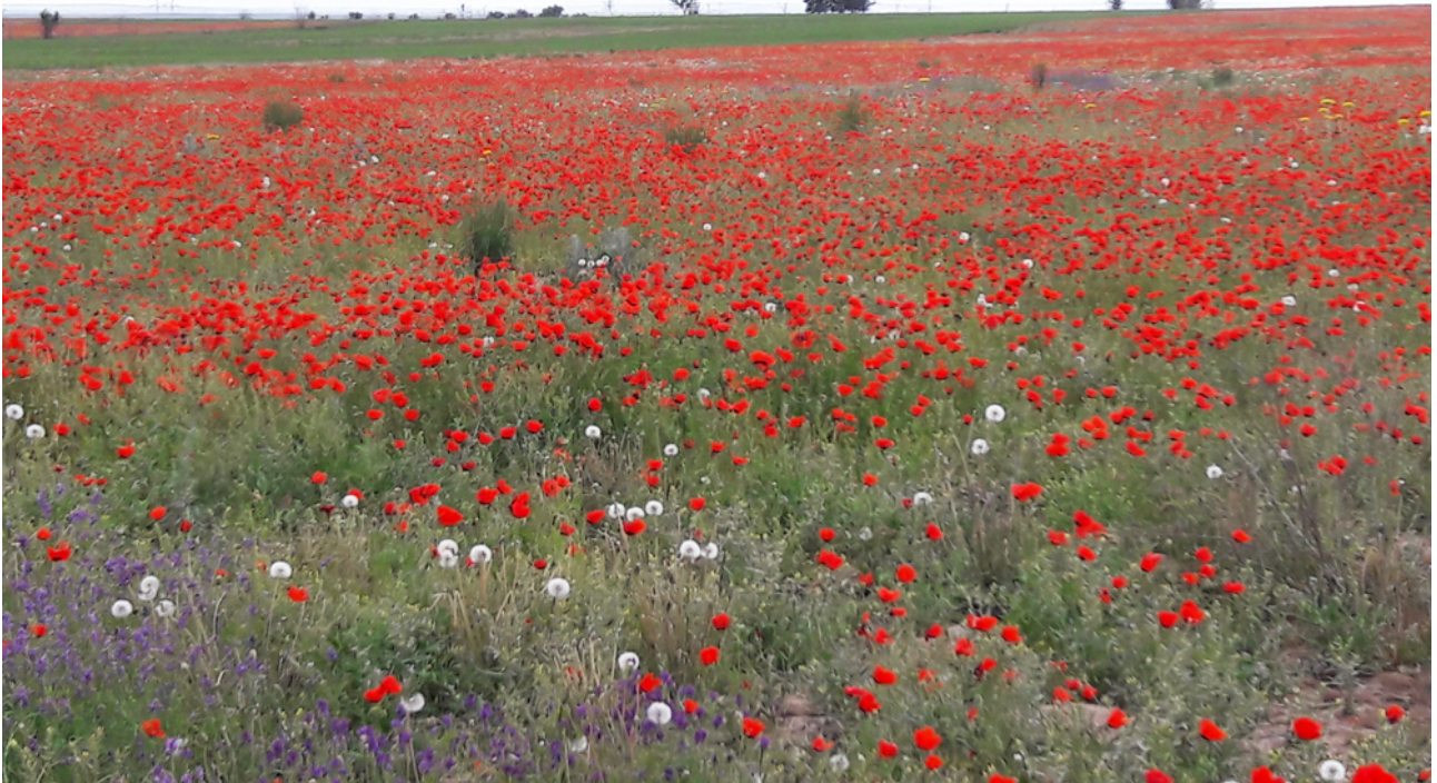
Poppy fields in southern Kazakhstan (Mark Van Beirs)