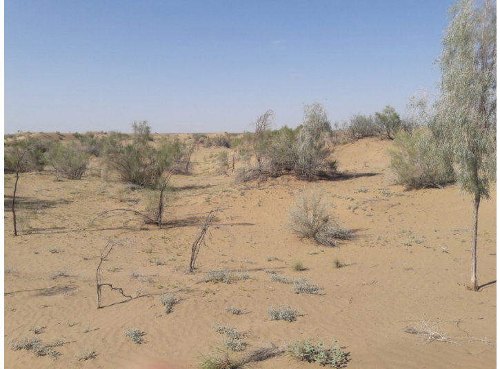
A fledgling Zarudny's Sparrow; The desert habitat of this much-desired species

A very early start got us to the best accessible area of barchan dunes of the Repetek reserve not too long after dawn. In this fabulous habitat of scarcely vegetated, impressive sandy dunes we scanned and scanned and scanned and eventually found a terrific male Zarudny's (or Asian Desert) Sparrow sitting not too far away on top of a small tree. The scope views were very much appreciated and all too soon this rarely-seen splendour flew off. Nearby we found a couple of begging fledgling Zarudny's Sparrows in a dense Saxaul bush, but the parents had obviously fed them well as they were left to themselves for at least another hour. As the temperature was really rising dramatically, we left the area with a big grin on our faces. We had scored on the main bird of the pre-trip! There had been rumours that Zarudny's Sparrow had not been seen at Repetek since 2007, but we felt fairly confident we would be able to find this highly-desired species, as we used to see them regularly on our 1990 tours to the area and the habitat hasn't really changed. In those days it was still treated as a race of the widespread Desert Sparrow, which is quite easy to see in Morocco. We drove to a nearby dune slack where a drinking station for sheep and cattle provided some bird activity. Attractive Desert Finches and clean-looking 'bactrianus' House Sparrows were regular visitors and we also