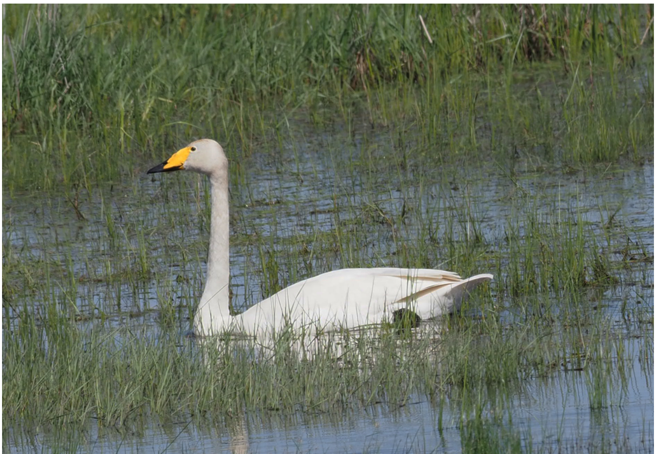
Whooper Swan

Greylag Goose Anser anser Regular sightings of the race rubrirostris in Kazakhstan.