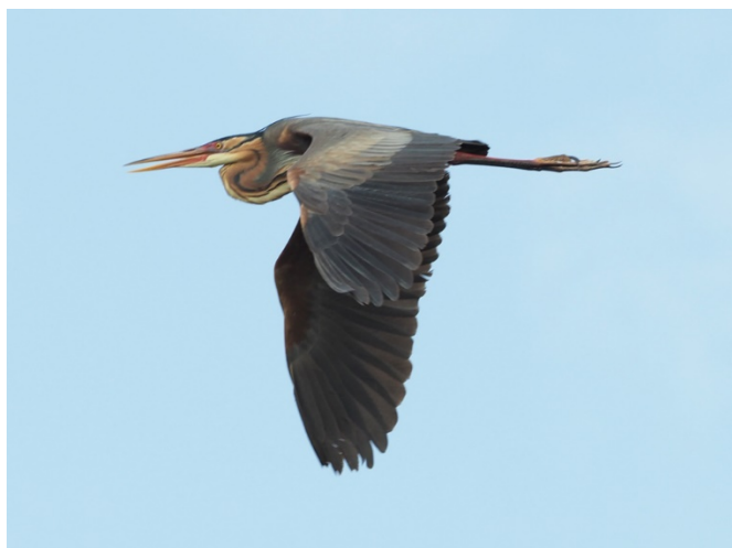
The attractive Masked Wagtail is one of the better looking races of White Wagtail; The widespread Purple Heron always attracts attention

We spent the early part of the next morning in an area of Saxaul scrub not far from Bukhara. The best bird here was without a doubt the dainty Streaked Scrub Warbler, a party of which we saw hopping about in the undergrowth. This localized species has recently been placed in its own family, so it has become a really important bird. We also found Ruddy Shelduck and Red-tailed Shrike, while we regularly heard the characteristic calls of Common Pheasant. A nearby saline lake held several smart Pied Avocets next to already encountered waders and not much further we explored a reed-lined freshwater lake. The highlight here was a pair of rarely-observed Marbled Duck, while several splendid White-tailed Lapwings gave quite a show. We also noted Gadwall, Eurasian Teal, Black-tailed Godwit, Curlew Sandpipers in exquisite breeding plumage, Wood Sandpipers, displaying Common Terns, Black-bellied Sandgrouse, Rufous-tailed Scrub Robin and a Common Sand Boa. A tamarisk grove gave us European and Blue-cheeked Bee-eaters, Great Tit (of the Turkistan variety), a furtive male Menetries's Warbler and a posing Common Nightingale. In late morning we boarded our faithful, spacious bus and drove northeast to the famous city of Samarkand. The drive took us through fertile fields and orchards along the base of the Zeravshan range. In late afternoon we