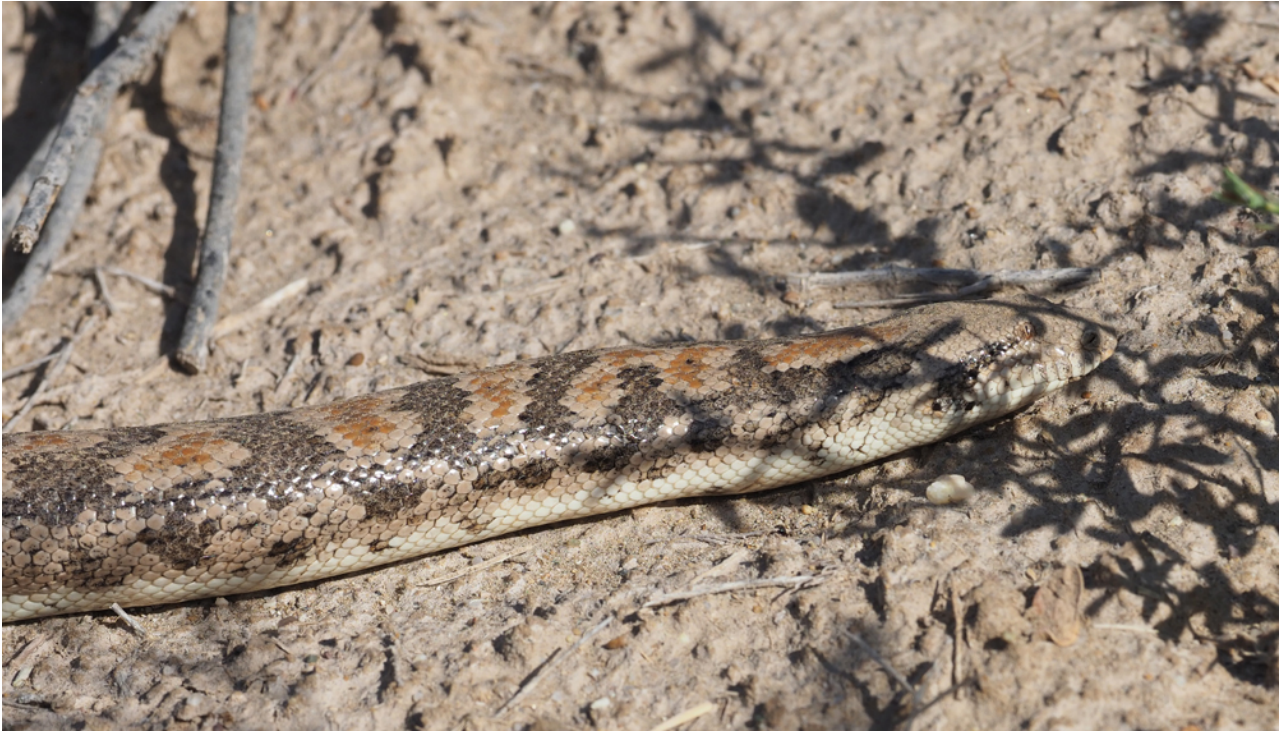
Common Sand Boa