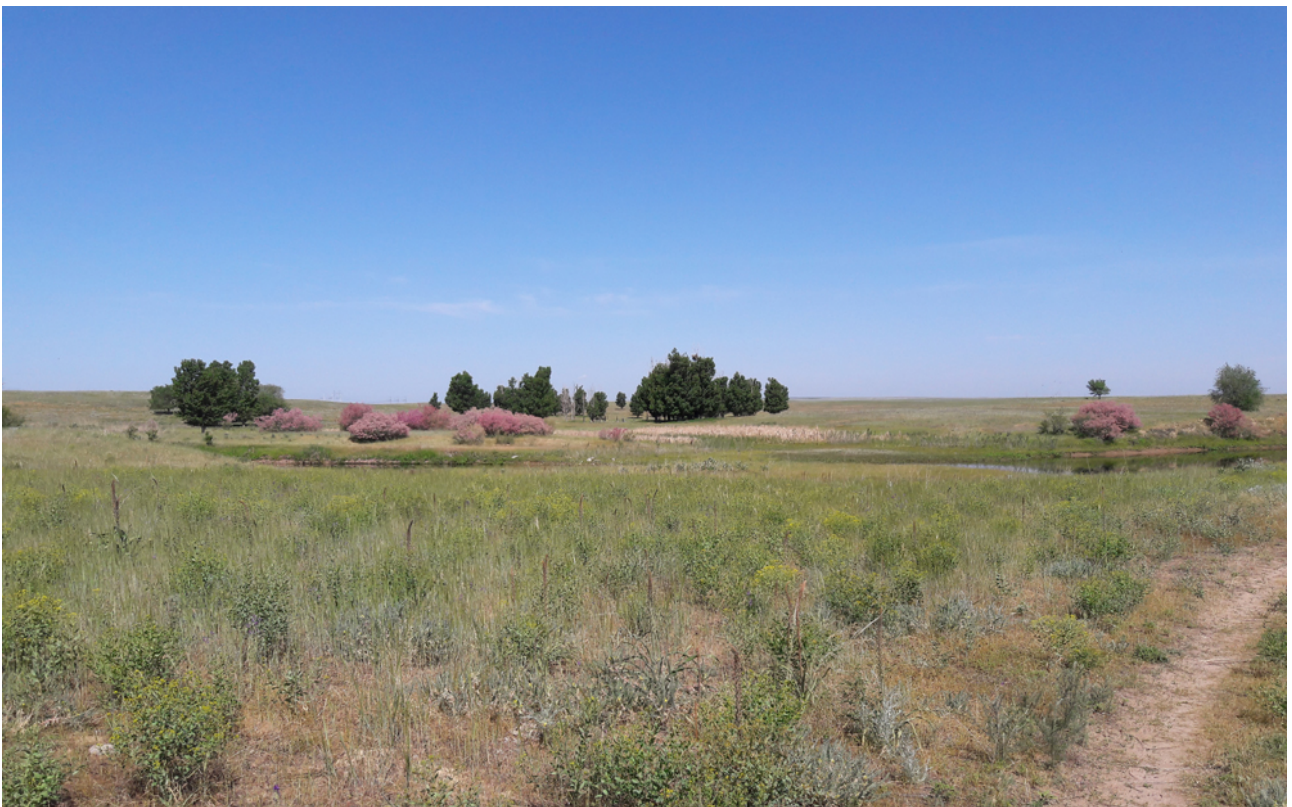
Steppe scenery at the edge of the Taukum desert (Mark Van Beirs)