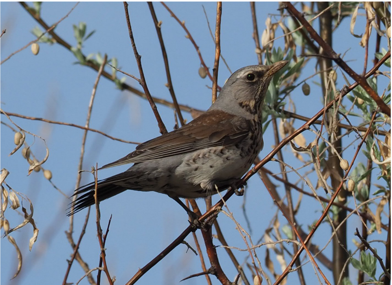
Fieldfare (Mark Van Beirs)

Fieldfare Turdus pilaris Great looks at several in a park in Nur Sultan.