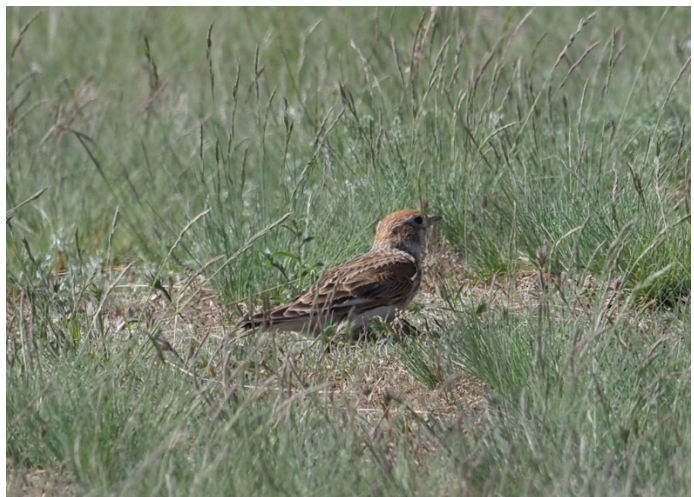
Pander's Ground Jay; White-winged Lark

Pander's Ground Jay ♦ Podoces panderi Great encounters in Turkmenistan and Uzbekistan. See Note.