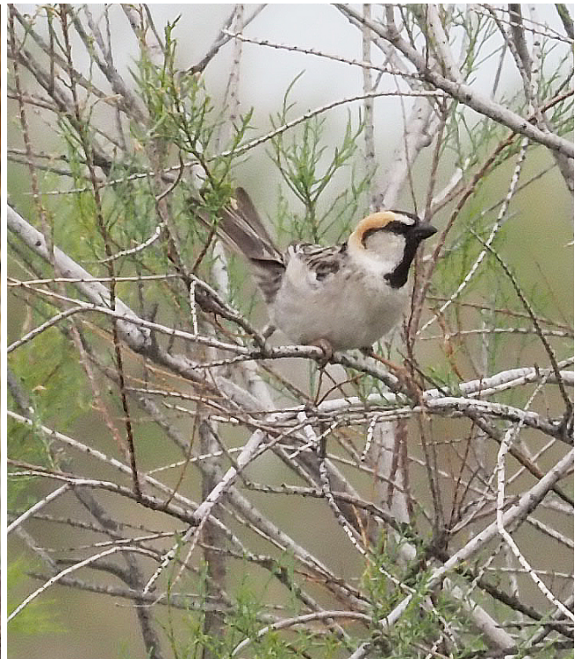
Brown Dipper; Saxaul Sparrow

Brown Dipper Cinclus pallasii Perfect looks at two in the Tien Shan (Kazakhstan). See Note.