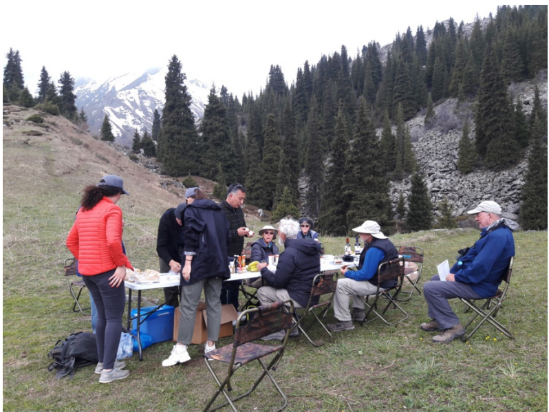
Yellow Ground Squirrel; Picnic lunch in the Tien Shan