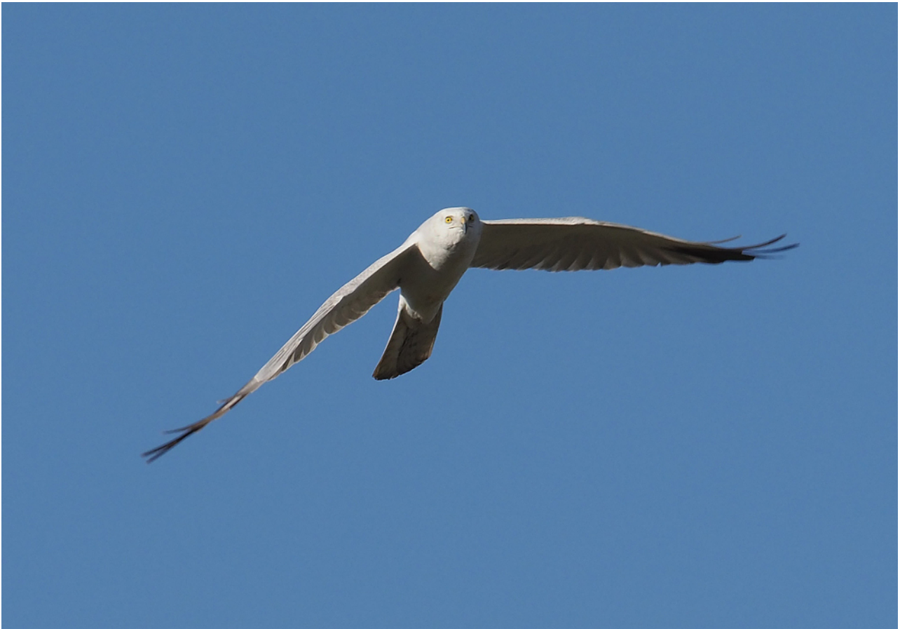
Male Pallid Harriers were regularly encountered in the steppes of northern Kazakhstan (Mark Van Beirs)

Buzzards, Slender-billed, Black-headed, Mew and Steppe Gulls, Caspian, Gull-billed, Black and superbly attractive White-winged Terns, Short-eared Owl, Hooded Crow, Eurasian Skylark, Booted Warbler, Lesser Whitethroat, Fieldfare, gorgeous Bluethroats, Siberian Stonechat, Northern Wheatear, Sykes's Wagtail (the beema subspecies of Western Yellow Wagtail) and Twite (of the subspecies kirghizhorum ) were other noteworthy species of this bird-filled day.