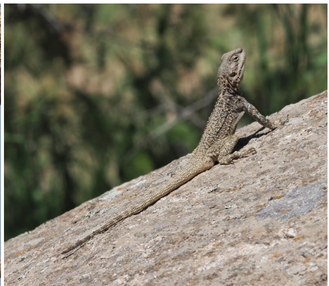
Steppe Agama; Turkestan Rock Agama