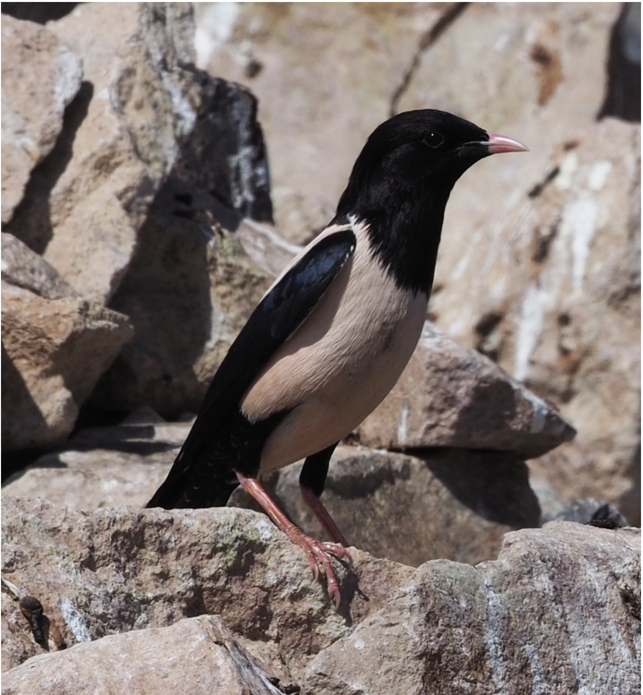
Gorgeous Rosy Starlings were regularly seen in swirling flocks, but we also observed them at a bustling colony (Mark Van Beirs)