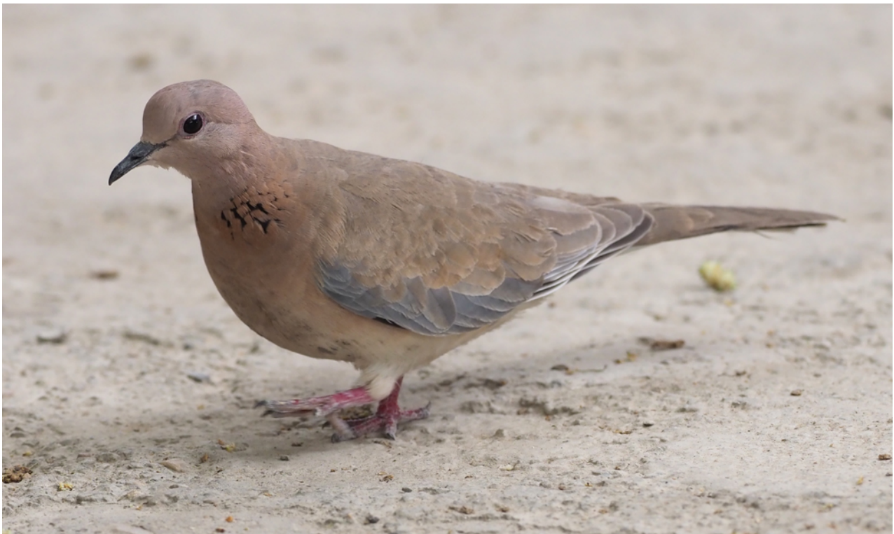
Laughing Dove (Mark Van Beirs)

Laughing Dove (Palm D) Spilopelia senegalensis Many in Turkmenistan and Uzbekistan. Common Cuckoo Cuculus canorus Small numbers all along our route. Also a rufous morph. Tawny Owl Strix aluco Terrific looks at our Chatkal hotel in Uzbekistan. Little Owl Athene noctua A single bird showed well near Bukhara. Short-eared Owl Asio flammeus Three performed nicely in the northern Kazakhstan steppes.