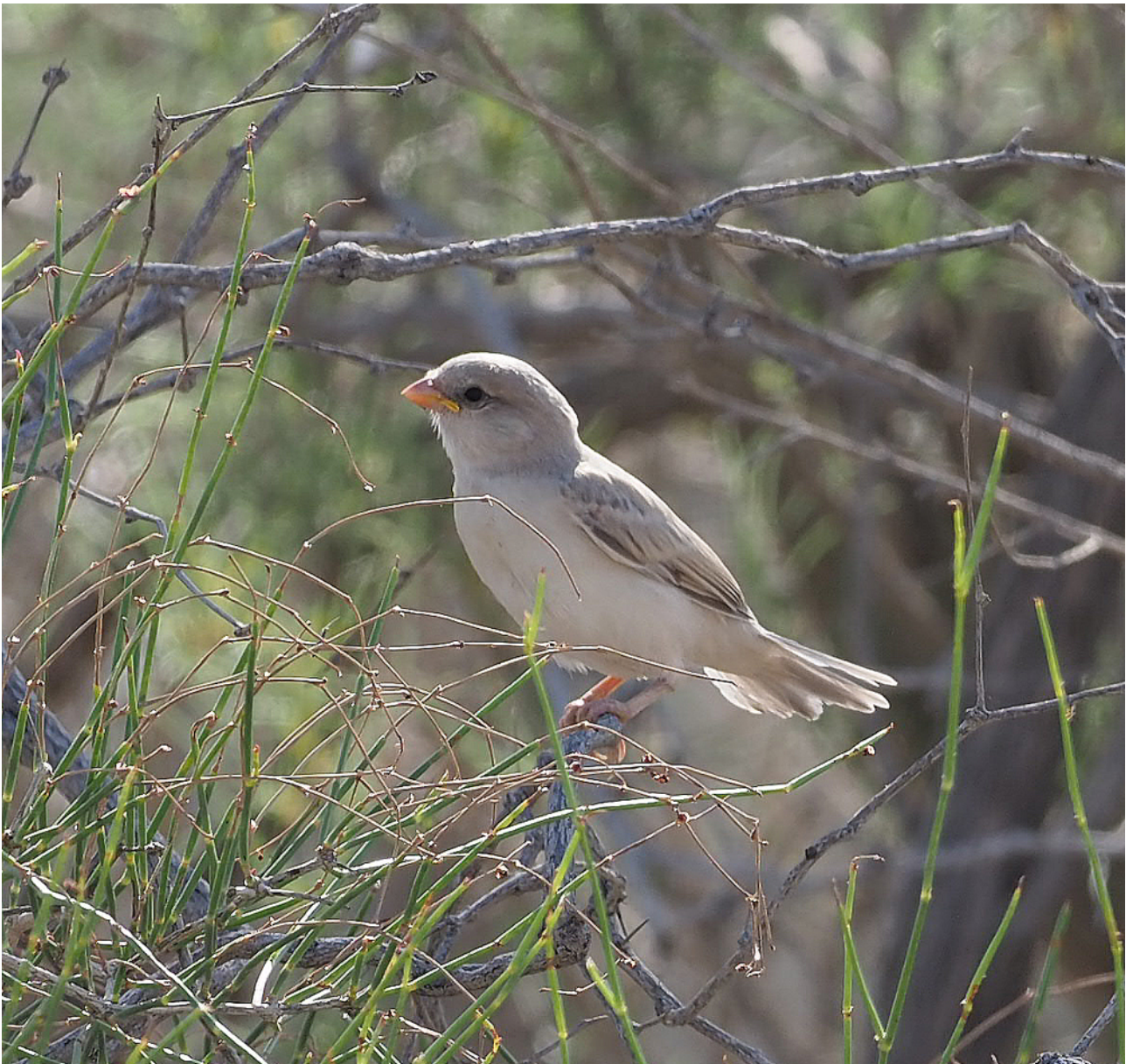
A fledgling Zarudny's Sparrow (Mark Van Beirs)

Eurasian Tree Sparrow Passer montanus Regular.