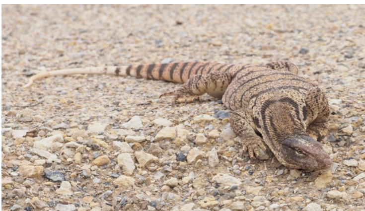
The Eurasian Hoopoe is a truly unique species; This impressive Desert Monitor Lizard was enjoying the early sun (Mark Van Beirs)

trio of smart Blue-cheeked Bee-eaters. We had lunch overlooking a lake where Kentish and Greater Sand Plovers, Ruff, Little Stint, Red-necked Phalarope, Common and Green Sandpipers and Common Greenshank were feeding along the muddy shore. A good selection of wagtails was also present here, as Grey-headed, Citrine, Grey, White and Masked Wagtails all showed well. We also noted Gadwall, Grey Heron, Great Cormorant, Western Marsh Harrier, Eurasian Coot, Collared Pratincole, Caspian Gull and Little Tern. In the nearby desert we located Little Owl, Oriental Skylark, Sand Martin, a female Bluethroat and Desert Finches. On the return journey we visited some reedy lakes where White-tailed Lapwing was the highlight. Two gorgeous drakes Red-crested Pochard flew over and Purple Heron, Glossy Ibis and Black-winged Stilt also made their way to the list.