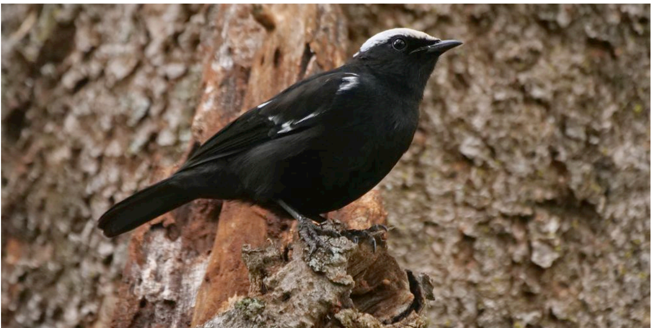
Arnot's Chats are easy to see at Nkanga Conservation Area. (Nik Borrow)