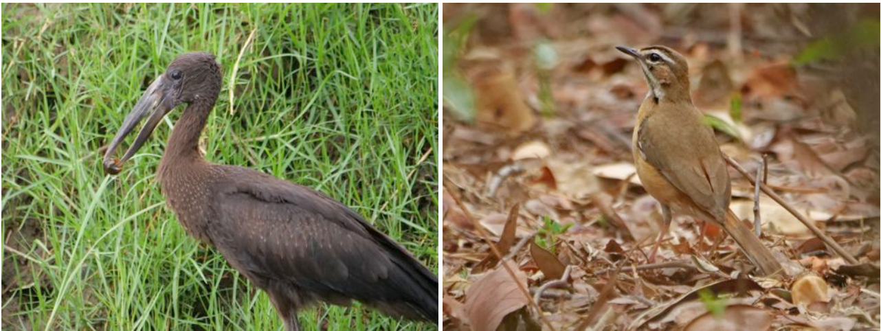
A juvenile African Openbill delicately selects a snail during our 'sunset cruise' (left) and an obliging Bearded Scrub Robin in the garden of our comfortable lodge on the banks of the Zambezi River. (Nik Borrow)

simply amazing Victoria Falls where we were quite happy to do the 'tourist thing' and gaze alongside the angels of David Livingstone on the spectacle in front of us. Here the mighty Zambezi widens to nearly two kilometres broad in the wet season before plunging vertically downwards. As we approached the falls dense clouds of water vapour hung over the area on the Zimbabwean side and the sight of millions of tons of water dropping into chasms over 100 metres deep was awe-inspiring. Rainbows arched through the fine spray before vanishing into the gorges far below us. Not only that but there were also a few birds to be seen and it was good to start the tour with beautiful species such as Schalow's Turaco and the pretty little Red-throated Twinspot. More widespread species included Black-collared Barbet, Pied Crow, Dark-capped Bulbul, Terrestrial Brownbul, Wire-tailed Swallow, Rock Martin, Yellow-breasted Apalis, Grey-backed Camaroptera, African Yellow White-eye, Red-winged Starling, White-browed Robin-Chat, Collared Sunbird and Blue Waxbill and it was a bit of a surprise to see a Natal Spurfowl in this touristy place. We left the falls passing some roadside African Elephants and then stopped for a pleasant lunch in Livingstone itself before making the short journey to our pleasantly situated lodge some way upriver on the banks of the Zambezi itself.