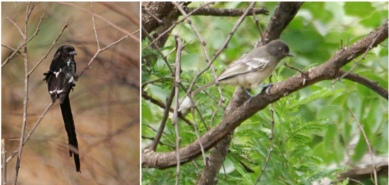
Magpie Shrike along the Machile road (left) and Cinnamon-breasted Tit at Cecil Kop (right).

Miombo Tit (M Grey T) Melaniparus griseiventris Seen in miombo in both countries. Grey Penduline Tit (African P T) Anthoscopus caroli At the nest in the Machile area and seen at Nkanga, Zambia. Eastern Nicator Nicator gularis Seen well at Mutulanganga, Zambia. Rufous-naped Lark Mirafra africana Seen well at Nkanga, Zambia.