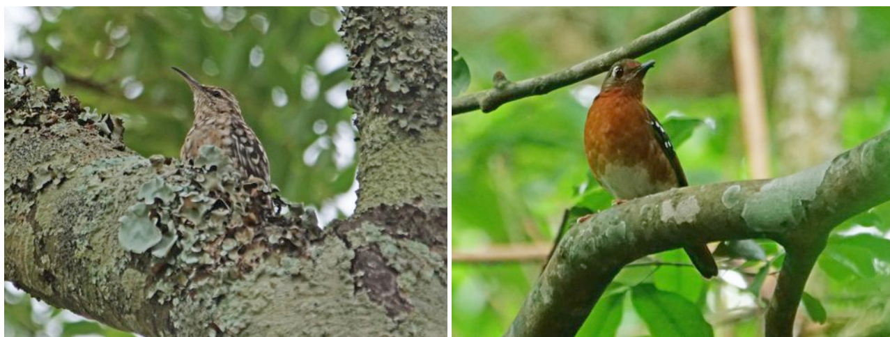
African Spotted Creeper (left) at Cecil Kop and Orange Ground Thrush (right) in the Vumba Highlands, both in Zimbabwe.

Green-capped Eremomela Eremomela scotops Small numbers seen at Nkanga in Zambia. Arrow-marked Babbler Turdoides jardineii Groups at Camp Nkwazi and the Machile area, Zambia. Garden Warbler Sylvia borin 1 of these Palearctic migrants at Mutulanganga, Zambia. Common Whitethroat Sylvia communis 2 of these Palearctic migrants at Mutulanganga, Zambia. African Yellow White-eye (Southern Y W) Zosterops [senegalensis] anderssoni Widespread sightings throughout. Southern Hyliota Hyliota australis 3 seen at Nkanga, Zambia. African Spotted Creeper Salpornis salvadori 1 seen well at Cecil Kop in Zimbabwe. Common Myna (Introduced) Acridotheres tristis Seen in Mutare, Zimbabwe. Wattled Starling Creatophora cinerea 10+ at Nkanga, Zambia. Greater Blue-eared Starling Lamprotornis chalybaeus Just 1 noted at Mutare in Zimbabwe. Miombo Blue-eared Starling (Southern B-e S) Lamprotornis elisabeth Numerous at Nkanga, Zambia. Meves's Starling Lamprotornis mevesii Common in the Machile area, Zambia. Burchell's Starling Lamprotornis australis Common in the Machile area, Zambia. Violet-backed Starling Cinnyricinclus leucogaster Seen at Nkanga, Zambia and Cecil Kop, Zimbabwe. Red-winged Starling Onychognathus morio Common at Victoria Falls and in the Vumba, Zimbabwe. Red-billed Oxpecker Buphagus erythrorhynchus Small numbers seen in southwestern Zambia. Orange Ground Thrush Geokichla guneyi Excellent views in the Vumba, Zimbabwe.