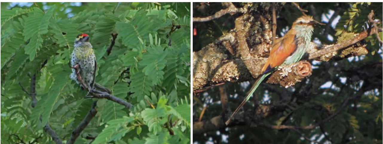
Miombo Pied Barbet (left) and Racket-tailed Roller (right) showed particularly well for us in the Miombo.

We were still missing miombo birds and so the remainder of our time in the Nkanga area was spent searching the dry woodlands in search of the missing species but as always with this habitat it was tough going however persistence paid off as we found several Racket-tailed Rollers and enjoyed repeated viewings of these desirable birds. We also succeeded in finding several Miombo Pied Barbet and the roving bird parties also held Red-capped Crombec and Southern Black, Rufous-bellied (heard only) and Miombo Tits as well as Narina Trogon, White-breasted Cuckooshrike, Eurasian Golden and Black-headed Orioles, Long-billed Crombec, Neddicky, Stierling's Wren-Warbler, Green-capped Eremomela, Southern Hylia, Kurrichane Thrush, Pale, Spotted and Collared Flycatchers, Amethyst Sunbird, Reichard's and Black-eared Seedeaters and Cabanis's Bunting. Other sightings in these woodlands included European Honey Buzzard, Lizard Buzzard, Gabar Goshawk, Crowned Hornbill, Short-winged Cisticola and Wood and Tree Pipits.