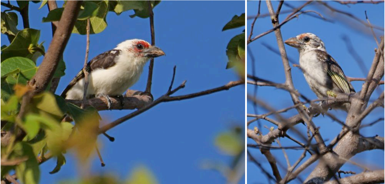
An adult (left) and one of the juveniles (right) Chaplin's Barbets that we found in the Nkanga Conservation Area. (Nik Borrow)

dapper Rufous-bellied Heron and some Blacksmith Lapwings.