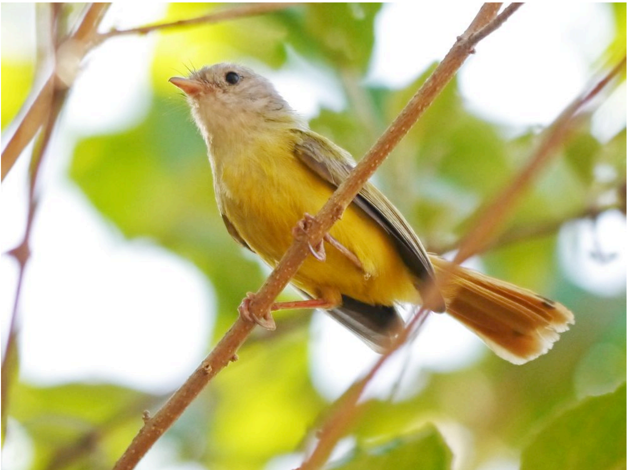
Livingstone's Flycatcher is an interesting species in the Erythrocercidae, a family comprising of just three African species. (Nik Borrow)

We had to leave well before dawn the following morning because we needed to be on site early in the darkness straining our ears for the frog-like 'blip' of the pitta but as the grey light of dawn permeated the skies and the dawn chorus started up there was no sound from the bird that we so wanted to hear. We descended into a dry river bed that could lead us through the dense thickets and located the place where the bird had been seen two days previously but still nothing. It seemed that despite playing the game to the rule book the bird was not co-operating but then for no reason at all after an hour of trying to provoke an aural response an African Pitta suddenly flew up onto a perch in front of us in full view but as rapidly it disappeared from sight but fortunately proceeded to call from deeper in the thicket. There were some tense moments until we had relocated the bird but we need not have worried for the bird continued to call intermittently for the next couple of hours and we had some excellent views when it chose to come closer and were able to watch the bird leap on its perch spreading the wings and cocking the tail with each jump. Our success had been total and absolute and so quickly when we had timetabled three mornings to find the bird and it was done and dusted before breakfast!