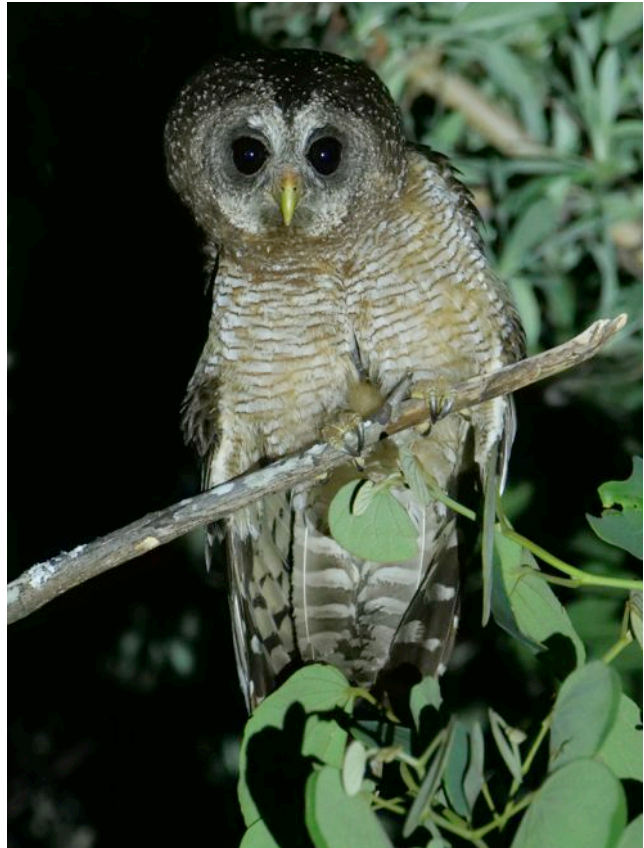
Southern Carmine Bee-eater seen during our excursion to the Machile River IBA (left) and an African Wood Owl at our camp (right).

Leaving Livingstone behind we travelled northeastwards towards Choma for our next stay at a ranch in the Nkanga River Conservation Area. We arrived at the delightful Masuku Lodge around lunchtime where the tame Arnot's Chats that frequented the garden have even nested in the lounge inside the house! The dam below the lodge held White-faced Whistling Duck, Little Egret, African Fish Eagle, African Wattled Lapwing and Giant Kingfisher whilst high overhead a Crowned Eagle was displaying. Also, around the garden were Lesser and Greater Honeyguides, Bennett's Woodpecker, Meyer's Parrot, Chinspot Batis, Black-crowned and Brown-crowned Tchagras, Miombo Blue-eared and Violet-backed Starlings, Yellow-throated Petronia, Pin-tailed Whydah and Yellow-fronted Canary.