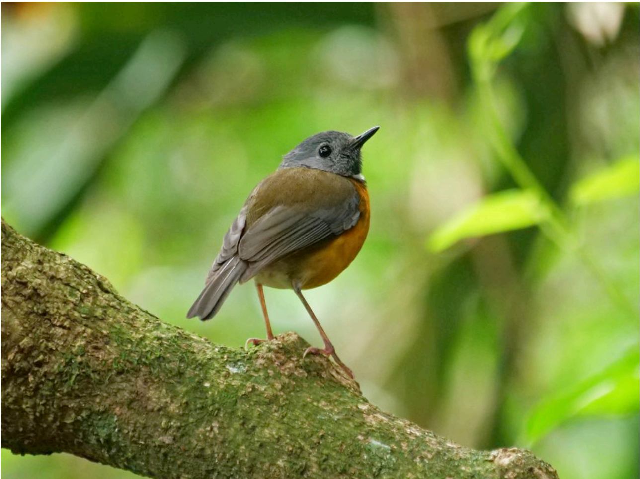
The gorgeous little Swynnerton's Robin is one of the star attractions in the Vumba Mountains in Zimbabwe.