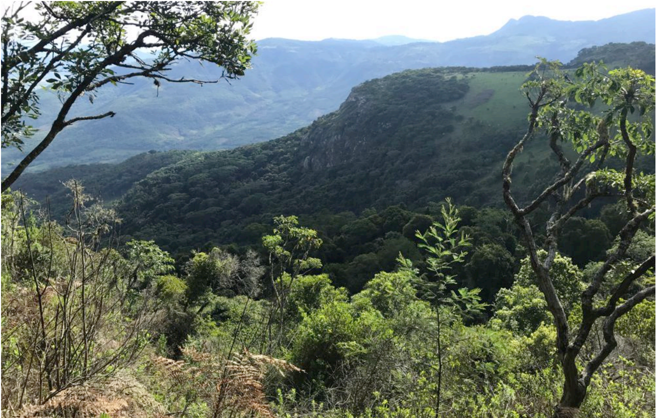
The beautiful Vumba Mountains produced an excellent selection of specialties of this region. (Nik Borrow)

Variable Sunbird, Red-collared Widowbird and Streaky-headed Seedeater. Driving back through Mutare we stopped for a roadside flock of Abdim's Stork and there were also Greater Blue-eared Starling, House and Northern Grey-headed Sparrows, and introduced Crested Mynas. After lunch we returned to the Vumba where we managed to tease out a few more species. We glimpsed Eastern Bronze-naped Pigeon, only Nik managed to see Black-fronted Bushshrike but we all saw some Red-faced Crimsonwings feeding in the canopy. Over the forest were small numbers of African Black and White-rumped Swifts and Common House Martin.