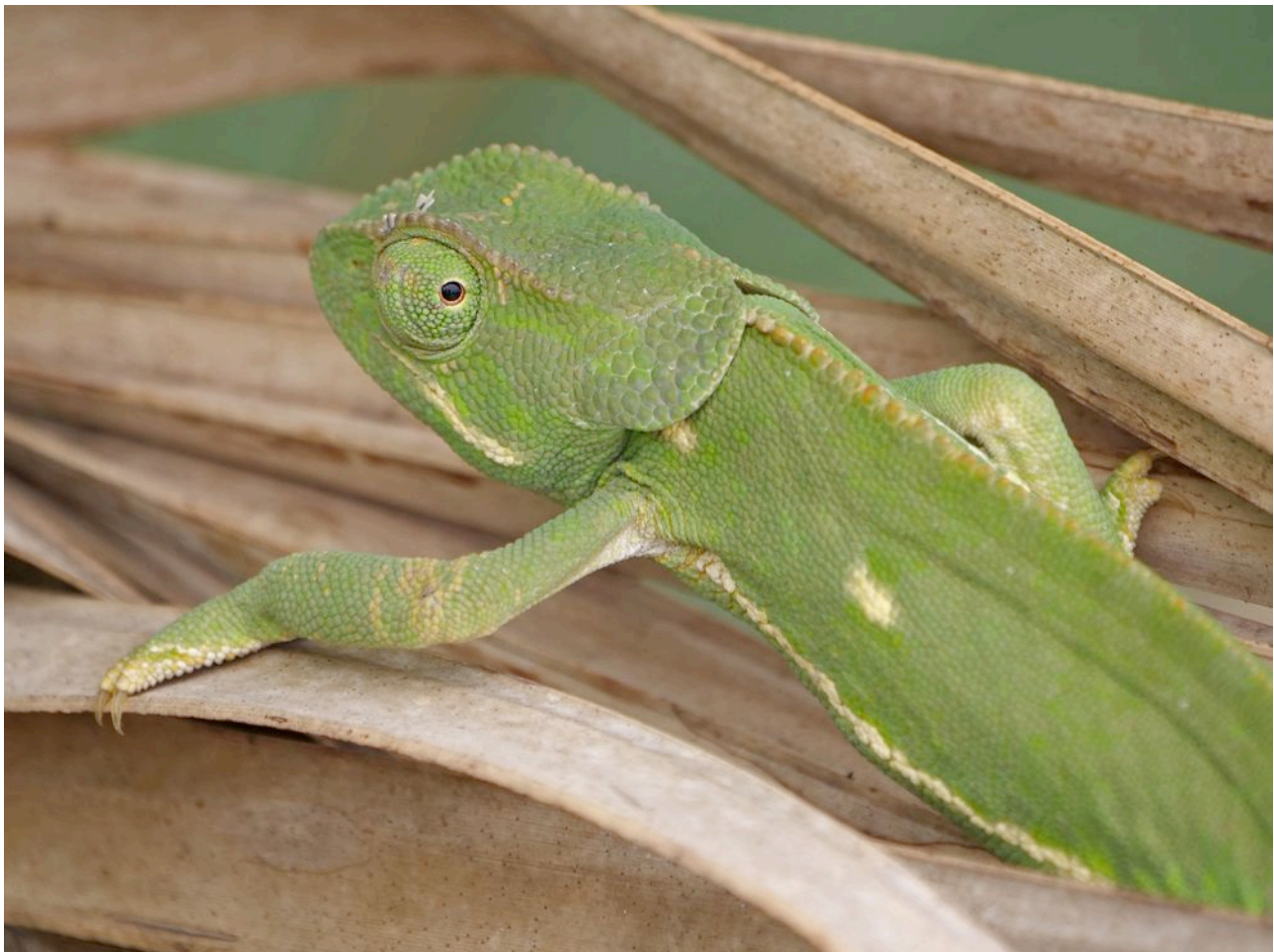
Flap-necked Chameleon seen along the Machile Road, Zambia. (Nik Borrow)