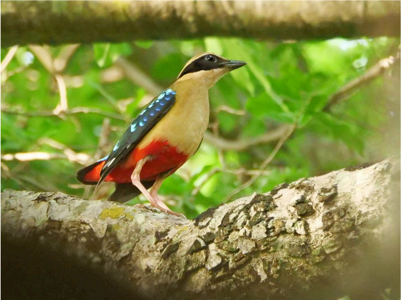
The trip highlight was certainly our wonderful encounter with the marvellous African Pitta in the Zambezi Valley.