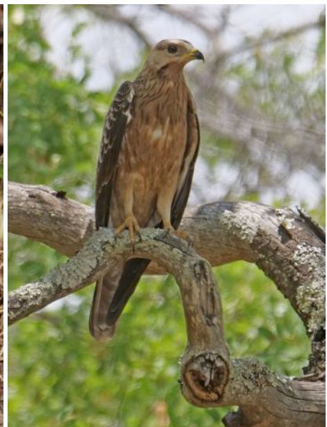
Swainson's Francolins (left) were quite easy to see along the Machile IBA road. A European Honey Buzzard (right) in the Nkanga Conservation area.