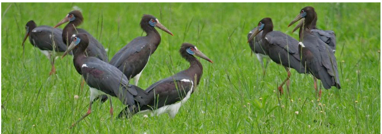
Part of a flock of Abdim's Storks in Mutare.

The drive back to Harare was uneventful but we managed to tick off Greater Striped Swallow on the way and still got back to the airport in good time. This had been a very specialised trip covering two countries and geared up to search out the notoriously elusive African Pitta and some of the endemics and specialties of the region which we currently do not see on other tours. We had been extremely successful in tracking down some of these remarkable birds even though the miombo had been hard work as it often can but we had persevered enough to make sure that we had seen the best of what these countries had to offer.