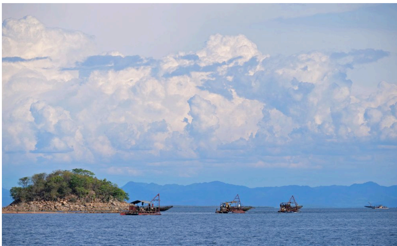
Fishing boats on Lake Kariba.