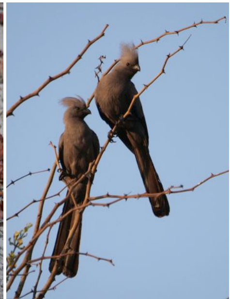
Water Thick-knees (left) were seen during the Zambezi boat trip. Grey Go-away-birds (right) in the Machile River area. (Nik Borrow)

Senegal Coucal Centropus senegalensis Small numbers seen at Nkanga, Zambia. Coppery-tailed Coucal Centropus cupreicaudus 1 seen during the Zambezi boat trip on the Zimbabwe side. White-browed Coucal Centropus superciliosus Widespread sightings in Zambia. Black Coucal Centropus grillii 2 at Nkanga, Zambia. Levaillant's Cuckoo Clamator levaillantii Heard in the Machile Area and seen at Mutulanganga, Zambia. Jacobin Cuckoo (Black-and-white C) Clamator jacobinus 4 at Mutulanganga, Zambia. Diederik Cuckoo (Didric C) Chrysococcyx caprius Heard more than seen in Zambia. Klaas's Cuckoo Chrysococcyx klaas Heard more often than seen in both countries. African Emerald Cuckoo Chrysococcyx cupreus Heard more than seen in Zambia. Barred Long-tailed Cuckoo Cercococcyx montanus 1 seen at Mutulanganga, Zambia. Black Cuckoo Cuculus clamosus 2 sightings in the Machile area and Mutulanganga, Zambia. Red-chested Cuckoo Cuculus solitarius Heard more often than seen in both countries. African Cuckoo Cuculus gularis (H) Possibly seen in the Machile area but heard at Nkanga in Zambia. Western Barn Owl Tyto alba At least 2 if not 3 at Camp Nkwazi, Zambia. African Wood Owl Strix woodfordii A pair seen well at night at Camp Nkwazi, Zambia. Square-tailed Nightjar (Gabon N) Caprimulgus fossii Seen on the roads at night in Zambia. African Palm Swift Cypsiurus parvus Common, with widespread sightings in both countries.