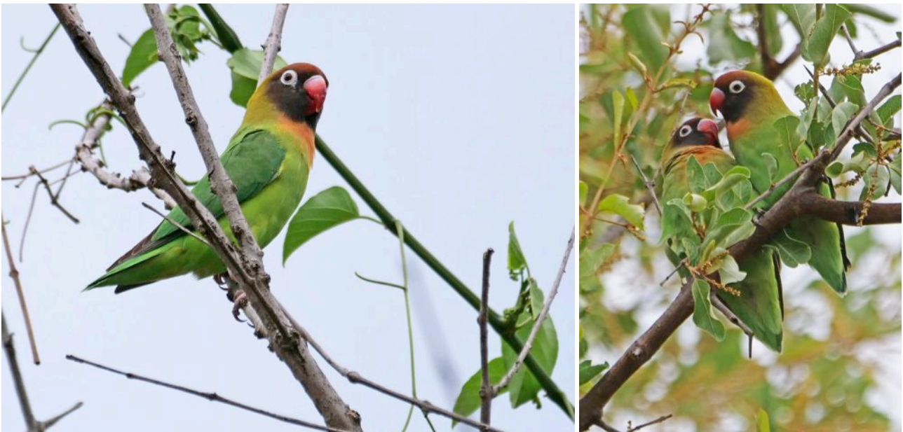
The gorgeous Black-cheeked Lovebird is virtually a Zambian endemic as records from outside of the country probably relate to wanderers or escapees. (Nik Borrow)

restricted range Black-cheeked Lovebird that favours the mopane woodland to the north and west of this area. Our current visit was at the beginning of the rainy season but recent downpours had seemingly soaked straight into the parched land as surface water was still most certainly lacking. The lovebirds are known to congregate in large numbers around the dwindling water supplies in the Machile River area and we hoped that this would still be the case for our visit. We set off very early in the morning before dawn in our sturdy four wheel drive vehicles which we hoped would be perfect for combatting the sandy tracks that lead into the interior of some very remote country. A Square-tailed Nightjar was seen in the headlights but otherwise there was a singular lack of night birds. The journey is not completely straightforward as the maze of tracks interweave but eventually we arrived at the drinking pools where, as hoped for the lovebirds were ready and waiting for us. For the most part these pretty little parrots seemed to prefer feeding high in the trees and the large flocks were quite restless moving from one place to another but we enjoyed wonderful views of them once we had tracked them down to where they were feeding in a huge fruiting fig tree and were then able to watch them for as long as we wished. Listening to their shrill calls and studying them feeding was an amazing experience!