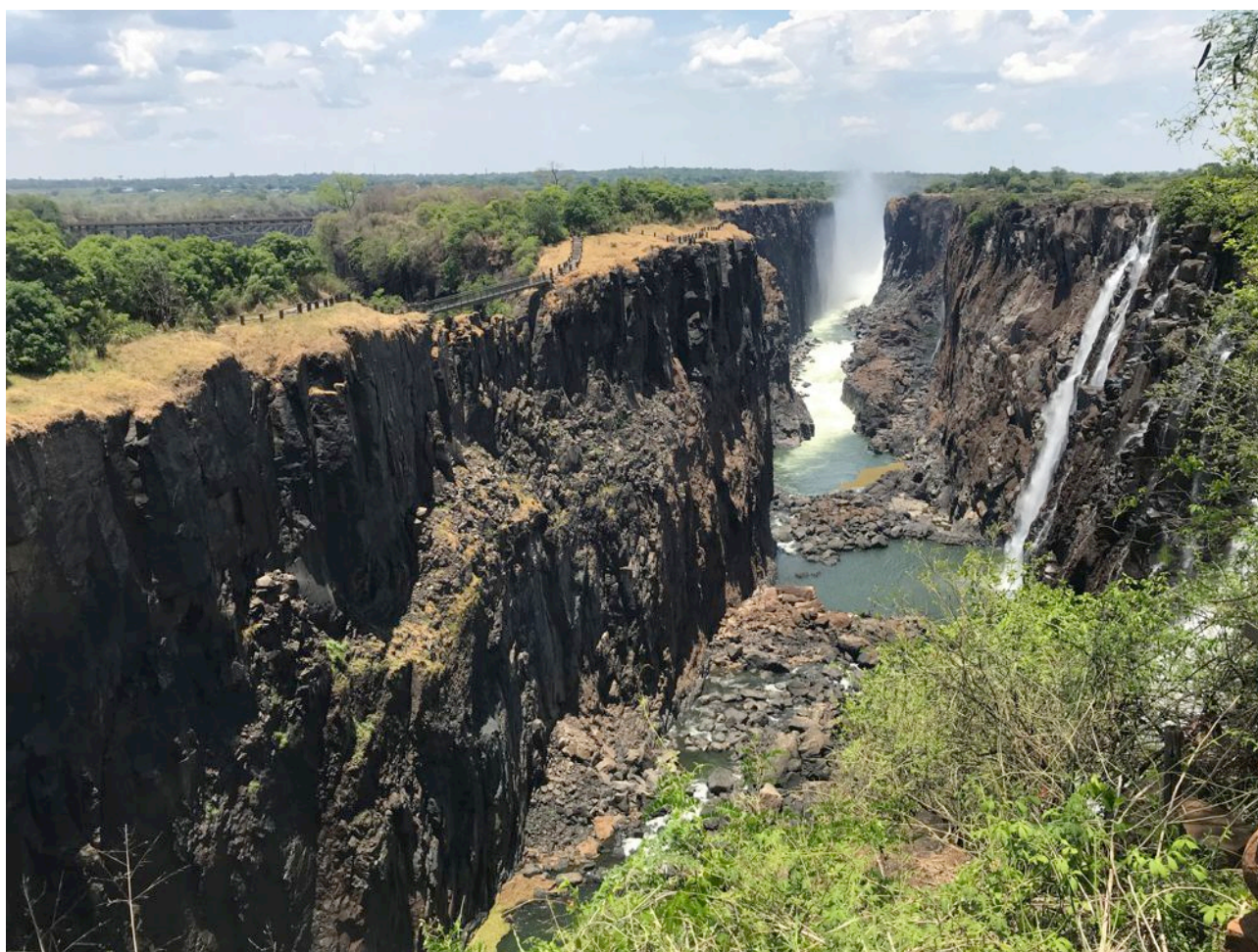
The Victoria Falls were relatively dry at the time of our visit but even the scale of the gorge is impressive.

The tour began in Livingstone and we immediately transferred to our vehicles which took us directly to the