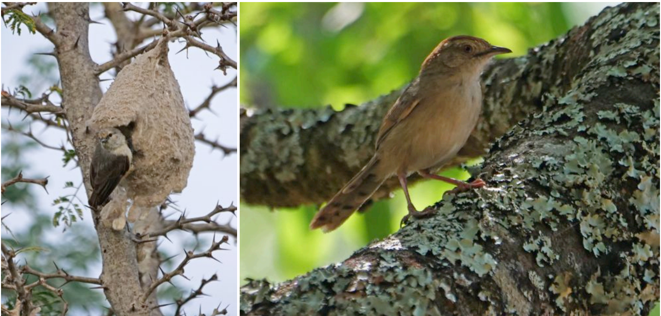
Grey Penduline Tit at its wonderful nest (left) in the Machile River area and Lazy Cisticola (right) at Cecil Kop in Zimbabwe. (Nik Borrow)

Rattling Cisticola Cisticola chiniana Seen well at Nkanga and Mutulunganga area, Zambia. Wailing Cisticola Cisticola lais 1 seen in the Vumba, Zimbabwe. Croaking Cisticola Cisticola natalensis Small numbers seen at Nkanga in Zambia. Short-winged Cisticola (Siffling C) Cisticola brachypterus Small numbers seen at Nkanga in Zambia. Neddicky (Piping Cisticola) Cisticola fulvicapilla Just 1 was seen at Nkanga, Zambia. Tawny-flanked Prinia Prinia subflava Widespread sightings in both countries. Roberts's Warbler Oreophilais robertsi Easily seen in the Vumba, Zimbabwe. Bar-throated Apalis Apalis thoracica Easily seen in the Vumba, Zimbabwe. Yellow-breasted Apalis Apalis flavida Widespread sightings in both countries. Chirinda Apalis Apalis chirindensis Easily seen in the Vumba, Zimbabwe. Grey-backed Camaroptera Camaroptera brevicaudata Widespread sightings in Zambia. Stierling's Wren-Warbler Calamonastes stierlingi Good views at Nkanga, Zambia.