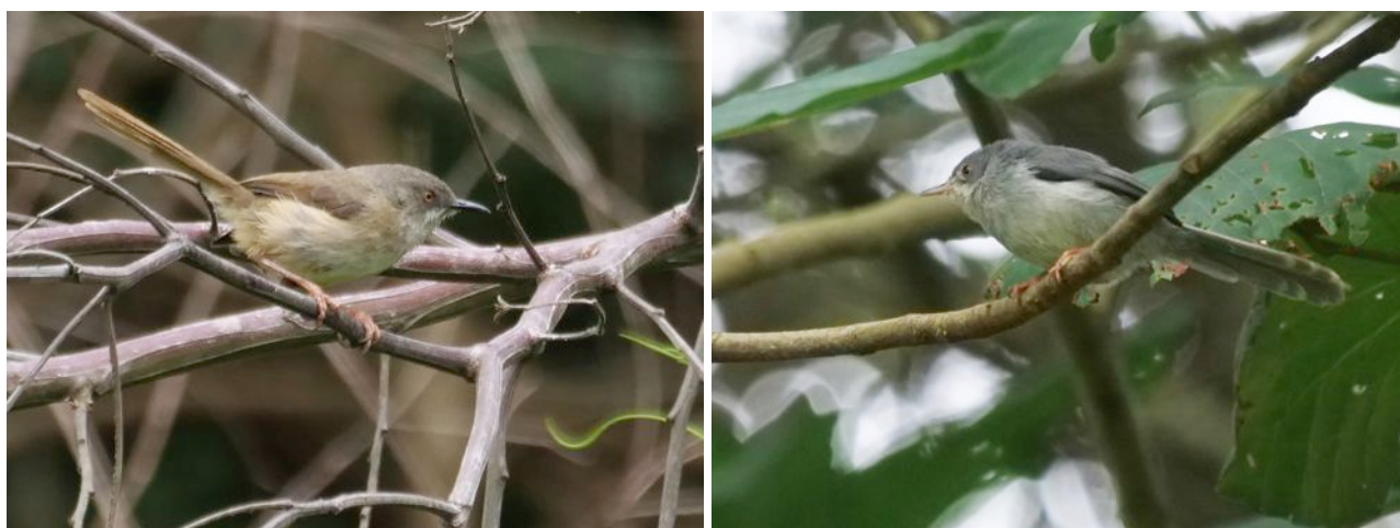
Two species are endemic to the highlands that straddle the border between eastern Zimbabwe and Mozambique; Roberts's Warbler (left) and Chirinda Apalis (right). (Nik Borrow)

were Silvery-cheeked Hornbills and colourful Livingstone's Turacos to be seen. After breakfast we headed to higher altitudes and we started our birding with a bang enjoying superb close up views of the lovely Swynnerton's Robin in the remnant forest patches. This attractive bird has a very localised distribution being only found here and in neighbouring Mozambique and also in some remote Tanzanian mountains. An Orange Ground Thrush was singing sweetly and we obtained excellent views, Olive Bushshrikes were equally noisy but put up more of a fight before we saw them as did a pair of highly mobile Blue-mantled Crested Flycatchers. White-tailed Crested Flycatchers were also seen as well as the pretty White-starred Robin and Cape Batis. Stripe-cheeked Greenbul is another species that has a restricted distribution only occurring away from these eastern highlands on Mount Mulanje in Malawi and it was seen well in these forests during this extension.