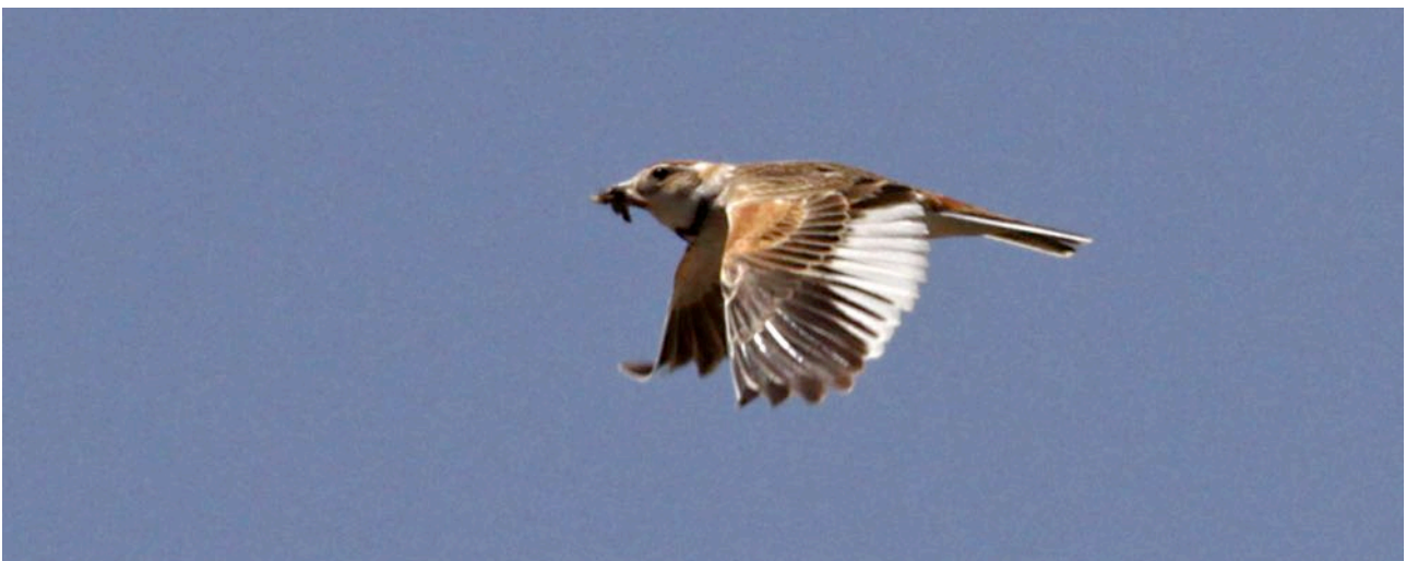
Mongolian Lark at Lake Qinghai.

The next day we visited the eroded hills on the outskirts of Xining where our task was to try and find Pale Rosefinch, which is a recent split from Sinai Rosefinch. For the last couple of years this species has been tricky to find here and it took quite some time before we managed to locate a female that gave decent scope views, but unfortunately was a little distant for photographs. Then we headed for the Plateau proper. The first stop was at a wetland at the east end of the Qinghai Lake, where we spent couple of hours enjoying the great scenery and exciting birds. Here we found a number of good birds including Great Crested and Black-necked Grebes, Greylag and Bar-headed Geese, Ruddy Shelduck, Whooper Swan, Northern Shoveler, Ferruginous and Tufted Ducks, Common and Red-crested Pochards, our first Black-necked Cranes, Pallas's and Brown-headed Gulls, Ground Tits, Horned, Hume's Short-toed and a few splendid Mongolian Larks,