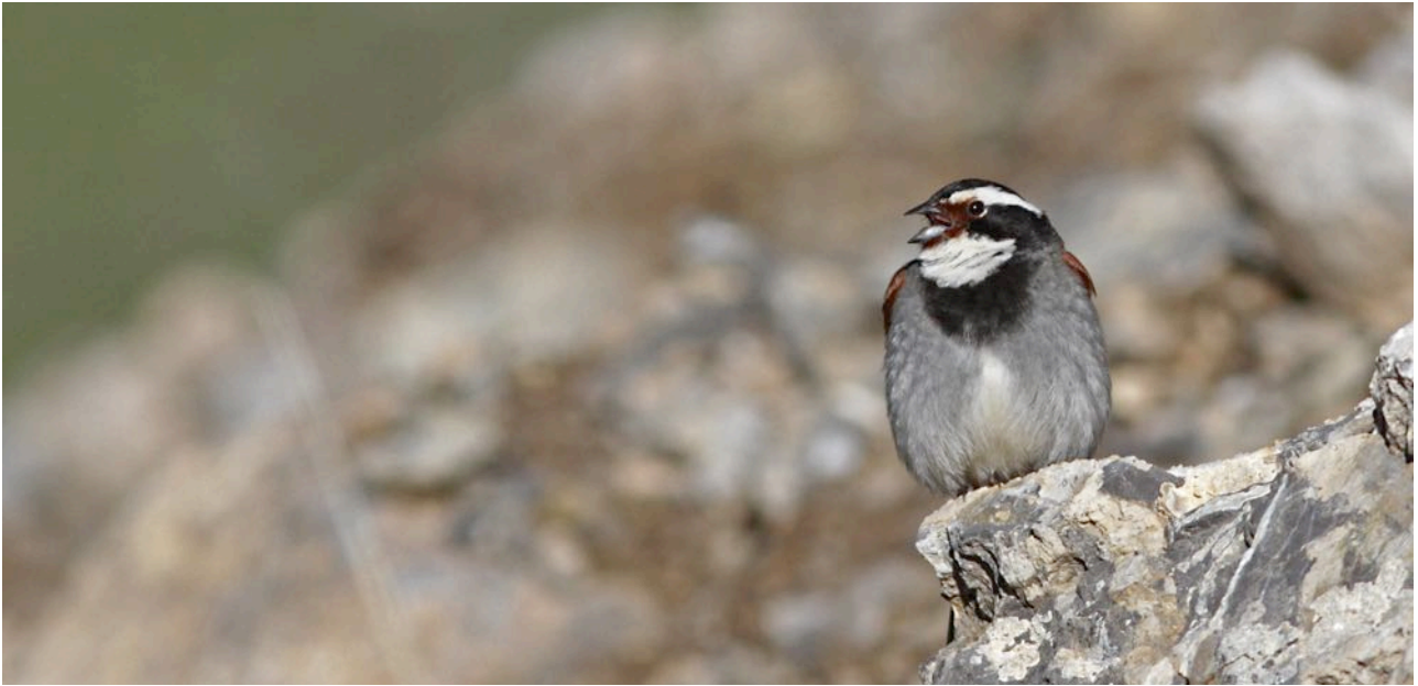
Tibetan Bunting at Kanda Shan pass (Hannu Jännes).

The new day saw us at a high altitude pass with a breath-taking vista, where our main target, Tibetan Bunting, was secured as soon as we stepped out of the bus. Whilst admiring this very special Tibetan endemic we heard calls of a Tibetan Snowcock in the distance, which we later found sitting on a far off mountain slope. Other great birds in this beautiful area included two Snow Pigeons, a handful of Alpine Choughs, a single Wallcreeper and, to everyone's surprise, a female Amur Falcon. Lower down the valley we saw a total of ten White Eared Pheasants providing us with good scope views, Sichuan Tit, three Tibetan Babaxes and White-capped Redstarts. On the mammalian side noteworthy observations included an Altai Weasel and a magnificent Grey Wolf brilliantly spotted by Nancy.