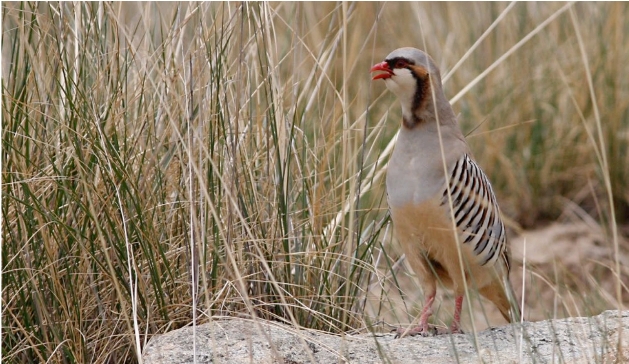
Przevalski's Partridge near Chaka.

Isabelline Wheatears, Père David's (or Small) Snowfinch, and, as an unexpected bonus, a group of three juvenile Bearded Reedlings. Apparently this species started to breed in suitable reedbed habitats of the Lake Qinghai and Chaka just couple of years ago. Later we made a stop at another wetland site on the southern shore of the lake, where our sightings included some brutish Tibetan Larks. In the evening we drove to our recently opened, very good hotel in Chaka, our home for the next three nights. Thanks to massive marketing efforts by Chinese travel agencies, the sleepy town of Chaka, especially the salt-lake, has become a major tourist attraction in the last couple of years. Locals said that during a 40-day period in July-August, over one million domestic tourists were estimated to have visited the town! And what are they doing here? Taking pictures of themselves standing in the salt-lake, which creates nice reflections!