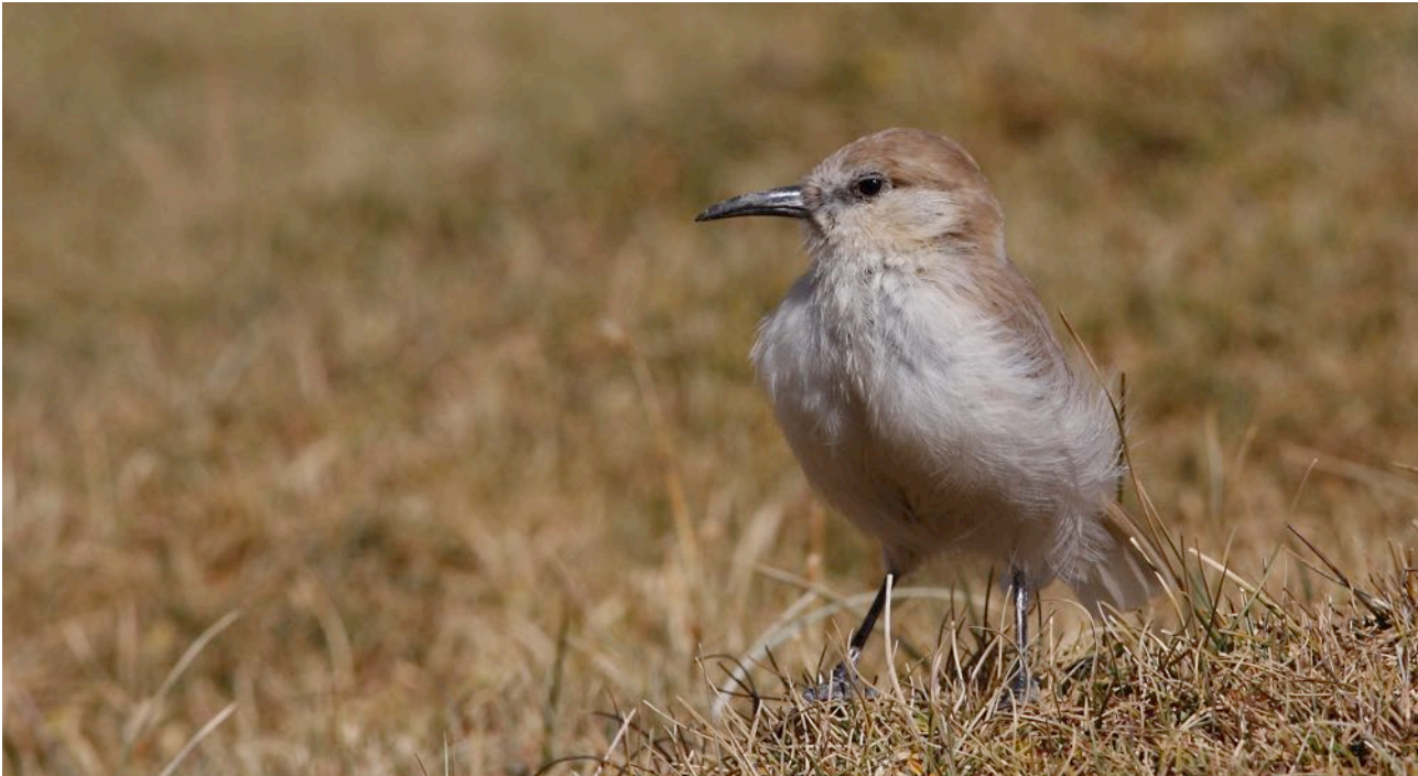
Ground Tit is a common sight on the plateau.

Henderson's Ground Jay ♦ Podoces hendersoni Great encounters near Chaka and in Xinjiang. Stunning birds.