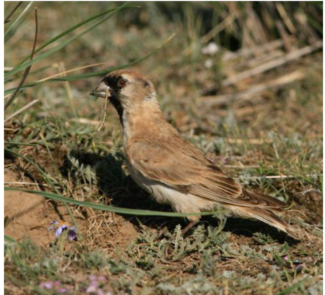
Rufous-necked and Small (or Père David's) Snowfinch (Hannu Jännes).

White-capped Redstart (W-c Water R, River Chat) Phoenicurus leucocephalus Small numbers in Nangqiang.