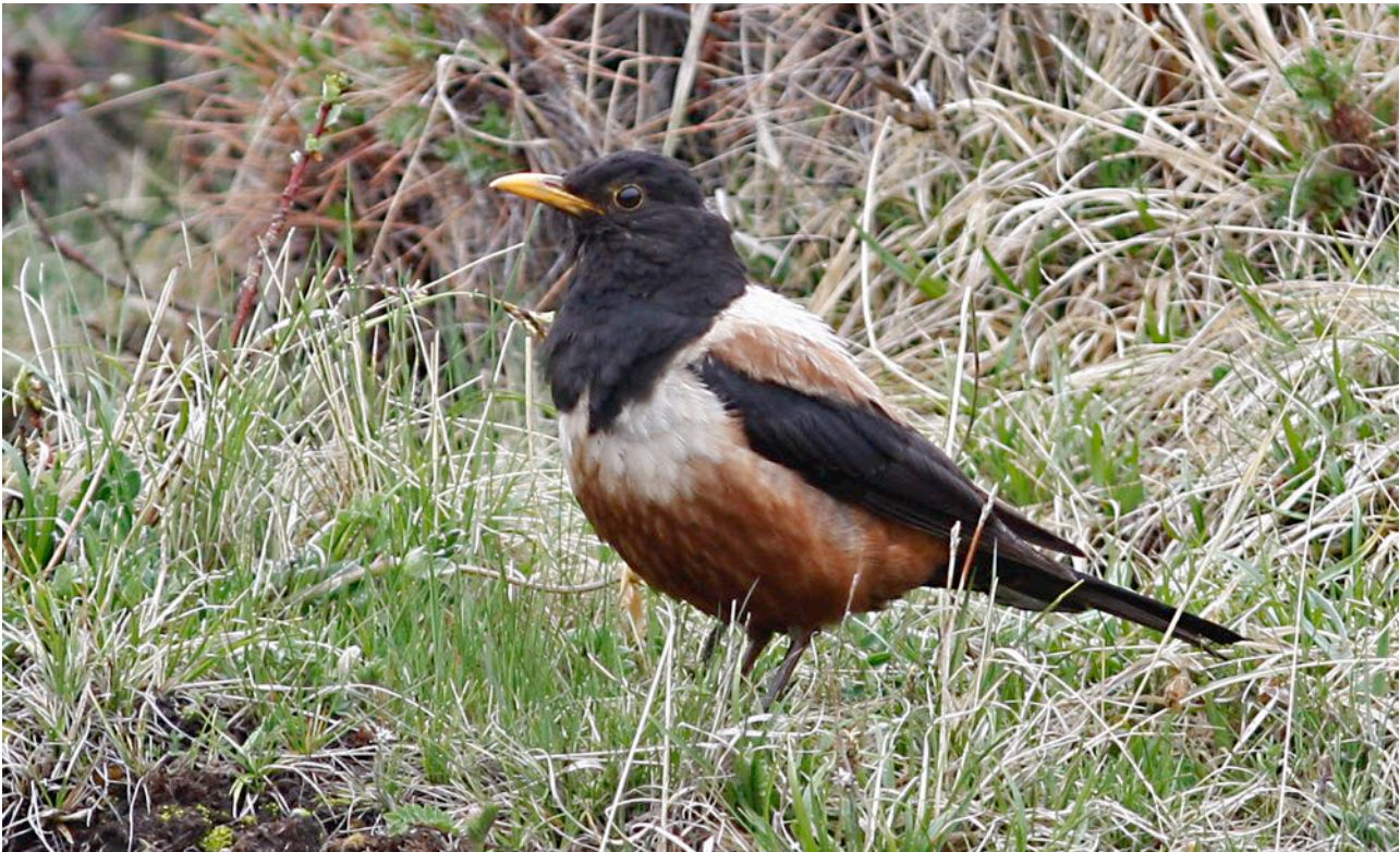
Male Kessler's Thrush (Hannu Jännes).