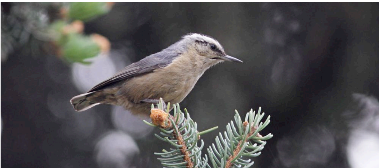
Chinese Nuthatch at Dongxia Shan.

The new day saw us breakfasting on a very windy and chilly Laoye mountain, a hillside covered in deciduous forest and bushes, just an hour's drive from Xining. Our morning here yielded an array of interesting new species including many Common Pheasants (wild ones here), Siberian Rubythroat, many Azure-winged Magpies, Rooks (of the distinct eastern subspecies pastinator ), Willow Tit, Yellow-streaked Warbler, Gansu and Hume's Leaf Warblers, Plain and Elliot's Laughingthrushes, Chestnut and Chinese Thrushes, White-bellied Redstart, White-throated and Daurian Redstarts, Rufous-breasted Accentors and showy Grey-headed Bullfinches. After a huge lunch in a local holiday complex, we visited a large forest park dominated by spruce forest, where we were entertained by a Great Spotted Woodpecker at its nest, a family party of amazingly tame White-browed Tit-Warblers, a total of five Crested Tit-Warblers (always great to get this