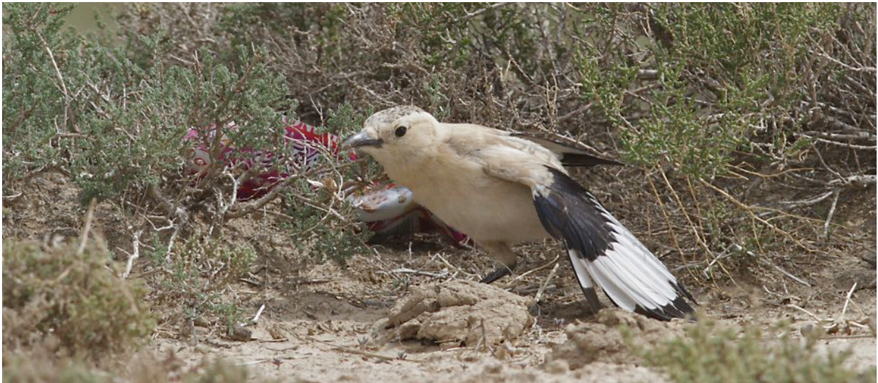
A juvenile Henderson's Ground Jay near Chaka.

For our last morning in the Chaka area, we headed back towards Lake Qinghai, and spent a lovely morning checking the bush adorned valleys and hill sides of the Rubber Mountain area. Best birds here were a total of eight Przevalski's (or Pink-tailed) Finches, with great views of both males and females, a couple of very showy Smoky Warblers, White-browed Tits, a very vocal Red-fronted Rosefinch, Black-winged, White-rumped and Rufous-necked Snowfinches, Robin Accentors, Siberian Stonechats, Rosy Pipits and a very noisy juvenile Saker Falcon. Perhaps the most exciting observation of the day was during our early afternoon birding stop near Chaka, when a male Tibetan Sandgrouse flew past us calling and showing pretty well for us all! Later in the afternoon it was time to drive to Gonghe, where we were to spend the night, but before we checked in to our accommodation we had a couple of hours birding on the outskirts of the city. New birds included Chinese Pond Heron, Common Moorhen, Common Rock Thrush and Citrine Wagtail of the black-backed subspecies calcarata .