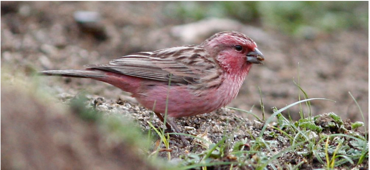
Pink-rumped Rosefinch is commonly encountered in southern Qinghai and Lhasa.

Crimson-browed Finch ♦ Carpodacus subhimachala A total of three near Lhasa were a good find.