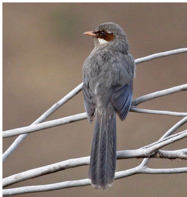
Giant Babax and Brown-cheeked Laughingthrush were easy to see near Lhasa.