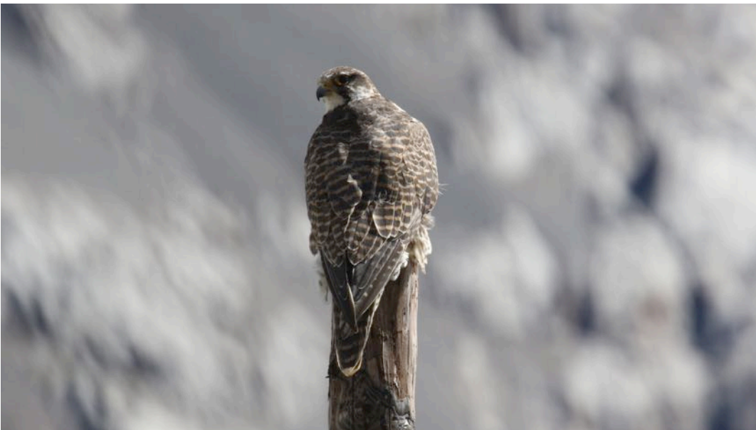
Saker Falcon is relatively common sight on the plateau. We logged over 20 on the best day (Werner Mueller).

Saker Falcon Falco cherrug A total of 43 noted. Subspecies milvipes .