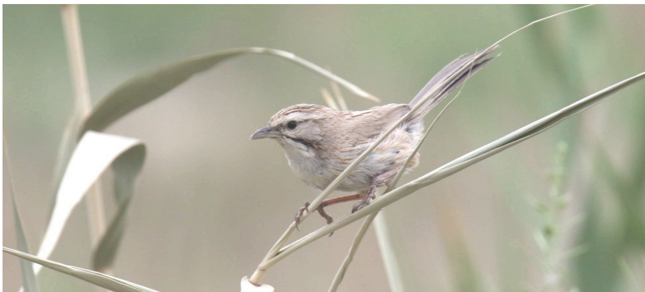
Tarim Babbler was rather common in the gardens on the outskirts of Ruoqiang (Werner Mueller).

The next day we revisited areas north of the city spending more time at a large wetland and also exploring a patch of native poplar forest. We found several interesting birds including many Red-crested Pochards and Great Crested Grebes, Great Egrets, Great Cormorants, a few Long-legged Buzzard, Pied Avocets, Black-winged Stilts, Black-tailed Godwits, Black-headed and Vega Gulls, Little Terns, good numbers of Isabelline Shrikes, a total of eight Biddulph's Ground Jays, Carrion Crows, Crested Larks, thirty or so Bearded Reedlings, Asian Short-toed Larks, Citrine Wagtails of the grey-backed nominate subspecies, Masked Wagtails (a distinct subspecies of White Wagtail) and three Little Bitterns. In the afternoon we revisited the gardens in the outskirts of Ruoqiang, and finally, after a lot of searching, managed to locate a male Desert Finch.