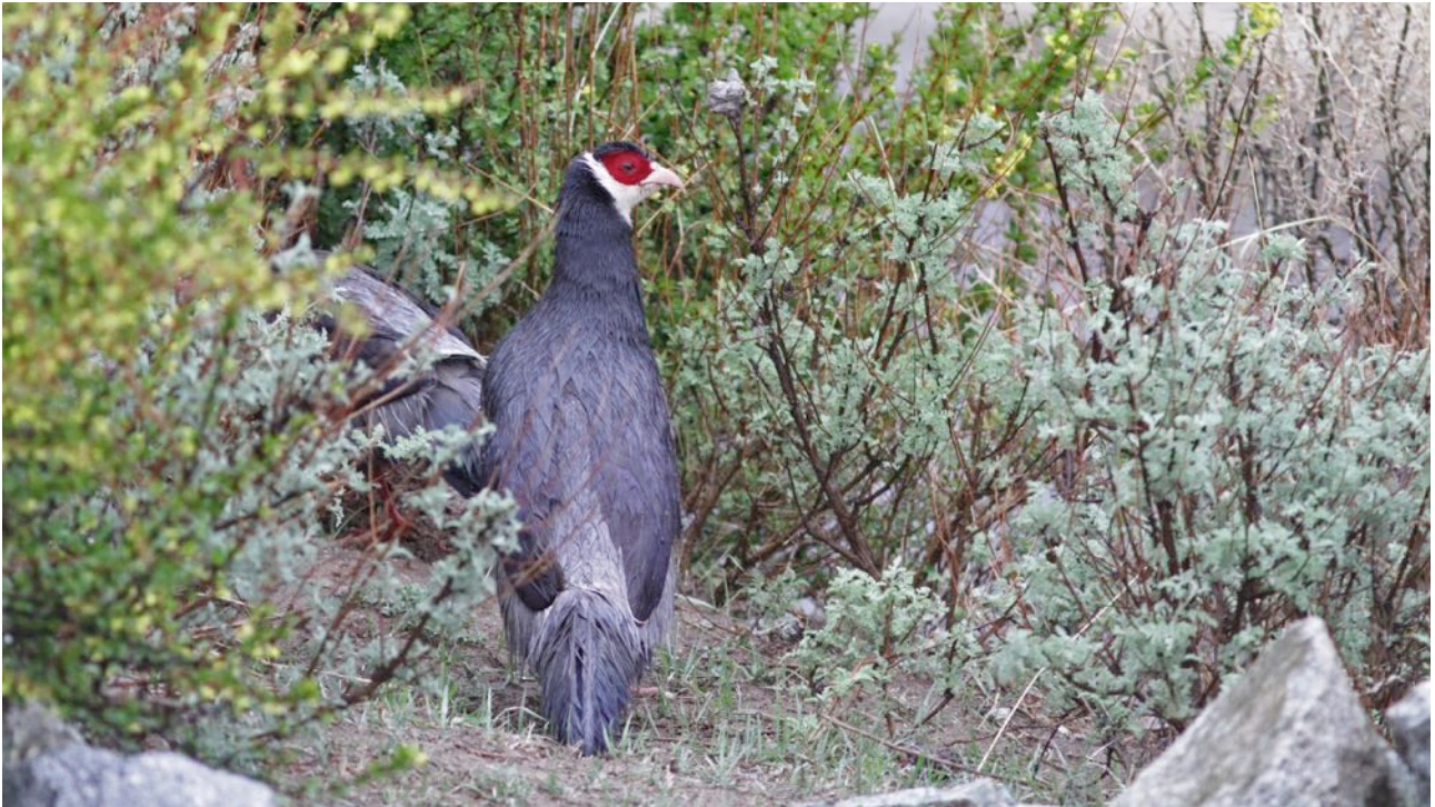
Tibetan Eared Pheasant at Shuksep nunnery.