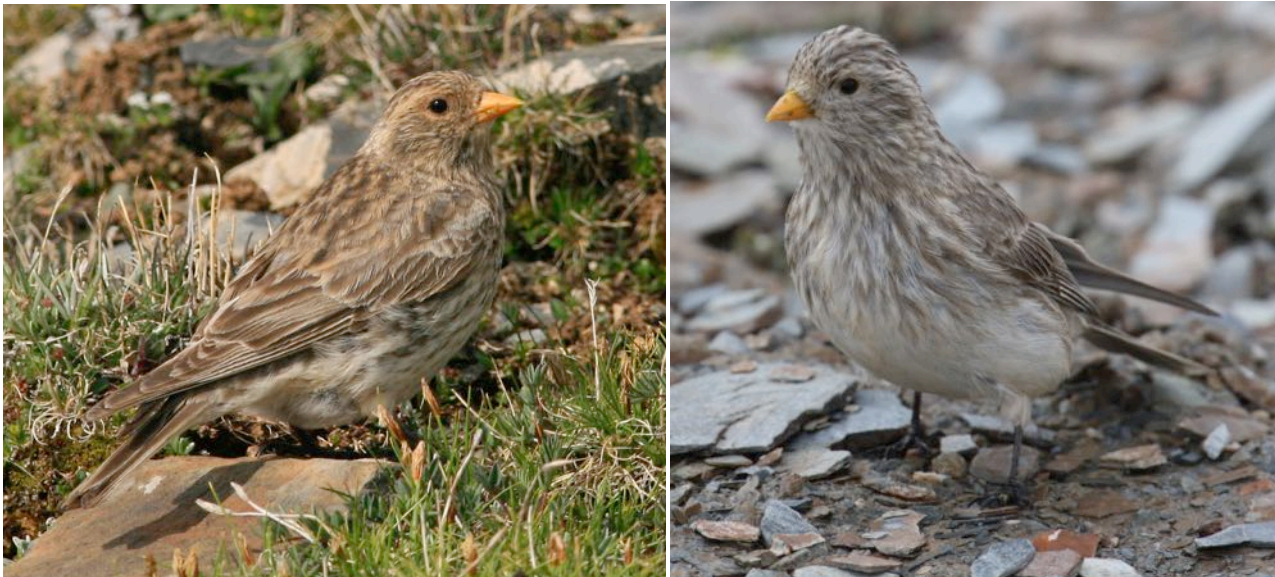
Females of Tibetan Rosefinch on the left and Sillem's Mountain Finch, which is actually a rosefinch, look very similar.