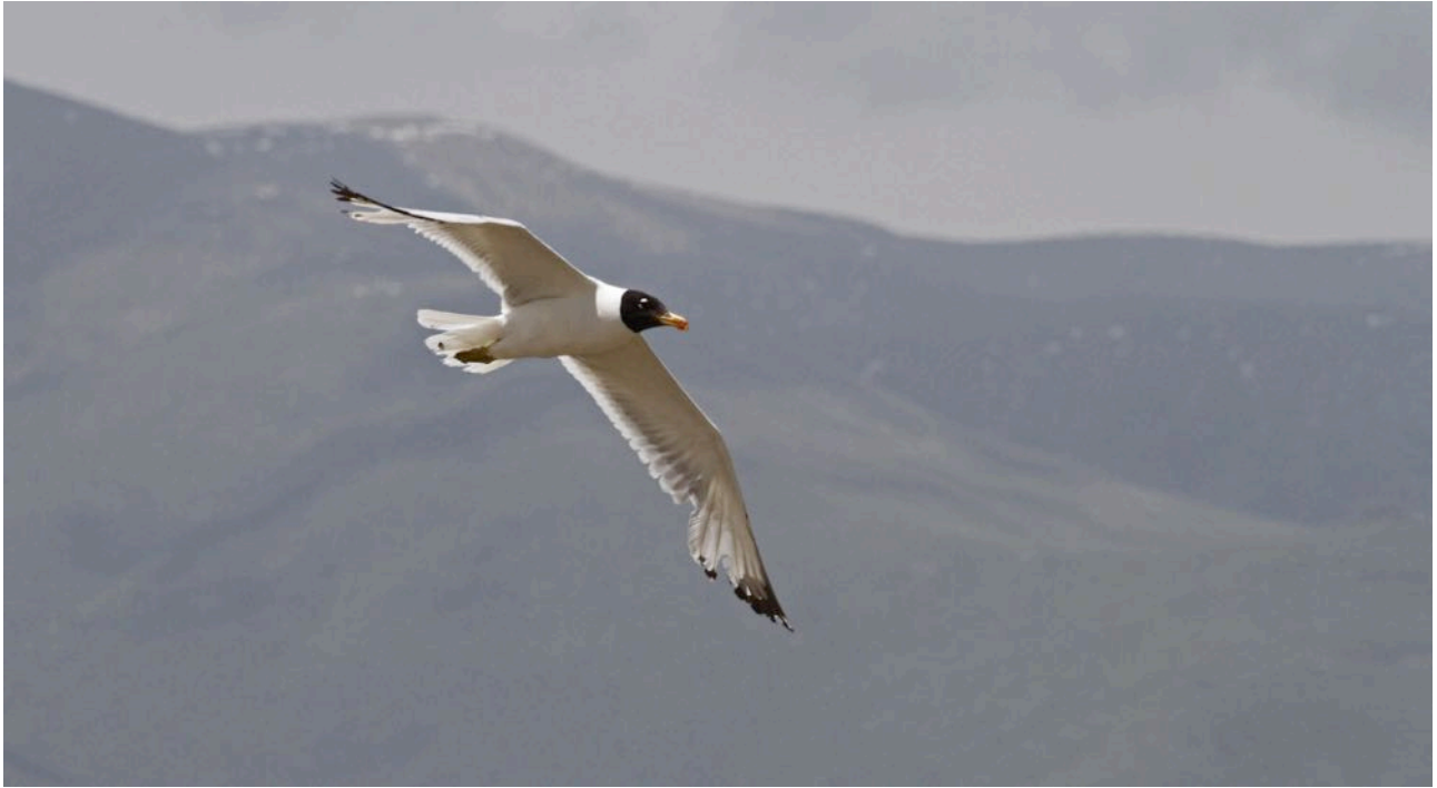
Adult Pallas's Gull at Lake Qinghai.

unpredictable and highly desired species so early on the tour), Greenish Warblers, Goldcrest, confiding Chinese and Przevalski's Nuthatches, Red-flanked Bluetail of the form albocoeruleus , Slaty-backed Flycatcher and Chinese White-browed Rosefinches. Thanks to the very good crop of spruce seeds, Red Crossbills were common, and we counted around 200 birds during our afternoon visit. Apparently the five Eurasian Siskins, a write-in for this tour, were also drawn here by the ample supply of spruce seeds.