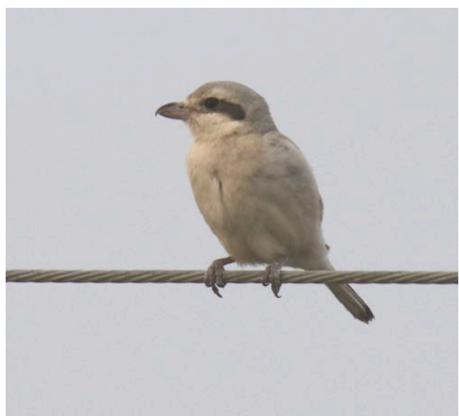
Male and female Steppe Grey Shrike in Ruoqiang (Werner Mueller).