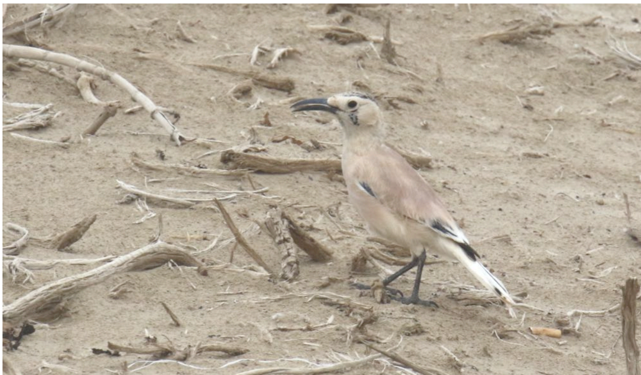
Biddulph's Ground Jays were rather common at the edge of the forbidding Taklimakan Desert (Werber Mueller).

The next day we revisited areas north of the city spending more time at a large wetland and also exploring a patch of native poplar forest. We found several interesting birds including many Red-crested Pochards and Great Crested Grebes, Great Egrets, Great Cormorants, a few Long-legged Buzzard, Pied Avocets, Black-winged Stilts, Black-tailed Godwits, Black-headed and Vega Gulls, Little Terns, good numbers of Isabelline Shrikes, a total of eight Biddulph's Ground Jays, Carrion Crows, Crested Larks, thirty or so Bearded Reedlings, Asian Short-toed Larks, Citrine Wagtails of the grey-backed nominate subspecies, Masked Wagtails (a distinct subspecies of White Wagtail) and three Little Bitterns. In the afternoon we revisited the gardens in the outskirts of Ruoqiang, and finally, after a lot of searching, managed to locate a male Desert Finch.