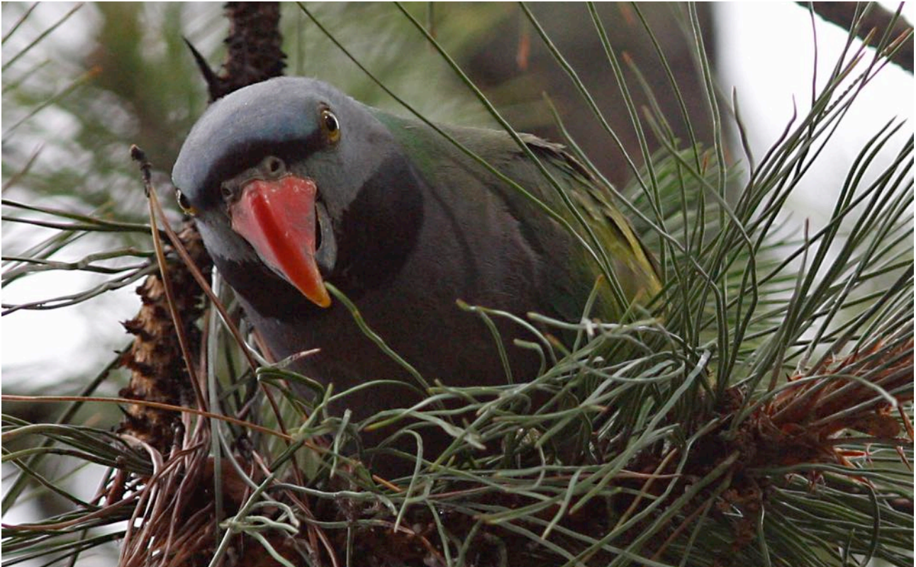
We had good views of Lord Derby's Parakeet in Lhasa.

Lord Derby's Parakeet ♦ Psittacula derbyana Five in Lhasa, with good views. Long-tailed Minivet Pericrocotus ethologus One male at Beizha Forest in Nangqien. Isabelline Shrike ♦ (Xinjiang S, Chinese S) Lanius isabellinus Very common in Xinjiang. Grey-backed Shrike Lanius tephronotus Chinese Grey Shrike ♦ Lanius sphenocercus Three sightings in the Chaka area. Steppe Grey Shrike Lanius pallidirostris Four in Xinjiang. Indian Golden Oriole Oriolus kundoo Several on the outskirts of Ruoqiang in Xinjiang. A write-in. Azure-winged Magpie ♦ (Asian A-w M) Cyanopica cyanus Eurasian Magpie Pica pica