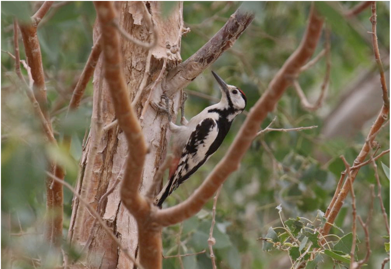
White-winged Woodpecker in a patch of native poplar forest.

Our last full day was spent on the bus travelling back to Golmud. This time, as we were now able to leave Ruopiang early in the morning, we had time for roadside birding stops, which produced very showy Henderson Ground Jays and Desert Wheatears, four Pallas's Sandgrouse in flight, a rather shy Margelanian Desert Whitethroat and a group of four Goitered Gazelles. Back in Golmud, it was time to enjoy a last dinner together, and thank everyone for being such great company during the rather exhausting extension, which nonetheless had turned up some amazing birds for us.