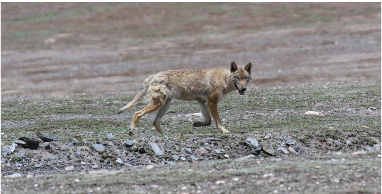
Grey Wolf is not a rare sight at Kekexili Nature Reserve.

Next in the agenda was finding the Tibetan Sandgrouse, which we did the next morning on the flat plains near Budongquan. Our pleasant birding here produced great views of a pair of Tibetan Sandgrouse on the ground and two more in flight. Later we followed the very busy Golmud-Lhasa highway north to Xidatan Scenic Area, where we met our camp crew with three four-wheel drives and a small truck and said goodbye to our excellent bus driver. The rest of the day was spent driving deep into the Yeniugou (Wild Yak) Valley, where we put up a camp that would be our base during the exciting expedition to try and find the near mythical Sillem's Mountain Finch. This species was overlooked when the first specimens were collected by a Dutch expedition that visited the area north of the Karakorum Range in the first part of the 20th century (they were misidentified as Brandt's Mountain Finch, L. brandti ) until C. S. Roselaar worked out that they represented a new species for science). After that nothing, until 2012 when Yann Muzika rediscovered the species by chance while on a trekking expedition in southwestern Qinghai in 2012! The area where Yann rediscovered the species is decidedly remote, and he again found the species present in 2013. After Yann's two visits, the finch had been sighted only by a handful of people including a Birdquest expedition, led by Mark Beaman, in 2014.