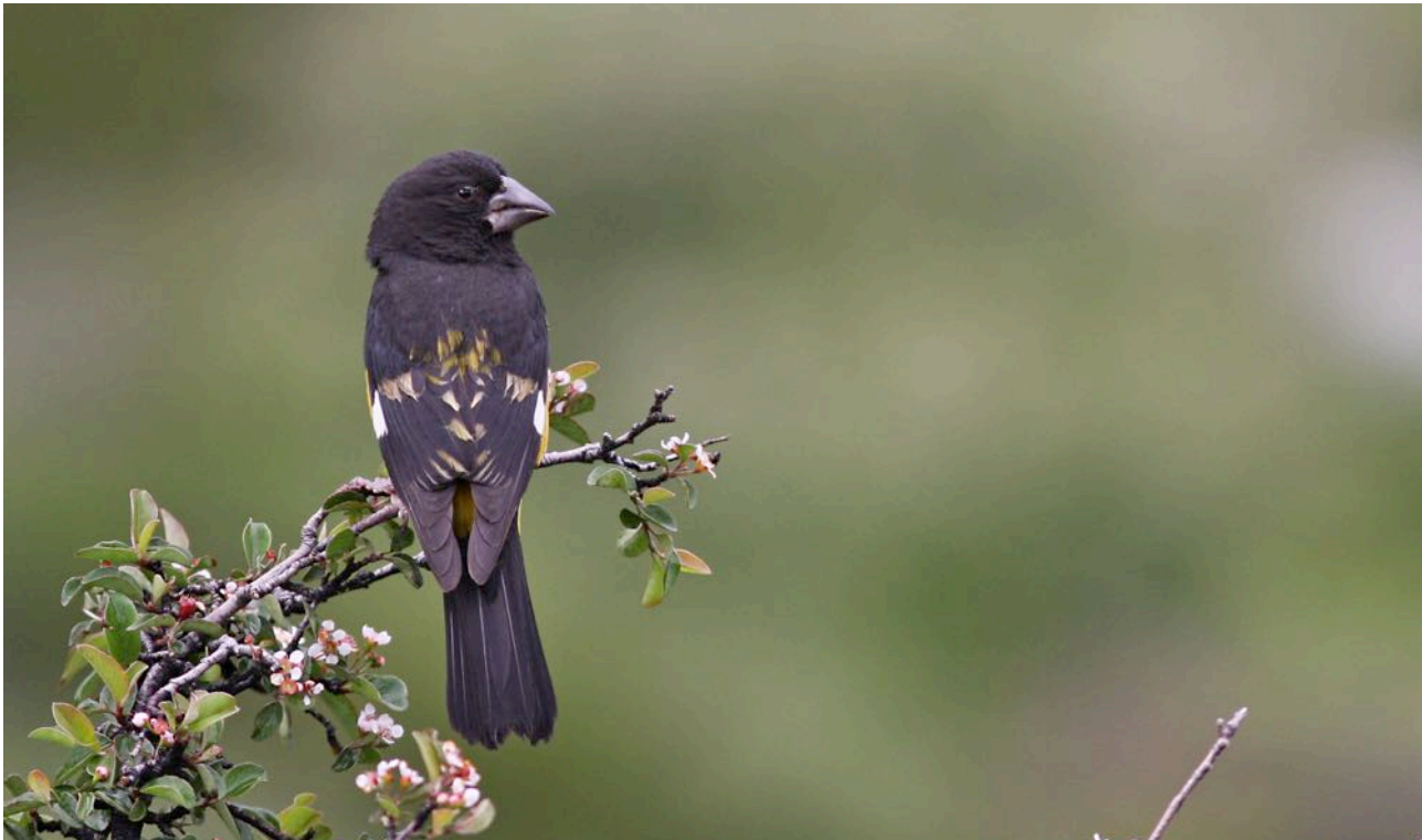
Male White-winged Grosbeak in Lhasa (Hannu Jännes).