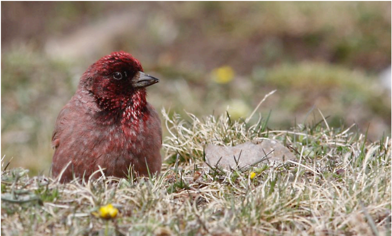
Tibetan Rosefinch, one of the 12 rosefinch species seen on this trip, is a high altitude specialist.