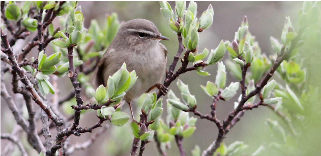
Smoky Warbler on Rubber Mountain (Hannu Jännes).