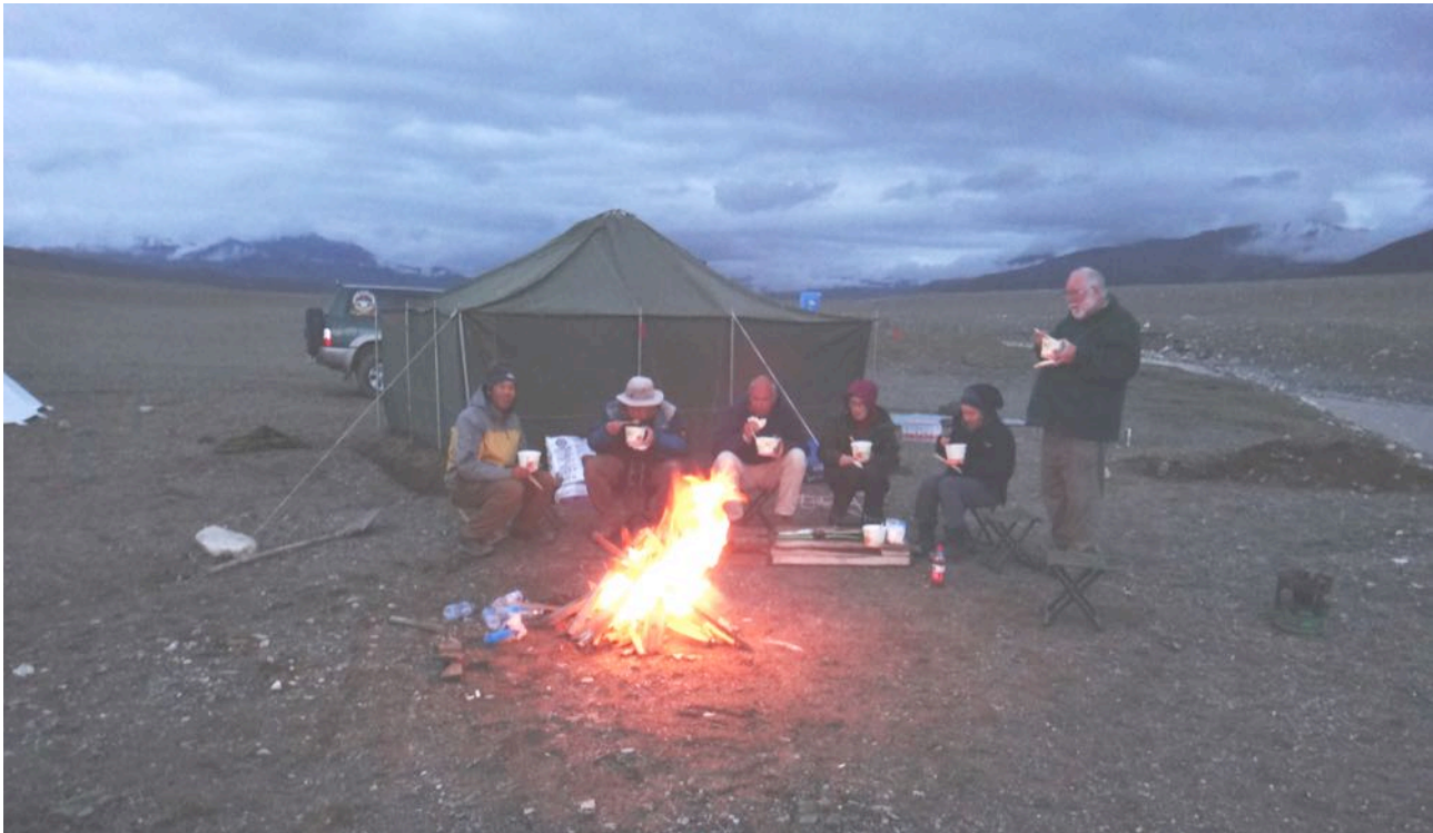
Camp Sillem somewhere in the Kunlun Mountains (Werner Mueller).