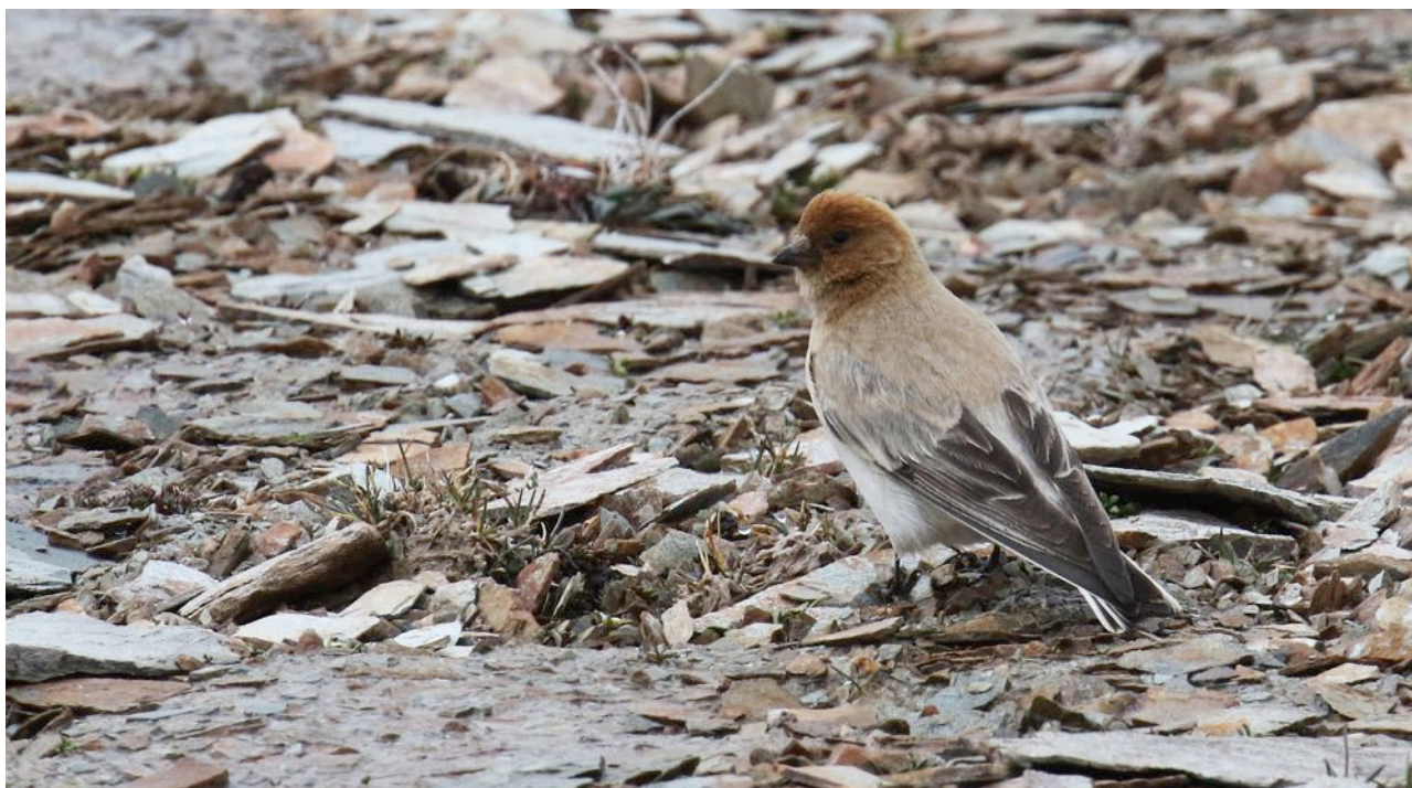
Sillem's Mountain Finch, only seen by a handful of people before us, was definitely the rarest bird on this trip.