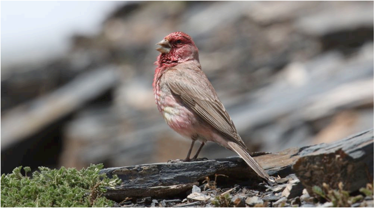
Great Rosefinch