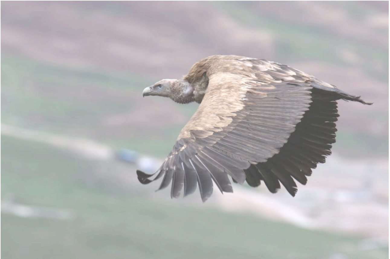
Himalayan Vulture is a common sight on his tour.

Széchenyi's Monal Partridge ♦ (Buff-throated P) Tetraophasis szechenyii Four seen at Beizha Forest.