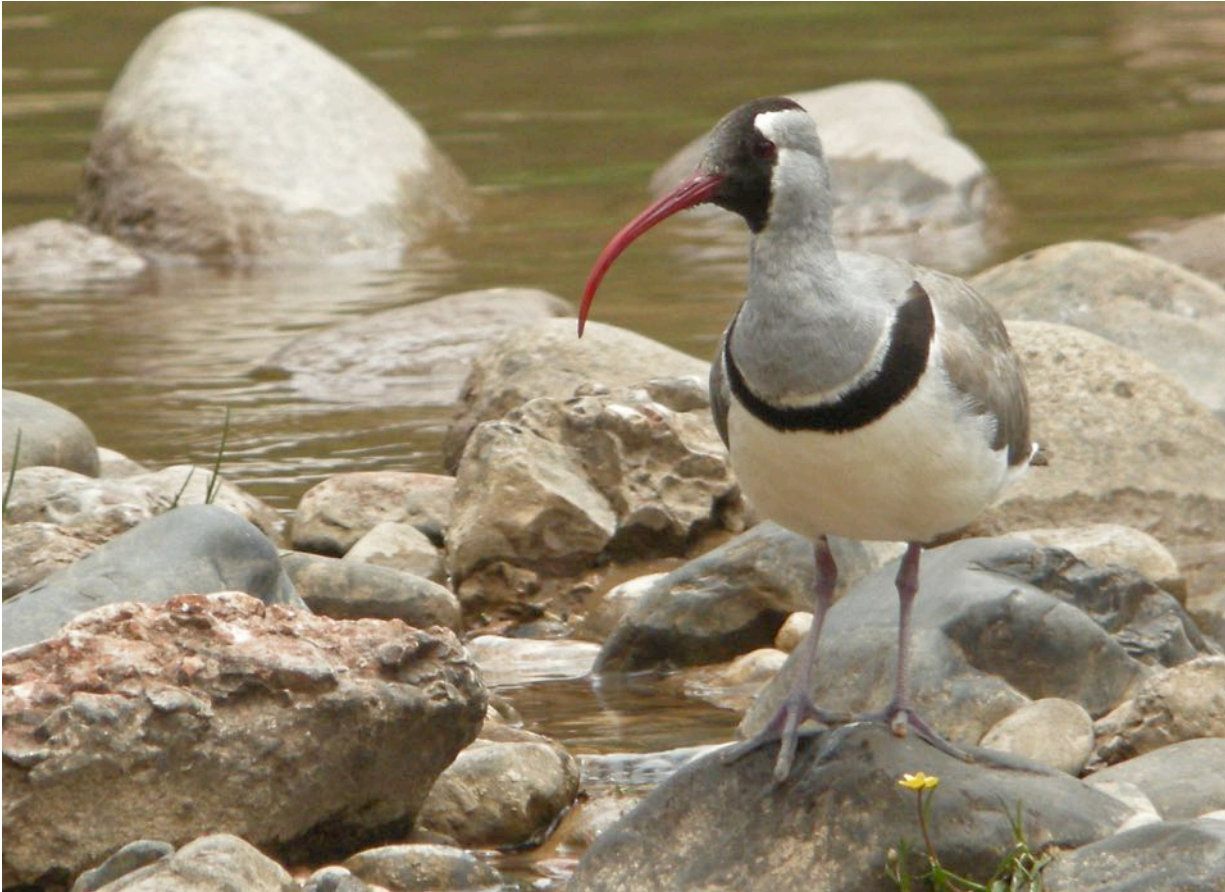
Ibisbills are easy to see in southern Qinghai (Hannu Jännes).