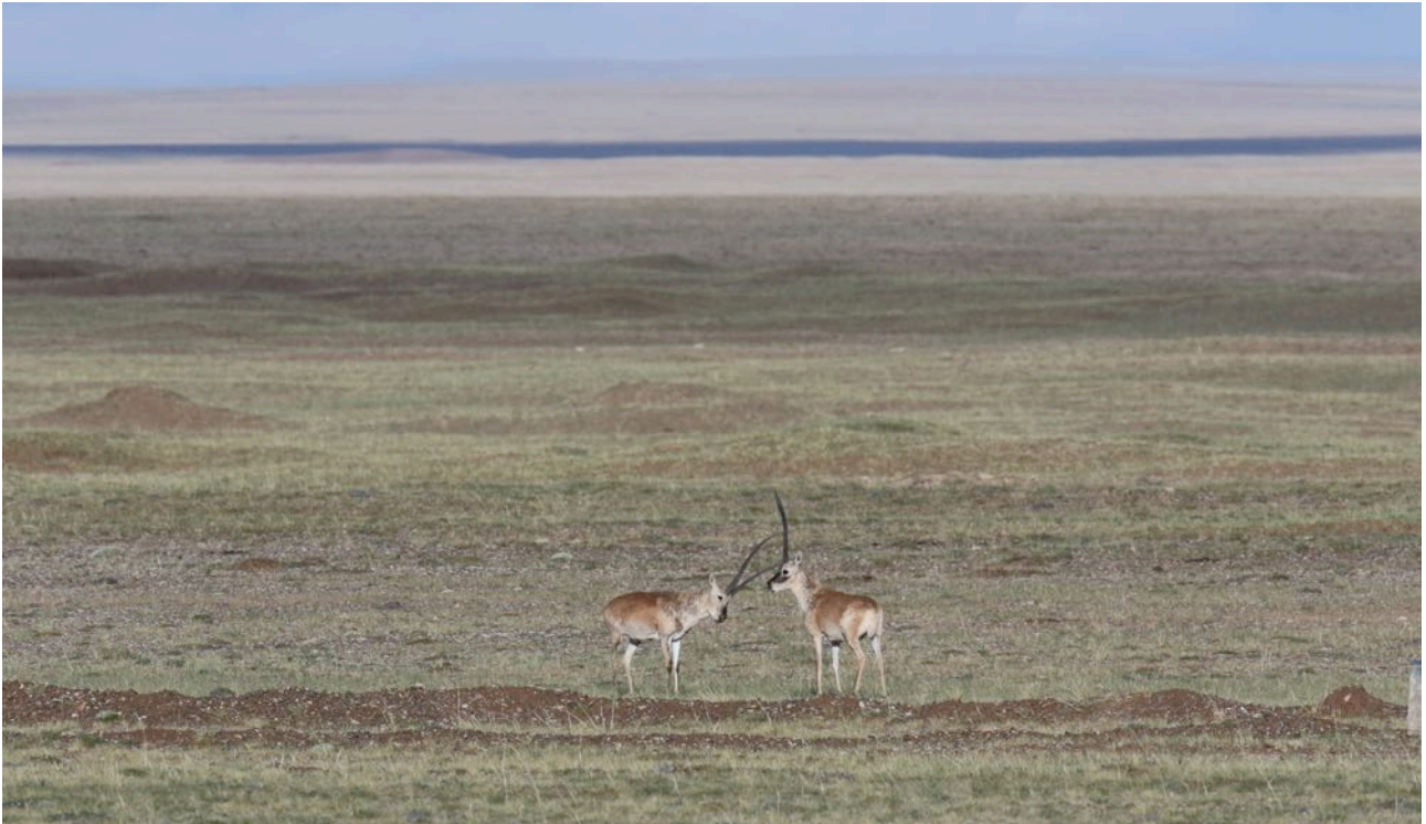
Chiru (or Tibetan Antelope) in the Kekexili Nature Reserve.