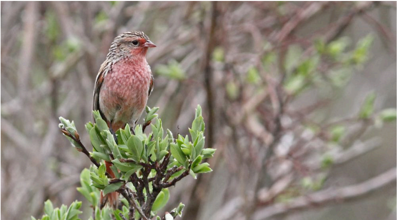
Przevalski's Finch, voted as the 'bird of the trip' on the main tour, was another very special bird we encountered.

Kiang, the massive Wild Yak, three species of pika, Tibetan Fox and many cute Himalayan Marmots. As well as these avian and mammalian highlights there is the privilege of travelling in this remote part of China with its breathtakingly beautiful high landscapes, the chance to see the fascinating lifestyles and cultures of the local peoples, and, of course, the usually great food.