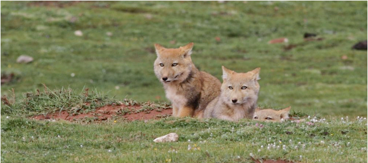
A den of Tibetan Fox with three cute cubs (Hannu Jännes).

Next in the agenda was finding the Tibetan Sandgrouse, which we did the next morning on the flat plains near Budongquan. Our pleasant birding here produced great views of a pair of Tibetan Sandgrouse on the ground and two more in flight. Later we followed the very busy Golmud-Lhasa highway north to Xidatan Scenic Area, where we met our camp crew with three four-wheel drives and a small truck and said goodbye to our excellent bus driver. The rest of the day was spent driving deep into the Yeniugou (Wild Yak) Valley, where we put up a camp that would be our base during the exciting expedition to try and find the near mythical Sillem's Mountain Finch. This species was overlooked when the first specimens were collected by a Dutch expedition that visited the area north of the Karakorum Range in the first part of the 20th century (they were misidentified as Brandt's Mountain Finch, L. brandti ) until C. S. Roselaar worked out that they represented a new species for science). After that nothing, until 2012 when Yann Muzika rediscovered the species by chance while on a trekking expedition in southwestern Qinghai in 2012! The area where Yann rediscovered the species is decidedly remote, and he again found the species present in 2013. After Yann's two visits, the finch had been sighted only by a handful of people including a Birdquest expedition, led by Mark Beaman, in 2014.