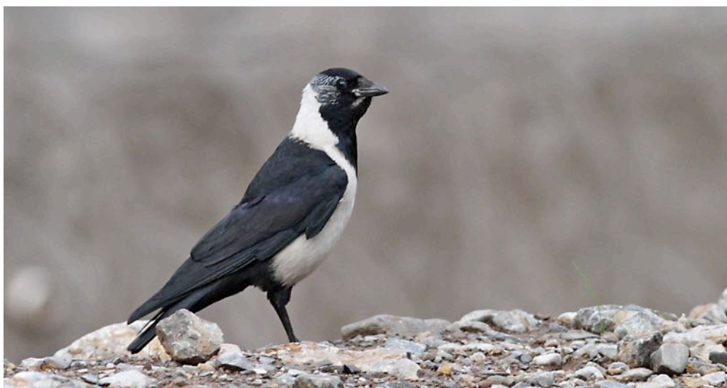
Daurian Jackdaw at Beizha Forest.

During our second morning at Nangqian we visited the Beizha Forest about a 90 minute drive away. Luckily the overnight rain, which is regular feature of this area, eased off just as we reached our first birding spot, and after a picnic breakfast attended by stunning Daurian Jackdaws, we were ready to begin with serious birding. One of the first birds we saw was a male Blood Pheasant that showed very well, followed by a group of White-lipped Deer and Tibetan Babax. Our quest for the Buff-throated (or Szechenyi's Monal) Partridge required quite a lot of climbing this year, but we eventually obtained decent scope views of four birds including small chicks, and we heard the distant calls of a couple of other family groups. Later a walk along a