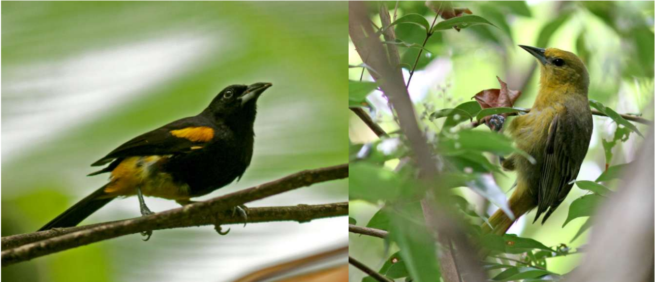
St. Lucia Oriole (left) and a female Montserrat Oriole