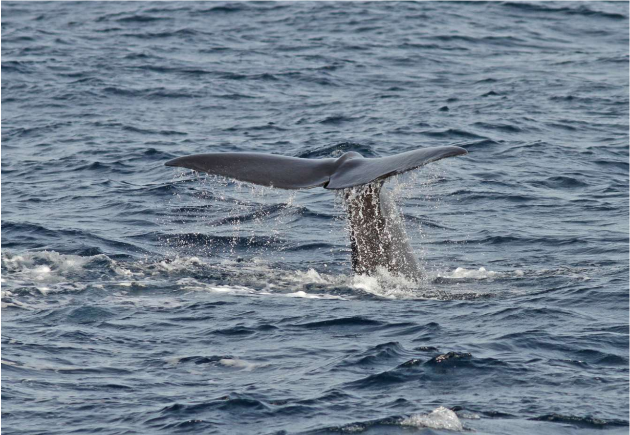
Sperm Whale off Dominica (Pete Morris)