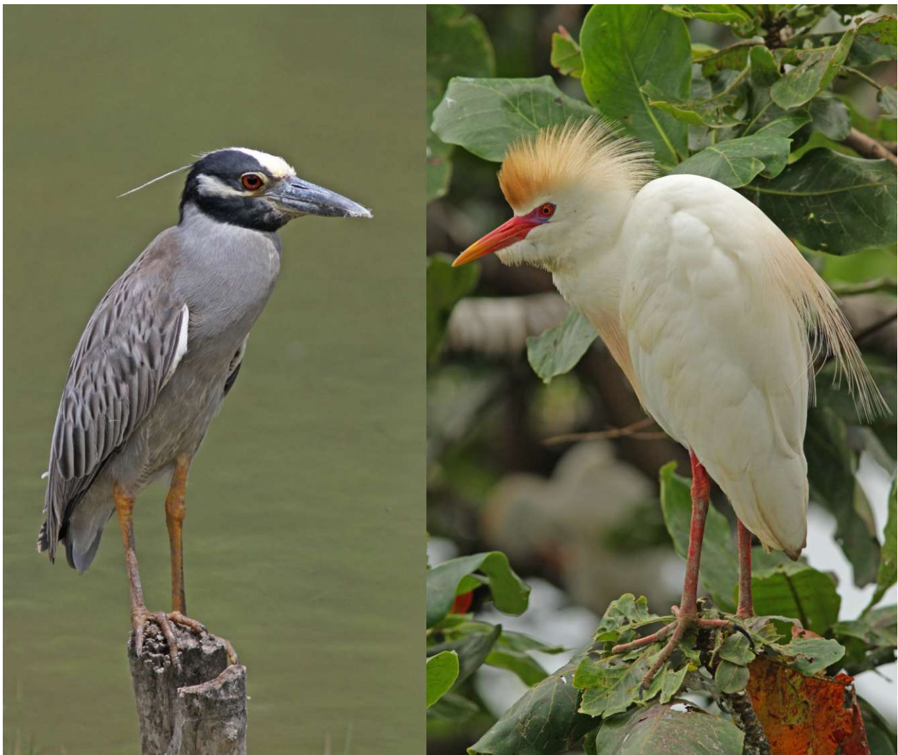
Common but still attractive - Yellow-crowned Night Heron and Western Cattle Egret (Pete Morris)