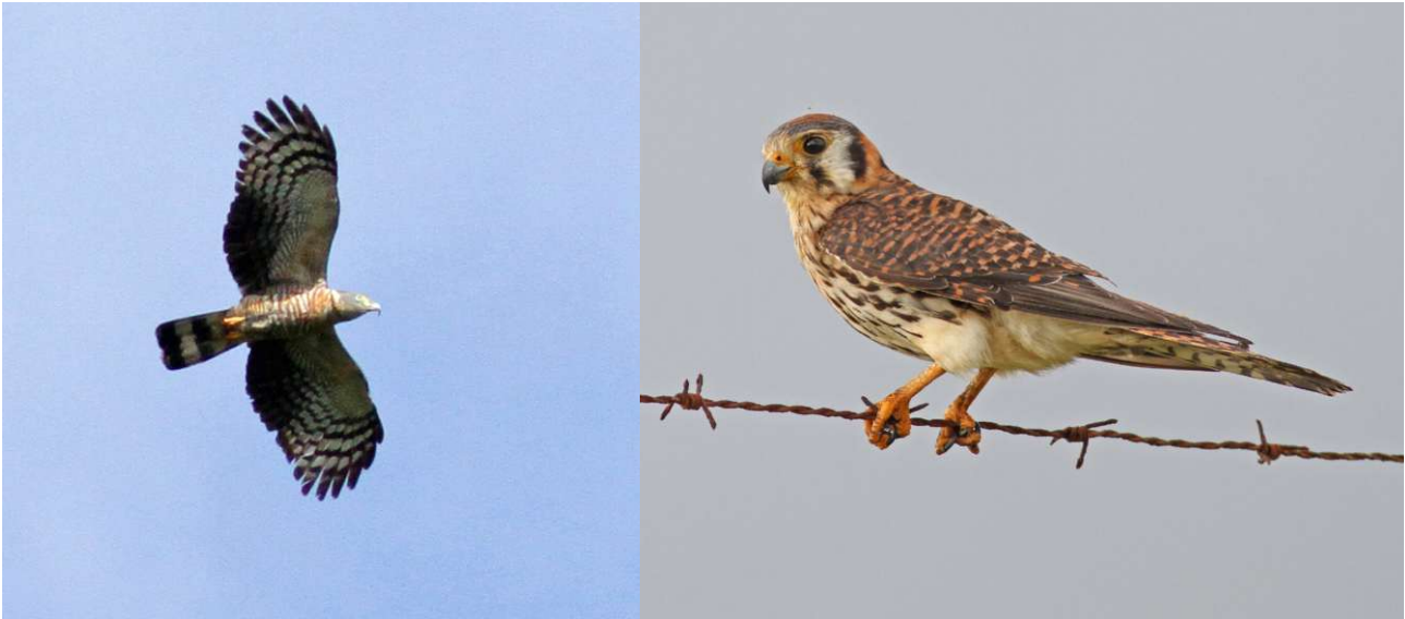
Hook-billed Kite on Grenada and American Kestrel

Hook-billed Kite Chondrohierax uncinatus A few of us saw 1 on Grenada. A very rare bird there ( mirus )! Common Black Hawk Buteogallus anthracinus Several seen well on Dominica (nominate). Broad-winged Hawk Buteo platypterus Two forms: riveri (Dominica, Martinique & St. Lucia), antillarum (St. Vincent & Grenada). American Kestrel Falco sparverius First seen on Antigua. Also on Montserrat and Dominica ( caribaeorum ).