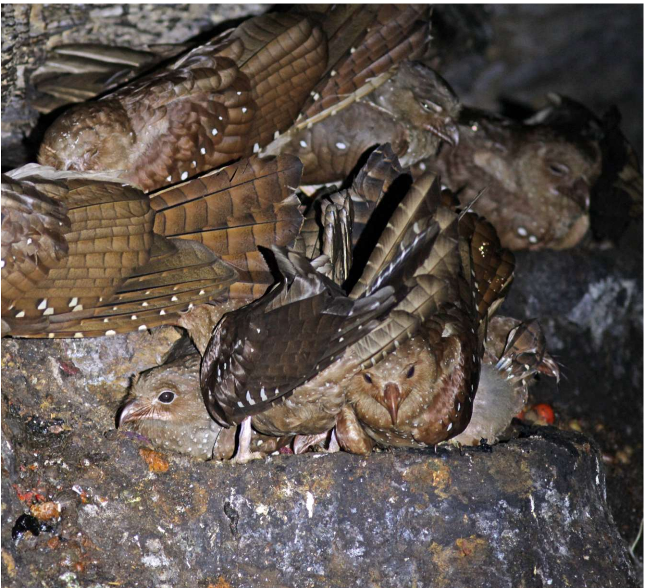
Oilbirds at Asa Wright (Pete Morris)

With just a final morning on the island, we still had some unfinished business as we headed down the trail from the centre. We'd kept the best at Asa Wright until the very last morning, when we finally got our chance to go and enjoy the amazing Oilbirds - a very up-close and intimate experience at this site! A family tick for some and a great experience for all, we headed to the airport having essentially achieved our objectives! Our Caribbean adventure had drawn to a close, and as we relaxed at the airport, we could look back on a unique adventure through a varied set of islands and a superb selection of endemics and specialities.