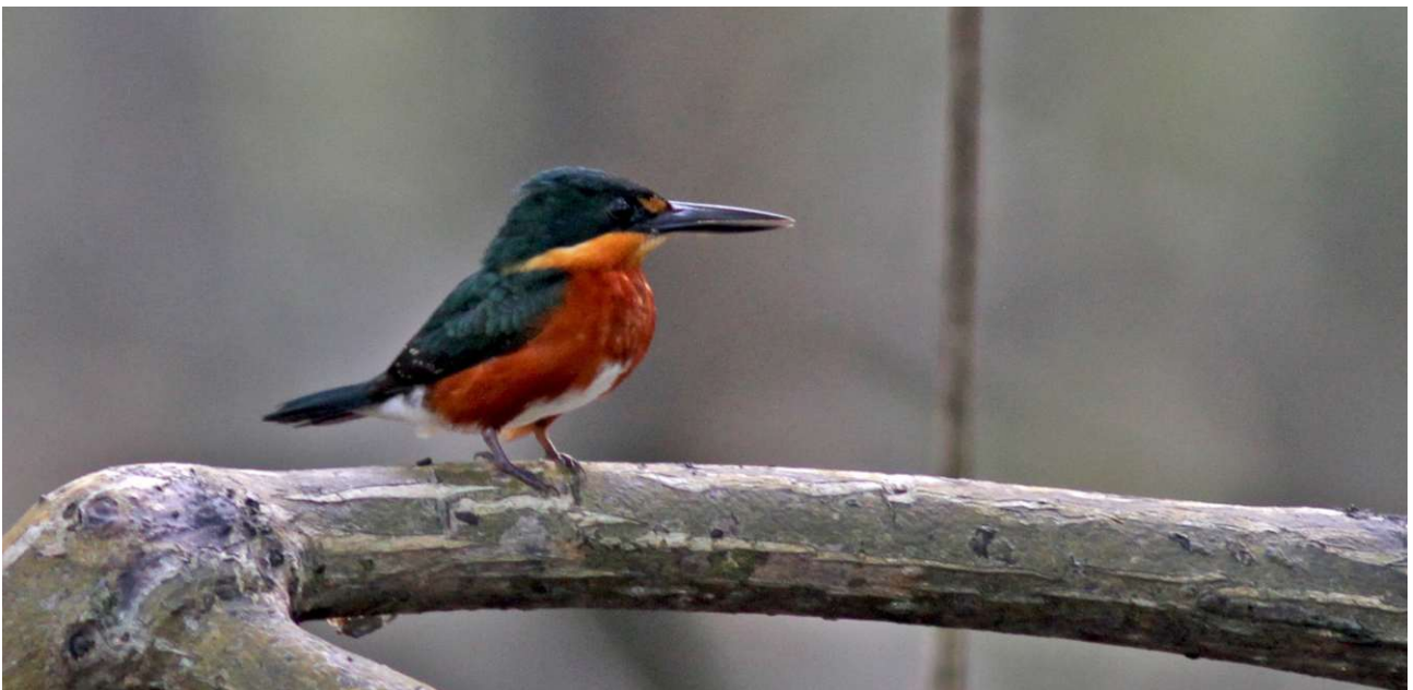
A beautiful American Pygmy Kingfisher at the Caroni Swamp