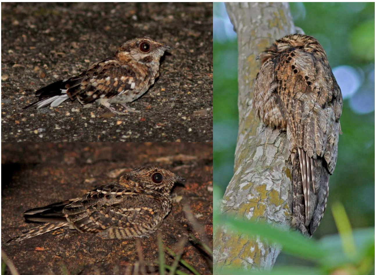
Nightbirds on Trinidad included (clockwise from top left) White-tailed Nightjar, Common Potoo and Pauraque