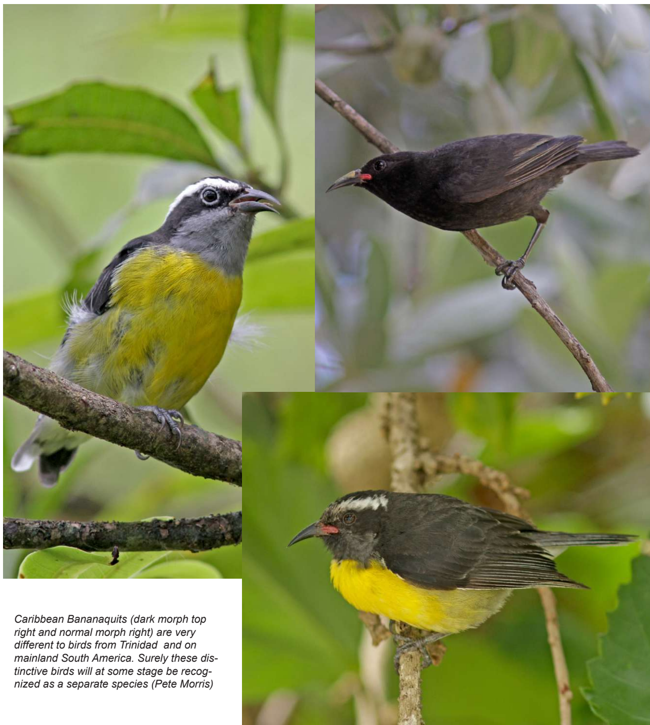
Caribbean Bananaquits (dark morph top right and normal morph right) are very different to birds from Trinidad and on mainland South America. Surely these distinctive birds will at some stage be recognized as a separate species

Common and widespread with several forms being seen. Antigua and Barbuda ( ridgwayi ), Dominica and Guadeloupe ( dominicana ), St. Lucia ( sclateri ), St. Vincent ( crissalis ) and Grenada ( grenadensis ).