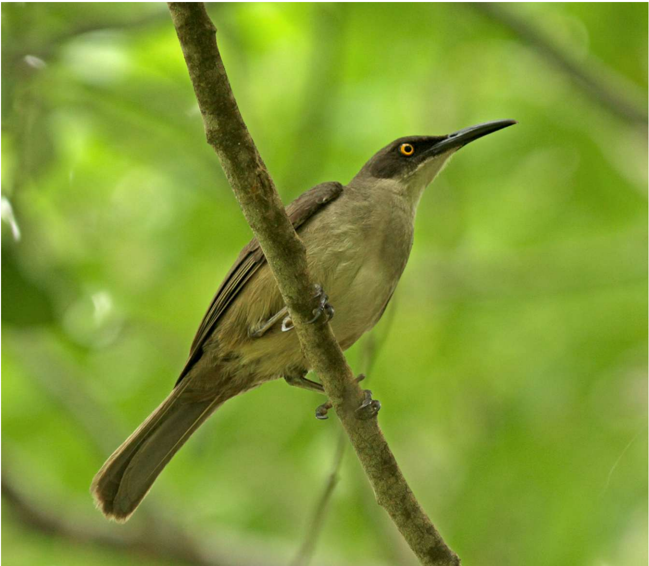
Grey Trembler - another great endemic