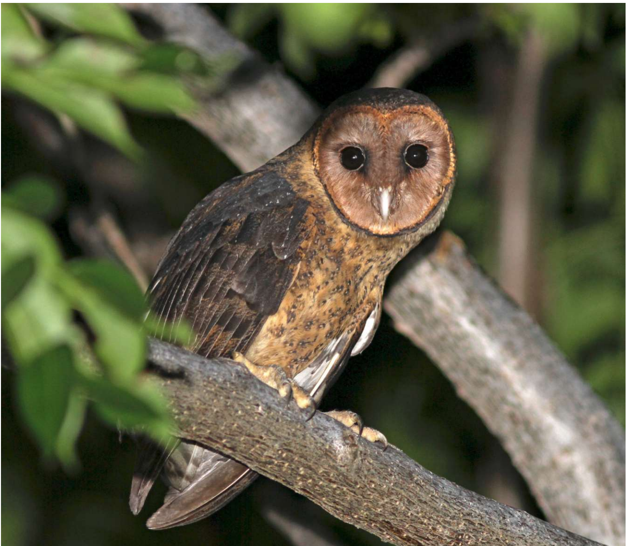
The brilliant Lesser Antillean Barn Owl was an unexpected highlight (Pete Morris)

Our Lesser Antilles clean up was nearly complete, and the following day, we stepped out of Barbados Airport (despite the immigration officers' attempts to stop us!) and immediately ticked off the Barbados Bullfinch. On this occasion we'd kept the worst till last, but we'd got the full set as we watched the dull sparrow-like things hopping around our feet! At this point, it was time to bid some of the group farewell, the rest of us continued on to Trinidad.