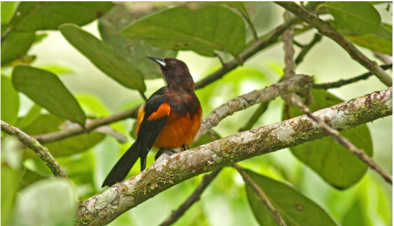
The stunning Martinique Oriole - the best of the endemic Orioles (Pete Morris)