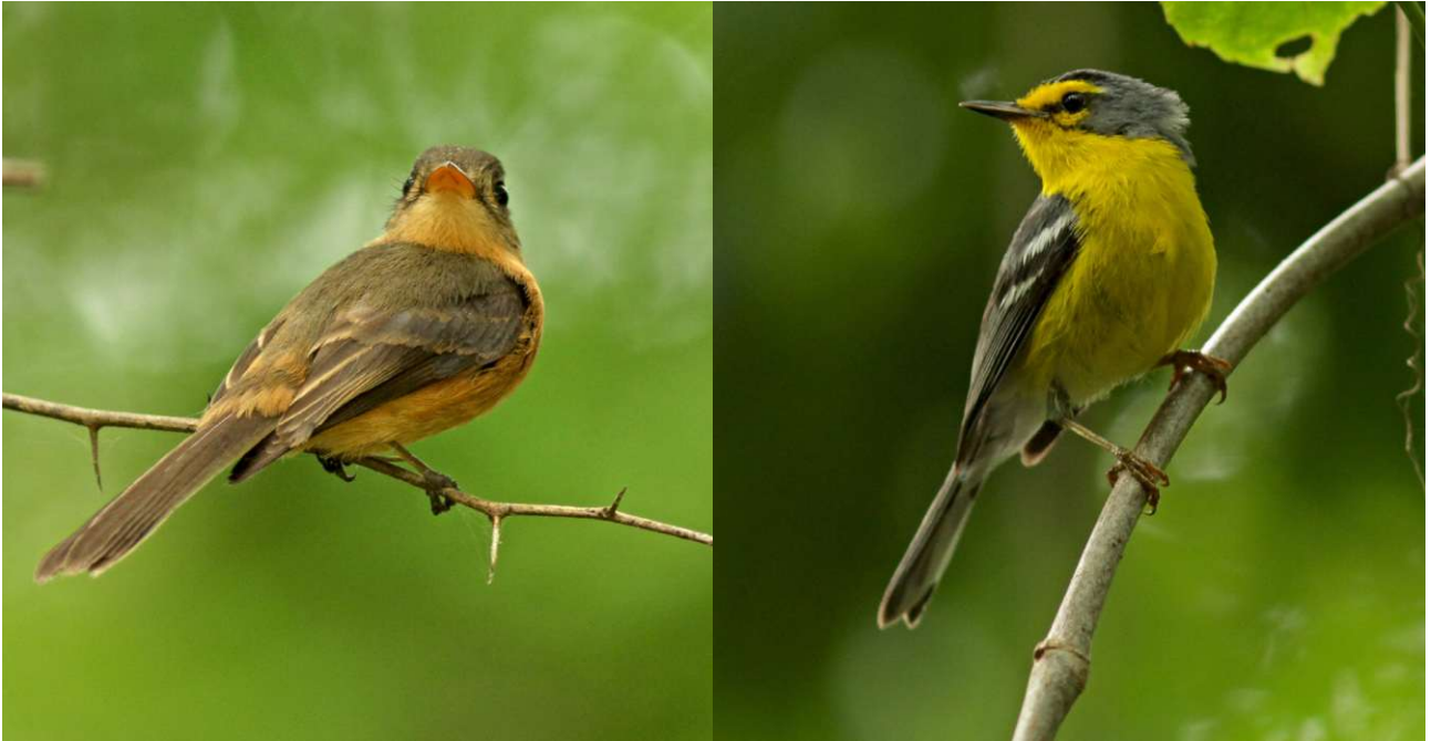
Two more favourites from St. Lucia: St. Lucia Pewee and St. Lucia Warbler

flying around squawking, and we soon tracked some down for great scope views. Also here were a couple of stunning Whistling Warblers and our first Lesser Antillean Tanagers, whilst nearer to town, we found our first Grenada Flycatchers. We also found a few other new species for the trip such as Eared Dove and Yellow-bellied Elaenia. We retired for lunch and most of the group took a rest. The intrepid few tried another area along the coast and here we found the different-looking St. Vincent House Wren as well as good numbers of the regular hummingbirds.