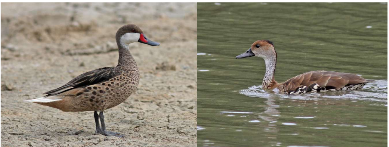
White-cheeked Pintail and West Indian Whistling Duck both showed well on Antigua (Pete Morris)

Another day, another island! To get across to Montserrat it was necessary to split the group onto two flights, but by mid-morning we'd all made it. We soon learnt that being good at filling out forms is an advantage on this tour, as every time we left or arrived at an island, another entrance or exit form was required and, (for Angie and myself) a driving license was also required!! It was grey and windy on the island and the birding was generally quite tough going with most of the species seemingly quite shy. As a result, a fair amount of perseverance was required before everyone had managed great looks at the rare Montserrat Oriole. The impressive Bridled Quail-Dove and Forest Thrush both put in several appearances as did the bizarre Northern Brown Trembler and both Pearly-eyed and Scaly-breasted Thrashers. Around the island, large Scaly-naped Pigeons were fairly conspicuous. The following morning, we filled in the forms and flew back (on two flights) to Antigua and spent the rest of the morning exploring a few wetlands. Here we enjoyed some great views of common waterbirds including Yellow-crowned Night Heron, Wilson's Plovers, Eastern Willets and an unexpected Little Egret, and we also enjoyed great views of another West Indian Whistling Duck.