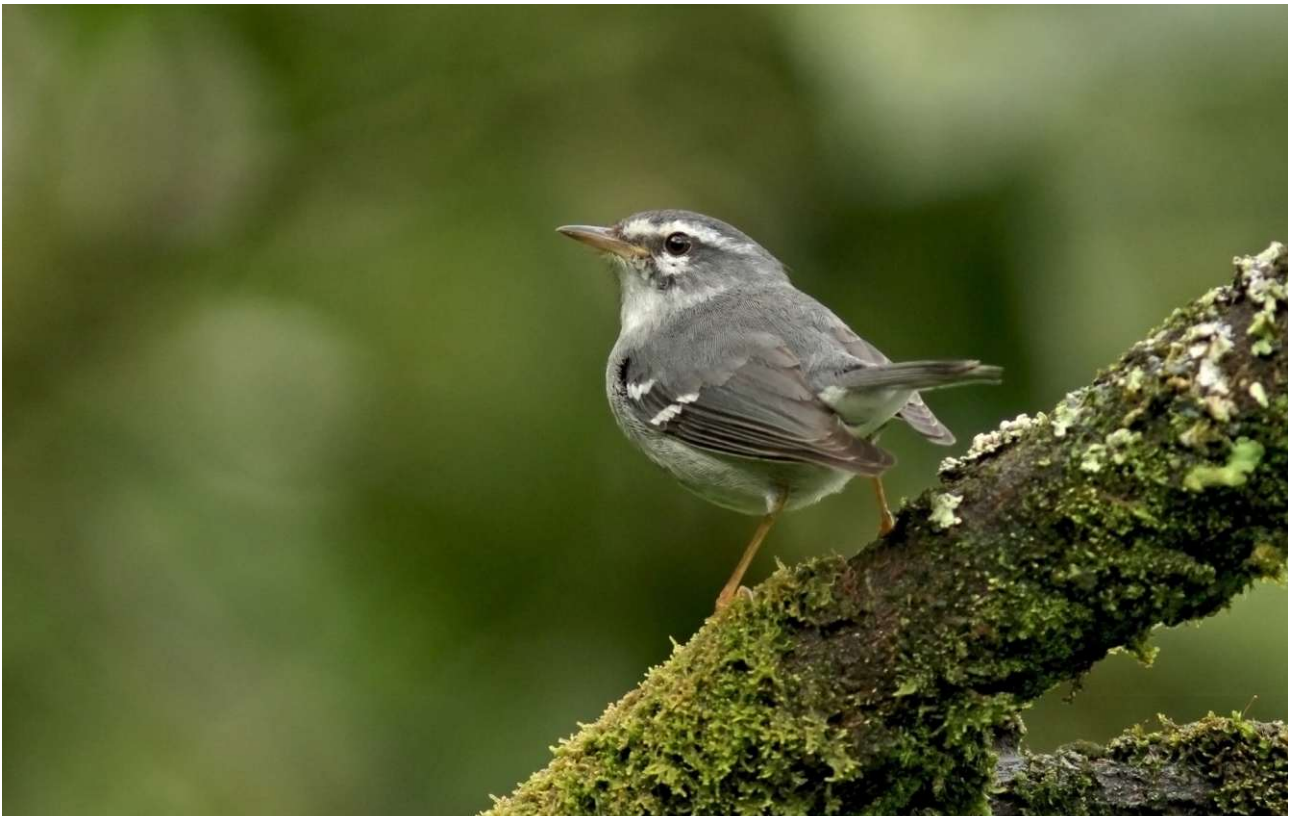
The endemic Plumbeous Warbler - another stunner

An early start saw us back at the airport before first light, before taking the short flight over to Grenada. Here we checked into our very pleasant resort hotel and enjoyed a decent breakfast before heading out. Grenada