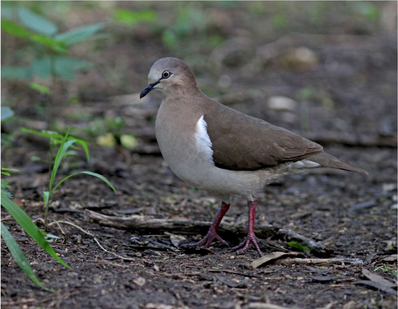
The ultra-rare Grenada Dove was a potential banana-skin but didn't cause us any problems! and became our bird of the tour!