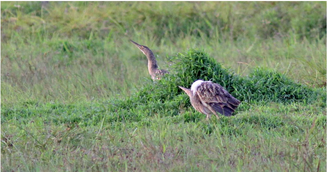
Pinnated Bitterns at Aripo Livestock Farm

On a couple of occasions we visited the Aripo area. Here we found another set of open country species. A Crane Hawk was quite a surprise, gorgeous Rufous-tailed Jacamars appeared, Black-crested and Barred Antshrikes skulked in the bushes and a male Masked Yellowthroat hopped up after a bit of persuasion. On flooded areas Wattled Jacanas, Southern Lapwings and South American Snipes showed well, the latter even drumming on occasions. Yellow-headed and Red-breasted Blackbirds added colour, Savanna Hawks drifted overhead, and other species here included Pied Water Tyrant and White-headed Marsh Tyrant, Yellow-chinned