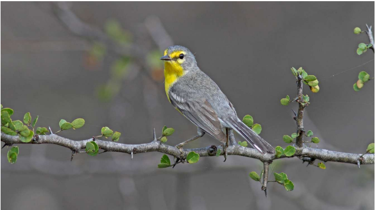
The attractive Barbuda Warbler proved to be common

lunch was more challenging than finding the birds, and we eventually ended up at a fiesta for a beer and some local produce! Whilst there a smart West Indian Whistling-Duck was spotted on Codrington Lagoon, as well as another Least Bittern. A fine end to our visit! The journey back was fairly quiet but for some lively Rastas enjoying a few beers!