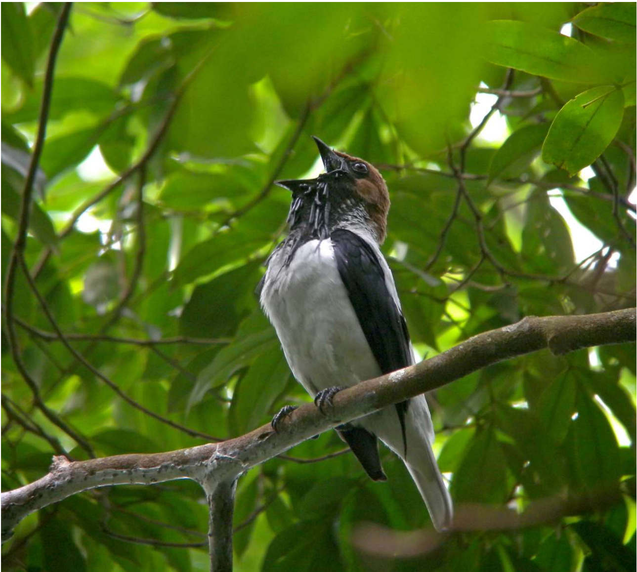
The amazing Bearded Bellbird showed well on many occasions