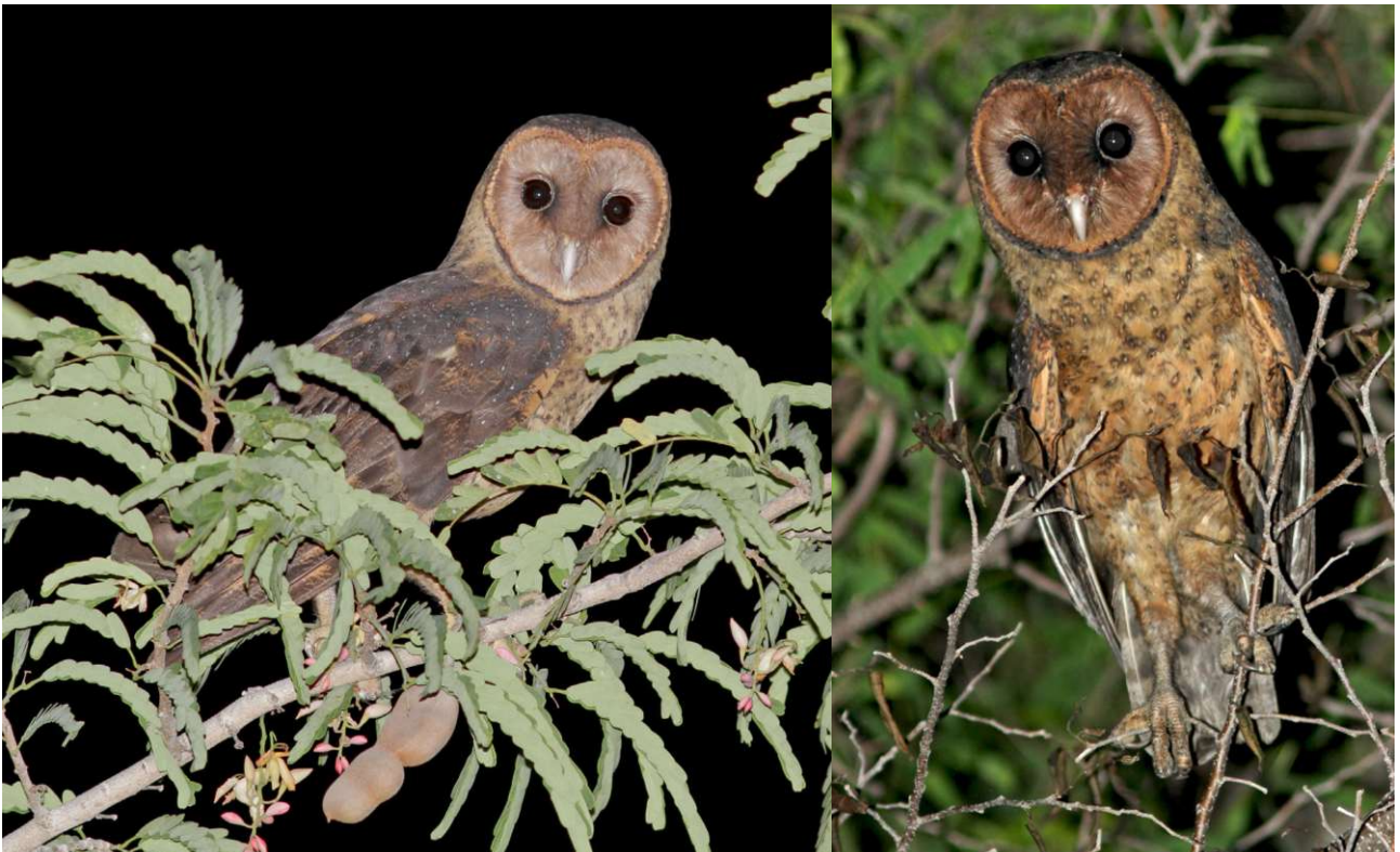
A couple more shots of the stunning Lesser Antillean Barn Owls