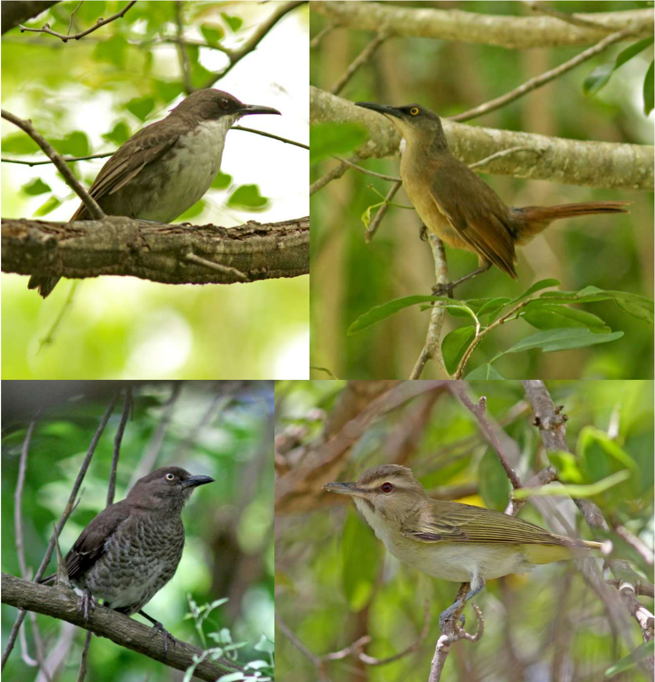
Clockwise from top left: White-breasted Thrasher; Southern Brown Trembler; Black-whiskered Vireo and Scaly-breasted Thrasher (Pete Morris)