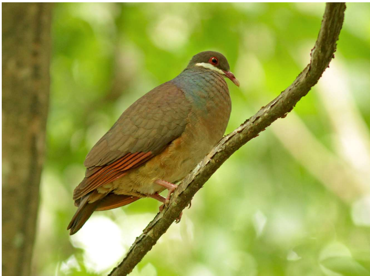
A gorgeous Bridled Quail-Dove

It's fair to say that our experience on Guadeloupe was not the best, but we did manage to get out and find the key birds without any problem. Strange-looking Guadeloupe Woodpeckers were easy to find, and we were also delighted to see more obliging Forest Thrushes and a stunning Bridled Quail-Dove. An excursion to the north of the island failed to find any tropicbirds, but did give us great views of Brown Noddies and Sooty and Bridled Terns providing nice side-by-side comparisons. After a long delay, and a disastrous lunch in a 'gourmet' restaurant, we finally made it to Martinique, and made our way up to our accommodation.