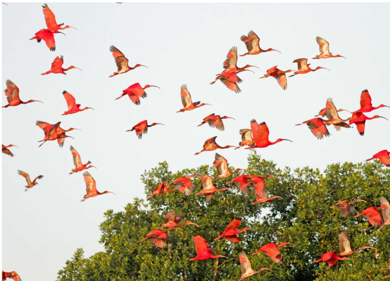
Amazing Scarlet Ibises at the Caroni Swamp (Pete Morris)