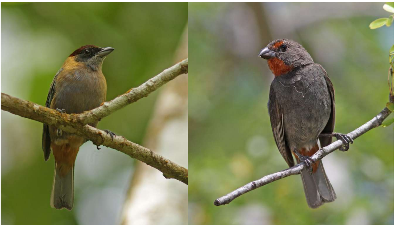
Lesser Antillean Tanager (left) and Lesser Antillean Bullfinch