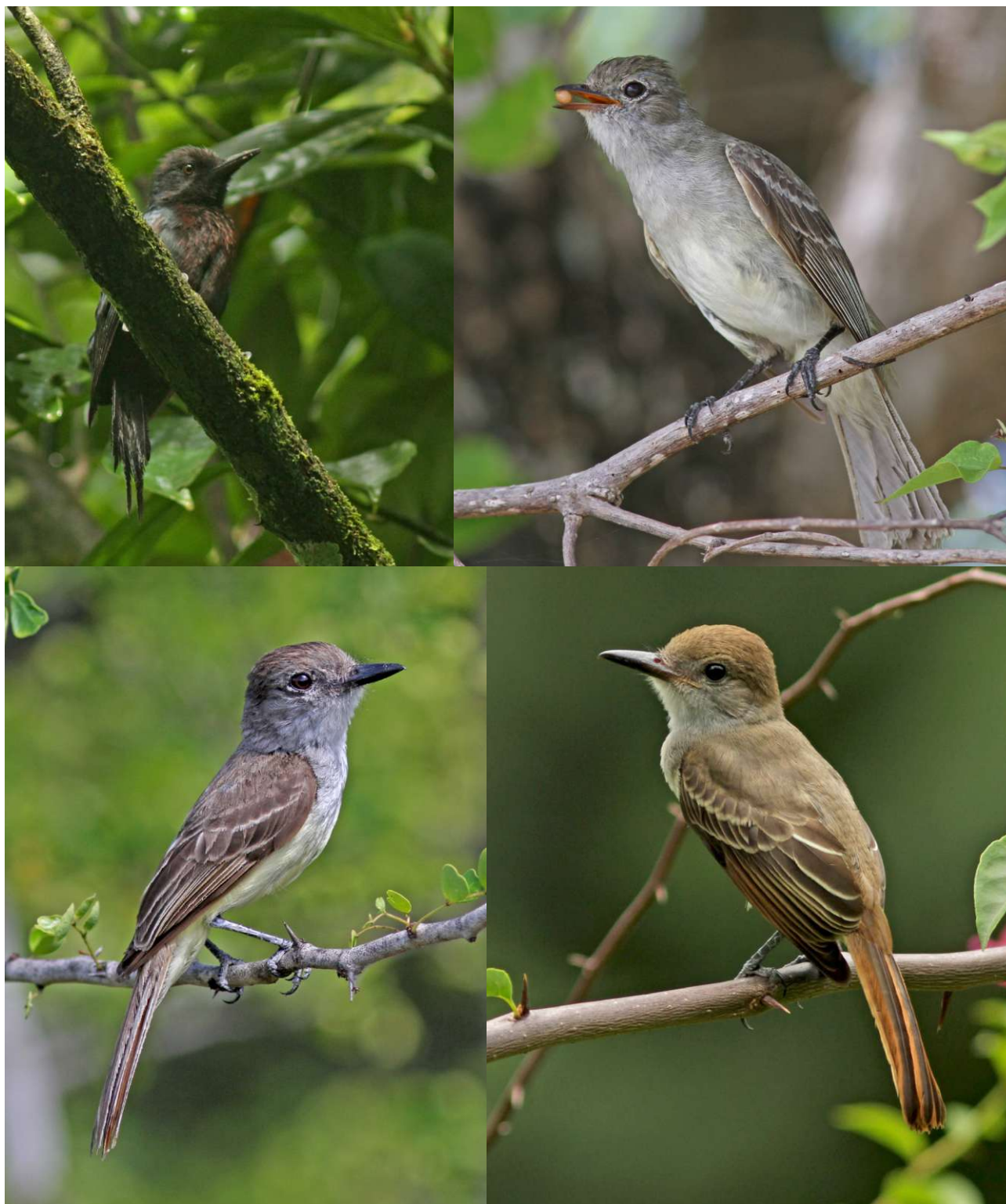
Clockwise from top left: Guadeloupe Woodpecker; Caribbean Elaenia; Grenada Flycatcher & Lesser Antillean Flycatcher

Ringed Kingfisher Megaceryle torquata Singles seen on Dominica and Guadeloupe ( stictipennis ). Guadeloupe Woodpecker ♦ Melanerpes herminieri (NT) Several seen very well. Unusual looking. Yellow-bellied Elaenia Elaenia flavogaster A few seen on St. Vincent and Grenada (nominate). Caribbean Elaenia ♦ Elaenia martinica 3 forms: riisii (Barbuda & St. Vincent); barbadensis (Barbados); nominate elsewhere. Lesser Antillean Pewee ♦ Contopus brunneicapillus 3 seen on Dominica. Lumped with St. Lucia Pewee by the IOC. St. Lucia Pewee ♦ Contopus latirostris Several of this attractive endemic seen well. Grey Kingbird Tyrannus dominicensis Pretty common throughout ( vorax ). Grenada Flycatcher ♦ Myiarchus nugator Excellent views on St. Vincent and Grenada. Lesser Antillean Flycatcher ♦ Myiarchus oberi Seen on Barbuda ( berlepschii ), Dominica ( oberi ) and St. Lucia ( sanctaeluciae ).