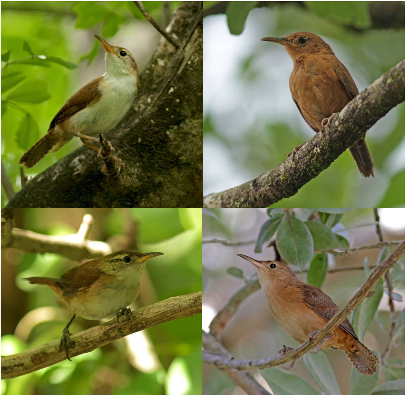
The interesting Lesser Antillean House Wrens! Clockwise from top right: Dominica House Wren; Grenada House Wren; St Vincent House Wren and St Lucia House Wren. Surely these adjacent island forms, with differing vocalizations, are good species?! (Pete Morris)