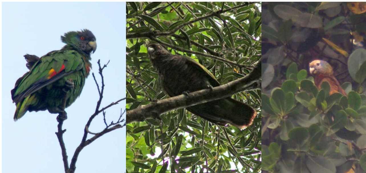
Endemic Amazons (left to right)! Red-necked and Imperial Amazons from Dominica and St. Vincent Amazon

Imperial Amazon ♦ Amazona imperialis (EN) A single seen very well in the scope at Syndicate at the 2nd attempt.