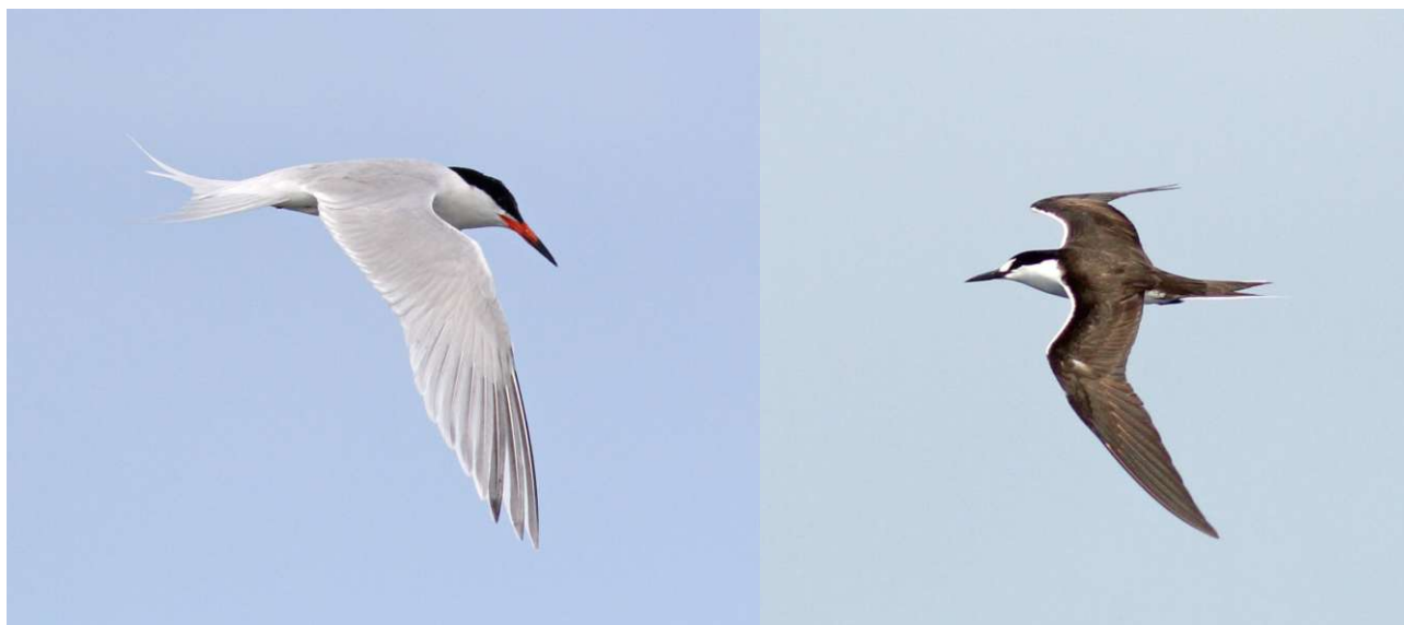
Roseate Tern and Sooty Tern (Pete Morris)

Roseate Tern Sterna dougallii Seen very well in Barbuda and at the river mouth on Dominica (nominate).