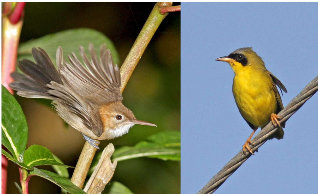
A Long-billed Gnatwren at Asa Wright and the localized Masked Yellowthroat at Aripo (Pete Morris)

Golden-fronted Greenlet Hylophilus aurantiifrons First seen at Grand Riviere, and a few others seen ( saturatus ). White-winged Swallow Tachycineta albiventer Common, first seen at the airport on arrival! Grey-breasted Martin Progne chalybea Common, also first seen at the airport (nominate). Southern Rough-winged Swallow Stelgidopteryx ruficollis Fairly common ( aequalis ). Rufous-breasted Wren Pheugopedius rutilus Common by voice. Best views were at Grand Riviere (nominate). Southern House Wren Troglodytes aedon Common, first seen at the airport ( clarus ). Long-billed Gnatwren Ramphocaenus melanurus Fairly common, especially by voice. Seen well at Asa Wright ( trinitatis ). Tropical Mockingbird Mimus gilvus Common and widespread ( tobagensis ). Cocoa Thrush ♦ Turdus fumigatus Fairly common at Asa Wright ( aquilonalis ). Spectacled Thrush Turdus nudigenis Common with several seen daily (nominate). White-necked Thrush Turdus albicollis Seen a few times at Asa Wright ( phaeopygoides ).