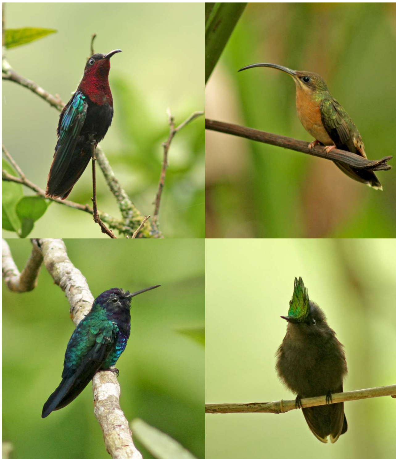
Some cracking Caribbean hummingbirds! Clockwise from top left: Purple-throated Carib; Rufous-breasted Hermit; Antillean Crested Hummingbird and Blue-headed Hummingbird (Pete Morris)

Smooth-billed Ani Crotophaga ani Seen on Dominica and on Grenada. Mangrove Cuckoo Coccyzus minor Fairly widespread with several great views. Lesser Antilles Barn Owl ♦ Tyto [alba] insularis Fantastic views on Grenada. Surely it should be split. Black Swift ♦ Cypseloides niger Quite common on Dominica, with many excellent views (nominate). Lesser Antillean Swift ♦ Chaetura martinica Seen well on Dominica, Martinique and St. Lucia. Short-tailed Swift Chaetura brachyura (NL) A couple on St. Vincent for some. Rufous-breasted Hermit Glaucis hirsutus Brilliant views of a few on Grenada, including one on a nest ( insularum ). Purple-throated Carib ♦ Eulampis jugularis A real cracker, seen superbly on Dominica, Guadeloupe, Martinique and St. Vincent. Green-throated Carib ♦ Eulampis holosericeus Nominate (Antigua/Barbuda, Dominica & St. Vincent, chlorolaemus (Grenada). Antilles Crested Hummingbird ♦ Orthorhyncus cristatus Lovely bird. Common and widespread. See note. Blue-headed Hummingbird ♦ Cyanophaia bicolor Great views on Dominica and Martinique.