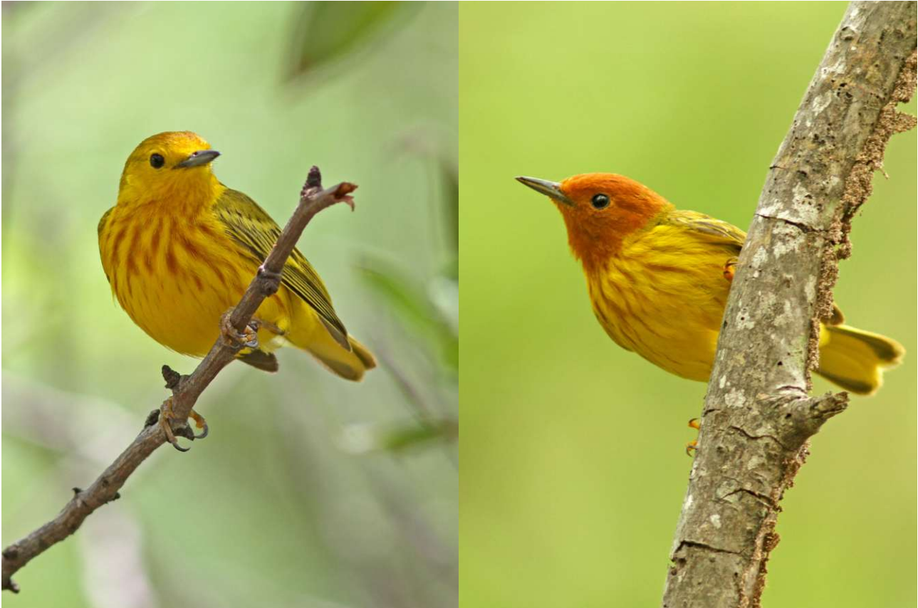
Mangrove (Golden) Warblers on Barbuda (left) and Martinique

A real cracker. We saw three forms. On Montserrat we saw the form pavida , Dominica nominate, and Guadeloupe we saw tremula . There is a suggestion that Brown Trembler may be split into two species, in which case those on Montserrat and Guadeloupe would be Northern Brown Trembler C. tremula and those on Dominica, Southern Brown Trembler C. ruficauda .