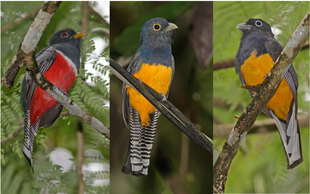
Left to right, Collared, Guianan and Green-backed Trogons provided colour at Asa Wright