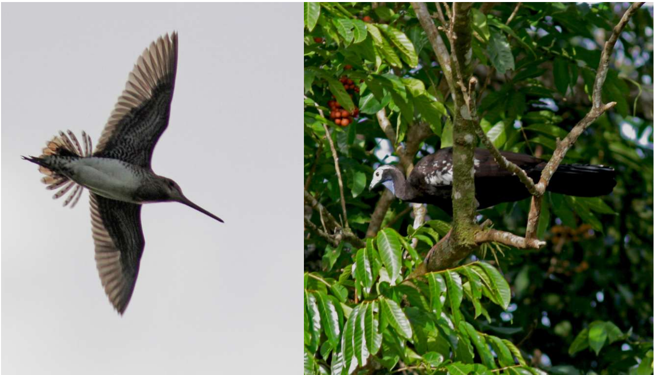
A displaying South American Snipe at Aripo and a Trinidad Piping Guan showing well up at Grand Riviere (Pete Morris)