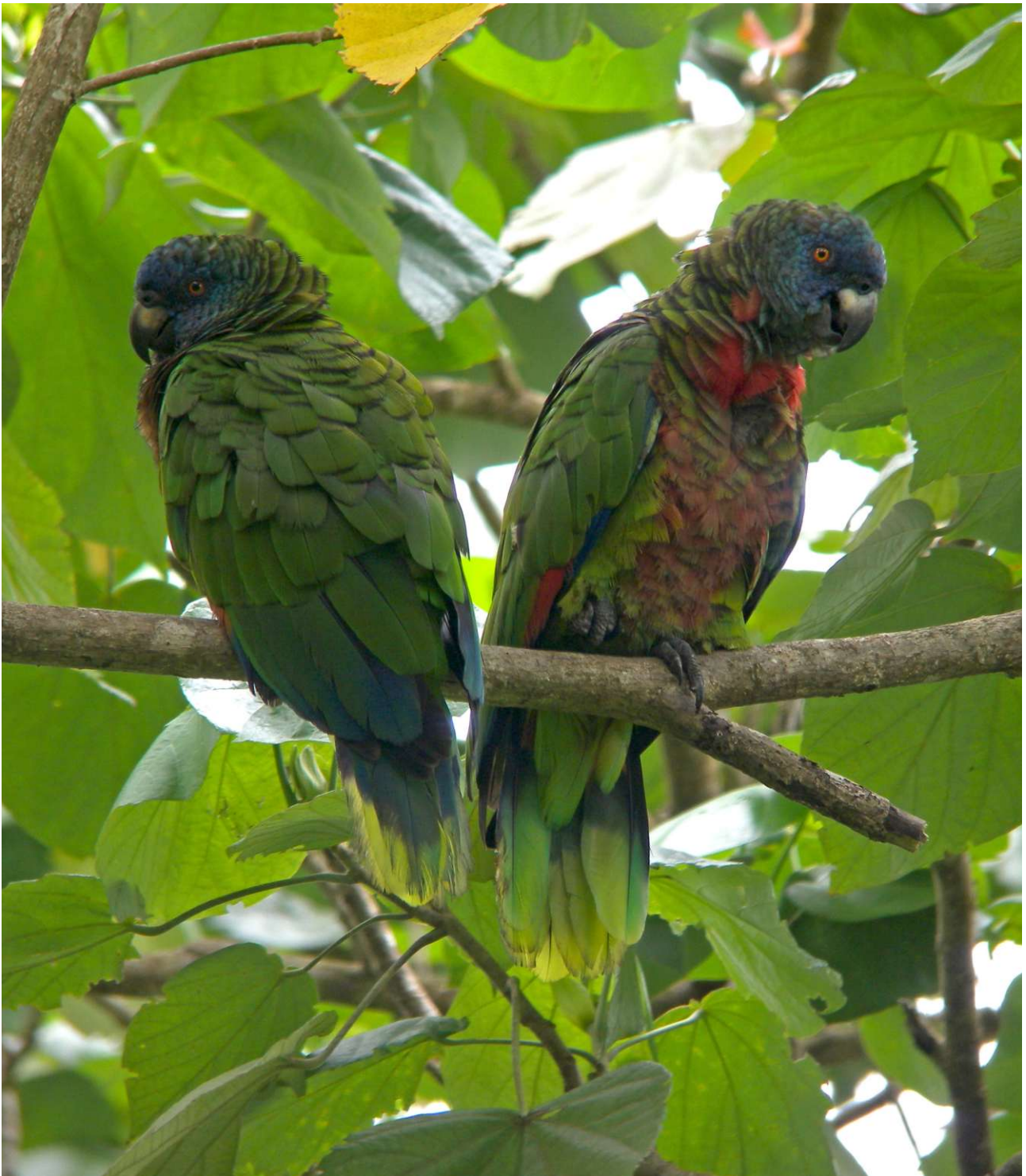
A fine pair of St. Lucia Amazons (or Parrots) (Pete Morris)

with a heronry just outside! In drier areas on the east coast of the island we found interesting St. Lucia House Wrens, delightful St. Lucia Warblers were common, cinnamon St. Lucia Pewees were very tame and we even managed another spectacular view of Bridled Quail Dove. Mangrove Cuckoos showed well, and eventually we tracked down the rather different looking local form of White-breasted Thrasher. Up in the wetter mountains we enjoyed some spectacular views of colourful St. Lucia Amazons and found the subtle St. Lucia Black Finch to be reasonably common, and found cacique-like St. Lucia Orioles building their nest.