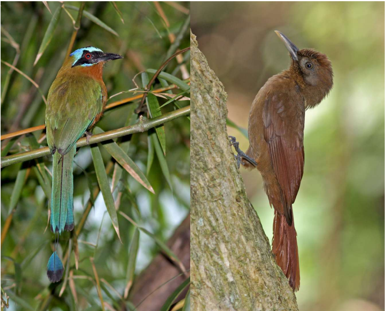
The stunning Trinidad Motmot and Plain-brown Woodcreeper both showed well at Asa Wright (Pete Morris)