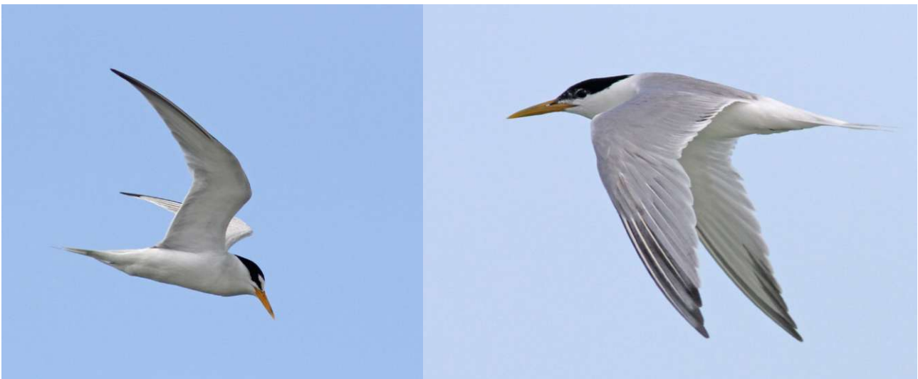
Least Tern and the Cayenne form of Cabot's Tern on Barbuda (Pete Morris)

Common Gallinule Gallinula galeata Fairly widespread with many great views ( cerceris ). Caribbean Coot ♦ Fulica caribaea (NT) Several seen well on Antigua. Black-necked Stilt Himantopus mexicanus Several seen on Antigua ( mexicanus ). Grey Plover Pluvialis squatarola A couple seen on Antigua ( cynosurae ). Semipalmated Plover Charadrius semipalmatus A few seen on Antigua/Barbuda Dominica and Grenada. Wilson's Plover Charadrius wilsonia Nominate seen on Antigua/Barbuda and cinnamominus on Grenada. Short-billed Dowitcher Limnodromus griseus A single seen well at the Layou River, Dominica. Greater Yellowlegs Tringa melanoleuca A couple seen on Grenada. Willet Tringa semipalmata A few seen on Antigua (nominate - Eastern Willet). Ruddy Turnstone Arenaria interpres Small numbers on Antigua and Grenada ( morinella ). Brown Noddy Anous stolidus Good numbers on Dominica and Guadeloupe (nominate). Laughing Gull Leucophaeus atricilla Common and widespread (nominate). Royal Tern Thalasseus maximus A few seen around Antigua/Barbuda (nominate). Cabot's Tern ♦ Thalasseus acufavidus A few on Antigua and Barbuda including a 'Cayenne Tern' with a dull yellow bill. Least Tern Sternula antillarum Plenty seen well on Antigua. Grey rump and distinct vocalizations (nominate).