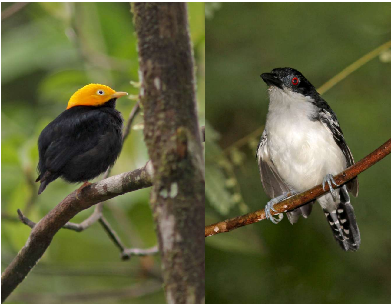
Golden-headed Manakin and Great Antshrike at Asa Wright (Pete Morris)

One bird at Aripo Livestock Farm was watched displaying like a bustard, strutting around with exposed white patches at the base of its neck! Quite an amazing sight!!