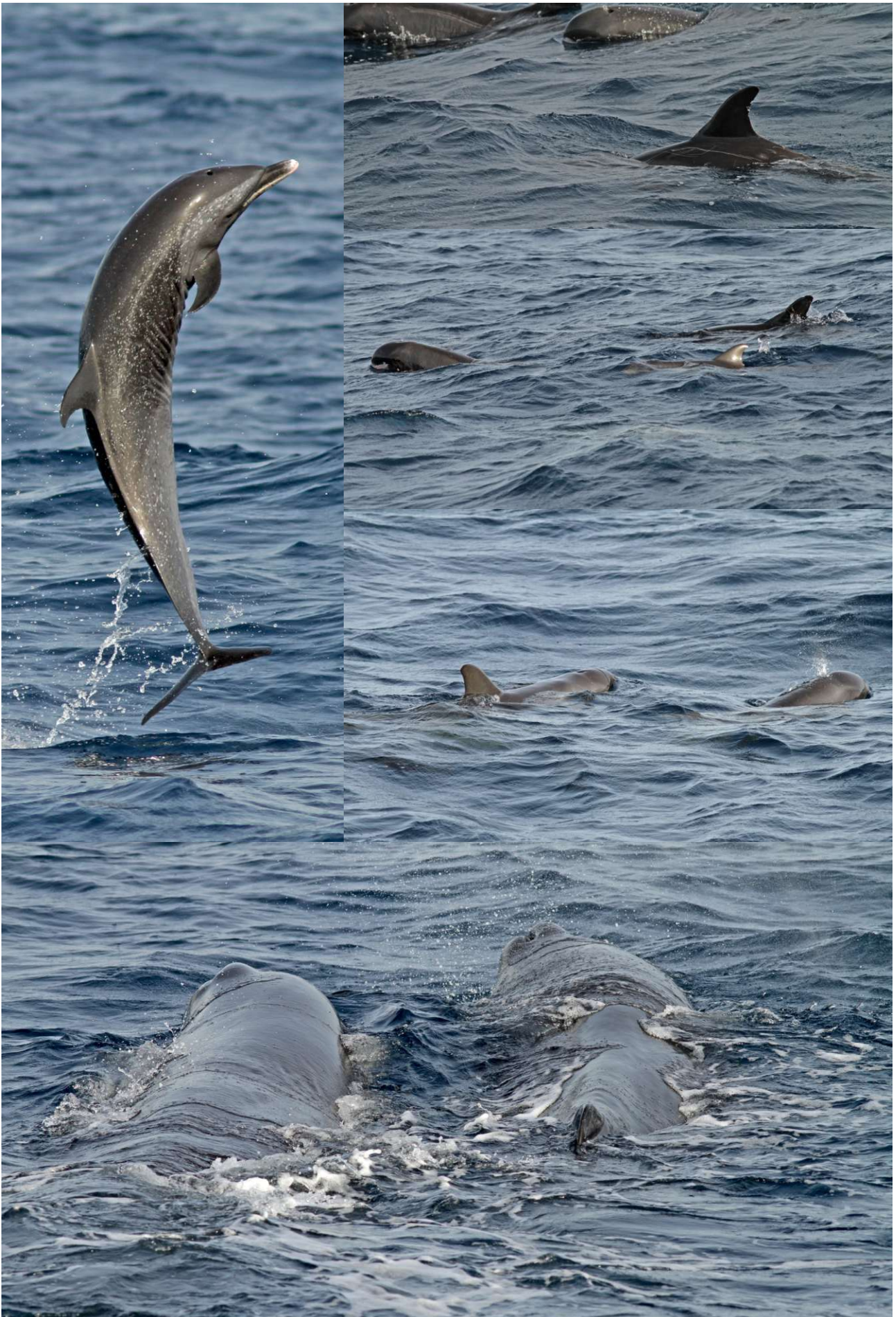
The Dominica cetacean experience! Pantropical Spotted Dolphin, three shots of Pygmy Killer Whales and two huge Sperm Whales