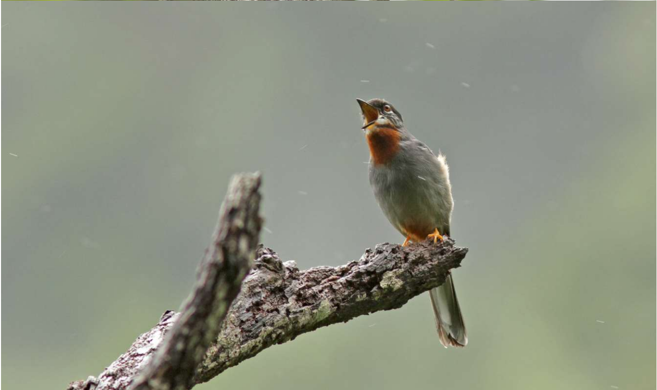
A couple of cracking thrushes from Dominica: top, Red-legged Thrush and Rufous-throated Solitaire (Pete Morris)

Red-legged Thrush ♦ Turdus plumbeus Several seen well at Syndicate on Dominica ( albiventris ).