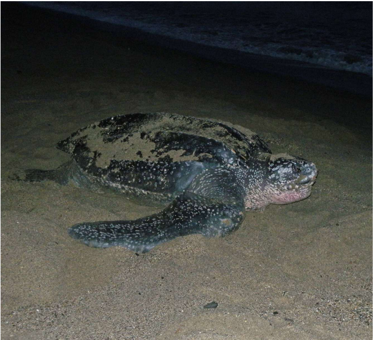
A huge Leatherback Turtle on the beach at Grand Riviere

pair of Ferruginous Pygmy Owls, a spotlight encounter with a fine Spectacled Owl, Golden-olive Woodpecker, White-flanked Antwren, Euler's Flycatcher, Ochre-lored and Yellow-olive Flatbills and Violaceous Euphonia.