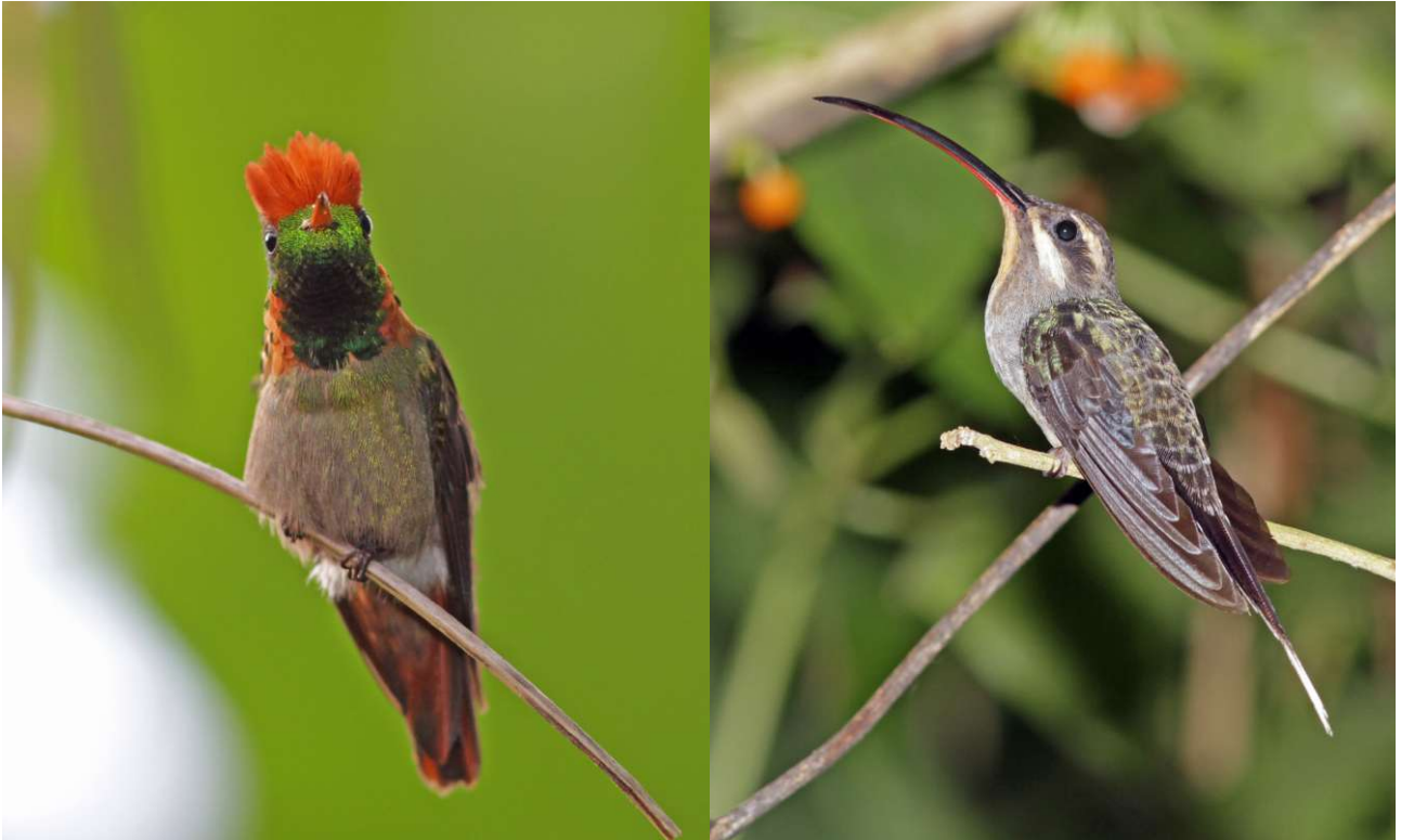
Another view of the stunning Tufted Coquette and a Green Hermit at Asa Wright