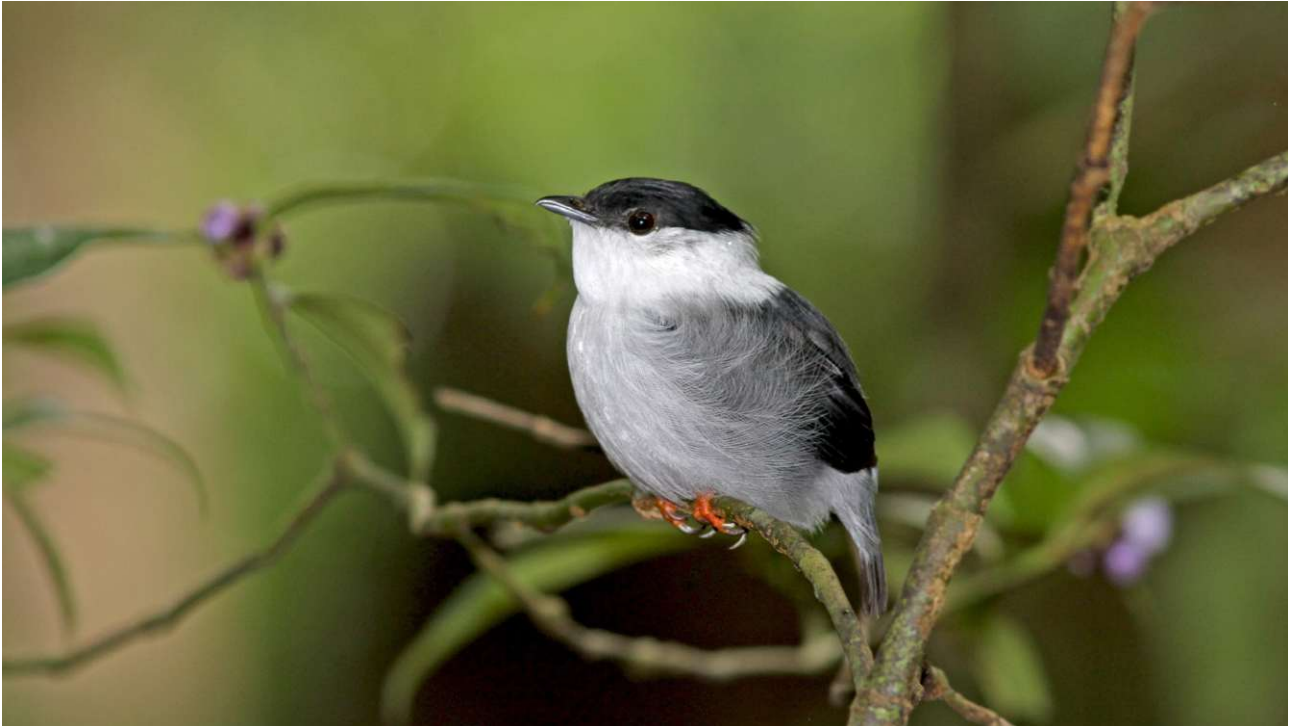
The superb White-bearded Manakin (Pete Morris)