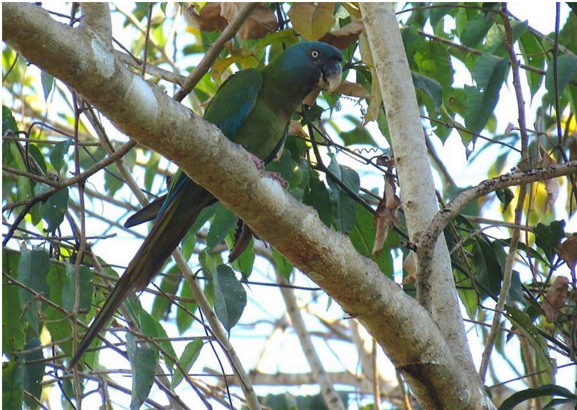
Blue-headed Macaw (Eduardo Patrial)

The impressive Ramal do Noca in Rio Branco, Acre is certainly a must visiting site in the whole Amazon. Again we had a phenomenal time in this bamboo rich forest with fascinating specialists, rarities and localized species. Here some of the photos taken at Noca: