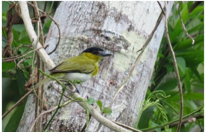
Yellow-cheeked Becard