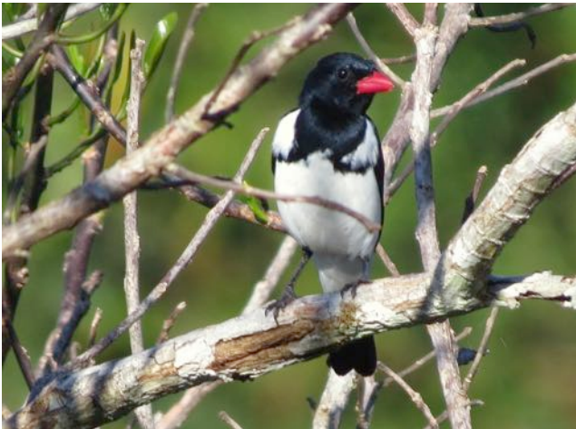
Red-billed Pied Tanager (Eduardo Patrial – archive)