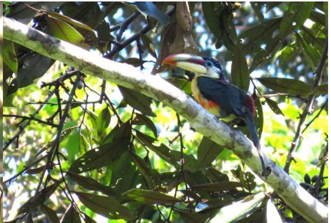
Curl-crested Aracari