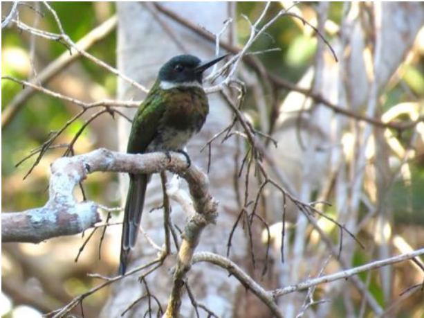
Bronzy Jacamar