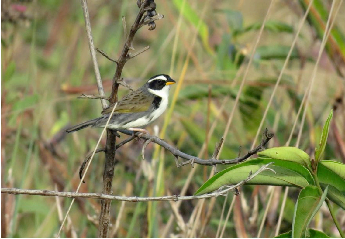
Black-masked Finch (Eduardo Patrial)