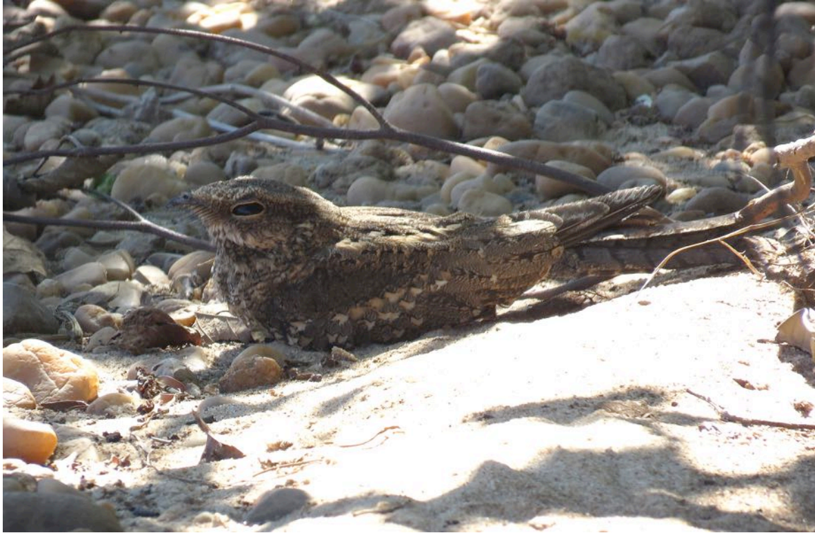
Ladder-tailed Nightjar

Natterer's Slaty Antshrike ♦ Thamnophilus stictocephalus Seen well at Tabajara. See note. Amazonian Antshrike Thamnophilus amazonicus (H) Heard in Humaitá and Rio Branco. Glossy Antshrike ♦ Sakesphorus luctuosus Great views in Tabajara and at varzea in Humaitá, right of Madeira. Fasciated Antshrike Cymbilaimus lineatus Good views of a male in Tabajara. Bamboo Antshrike ♦ Cymbilaimus sanctaemariae Superb looks at a pair at Ramal do Noca. Great Antshrike Taraba major Also seen at Ramal do Noca.