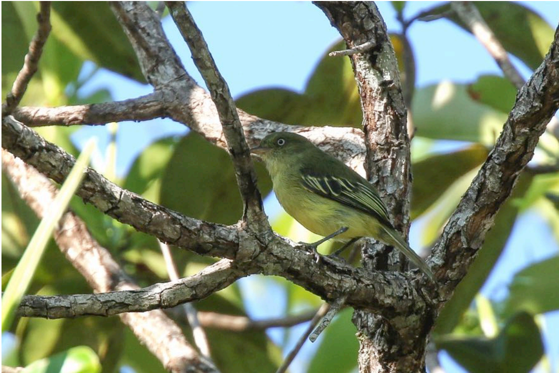
Chico's Tyrannulet (Brian Field)

The Tabajara area kept the good birding and we left the area with several great birds on our list. Below some of the photographed species: