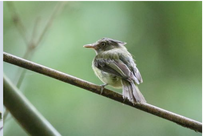
Long-crested Pygmy Tyrant (Brian Field)