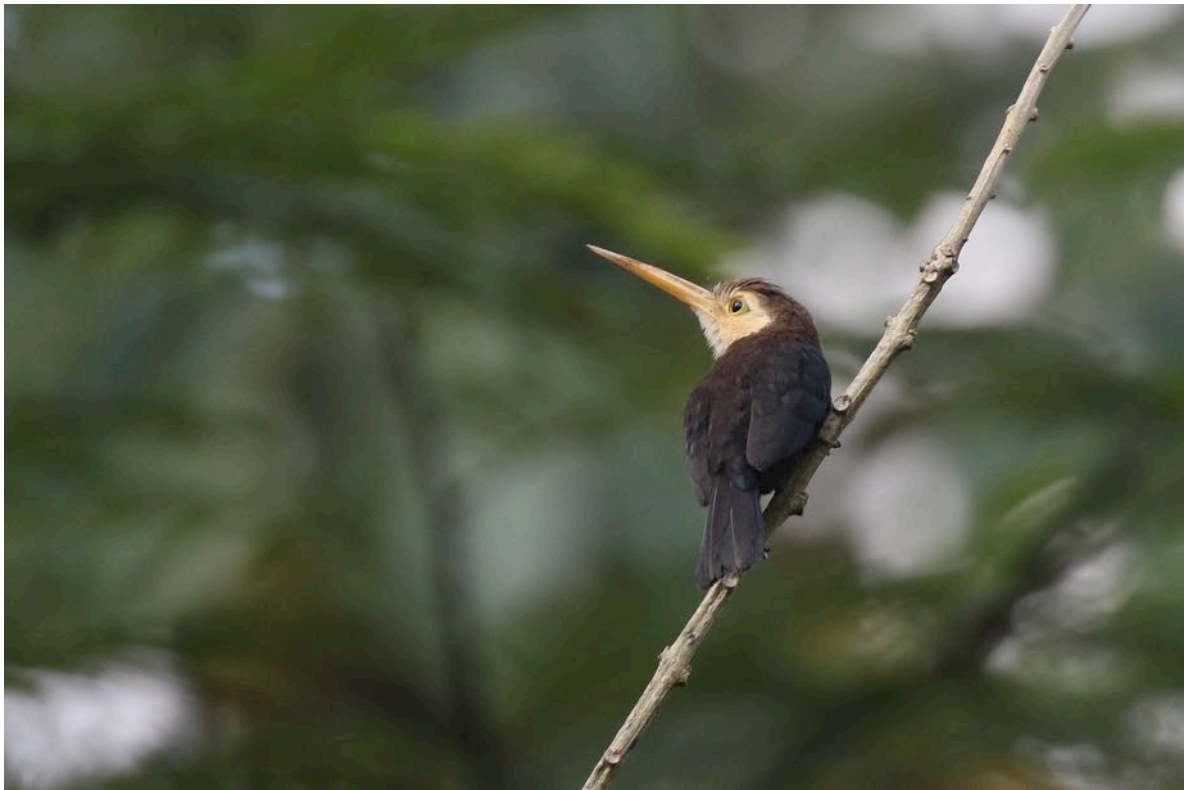
White-throated Jacamar (Brian Field)