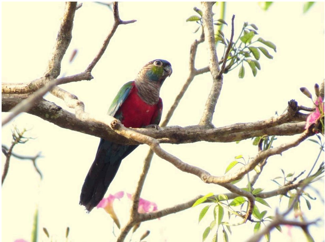
Crimson-bellied Parakeet