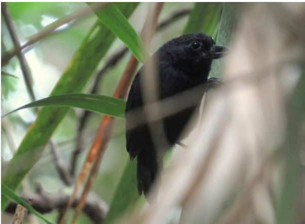
Rondonia Bushbird

Jaci-Paraná turned out a very good change on the itinerary, putting us some really fine Amazonian birds, including the very rare Rondonia Bushbird, star of the tour and only seen by us (Birdquest) for the second time. Below some images to illustrate these two days there: