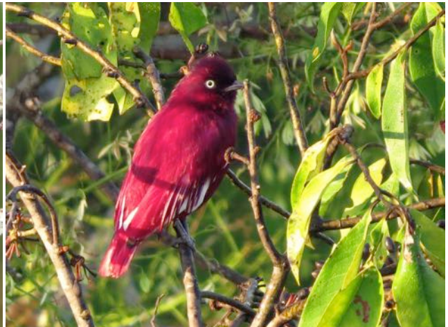
Pompadour Cotinga

July 18 th . A morning travel from Jaci-Paraná to Rio Branco, Acre's state capital. On the drive we had the expected cast including Wood Stork, Capped Heron, Swallow-tailed Kite, White-tailed and Roadside Hawks, Neotropical Palm Swift, Scarlet and Red-bellied Macaws, Black Caracara and Scarlet Flycatcher. The ferry across the Madeira in Abunã provided a couple Collared Plovers, Brown-chested Martin and at least two Bolivian River Dolphins. Lunch was at Rio Branco followed by our first incursion to the impressive bamboo forest at Ramal do Noca. Even in the beginning of afternoon the amazing Noca provided great bird activity with Tinamous calling, Parrots, Antbirds and more, and we were so delighted. The couple of hours there were fantastic with splendid sightings of fine selection of birds: White-throated Jacamar, Blue-headed Macaw, Rufous-headed Woodpecker, Manu Antbird, Bamboo Antshrike (male and female), Yellow-breasted Warbling Antbird (for some), the both rare Black-faced and Purple-throated Cotingas (curiously interacting in the same tree); Cobalt-winged and Dusky-headed Parakeets, Chestnut-fronted Macaw, Black-tailed Trogon, Little Woodpecker, Brown-rumped Foliage-gleaner (a brief view for some), Yellow-billed Nunbird and a female Crimson-crested Woodpecker. What an amazing start in Rio Branco!