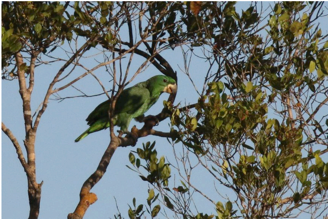
Kawall's Amazon