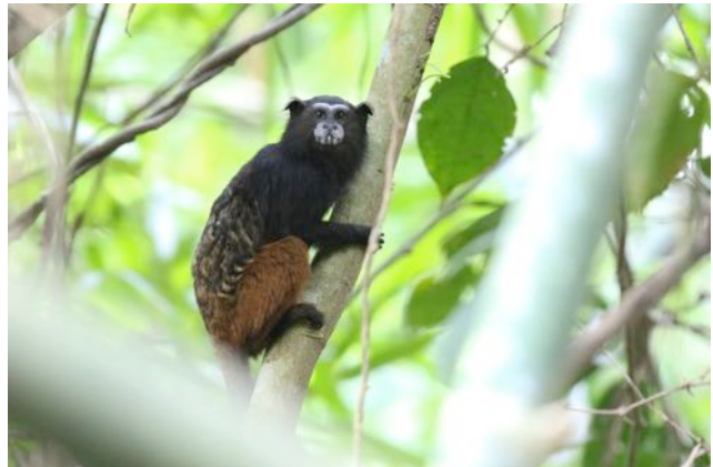
Saddleback Tamarin