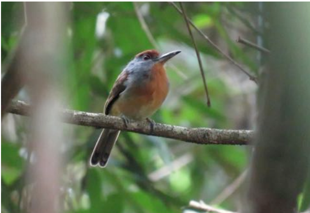
Rufous-capped Nunlet