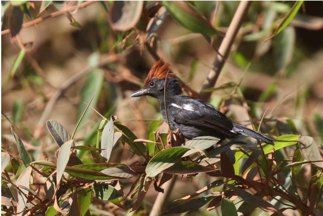
Glossy Antshrike – female (Brian Field)