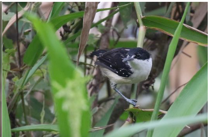
Black-and-white Antbird (Brian Field)