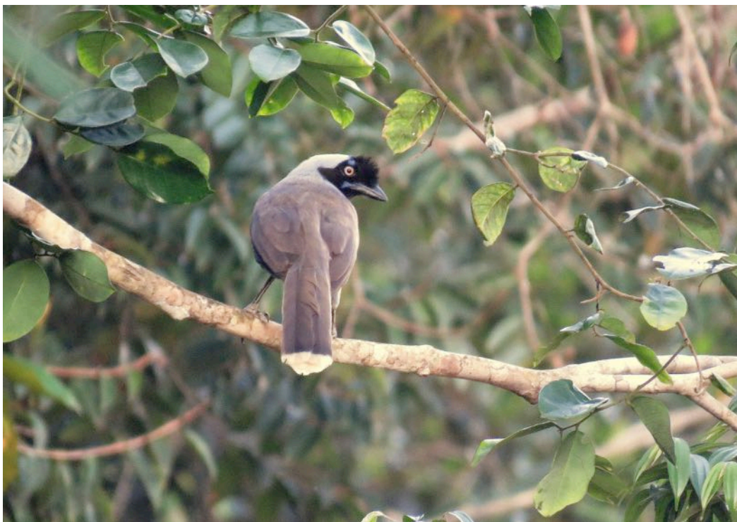
Azure-naped (Campina) Jay