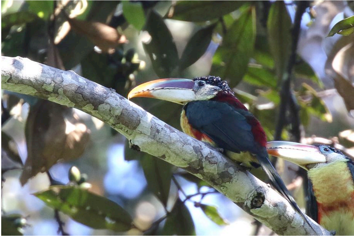
Curl-crested Aracari (Brian Field)