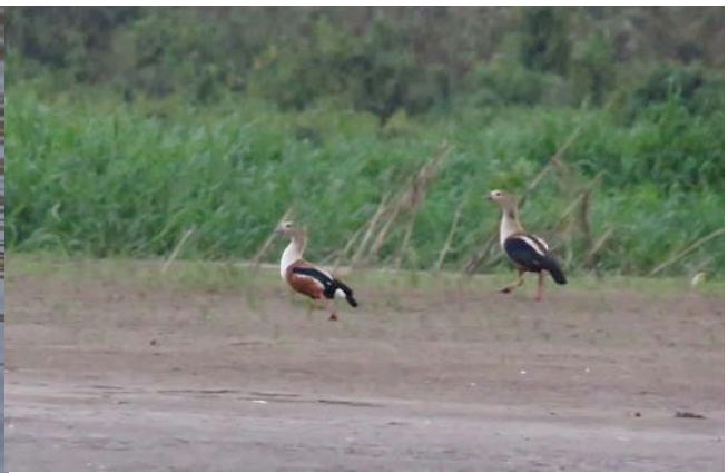
Orinoco Goose (Eduardo Patrial)