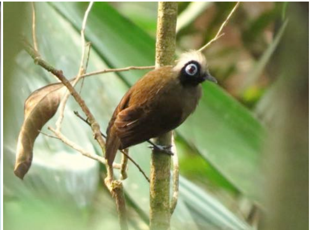
Hairy-crested Antbird