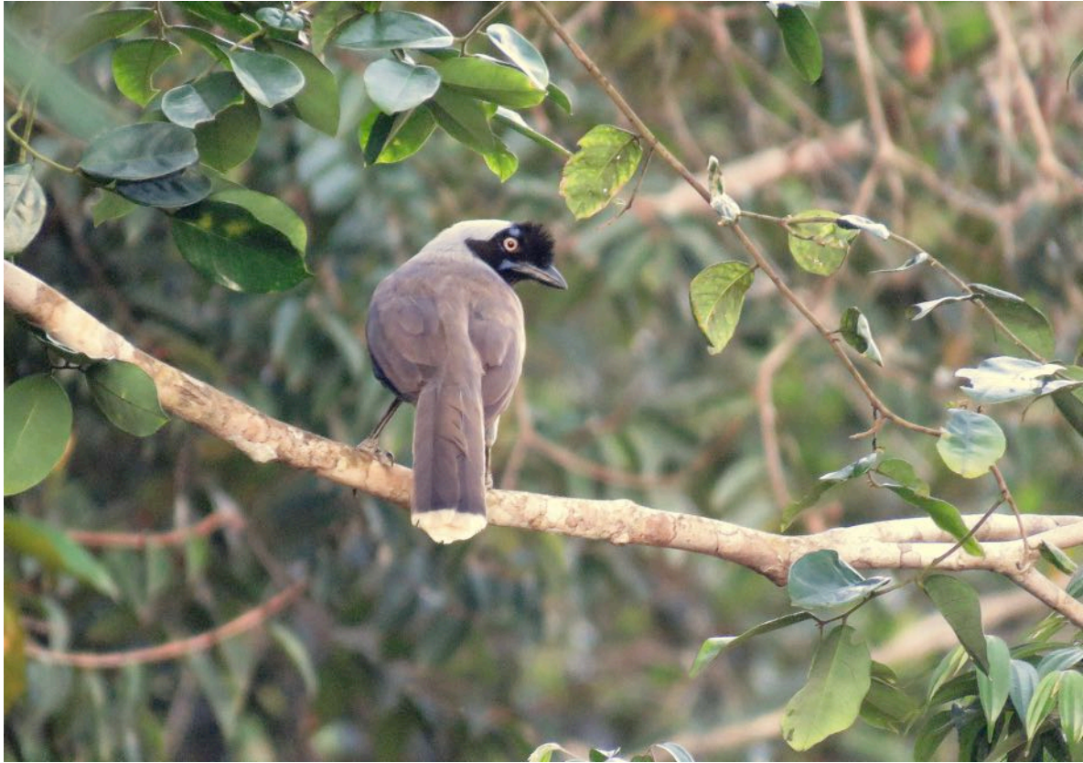
Azure-naped (Campina) Jay