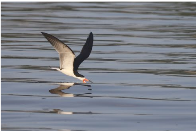
Black Skimmer (Brian Field)