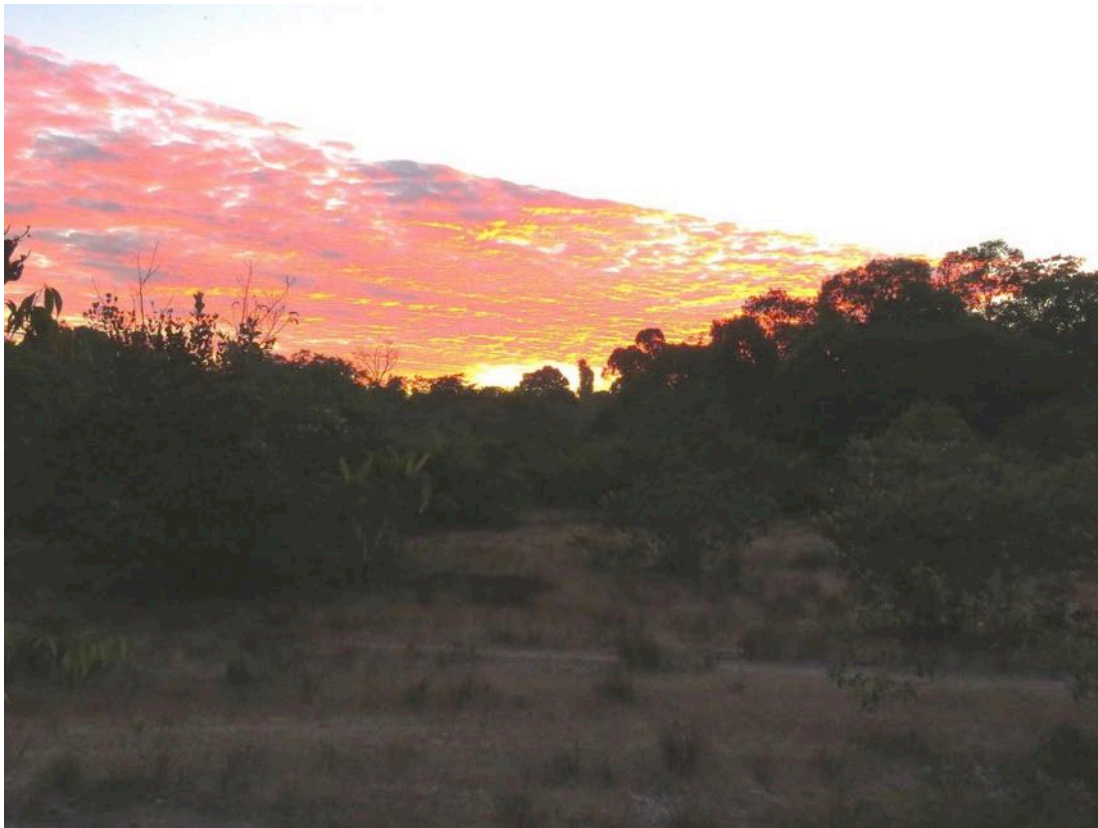
Sunrise at Ramal do Caldeirão, Tabajara

July 12 th . On this day, next to Porto Velho, we began with our first forays on the west bank of Rio Madeira (the Inambari endemism centre). Taking the bridge across the Madeira we visited a close and good terra firme forest at Ramal C-1. Bird activity was not the greatest but we certainly had a pleasant morning at forest edge starting with some Red-throated Caracaras, White-bellied Parrot, Swallow-tailed Kites, Brown-madible Aracari, Short-tailed Pygmy Tyrant with nest and an Amazonian Scrub Flycatcher which attended in canopy after play-back. Further on the track the forest provided an enjoyable morning with good sightings of several goodies like Inambari Woodcreeper, Black Antbird, Amazonian Pygmy Owl, a couple Brown-banded Puffbird, the rare Inambari Gnatcatcher, Brownish Twistwing, a couple Western Striolated Puffbirds and the stunning Curl-crested Aracari. We tried hard for other things (e.g. Black Bushbird and Bar-bellied Woodcreeper) but without succeeding this time. In the afternoon, still on Madeira's west bank, we visited the further Ramal C-30. The good campinarana was a little quiet as expected for the time of day, but it was enough to get our main target species, the recently described Predicted Antwren (a male) and the beautiful Azure-naped (Campina) Jay, a group of about eight birds just before dusk. There we also got nice looks at Peruvian Warbling Antbird and Bronzy Jacamar.