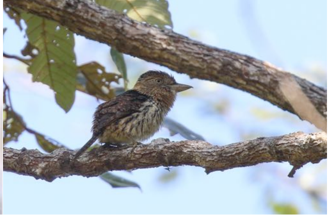
Western Striolated Puffbird (Brian Field)