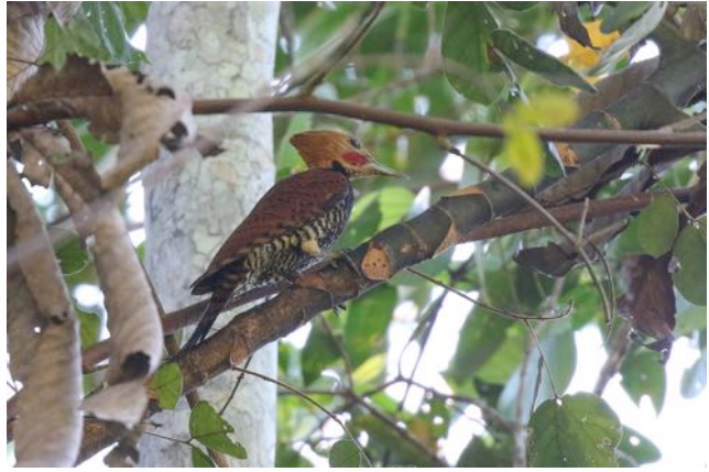
Ringed Woodpecker (Brian Field)