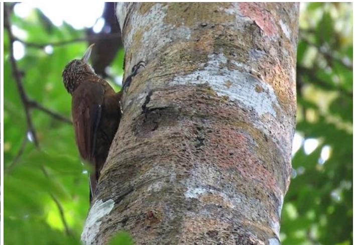
Zimmer's Woodcreeper (Eduardo Patrial)