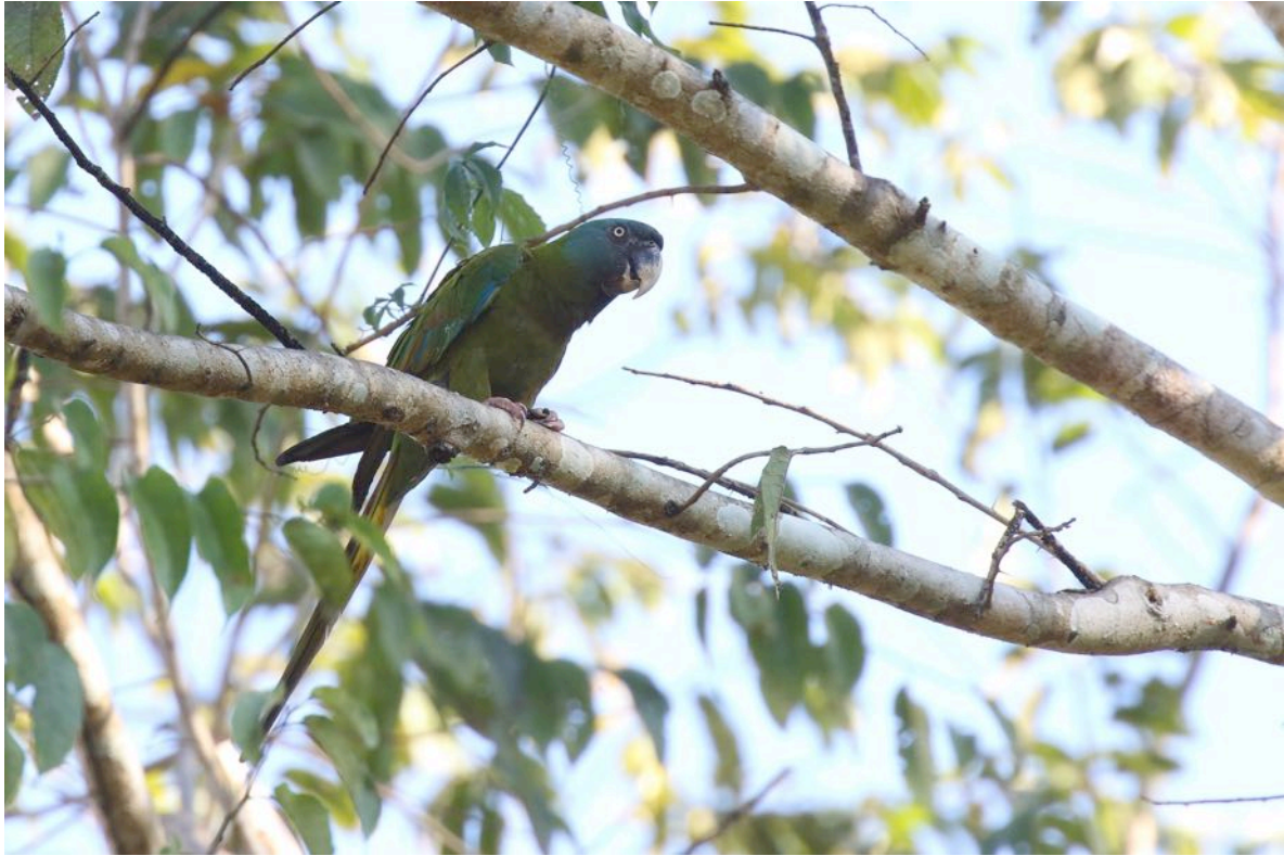
Blue-headed Macaw (Brian Field)