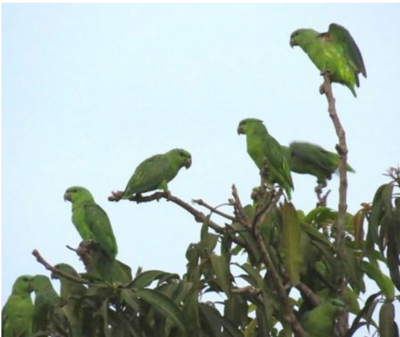
Short-tailed Parrot (Eduardo Patrial)