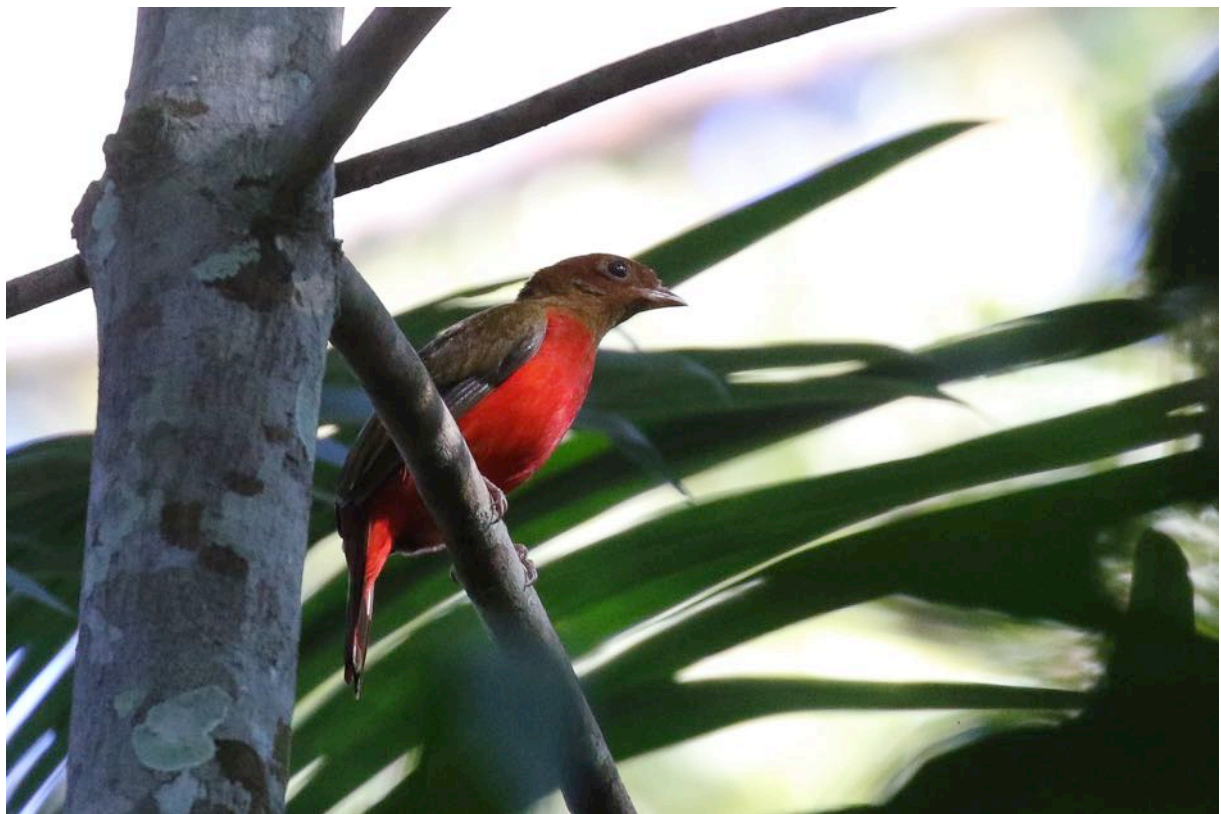
Black-necked Red Cotinga (Brian Field)