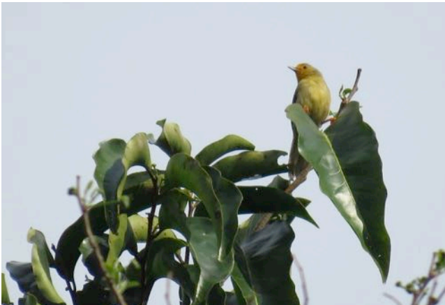
Orange-fronted Plushcrown (Eduardo Patrial)