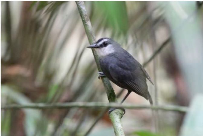
White-throated Antbird (Brian Field)