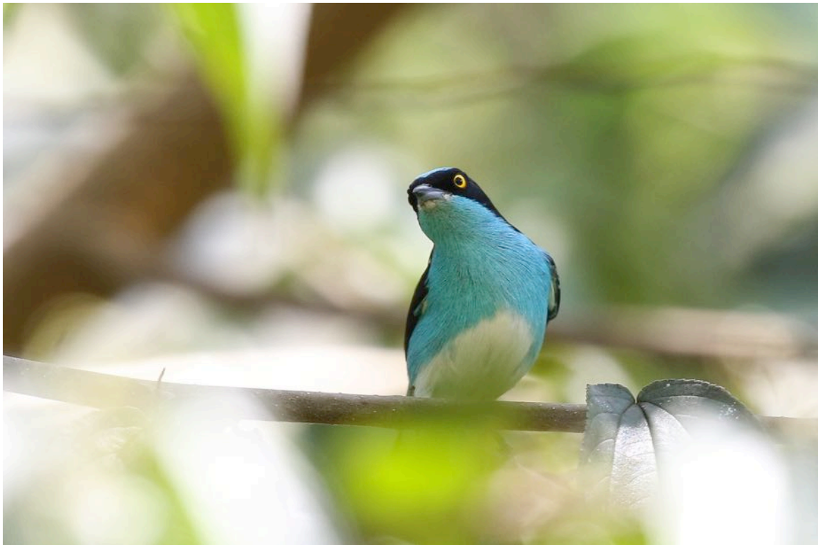
Black-faced Dacnis (Brian Field)