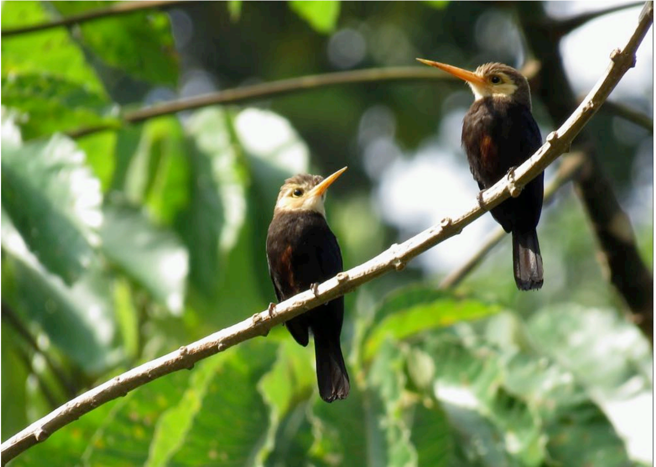
The range-restricted White-throated Jacamar in Acre, Brazil (Eduardo Patrial)