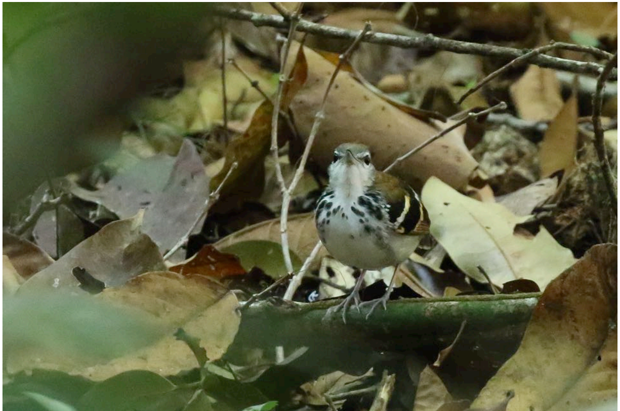
Banded Antbird