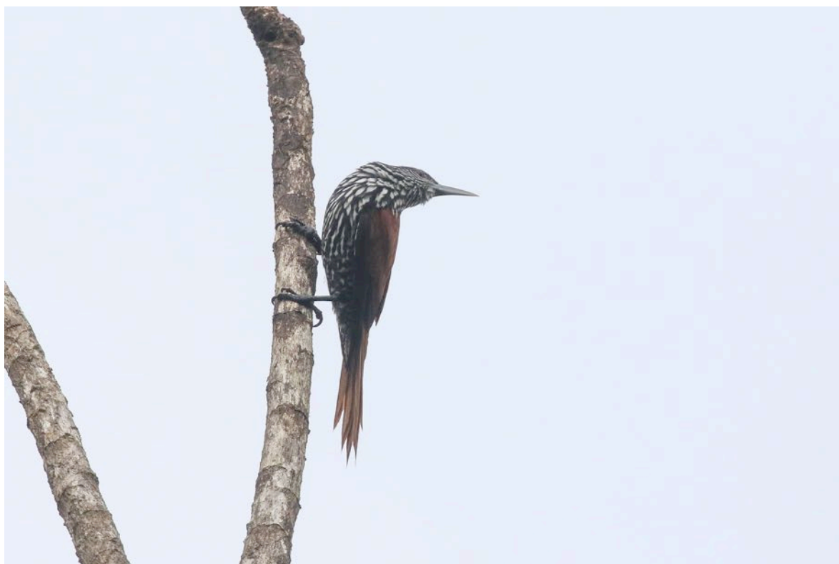
Point-tailed Palmcreeper (Brian Field)

Rufous-tailed Foliage-gleaner Philydor ruficaudatum Seen in Humaitá, Jaci-P and Rio Branco. Buff-throated Foliage-gleaner Automolus ochrolaemus (H) Heard at C-30, Humaitá and Rio Branco. Brown-rumped Foliage-gleaner Automolus melanopezus Briefly seen by some at Ramal do Noca, Acre. Chestnut-crowned Foliage-Gleaner Automolus rufipileatus Good sightings at Ramal do Noca, Acre.