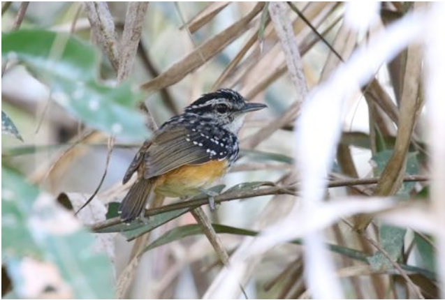
Peruvian Warbling Antbird

We had a fine selection of birds exploring the west bank of Madeira near Porto Velho and later the varied habitats around Humaitá. Below some of species photographed: