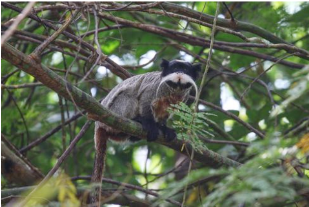
Emperor Tamarin (Brian Field)