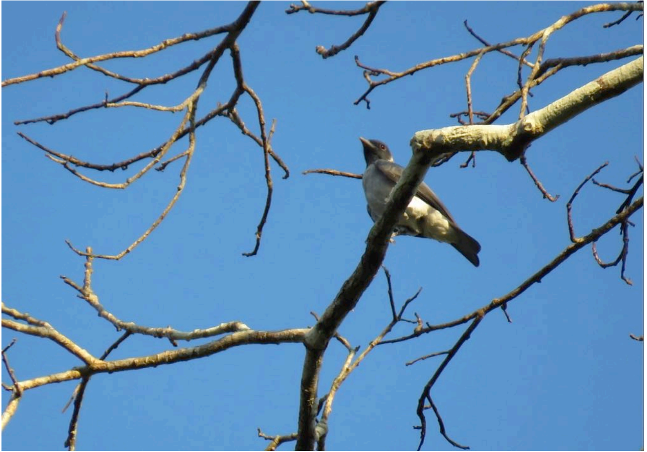
Black-faced Cotinga (Eduardo Patrial)