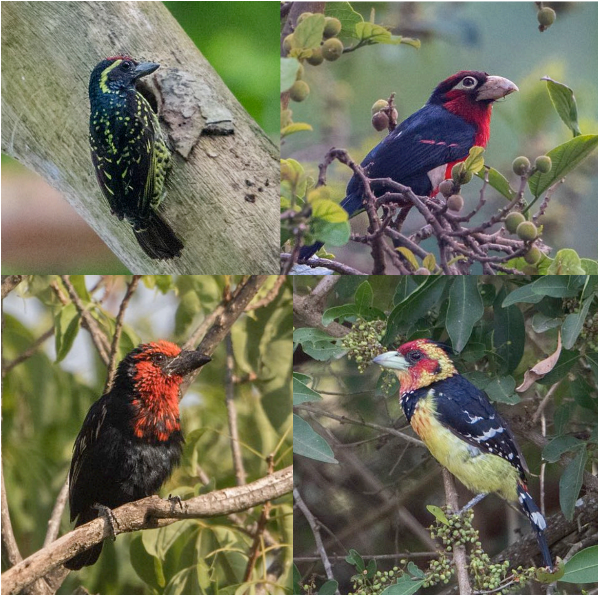
Barbet collection: Yellow-spotted, Double-toothed, Crested and Black-billed Barbets.

African Pied Hornbill Tockus fasciatus Several sightings. African Grey Hornbill Tockus nasutus Fairly common. White-thighed Hornbill Bycanistes albotibialis Seen well in Budongo forest. Black-and-white Casqued Hornbill Bycanistes subcylindricus Fairly common and widespread. Grey-throated Barbet Gymnobucco bonapartei Several birds seen in the forest. Speckled Tinkerbird Pogoniulus scolopaceus Fairly common in the forest. Western Tinkerbird Pogoniulus coryphaea Seen well at Bwindi. Yellow-throated Tinkerbird Pogoniulus subsulphureus Scattered sightings. Yellow-rumped Tinkerbird Pogoniulus bilineatus Fairly common. Yellow-fronted Tinkerbird Pogoniulus chrysoconus 3 birds seen in dry areas. Yellow-spotted Barbet Buccanodon duchaillui A few birds seen, first in Mabira.