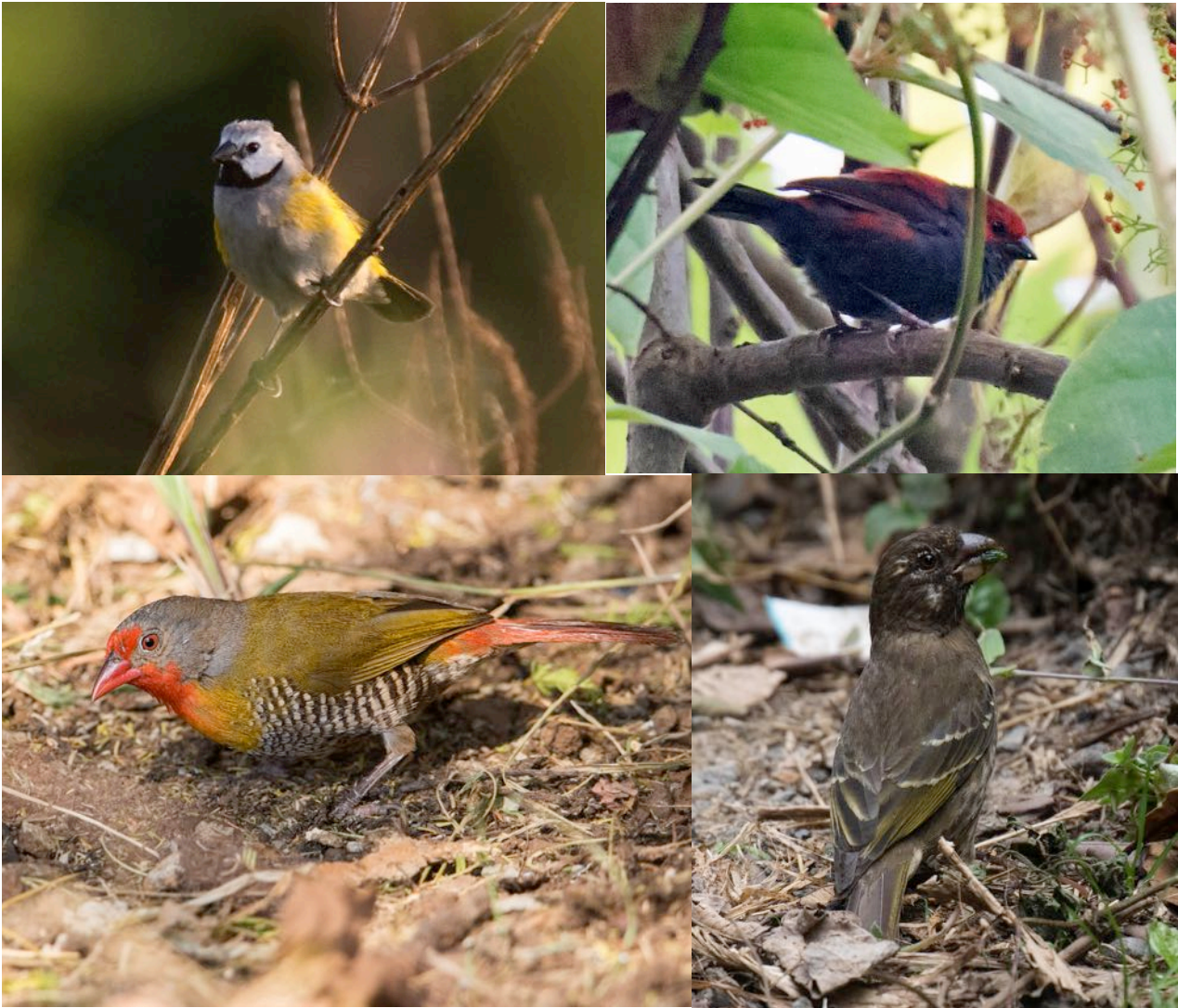
Grey-headed Oliveback, Dusky Crimsonwing, Thick-billed Seed-eater and Green-winged Pytilia.

Chestnut-crowned Sparrow-weaver Plocepasser superciliosus Small numbers in Murchison Falls NP. House Sparrow Passer domesticus Only seen 4 times during the tour. Shelley's Sparrow Passer shelleyi Seen at Murchison Falls. Northern Grey-headed Sparrow Passer griseus Widespread. Speckle-fronted Weaver Sporopipes frontalis Seen in Murchison Falls. Thick-billed Weaver (Grosbeak W) Amblyospiza albifrons Widespread. Baglafecht Weaver Ploceus baglafecht Fairly common. Slender-billed Weaver Ploceus pelzelni Recorded a few times, common in Queen Elizabeth. Little Weaver Ploceus luteolus Seen at Murchison Falls. Spectacled Weaver Ploceus ocularis Scattered sightings. Black-necked Weaver Ploceus nigricollis Small numbers recorded at various locations. Strange Weaver ♦ Ploceus alienus Good views in Nyungwe and Bwindi. Black-billed Weaver Ploceus melanogaster Seen at Bwindi. Holub's Golden Weaver Ploceus xanthops Scattered sightings. Orange Weaver Ploceus aurantius 2 near Mabamba. Northern Brown-throated Weaver Ploceus castanops Seen at several locations. Lesser Masked Weaver Ploceus intermedius 2 in Queen Elizabeth NP. Vitelline Masked Weaver Ploceus vitellinus Seen at Murchison Falls NP. Village Weaver Ploceus cucullatus Common and widespread. Vieillot's Black Weaver Ploceus nigerrimus Widespread.