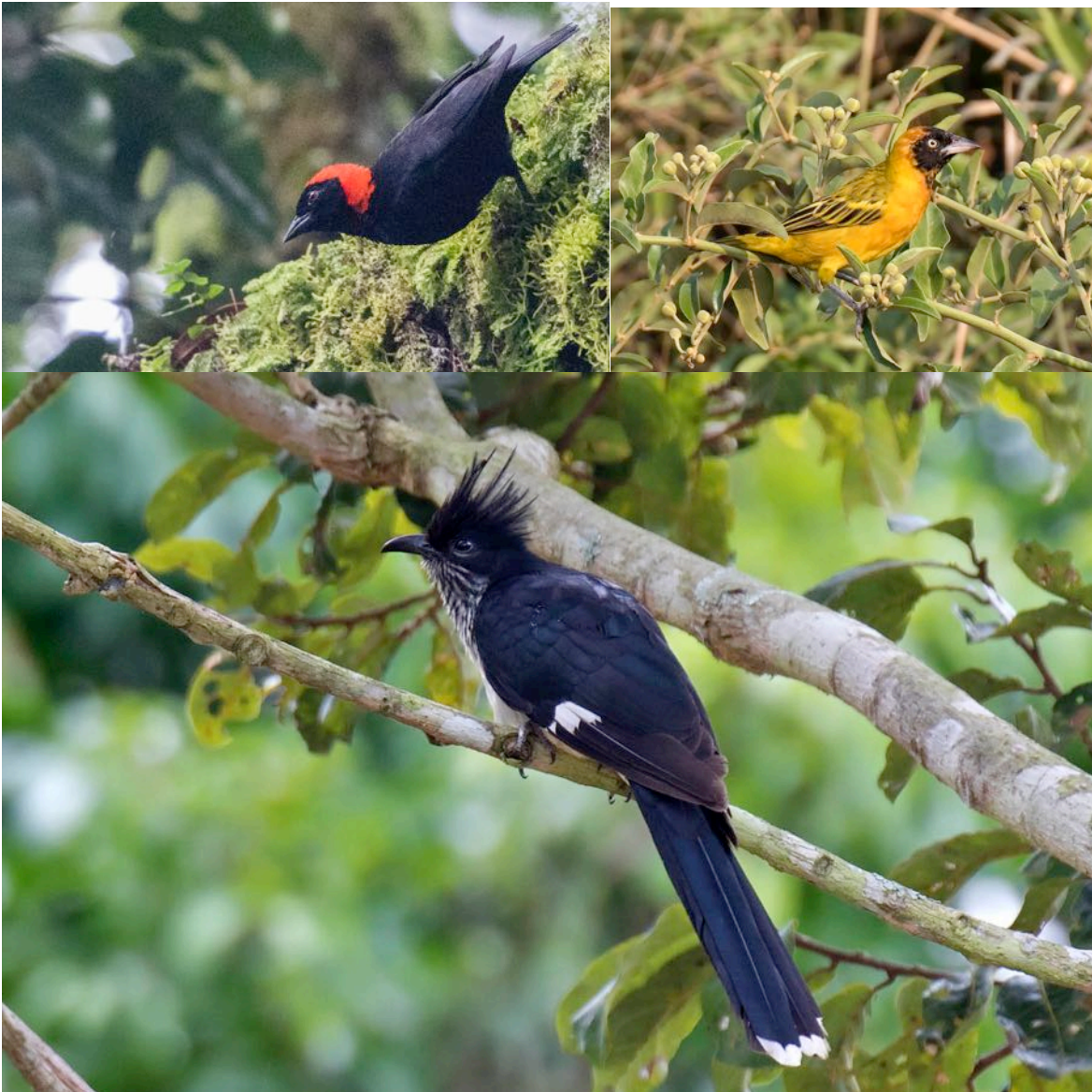
Red-headed Malimbe, Lesser Masked Weaver and Levaillant's Cuckoo.

Weyns's Weaver ♦ Ploceus weynsi Hundreds in a colony at Mabamba Swamp. Black-headed Weaver (Yellow-backed Weaver) Ploceus melanocephalus Widespread. Yellow-mantled Weaver Ploceus tricolor Seen in Mabira and Kibale. Compact Weaver Ploceus superciliosus First seen near Masindi. Brown-capped Weaver Ploceus insignis Several seen in Nyungwe and Bwindi. Red-headed Malimbe Malimbus rubricollis Seen in the forest a few times. Red-headed Weaver Anaplectes rubriceps Seent twice. Cardinal Quelea Quelea cardinalis One male near Masindi. Red-headed Quelea Quelea erythrops A large flock near Masindi. Red-billed Quelea Quelea quelea Large numbers at Murchison Falls and Queen Elizabeth NP. Black Bishop Euplectes gierowii Three scattered sightings. Black-winged Red Bishop Euplectes hordeaceus Seen at Murchison Falls. Southern Red Bishop Euplectes orix Seen in Queen Elizabeth NP. Northern Red Bishop Euplectes franciscanus Seen in Murchison Falls. Fan-tailed Widowbird Euplectes axillaris Seen a few times. Yellow-mantled Widowbird Euplectes (macroura) macroura Several seen at Murchison Falls. Yellow-shouldered Widowbird Euplectes (macroura) macrocercus Seen in Luwero. Marsh Widowbird (Hartlaub's M W) Euplectes hartlaubi Five seen near Luwero. Red-collared Widowbird (Red-naped W) Euplectes ardens Small numbers near Masindi.