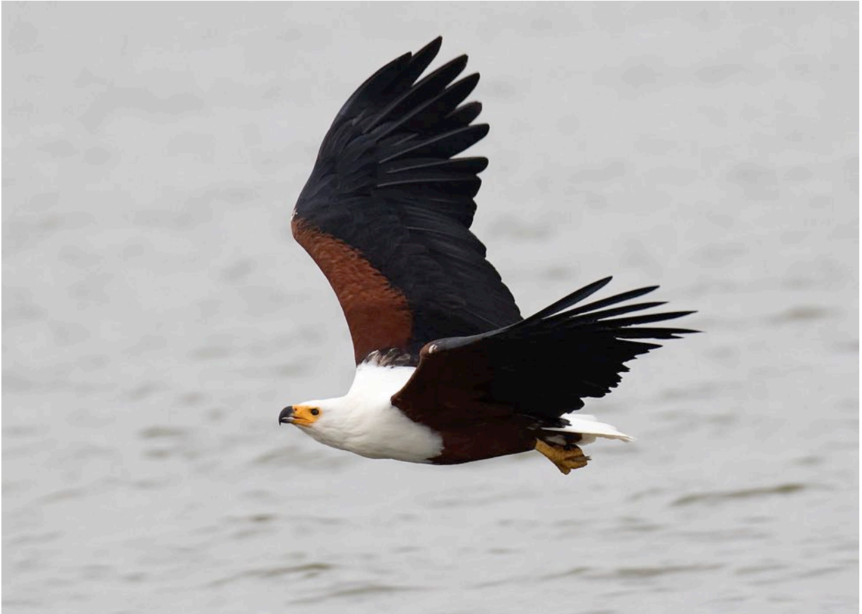
African Fish Eagle and Yellow-lored Bristlebill.