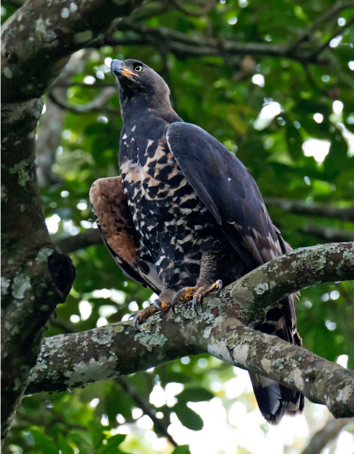
An impressive Crowned Eagle.

while a Cassin's Flycatcher gave excellent views sitting on a rock by the river. Other notable species seen included Afep Pigeon, some Narrow-tailed Starlings, Cassin's Hawk Eagle, African Emerald and Klass's Cuckoos, a small group of noisy White-headed Wood Hoopoes, Brown-eared Woodpecker, Grey Parrot, African Shrike Flycatcher, Petit's Cuckooshrike, Velvet-mantled Drongo, African Blue Flycatcher, Buff-throated Apalis, Sooty Flycatcher, Green-throated Sunbird and Mountain Wagtail. A truly unforgettable day!