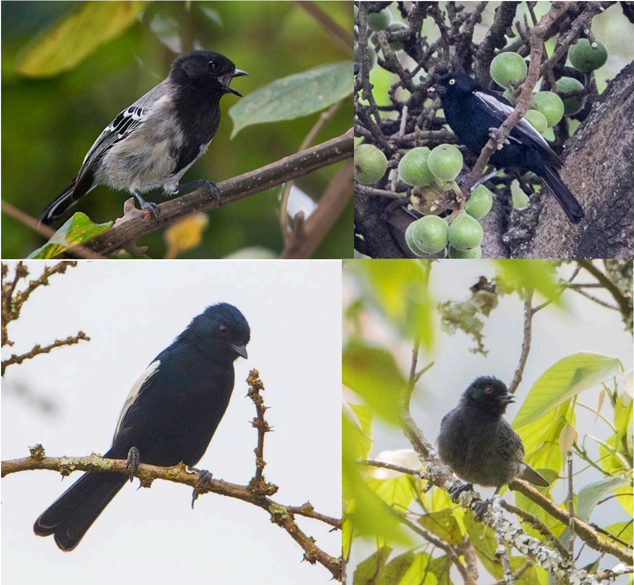
Stripe-breasted, White-shouldered Black, Dusky and White-winged Black Tits.

Velvet-mantled Drongo Dicrurus modestus Seen in Kibale. Fork-tailed Drongo (Common D) Dicrurus adsimilis Common and widespread. Red-bellied Paradise Flycatcher Terpsiphone rufiventer Seen well several times, first in Mabira. African Paradise Flycatcher Terpsiphone viridis Scattered sightings. Piapiac Ptilostomus afer Fairly common in the north. Pied Crow Corvus albus Common and widespread. White-necked Raven (White-naped R) Corvus albicollis A few seen in the highlands. African Blue Flycatcher Elminia longicauda Small numbers seen during the tour. White-tailed Blue Flycatcher Elminia albicauda Seen at Nyungwe and Bwindi.