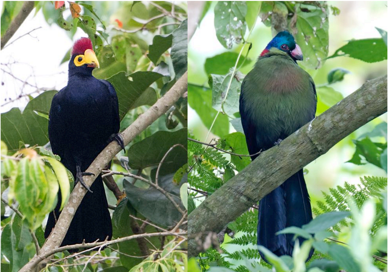
Ross's and Ruwenzori Turacos are two stunning birds.

Western Bronze-naped Pigeon Columba iriditorques (H) Heard in Bwindi. Dusky Turtle Dove Streptopelia lugens 1 seen in Bwindi. Mourning Collared Dove Streptopelia decipiens Small numbers noted at various locations. Red-eyed Dove Streptopelia semitorquata Fairly common and widespread. Ring-necked Dove Streptopelia capicola Fairly common at Queen Elizabeth NP. Vinaceous Dove Streptopelia vinacea Small numbers seen during the first half of the tour. Laughing Dove Spilopelia senegalensis Most commonly recorded at Queen Elizabeth NP. Emerald-spotted Wood Dove Turtur chalcospilos Several birds seen at Mburo. Black-billed Wood Dove Turtur abyssinicus Seen at Murchison Falls. Blue-spotted Wood Dove Turtur afer Small numbers recorded at various locations.