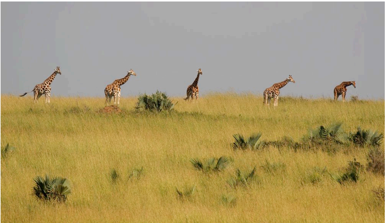
Classic Murchison Falls NP scenery.

Reluctantly we departed the park the next day, adding a couple of good birds on the way, including a pair of overdue Heuglin's Francolins, and made our way through cultivation and open scrub. Here, we found our target White-rumped Seedeater, as well as Brown Snake Eagle, Olive Bee-eater, Cardinal and African Grey Woodpeckers, Western Black-headed Batis, Green-backed Eremomela, Grey-headed Bushshrike –heard only-, and Black-faced Waxbill. We had lunch on the Butiaba Escarpment, where we found Namaqua Dove, a pair of Horus Swift prospecting an abandoned bee-eater colony, a flock of Cut-throat Finches –a species without records in the country until 2016- and a brief Cinnamon-breasted Rock Bunting. We made a short stop in the afternoon in the forest at Busingiro, where we did very well in spite of the hour. The highlight was undoubtedly the diminutive Ituri Batis, a very localized species in Uganda that elsewhere only occurs in Congo, that showed so very well, almost eye level, while supporting cast included Mottled and Cassin's Spinetails, Yellow-billed Barbet, Yellow-whiskered Greenbul and White-breasted Nigrita. By dusk we arrived at the little town of Masindi, which was to be our base for the next two nights.