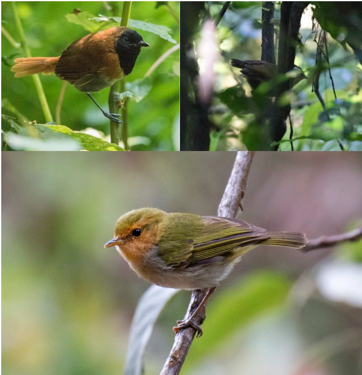
Black-faced Rufous Warbler, a rare record shot of the very elusive Neumann's Warbler, and Red-faced Woodland Warbler.

Red-faced Woodland Warbler ♦ Phylloscopus laetus Several seen in Nyungwe and Bwindi.