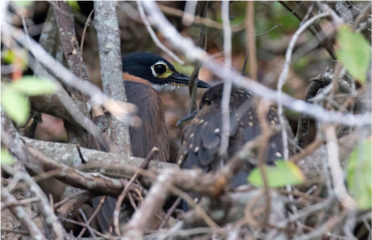
Adult White-backed Night Heron with a chick ta Mburo.

Shoebill Balaeniceps rex 2 Seen at Mabamba and 2 Murchison Falls NP. What a bird!