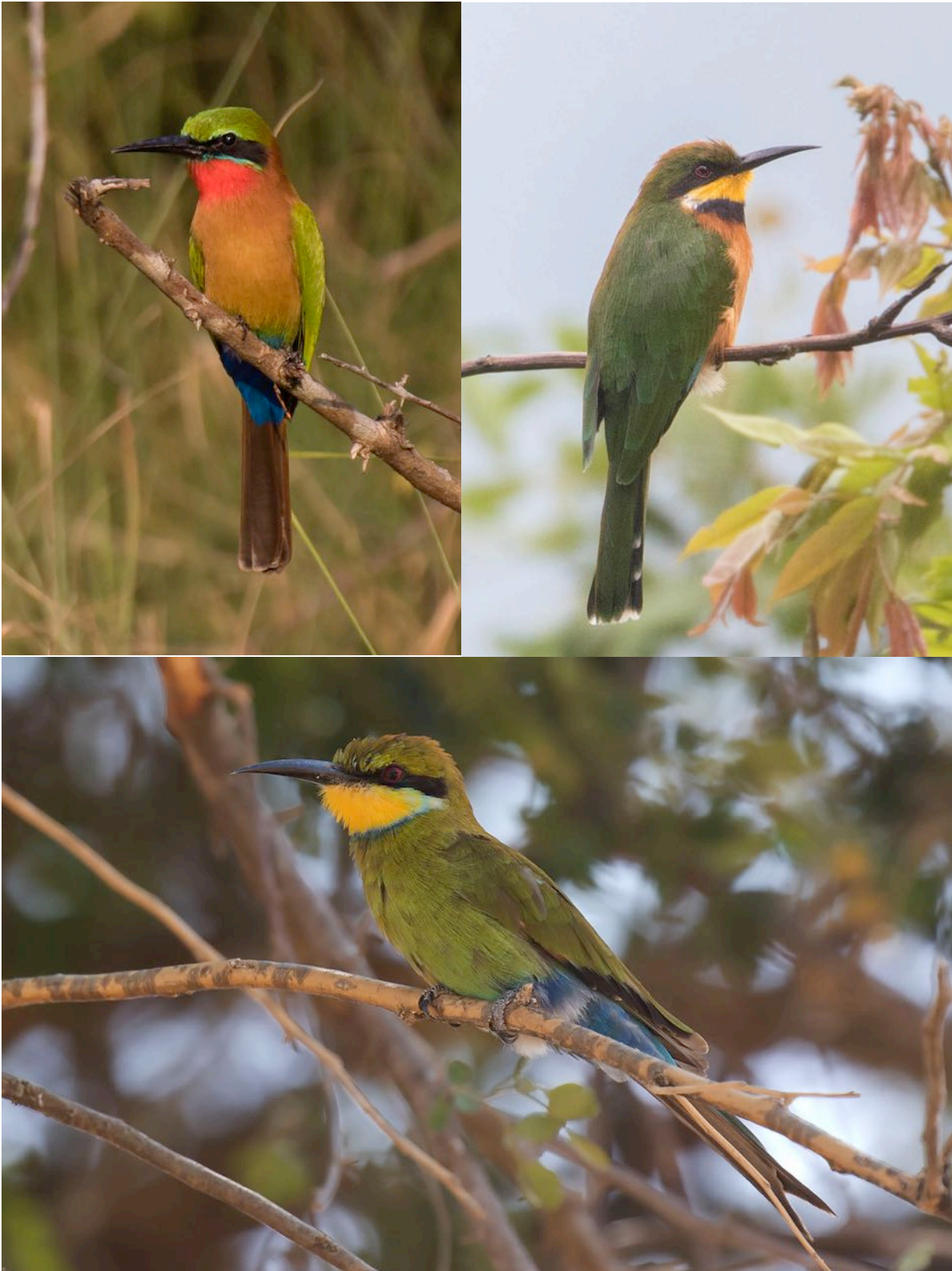
Red-throated, Cinnamon-chested and Swallow-tailed Bee-eaters.

Central African Hoopoe Upupa (epops) senegalensis Seen briefly at Queen Elizabeth NP.