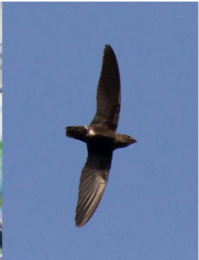
Bar-tailed Trogon and Mottled Spinetail.

Lilac-breasted Roller Coracias caudatus Seen at Mburo. Blue-throated Roller Eurystomus gularis Seen well in Kibale. Broad-billed Roller Eurystomus glaucurus Common. Chocolate-backed Kingfisher Halcyon badia Great views at the Royal Mile. Grey-headed Kingfisher Halcyon leucocephala Fairly common and widespread. Striped Kingfisher Halcyon chelicuti Fairly common and widespread. Blue-breasted Kingfisher Halcyon malimbica Seen in Mabira. Woodland Kingfisher Halcyon senegalensis Common. African Dwarf Kingfisher Ispidina lecontei Seen well in Budongo Forest. African Pygmy Kingfisher Ispidina picta Recorded at various localities.