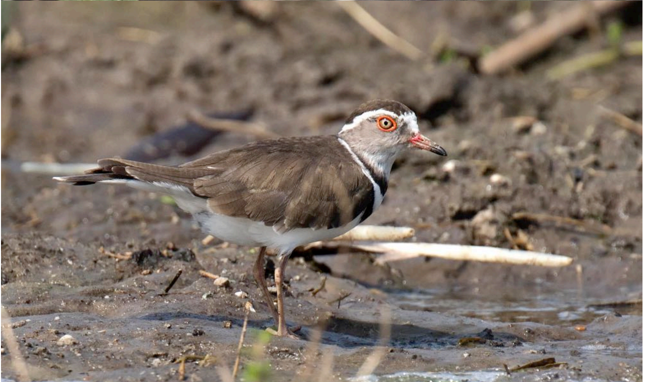
Female White-spotted Flufftail and Three-banded Plover.