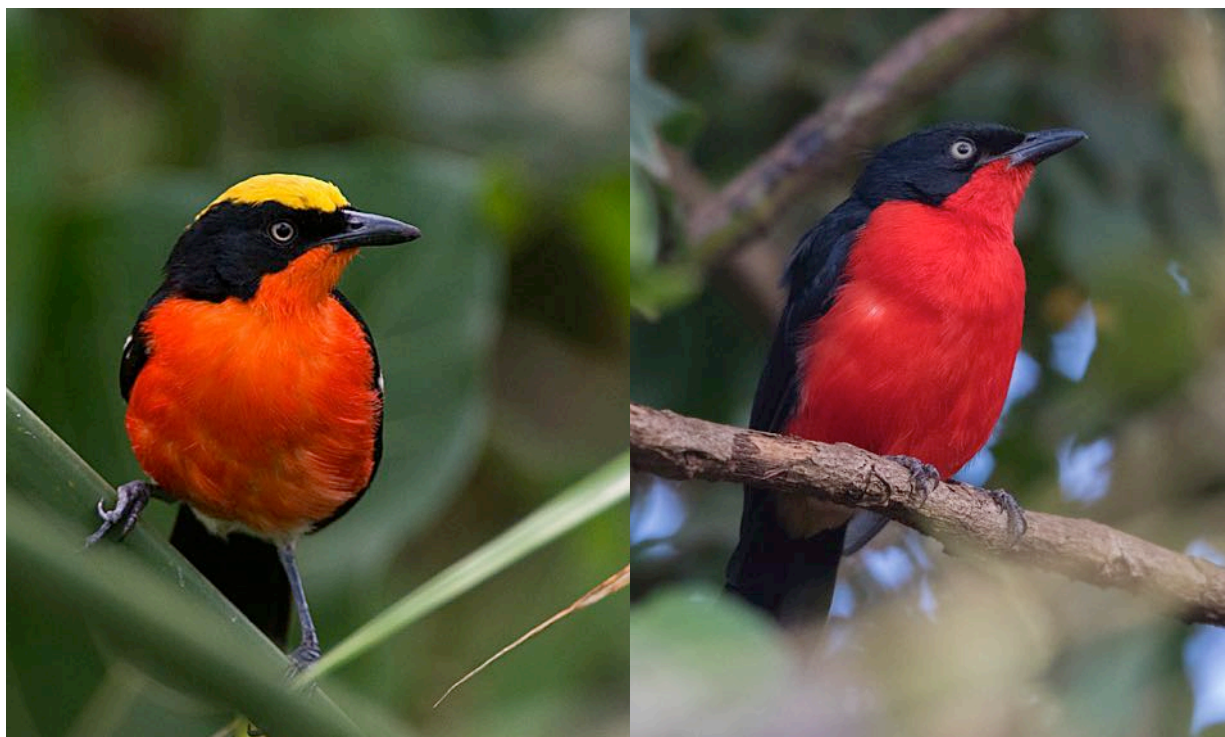
Papyrus and Black-headed Gonoleks.

Grey-headed Bushshrike Malaconotus blanchoti (H) Heard at Murchison Falls. Many-colored Bushshrike Chlorophoneus multicolor Seen well at Nyungwe and Buhoma. Lagden's Bushshrike ♦ Malaconotus lagdeni Seen very well in Nyungwe and briefly in Bwindi. Bocage's Bushshrike Chlorophoneus bocagei First seen in Bigodi swamp.. Orange-breasted Bushshrike Chlorophoneus sulfureopectus Seen briefly in Murchison. Doherty's Bushshrike ♦ Telophorus dohertyi Seen well in Nyungwe and Bwindi. Marsh Tchagra Bocagia minuta Scattered sightings. Brown-crowned Tchagra Tchagra australis A couple of sightings. Black-crowned Tchagra Tchagra senegalus Widespread. Pink-footed Puffback Dryoscopus angolensis Seen in Bwindi. Northern Puffback Dryoscopus gambensis Fairly common and widespread. Lowland Sooty Boubou ♦ (S B) Laniarius leucorhynchus 1 seen in Mabira Forest. Mountain Sooty Boubou Laniarius poensis Seen well in Nyungwe and Bwindi.