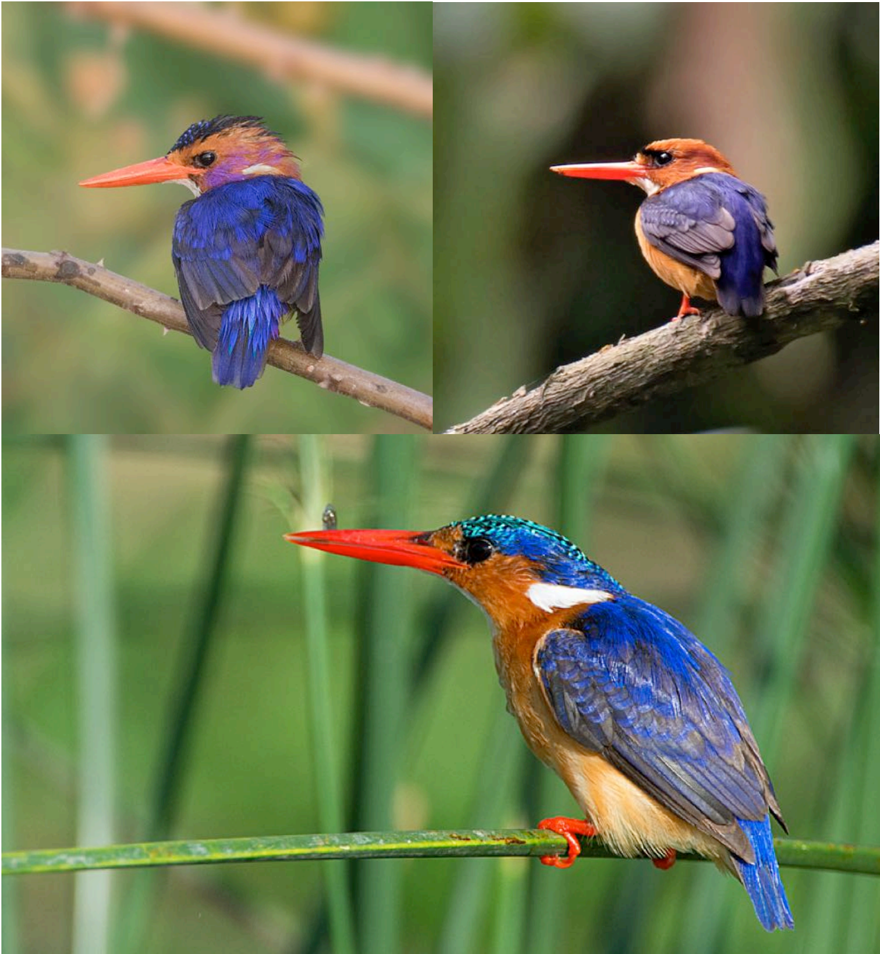
Some African jewels: African Pygmy, African Dwarf and Malachite Kingfishers.

White-throated Bee-eater Merops albicollis Seen near Mabamba and Mabira.