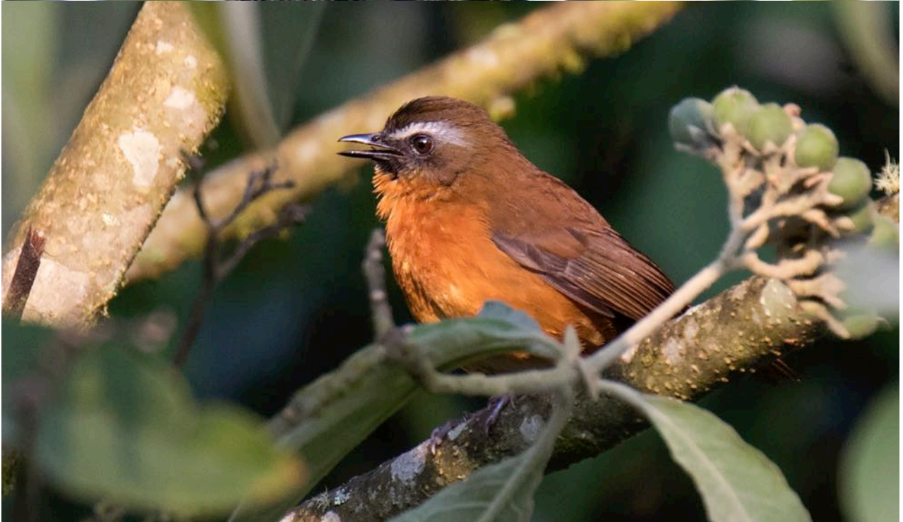
Red-collared (Mountain) Babbler and Archer's Ground Robin from Nyungwe.

On our last day, as we left the park, we made a short stop in a marshy area to look for Grauer's Swamp Warbler, which proved easy to find. On the way back to Kigali we stopped in a papyrus swamp by the road,