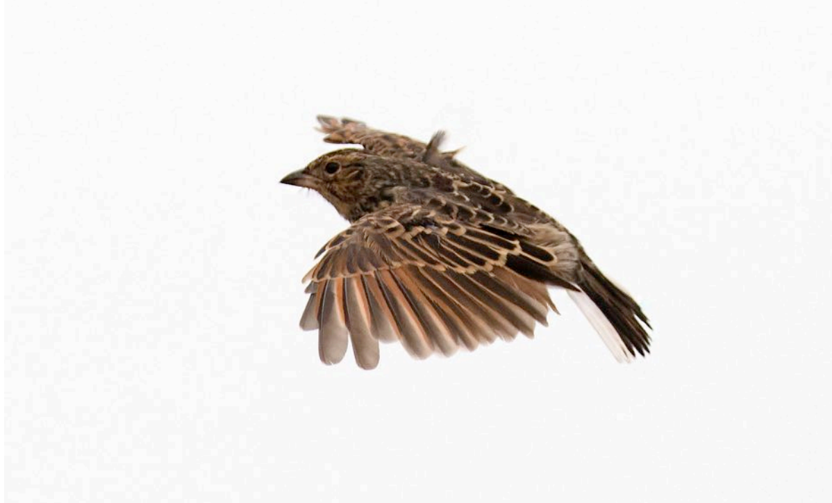
Flappet Lark and the rare White-tailed Lark, both seen in Queen Elizabeth NP. Notice bill shape, outer tail and back feather differences.

Olive-breasted Greenbul (O-b Mountain G) Arizelocichla kikuyuensis Fairly common at Nyungwe and Bwindi.