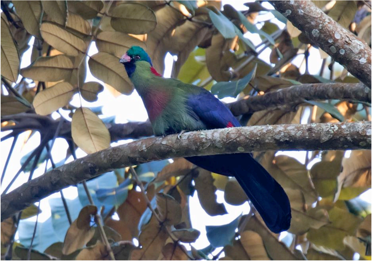
Ruwenzori Ruraco and African Skimmer –Yellow-billed Stork in the background-.