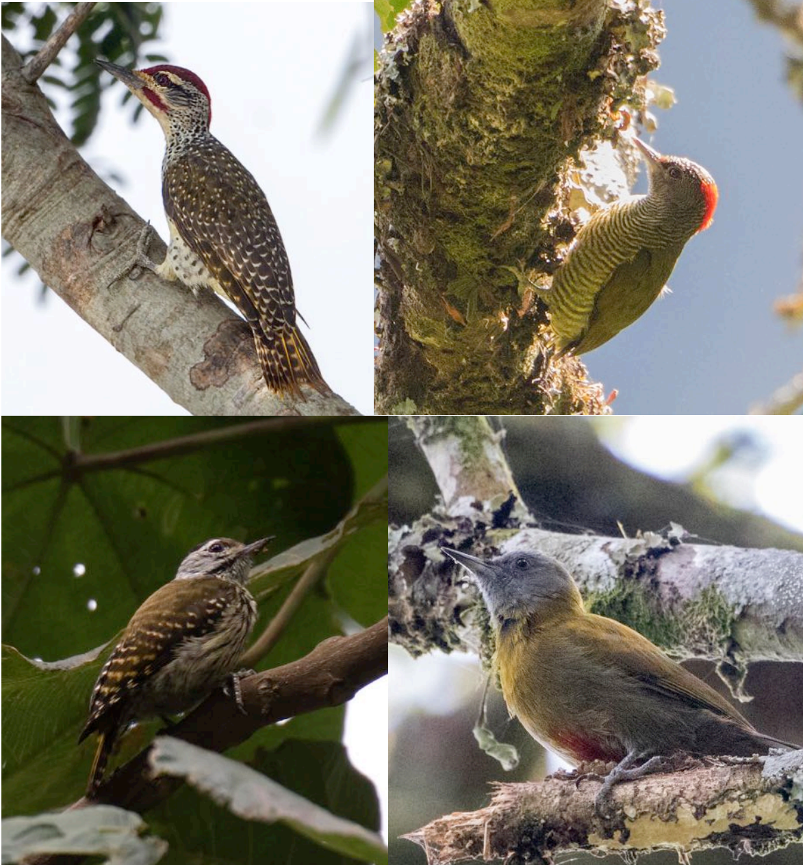
Nubian, Tullberg's, Olive and Cardinal –ssp lepidus- Woodpeckers.

Crested Barbet Trachyphonus vaillantii Seen in Mburo. A recent coloniser. Double-toothed Barbet Lybius bidentatus A few birds recorded. Yellow-billed Barbet Trachyphonus purpuratus Several birds showed well in the forest. Cassin's Honeybird Prodotiscus insignis A single bird seen in Kibale. Dwarf Honeyguide ♦ Indicator pumilio One seen very well in Nyungwe. Willcocks's Honeyguide ♦ Indicator willcocksii Seen at Bwindi. Thick-billed Honeyguide Indicator conirostris Seen well at Budongo. Least Honeyguide ♦ Indicator exilis One bird, seemingly this species, photographed at the Neck, Bwindi. Lesser Honeyguide Indicator minor Seen at Mabira. Greater Honeyguide Indicator indicator One bird seen near Masindi. Nubian Woodpecker Campethera nubica Several sightings during the trip. Tullberg's (Fine-banded) Woodpecker ♦ Campethera tullbergi Seen at Nyungwe and Bwindi.