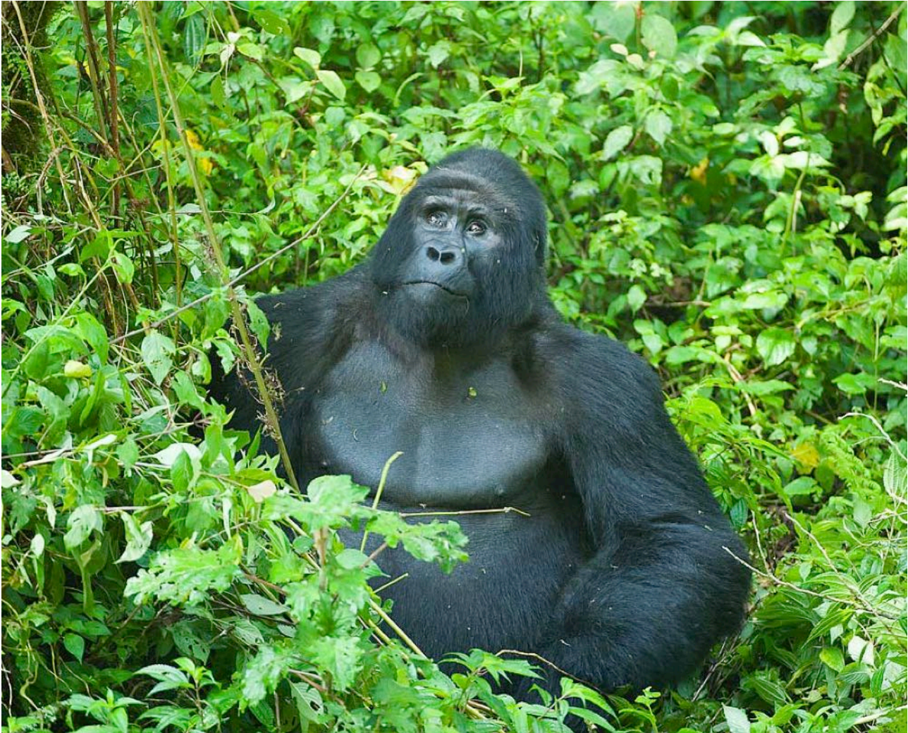
"Silverback" Eastern Gorilla.

While most of the group were watching the gorillas, some of us went back to the Buhoma track. The birding was similar to the previous day, although we saw a couple of different things. Probably the best bird seen was the enigmatic and little known Jameson's Antpecker, which was watched at length as it fed amongst some dead leaves in the midstorey. We also found a rather cooperative Neumann's Warbler, while both Many-colored Bushshrike and Grey-winged Robin Chat were new additions to our list.