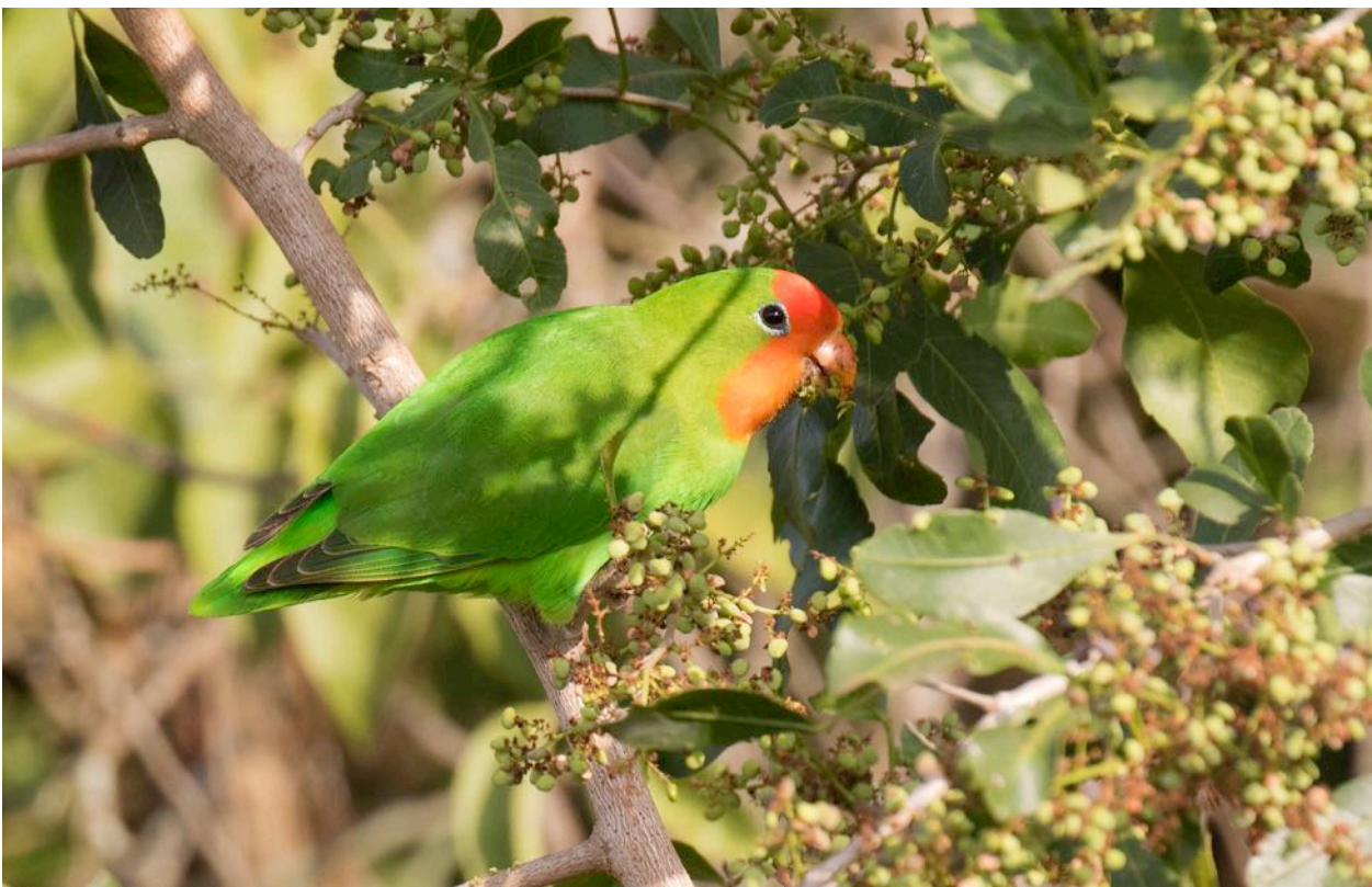
Red-headed Lovebird in Mburo.

Kivu Ground Thrush ♦ ( Abyssinian G T ) Geokichla [piaggiae] tanganjicae Brilliant views of one in Nyungwe. African Thrush Turdus pelios Widespread. Abyssinian Thrush (Mountain T) Turdus abyssinicus Seen in Nyungwe. Fire-crested Alethe Alethe castanea Seen very well in Budongo. Brown-backed Scrub Robin Cercotrichas hartlaubi Several sightings throughout the tour. White-browed Scrub Robin Cercotrichas leucophrys A few sightings. Fraser's Forest Flycatcher Fraseria ocreata One sighting in the Royal Mile. Grey-throated Tit-Flycatcher (G-t F) Myioparus griseigularis Seen in Kibale. Grey Tit-Flycatcher (Lead-coloured F) Myioparus plumbeus 1 seen in Murchison. White-eyed Slaty Flycatcher Melaenornis fischeri Fairly common in Nyungwe and Bwindi. Yellow-eyed Black Flycatcher ♦ Melaenornis ardesiacus Seen well in Nyungwe and Bwindi. Northern Black Flycatcher Melaenornis edolioides Scattered sightings. Southern Black Flycatcher Melaenornis pammelaina Seen at Mburo. Pale Flycatcher Melaenornis pallidus Seen at Murchison Falls. Silverbird ♦ Empidonax semipartitus Several seen at Murchison Falls.