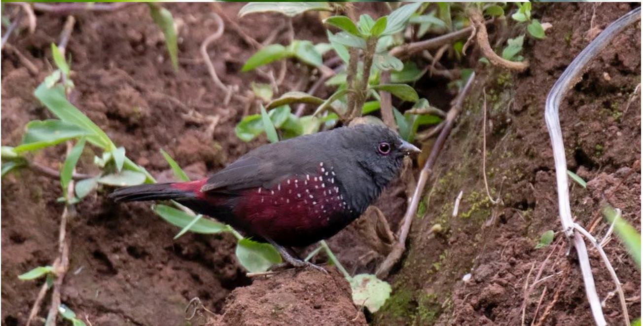
2 rare birds from Bwindi, Jameson's Antpecker and Dusky Twinspot.

The main reason for coming to Ruhija was to trek up and down a number of times to the Mubwindi Swamp where some exciting species occur. After an early start, and a few stops during the descent, seeing Yellow-streaked and Olive-breasted Greenbuls, Grey Cuckooshrike, Yellow-eyed Black Flycatcher and Strange Weaver, we made it to the bottom. The area around the swamp is prime habitat for the rarely seen Grauer's (or African Green) Broadbill, the ultimate of all Albertine Rift endemics, which we always hope to see, but