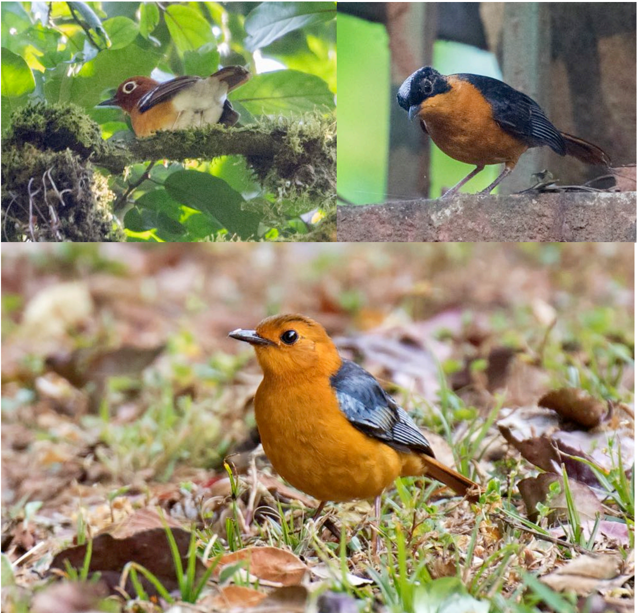
Kivu (Abyssinian) Ground Thrush from Nyungwe and Snowy-crowned and Red-capped Robin Chats.

Buff-bellied Warbler Phyllolais pulchella Seen a few times in dry country. Yellow-breasted Apalis Apalis flavida Seen near Masindi and Mburo. Lowland Masked Apalis ♦ Apalis binotata Seen in Kibale. Mountain Masked Apalis (Black-faced A) ♦ Apalis personata Seen well in Nyungwe and Ruhija. Black-throated Apalis Apalis jacksoni A few sightings. Black-capped Apalis Apalis nigriceps (H) Heard at Budongo. Chestnut-throated Apalis Apalis porphyrolaema Recorded in Nyungwe and Bwindi. Buff-throated Apalis Apalis rufogularis Seen several times in the forest. Kungwe Apalis ♦ Apalis argentea Seen well in Nyungwe. Grey Apalis Apalis cinerea Seen in Nyungwe and Bwindi. Grey-capped Warbler Eminia lepida Widespread. Grey-backed Camaroptera Camaroptera brevicaudata Common and widespread. Olive-green Camaroptera Camaroptera chloronota Seen at Masindi and Budongo. Black-faced Rufous Warbler Bathmocercus rufus Seen in Nyungwe and Bwindi.