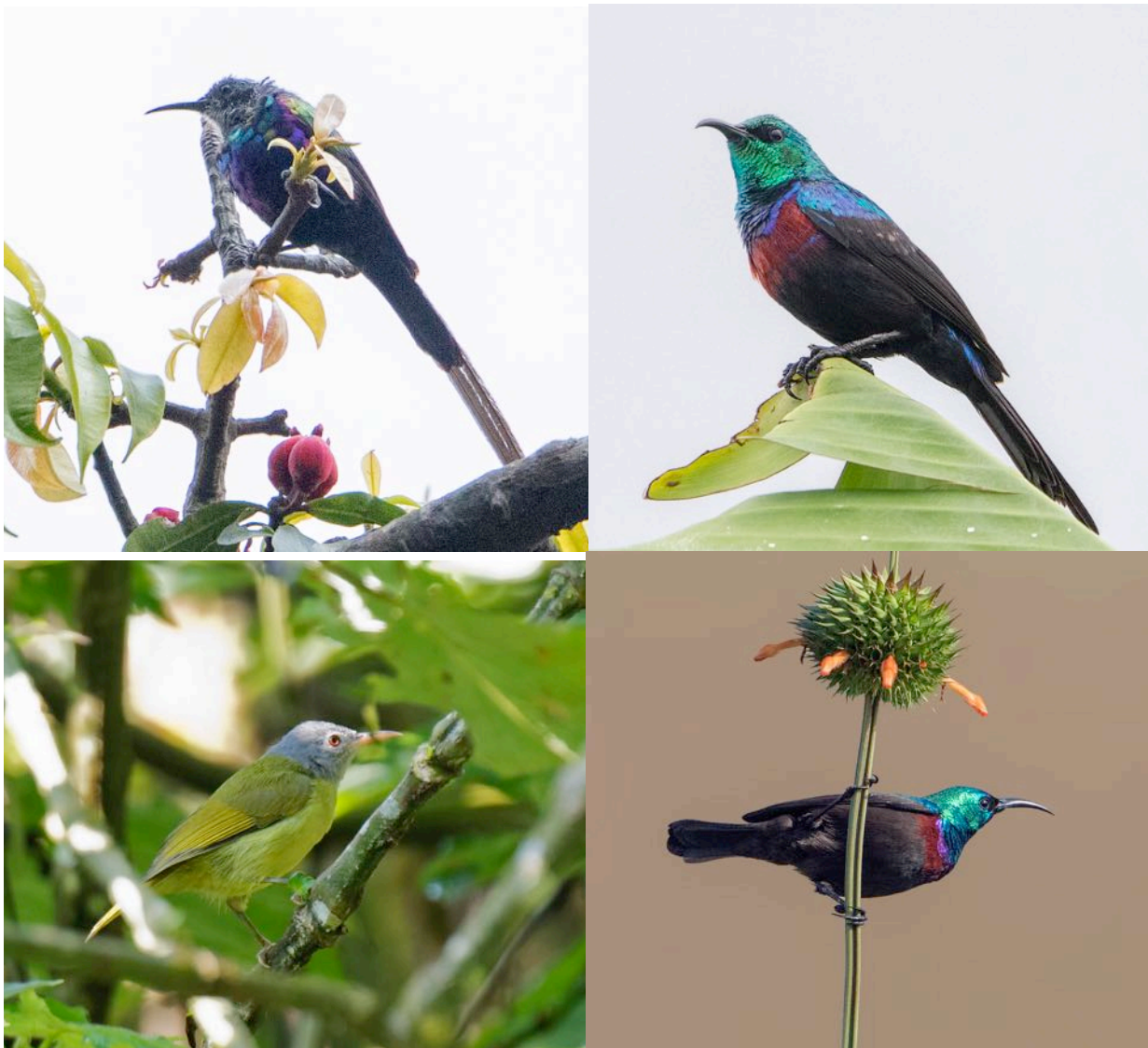
Some of the many sunbirds seen during the tour: Purple-breasted, Red-chested, Orange-tufted and Grey-headed.

Red-capped Robin-Chat Cossypha natalensis Seen well in Nyungwe and Bwindi. Snowy-crowned Robin-Chat Cossypha niveicapilla Several sightings. White-starred Robin Pogonocichla stellate Seen in Nyungwe and Bwindi. Eastern Forest Robin Stiphrornis (erythrothorax) xantogaster Seen well in Budongo. Equatorial Akalat ♦ Sheppardia aequatorialis Seen well in Nyungwe and Bwindi. Spotted Palm Thrush Cichladusa guttata Seen at Murchison Falls. African Stonechat Saxicola torquatus Seen a few times. Sooty Chat Myrmecocichla nigra Scattered sightings. Ruaha Chat ♦ Pentholaea collaris Seen in Rwanda. Grey-headed Sunbird ♦ Deleornis axillaris Seen well in Mabira. Little Green Sunbird Anthreptes seimundi First seen in Mabira. Grey-chinned Sunbird Anthreptes rectirostris Several sightings, first in Mabira. Collared Sunbird Hedydipna collaris Widespread. Green-headed Sunbird Cyanomitra verticalis 2 sightings. Blue-throated Brown Sunbird Cyanomitra cyanoaema Seen a few times.