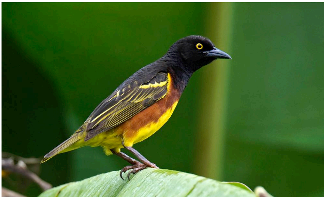
Weyns's Weaver from Mabamba.

The next day we visited the remnants of Mabira Forest, and during our productive time here we managed to find some special birds. A pair of White-spotted Flufftails showed exceptionally well, as did 2 Forest Wood Hoopoes, our main target in the forest. A calling Lowland Sooty Boubou gave brief views, while another key species here, Yellow-lored Bristlebill, sat in the open for ages. A singing Blue-shouldered Robin Chat was, as usual, difficult to spot in its thick home, but after some persistence all of us saw the bird, and Sander even managed to get a good photo! We had our first views of Tambourine Dove, a Grey Longbill was found, and