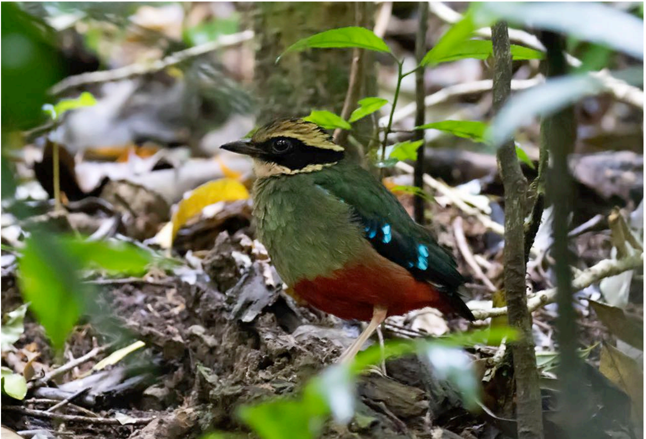
This wonderful and rarely seen Green-breasted Pitta was one of the highlights of the tour.

For any world-travelling birder, a visit to Uganda should definitely be on the agenda. Why? The fabulous Shoebill is probably a good-enough reason to visit this magical, friendly and welcoming country, but there are many more, including a good selection of Albertine Rift endemics, with such megas as Grauer's Broadbill or Green-breasted Pitta, as well as other difficult western African forest species. Together with some great mammal watching, with of course primates as the icing of the cake, in particular the mighty Eastern Gorillas and Chimpanzees. Combined with excellent accommodation and food, impressive scenery and a good road network, it's easy to understand why this African country is undoubtedly one of my favourites in the whole world! Rwanda has a lot to offer too, Nyungwe forest is a wonderful and very birdy place, and in the bird front, the unique Red-collared Mountain Babbler stands out. By visiting the 2 countries, any visiting birder greatly increases the chances of seeing a very good selection of Albertine Rift endemics.