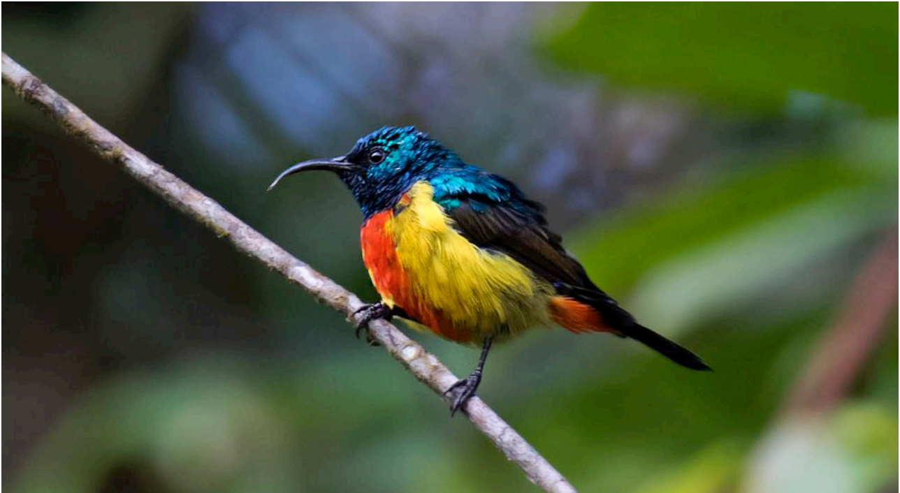
Regal Sunbird from Nyungwe. What a beautiful sunbird!

coming to Nyungwe is a must. Possibly the best bird seen during the afternoon was a very cooperative Willard's Sooty Boubou, an Albertine Rift endemic, described not long ago, that showed very well. Other key birds such as the tiny White-browed Crombec, Ruwenzori Apalis, Mountain Masked Apalis, Red-faced Woodland Warbler, Yellow-eyed Black Flycatcher, Blue-headed Sunbird and the cracking Regal Sunbird were all easily seen too. Supporting cast included Great Blue Turaco, Blue Malkoha, a showy Barred Long-tailed Cuckoo, some Scarce Swifts, colourful Cinnamon-chested Bee-eaters, a pair of Many-colored Bushshrikes and Olive-breasted Greenbul.