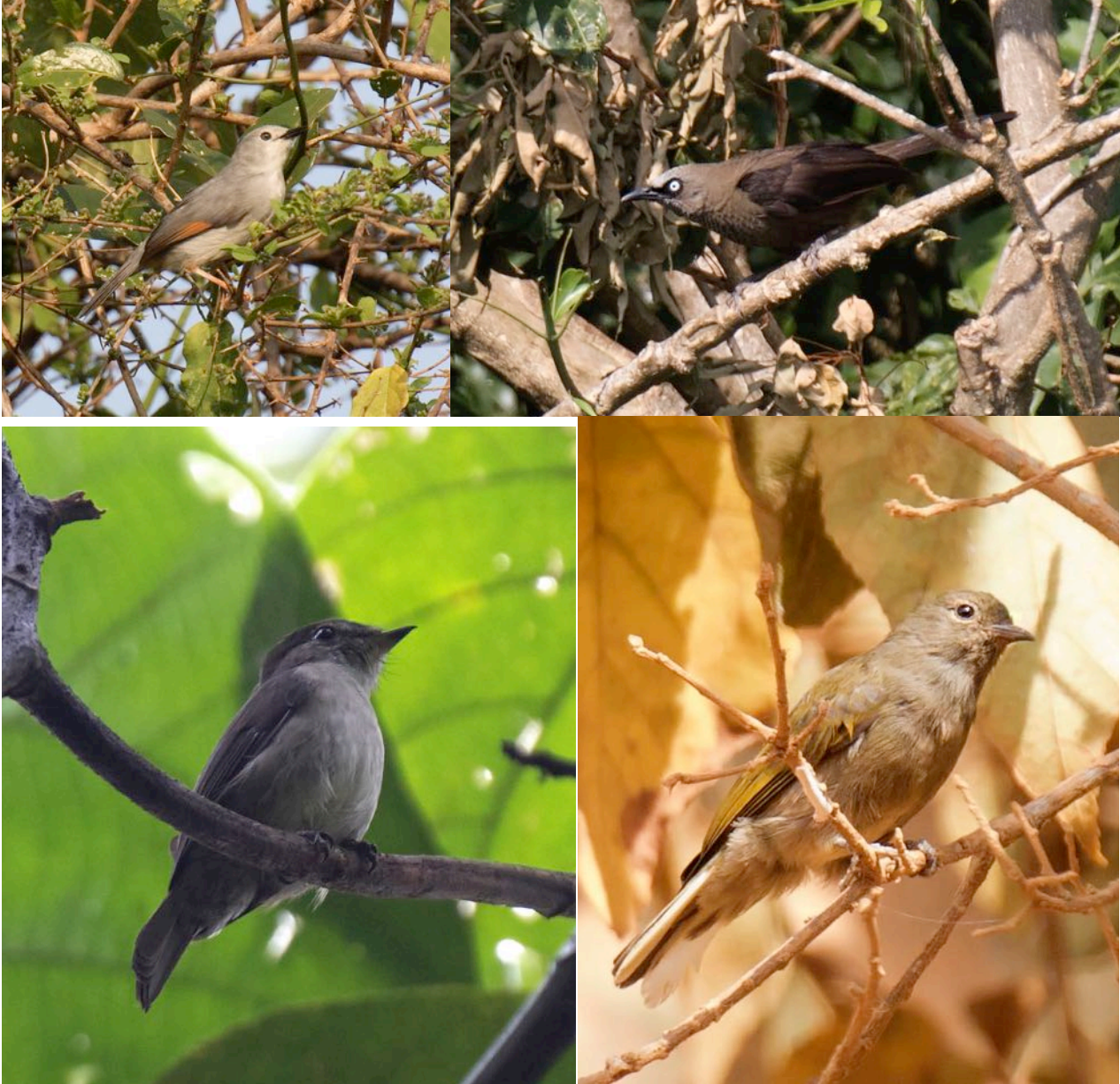
Some uncommon birds: Red-winged Grey Warbler, Dusky Babbler, Cassin's Honeybird and Chapin's Flycatcher.

Chubb's Cisticola ♦ Cisticola chubby Seen in Nyungwe and Bwindi. Rattling Cisticola Cisticola chiniana Several seen in open country. Winding Cisticola Cisticola marginatus Common at various wetlands. Carruthers's Cisticola ♦ Cisticola carruthersi Seen at a few locations. Stout Cisticola Cisticola robustus Seen at Queen Elizabeth NP. Croaking Cisticola Cisticola natalensis First seen near Masindi. Short-winged Cisticola (Siffling C) Cisticola brachypterus A couple of sightings. Foxy Cisticola ♦ Cisticola troglodytes Seen well in Murchison Falls. Long-tailed Cisticola ♦ (Tabora C) Cisticola angusticauda 3 seen in Lake Mburo NP.