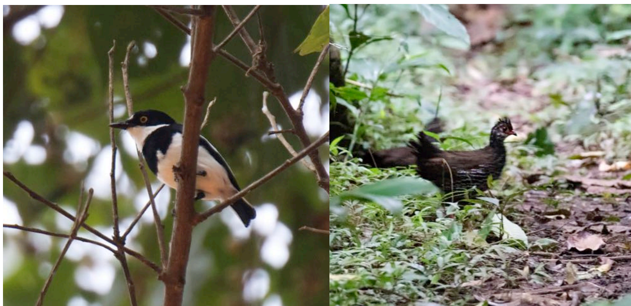
The two main target birds in the Royal Mile: Ituri Batis and Nahan's Partridge.

Next morning we headed towards Kaniyo Pabidi, part of the sprawling Budongo Forest. We did some roadside birding on the way, seeing Marsh Tchagra, Brown-backed Scrub Robin, Compact Weaver, Red-collared Widowbird and Brown Twinspot amongst other things. We then spent most of the morning exploring the network of trails that lead into the superb rainforest with its magnificent mahogany and ironwood trees. The birding was very slow going this morning, but with some persistence we got to see some of its shy