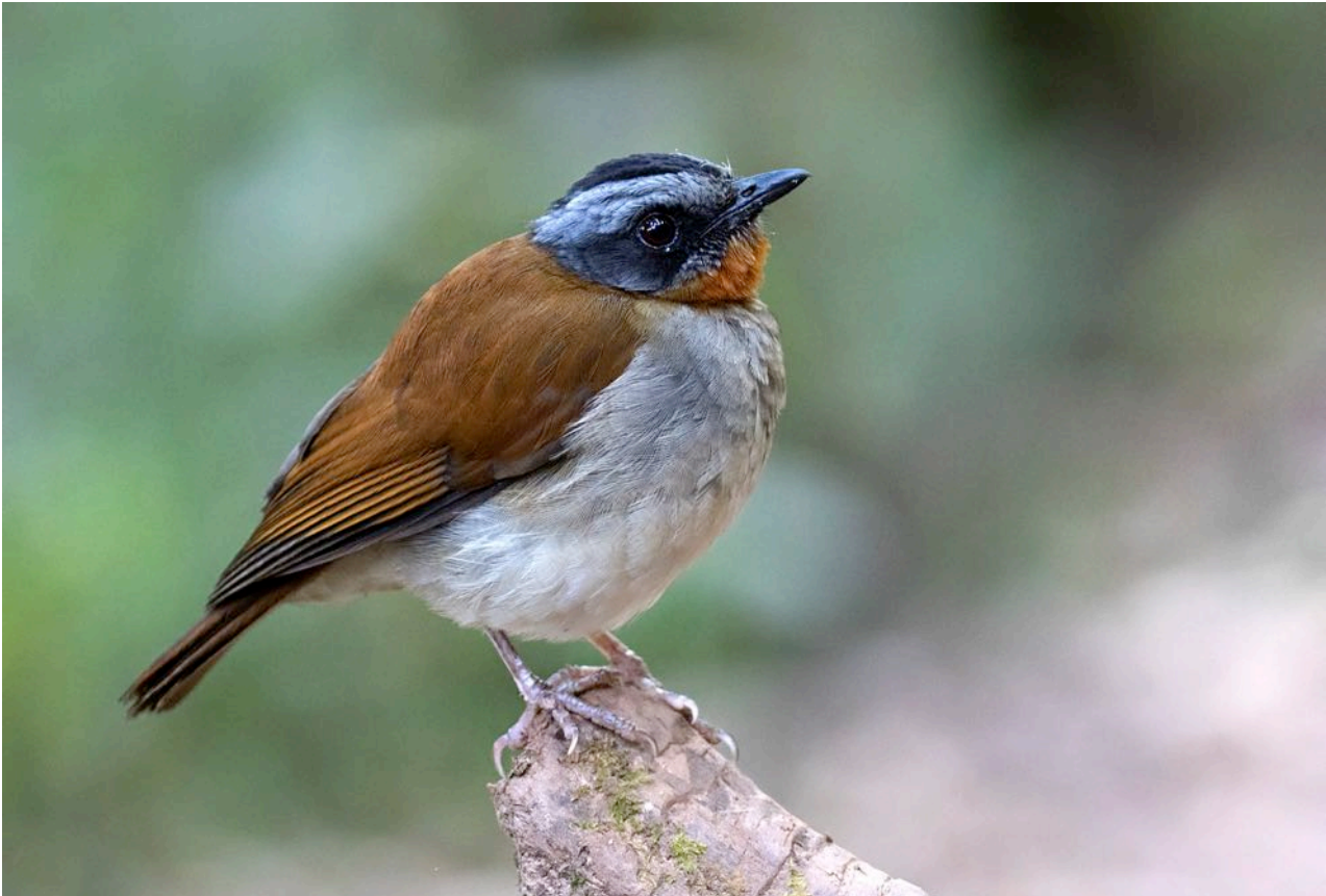
A confiding Red-throated Alethe.

put on a great show, and the striking Lühder's Bushshrike obliged too. We spent considerable time chasing a singing Neumann's (Short-tailed) Warbler, but we only managed fleeting views. On the other hand, Black-faced Rufous Warbler was far easier to see, whilst in the tangles we also found the diminutive White-browed Crombec and the cute Re-faced Woodland Warbler. Other species recorded during the day included a heard only Western Bronze-naped Pigeon, Scarce Swift, Bar-trailed Trogon, Black Bee-eater, Cinnamon-chested Bee-eater, Willcock's Honeyguide, Tullberg's and Elliott's Woodpeckers, Pink-footed Puffback, Dusky Tit, Petit's Cuckooshrike, Mountain Oriole, Chubb's Cisticola, Black-throated Apalis, Mountain Illadopsis, Chestnut-winged Starling, White-tailed Blue Flycatcher, White-eyed Slaty Flycatcher, White-tailed Ant Thrush, Red-throated Alethe, Northern Double-collared Sunbird, Black-necked, Brown-capped and Black-billed Weavers, Oriole Finch and Thick-billed Seed eater.