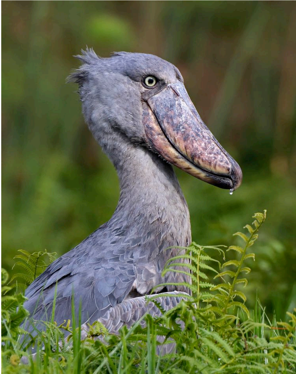
The extraordinaire Shoebill gave fantastic views during the tour.