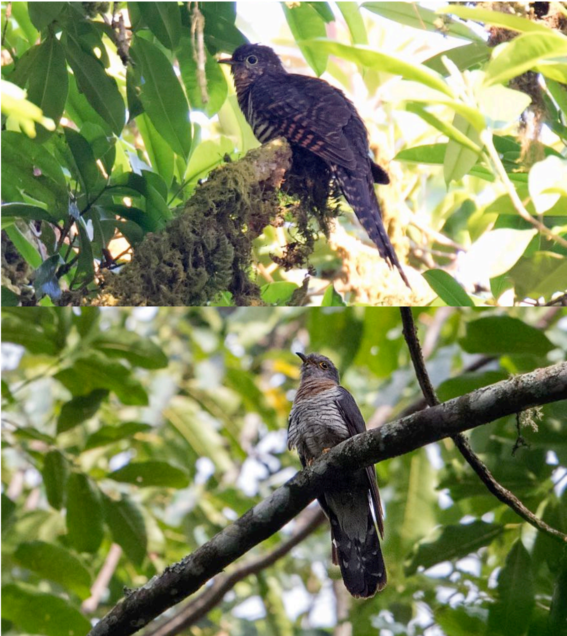
The elusive Barred Long-tailed Cuckoo and the far easier to see Red-chested Cuckoo.

Diederik (Didric) Cuckoo Chrysococcyx caprius Widespread. Klaas's Cuckoo Chrysococcyx klaas 3 birds seen, more heard. African Emerald Cuckoo Chrysococcyx cupreus 1 bird seen in Kibale. Dusky Long-tailed Cuckoo ♦ Cercococcyx mechowii 1 seen briefly by some in Kibale. Barred Long-tailed Cuckoo Cercococcyx montanus Seen very well in Nyungwe.