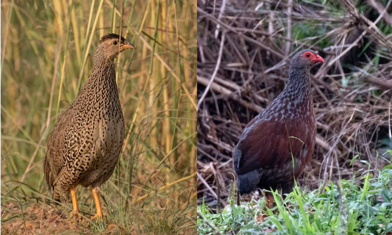
Heuglin's and Handsome Francolins.

Nahan's Partridge (N Francolin) ♦ Ptilopanchus nahani (E) Three seen very well at the Royal Mile in Budongo. Coqui Francolin Peliperdix coqui Seen at Mburo. Crested Francolin Dendroperdix sephaena Seen at various locations. Scaly Francolin Pternistis squamatus (H) Heuglin's Francolin ♦ Pternistis icterorhynchus Seen well in Murchison Falls. Handsome Francolin ♦ Pternistis nobilis Seen briefly in Nyungwe, and very well at Bwindi. Red-necked Spurfowl Pternistis afer Particularly common at Queen Elizabeth NP. Blue Quail ♦ Excalfactoria adansonii Seen at Queen Elizabeth NP. Little Grebe Tachybaptus ruficollis Small numbers seen.