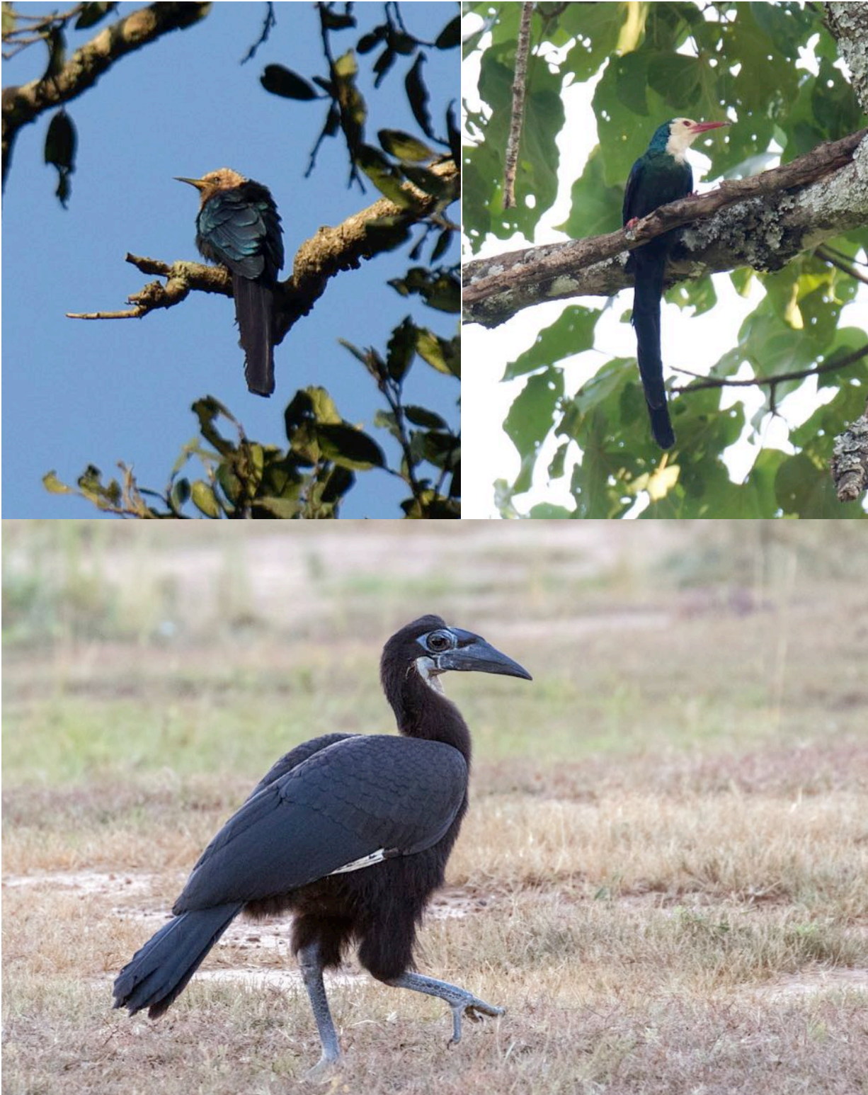
Forest and White-headed Wood Hoopoes and juvenile Abyssinian Ground Hornbill.

Forest Wood Hoopoe ♦ Phoeniculus castaneiceps 2 seen very well in Mabira, and one unexpected at Royal Mile. White-headed Wood Hoopoe Phoeniculus bollei Seen at Kibale and Bwindi. Green Wood Hoopoe Phoeniculus purpureus Seen in Murchison. Black Scimitarbill (B Wood-hoopoe) Rhinopomastus aterrimus Seen in Murchison Falls. Common Scimitarbill Rhinopomastus cyanomelas Seen at Mburo. Abyssinian Ground Hornbill Bucorvus abyssinicus Seen well in Murchison Falls NP. Crowned Hornbill Tockus alboterminatus Scattered sightings throughout the trip.