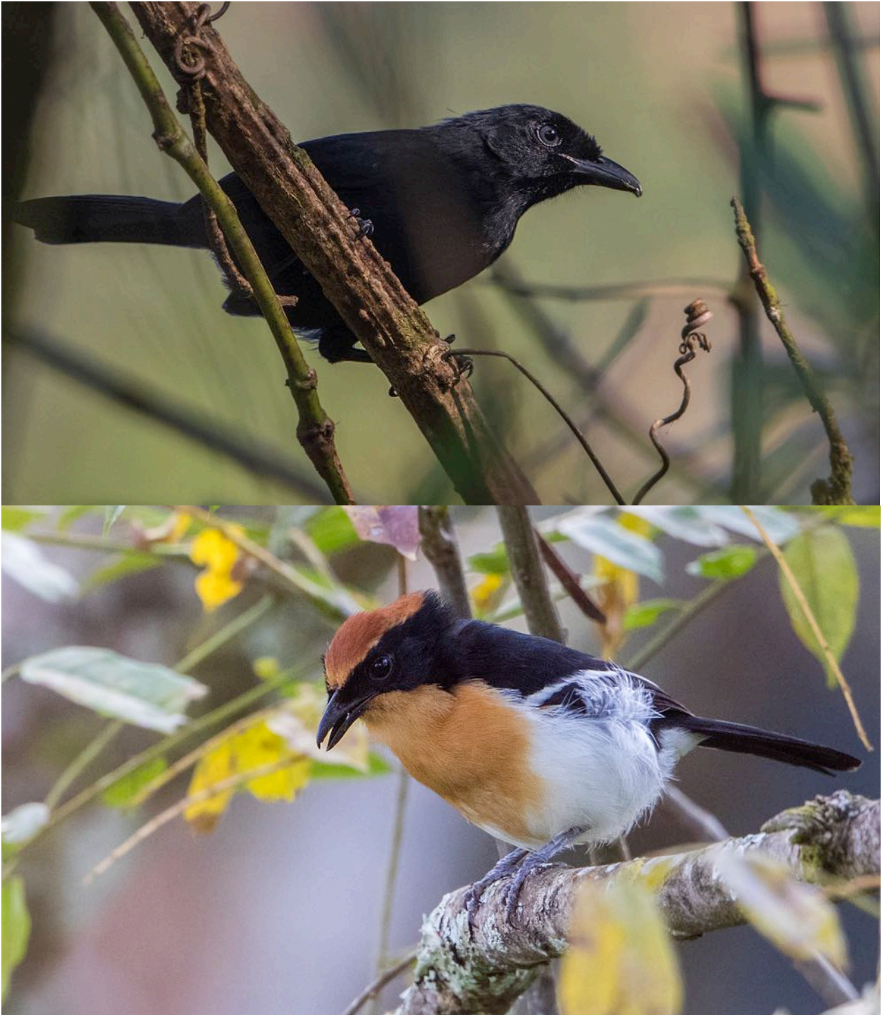
Willard's Sooty Boubou and Lühder's Bushshrike.

which gave us a colorful Papyrus Gonolek, as well as a singing Greater Swamp Warbler. After an early dinner, we took a flight to Entebbe, Uganda, where the main tour started the following day.