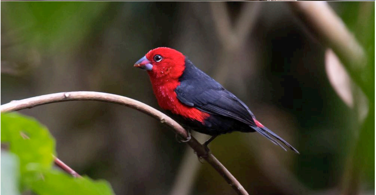
Speckle-breasted Woodpecker and Red-headed Bluebill from Bigodi Swamp.