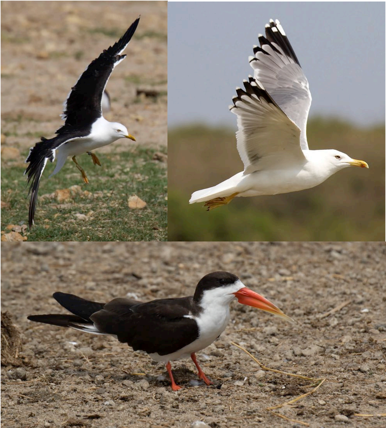
Baltic (Lesser Black-backed) Gull with a finnish colour ring, Steppe (Caspian) Gull and African Skimmer.

Three-banded Plover Charadrius tricollaris Seen in the Kazinga channel. Lesser Jacana Microparra capensis Seen well at Mabamba . African Jacana Actophilornis africanus Fairly common in wetlands. Ruff Calidris pugnax Seen in the Kazinga channel. Common Greenshank Tringa nebularia Recorded at Queen Elizabeth and Mburo. Wood Sandpiper Tringa glareola Seen 3 times. Common Sandpiper Actitis hypoleucos Seen several times. Marsh Sandpiper Tringa stagnatilis Seen at the Kazinga Channel. Ruddy Turnstone Arenaria interpres One seen at Queen Elizabeth NP. Collared Pratincole Glareola pratincola Seen at Queen Elizabeth NP. Rock Pratincole Glareola nuchalis Good views at Murchison Falls.