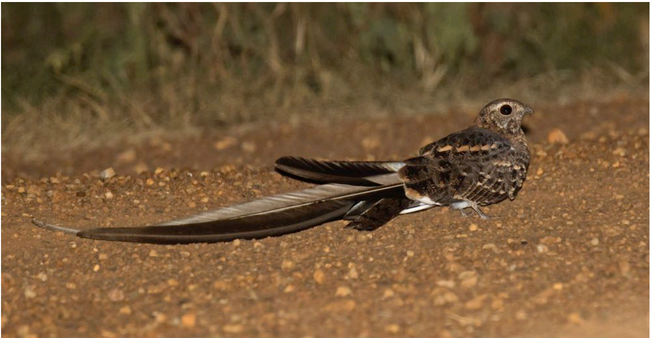
A spectacular male Pennant-winged Nightjar.