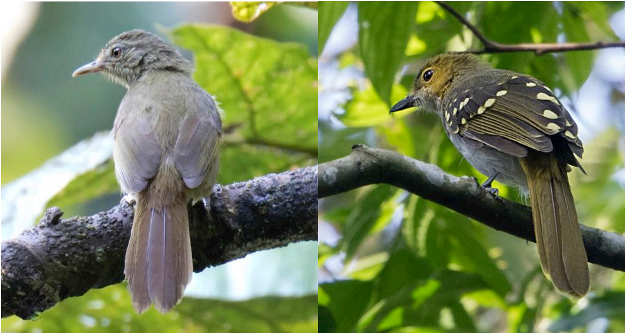
Toro Olive Greenbul and Western Nicator.

Yellow-whiskered Greenbul Eurillas latirostris Seen a few times. Honeyguide Greenbul Baeopogon indicator Seen a couple of times. Spotted Greenbul Ixonotus guttatus Seen at Budongo. Yellow-throated Leaflove Atimastillas flavicollis Recorded at several locations.