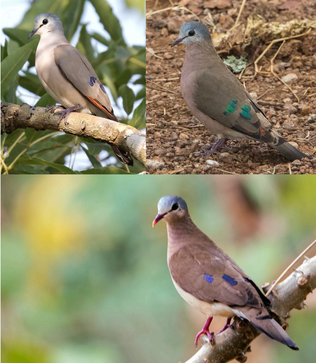
Comparison of Black-billed, Emerald-spotted and Blue Spotted Wood Doves.

African Olive Pigeon Columba arquatrix Only seen in Nyungwe.