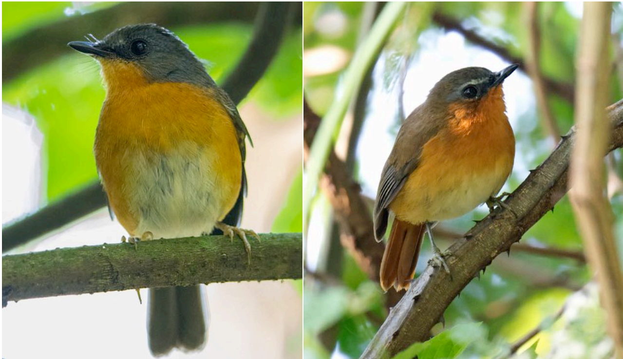
Equatorial Akalat and White-bellied Robin Chat.

Scaly-breasted Illadopsis ♦ Illadopsis albipectus Seen in Budongo forest by some. Puvel's Illadopsis ♦ Illadopsis puveli One gave excellent views at Kaniyo Pabidi. Brown Illadopsis Illadopsis fulvescens (H) Recorded in Budongo. Mountain Illadopsis ♦ Illadopsis pyrrhoptera Seen well in Nyungwe and Ruhija. Red-collared Babbler ♦ Kupeornis rufocinctus A group of 3 seen very well in Nyungwe. Black-lored Babbler Turdoides sharpei Seen in Queen Elizabeth NP. Brown Babbler Turdoides plebejus Seen near Masindi first. Dusky Babbler ♦ Turdoides tenebrosa Two seen very well in Murchison. Arrow-marked Babbler Turdoides jardineii Seen at Queen Elizabeth NP. Ruwenzori Hill Babbler ♦ Pseudoalcippe atriceps Seen well in Nyungwe and Bwindi. Grey-chested Babbler ♦ (G-c Illadopsis) Kakamega poliothorax Heard and glimpsed by some in Mubwindi. African Yellow White-eye Zosterops senegalensis Fairly common and widespread.