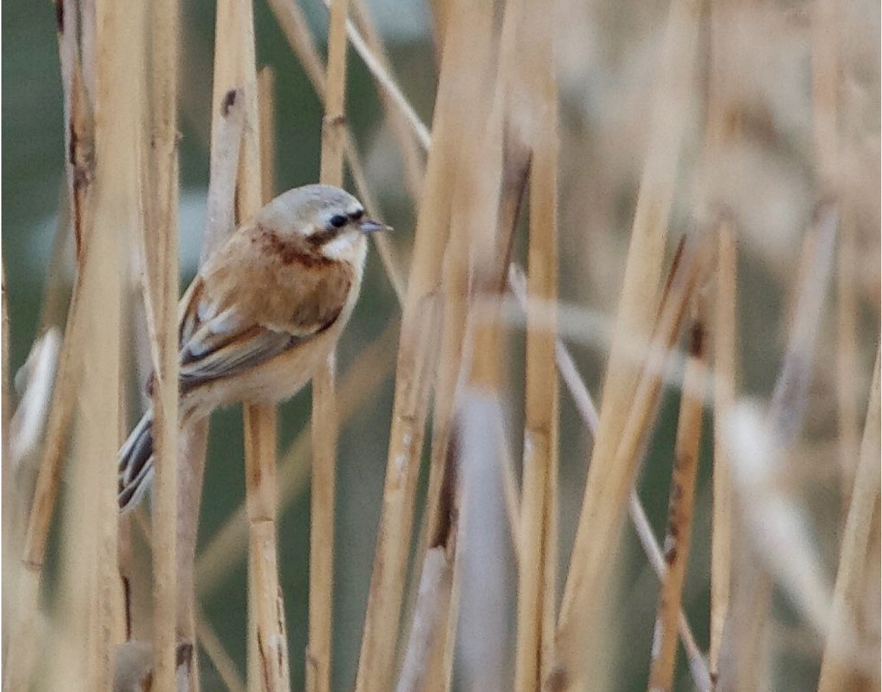
Chinese Penduline Tit near Arasaki (Craig Robson)

Eurasian Wren (Winter W) Troglodytes troglodytes A few around Karuizawa and one at Mi-ike Lake ( fumigatus ).