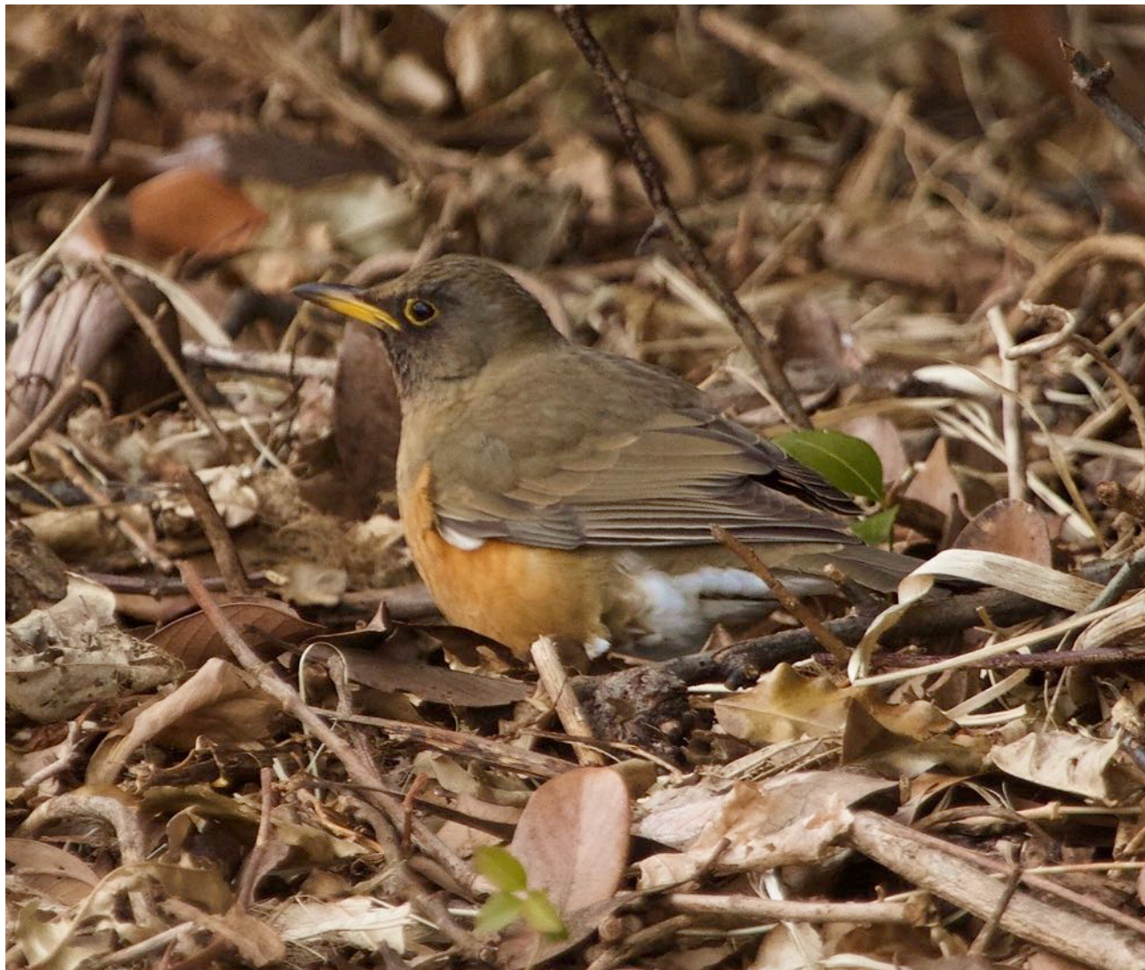
Brown-headed Thrush in Tokyo (Craig Robson)

Buff-bellied Pipit Anthus rubescens Plenty at Arasaki, four at Kasai Rinkai Park, Tokyo, and one on Hachijo-jima.