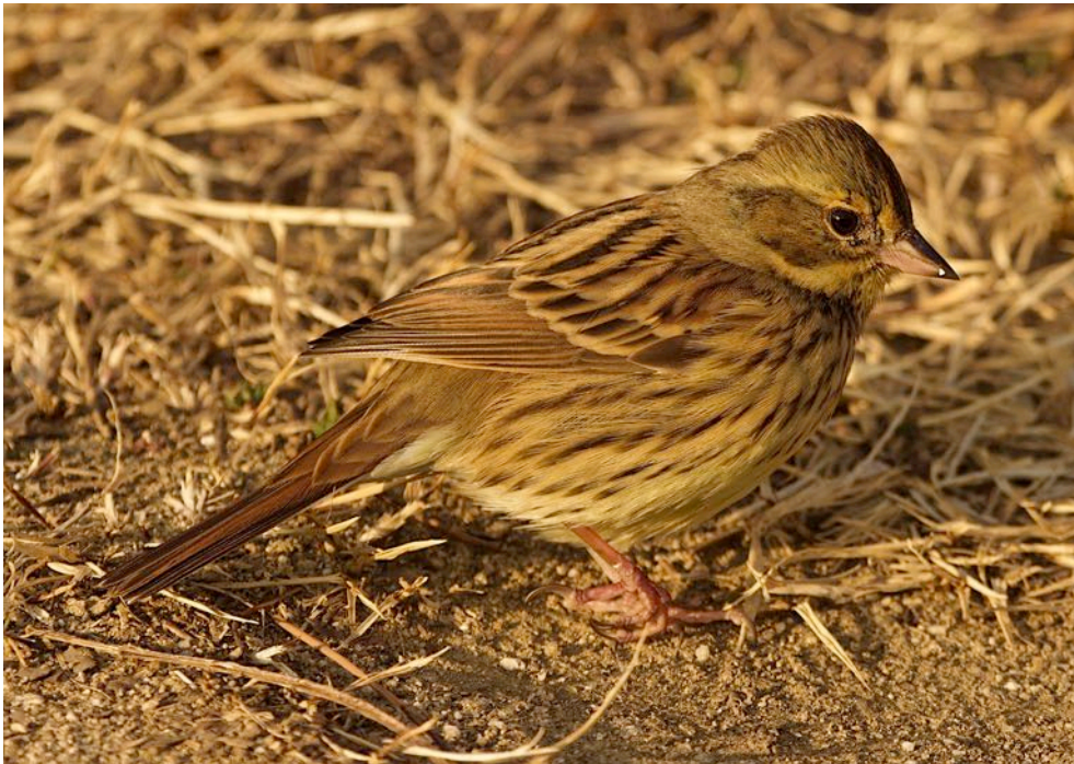
Black-faced Bunting (Craig Robson)

Black-faced Bunting Emberiza spodocephala