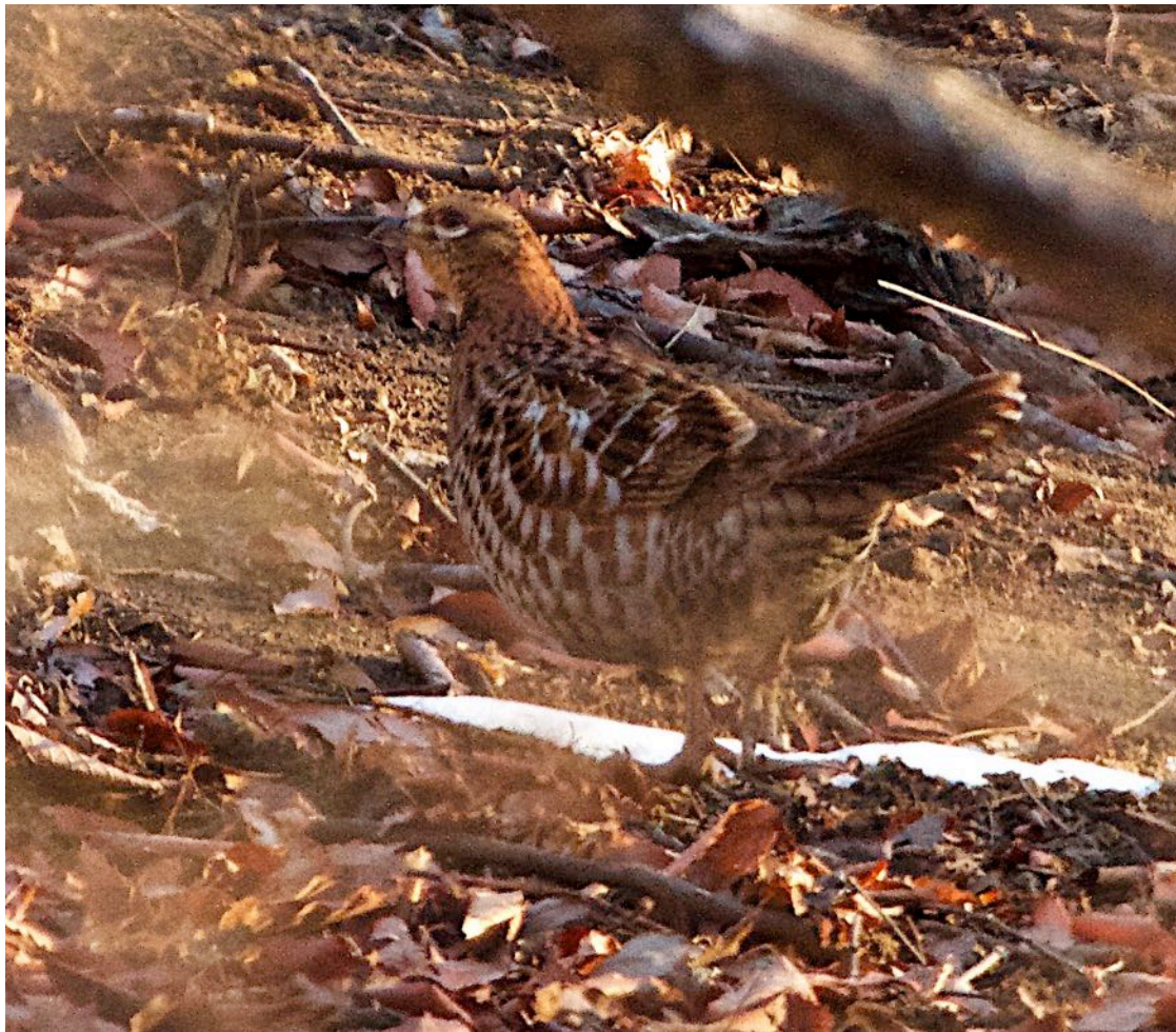
Copper Pheasant (Craig Robson)

Copper Pheasant Symaticus soemmerringii Multiple sightings at Karuizawa for all of us; at least 7 individuals.