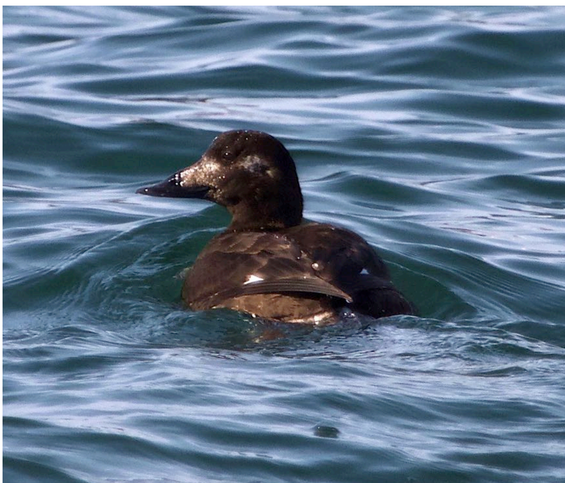
'American' White-winged Scoter (Craig Robson)