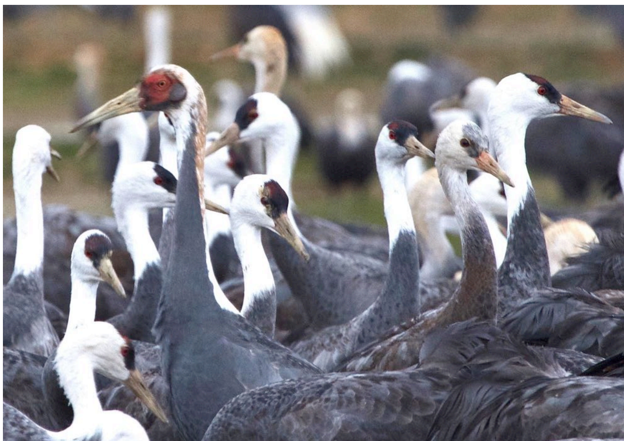
White-naped Crane with Hooded Cranes at Arasaki

After another look at the cranes massing in the early morning hours, we travelled across Kyushu, to Mi-ike and its attractive crater lake nestled among the volcanoes of the Kirishima range. During the afternoon, we birded various points around the lake. We scoped our first Mandarin Ducks roosting on branches, a highly responsive male White-backed Woodpecker entertained us, and we got multiple views of the localised Ryuku Minivet. Much of our time was taken-up trying to get good views of a foraging group of secretive Grey Buntings - without much success. On this occasion, we made do with Japanese Green Woodpecker, Eurasian Nuthatch, Red-flanked Bluetail, lots of Pale Thrushes, and Olive-backed Pipit. Returning to the