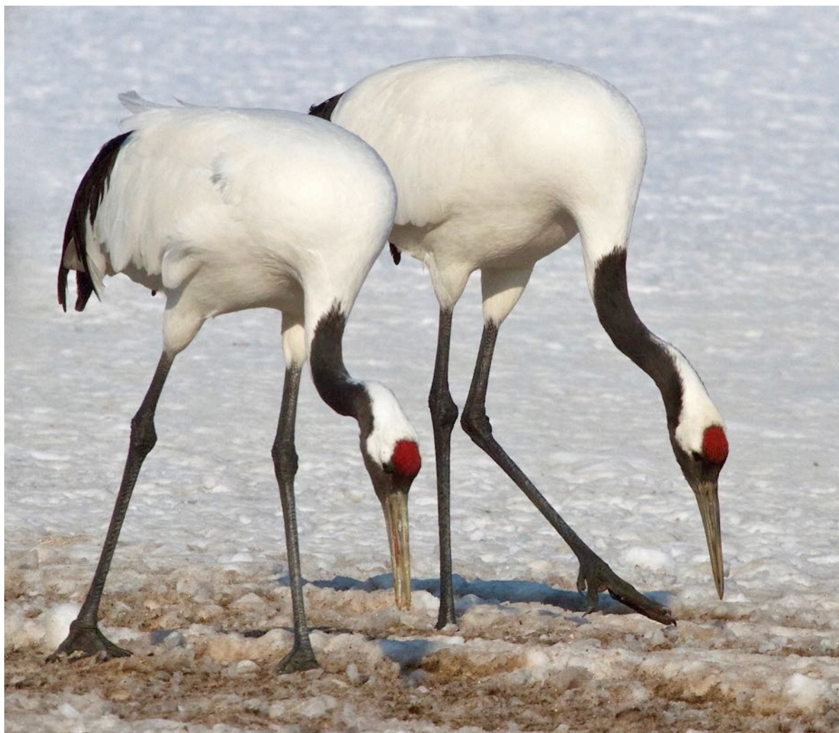
Red-crowned Cranes

Dark Evening Brown Melanitis phedima One in the forest at Mi-ike Lake.