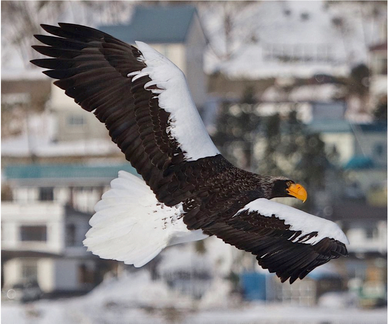
Steller's Sea Eagle (Craig Robson)