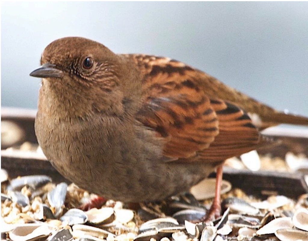
Japanese Accentor (Craig Robson)

Once we had all assembled at Haneda airport, we made our way across town to Tokyo station where we caught a high-speed train to Karuizawa. We disembarked into the sunlit snowy uplands of central Honshu. At our nearby accommodation, we ate our lunch overlooking the hotel bird feeders that were busy with numerous Varied, Japanese and Willow Tits, and an excellent Japanese Accentor.