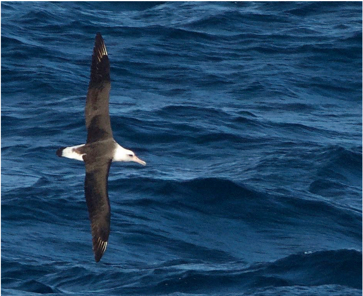
Laysan Albatross (Craig Robson)

As we approached Tokyo Bay, a big red sun set for the final time on our tour and, back at our hotel, we raised a toast to a marvellous adventure.