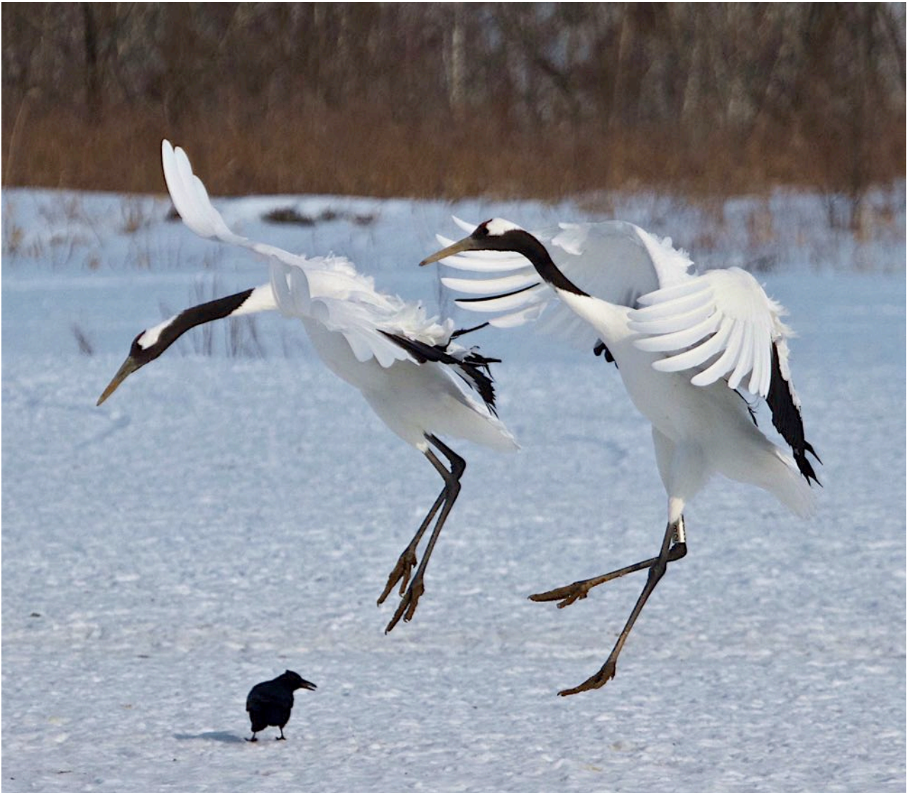
Red-crowned Cranes show their agility

photographers than cranes, so we decided to head off to another feeding station for a more enjoyable experience. It proved to be a good move, as the Tancho (or Ito) Sanctuary had more cranes than photographers!! Although the office feeders were empty, there were a few passerines too, including the local form of Marsh Tit, and several Eurasian Siskins. Leaving the Kushiro area behind, we headed across country to the east coast of Hokkaido. Our best sighting en route was a small flock of Common Redpolls which, upon close inspection, contained a single Arctic (or Hoary) Redpoll. Once at the coast, we drove down the Notsuke Peninsula to a sea-watching spot, and also searched a nearby harbour. There were good numbers of Black Scoter, Greater Scaup, Common Goldeneye, and both mergansers, as well as a single White-winged (or Stejneger's) Scoter, and small numbers of fancy-looking Long-tailed and Harlequin Ducks. We continued up the coast to Rausu, where we had an appointment with Blakiston's Fish Owl! As we approached the town, we noticed that there was no sign of any pack-ice, and we pondered how this might affect our viewing of sea eagles on the following day.