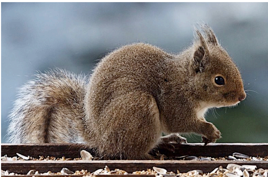
Japanese Serow and Japanese Squirrel (Craig Robson)