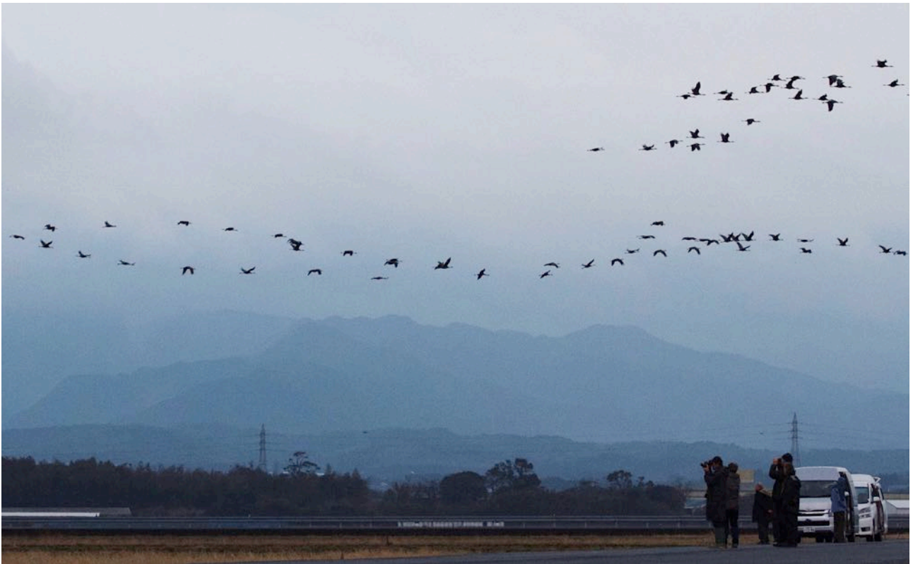
Flights of cranes at Arasaki (Craig Robson)