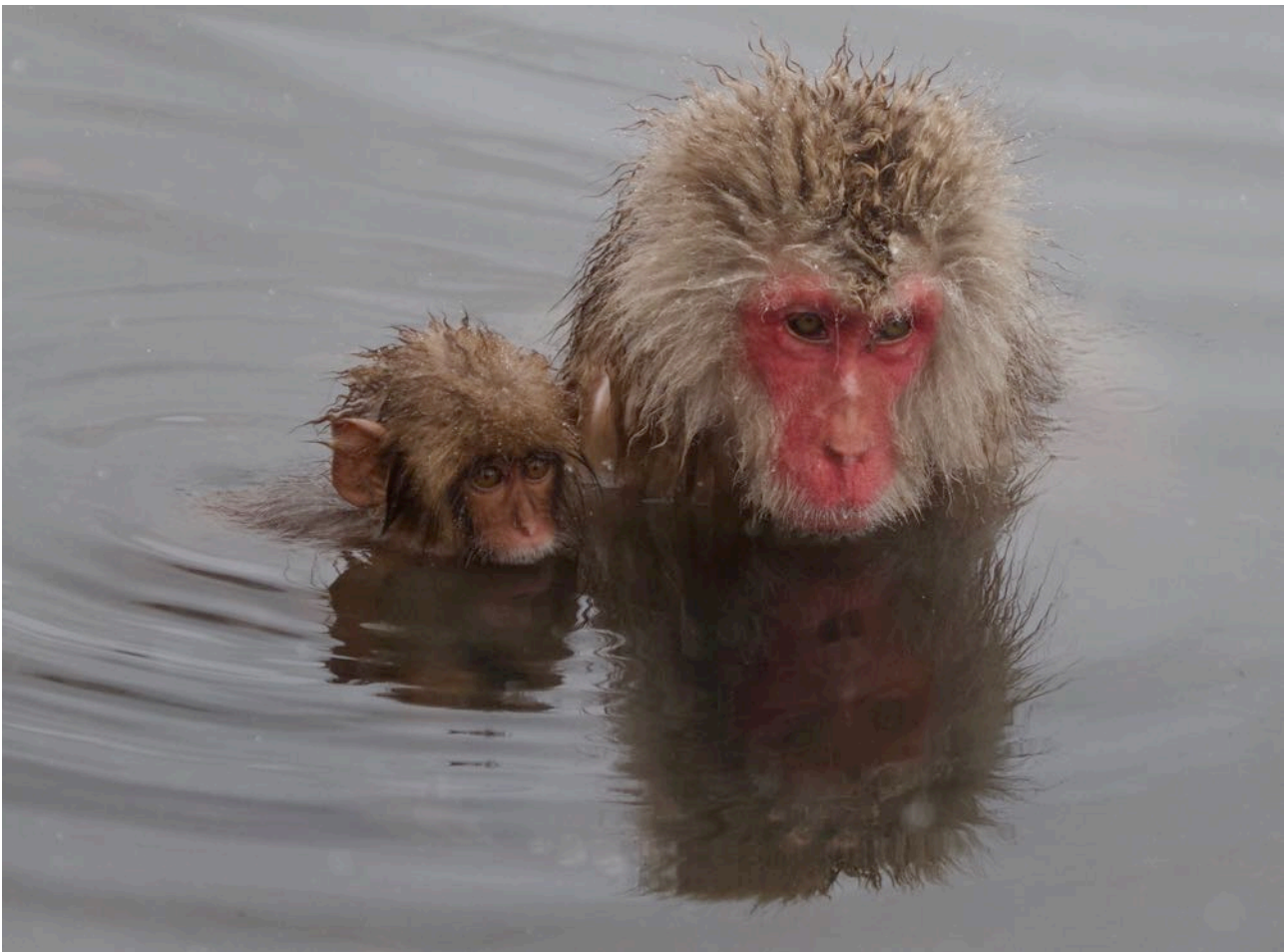
Bathing Japanese Macaques (Craig Robson)

We had one full day to explore the Kaga area. Recent and on-going snowfall hampered our efforts a bit, but things came good in the end. Scanning a multitude of fields, we eventually spotted three male Green Pheasants picking through the snow, and a small flock of statuesque Grey-headed Lapwings. A large gathering of 100s of Tundra (or Bewick's) Swans sheltered a single rare Snow Goose. A small lake was jam-packed with waterfowl, including about 100 Falcated Ducks, and multiple flocks of Greater White-fronted Geese skeined overhead. Scanning the Sea of Japan from a prominent spit of land known as Kasa Point was very productive. We estimated about 50 each of Pacific Loon and Ancient Murrelet, and 40 Japanese Cormorants, and we also picked-out Red- and Black-throated Loons, Red-necked Grebe, lots of Pelagic Cormorants, Vega and Slaty-backed Gulls, and a flyby Rhinoceros Auklet. We ate lunch at the duck observatory at Katano Kamo-ike, where we watched good numbers of Baikal Teal and Taiga Bean Goose, amidst more hordes of waterfowl.