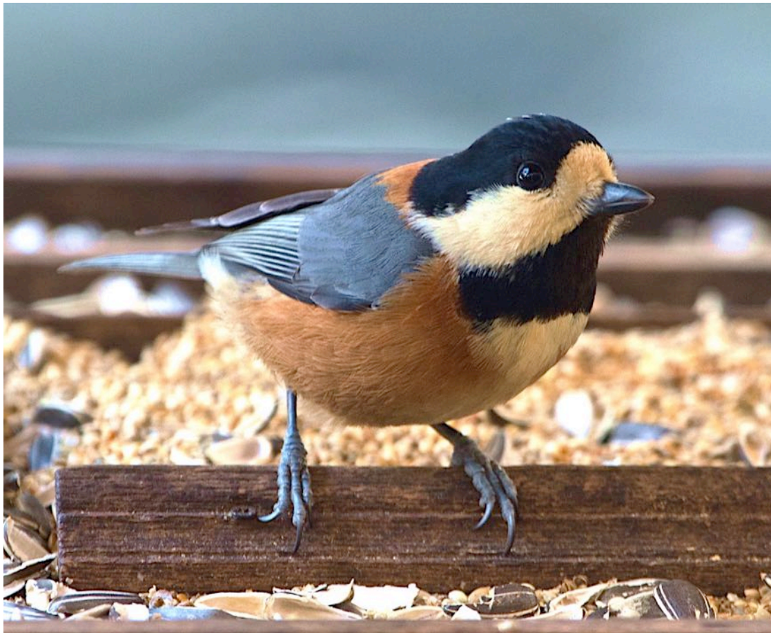
Varied Tit (Craig Robson)

Great Spotted Woodpecker Dendrocopos major Frequent Karuizawa; 1 Tancho Sanctuary, Hokkaido ( japonicus ). White-backed Woodpecker Dendrocopos leucotos A superb responsive male at Mi-ike Lake ( namiyei ). Japanese Green Woodpecker Picus awokera Small number around Karuizawa ( awokera ); two at Mi-ike Lake ( hori ). Common Kestrel (Eurasian K) Falco tinnunculus Peregrine Falcon Falco peregrinus Singles Kanazawa, Arasaki, Kadogawa, Cape Kiritappu. Latter potentially pealei . Ryukyu Minivet Pericrocotus tegimae A handful in Kyushu, at Mi-ike Lake and Kota Shrine. Bull-headed Shrike Lanius bucephalus Regular encounters with this smart bird on Honshu and Kyushu.