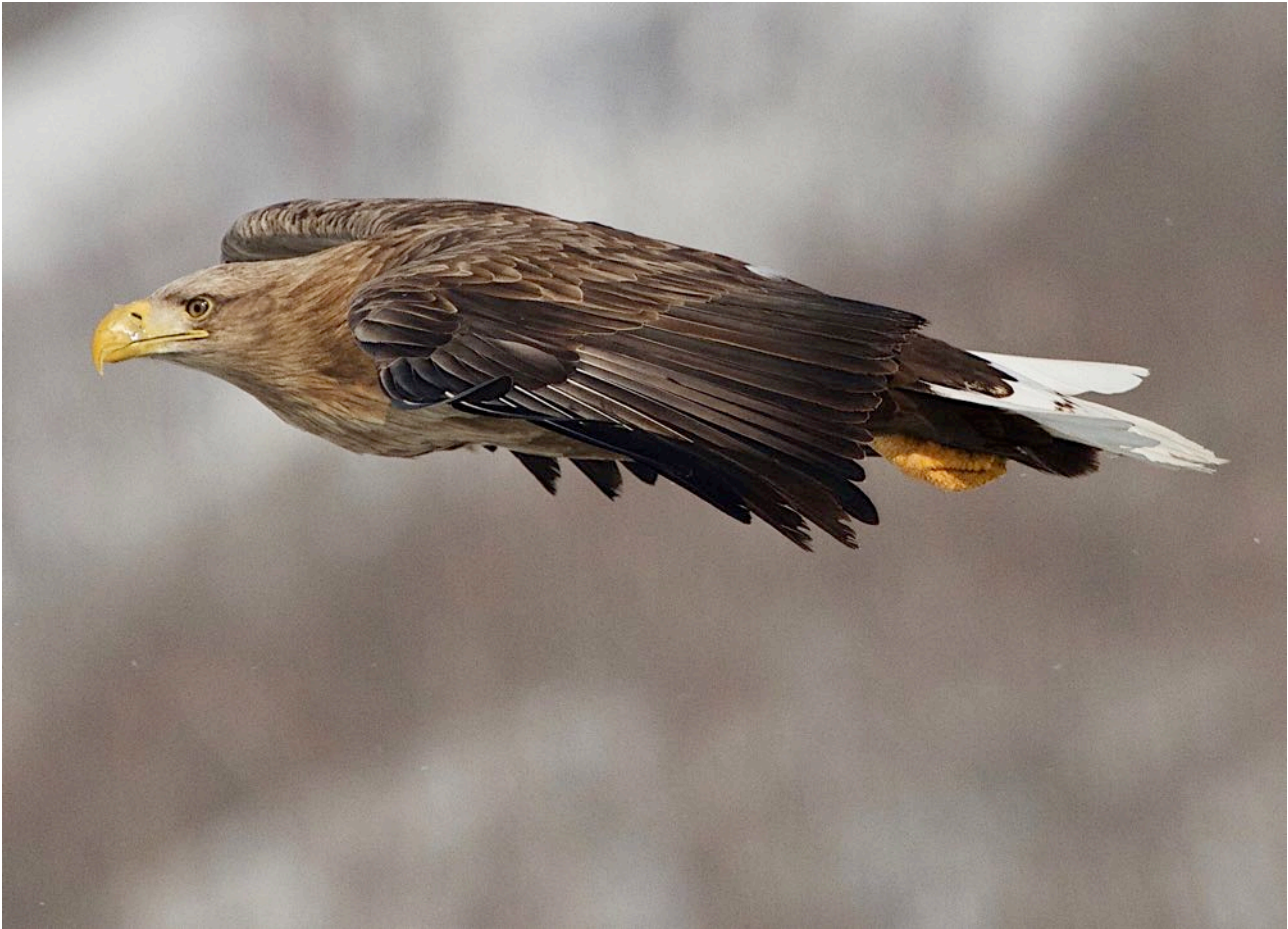
White-tailed Eagle (Craig Robson)

White-naped Crane Grus vipio Many still at Arasaki, even though some were already departing. 200+. Red-crowned Crane (Japanese C) Grus japonensis Many encounters with these special birds on Hokkaido. 200+. Common Crane Grus grus Two in the Crane flocks at Arasaki, plus some hybrids with the next species. Hooded Crane Grus monacha The most numerous Crane at Arasaki. 4000+.