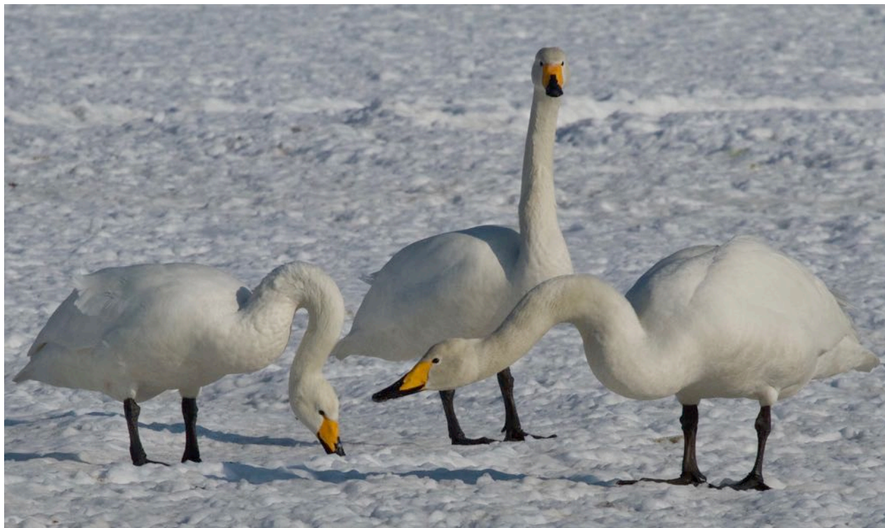
Whooper Swans in Hokkaido

Common Shelduck Tadorna tadorna Seen in several places on Kyushu.