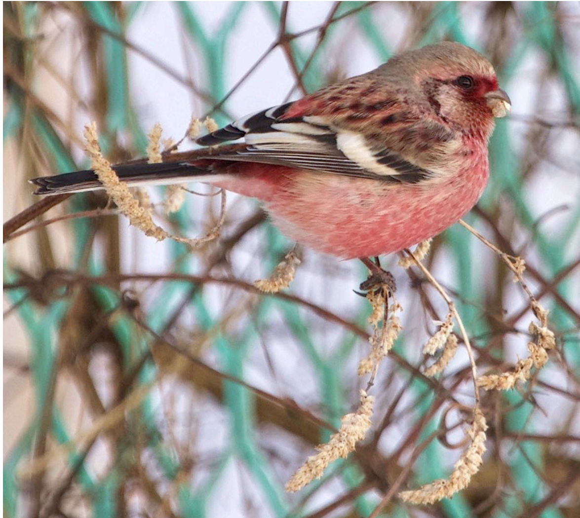
Long-tailed Rosefinch (Craig Robson)

The rising slopes of Mount Asama provide a magnificent backdrop, and when we explored them briefly on one afternoon, we were very fortunate to run-into a feeding flock of about 20 Pallas's Rosefinches - one of the trickier species that we don't always see on this tour. One or two Eastern (or Japanese) Buzzards were perched-up by the road.