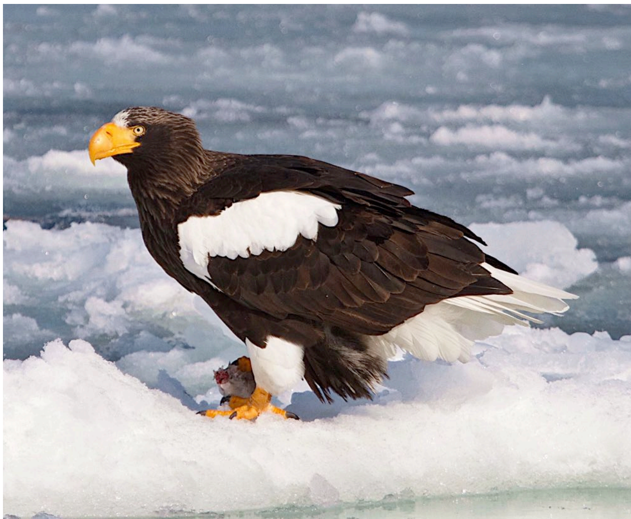
Steller's Sea Eagle on the Rausu pack-ice, Hokkaido

Our final birding day in Hokkaido took us along the coast from Nemuro back to Kushiro. Our first port of call was Cape Kiritappu. There were more good views of seabirds from the cape itself, including another Crested Auklet. Back inland a bit, in a small wooded valley, we scoped a mass of Asian Rosy Finches, as well as a rather unexpected flock of Hawfinches. At Biwase Observation Point there were flocks of wintering Brant Geese (or Black Brant), mixed with Whooper Swans. Before going to the airport, we had time for another visit to Tancho Sanctuary, where we were treated to our biggest gathering of Red-crowned Cranes during the tour. Many of the birds were performing their famous leaping dance. A small flock of lovely white-headed nominate Long-tailed Tits also appeared on-cue, and we had our best views of Asian Rosy Finch nearby. Another flight returned us to Tokyo, and we said our goodbyes to those who were not taking part in the pelagic extension.