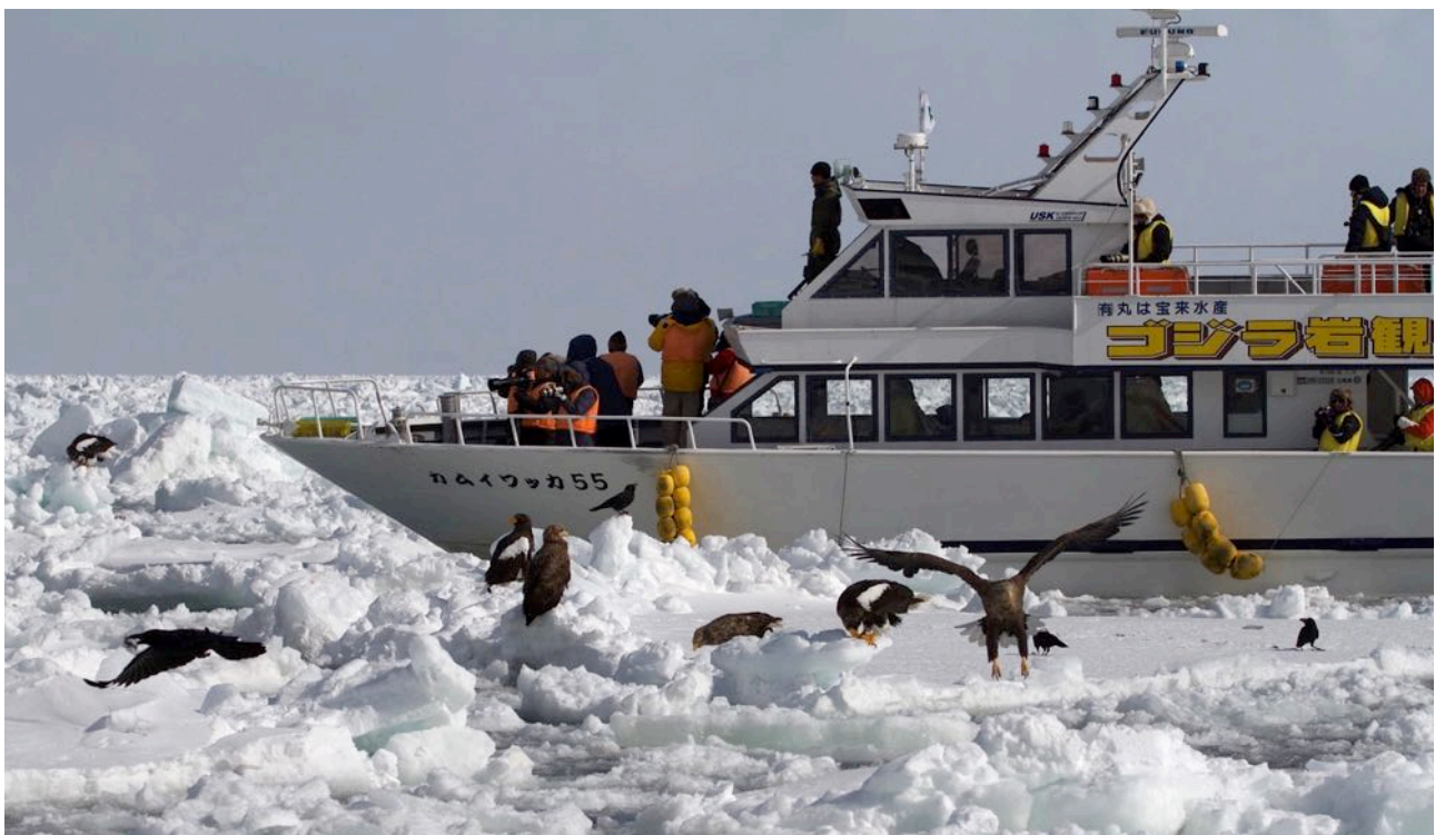
Eagles on the pack-ice in Hokkaido

Common Reed Bunting Emberiza schoeniclus A dozen or so around Arasaki, and three at Kasai Rinkai Park.