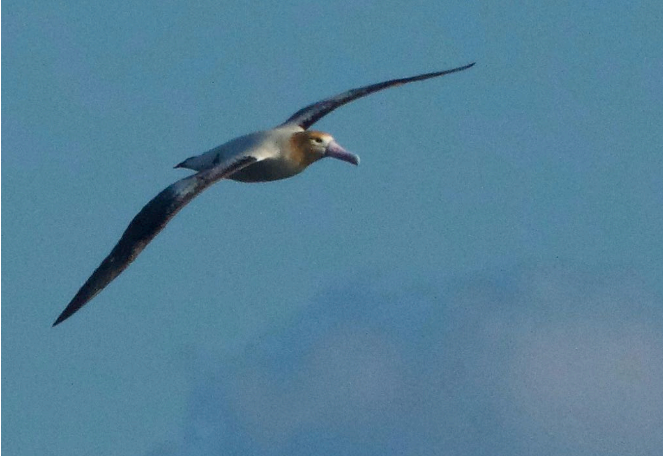
Short-tailed Albatross (Craig Robson)

Grey Heron Ardea cinerea Great Egret Ardea alba Little Egret Egretta garzetta Pacific Reef Heron Egretta sacra One dark morph at Kadogawa Harbour. Brown Booby Sula leucogaster Two during our pelagic trip. Pelagic Cormorant Phalacrocorax pelagicus Red-faced Cormorant Phalacrocorax urile Just one at Cape Nosappu; but nice scope views. Great Cormorant Phalacrocorax carbo Japanese Cormorant Phalacrocorax capillatus 40 Komatsu coast; 6 Kadogawa; 2 Kasai Rinkai Park; 2 on pelagic.