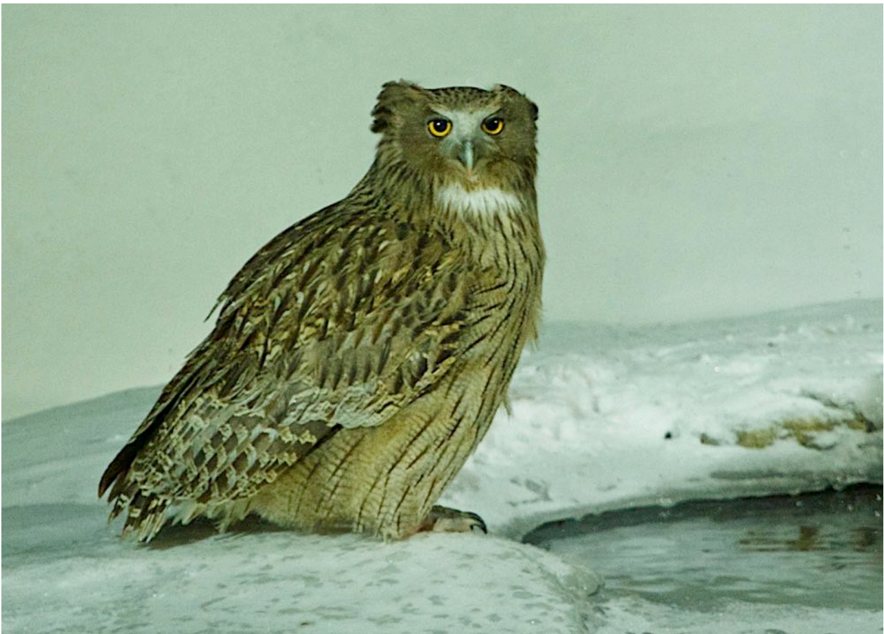
The awesome Blakiston's Fish Owl (Craig Robson)

The following morning, as we looked offshore, we were gob-smacked to see a mass of glimmering pack-ice stretching as far as the eye could see - it had miraculously blown-in overnight like a giant raft. The sea ice is formed in the Sea of Okhotsk, and only comes south when the weather and sea conditions permit. As our boat nudged its way into the midst of the pack-ice, we could already see the magnificent Steller's Sea and White-tailed Eagles dotted about in all directions. The crew tossed fish onto the ice, and in came the eagles!! We enjoyed a magical few hours as these amazing birds provided an incredible spectacle, not to mention some fantastic photo-opportunities. We reckoned on at least 100 Steller's, and 60 White-tailed - an unbelievable sight. We said farewell to Rausu and followed the coast down to the south-east, as we journeyed to Nemuro. We called-in again at the Notsuke Peninsula and also visited a few harbours. There were large numbers of gulls, including Glaucous-winged and particularly Glaucous, a good number of Spectacled Guillemots moving offshore, a single Least Auklet, ten Crested Auklets, large numbers of Pelagic Cormorants, and similar numbers of sea-ducks to the previous day. At our hotel in Nemuro, we enjoyed a feast of Hanasaki Crab and oysters.