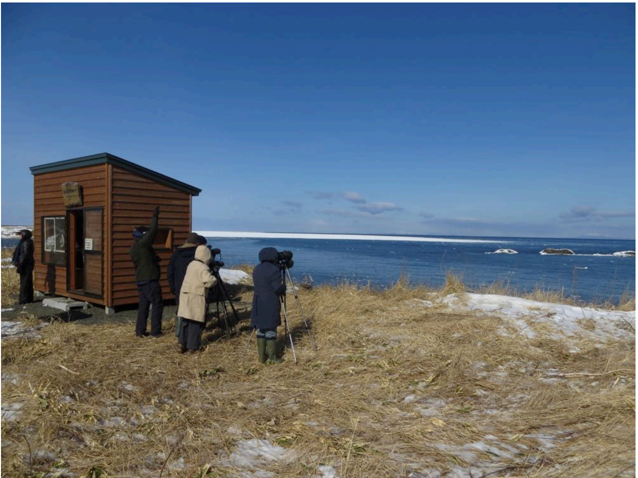
Scanning the sea near Cape Nosappu, Hokkaido (Craig Robson)