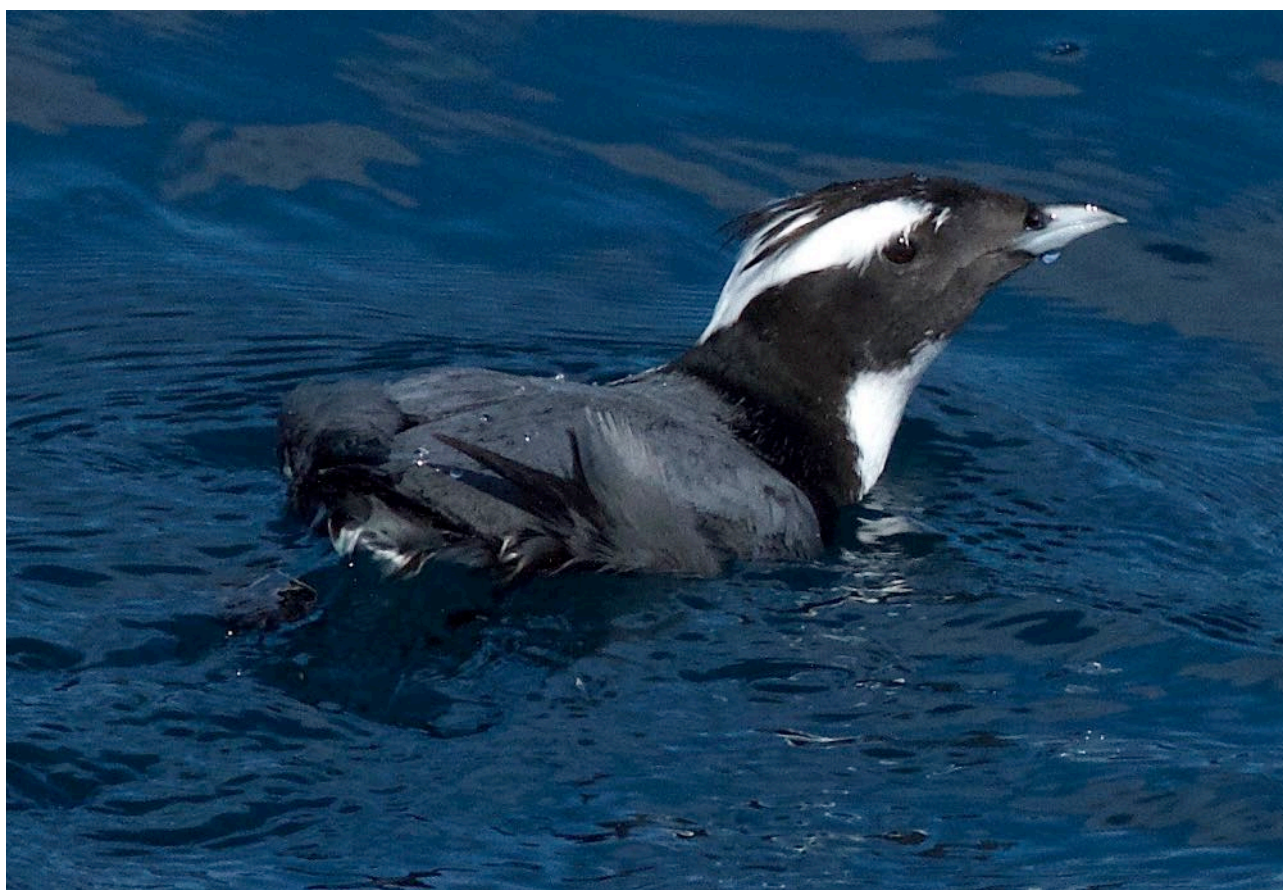
Japanese Murrelet in Kyushu (Craig Robson)

We began the following day nice and early, in order to reach the east coast of Kyushu in good time, and began our birding in an area of fields and wooded copses near Kota Shrine. A couple of White-bellied Green Pigeons flew past us and, as we approached the head of small valley, we found good numbers of lovely Yellow-throated Buntings. More Grey Buntings were located by a small reservoir, but continued to frustrate us. A well vegetated lake held more Mandarin and Falcated Ducks, and a superb Northern Goshawk was watched preening by the shore. Fleeting views of a displaying Japanese Sparrowhawk meant another tour write-in. We headed up the coast to Kadogawa Harbour and, after enjoying lunch in some comfy armchairs, we set off in our charter-boat across the harbour in search of Japanese Murrelets. So small and sprightly, they certainly earn their Japanese name of 'Sea Sparrow'. Otani-san soon spotted a couple, and the skipper skilfully manoeuvred around them for superb views. Also here, were Great Crested Grebes, a few Japanese Cormorants, Western Osprey, a slaty-plumaged Pacific Reef Heron, and Black-tailed, Vega and Slaty-backed Gulls. On our way back to Mi-ike we tried another trail near Kota Shrine, and this time succeeded in getting excellent views of Grey Bunting for everyone, when a calling male suddenly decided to perch right up in front of us.