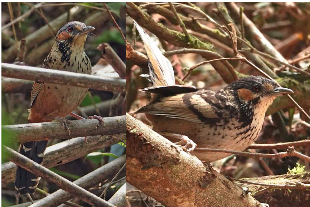
Chestnut-eared Laughingthrush (left Dave Williamson, right Craig Robson)

We had a full day and a morning to explore the Mang Canh area near Mang Den, birding along narrow paved and rough old logging roads and trails. Our good fortune continued, as our primary target-bird here, the near-endemic Chestnut-eared Laughingthrush (only discovered in the 1990s) showed really well - thanks again to the efforts of our local guide Quang. As usual in this area, Black-hooded Laughingthrush was quite common and performed well on multiple occasions. Other star birds were our first Ratchet-tailed Treepies, Yellow-billed Nuthatch, our first black crested 'Annam' Sultan Tits, some cracking little Rufous-faced Warblers, an obliging Spot-throated Babbler, and Pale Blue Flycatcher.