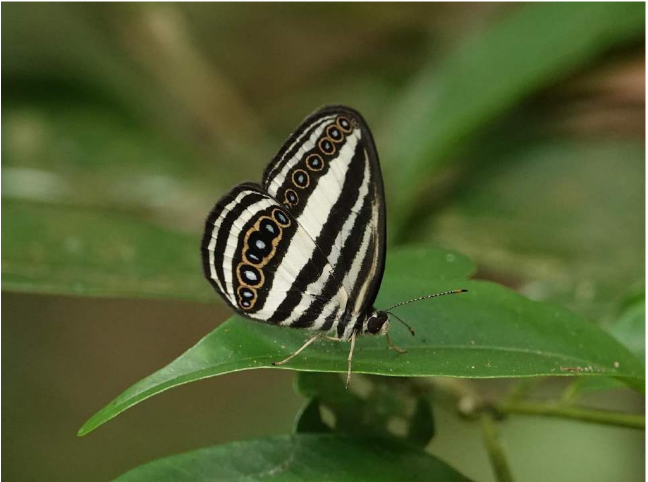
Massing Dwarf and Striped Blue Crows and Large Faun & Striped Ringlet