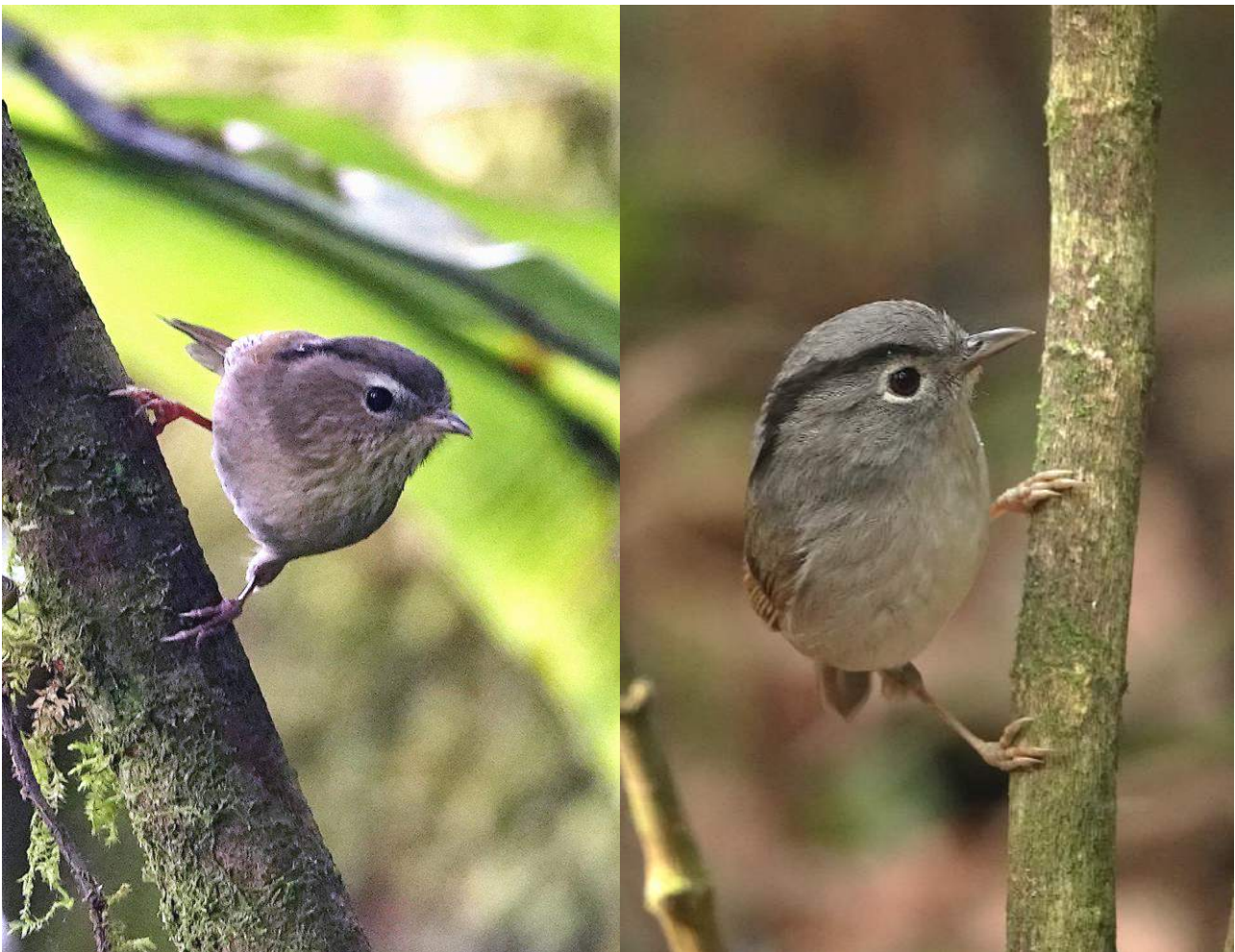
Indochinese and Mountain (or Annam) Fulvettas

From Ngoc Linh, we headed for the coast at Lang Co Beach Resort. Apart from enjoying the sound of the waves lapping on the sandy shoreline, we explored the gardens and also nearby An Cu Lagoon. Highlights were our first Japanese Tits, Light-vented Bulbul, some obliging Masked Laughingthrushes, Scaly and Japanese Thrushes, Chinese Blackbird, and a brief female Daurian Redstart.