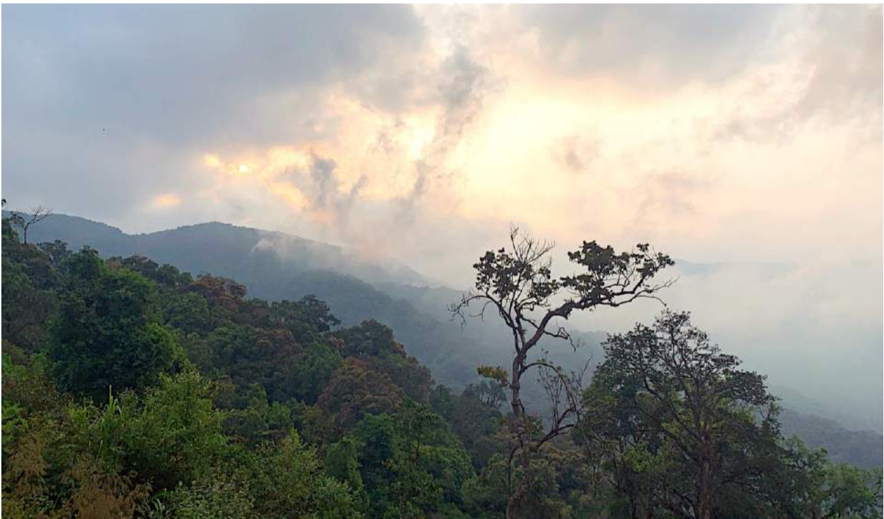
Forested ridges at Ngoc Linh

Finishing off down towards the headquarters buildings, there were brief views of Pale-footed Bush Warbler, Eastern Crowned Warbler, and a nice Chestnut Bunting, before the tour drew to its conclusion and we headed for the airport!