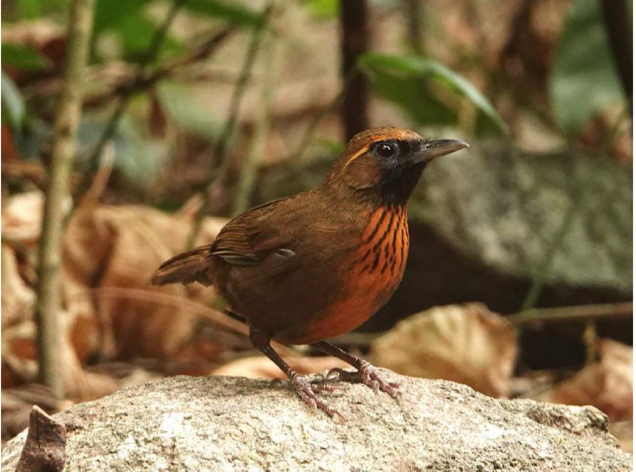
Vietnamese Cutia & Black-headed (or White-spectacled) Sibia, and Orange-breasted Laughingthrush