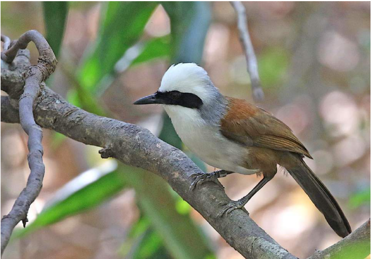
Scaly-breasted Partridge and White-crested Laughingthrush (Craig Robson)