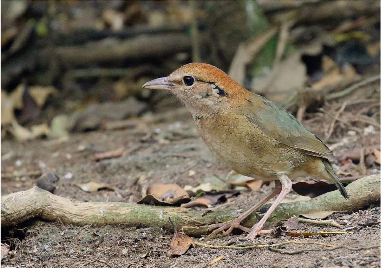
Rusty-naped Pitta (Craig Robson)