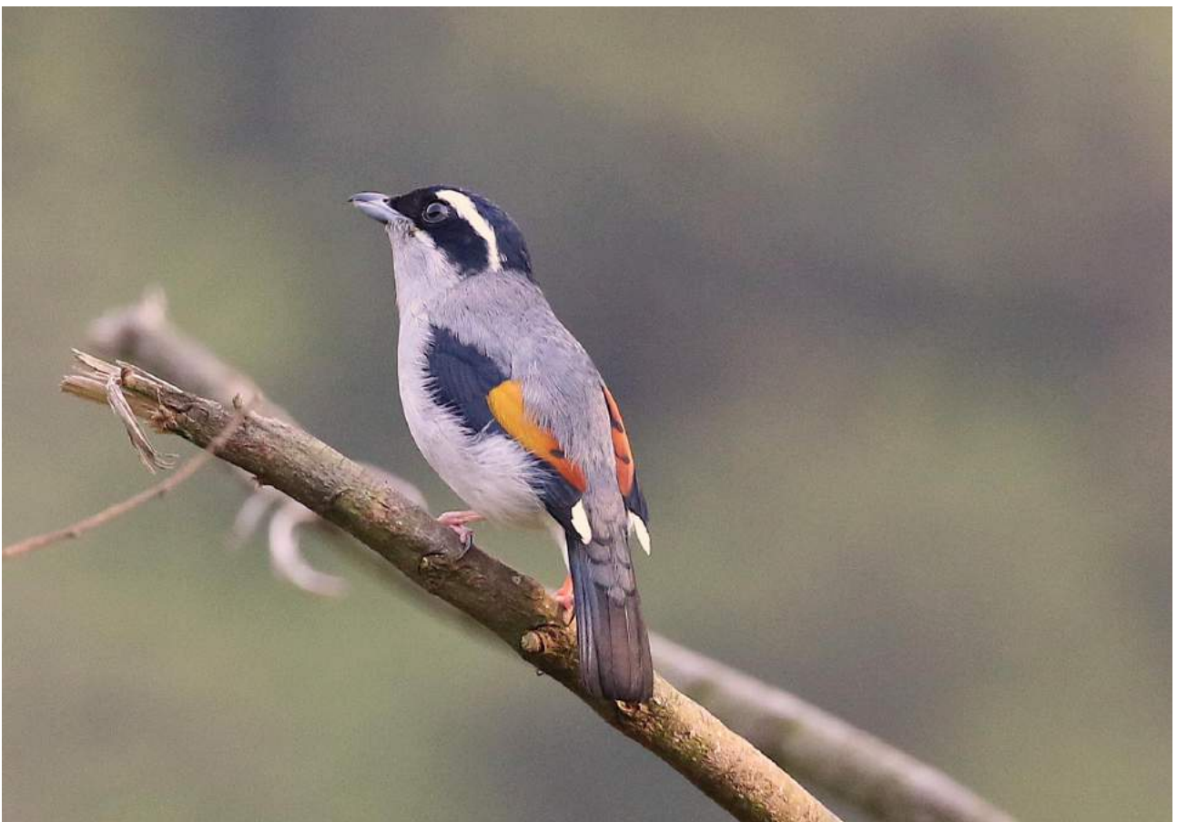
Bar-bellied Pitta at Cat Tien and nominate Blyth's Shrike-babbler at Deo Sa Mu