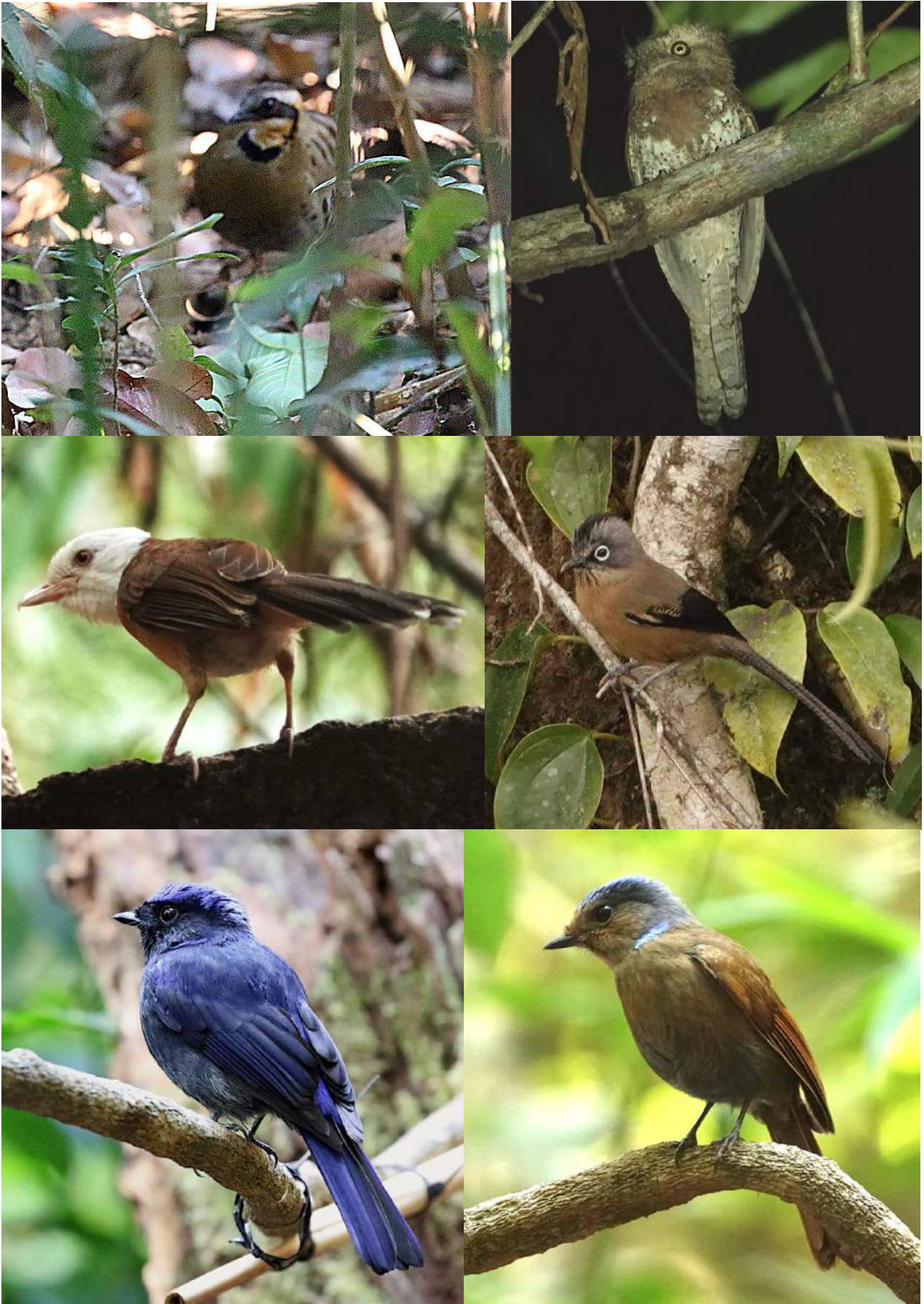
Clockwise from top left : Orange-necked Partridge, Blyth's (or Indochinese) Frogmouth, Black-crowned Barwing, female and male Large (or Dalat) Niltava, and Collared Babbler.