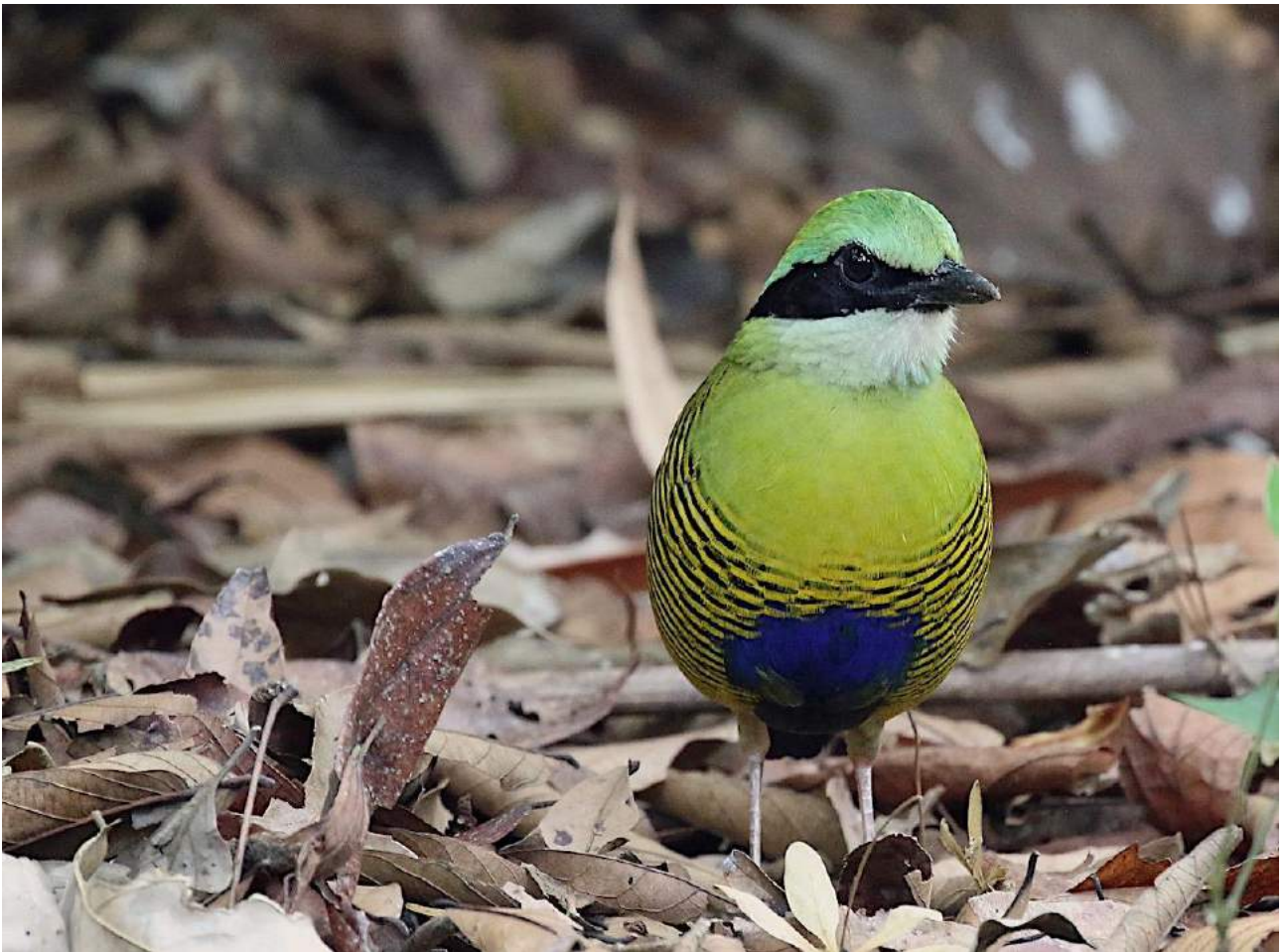
Bar-bellied Pitta (Craig Robson)

It was also a great tour for mammals. We were lucky enough to find good numbers of both Red-shanked and Black-shanked Douc Langurs, Red (or Buff-) cheeked and Northern Yellow-cheeked Crested Gibbons, Hatinh Langur, and a herd of impressive Gaur. With butterfly enthusiasts on-board, a little extra effort resulted in some very worthwhile sightings.