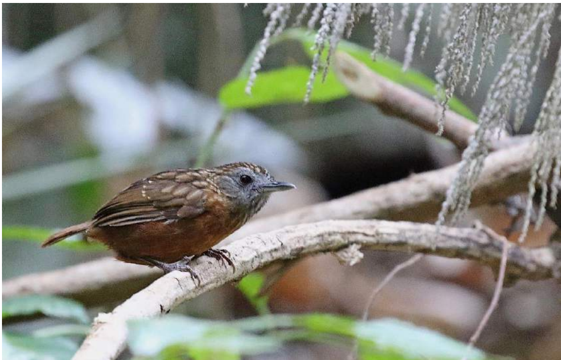
Streaked Wren-Babbler (Craig Robson)