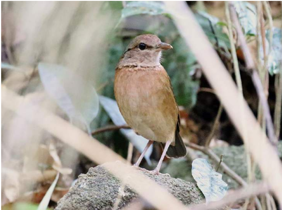
Female Blue-rumped Pitta (Craig Robson)

(a fairly shy pair), Orange-breasted Laughingthrush, Collared Babbler, Streaked Wren-Babbler, the innotata and aurimacula forms of Orange-headed Thrush, Siberian Blue Robin, and a smart female White-throated Rock Thrush. Birding the forest edge along the road, we picked-out or first Grey-crowned Bushtits (a split from Black-throated), some near-endemic Black-headed Parrotbills were eventually very obliging, and we also encountered our first flock of near-endemic White-cheeked Laughingthrushes. Other nice birds included Jerdon's Baza, Red-vented and Indochinese Barbets, Speckled Piculet, superb Long-tailed and Silver-breasted Broadbills, singing migrant Claudia's Leaf Warbler, Red-billed Scimitar Babbler, Mountain (or Annam) Fulvetta, the unusual orientalis form of Blue-winged Minla (sometimes split as Plain Minla), Black-chinned Yuhina, Mugimaki Flycatcher, and the amazing johnsi form of Black-throated Sunbird (now often split as Langbian Sunbird). Nearby, we tempted out an Annam Prinia, Vietnam's latest endemic, having just been split from Brown.