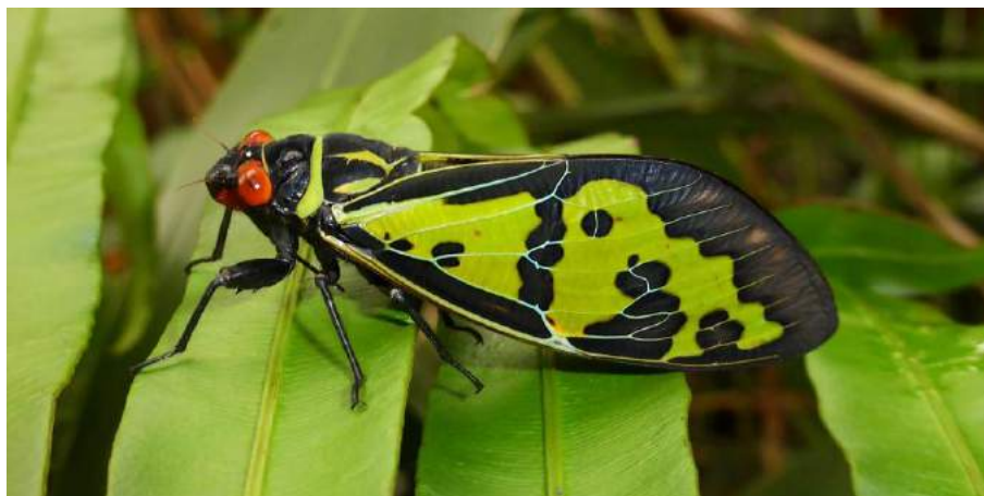
The amazing cicada Gaeana festiva at Phong Nha Ke Bang

Huechys sanguinea Dakrong NP. Distantalna splendida Deo Sa Mu. Gaeana cheni Dakrong NP. Gaeana festiva Phong Nha Ke Bang. Gaeana maculata Mang Canh.