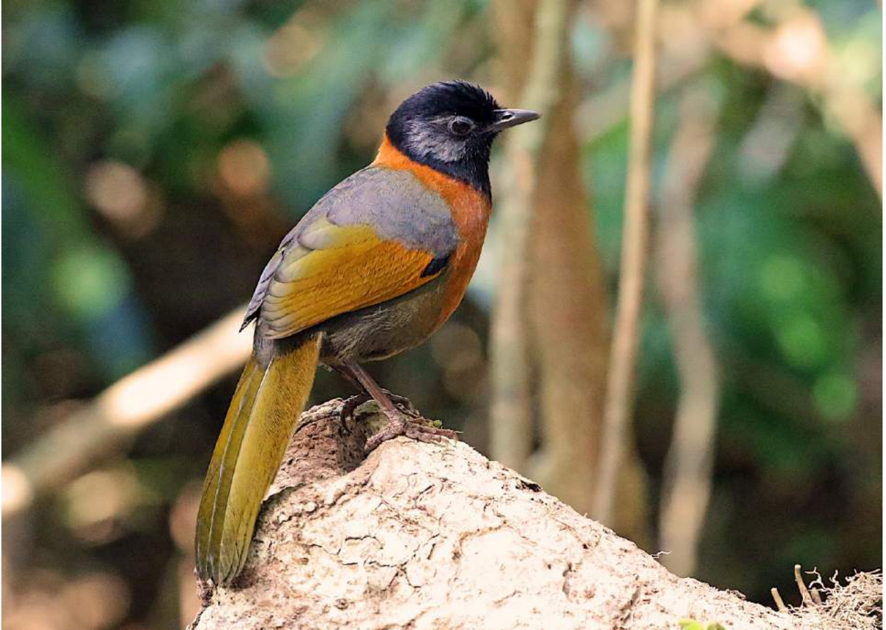
Female Blue Pitta and Collared Laughingthrush at Bi Doup Nui Ba National Park (Craig Robson)