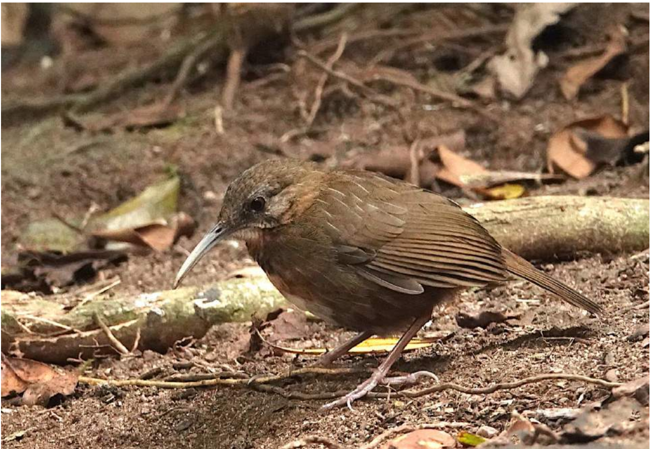
aurimaculatus Orange-headed Thrush and Short-tailed Scimitar Babbler