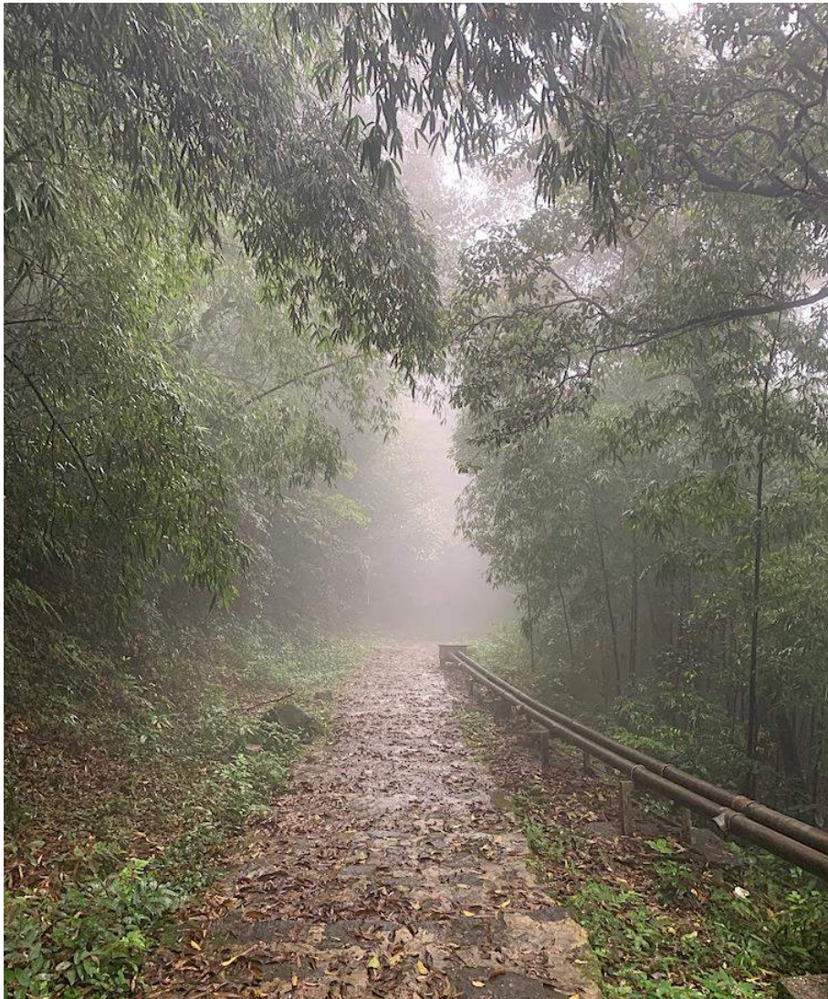
Phong Nha Ke Bang NP and the foggy steps at Tam Dao