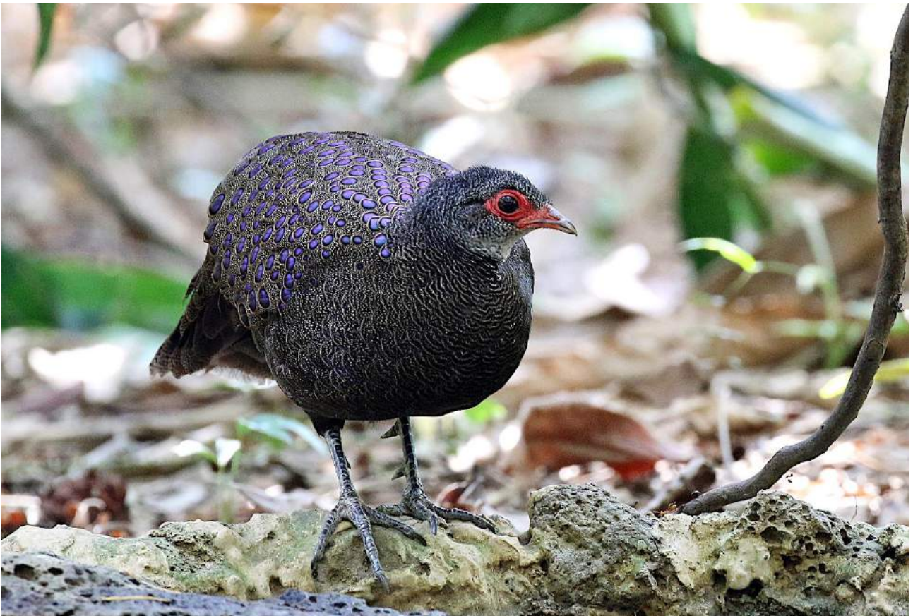
Male Germain's Peacock-Pheasant (Craig Robson)

From Cat Tien, we had a relatively easy drive to our next birding hotspot near Di Linh, pausing for lunch in Bao Loc en route. We had the best part of two days to get to grips with the rich birdlife of the excellent forested pass referred to as Deo Nui San, along the Phan Thiet road. When we first visited this site in 1991, the road was but a dirt track, and the logistics of reaching it were a bit of a nightmare. Things could hardly be different now, with easy and quick access; though the forest has been pushed back from the roadsides. We stayed in some very nice new accommodations close to the site. There were many specialities for us to chase here. On the first afternoon, we walked down to the south from the pass, before spending some time at a hide that our local guide Quang had personally installed, and spent a lot of his time and effort maintaining. What a fantastic little spot it proved to be, as we soaked up the brilliant views of another Slaty-legged Crane, Blue-rumped Pitta