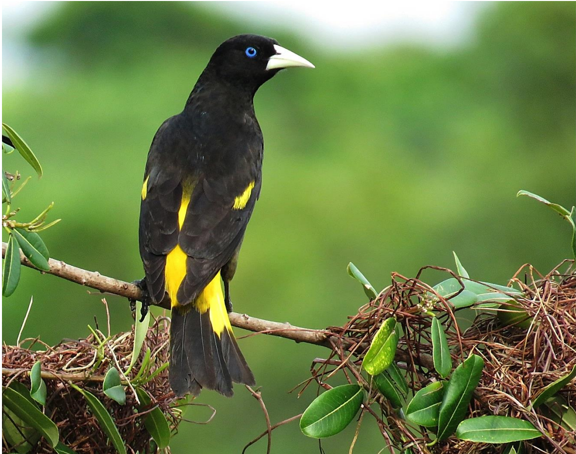
Yellow-rumped Cacique

Grey-headed Tanager Eucometis penicillata Cipó, Pantanal and Chapada. Flame-crested Tanager Tachyphonus cristatus Cristalino Lodge. Ruby-crowned Tanager ◊ Tachyphonus coronatus (H) Heard at Canastra. White-lined Tanager Tachyphonus rufus Chapada and Rio Azul Lodge. Silver-beaked Tanager Ramphocelus carbo Common at Pantanal, Chapada and Amazon. Blue-grey Tanager Thraupis episcopus Rio Azul and Cristalino. Sayaca Tanager Thraupis sayaca Common on main tour. Palm Tanager Thraupis palmarum More in the Amazon. Shrike-like Tanager ◊ (White-banded T) Neothraupis fasciata Chapada dos Guimarães. Turquoise Tanager Tangara mexicana Rio Azul and Cristalino. Green-and-gold Tanager Tangara schrankii Rio Azul.