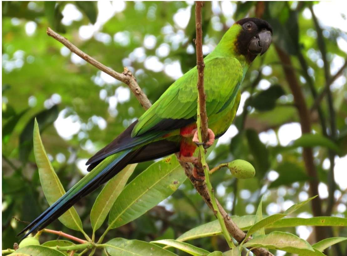
Nanday Parakeet

Large-billed Tern Phaetusa simplex Pantanal. Rock Dove (introduced) Columba livia Towns, cities. Scaled Pigeon Patagioenas speciosa Chapada dos Guimarães. Picazuro Pigeon Patagioenas picazuro Minas Gerais, Chapada and Alta Floresta. Pale-vented Pigeon Patagioenas cayennensis Cipó, Pantanal and Chapada. Plumbeous Pigeon Patagioenas plumbea Seen at Cipó.