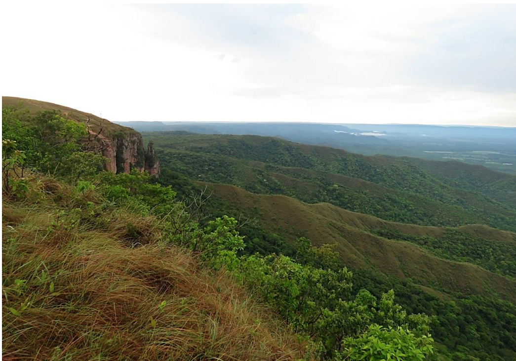
Viewpoint in Chapada dos Guimarães