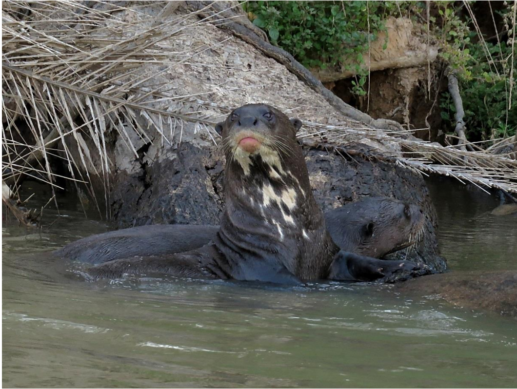
Giant Otter