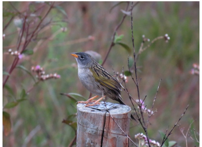
Lesser Grass Finch