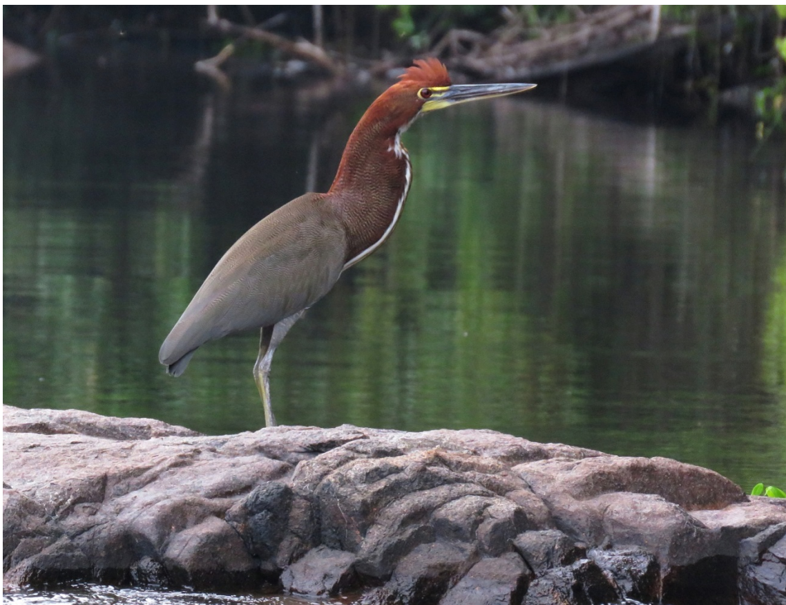
Rufescent Tiger Heron

Red-winged Tinamou Rhynchotus rufescens Seen at Canastra and Chapada dos Guimarães. Spotted Nothura Nothura maculosa Seen at Canastra NP. Dwarf Tinamou ◊ Taoniscus nanus (H) Heard at Canastra NP. Southern Screamer Chauna torquata Pantanal. White-faced Whistling Duck Dendrocygna viduata On way to Rio Azul Lodge. Black-bellied Whistling Duck Dendrocygna autumnalis Pantanal. Muscovy Duck Cairina moschata Canastra, Pantanal and the Amazon. Brazilian Teal (B Duck) Amazonetta brasiliensis Pantanal and the Amazon. Brazilian Merganser ◊ Mergus octosetaceus A couple after a long search in Canastra NP. Chaco Chachalaca ◊ Ortalis canicollis Pantanal, common. Speckled Chachalaca Ortalis guttata On way to Rio Azul Lodge. Spix's Guan Penelope jacquacu At Rio Azul and Cristalino. Dusky-legged Guan ◊ Penelope obscura At Canastra NP. Chestnut-bellied Guan ◊ Penelope ochrogaster Pantanal. Blue-throated Piping Guan Pipile cumanensis Pantanal. Red-throated Piping Guan ◊ Pipile cujubi Pantanal, Rio Azul and Cristalino.