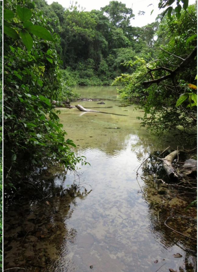
Clear water spring at Rio Azul Lodge