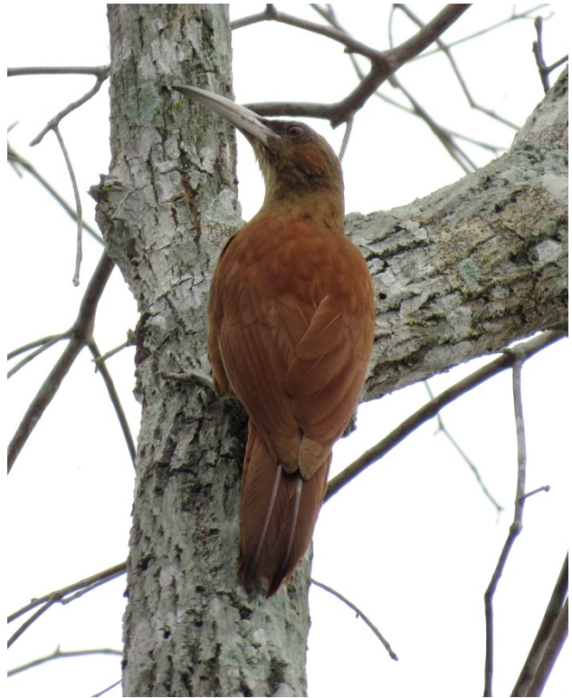
Great Rufous Woodcreeper