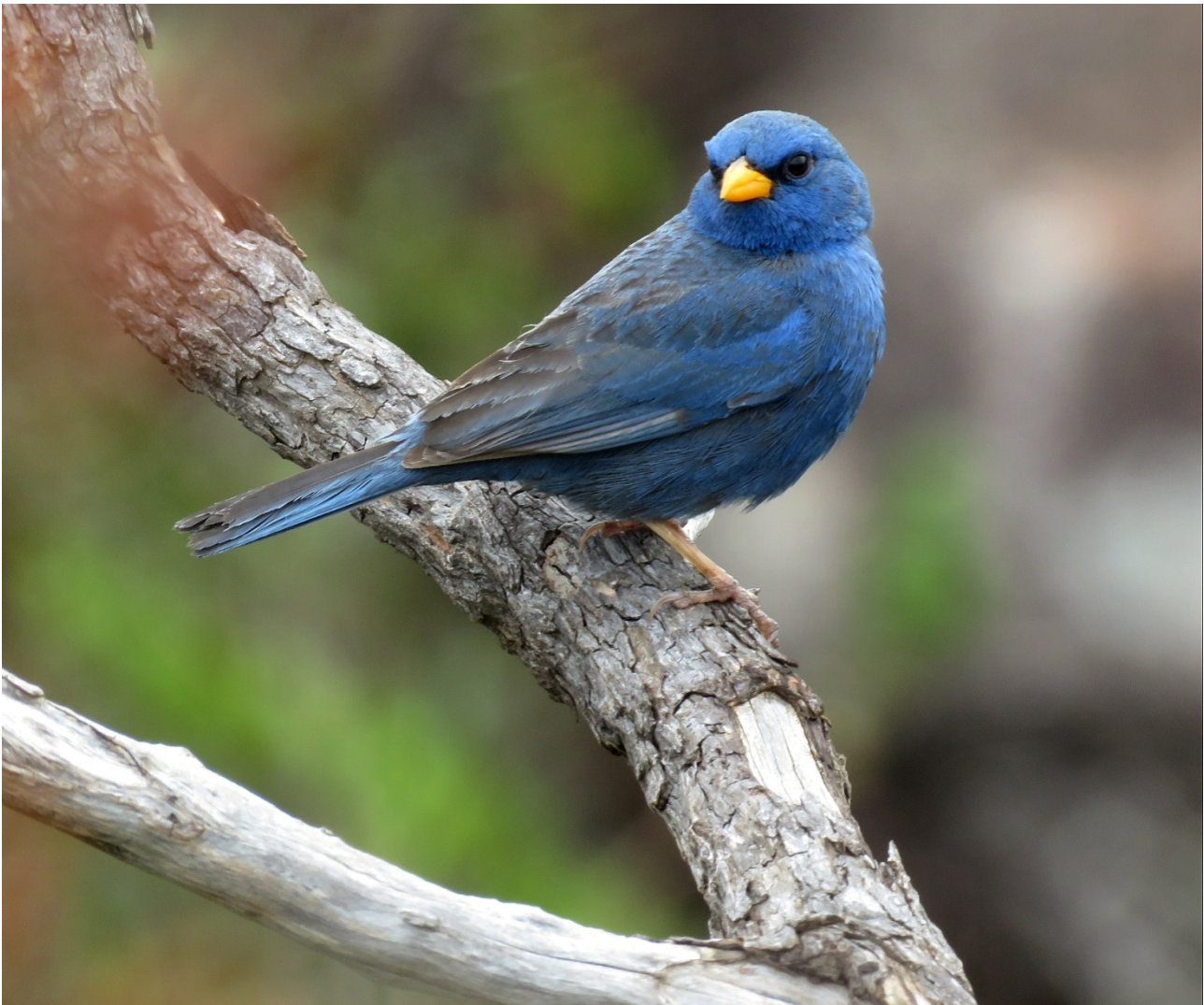
The astonishing male Blue Finch from the rocky savannas of Brazilian Cerrado (Eduardo Patrial)