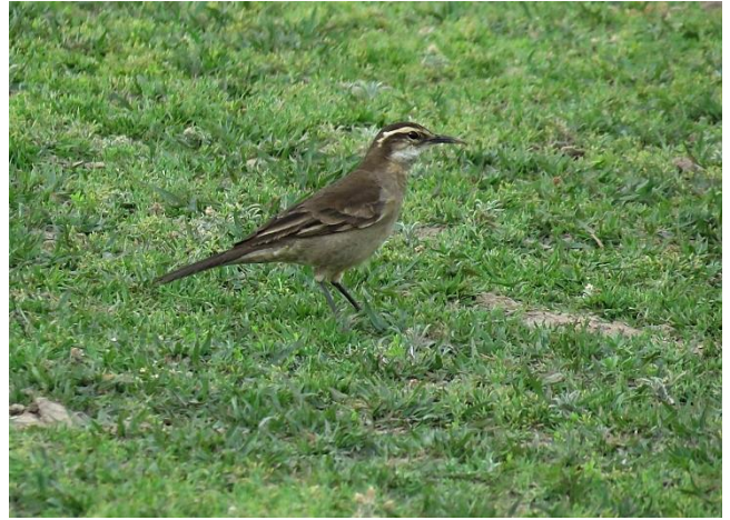
Long-tailed Cinclodes (Cipo C) [espinhacensis]