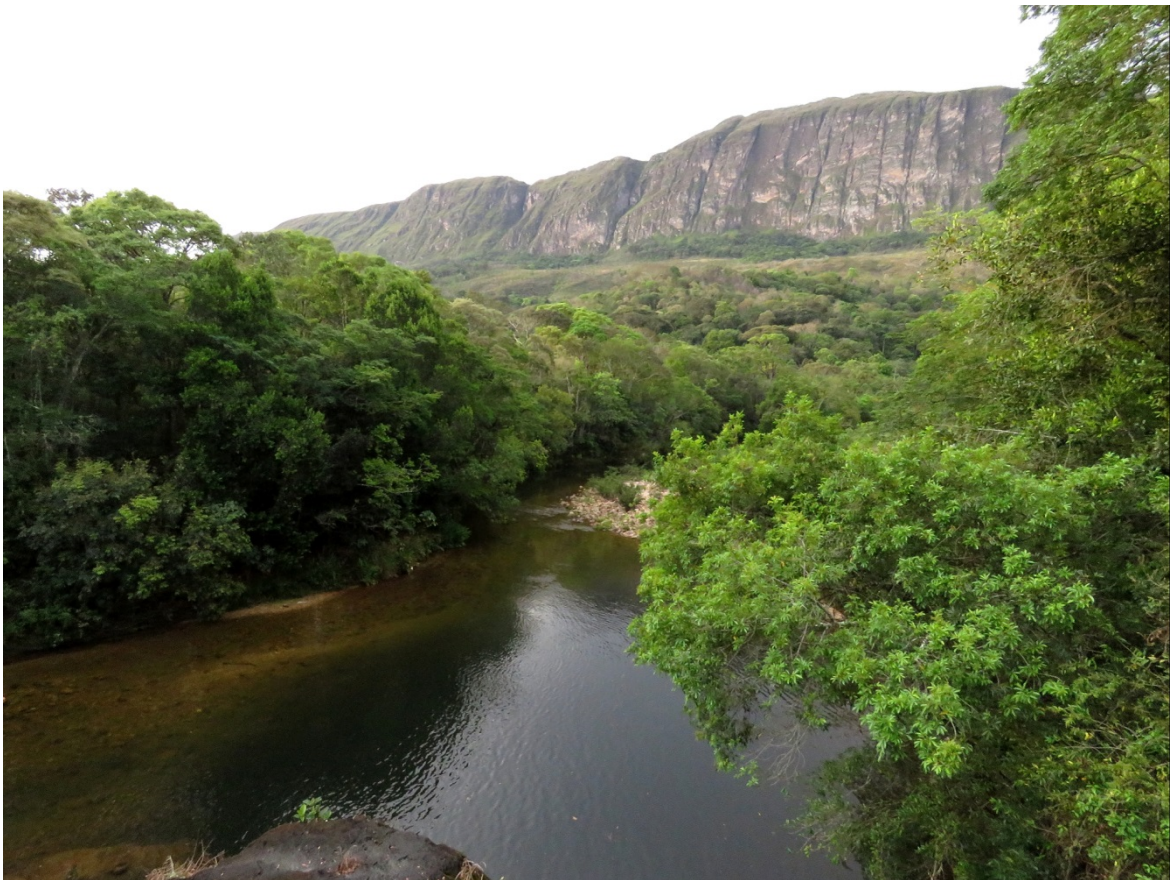
São Francisco River and the big wall of Canastra