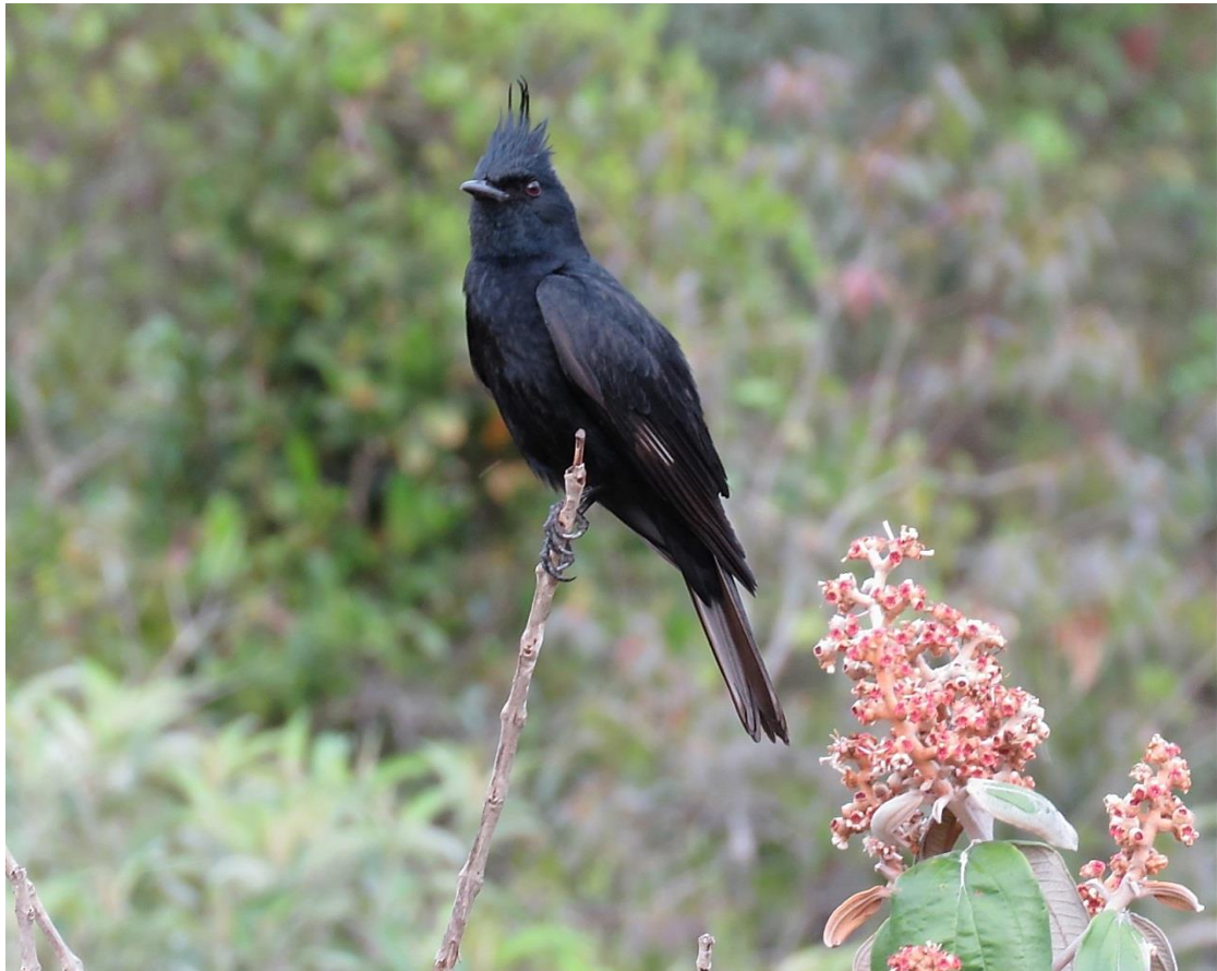
Crested Black Tyrant

Yellow-crowned Amazon (Y-c Parrot) Amazona ochrocephala At Rio Azul Lodge. Turquoise-fronted Amazon (Blue-f A, T-f Parrot) Amazona aestiva Pantanal. Kawall's Amazon ◊ (K Parrot) Amazona kawalli (H) Heard at Cristalino. Orange-winged Amazon (O-w Parrot) Amazona amazonica Pantanal and Rio Azul. Dusky-billed Parrotlet Forpus modestus (H) Heard at Cristalino. Blue-winged Parrotlet Forpus xanthopterygius Canastra and Cipó. White-bellied Parrot Pionites leucogaster Seen at Rio Azul and Cristalino. Red-fan Parrot Deropterus accipitrinus Cristalino Lodge. Maroon-bellied Parakeet Pyrrhura frontalis Seen well at Canastra. Crimson-bellied Parakeet ◊ Pyrrhura perlata Flight view from tower 2 at Cristalino Lodge.