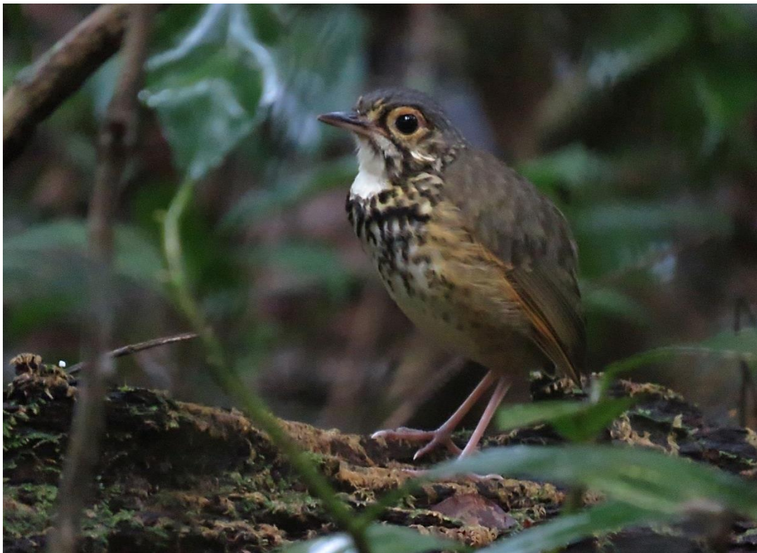
Alta Floresta Antpitta