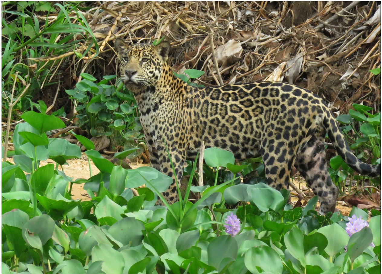
The Jaguars provided again a great show on this tour, here some of the best shots of the two young brothers found in the morning ride