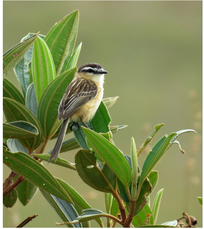
Sharp-tailed Grass Tyrant