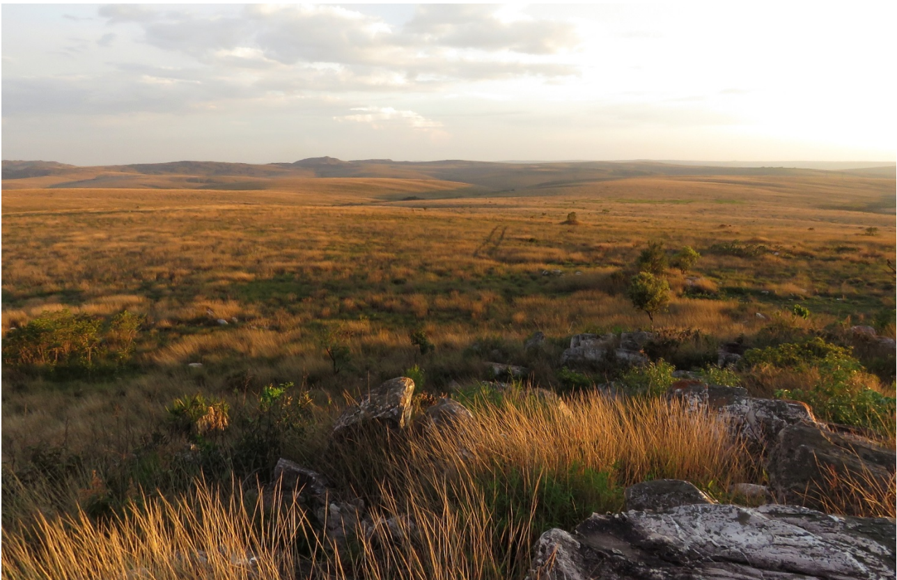
Canastra National Park (Eduardo Patrial)

Zimmer's Tody-Tyrant ◊ Hemitriccus minimus (H) Heard at Rio Azul. Stripe-necked Tody-Tyrant ◊ Hemitriccus striaticollis Pantanal. Pearly-vented Tody-Tyrant Hemitriccus margaritaceiventer Cipó and Pantanal. Short-tailed Pygmy Tyrant Myiornis ecaudatus (H) Heard at Rio Azul and Cristalino. Helmeted Pygmy Tyrant Lophotriccus galeatus (H) Same as above. Ochre-faced Tody-Flycatcher Poecilatriccus plumbeiceps (H) Heard at Cipó. Rusty-fronted Tody-Flycatcher ◊ Poecilatriccus latirostris Pantanal. Spotted Tody-Flycatcher Todirostrum maculatum Ariosto Island, Cristalino Lodge. Yellow-lored Tody-Flycatcher ◊ (Grey-headed T-F) Todirostrum poliocephalum Canastra. Common Tody-Flycatcher Todirostrum cinereum Pantanal. Yellow-browed Tody-Flycatcher Todirostrum chrysocrotaphum (H) Heard at Rio Azul and Cristalino. Olivaceous Flatbill Rhynchocyclus olivaceus A nice one at Cristalino. Yellow-olive Flatbill (Y-o Flycatcher) Tolmomyias sulphurescens Pantanal. Grey-crowned Flatbill (G-c Flycatcher) Tolmomyias poliocephalus (H) Heard at Rio Azul and Cristalino. Ochre-lored Flatbill (Yellow-breasted F) Tolmomyias flaviventris Seen at Rio Azul. Golden-crowned Spadebill Platyrinchus coronatus (H) Heard at Cristalino.