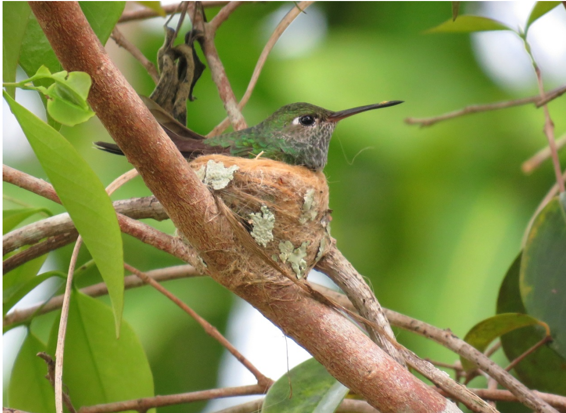
Glittering-throated Emerald

Pygmy Antwren Myrmotherula brachyuran Rio Azul Lodge. Amazonian Streaked Antwren Myrmotherula multostriata Rio Azul and Cristalino. Slater's Antwren ◊ Myrmotherula sclateri (H) Heard at Rio and Cristalino. White-flanked Antwren Myrmotherula axillaris (H) Heard at Rio Azul. Long-winged Antwren Myrmotherula longipennis (H) Heard at Cristalino. Grey Antwren Myrmotherula menetriesii Rio Azul and Cristalino. Southern White-fringed Antwren Formicivora grisea Rio Azul Lodge. Black-bellied Antwren ◊ Formicivora melanogaster Piuval Lodge, Pantanal. Rusty-backed Antwren Formicivora rufa Pantanal. Saturnine Antshrike ◊ Thamnomanes saturninus Rio Azul and Cristalino. Cinereous Antshrike Thamnomanes caesius Seen at Cristalino Lodge. Black-capped Antwren Herpsilochmus atricapillus At Cipó. Large-billed Antwren ◊ Herpsilochmus longirostris Pantanal. Rufous-winged Antwren Herpsilochmus rufimarginatus (H) Heard at Rio Azul. Plain Antvireo Dysithamnus mentalis Seen at Canastra and Pantanal. Barred Antshrike Thamnophilus doliatus Pantanal. Chestnut-backed Antshrike Thamnophilus palliatus Cristalino Lodge. Plain-winged Antshrike Thamnophilus schistaceus Cristalino Lodge. Natterer's Slaty Antshrike ◊ Thamnophilus stictocephalus Rio Azul Lodge.