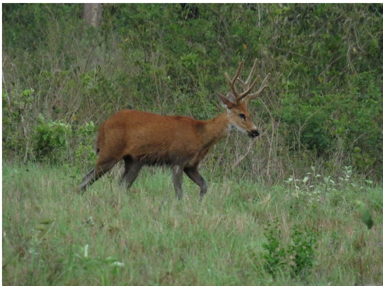
Marsh Deer