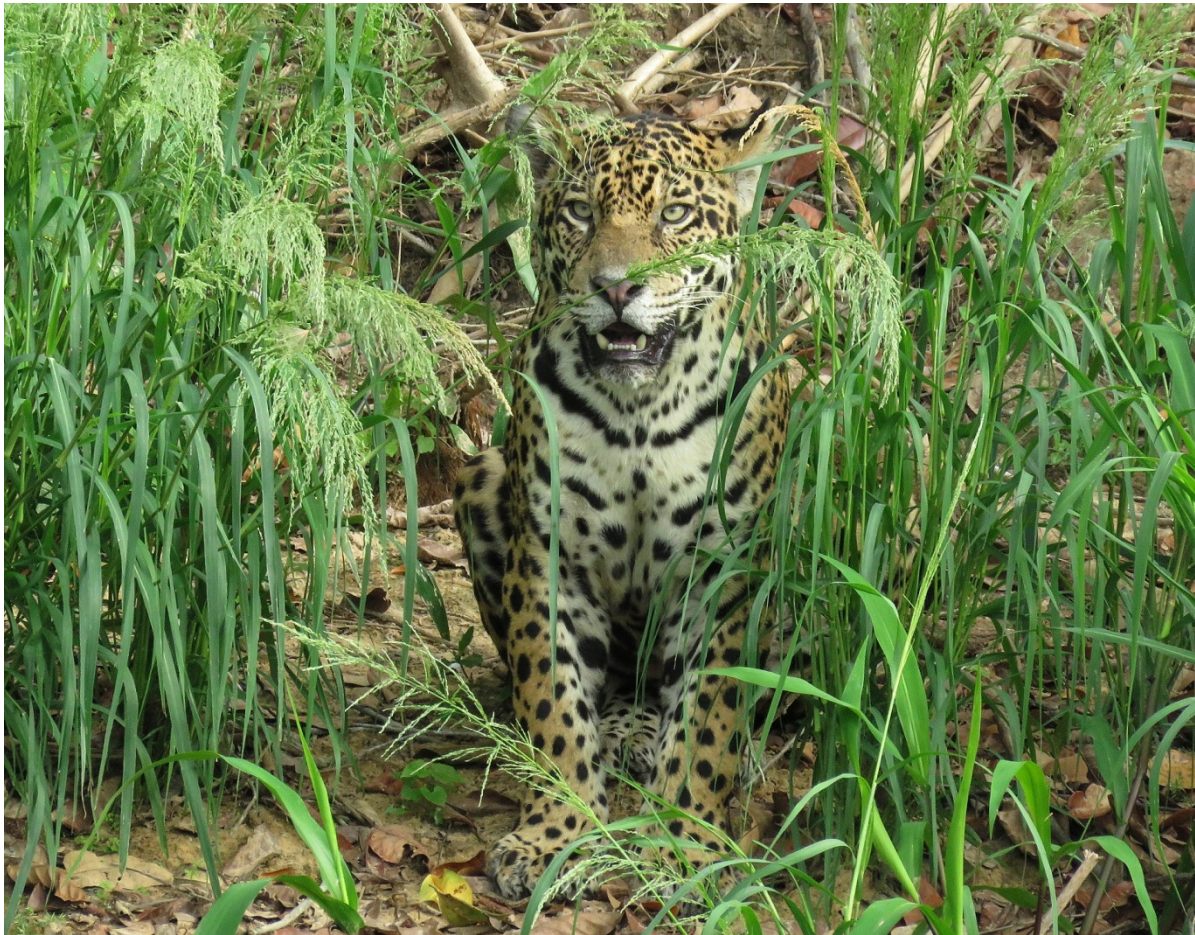
Jaguar (Eduardo Patrial)

Red Pileated Finch (Red-crested F) Coryphospingus cucullatus Chapada dos Guimarães. Blue Finch ◊ (Yellow-billed B F) Porphyrospiza caerulescens Canastra and Cipó. Long-tailed Reed Finch Donacospiza albifrons Serra do Cipó. Cinereous Warbling Finch ◊ (Grey-and-white W-F) Poospiza cinerea Canastra and Cipó. Saffron Finch Sicalis flaveola Common. Wedge-tailed Grass Finch Emberizoides herbicola Canastra and Cipó. Lesser Grass Finch ◊ Emberizoides ypiranganus A nice one at Serra do Cipó. Pampa Finch (Great P F) Embernagra platensis Seen in Canastra NP. Serra Finch ◊ (Pale-throated Pampa-F) Embernagra longicauda Serra do Cipó. Slate-colored Grosbeak (S-c Saltator) Saltator grossus (H) Heard at Cristalino. Buff-throated Saltator Saltator maximus Chapada dos Guimarães. Green-winged Saltator Saltator similis Minas Gerais. Greyish Saltator Saltator coerulescens Pantanal. Black-throated Saltator ◊ Saltator atricollis Canastra, Cipó and Chapada. Blue-black Grassquit Volatinia jacarina Noticed at most places. Plumbeous Seedeater Sporophila plumbea Canastra, Cipó and Chapada. Rusty-collared Seedeater Sporophila collaris Pantanal. Lined Seedeater Sporophila lineola Pantanal. Yellow-bellied Seedeater Sporophila nigricollis Cipó. Dubois's Seedeater ◊ Sporophila ardesiaca Canastra and Cipó. Chestnut-bellied Seed Finch (Lesser S F) Oryzoborus angolensis Pantanal. Bananaquit Coereba flaveola At most places.