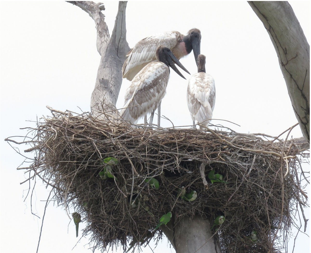
Jabiru and Monk Parakeet nests