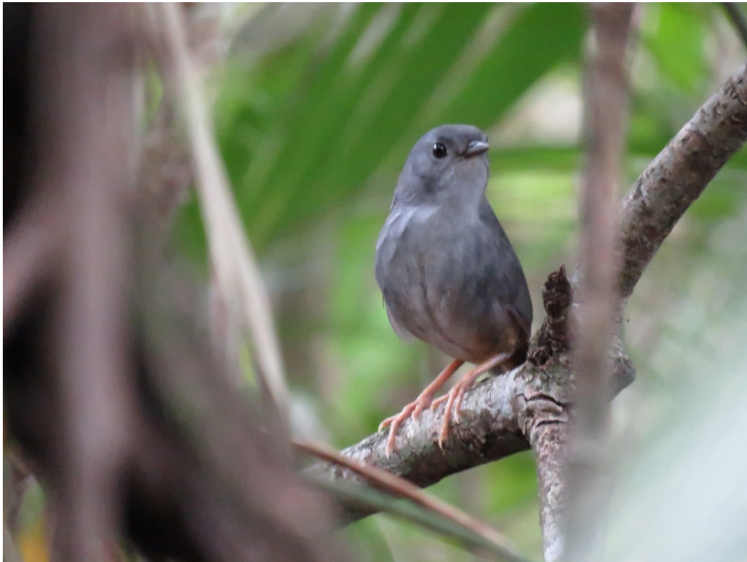
Brasilia Tapaculo (Eduardo Patrial)

Green-backed Becard Pachyramphus viridis Pantanal. White-winged Becard Pachyramphus polychopterus (H) Heard at Canastra. Black-capped Becard Pachyramphus marginatus (H) Heard at Cristalino. Rufous-browed Peppershrike Cyclarhis gujanensis Seen in Chapada. Slaty-capped Shrike-Vireo Vireolanius leucotis (H) Heard in the Amazon. Red-eyed Vireo Vireo olivaceus Pantanal and Rio Azul. Grey-eyed Greenlet ◊ Hylophilus amaurocephalus Seen at Cipó. Grey-chested Greenlet ◊ Hylophilus semicinereus (H) Heard at Rio Azul and Cristalino.