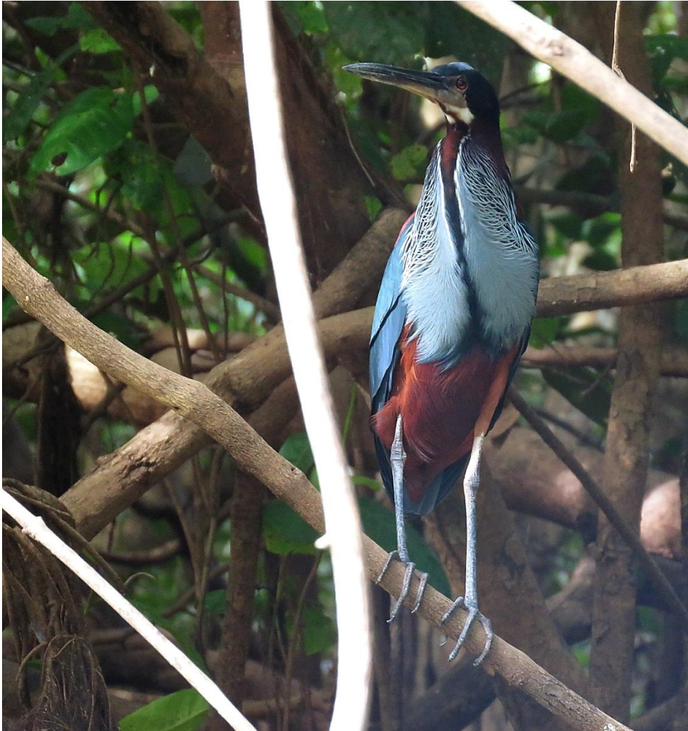
Agami Heron

Surucua Trogon ◊ Trogon surrucura Canastra NP. Collared Trogon Trogon collaris (H) Heard at Rio Azul and Cristalino. American Pygmy Kingfisher Chloroceryle aenea Transpantaneira Road, Pantanal. Green-and-rufous Kingfisher Chloroceryle inda Pixaim River, Pantanal. Green Kingfisher Chloroceryle americana Pantanal and Amazon. Amazon Kingfisher Chloroceryle amazona Cipó, Pantanal and Amazon. Ringed Kingfisher Megaceryle torquata Canastra, Pantanal and Amazon. Amazonian Motmot Momotus momota Sightings at Chapada dos Guimarães.