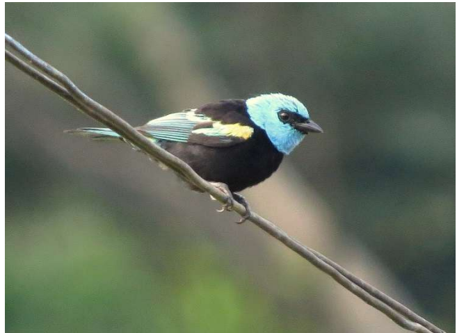
The lake at Floresta Amazônica Hotel is an easy birding spot with great species, such as Blue-winged Macaw and Blue-necked Tanager (Eduardo Patrial)