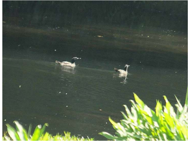
The low part of Canastra is a great place for Helmeted Manakin ; and for its most dependent and noble inhabitant, the endangered Brazilian Merganser