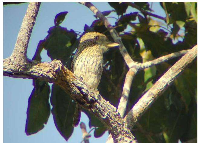
The beautiful Black-girdled Barbet and the shy Striolated Puffbird were some of the highlights on our first day at Cristalino