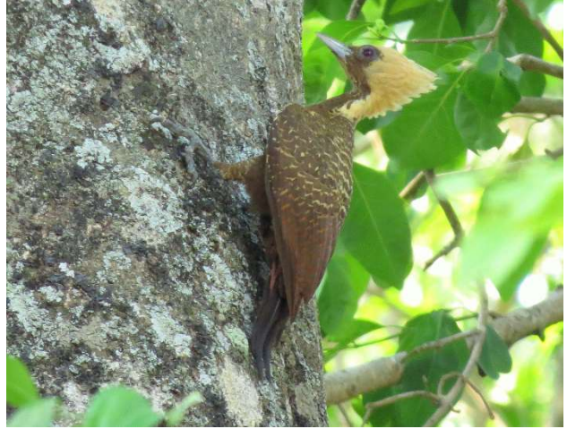
Some of the frequent species found in the peculiar woodlands of Piuvai: Ferruginous Pygmy Owl and Pale-crested Woodpecker (Eduardo Patrial)