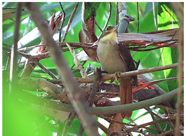
Some special birds on the last few hours at Cristalino: Collared Puffbird for the first time on this tour; and here a poor shot of the specialist Bamboo Foliage-gleaner