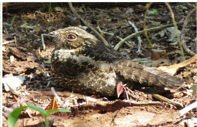
Bare-faced Curassow is tame by the lodge's garden while the nice Secret Garden is good for Blackish Nightjar (Eduardo Patrial)

October 18 th . We had a busy morning on our first day at Cristalino. After an early breakfast we took the boat up river to the Serra II Trail, a place which combines tall forest and a hilly rocky outcrop at its end. On our way by the river we spotted Razor-billed Curassow and Red-throated Piping Guan. Birding the tall dense forest was not easy but we managed to see a lot of good birds such as the endemics Xingu Scale-backed and Spix's Warbling Antbirds, the mighty Long-billed Woodcreeper, Gould's Toucanet, Cinereous and Plain-winged Antshrikes, colourful Green-and-gold and Yellow-backed Tanagers, a couple of the amazing Black-girdled Barbet, Dot-winged Antwren, a female Snow-capped Manakin and superb views of the endemic Alta Floresta Antpitta. We also had good time on the outcrop with Purple Honeycreeper, the cryptic Striolated Puffbird, Santarem Parakeets in flight, Short-tailed and Mato Grosso Swifts and the small Tooth-billed Wren. Back to get the boat we saw a female Collared Trogon. Still in the morning we checked the entrance of Dr. Haffer's Trail. We tried hard for Bronzy Jacamar but only managed hearing it in the canopy. Returning to the lodge we saw King Vulture and some of the common birds along the river. In the afternoon we started with a nice couple of the endemic Glossy Antshrike right at the floating deck. Then our boat trip down the river