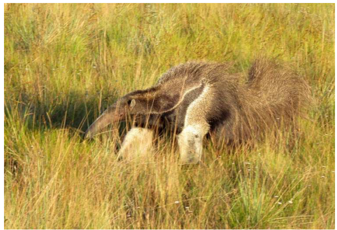
Always nice to see the little endemic Grey-backed Tachuri; this close view of Giant Anteater was an unforgettable moment (Eduardo Patrial)