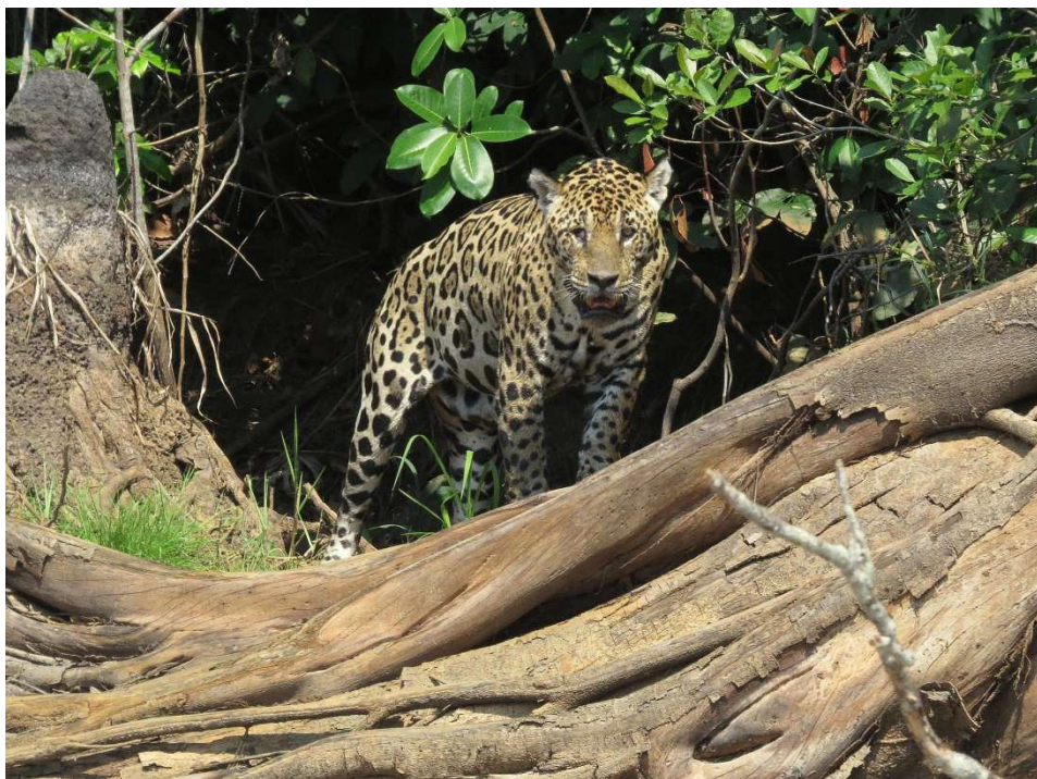
Jaguar (Eduardo Patrial)

Flame-crested Tanager Tachyphonus cristatus Seen at Chapada and Cristalino Lodge. White-shouldered Tanager Tachyphonus luctuosus Same as above. Ruby-crowned Tanager ◊ Tachyphonus coronatus Seen at Canastra. White-winged Shrike-Tanager Lanio versicolor Wonderful view of pair having a bath at Pocinha, Cristalino. Silver-beaked Tanager Ramphocelus carbo Common at Chapada, Pantanal and Cristalino. Blue-grey Tanager Thraupis episcopus Aristo Island, Cristalino Lodge and hotel in Alta Floresta. Sayaca Tanager Thraupis sayaca Common along main tour. Palm Tanager Thraupis palmarum Several sightings along the tour. Shrike-like Tanager ◊ (White-banded T) Neothraupis fasciata First at Canastra, more at Chapada. Turquoise Tanager Tangara mexicana Few sightings at Cristalino. Paradise Tanager Tangara chilensis Seen from Tower 1, Cristalino Lodge. Green-and-gold Tanager Tangara schrankii Great views along Serra 2 Trail, Cristalino Lodge. Bay-headed Tanager Tangara gyrola (H) Heard few times at Cristalino Lodge. Burnished-buff Tanager Tangara cayana Common at Canastra, Cipó and Chapada. Blue-necked Tanager Tangara cyanicollis Good views at Serra 2 Trail, Cristalino and Alta Floresta. Swallow Tanager Tersina viridis Seen at Canastra, Cipó and Chapada. Blue Dacnis Dacnis cayana Several sightings along the tour. Purple Honeycreeper Cyanerpes caeruleus Fantastic yellow legs! Few sightings at Cristalino Lodge.