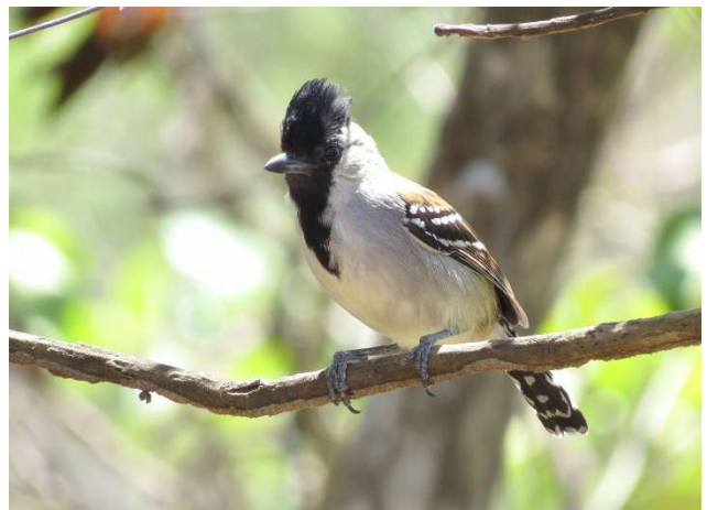
The Cerrado at Cipó is very good for the nice Checkered Woodpecker; and a real surprise in that area was this cracking male Silvery-cheeked Antshrike, an endemic gift from NE Brazil