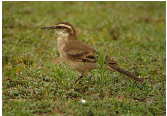
Two other appreciated localized endemics found that day at Cipo: lacking the tail, Serra Finch; and for the first time on a Birdquest tour, Long-tailed Cinclodes, ssp. espinhacensis (Eduardo Patrial)