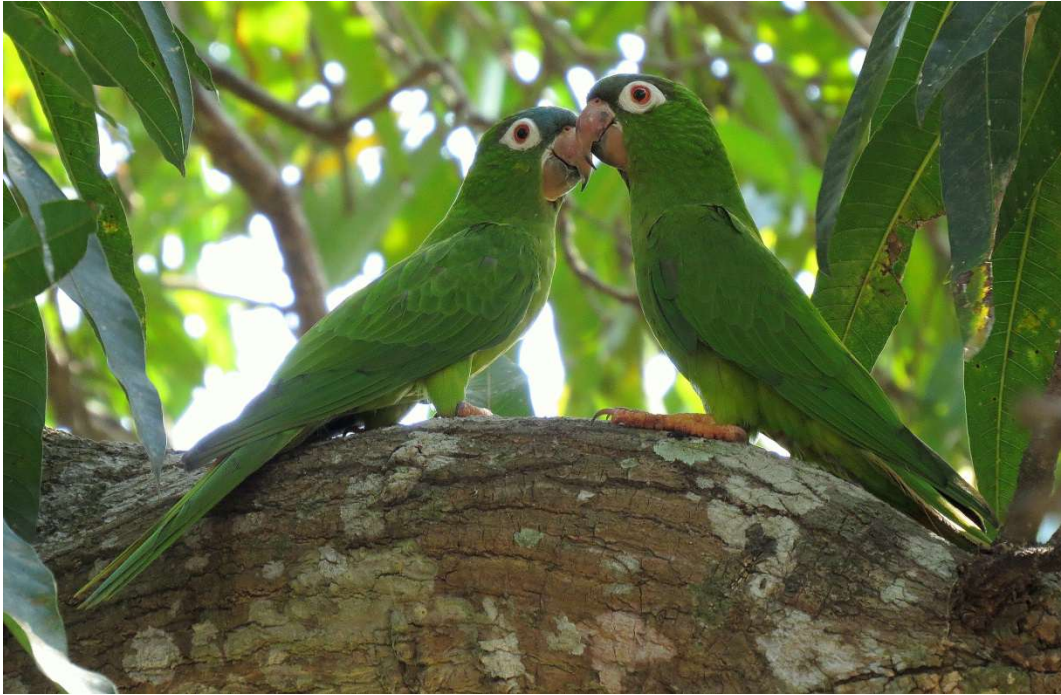
Blue-crowned Parakeet (Eduardo Patrial)

Chestnut-winged Hookbill Ancistrops strigilatus Seen in mixed flock, Cristalino Lodge. Rufous-rumped Foliage-gleaner Philydor erythrocerum (H) Heard once in mixed flock at Cristalino Lodge. Buff-fronted Foliage-gleaner Philydor rufum Good view at Canastra NP, low part. Bamboo Foliage-gleaner (Dusky-cheeked F-G) Anabazenops dorsalis Last morning target well seen at Cristalino. Buff-throated Foliage-gleaner Automolus ochrolaemus Seen on Rocky Trail, Cristalino Lodge. White-eyed Foliage-gleaner ◊ Automolus leucophthalmus Seen at Canastra NP, low part. Henna-capped Foliage-gleaner ◊ (Chestnut-c F-G) Hylocryptus rectirostris Again at stakeout in Cipó, mega! Sharp-tailed Streamcreeper Lochmias nematura (H) Only heard at Canastra N P.