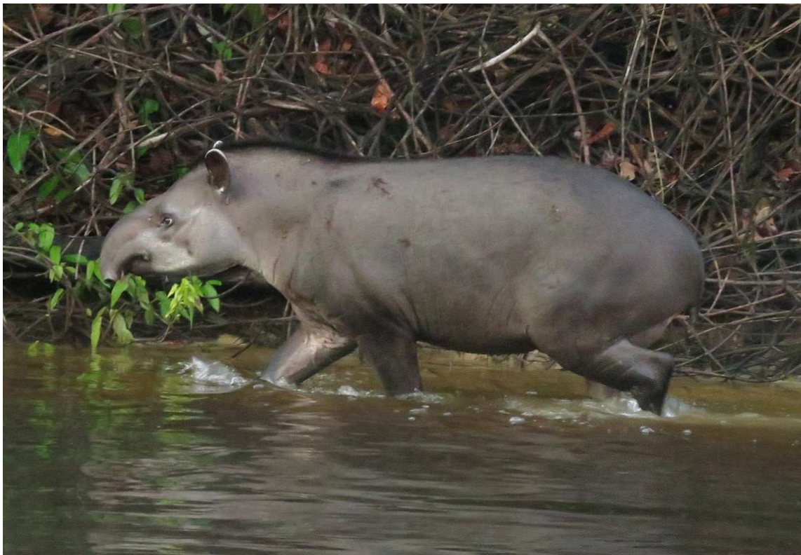
Lowland (Brazilian) Tapir (Eduardo Patrial)

Six-banded Armadillo (Yellow A) Euphractus sexcinctus One crossing the road near Poconé. Giant Anteater Myrmecophaga tridactyla Superb views at Canastra NP, high part. Southern Tamandua Tamandua tetradactyla An amazing encounter after breakfast at Cristalino Lodge. Black-tufted Marmoset ◊ Callithrix penicillata Now common on the feeder at Hotel in Canastra. Silvery Marmoset Mico argentata Great view of a group at Floresta Amazônica Hotel, Alta Floresta. Emilia's Marmoset ◊ Mico emiliae Great view at Francisco's Trail, Cristalino Lodge. Black-tailed Marmoset Mico melanura Seen well at Piuval Lodge, Pantanal. Tufted Capuchin (Brown C Monkey) Sapajus paella Seen few times at Cristalino Lodge. Black-striped Capuchin Sapajus libidinosus Seen at Piuval Lodge, Pantanal. Black Howler Alouatta caraya Good views at Pantanal. Spix's Red-handed Howler ◊ Alouatta discolor (H) Heard at Cristalino.