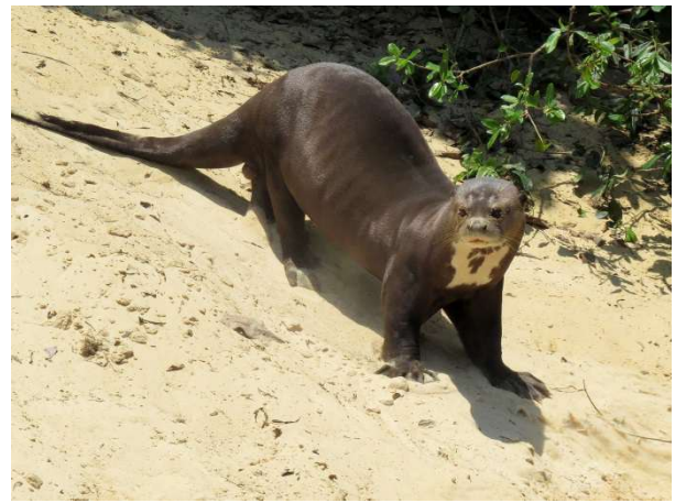
The Piquiri River is a great place to find the amazing Giant Otter