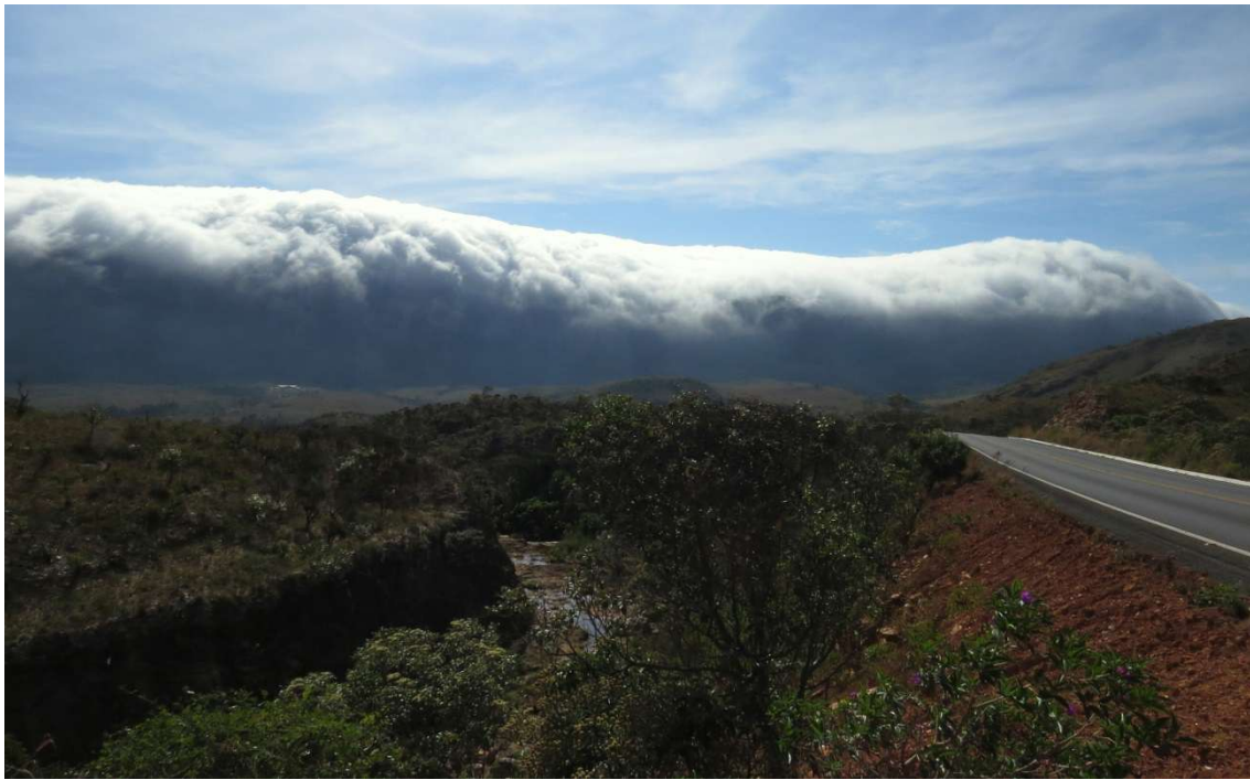
Hills of Cipó covered in clouds (Eduardo Patrial)