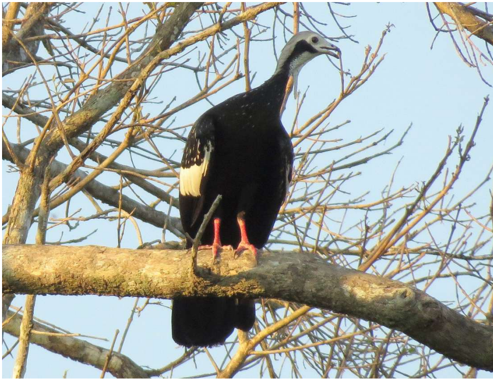
Blue-throated Piping Guan (Eduardo Patrial)