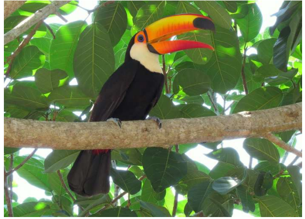
The marshes at Campo Jofre are good for Little Cuckoo as the garden of Porto Jofre Hotel is for Toco Toucan (Eduardo Patrial)