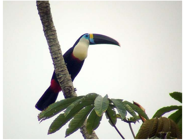
Common Potoo could easily have passed unnoticed on the trail; while White-throated Toucan is commonly seen from the viewpoint of Serra I