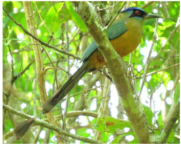
The shy Pheasant Cuckoo incredible was our first observation at Vale da Benção; abundant in the forests of Chapada, Amazonian Motmot is always a nice bird to see