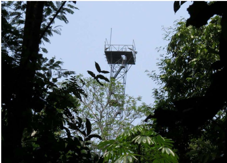
Tower 1 seen from the Trail, Cristalino Lodge

Hooded Tanager Nemosia pileata Seen at Cipó and Pantanal. Orange-headed Tanager Thlypopsis sordida A brief view in flight at Lapinha da Serra, Cipó. White-rumped Tanager ◊ Cypsnagra hirundinacea Seen at Canastra and Chapada. Grey-headed Tanager Eucometis penicillata Great views at Chapada and Pantanal.