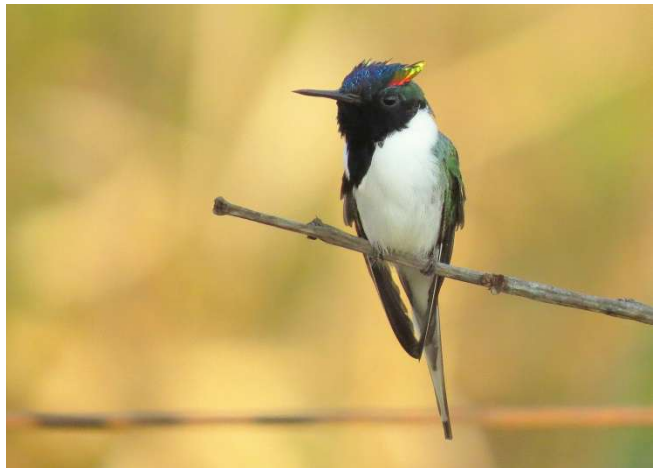
Our stake-out for the uncommon Henna-capped Foliage-gleaner is still very reliable; and the show provided this time by the fabulous Horned Sungem