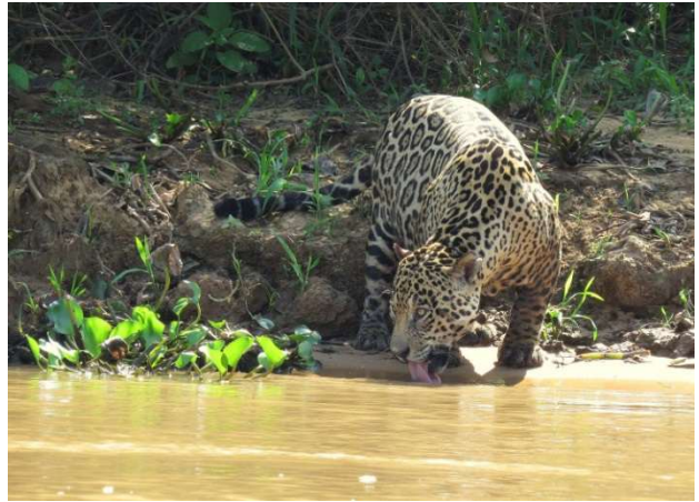
Amazing Jaguar sightings on this day! Here our first female amazingly captured in the air (left) and our first male (right) drinking water from the river