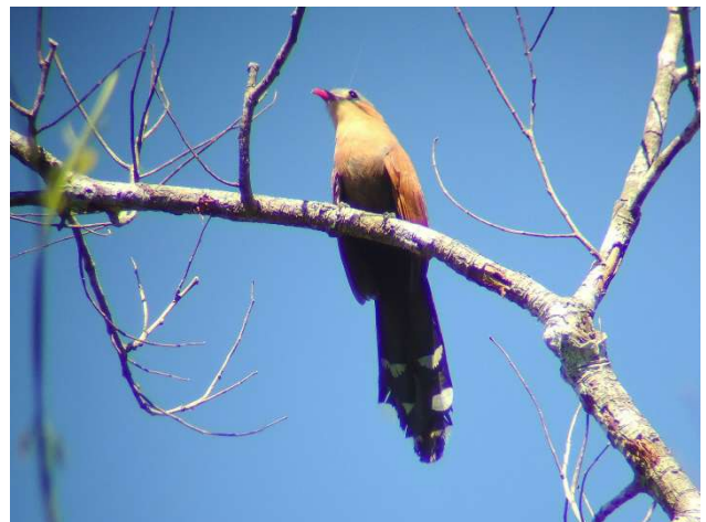
More from Tower II: Double-toothed Kite and Black-bellied Cuckoo (Eduardo Patrial)