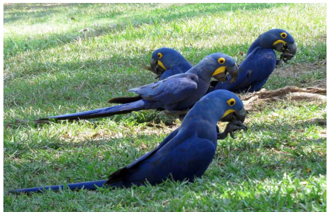
Hyacinth Macaw can be watched that close at Porto Jofre Hotel's grounds (Eduardo Patrial)