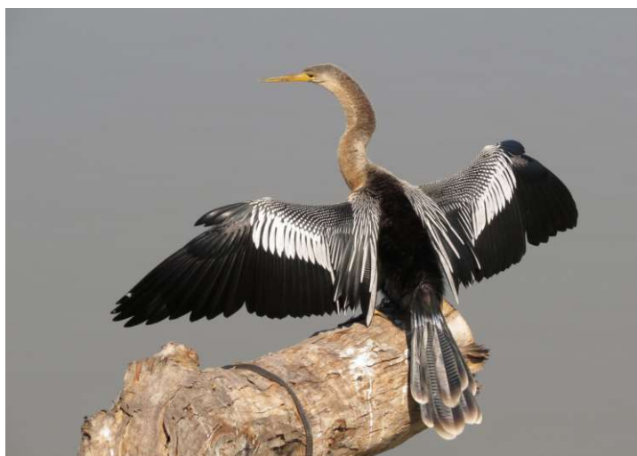
Anhinga

Razor-billed Curassow ◊ Mitu tuberosum Just one seen by the Cristalino river.