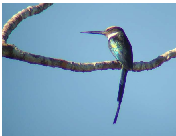
Two beautiful and frequently spotted birds from Tower 1: Spangled Cotinga and Paradise Jacamar (Eduardo Patrial)