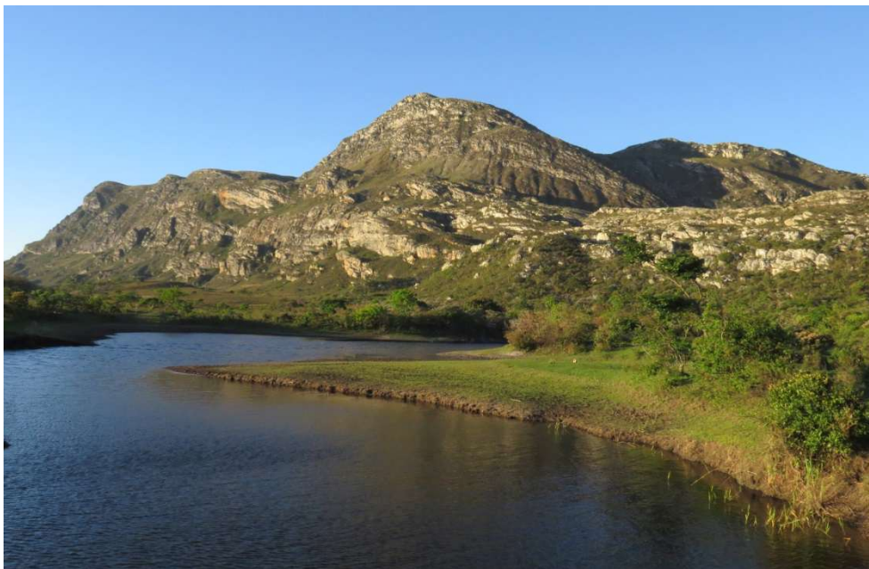
The fascinating landscape at Lapinha da Serra (Eduardo Patrial)

October 9 th . On this day we had a full morning for a last exploration at the Cipó area. By early morning we covered the road to Serra Morena which comprises a beautiful rocky Cerrado habitat and also some narrow