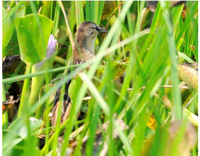
Uncommon in northern Pantanal, White-fronted Woodpecker (Eduardo Patrial); Yellow-breasted Crake was a fantastic encounter (photo by Tim Marlow)