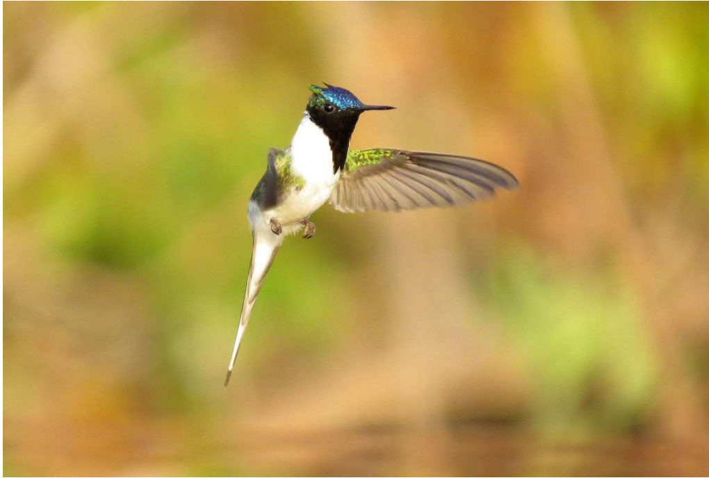
Horned Sungem