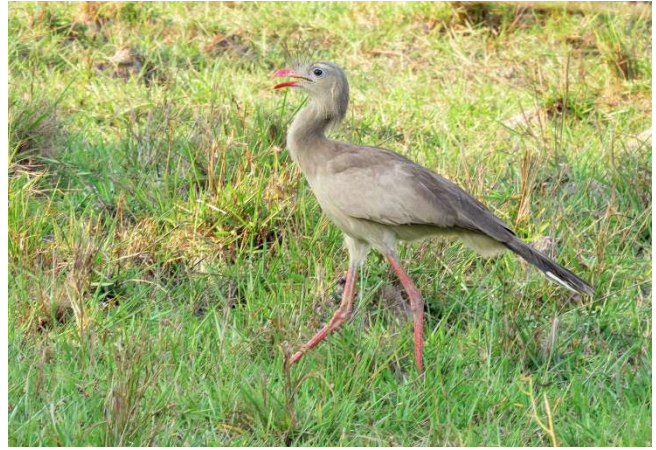
We just couldn't leave the Transpantaneira without a good view of Great Black Hawk; and arriving at Piuval Lodge, the Red-legged Seriema (Eduardo Patrial)

October 16 th . We had a wonderful time on our last main tour's day at Piuval. We spent the day birding different types of woodland, dry forests, and edges of marshes, a good combination that rewarded us some unusual records from Pantanal. First we started early with a pair of White-fronted Woodpecker followed later by an unexpected Ochre-cheeked Spinetail. We also saw Black-bellied Antwren, Black-tailed Marmoset, South American Coati, the secretive Rufous-sided Crake, and by the edge of the lagoon, the skulking Least Bittern and for the first time at Pantanal, the diminutive Yellow-breasted Crake. One of us (Warren) still found a Great Potoo roosting in that morning. It was really hot in the afternoon but we had a lovely time in some forest and later on the top of an observation tower. We certainly enjoyed some nice birds as Ferruginous Pygmy Owl, Hyacinth Macaws, Pale-crested Woodpecker, Black-fronted Nunbird, Orange-backed Troupial, Great Rufous Woodcreeper, Black-backed Water Tyrant and also some primates as Black-striped Capuchin and Black Howler; besides a typically beautiful Pantanal sunset. At dusk we transferred ourselves to Tainá hotel in Cuiabá, having a Six-banded Armadillo across the road on the way.