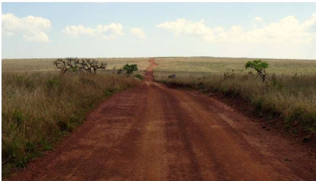
Dirt road and grassland at Canastra National Park (Eduardo Patrial)

October 7 th . Before heading to our next destination, the hills of Cipó, we spent the morning covering some different places at the low part of Canastra around São Roque. It was productive with good sightings of several nice birds. At our first place close to a slope we saw a good number of Curl-crested Jays, Toco Toucans, Swallow Tanagers, Pale-breasted Spinetail, White-tailed Hawk, White-vented Violetear, an amazing obliging male Blue Finch and Southern Beardless Tyrannulet. Later at a marsh near São Roque we found the lovely Streamer-tailed Tyrant, Peach-fronted Parakeet, Black-capped Donacobius, Green-barred Woodpecker, Yellow-chinned Spinetail, Savanna Hawk, Anhinga, more Toco Toucans and finally the uncommon Campo Miner (a stake-out from the Jaguars and Birds tour). Our transfer to Cipó took the whole afternoon and we arrived at the nice Pousada Monjolos at 7:30 pm.