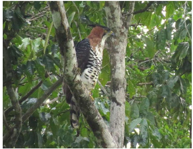
Our arrival at Cristalino Lodge couldn't be better! What a view we got of this adult Ornate Hawk-Eagle (Eduardo Patrial)