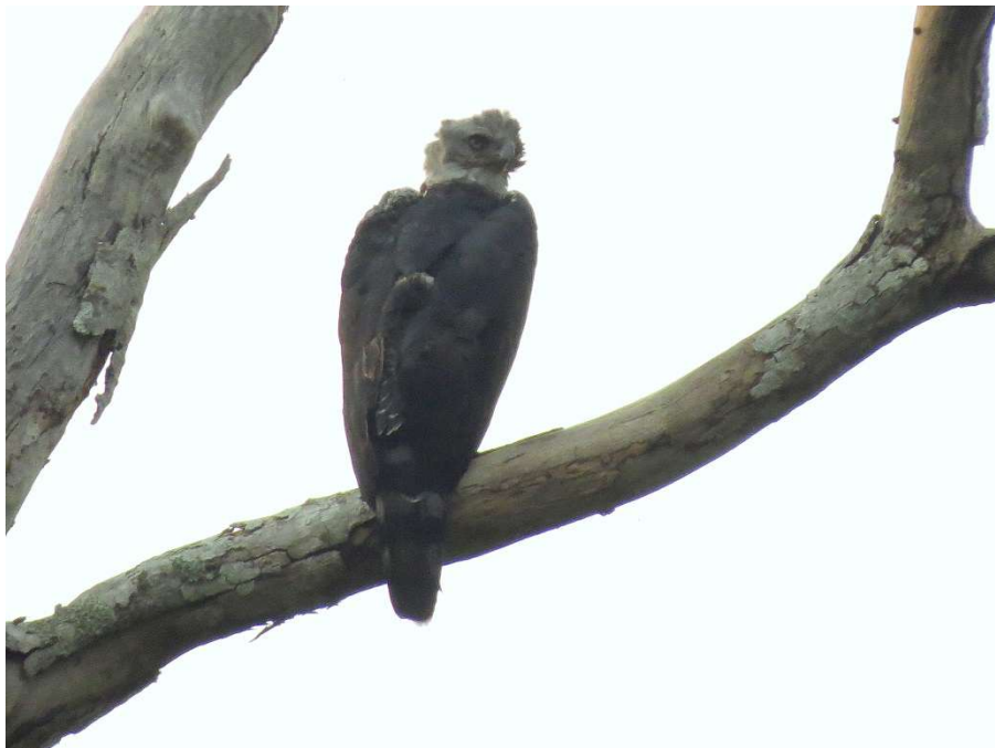
Harpy Eagle (Eduardo Patrial)

Cock-tailed Tyrant ◊ Alectrurus tricolor Great views of a good number at Canastra N P, high part. Long-tailed Tyrant Colonia colonus Seen at Canastra and Cristalino Lodge. Cattle Tyrant Machetornis rixosa Several sightings along the main tour. Piratic Flycatcher Legatus leucophaeus Seen at Chapada and Pantanal. Rusty-margined Flycatcher Myiozetetes cayanensis Seen at Pantanal and Cristalino. Social Flycatcher Myiozetetes similis Seen at Canastra. Dusky-chested Flycatcher Myiozetetes luteiventris Seen from Serra 2 Trail, Cristalino Lodge. Great Kiskadee Pitangus sulphuratus Common throughout the tour. Lesser Kiskadee Philohydor lictor Good views at Pantanal and Alta Floresta. Streaked Flycatcher Myiodynastes maculatus Seen at Canastra and Pantanal. Boat-billed Flycatcher Megarynchus pitangua Seen at Pantanal. Sulphury Flycatcher Tyrannopsis sulphurea A nice pair at Chapada dos Guimarães. Variiegated Flycatcher Empidonomus varius Seen at Chapada. Tropical Kingbird Tyrannus melancholicus Common throughout the tour. Fork-tailed Flycatcher Tyrannus savana Several sightings along the main tour. Greyish Mourner Rhytipterna simplex (H) Heard at Cristalino Lodge.