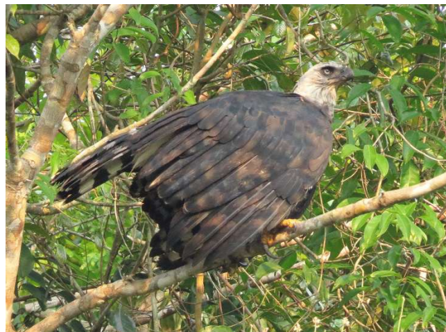
Some superb birds of prey seen on that day at Cristalino: Crested Owl at daytime roost and the impressive Harpy Eagle (Eduardo Patrial)