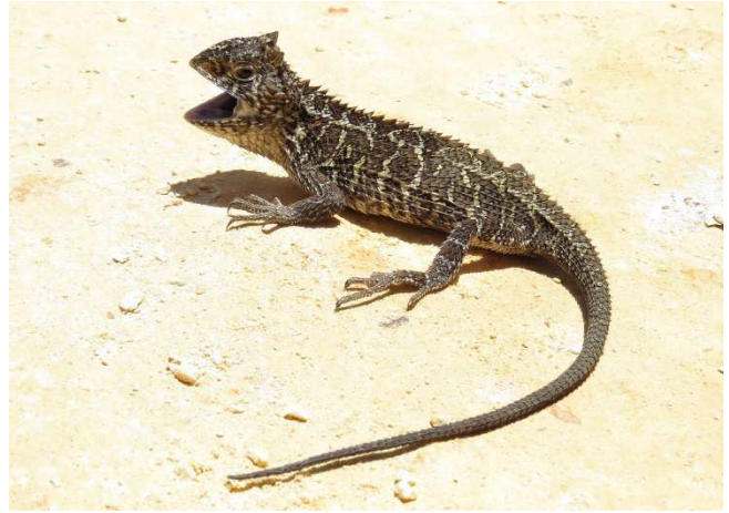
The central-Brazilian endemic White-striped Warbler is a fine bird from gallery forests; and the notorious lizard Stenocercus sp., an usual encounter that couldn't pass unnoticed