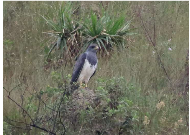
A top highlight, the rare endemic Cinereous Warbling Finch; and the superb view we had of Black-chested Buzzard-Eagle