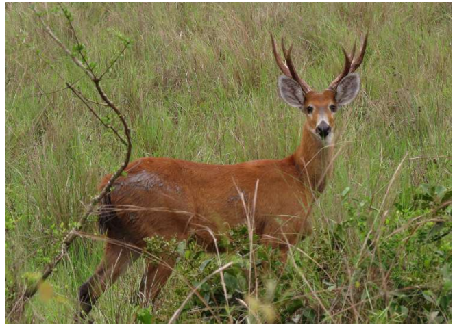
Some classic sightings at Pantanal: a Jabiru nest and the imposing male Marsh Deer (Eduardo Patrial)