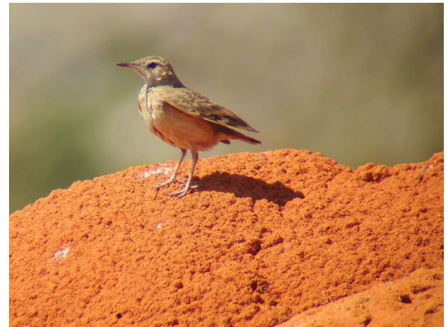
The fantastic Streamer-tailed Tyrant is always a most wanted species; the uncommon Campo Miner was possible thanks to a previous found on the Jaguars and Birds Tour (Eduardo Patrial)