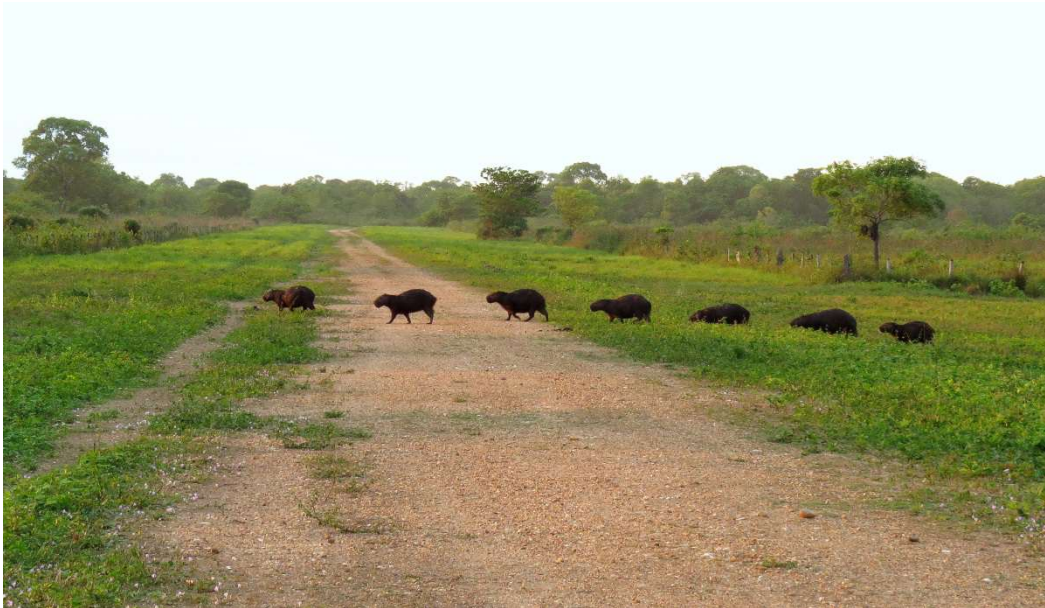
Capybaras in row (Eduardo Patrial)

Rufous-sided Crane Laterallus melanophaius Seen at Piuval Lodge, Pantanal. Grey-breasted Crane Laterallus exilis Fantastic views near Porto Jofre Hotel, Pantanal. Grey-necked Wood Rail Aramides cajaneus Common at Pantanal. Yellow-breasted Crane Porzana flaviventer Amazing views at Piuval Lodge, Pantanal.