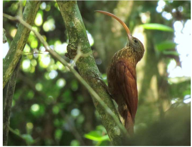
Later in the gallery forest our time was productive. Here a male Band-tailed Antbird and fascinating Red-billed Scythebill