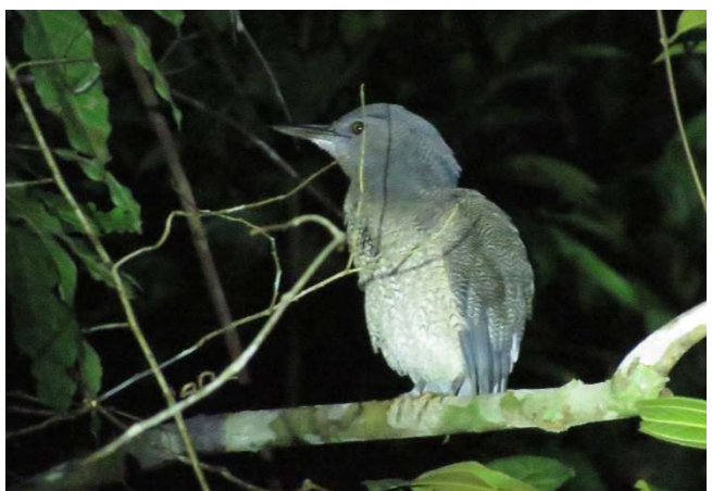
Brazilian Tapir was definitely a highlight that afternoon; and for the second time on the tour, Zigzag Heron (Eduardo Patrial)

October 21 st . We started nicely our morning on the way to Tower II spotting a handsome Blue-necked (B-cheeked) Jacamar. Later on the trail we had rapid but good view of a male Long-winged Antwren. Before climbing the tower we spent some time at its base watching two incredible and uncommon species: first was the singular Banded Antbird with its proper way to behave on the forest floor. The massive Uniform