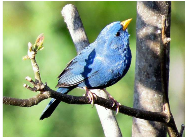
Two nice Cerrado specialties: Curl-crested Jay and the stunning male Blue Finch (Eduardo Patrial)