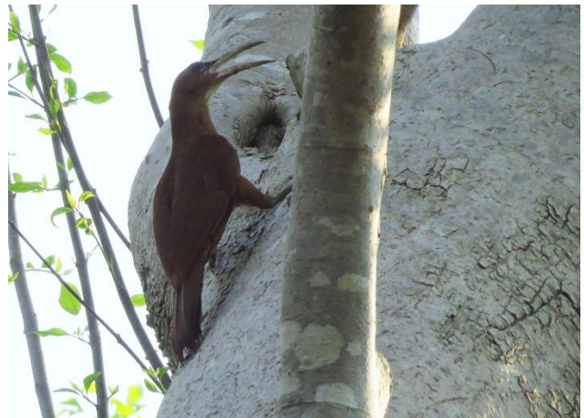
The forest along Santa Isabel road is replete of nice birds: Bat Falcon and Great Rufous Woodcreeper (Eduardo Patrial)