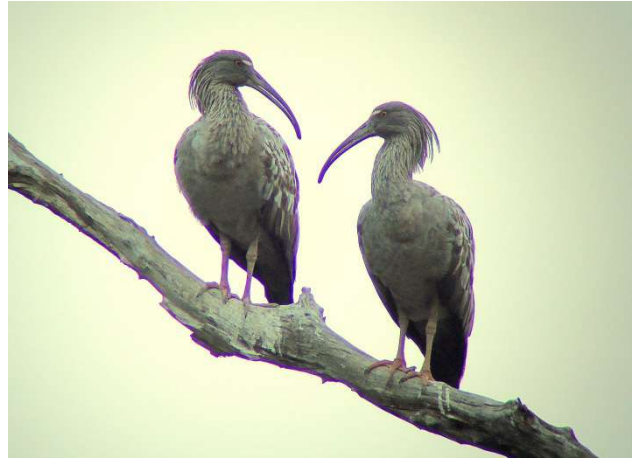
Two nice species commonly found along the road Transpantaneira: Grey-necked Wood Rail and Plumbeous Ibis (Eduardo Patrial)