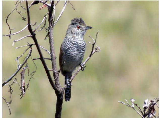
The localized and uncommon endemic Cipo Canastero was the best reward after a good hiking morning; amongst some other birds that morning we had this nice male Rufous-winged Antshrike (Eduardo Patrial)