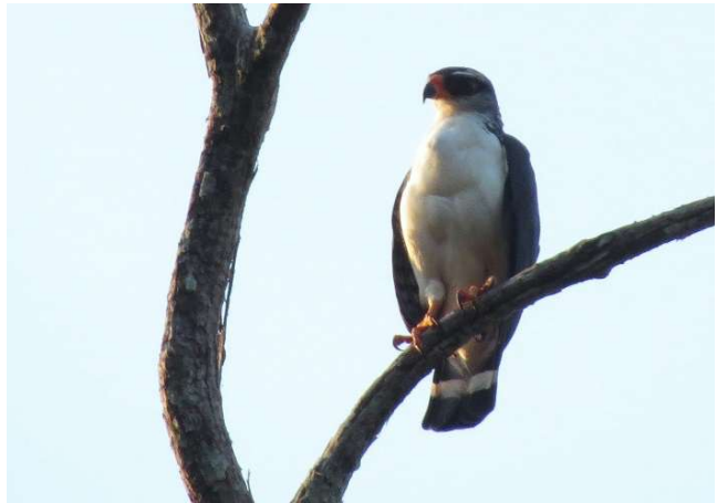
We had a good time at Cocoa Trail in the afternoon: male Snow-capped Manakin and the uncommon White-browed Hawk