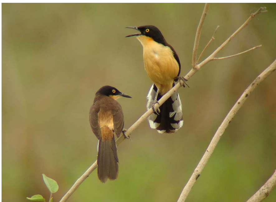
Black-capped Donacobius