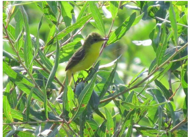
At Campo Jofre we saw some interesting Passerines such as this nice male Lined Seedeater and the tiny Subtropical Doradito (Eduardo Patrial)