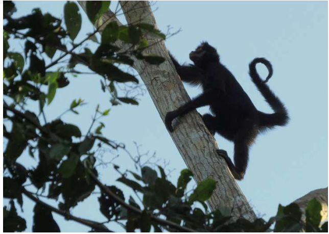
We also spotted some pretty cool mammals along the river and at Brazil-nut Trail: Proboscis Bat and the endemic White-cheeked (Whiskered) Spider-Monkey