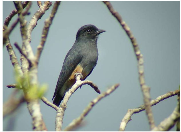
A little obscured, Razor-billed Curassow was spotted on the riverbank; and very common by the river, Swallow-winged Puffbird (Eduardo Patrial)