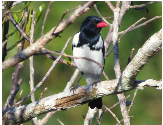
Tower II always provides good views of great birds: Curl-crested Aracari (left) and Red-billed Pied-Tanager (right)