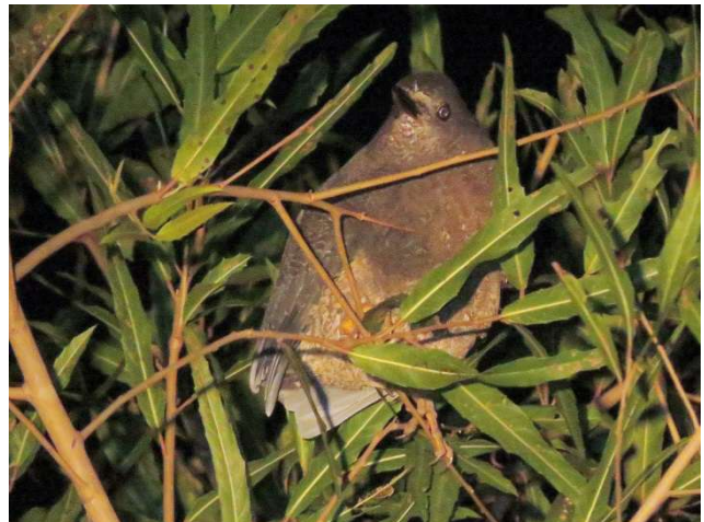
We had an excellent time along the Pixaim River: American Pygmy Kingfisher and the mysterious Zigzag Heron