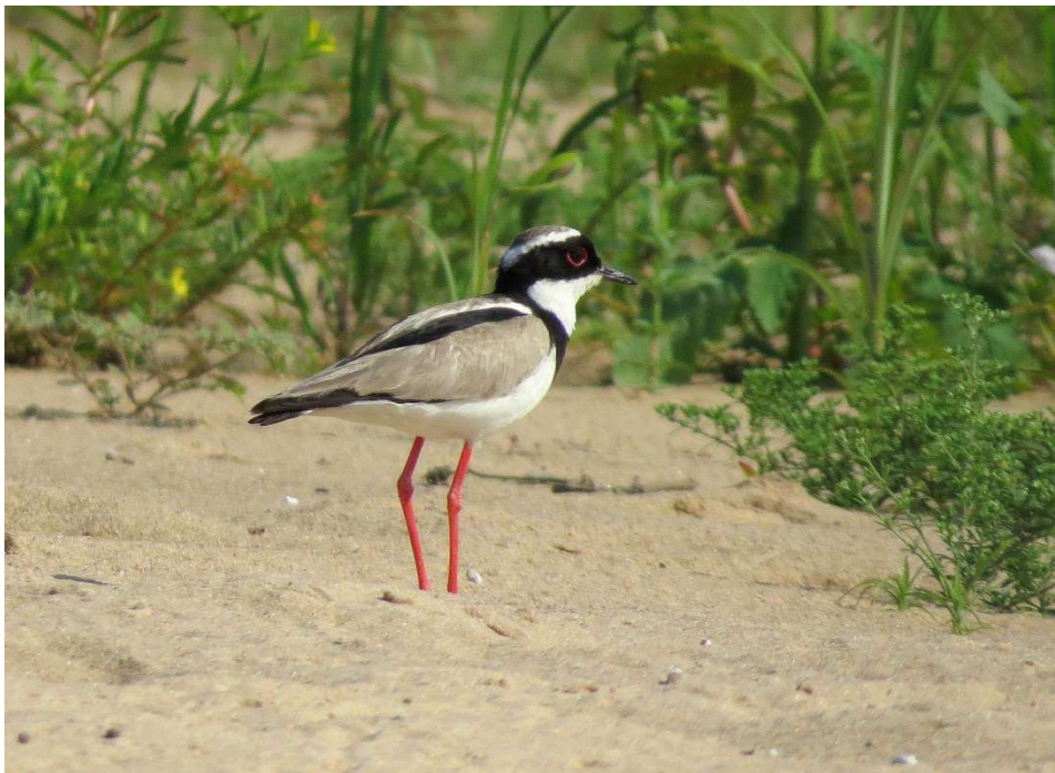
Pied Plover (Eduardo Patrial)