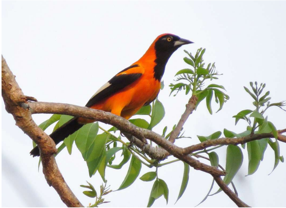
Orange-backed Troupial (Eduardo Patrial)