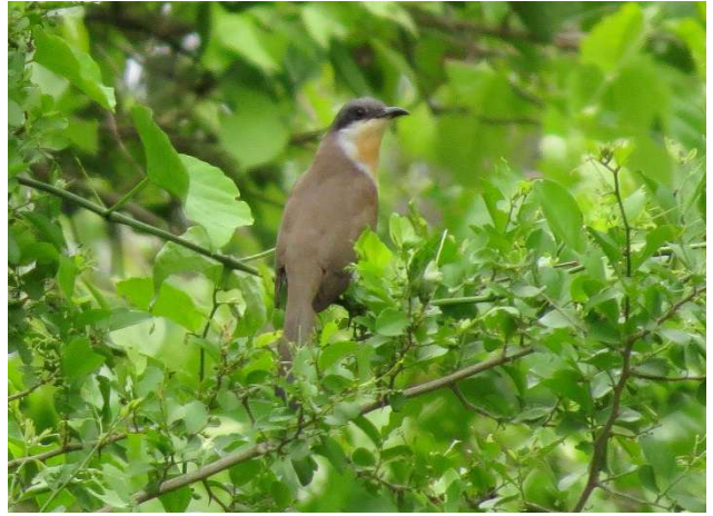
A few time spent in woodland provided some great birds such as this smart White-eyed Attila and the seasonal Dark-billed Cuckoo