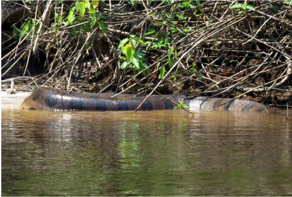
A big Green Anaconda at Cristalino River was a nice surprise for after-lunch

October 23 rd . We had few hours in the morning at Cristalino Lodge before we head to Floresta Amazônia Hotel in Alta Floresta. So right after breakfast we walked the Rocky and part of Francisco's Trail, being very productive by the way. Our notable records were the uncommon Collared Puffbird, a couple of Red-necked Woodpecker, the specialist Bamboo Foliage-gleaner (Dusky-cheeked F-g), two Brown-banded Puffbirds, Yellow-shouldered Grosbeak, White-eyed Antwren, Buff-throated Foliage-gleaner, a closely heard (again!) Cryptic Forest Falcon and a group of the uncommon endemic Emilia's Marmoset. We said goodbye to the amazing Cristalino and transferred ourselves to Alta Floresta for lunch. In the afternoon we started doing the trail in the good forest fragment at the hotel. We heard Elegant Woodcreeper and saw a male Southern Chestnut-tailed Antbird and Purus Red Howler, but suddenly a wind storm came strongly and finished with any possibility to keep birding. Later we had a nice dinner with some beers and 'caipirinhas' to celebrate this fantastic tour.