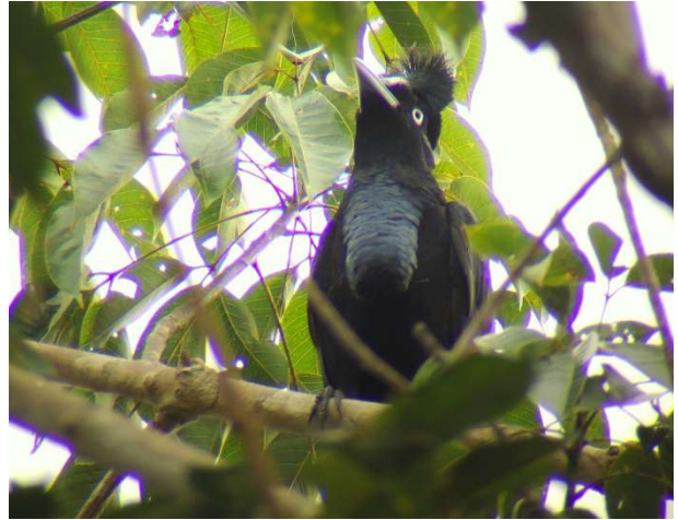
This beautiful sunrise on the Teles Pires River was followed by breath-taking views of Amazonian Umbrellabird