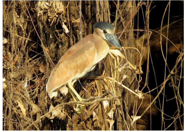
We had a nice time at Negrinho tributary river: White-lipped Peccary family and the odd Boat-billed Heron

October 15 th . On this following day we had a full morning at the Jofre area so we decided to cover the huge floodable fields called Campo Jofre, an amazing array of marshy habitats where we started very nicely with superb views of the skulking Grey-breasted Crake. Later on we enjoyed good views of White-tailed Goldenthrout, Lined Seedeater, Little Cuckoo, Cinereous-breasted Spinetail, the tiny Subtropical Doradito, Rusty-collared Seedeater, a group flying of Black-bellied Whistling Duck, a day roost of Great Horned Owl and mammals as Brazilian Guinea-Pig and Marsh Deer. Back to the hotel we spent some time in the garden watching Toco toucans, Buff-necked Ibis, White Woodpeckers and of course, Hyacinth Macaws. We said goodbye to Porto Jofre after lunch and headed towards the beginning of Transpantaneira Road, our next stay was the fine Piuval Lodge. On our way we finally spotted Great Black Hawk, White-faced Whistling and Muscovy Ducks, Roseate Spoonbill, some Greater Rheas and arriving at Piuval, some close Red-legged Seriemas. Birding the last rays of light at the fantastic area of Piuval Lodge we saw Orange-winged Amazon perched and heard Cinnamon-throated Hermit and Rufous-sided Crake. We also went owling but without any success this time. In the evening after dinner we had an amazing night-driving safari with some great mammals spotted – Crab-eating Fox, Tapeti (Brazilian Cottontail), Grey Brocket, the elusive Ocelot and the good-looking Crab-eating Racoon.