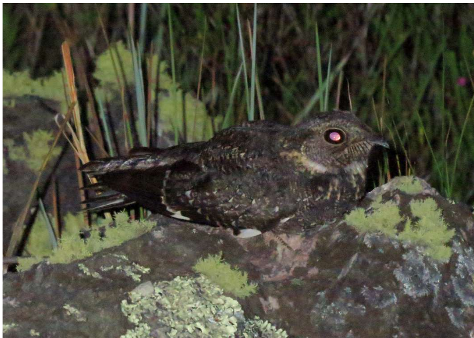
After dusk we had this Band-winged Nightjar