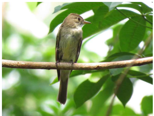
At the hilltop we saw the smart Pied Puffbird, and for the first time on this trip, the migrant Eastern Wood Pewee