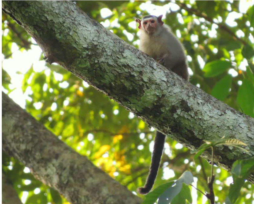
And a special mammal, the endemic Emilia's Marmoset

October 24 th . The early morning at Floresta Amazônica Hotel was very birdy and we could catch up with some last target species. We started with a pair of Cinnamon-throated Woodcreeper by the forest edge behind the rooms. Later we checked the good lake beside the forest which concentrates an amazing array of parrots, macaws and some other birds. There we recorded Red-and-green, Scarlet, Blue-and-yellow, Chestnut-fronted and Blue-winged Macaws, Yellow-crowned and Mealy Amazons, Blue-head Parrot, Short-tailed Hawk, Hook-billed and Plumbeous Kites, Chestnut-eared and Lettered Aracaris, Green-backed and Black-tailed Trogons, Yellow-tufted Woodpecker, Lesser Kiskadee and the stunning Blue-necked Tanager. We also got nice views of Peruvian Spider-Monkeys by the lake. After that we did the forest trail, where we collected a brief but close view of Elegant Woodcreeper and much nicer looks at Southern Chestnut-tailed Antbird. By the end of the trail we struggled to see a Red-fawn Parrot that was calling in the canopy, which moved later towards the lake. We ran for that area but unfortunately couldn't find it. On the other hand we found a group of Silvery Marmosets that finished this unforgettable trip to Brazil.