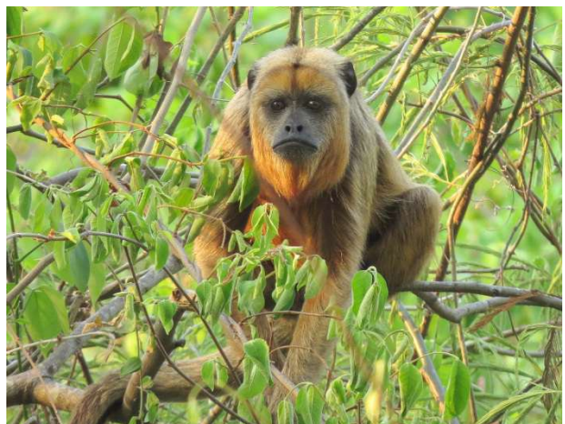
Piuvai Lodge always provides some mammals: South American Coati and a female Black Howler

October 17 th . As our internal flight to Alta Floresta was about noon we had a morning off to get fully recovered for our tour extension at Cristalino Lodge. We arrived in Alta Floresta near two pm. A van from Cristalino Lodge collected us at the airport and immediately transferred our group to the bank of the Teles Pires River, the place we get the boat to reach Cristalino. The trip by car lasted around one hour on a dirt road. We crossed a strong but quick storm on the way and by some pasture area we saw a few Red-