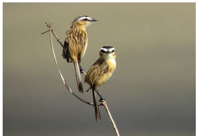
Two fantastic Tyrant species from the grasslands of Canastra: Cock-tailed Tyrant and Sharp-tailed Grass Tyrant (Eduardo Patrial)