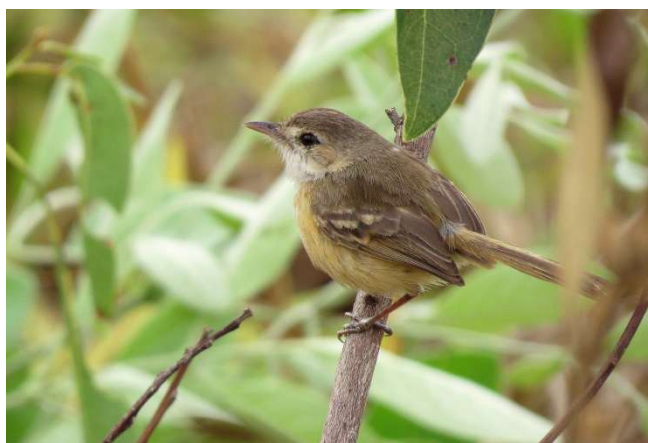
Always favouring palm groves, the curious Sulphury Flycatcher; and our great find along Água Fria road, the rare Rufous-sided Pygmy Tyrant