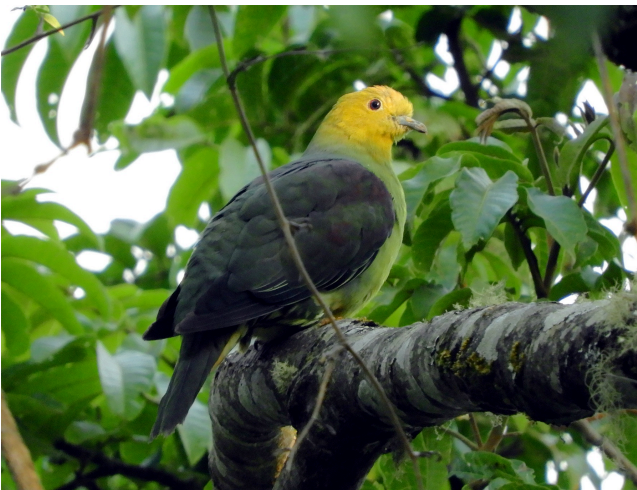
Wedge-tailed Green Pigeon