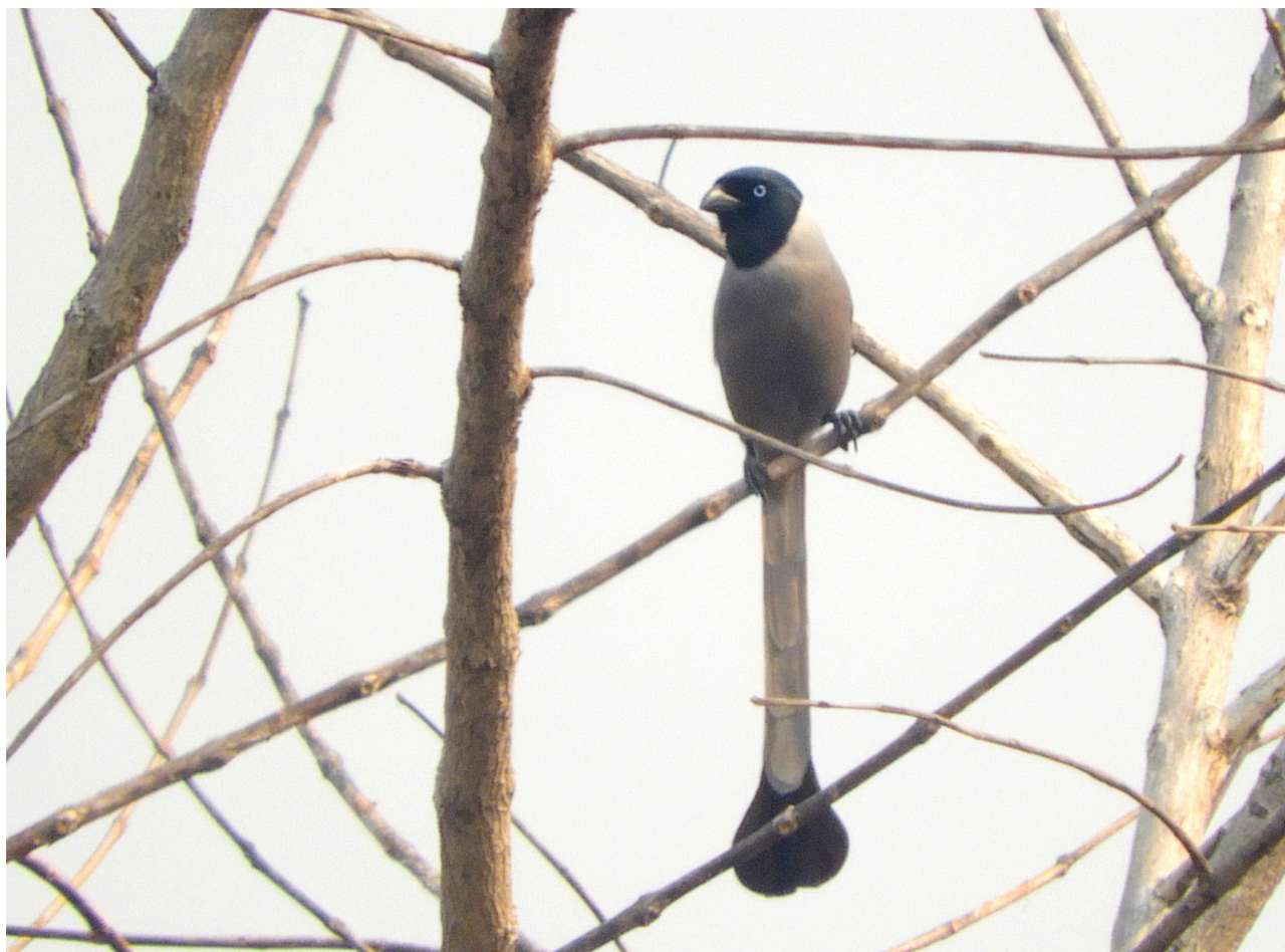
Hooded Treepie at Saw.