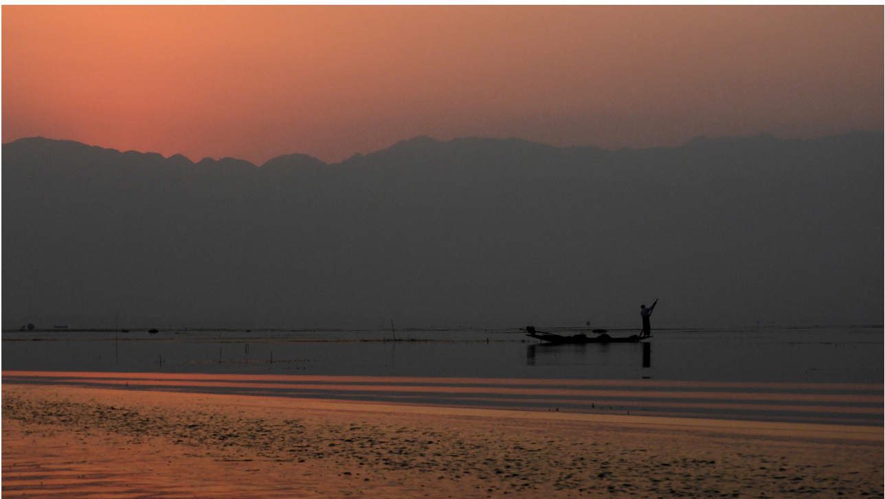
Dawn on Inle Lake