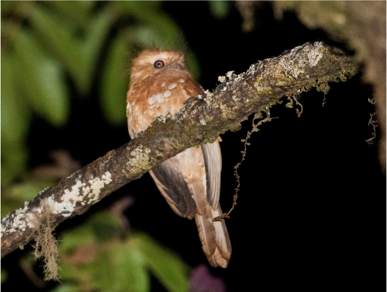
Hodgson's Frogmouth

Green-billed Malkoha Phaenicophaeus tristis Singles seen at Mt Victoria and Kalaw Asian Koel Eudynamys scolopaceus Often heard, seen in Yangon by the Shwedagon pagoda. Asian Emerald Cuckoo Chrysococcyx maculatus Vocal and visible around Kalaw with several males seen. Plaintive Cuckoo Cacomantis merulinus A couple seen at Kalaw. Square-tailed Drongo-Cuckoo Surniculus lugubris (H) Heard at Yayayekan. Large Hawk-Cuckoo Hierococcyx sparveroides Often heard in the Chin Hills with two seen. Indian Cuckoo Cuculus micropterus (H) One heard at Bagan. Himalayan Cuckoo Cuculus saturatus One definite seen on Mt Victoria plus a couple of probables. Common Cuckoo (Eurasian C) Cuculus canorus One seen on Mt Victoria, others heard. Just arrived! Asian Barred Owlet Glaucidium cuculoides A couple of singles seen, one on Mt Victoria, another near Saw. Spotted Owlet Athene brama Rather numerous at Bagan with at least ten in a day. Hodgson's Frogmouth ♦ Batrachostomus hodgsoni A great view of a female on Mt Victoria. See note.