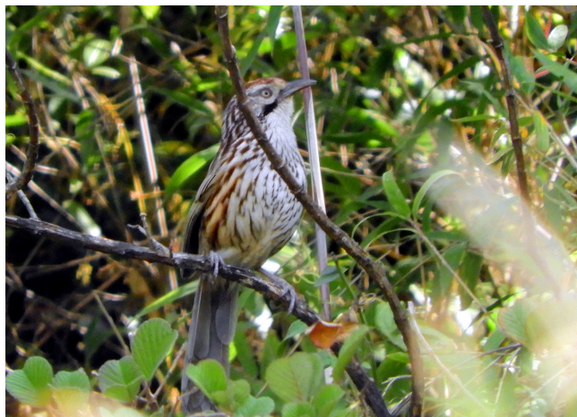
Mt. Victoria Babax