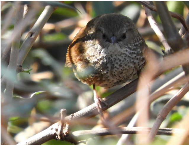
Chin Hills Wren Babbler

Grey-breasted Prinia Prinia hodgsonii Common in the Bagan area. Yellow-bellied Prinia Prinia flaviventris Not uncommon in the reedy swamps at Inle Lake. Plain Prinia Prinia inornata Odd birds seen along our route. Common Tailorbird Orthotomus sutorius Regular sightings in typical habitat. Dark-necked Tailorbird Orthotomus atrogularis Heard in the woods at Hlawga, seen at Yayayekan. Rusty-cheeked Scimitar Babbler Pomatorhinus erythrogenys (H) Heard near Kalaw. Spot-breasted Scimitar Babbler ♦ Pomatorhinus maclellandi (H) Frustratingly heard only, near Mindat. White-browed Scimitar Babbler Pomatorhinus schisticeps Several seen around Kalaw Streak-breasted Scimitar Babbler Pomatorhinus ruficollis Regular sightings in the forest on Mt Victoria. Slender-billed Scimitar Babbler ♦ Pomatorhinus superciliosus An excellent sight of one near Mindat. See note. Chin Hills Wren-Babbler ♦ Spelaeornis oatesi Some excellent views of these cuties on Mt Victoria. Heard Mindat.