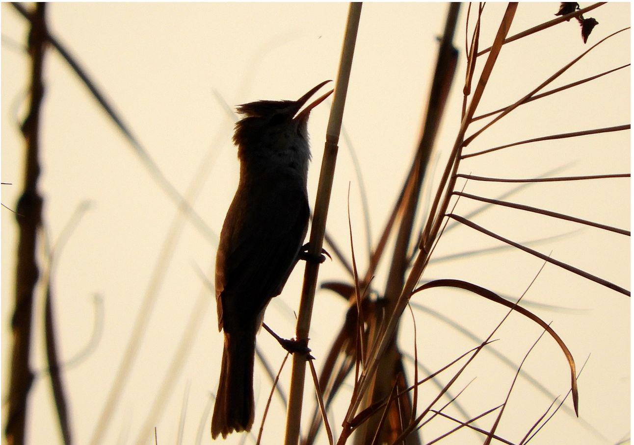
Clamorous Reed Warbler