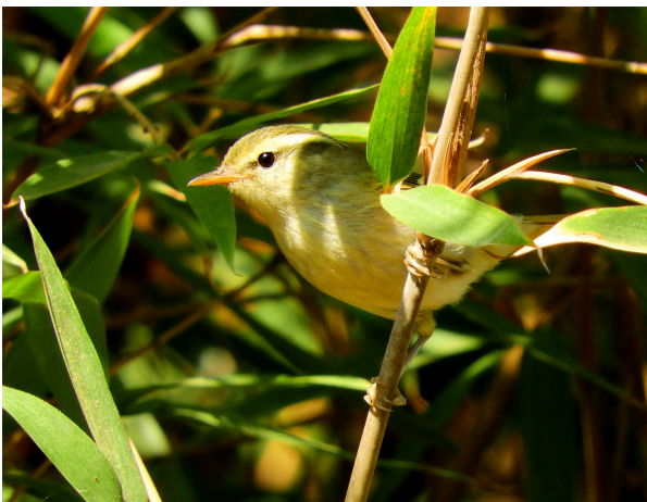
Blyth's Leaf Warbler