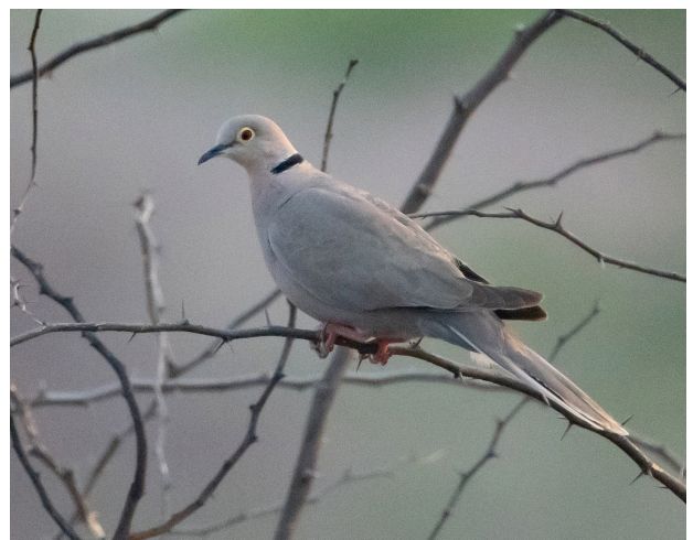
Burmese Collared Dove