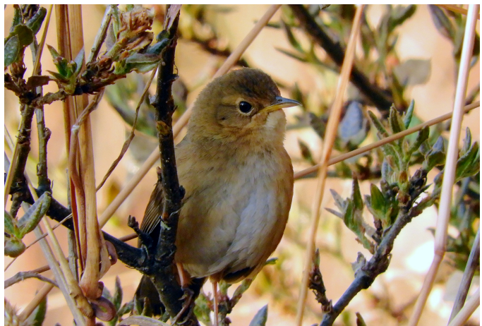
Brown Bush Warbler

Blyth's Leaf Warbler Phylloscopus reguloides Frequent encounters on Mt Victoria, where they were vocal. Davison's Leaf Warbler ♦ Phylloscopus intensior Several seen well at Yayayekan. Grey-hooded Warbler Phylloscopus xanthoschistos Odd birds seen on Mt Victoria. Clamorous Reed Warbler (Indian R W) Acrocephalus stentoreus Quite obvious and noisy in the Inle swamps. Black-browed Reed Warbler Acrocephalus bistrigiceps Three seen in tall grass in the Inle swamps. Blunt-winged Warbler ♦ Acrocephalus concinens A surprise to find one at Yayayekan, a good view in the bushes. Thick-billed Warbler Arundinax aedon One seen at Hlawga, also noted at Yayayekan. Brown Bush Warbler ♦ Locustella luteoventris Some great looks at some of these on Mt Victoria. Spotted Bush Warbler ♦ Locustella thoracica A single skulker at Inle Lake. Russet Bush Warbler Locustella mandelli One seen running on the ground in the scrub and grass on Mt Victoria. Striated Grassbird Megalurus palustris Several seen perching prominently and singling loudly at Inle and Kalaw. Zitting Cisticola Cisticola juncidis A few seen in fields along the banks of the Irrawaddy at Bagan. Brown Prinia ♦ Prinia polychroa Vocal birds seen well at Bagan and Kalaw. Black-throated Prinia Prinia atrogularis A couple seen on Mt Victoria. Hill Prinia Prinia superciliaris Three seen in the Kalaw area, split from the above species some time ago. Rufescent Prinia Prinia rufescens seen well at Hlawga, also in the dry lowland forest.