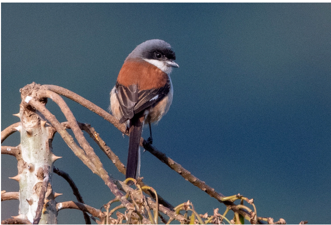
Burmese Shrike

Long-tailed Broadbill Psarisomus dalhousiae A pair seen at some range near Mindat. Silver-breasted Broadbill Serilophus lunatus A nice surprise to see this beauty at Yayayekan. Bar-winged Flycatcher-shrike Hemipus picatus Seen at Yayayekan. Common Woodshrike Tephrodornis pondicerianus Two seen in the pine woods near Kalaw. Ashy Woodswallow Artamus fuscus Regular sightings along our route. Common Iora Aegithina tiphia Notably common and all in breeding plumage, such as at Hlawga and around Bagan. Jerdon's Minivet ♦ Pericrocotus albifrons The best birds make you sweat for them! Seven in a morning... See note. Small Minivet Pericrocotus cinnamomeus A pair in dry forest near Kazunma. Grey-chinned Minivet Pericrocotus solaris A couple of pairs in the evergreen forest on Mt Victoria. Long-tailed Minivet Pericrocotus ethologus Regularly sightings on Mt Victoria, also in the pines at Kalaw. Scarlet Minivet Pericrocotus speciosus In good number around Kalaw, also seen near Saw. Ashy Minivet Pericrocotus divaricatus Three in big trees at the Shwedagon pagoda. Large Cuckooshrike Coracina macei Five birds seen in lowland forest near Saw. Black-winged Cuckooshrike Lalage melaschistos Seen at Hlawga and on a couple of days on Mt Victoria. Brown Shrike Lanius cristatus A few scattered sightings along the way.