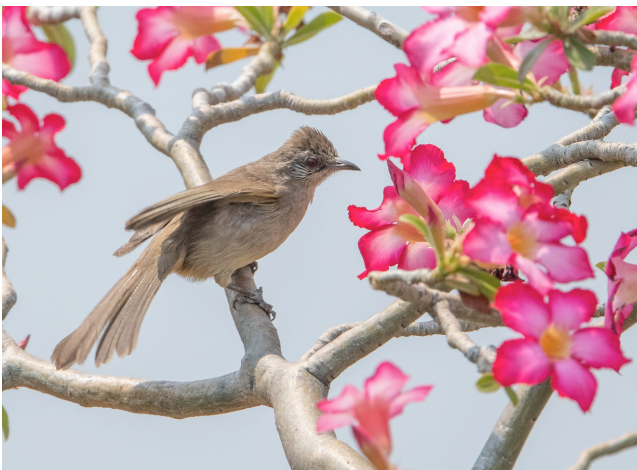
Ayeyarwady Bulbul