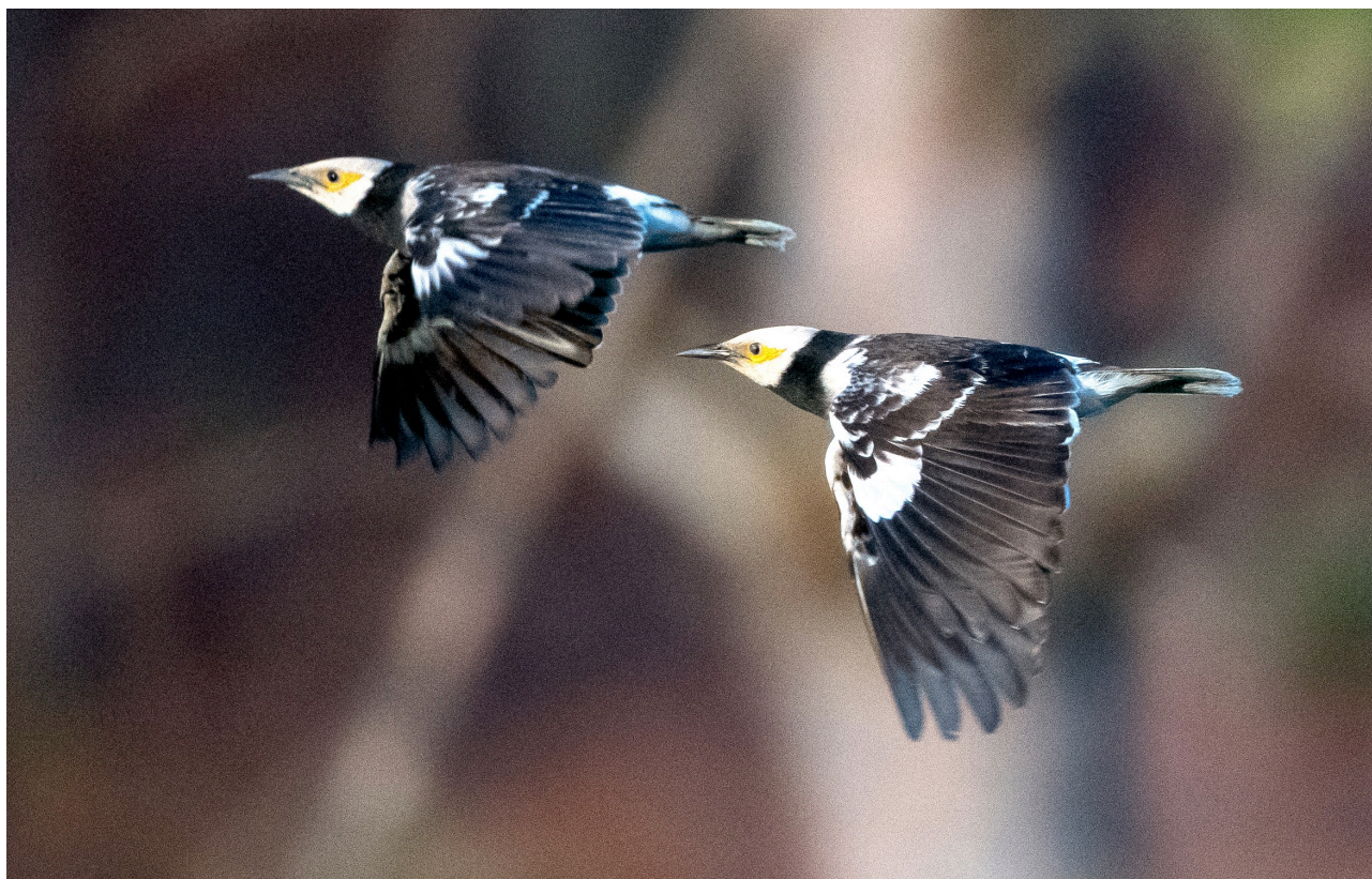
Black-collared Starling

Bluethroat Luscinia svecica Three or more seen at Inle Lake. Siberian Rubythroat Calliope calliope Two seen at Hlawga, another female seen at Bagan. Himalayan Bluetail Tarsiger rufilatus Not uncommon at higher elevations on Mt Victoria. Slaty-backed Flycatcher Ficedula hodgsonii A single female seen on Mt Victoria. Rufous-gorgeted Flycatcher Ficedula strophiate Frequent sightings on Mt Victoria and in the forests near Mindat. Taiga Flycatcher Ficedula albicilla A small number of these winter visitors seen along our way. Little Pied Flycatcher Ficedula westermanni A few seen in the forests on Mt Victoria. Slaty-blue Flycatcher Ficedula tricolor Quite numerous if skulky on Mt Victoria. Blue-fronted Redstart Phoenicurus frontalis A few of these handsome fellows still lingering on Mt Victoria.