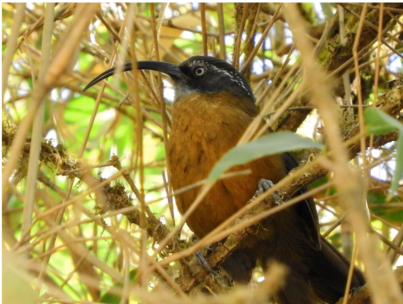
Slender-billed Scimitar Babbler.