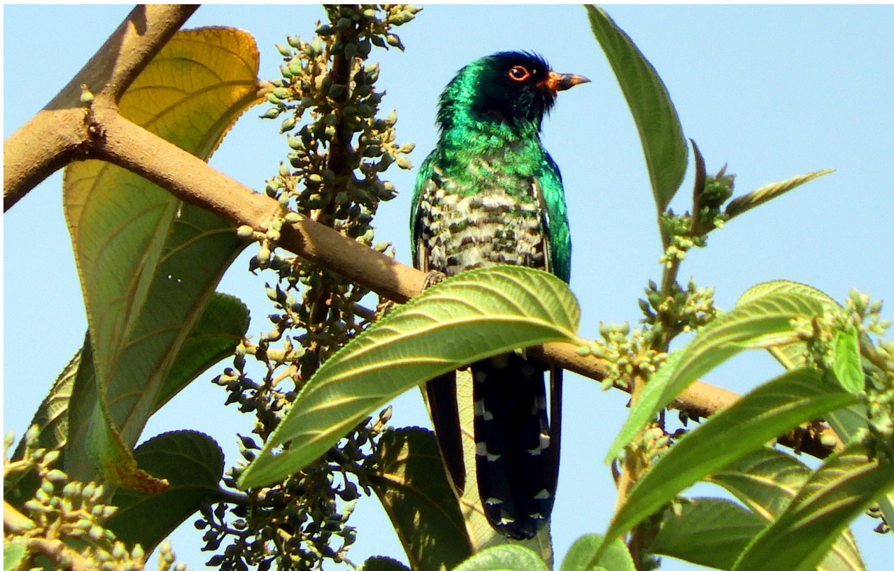
Asian Emerald Cuckoo

Eurasian Hoopoe Upupa epops A few seen along the way.