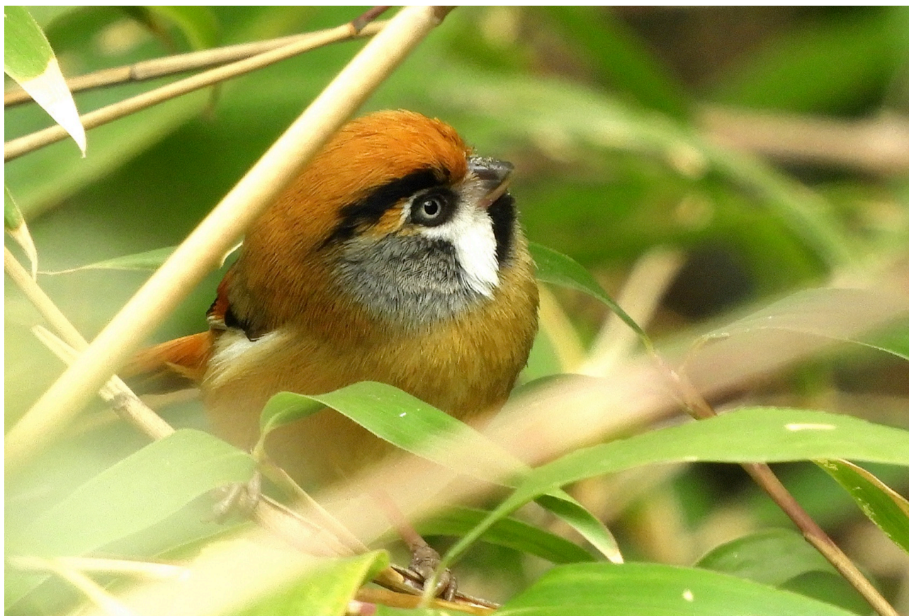
Black-throated (or Buff-breasted) Parrotbill

We left Mindat and drove back down to the lowlands, pausing at a bridge where we saw River Lapwing, plus a remarkable gathering of Greater Coucal, then in degraded forest we had a busy hour with Blossom-headed, Grey-headed, Alexandrine and Red-breasted Parakeets, Grey-capped and Rufous Woodpeckers, Velvet-fronted Nuthatch, Crested Treeswift, Large Cuckooshrike, Scarlet Minivet, Crimson Sunbird, Pin-striped Tit Babbler, Brown-cheeked Fulvetta and a fearless Asian Barred Owlet. Further stops in lowland dry forest provided Wedge-tailed Green Pigeon, Black-naped Monarch and a Radde's Warbler, as it grew hotter and quieter. A final stop under a noon sun we found Indian Rollers gathered around a small wildfire, Black Baza, White-eyed Buzzards, and finally we found Neglected (or Burmese) Nuthatch to make five Nuthatch species for the trip – possibly the only tour where that it is possible? After a Burmese lunch at a wayside restaurant we headed on down to the Irrawaddy and back up to Bagan. A final sortie around one of the pagodas provided some last looks at White-throated Babblers and Burmese Bushlarks, Burmese Collared Dove, Irrawaddy Bulbuls, many Vinous-breasted Starlings and a Eurasian Wryneck in the fields. We checked into our well-situated hotel, as night fell Indian Nightjars become vocal and we quickly found one nearby, while Spotted Owlets yelped from the garden trees.