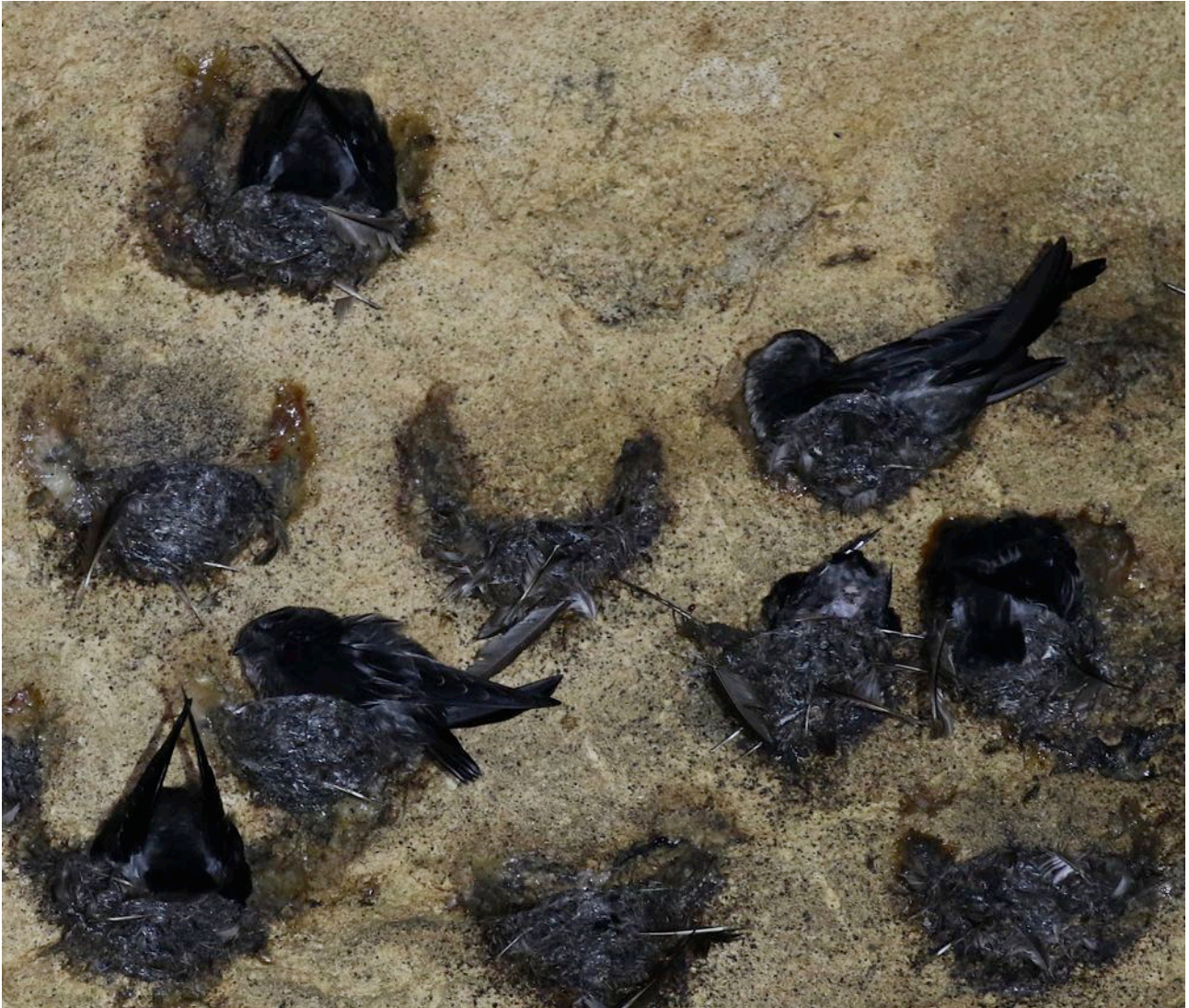
Black-nest Swiftlets at Gomantong (Craig Robson)

Brown Wood Owl (Bornean W O) Strix leptogrammica A very tame bird at BRL. Collared Owlet (Sunda O) Glaucidium [brodiei] sylvaticum Great scope views at Ba'kelalan; the only one heard. Brown Hawk-Owl (B Boobook) Ninox scutulata Seen poorly at Klias Peatswamp Field Centre. Heard at Tabin. Large Frogmouth Batrachostomus auritus One spotlighted at Silau Tenegang; heard at BRL. Dulit Frogmouth Batrachostomus harterti Amazing spotlight views of one near Ba'kelalan. Gould's Frogmouth Batrachostomus stellatus Excellent close-ups of one, pre-dawn, near Bilit, Kinabatangan. Bornean Frogmouth B. mixtus After a very long search, Yeo finally located a day-roosting bird at Paya Maga. Blyth's Frogmouth Batrachostomus affinis Just one, during a night drive at Tabin. Sunda Frogmouth B. comutus One spotlighted at Taman Tun Fuad Stephen, KK and a day-roosting pair at BRL Malaysian Eared Nightjar Lyncornis temminckii A pair were seen really well near Ba'kelalan, Sarawak. Grey-rumped Treeswift Hemiprocne longipennis Whiskered Treeswift Hemiprocne comata