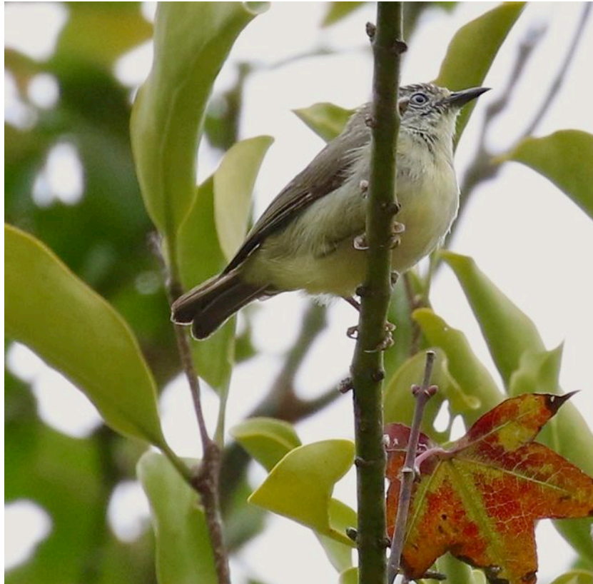
Pygmy White-eye (Craig Robson)

Sunda Bush Warbler Horornis vulcanius A few at higher elevations in Kinabalu Park. Bornean Stubtail Urosphena whiteheadi Good views of one at Kinabalu Park. Many heard. Mountain Leaf Warbler Phylloscopus trivirgatus Fairly common at Kinabalu Park. Yellow-breasted Warbler Seicercus montis Common at Kinabalu Park. Striated Grassbird Megalurus palustris A couple near Papar. Yellow-bellied Prinia (Bornean P) Prinia [flaviventris] latrunculus Dark-necked Tailorbird Orthotomus atrogularis Rufous-tailed Tailorbird Orthotomus sericeus Ashy Tailorbird Orthotomus ruficeps