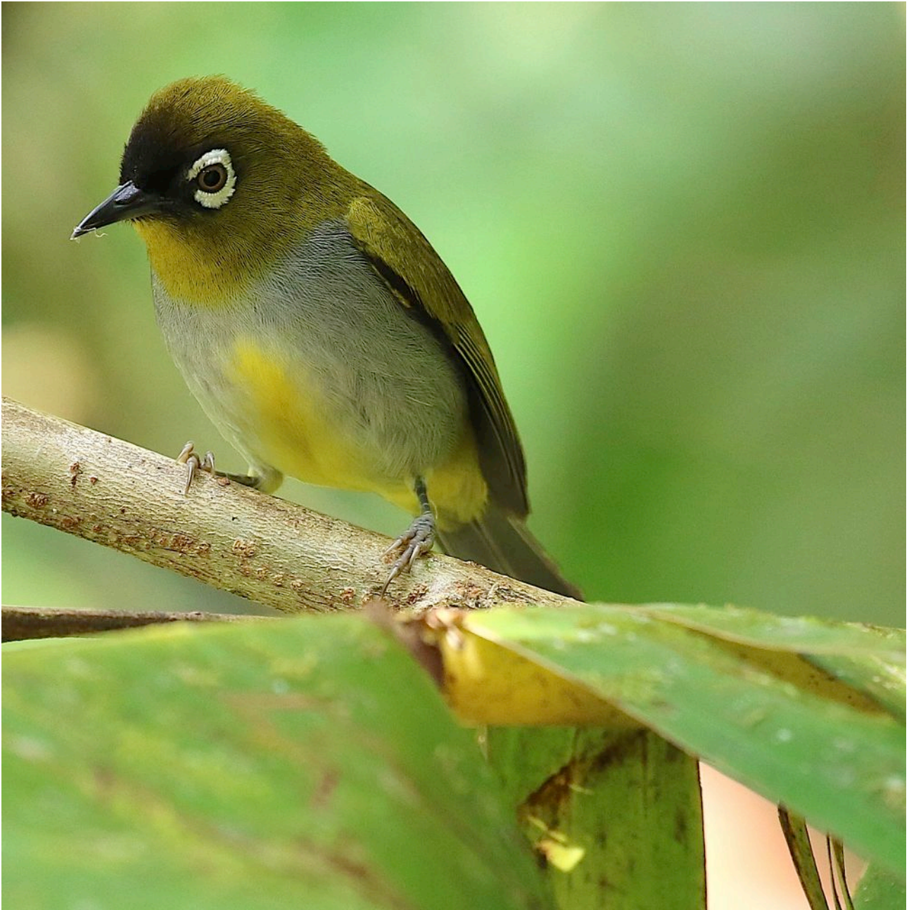
Black-capped White-eye

Having all met up at the airport in Kota Kinabalu, around midday, we headed off birding for the rest of the day. First up was Lok Kawi Beach, where we enjoyed excellent views of the day's top target, a pair of dapper Malaysian Plovers. Moving on, we explored some areas near Papar, particularly Kampung Benoni Marsh. Here there were large numbers of Wandering Whistling Ducks, Lesser Adjutant, White-browed Crakes and Sunda Pygmy Woodpecker. Back in KK we paid a visit to Prince Philip Park, where Blue-naped Parrots and Long-tailed Parakeets showed at close range. Then, the tiny Sembulan River Park delivered close-ups of breeding Nankeen Night Herons. After dinner we visited another park, Taman Tun Fuad Stephen, where we spotlighted Sunda Frogmouth and heard a Sunda Scops Owl close by.