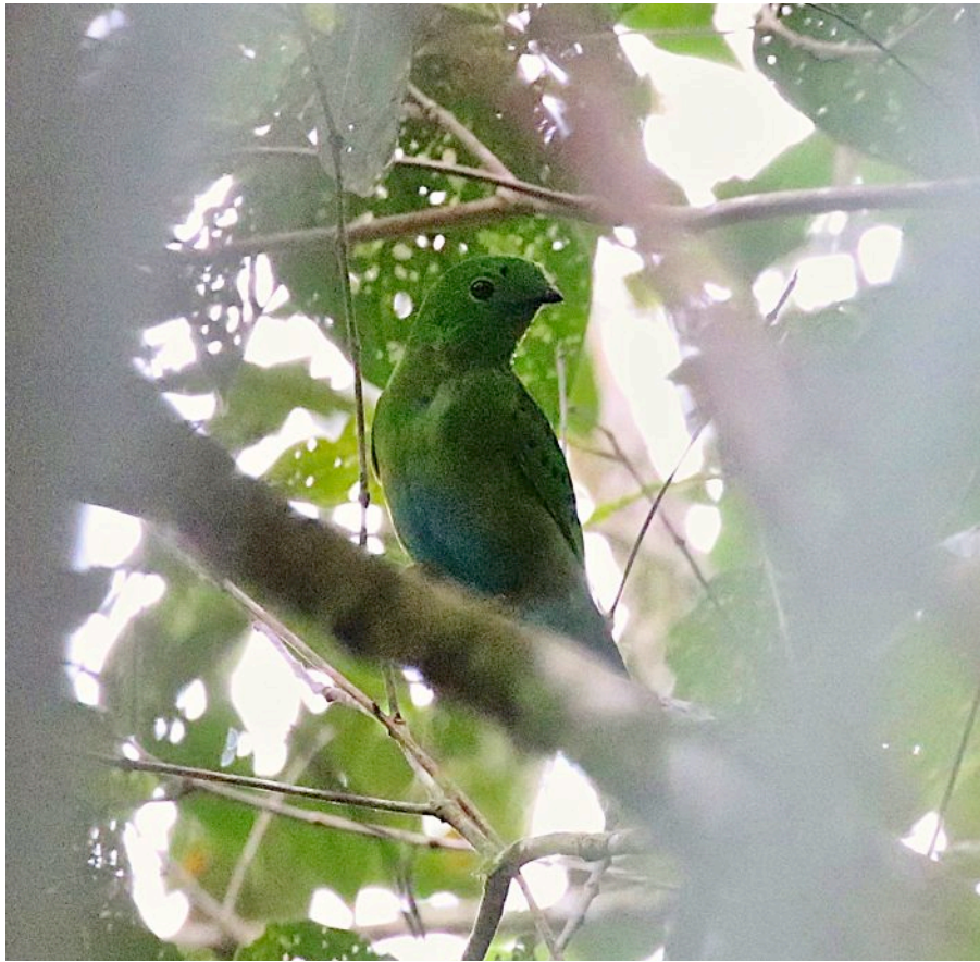
Hose's Broadbill at Paya Maga

Dusky Broadbill Corydon sumatranus A nice group of five at BRL.