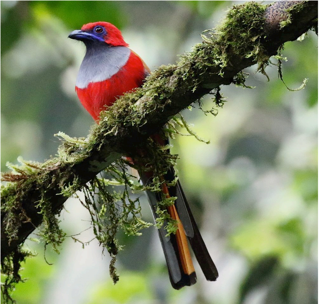
One of our Male Whitehead's Trogons

In the afternoon we paid a short visit to the Zen Garden Resort, where we tracked a small flock of scarce Pygmy White-eyes, and a Plain Flowerpecker was the only one of the tour. The evening was spent making an initial visit to Kinabalu Park, but things were pretty quiet already.