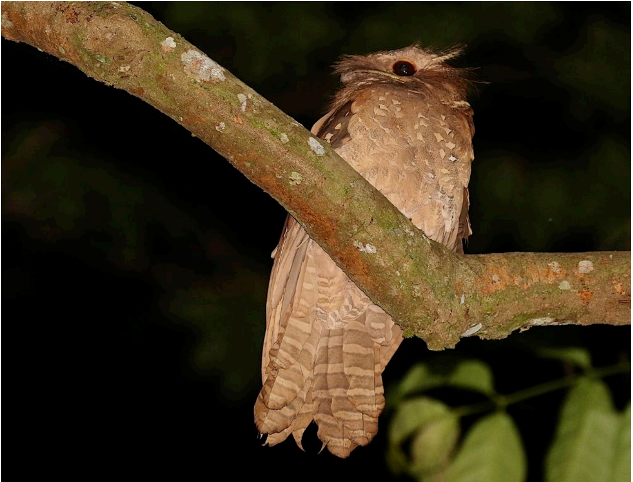
Dulit Frogmouth (Craig Robson)

specialities of the tour. By day, we had great views of two unexpected Jambu Fruit Doves, a superb male Bornean Banded Pitta, a lovely female Hose's Broadbill, and 'Dayak' Blue Flycatcher (a split from Hill). The best of the rest consisted of Black-bellied Malkoha, Banded (or Black-faced) Kingfisher, Buff-rumped Woodpecker, Crested Jay, Chestnut-backed Scimitar Babbler, Pygmy White-eye, White-rumped Shama, Eyebrowed (or Sunda) Wren-Babbler, and Rufous-chested Flycatcher. A pre-dawn try for Bornean Frogmouth continued into the early morning hours as we painstakingly searched for a calling bird at its roost. How difficult they can be to see, even when they seem so close in broad daylight. Minutes turned to hours! Eventually Yeo finally spotted the bird and we were able to enjoy it through the scope for as long as we wanted. The best bird was saved until last however as, on our way back down to the trail-head near Long Tuyo, with some careful planning and staging, we all managed to get unbelievably good walk-away views of Blue-banded Pitta.