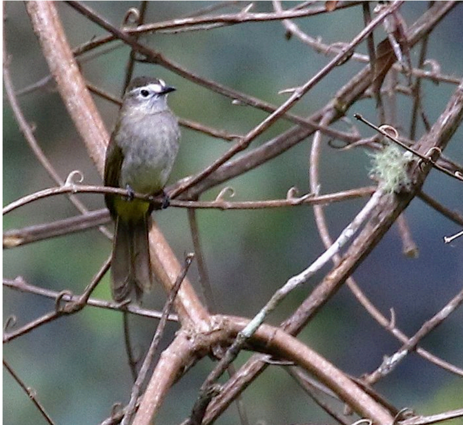
'Pale-faced' Bulbul (Craig Robson)

Rail-babbler Eupetes macrocerus (H) A couple were calling at Paya Maga, but not when we wanted!! Grey-headed Canary-flycatcher Culicicapa ceylonensis (H) Straw-headed Bulbul Pycnonotus zeylanicus (H) Heard briefly at BRL. Very frustrating. Black-headed Bulbul Pycnonotus atriceps Bornean Bulbul Pycnonotus montis Fairly common at mid-elevations in Sabah and Sarawak. Scaly-breasted Bulbul Pycnonotus squamatus A couple at BRL, and eight in Sarawak. A smart bulbul. Puff-backed Bulbul Pycnonotus eutilotus Just one seen well at Tabin. Flavescent Bulbul (Pale-faced B) P. [flavescens] leucops An unexpected bonus at Timpohon, Kinabalu; just one.