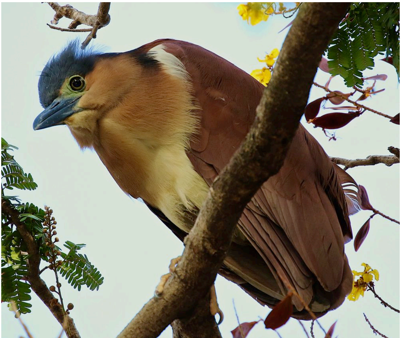
Nankeen Night Heron (Craig Robson)

Black-crowned Night Heron Nycticorax nycticorax