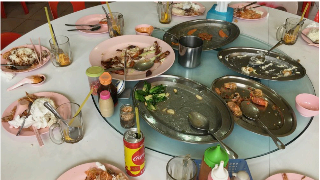
Yum yum (Craig Robson)