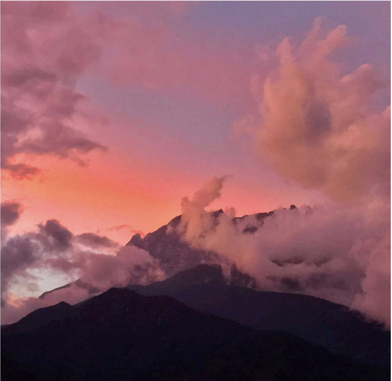
Mount Kinabalu from our accommodation (Craig Robson)

The tour reached its conclusion with a rather thrilling flight in a small aircraft back to Lawas, from where we continued by road to the airport at Kota Kinabalu.