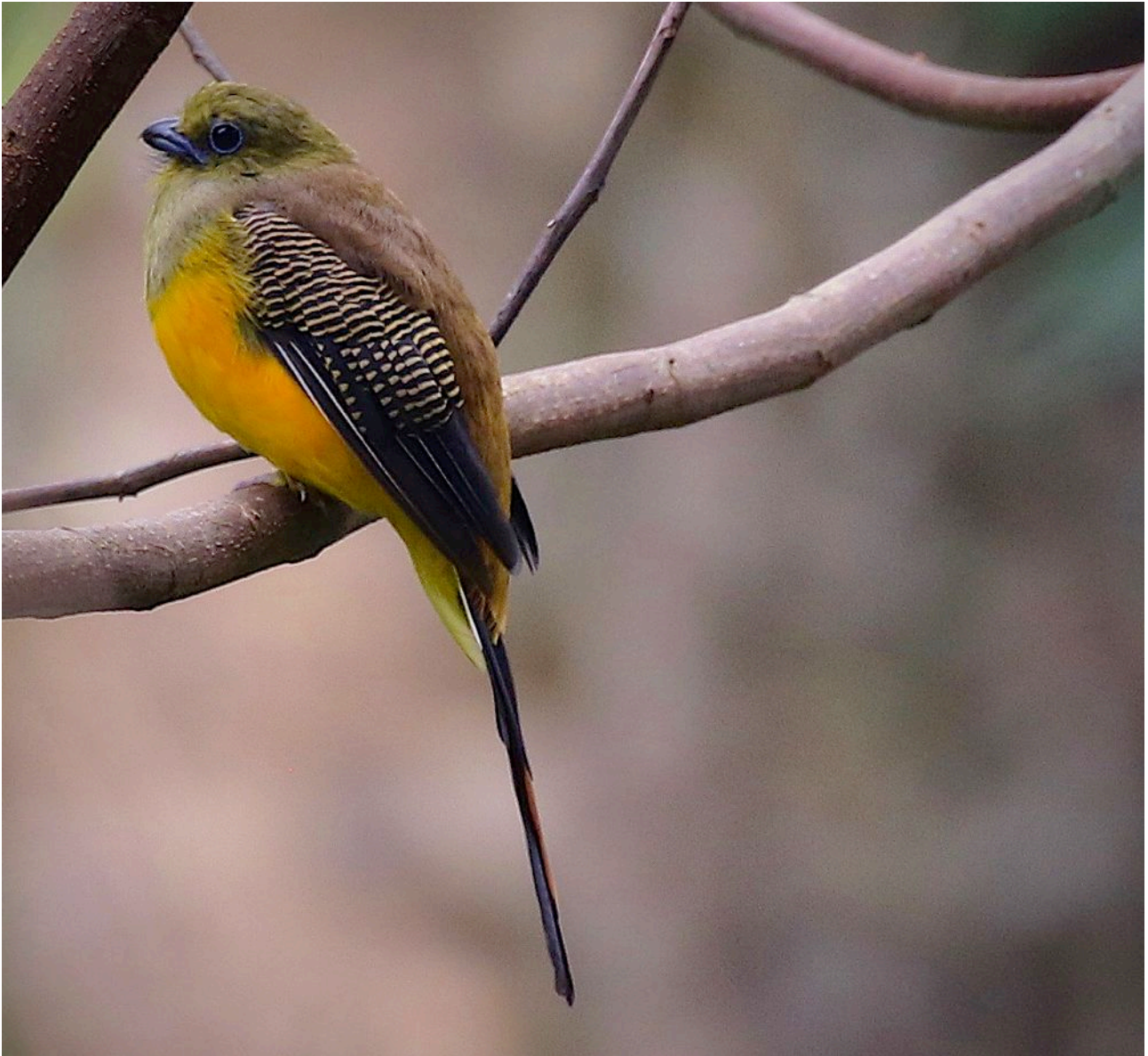
Orange-breasted (or Spice) Trogon

Silver-rumped Spinetail (S-r Swift) Rhaphidura leucopygialis Only seen along the river at BRL. Brown-backed Needletail Hirundapus giganteus Red-naped Trogon Harpactes kasumba Seen at Tabin and BRL. Diard's Trogon Harpactes diardii Seen at Kinabatangan, Tabin and BRL. Whitehead's Trogon Harpactes whiteheadi Two males and two females at Kinabalu Park, after a long search. Scarlet-rumped Trogon Harpactes duvaucelii Orange-breasted Trogon (Spice T) H. [oreskios] dulitensis One seen, and one heard near Ba'kelalan, Sarawak.