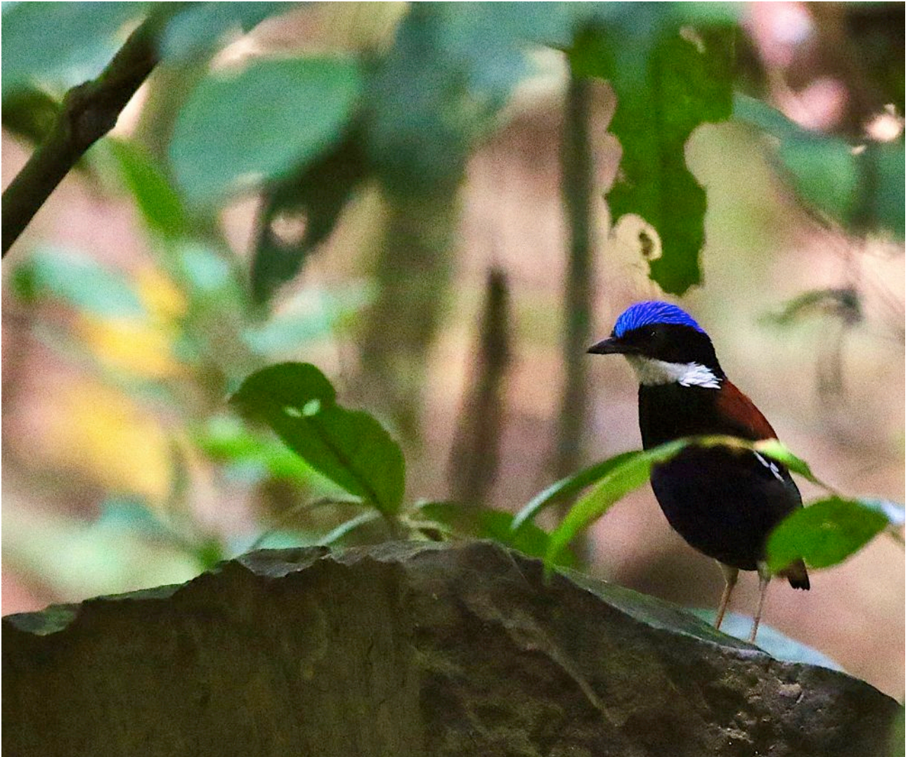
Blue-headed Pitta (Craig Robson)

Moving on once more, we returned to Lahad Datu before being transported to the legendary Borneo Rainforest Lodge. Before long, we were travelling through an increasingly wild jungle landscape and, Just before arriving at the secluded BRL, we happened across a small group of rare 'Bornean' or 'Pygmy' Elephants (the local form of Asian), a very lucky encounter indeed.