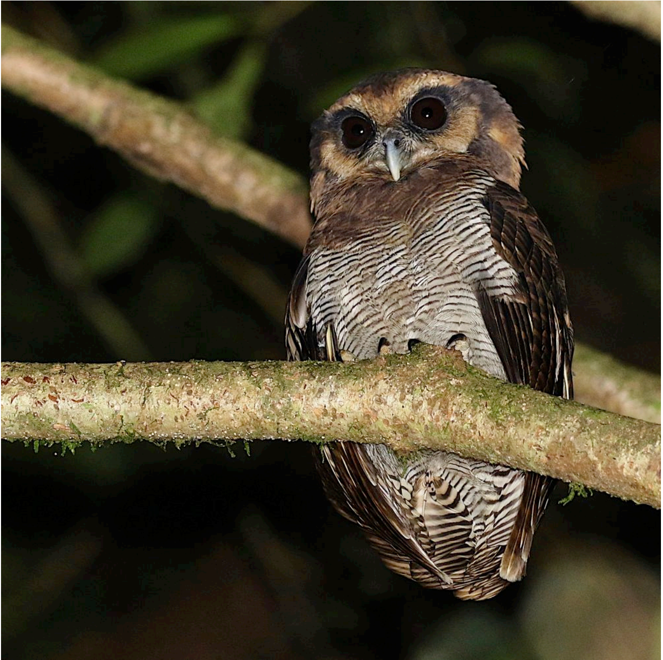
Brown (or Bornean) Wood Owl

Sunda Cuckoo Cuculus lepidus (H) At Kinabalu Park.