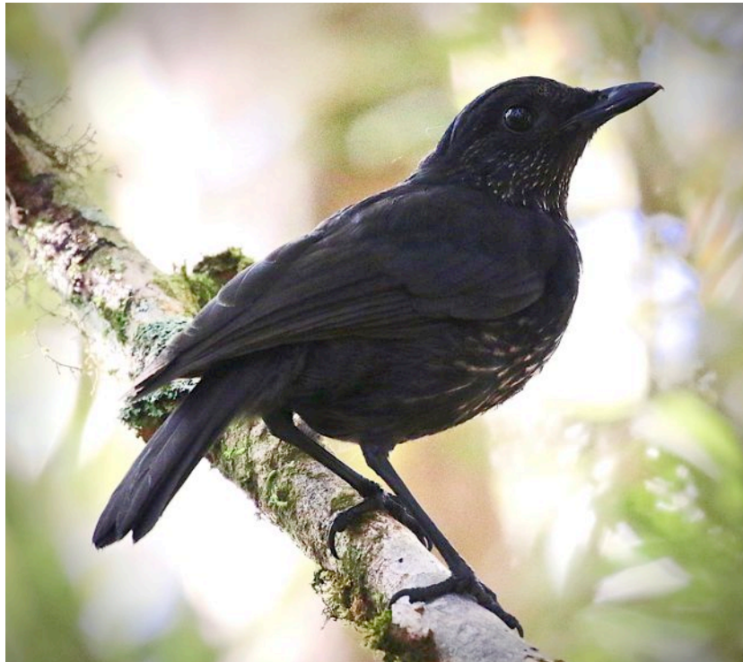
Bornean Whistling Thrush (Craig Robson)

Moustached Babbler (Sabah M B) Malacopteron [magnirostre] ssp. Just one at Tabin. Sooty-capped Babbler Malacopteron affine Scaly-crowned Babbler Malacopteron cinereum Rufous-crowned Babbler Malacopteron magnum White-chested Babbler Trichastoma rostratum Ferruginous Babbler Trichastoma bicolor One performed well at BRL. Striped Wren-Babbler Kenopia striata Great views of one at Tabin, and another at BRL. Temminck's Babbler Pellorneum pyrrogenys Widespread in uplands, but only seen at Kinabalu Park. Black-capped Babbler (Bornean B-c B) Pellorneum [capistratum] capistratoides Sunda Laughingthrush Garrulax palliatus Common in Montane Sabah. Chestnut-hooded Laughingthrush Garrulax treacheri Common at higher elevations throughout. Bare-headed Laughingthrush Garrulax calvus Tricky, but 4-6 seen at Kinabalu Park. Chestnut-crested Yuhina Yuhina everetti Common in the highlands throughout. Pygmy White-eye (P Ibon) Oculocincta squamifrons 6 Kundasang, 6 Paya Maga, and 6 Ba'kelalan. Mountain Blackeye Chlorocharis emiliae At least five at Timpohon Gate, Kinabalu Park. Black-capped White-eye Zosterops atricapilla Everett's White-eye (Hume's W) Zosterops [everetti] auriventer 15 at a fruiting tree at BRL. Heard in Sarawak.