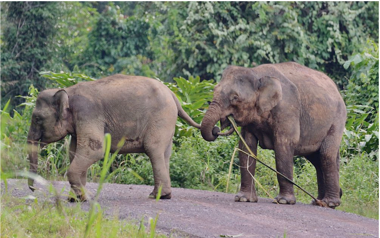
'Bornean' (or 'Pygmy') Elephants (Craig Robson)

Bornean Orangutan Pongo pygmaeus Three along the Kinabatangan and three more at BRL; great views.