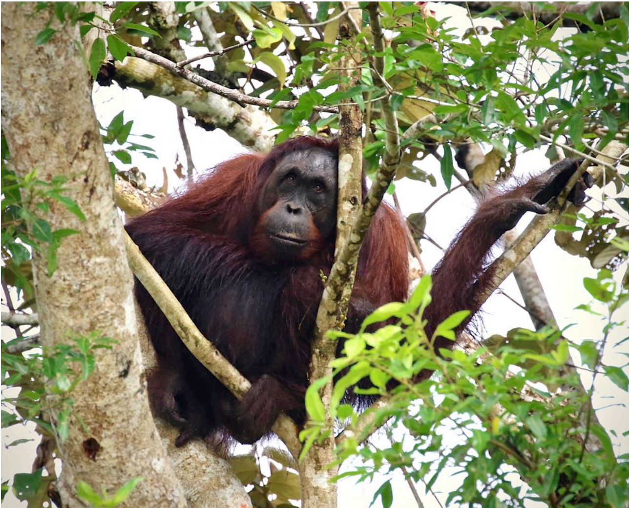
Bornean Orangutan by the Kinabatangan River

only White-fronted Falconet of the tour, a couple of smart Hooded Pittas, and Malaysian Blue Flycatcher. This was also a fantastic place for mammals. The narrower tributaries brought the best views of the wonderful Proboscis Monkeys, and we also found quite a few Silvery Lutungs (or Silvered Langurs). No fewer than three Bornean Orangutans were found in the vicinity of the huge fruiting fig trees, and a napping Binturong was a big bonus.