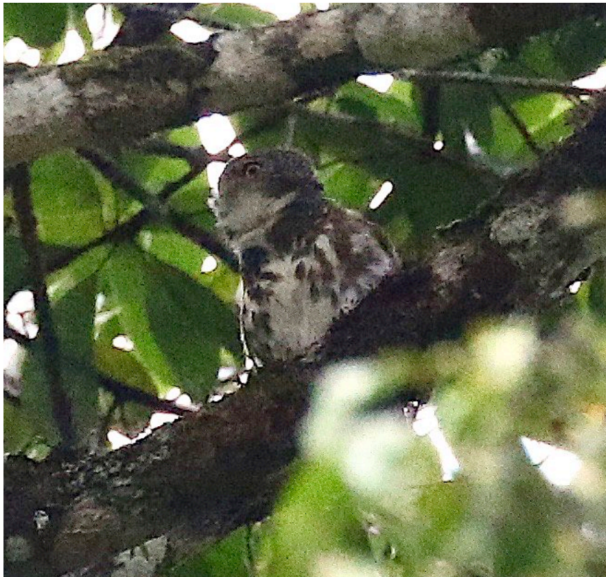
'Sunda' Owlet (Craig Robson)

Malaysian Plover Charadrius peronii A pair at Lok Kawi Beach. Whimbrel (Eurasian W) Numenius phaeopus Five at Lok Kawi Beach. Ruddy Turnstone Arenaria interpres One at Lok Kawi Beach. Common Sandpiper Actitis hypoleucos Wood Sandpiper Tringa glareola (NL) One at Ba'kelalan. Little Tern Sternula albifrons Two at Lok Kawi Beach. Whiskered Tern Chlidonias hybrida Rock Dove (introduced) Columba livia Spotted Dove Spilopelia chinensis Philippine Cuckoo-Dove (Ruddy C-D) Macropygia tenuirostris One at Ba'kelalan. Little Cuckoo-Dove Macropygia ruficeps Widespread and common in highland areas. Common Emerald Dove (Asian E D) Chalcophaps indica Zebra Dove (introduced) Geopelia striata Little Green Pigeon Treron olax Well scattered, and some nice views. Pink-necked Green Pigeon Treron vernans Thick-billed Green Pigeon Treron curvirostra Large Green Pigeon Treron capellei Just two fly-by's at Tabin's mud volcano, a traditional site. Jambu Fruit Dove Ptilinopus jambu Two were seen quite nicely at Paya Maga, an unexpected bonus. Green Imperial Pigeon Ducula aenea Mountain Imperial Pigeon Ducula badia