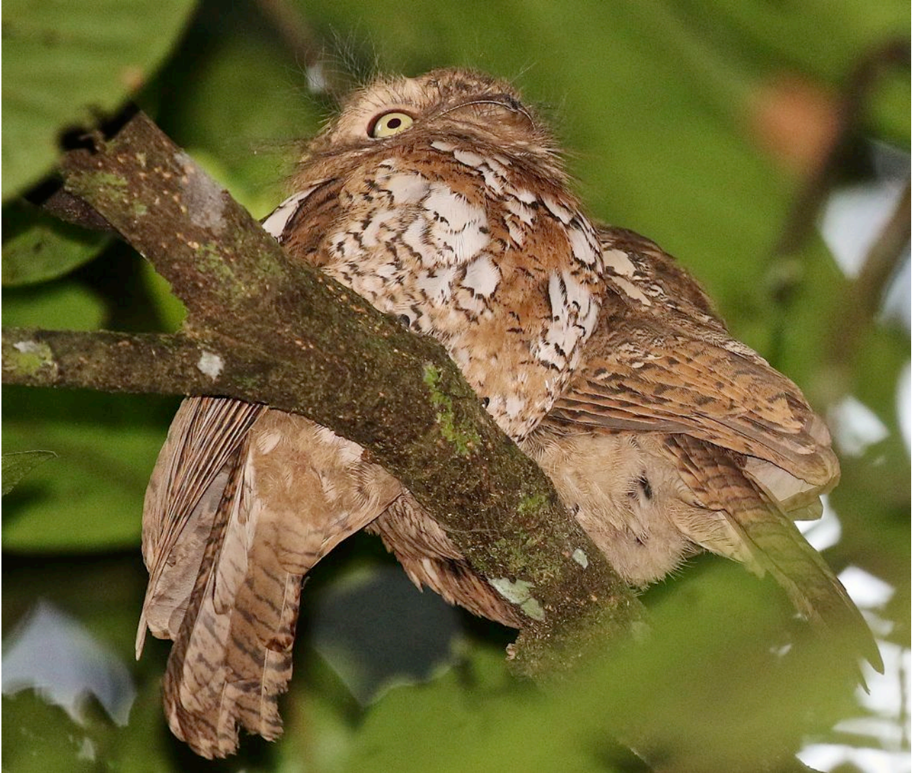
Day-roosting Sunda Frogmouths at BRL (Craig Robson)

close to the lodge, perched on a low branch right above our heads, while a night walk produced good views of Oriental Bay Owl and a roosting female 'Bornean' Crested Fireback. The various secluded trails brought us into contact with Chestnut-necklaced Partridge (our best views), Green and Dusky Broadbills, Crested Jay, two potentially splittable bulbuls, Grey-cheeked (or Guttural) and Yellow-bellied (or Sabah Yellow-bellied), a wide range of babblers including the endemic Bornean and Black-throated Wren-Babblers, Bornean Blue and Grey-chested Jungle Flycatchers, and Rufous-tailed Shama. BRL is always excellent for mammals and, during our night drives and walks this year, we saw three species of flying squirrel, Sunda Flying Lemur, Leopard Cat, and Malay Civet. Several more Bornean Orangutans, as well as Bearded Pigs, were seen well during daylight hours.