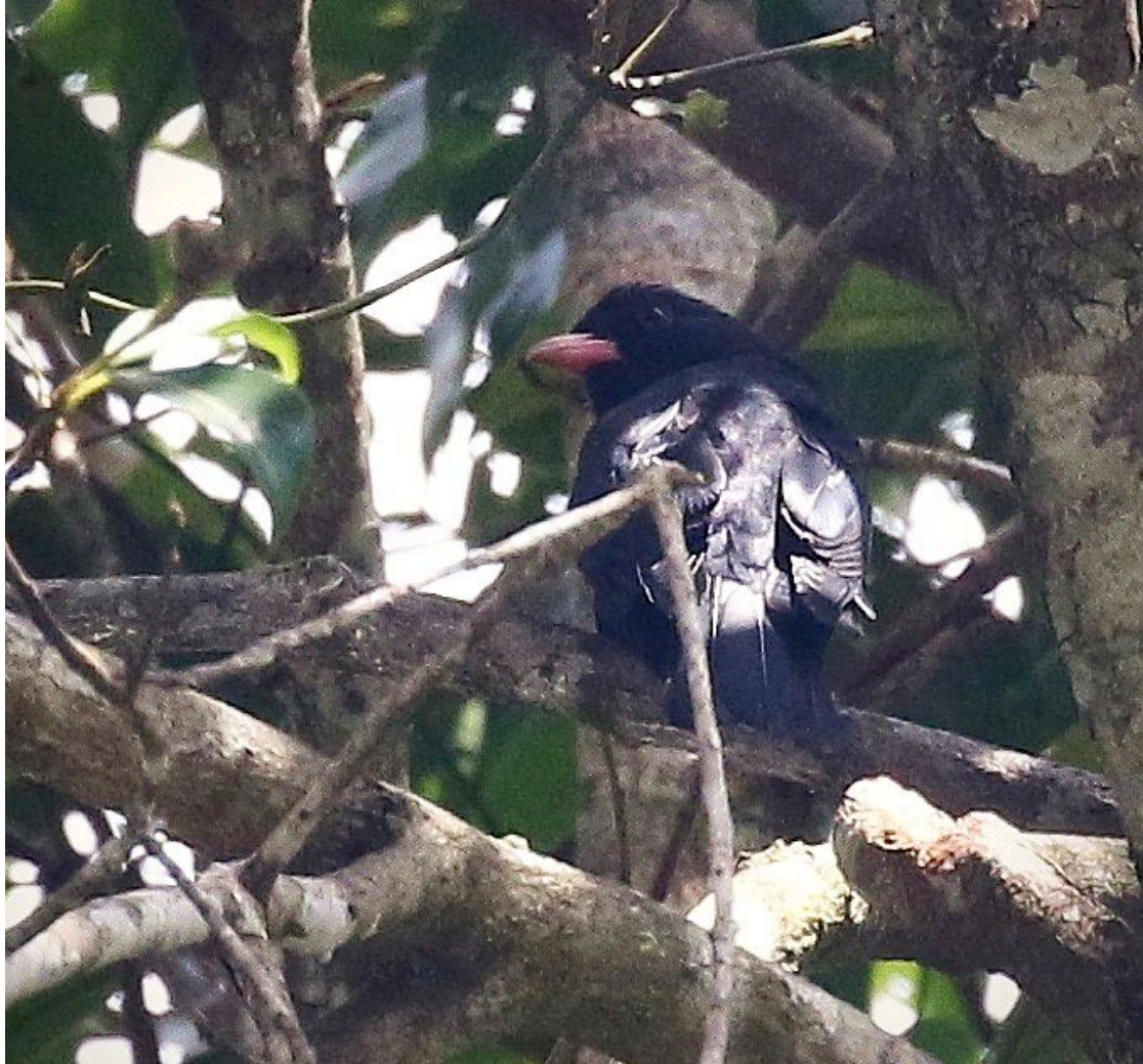
Black Oriole (Craig Robson)

Bornean Whistler Pachycephala hypoxantha Common at Kinabalu Park; heard at Ba'kelalan. White-bellied Erpornis Erpornis zantholeuca Blyth's Shrike-babbler Pteruthius aeralatus Frequent in montane Sabah; 1 at Ba'kelalan. Dark-throated Oriole Oriolus xanthonotus Black Oriole Oriolus hosii Easily seen around our camp at Paya Maga; probably at least five birds. Black-and-crimson Oriole Oriolus cruentus One in the Crocker Range, two at Kinabalu Park, and two at Ba'kelalan.