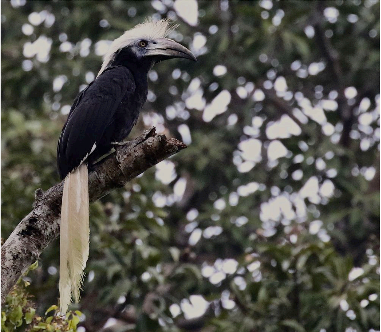
White-crowned Hornbill at the Kinabatangan River (Craig Robson)

White-crowned Hornbill Berenicornis comatus Singles at the Menanggol R. and Tabin. Superb view at former. Rhinoceros Hornbill Buceros rhinoceros Several great encounters in the lowlands. Helmeted Hornbill Rhinoplax vigil Pairs were seen at BRL and at Paya Maga. Often heard. Oriental Pied Hornbill Anthracoceros albirostris Black Hornbill Anthracoceros malayanus Bushy-crested Hornbill Anorrhinus galeritus Occasional small flocks noted. Wreathed Hornbill Rhyticeros undulatus Wrinkled Hornbill Rhabdotorrhinus corrugatus Great views near Bilit, Kinabatangan R. 19 logged.