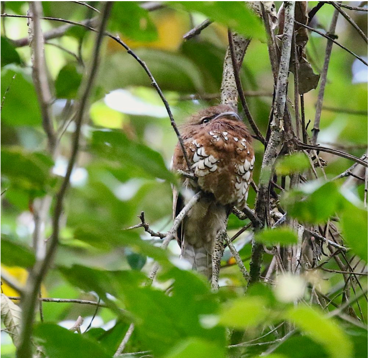
Bornean Frogmouth at Paya Maga (Craig Robson)

We continued south to Lawas where, after a nice lunch, we changed to four-wheel drive vehicles and continued to the remote settlement of Long Tuyu near the Kalimantan border in NE Sarawak. We found a few good birds during a late afternoon excursion around the village perimeter, with King Quail and Banded Woodpecker particularly notable.