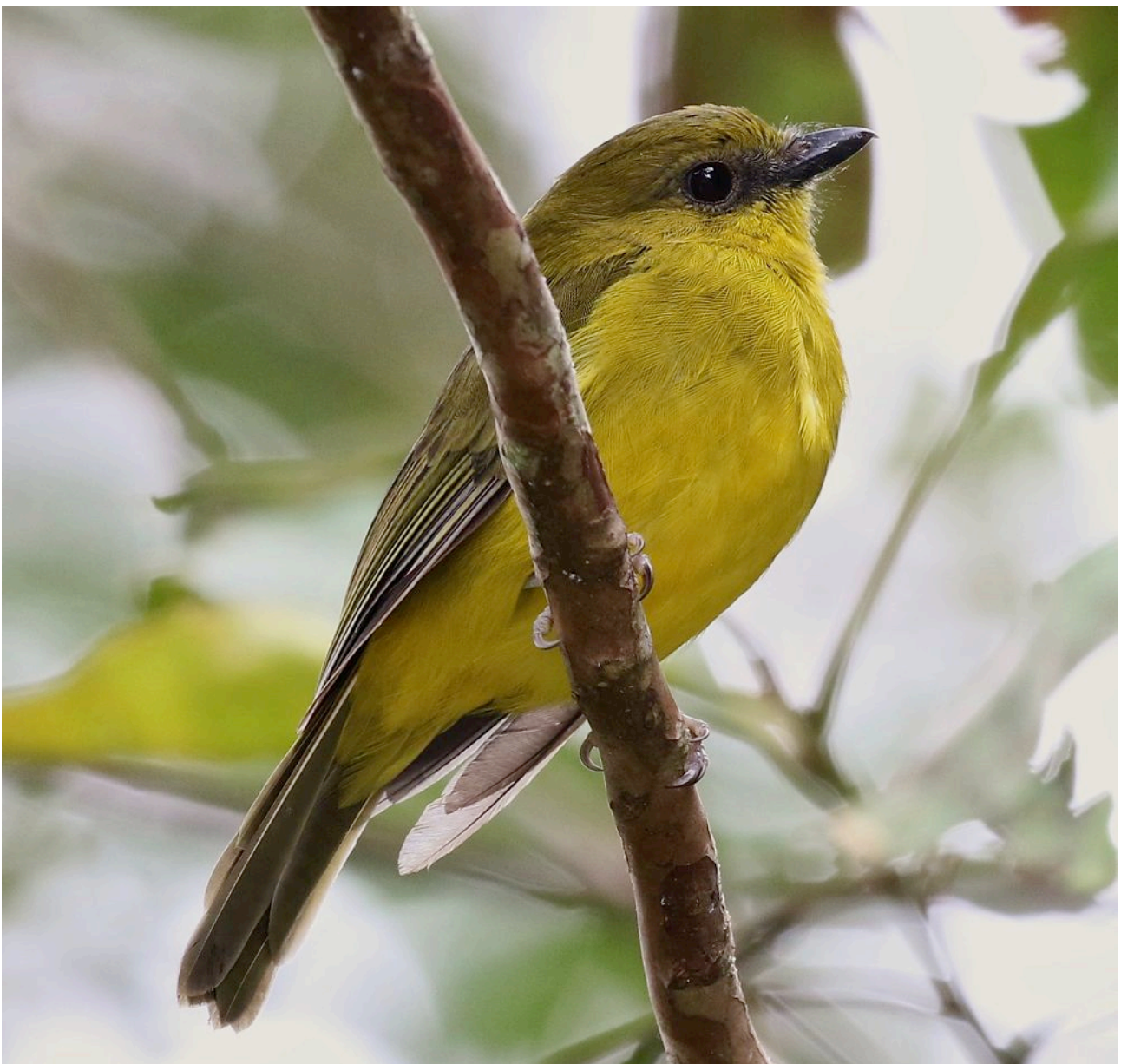
Bornean Whistler