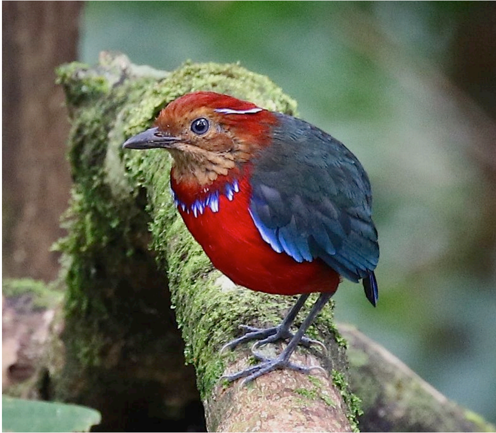
The stunning Blue-banded Pitta (Craig Robson)