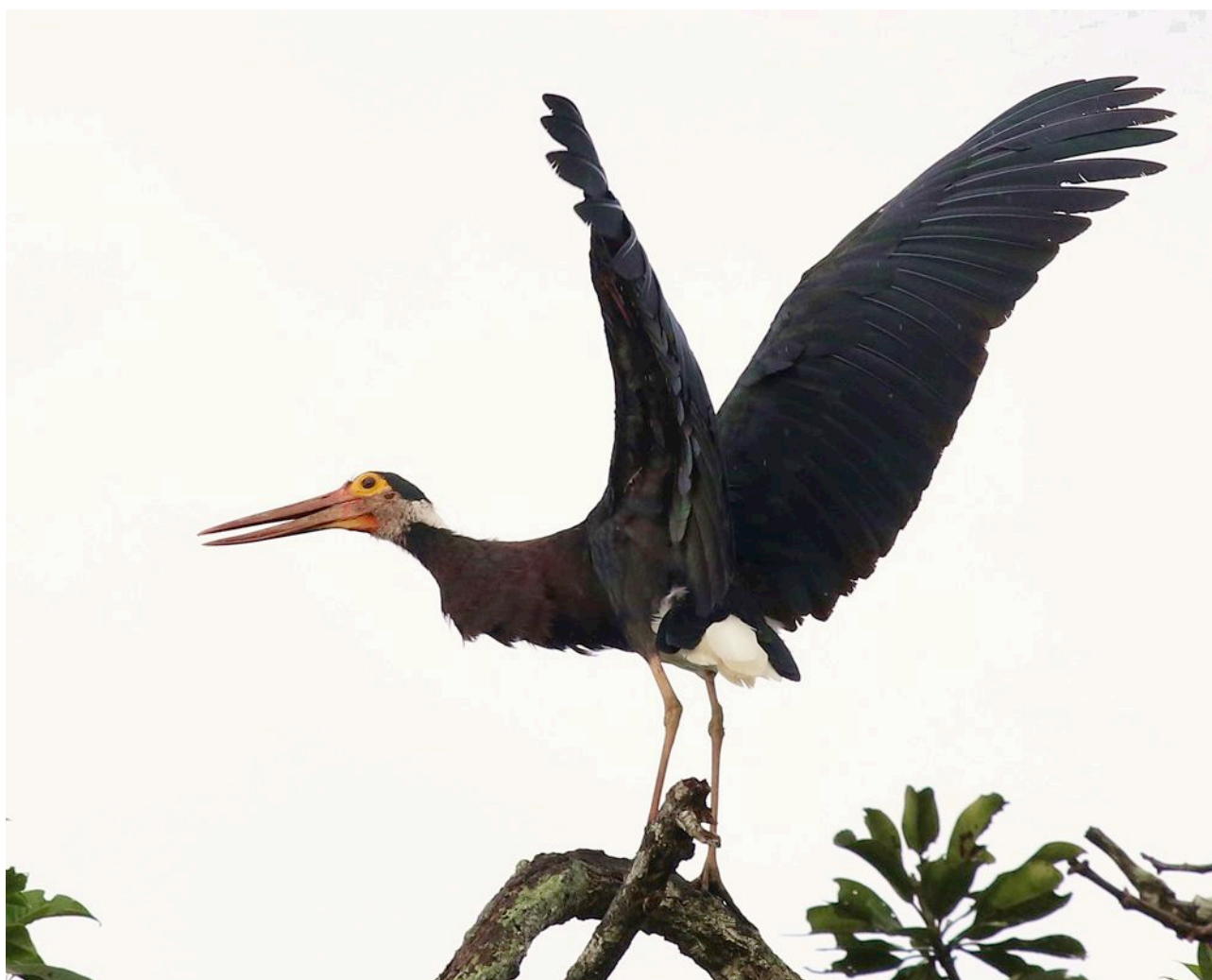
Storm's Stork along the Kinabatangan River (Craig Robson)

Leaving Kinabalu behind, we headed for the Kinabatangan River. We reached Gomantong Caves in time to spend several hours there, and quickly made our way to the main cavern where Mossy-nest, Black-nest and Edible-nest Swiftlets were all seen on their telltale nests. Back outside, as dusk approached, we racked-up a good list of birds including Wallace's Hawk-Eagle, Black Hornbill, Black-and-yellow Broadbill, Sunda Blue Flycatcher, and Crimson Sunbird. Soon after the first Wrinkle-lipped Free-tailed Bats emerged, we noted our first Bat Hawk, and we enjoyed entertaining views of at least three. From here it was just a short drive and a five-minute boat ride to our riverside lodge near Bilit.