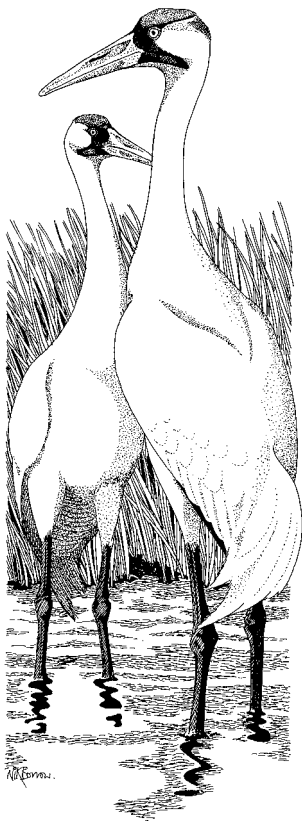
Whooping Cranes

All in all there is nothing in North America to compare with the sheer avian diversity of 'The Lone Star State'. Texas really is bigger and better!