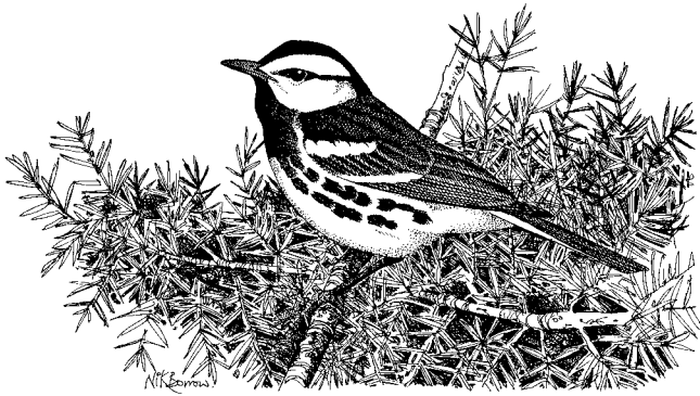
Golden-cheeked Warbler (Nik Borrow)

Tour Category: Easy (apart from one optional fairly Demanding hike)