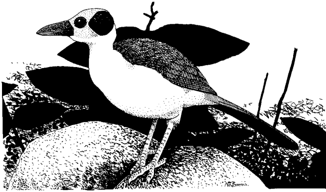
Yellow-headed Picathartes (Nik Borrow)

Situated in the heart of West Africa, Ghana was the first sub-Saharan colonial country to gain its independence in 1957 and is now recognized as a friendly, safe and stable African destination. Once known as the Gold Coast, its growing tourist industry has much to offer in the way of a colourful and vibrant culture and a turbulent history, including a coast lined with beautiful beaches and numerous slave forts still standing to remind visitors of a grim episode in the country's past. A European power struggle over the Gold Coast raged between the 15th and 19th centuries. The Portuguese built a castle at Elmina on the coast in 1482 and their presence was swiftly followed by the Dutch, Swedes, Danes, Prussians and British: all motivated by the lure of gold, ivory and of course slaves.