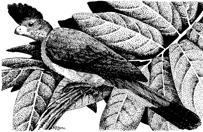
Great Blue Turaco (Nik Borrow)

species. There are chances here for the Upper Guinea endemic Little Green Woodpecker, the diminutive and seldom-seen African Piculet, Black-billed Dwarf Hornbill, the striking Yellow-throated Cuckoo, Little Grey and Black-and-white Flycatchers, West African Batis (split from Bioko), Red-vented Malimbe and Maxwell's Black and Preuss's Golden-backed Weavers. We shall also be on the lookout for the inexplicably localized Tessmann's Flycatcher (although it now seems that recent claimed sightings of the latter from Kakum may be erroneous).