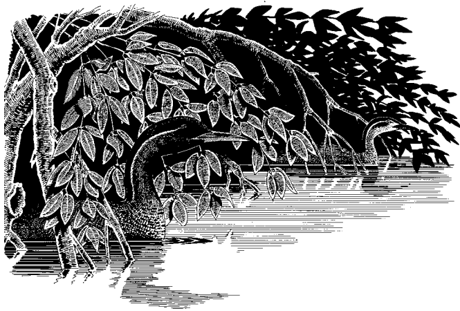
African Finfoot (Michael Hodgson)

that run through the park. In particular, we shall be looking for skulkers such as Upper Guinea endemic Grey-headed Bristlebill, White-tailed Alethe (split from Fire-crested), Finsch's Flycatcher Thrush and Western Forest Robin. We shall try hard to find a displaying Rufous-sided Broadbill and a confusing array of greenbuls includes Little, Little Grey, Cameroon Sombre, Slender-billed, Yellow-whiskered, Golden, Honeyguide, Spotted, Icterine, White-throated, Western Bearded and Red-tailed Greenbuls, and Red-tailed Bristlebill. Other species here include Black Cuckoo, Buff-spotted Woodpecker, Grey Longbill, Green Crombec, Green Hylia, White-tailed Ant Thrush, Olivaceous Flycatcher, Blue-headed Crested Flycatcher, Red-bellied Paradise Flycatchers, Chestnut Wattle-eye, Brown and Blackcap Illadopsises, Fraser's, Western Olive and Olive-bellied Sunbirds, Shining Drongo and Blue-billed and Crested Malimbés. Primates include Lesser Spot-nosed Monkey, Lowe's Monkey and the rare Olive Colobus.